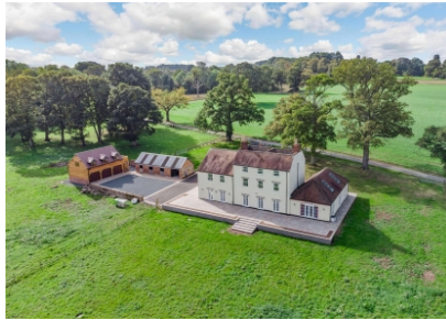
Home Farm, Gatacre, Claverley, Wolverhampton