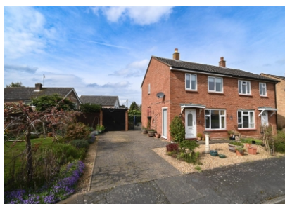
9 Wrekin Road, Bridgnorth