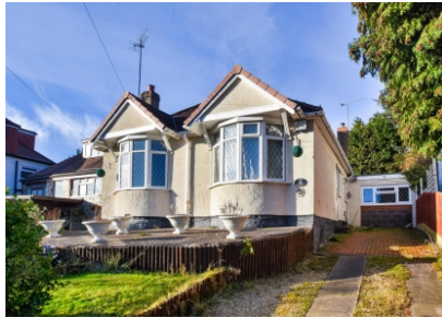
The Chalett, 78 Bridgnorth Road, Compton