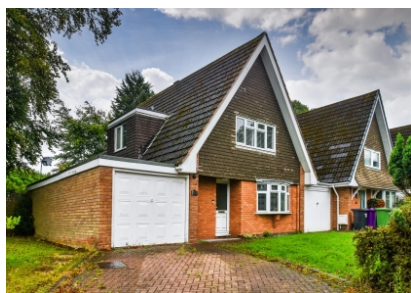
64 Bantock Gardens, Finchfield, Wolverhampton