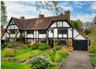
11 Castlecroft Gardens, Wolverhampton