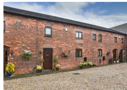
3 Manor Farm Barns, Bognop Road, Essington