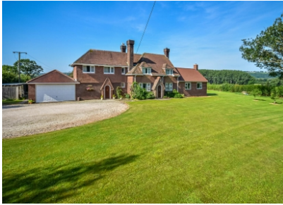
Footbridge House, Tasley, Bridgnorth