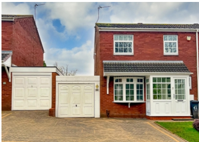
14 St James Street, Lower Gornal, Dudley