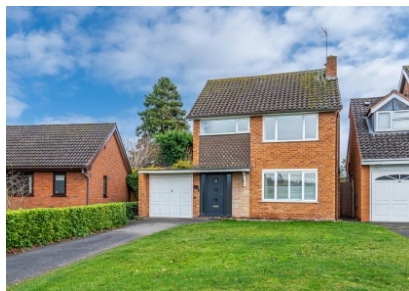
1 Redford Drive, Albrighton