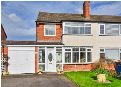
12 Oakfield Road, Codsall, Wolverhampton