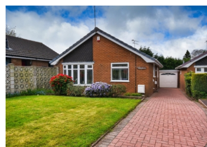
19 Finchdene Grove, Finchfield, Wolverhampton