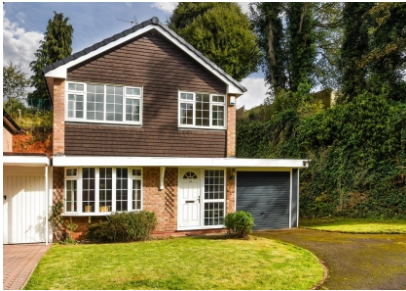
39 Alpine Way, Compton, Wolverhampton