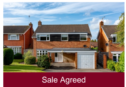
11 Copper Beech Drive, Wombourne, Wolverhampton