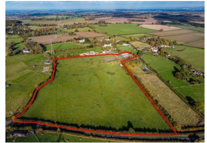
Plot of Land at Former Mill Riding Centre, Warstone Hill Road, Pittingham