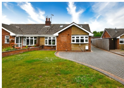
6 Lime Close, Alveley, Bridgnorth