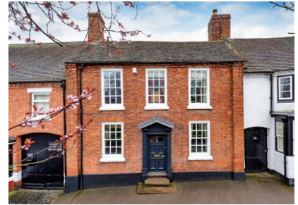
Saredon House, 28 Stafford Street, Brewood