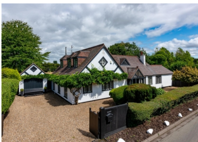
Pennygate, Paradise Lane, Slade Heath, Wolverhampton