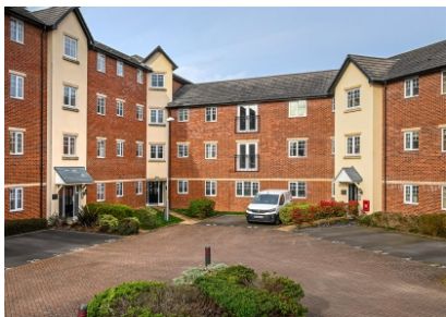
23 Greyfriars House, Kings Court, Stourbridge Road, Bridgnorth