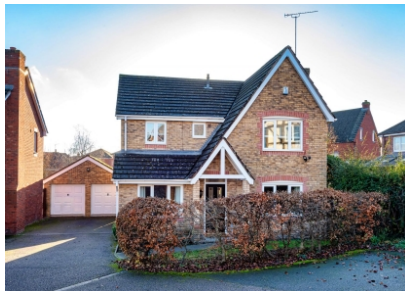
17 Holendene Way, Wombourne, Wolverhampton