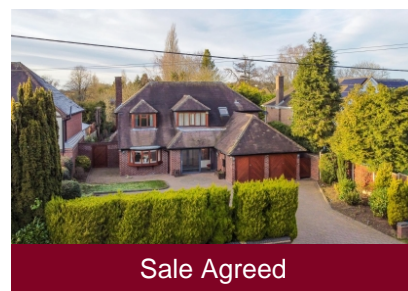
Broad Elms, Great Moor Road, Pattingham