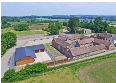
Saxon Meadow Cottage 5, The Wyke, Shifnal