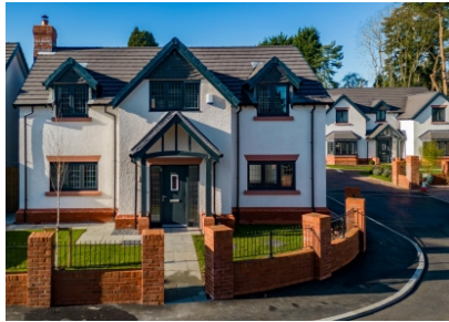
Alder House, Popes Lane, Tettenhall