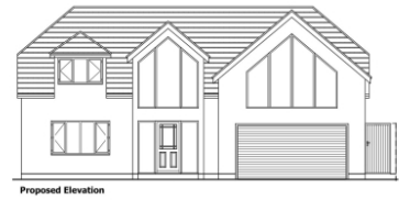
38 Cranmere Avenue, Tettenhall, Wolverhampton