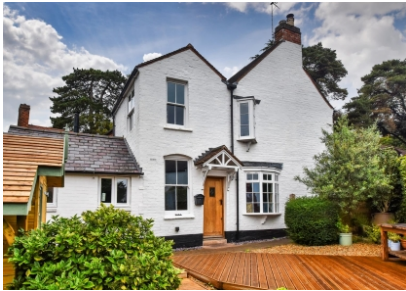
Beech Cottage, 8 The Holloway, Compton