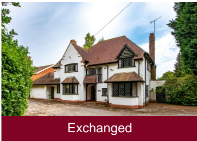
Greenways and Building Plots, 45 Perton Road