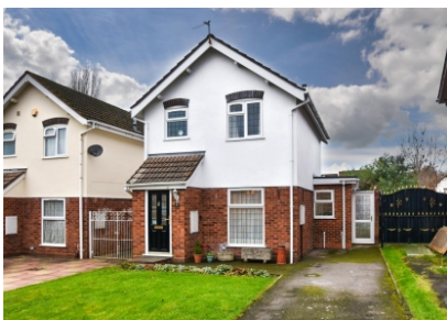
8 Laburnum Street, Wolverhampton