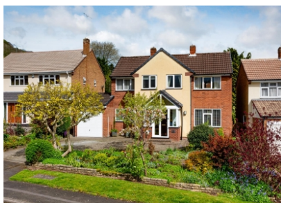
5 Torvale Road, Wightwick, WV6 8NW