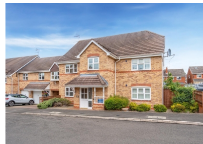
10 Cygnet Court, Wombourne, Wolverhampton