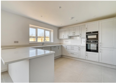
Green Acres, 3 Rowan Grange, Broseley