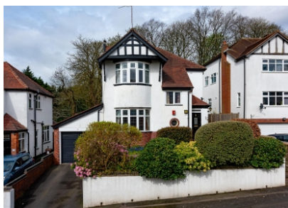
Tudor Crescent, Wolverhampton