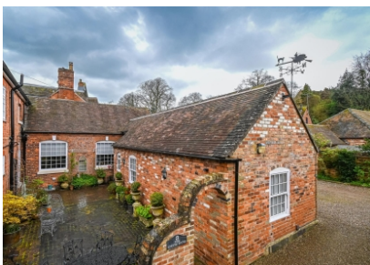
Corner House, 3 Stableford Hall, Stableford, Bridgnorth