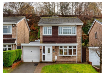
23 Redcliffe Drive, Wombourne, South Staffordshire