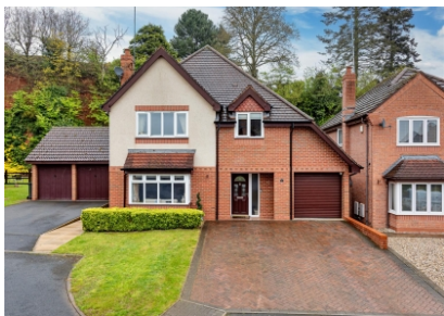
Hillside, Wombourne, Wolverhampton