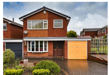
7 Marlborough Gardens, Newbridge, Wolverhampton