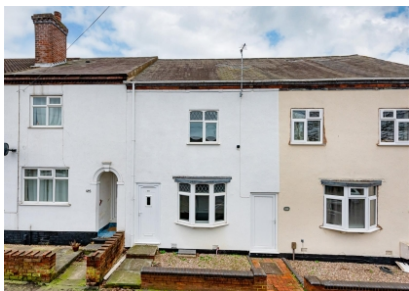
126a Clifton Street, Sedgley