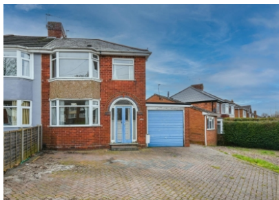
1 Rutland Avenue, Wolverhampton