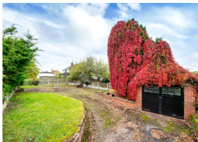
Planning Permission, 40 Moatbrook Lane, Codsall, WV8 1SD