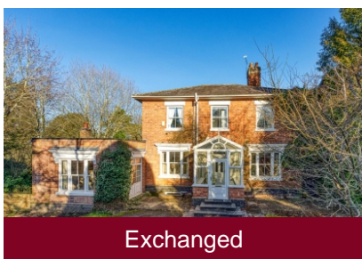
Ferndale, 33 Oaken Lanes, Codsall, Wolverhampton