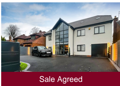
14 Lothians Road, Stockwell End