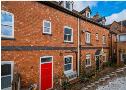
22a High Street, Bridgnorth