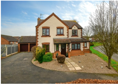
3 Danesbrook, Claverley, Wolverhampton