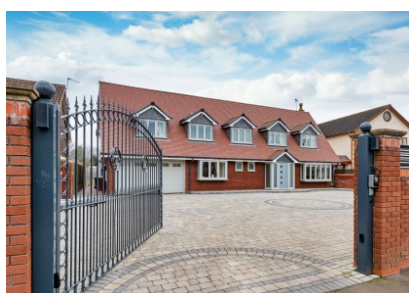
Alpine Cottage, 11 Kings Road, Calf Heath