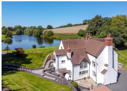
Hem Mill, The Hem, Shifnal