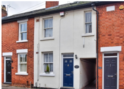
9 Nursery Walk, Wolverhampton