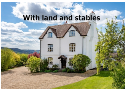
Ouseley Farm, Aston Eyre, Bridgnorth