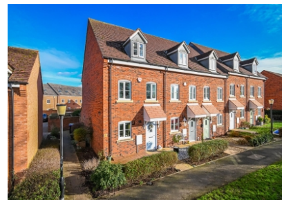
75 Rastrick Close, Bridgnorth