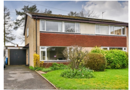
32 The Greenway, Pattingham, Wolverhampton