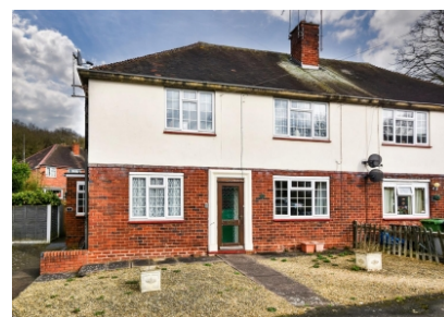
73 Meadow Lane, Wombourne, Wolverhampton