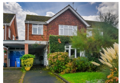
86 Van Diemens Road, Wombourne, Wolverhampton