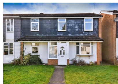
11 Woodside, Ashmore Park, Wolverhampton