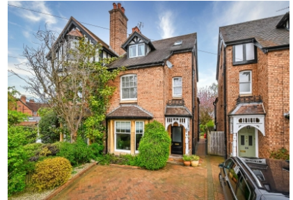
7 Westgate Villas, Salop Street, Bridgnorth