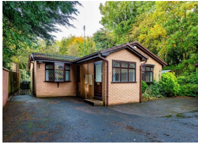
6 Finchfield Hill, Compton, Wolverhampton