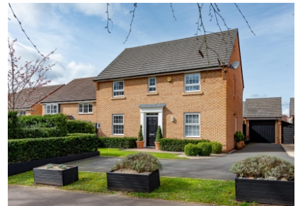
12 Larch Grove, Shifnal