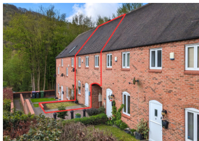
6 The Courtyard, Ironbridge, Telford