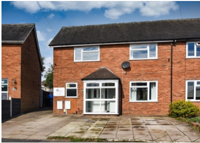
69 Oak Road, Brewwood, Stafford