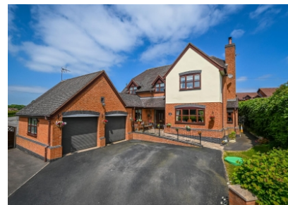
Cape Lodge, Billingsley, Bridgnorth