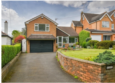
Stourbridge Road, Wombourne, Wolverhampton