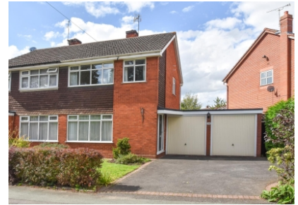
34 Castlecroft Road, Finchfield, Wolverhampton