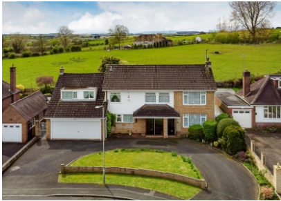
7 Wightwick Hall Road, Wightwick, WV6 8BZ