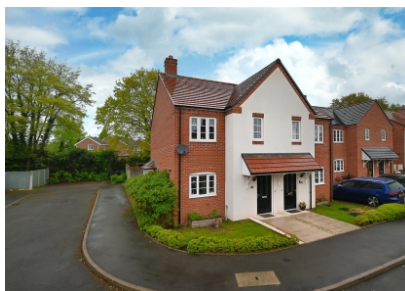
19 Staley Grove, Highley, Bridgnorth