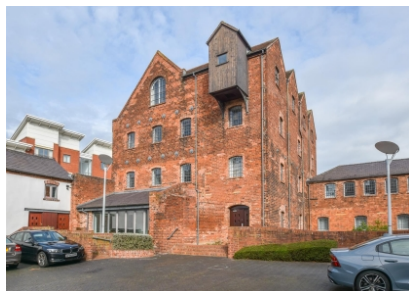
11 The Mill, Albion Street, Wolverhampton