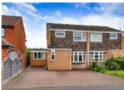
148a Birches Road, Codsall, Wolverhampton