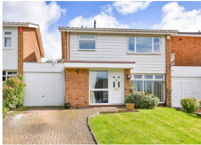
4 Forton Close, Compton, Wolverhampton