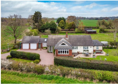
Holly Lodge, Church Lane, Boningale, Albrighton