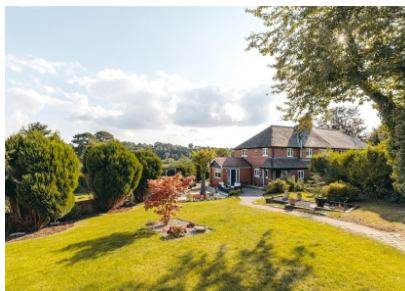
Sunnybank, 11b, Danesford, Bridgnorth