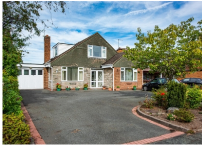
83 Cranmere Avenue, Tettenhall, Wolverhampton