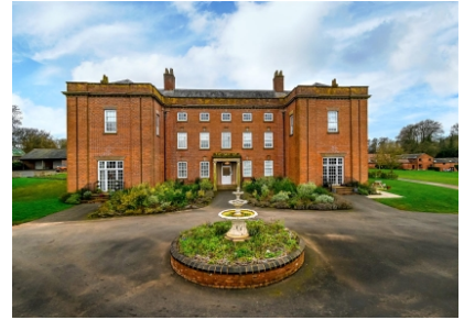
Home Wood, Gatacre Hall, Claverley, Wolverhampton