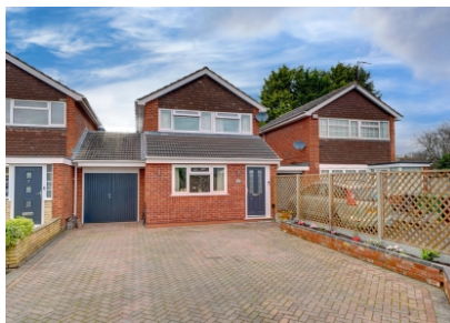
Elderberry Close, Stourport-On-Severn