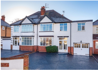
7 Osborne Road, Wolverhampton