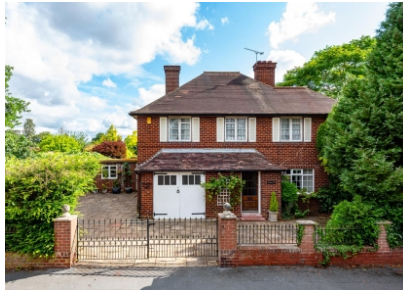
Oxleaze, Grange Road, Albrighton