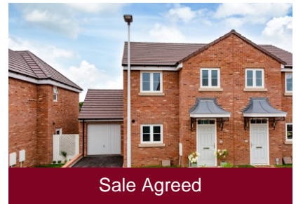
7 Crossfield Crescent, Albrighton