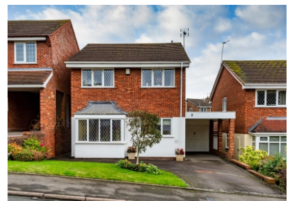
2 Woodthorne Close, Lower Gornal, Dudley