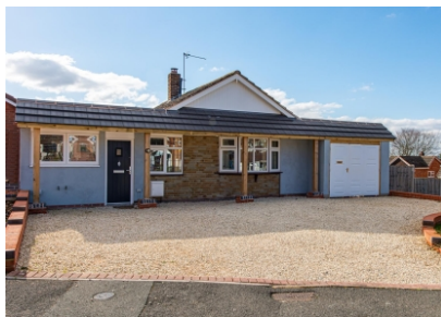
21 Uplands Drive, Wombourne, Wolverhampton