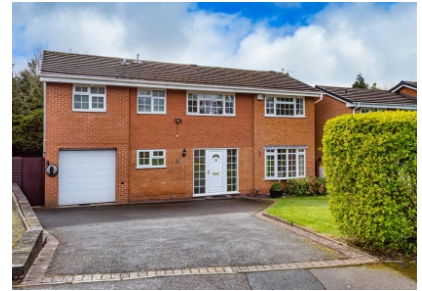
11 Swallowdale, Wightwick, Wolverhampton