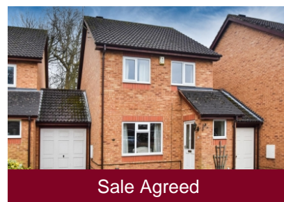
14 Alpine Way, Compton, Wolverhampton