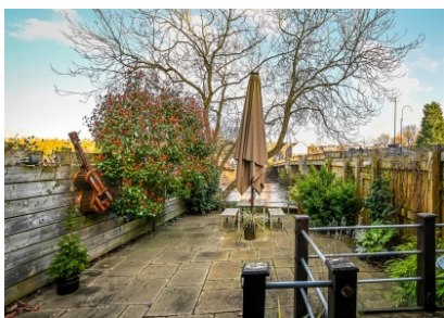
45 Cartway, Bridgnorth