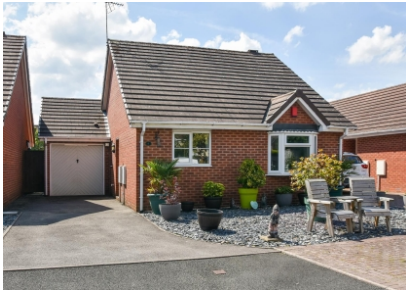
4 Hazelmere Drive, Castlecroft, Wolverhampton