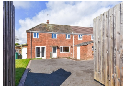
146 Cornwall Road, Tettenhall, WV6 8UZ