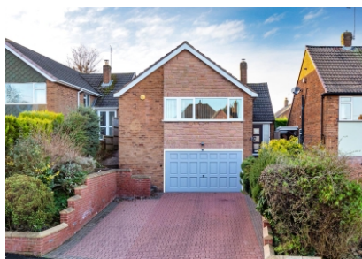
52 Church Hill, Penn, Wolverhampton