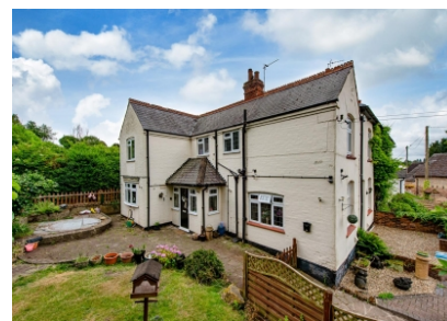
1 & 2 New Cottages, Oaken Lane, Oaken