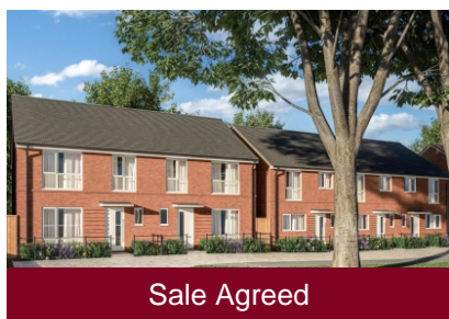
Plot 2 Nightingale Place, Vicarage Road, Wolverhampton