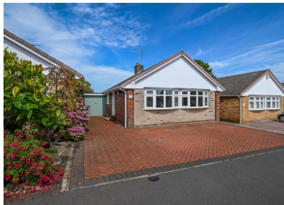
7 Princess Drive, Bridgnorth