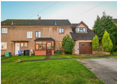
74 The Hobbins, Bridgnorth