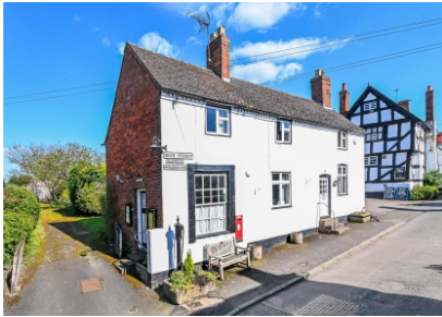
The Old Post Office, High Street, Claverley, Wolverhampton