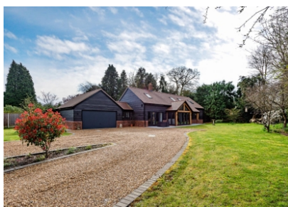
Willow Lodge, 23 High Street, Albrighton