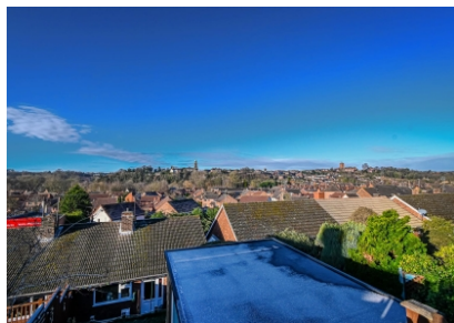
5 River View, Bridgnorth