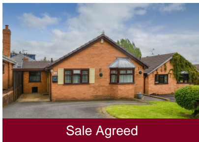
56 Coton Road, Wolverhampton