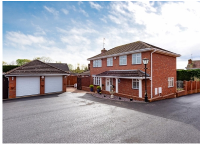
St. Johns Close, Swindon, Dudley