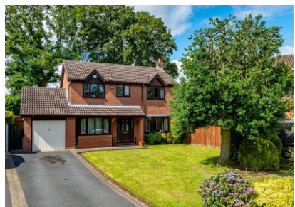
South View Close, Codsall, Wolverhampton