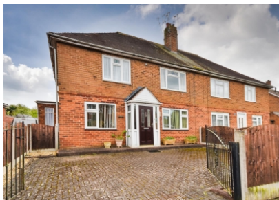
Dickinson Road, Wombourne, Wolverhampton