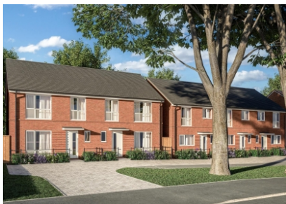
Plot 4 Nightingale Place, Vicarage Road, Wolverhampton