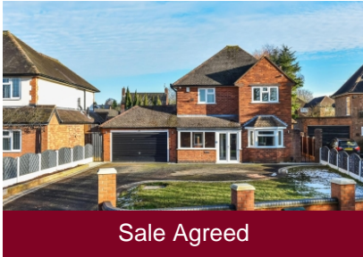
75 Yew Tree Lane, Tettenhall