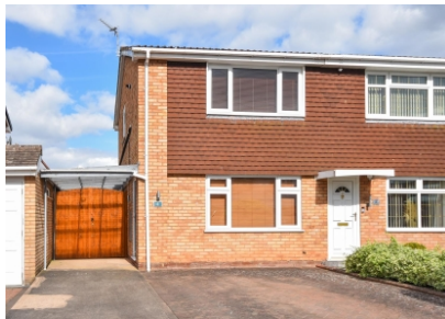
Green Meadow Close, Wombourne, Wolverhampton