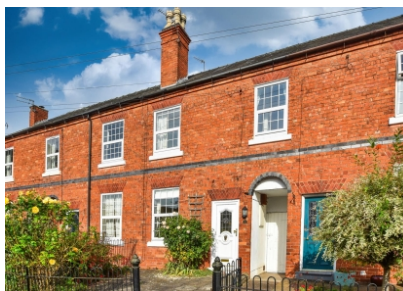
3 Shaw Lane, Albrighton, Wolverhampton