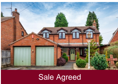
92 Bridgnorth Road, Wombourne, Wolverhampton