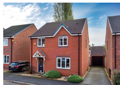
39 Rakegate Close, Oxley, Wolverhampton