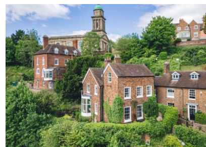
Castle Cliffe House, 24 St. Mary's Steps, Bridgnorth