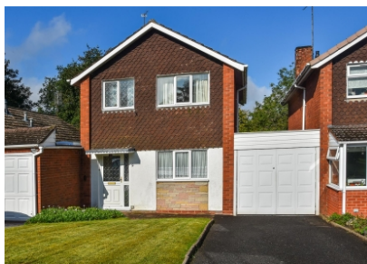
9 Westhill, Wolverhampton