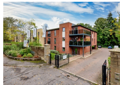
6 Thorneycroft, Wood Road, Tettenhall