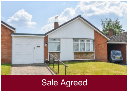
13 The Broadway, Wombourne, Wolverhampton