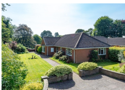
11 Compton Hill Drive, Compton, Wolverhampton