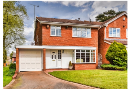
1 Foxlands Drive, Wolverhampton