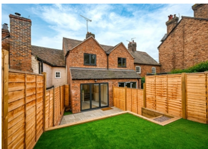
6 Salop Street, Bridgnorth