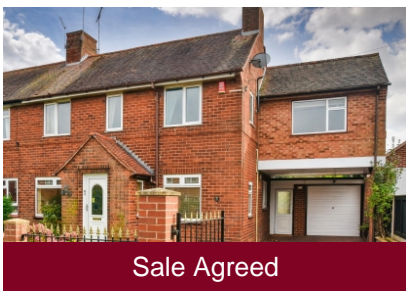
13 Grange Road, Albrighton, Wolverhampton