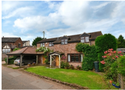
Finger Cottage, 123 Birds Green, Alveley, Bridgnorth