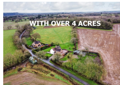
Keepers Cottage, Colemore Green, Bridgnorth