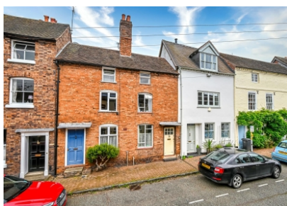
24 St. Marys Street, Bridgnorth