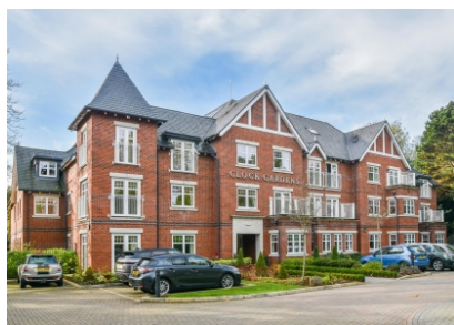
8 Clock Gardens, Stockwell Road, Wolverhampton