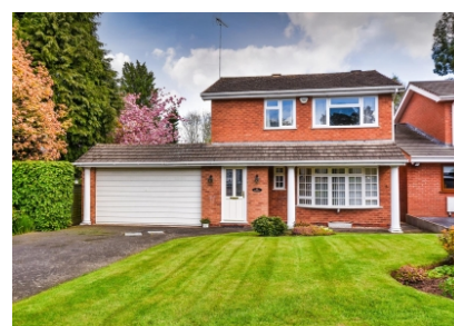
18 Fair Oak Drive, Wolverhampton