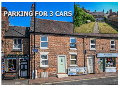
50 Whitburn Street, Bridgnorth