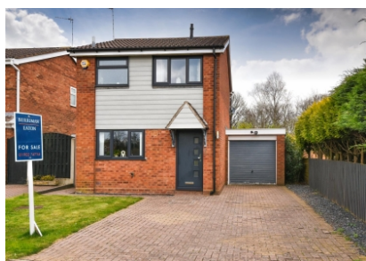
71 Mercia Drive, Perton, Wolverhampton