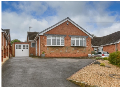
9 Brick Kiln Lane, Dudley