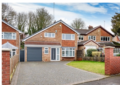
3 St. Marys Close, Dudley