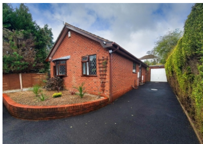
10 Planks Lane, Wombourne, Wolverhampton