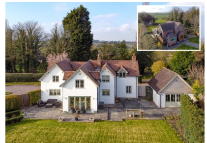
Oaklea and The Cottage, Damson Lane, Weston Heath, Shifnal