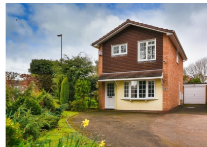
28 Quendale, Wombourne, Wolverhampton