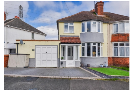
56 Hilston Avenue, Penn, Wolverhampton