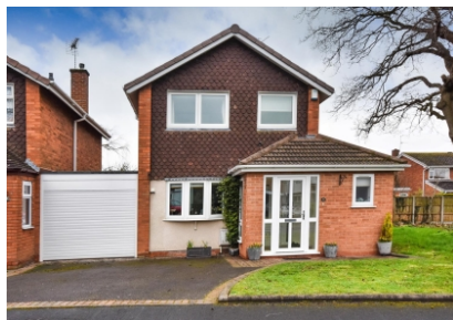
10 Ashley Gardens, Codsall, Wolverhampton