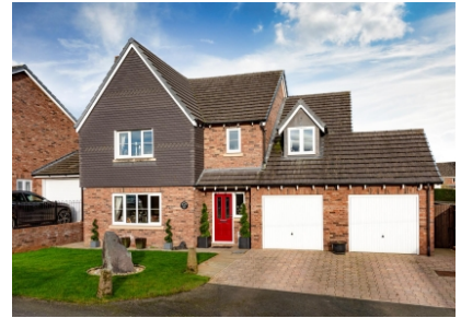
41 Kings Road, Calf Heath, Wolverhampton