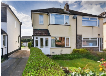
36 Hall End Lane, Pattingham, Wolverhampton