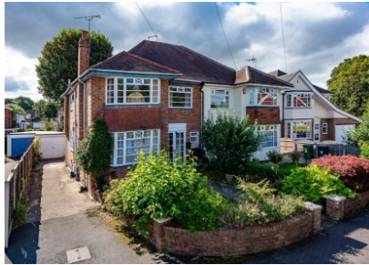
7 Newbridge Gardens, Newbridge, Wolverhampton