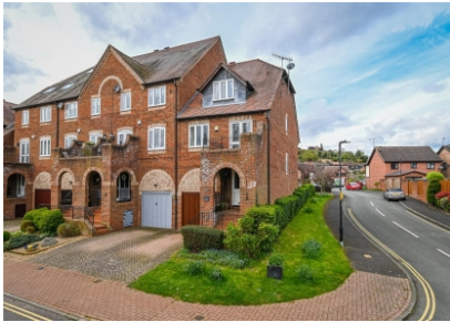
36 Southwell Riverside, Bridgnorth