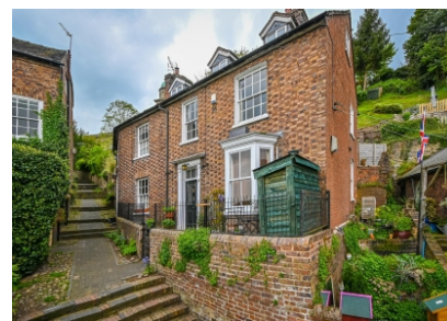
19 St. Marys Steps, Bridgnorth