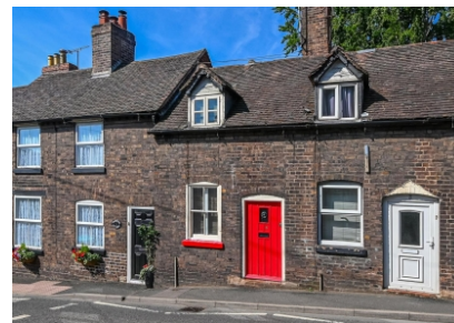
4 Pound Street, Bridgnorth