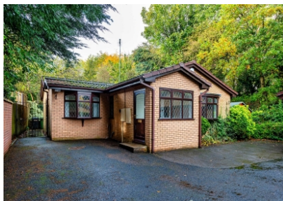
6 Finchfield Hill, Compton, Wolverhampton