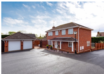
St. Johns Close, Swindon, Dudley