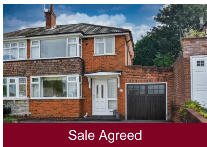
10 Waverley Crescent, Lanesfield, Wolverhampton