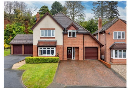
Hillside, Wombourne, Wolverhampton