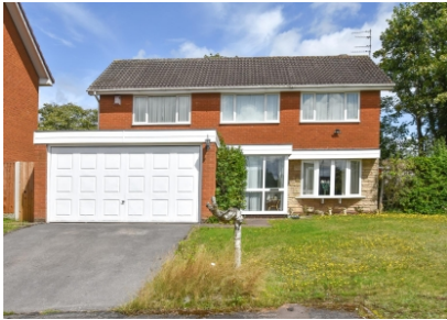
4 The Heathlands, Wombourne, Wolverhampton