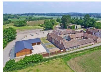
Saxon Meadow Cottage 5, The Wyke, Shifnal