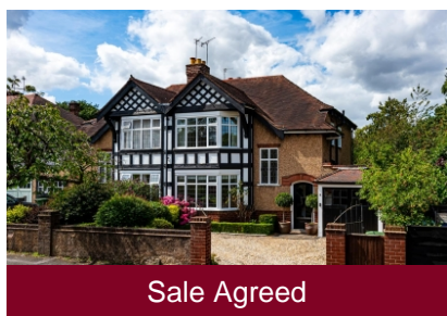
2 Highlands Road, Finchfield, Wolverhampton