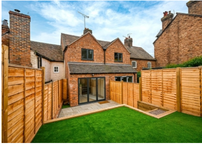
6 Salop Street, Bridgnorth