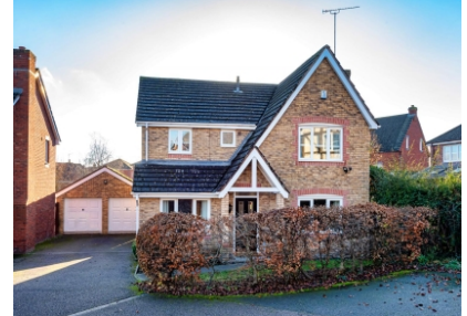
17 Holendene Way, Wombourne, Wolverhampton