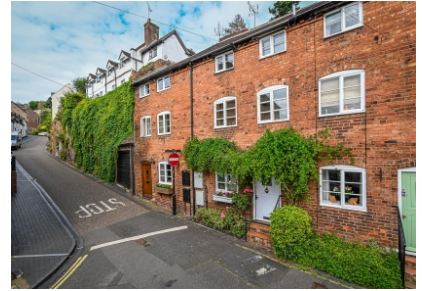
70 Cartway, Bridgnorth