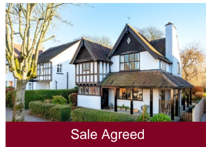
Far Croft, 19 Newbridge Avenue, Newbridge