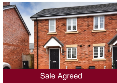
6 Sanderson Way, Codsall, Wolverhampton