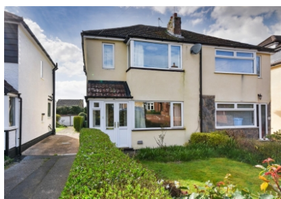
36 Hall End Lane, Pattingham, Wolverhampton