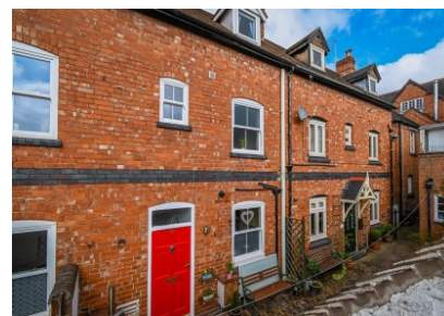
22a High Street, Bridgnorth