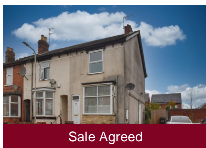
62 Merridale Street West, Wolverhampton