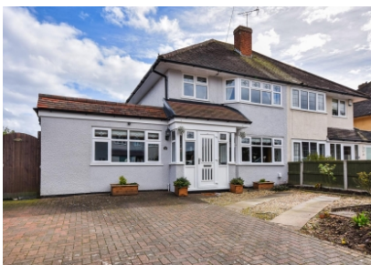
34 Delaware Avenue, Albrighton