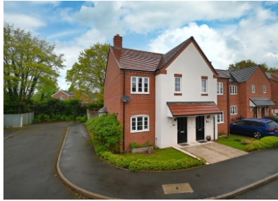
19 Staley Grove, Highley, Bridgnorth