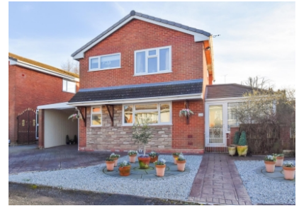
23 Bellencroft Gardens, Merry Hill, Wolverhampton