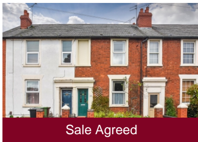
46 Merridale Road, Wolverhampton