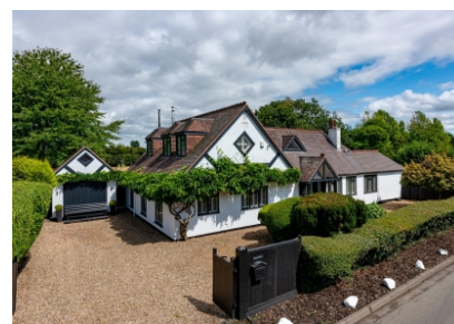
Pennygate, Paradise Lane, Slade Heath, Wolverhampton