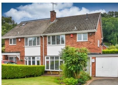
23 Chequers Avenue, Wombourne, Wolverhampton