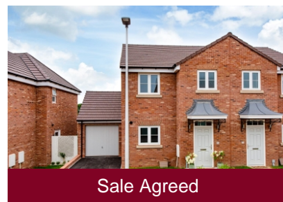
7 Crossfield Crescent, Albrighton