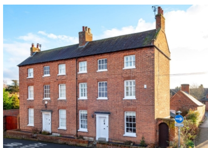
4 Church Road, Albrighton, Wolverhampton