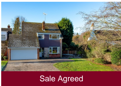
5 Post Office Road, Seisdon, Wolverhampton