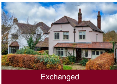
43 Springhill Park, Lower Penn, Wolverhampton