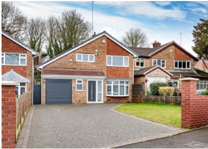
3 St. Marys Close, Dudley