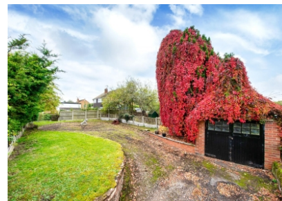
Planning Permission, 40 Moatbrook Lane, Codsall, WV8 1SD