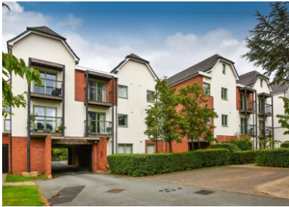
Flat 4 Magnolia Court, Muchall Road, Wolverhampton