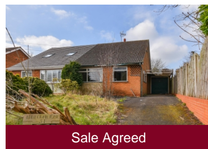
31 Bull Meadow Lane, Wombourne, Wolverhampton