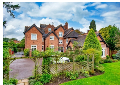
18f Southgate, Stockwell Road, Tettenhall, Wolverhampton