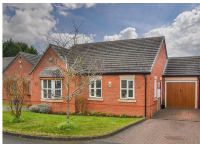
14 Berkeley Close, Perton, Wolverhampton