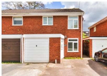
Forge Leys, Wombourne