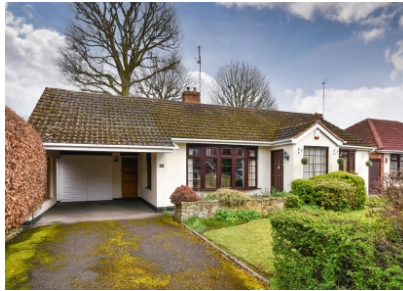
30 Sabrina Road, Wightwick, Wolverhampton