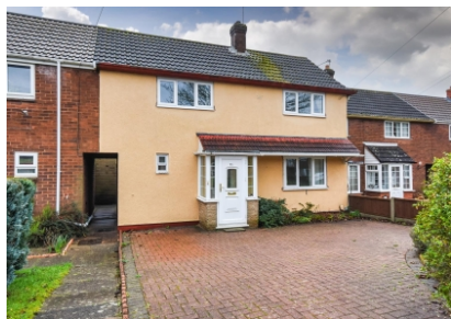
71 Cornwall Road, Tettenhall Wood