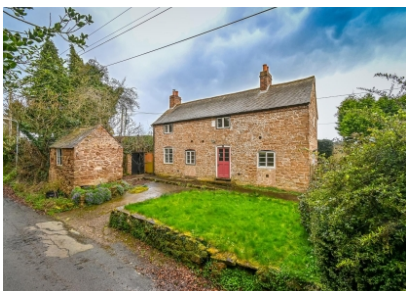
148 Broad Oak, Six Ashes