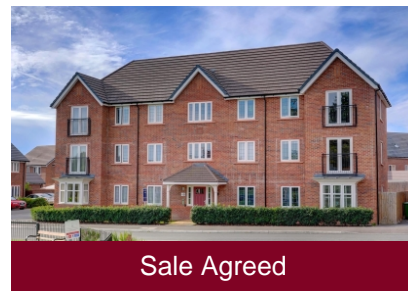
Ashford Road, Worcester