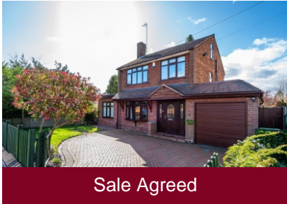
13 Springhill Lane, Wolverhampton