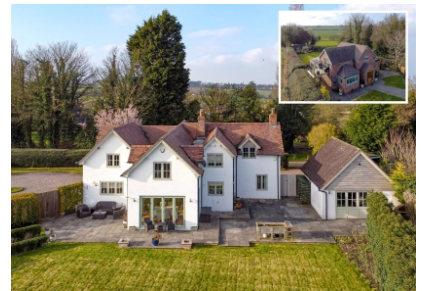
Oaklea and The Cottage, Damson Lane, Weston Heath, Shifnal