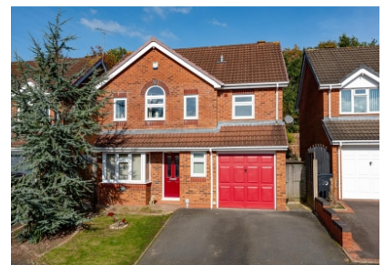
12 Dudmaston Way, Milking Bank, Dudley