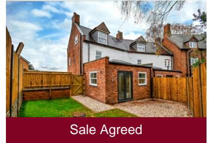
4 Rudge Road, Pattingham, Wolverhampton