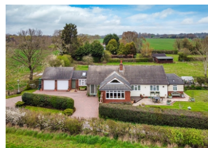
Holly Lodge, Church Lane, Boningale, Albrighton