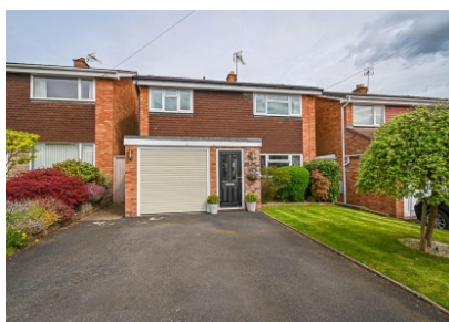
18 Stretton Close, Bridgnorth