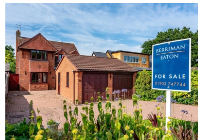
Bridgeside, 187 Birches Road, Codsall