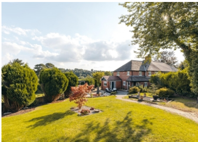
Sunnybank, 11b, Danesford, Bridgnorth