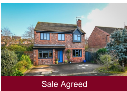
10 Washbrook Road, Bridgnorth