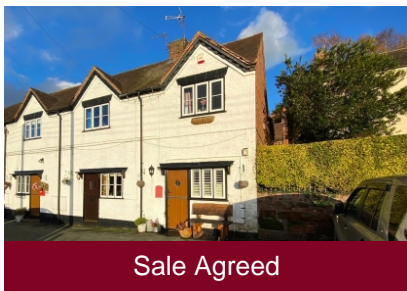
26c Bernards Hill, Bridgnorth