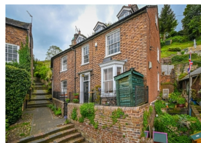
19 St. Marys Steps, Bridgnorth