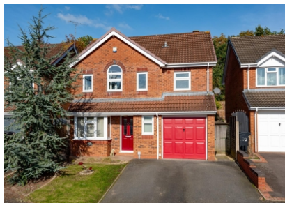
12 Dudmaston Way, Milking Bank, Dudley