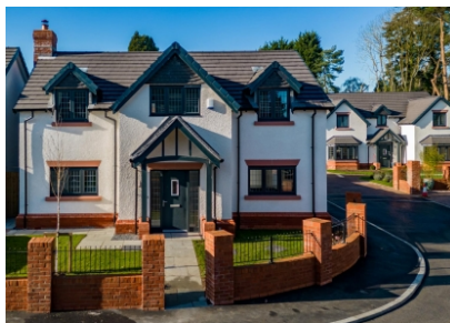
Alder House, Popes Lane, Tettenhall