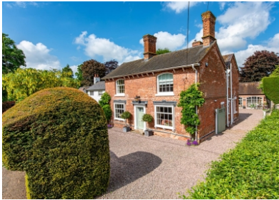
Beckbury House, Beckbury, Shifnal