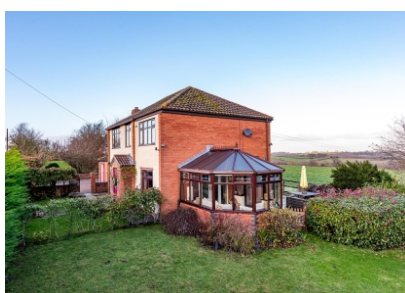
Longmoor House, Billingsley, Bridgnorth