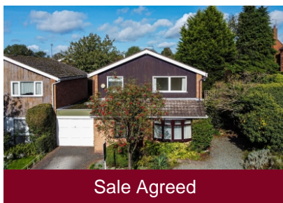
2 Beech Close, Pattingham, Wolverhampton