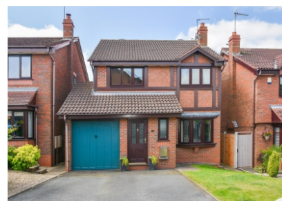
35 Penleigh Gardens, Wombourne, Wolverhampton