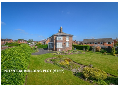
Hookfield House, 81 Victoria Road, Bridgnorth