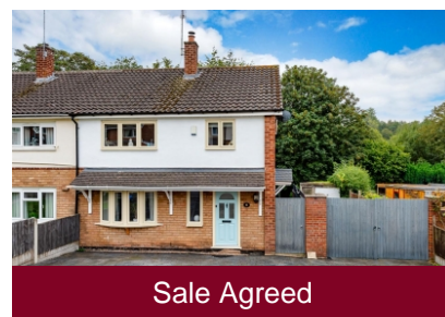
6 Moises Hall Road, Wombourne, Wolverhampton