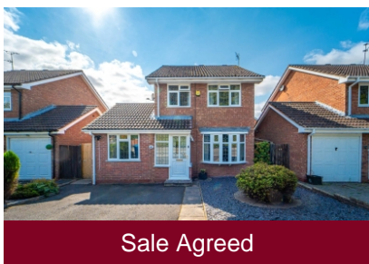
42 Gainsborough Drive, Perton, Wolverhampton