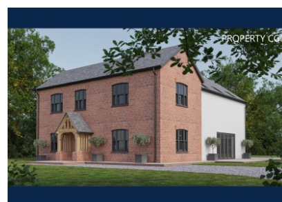
Plot 1, Bynd Lane, Billingsley, Bridgnorth