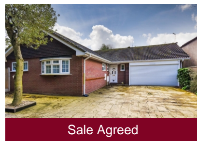
28a Mount Road, Mount Road, Tettenhall Wood