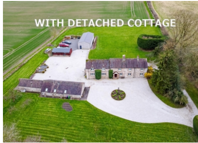
Lower Westwood Farm, Stretton Westwood, Much Wenlock