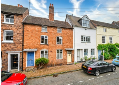
24 St. Marys Street, Bridgnorth