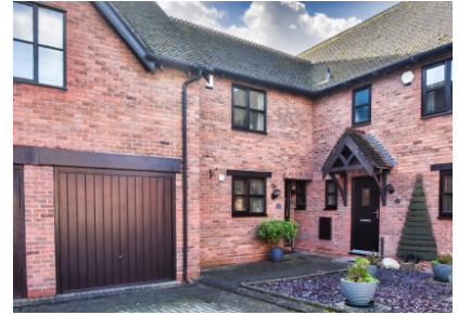
17 Bridgeman Court, Weston-Under-Lizard, Shifnal