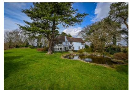
Horseshoes, Netherton, Highley, Bridgnorth