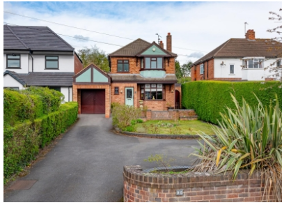
95 Windmill Lane, Castlecroft, Wolverhampton