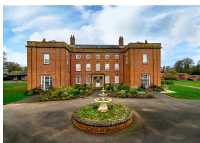
Home Wood, Gatacre Hall, Claverley, Wolverhampton