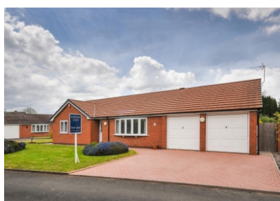
1 The Courts, Albrighton, Wolverhampton