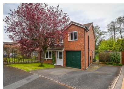
27 Greenway Avenue, Alveley, Bridgnorth