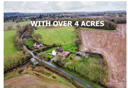
Keepers Cottage, Colemore Green, Bridgnorth