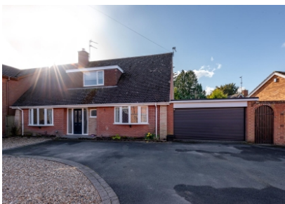
Strathmore, Shaw Lane, Albrighton