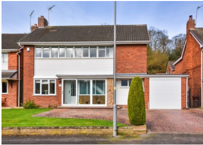
97 Henwood Road, Compton, Wolverhampton