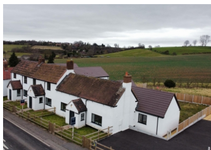
3 Ackleton Meadows, Stableford, Bridgnorth