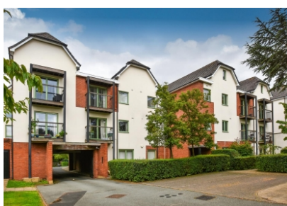
Flat 4 Magnolia Court, Muchall Road, Wolverhampton