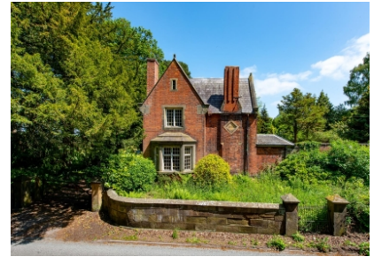
Wergs Hall Gardens, Wergs Hall Road, Tettenhall