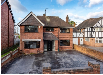
288b Penn Road, Wolverhampton