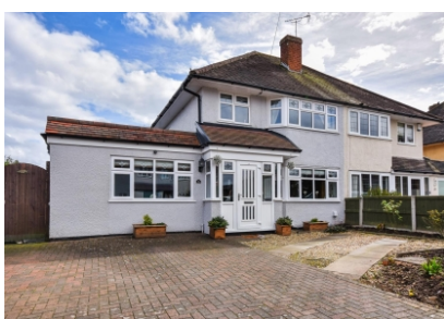
34 Delaware Avenue, Albrighton