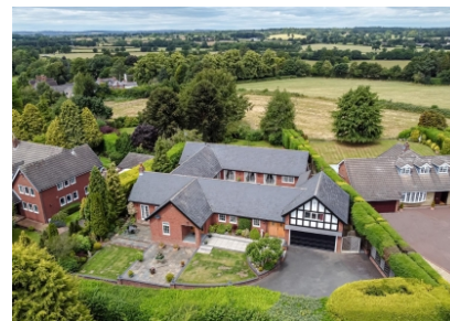
Courtenys, Oaken Drive, Oaken, Codsall