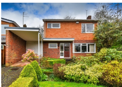
10 Ashfield Road, Compton, Wolverhampton