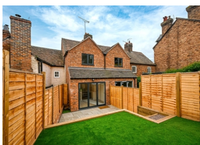
6 Salop Street, Bridgnorth