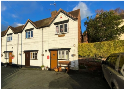
26c Bernards Hill, Bridgnorth