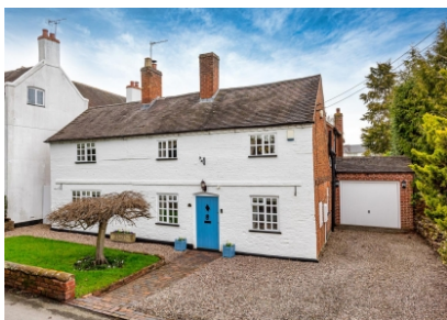
Garden Cottage, 4 Shop Lane, Brewwood