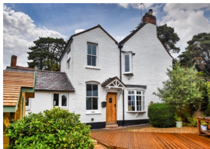
Beech Cottage, 8 The Holloway, Compton