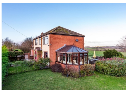
Longmoor House, Billingsley, Bridgnorth