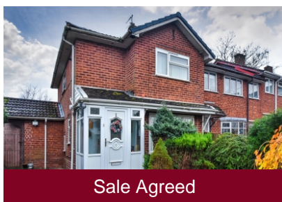
5 Manor Close, Codsall, Wolverhampton