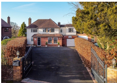
Fern House, Links Avenue, Tettenhall