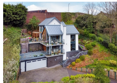
Hawthorn View, Hollybush Road, Bridgnorth