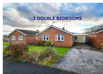
12 Redstone Drive, Highley, Bridgnorth