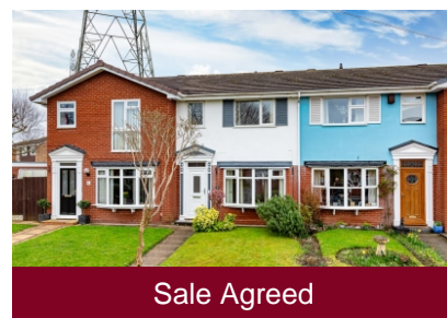
3 Swinford Leys, Wombourne, WV5 8HT