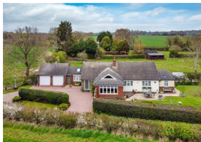
Holly Lodge, Church Lane, Boningale, Albrighton