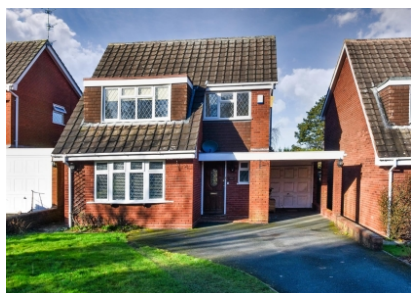
15 Hists Drive, Codsall, Wolverhampton