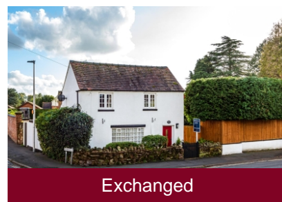
Station Cottage, 58 Station Road, Albrighton