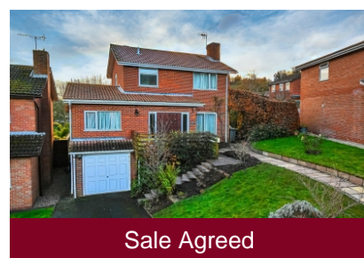
15 Bramble Ridge, Bridgnorth