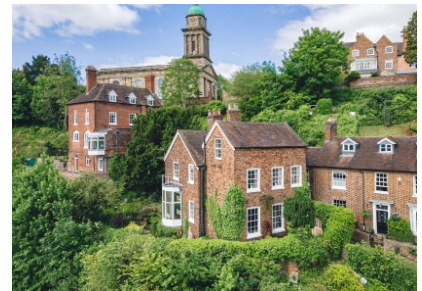
Castle Cliffe House, 24 St. Mary's Steps, Bridgnorth