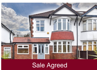
103 Windsor Avenue, Penn, Wolverhampton