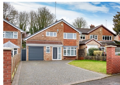
3 St. Marys Close, Dudley