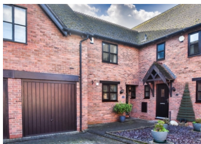
17 Bridgeman Court, Weston-Under-Lizard, Shifnal