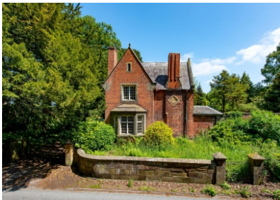
Wergs Hall Gardens, Wergs Hall Road, Tettenhall