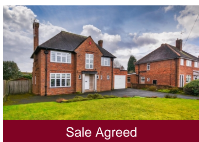
61 Brickbridge Lane, Wombourne, Wolverhampton