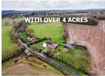
Keepers Cottage, Colemore Green, Bridgnorth