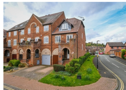
36 Southwell Riverside, Bridgnorth