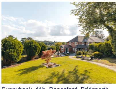
Sunnybank, 11b, Danesford, Bridgnorth