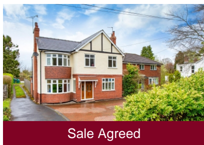
74 Langley Road, Wolverhampton