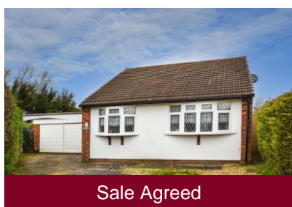
7 Apse Close, Wombourne, Wolverhampton