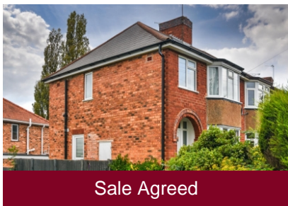
2 Fancourt Avenue, Penn, Wolverhampton