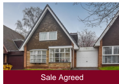
16 Surrey Drive, Finchfield, Wolverhampton