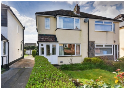
36 Hall End Lane, Pattingham, Wolverhampton