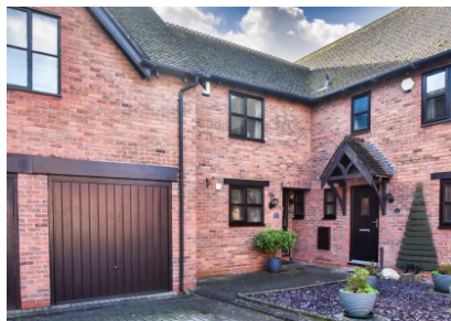
17 Bridgeman Court, Weston-Under-Lizard, Shifnal