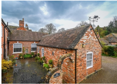
Corner House, 3 Stableford Hall, Stableford, Bridgnorth