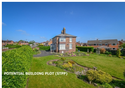
Hookfield House, 81 Victoria Road, Bridgnorth