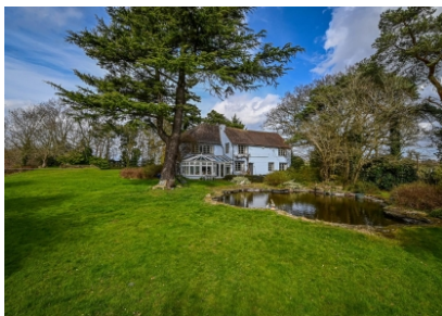
Horseshoes, Netherton, Highley, Bridgnorth