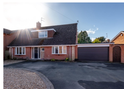
Strathmore, Shaw Lane, Albrighton