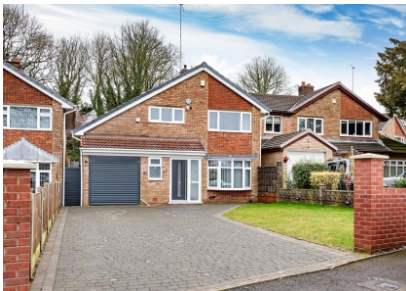
3 St. Marys Close, Dudley