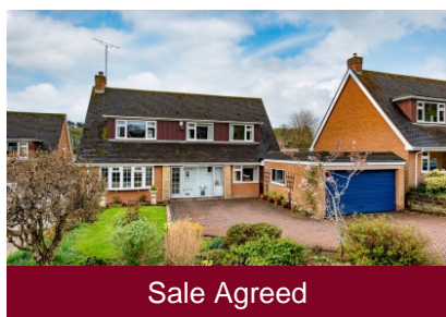
18 Quail Green, Wightwick, Wolverhampton