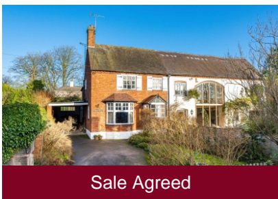
Newport House, 28 Newport Street, Brewood