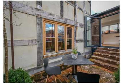
Park Cottage, Abbey Foregate, Shrewsbury