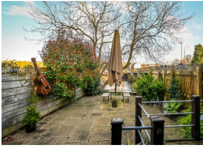
45 Cartway, Bridgnorth