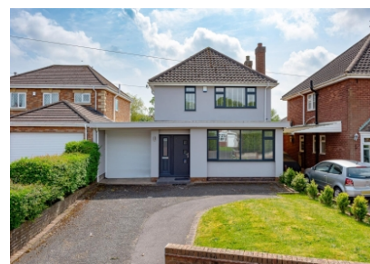
46 Wood Road, Codsall, Wolverhampton, WV8 1DN