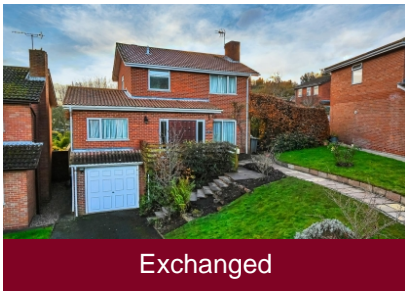
15 Bramble Ridge, Bridgnorth