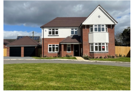
Cedar House, 7 Rowan Grange, Broseley