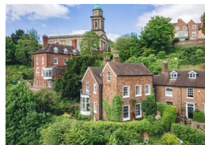
Castle Cliffe House, 24 St. Mary's Steps, Bridgnorth