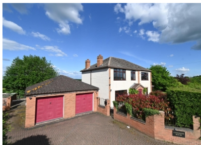
Longmoor House, Billingsley, Bridgnorth