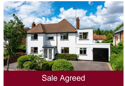
Helford House, Westland Avenue, Compton