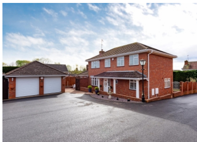
St. Johns Close, Swindon, Dudley