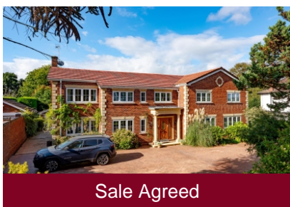
Elan Ridge. Pool House Road, Wombourne, Wolverhampton