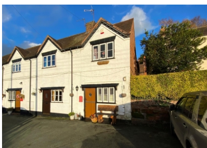
26c Bernards Hill, Bridgnorth