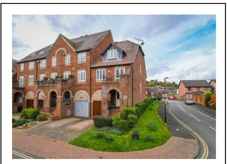
36 Southwell Riverside, Bridgnorth