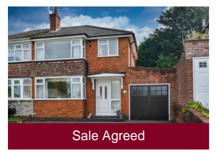
10 Waverley Crescent, Lanesfield, Wolverhampton