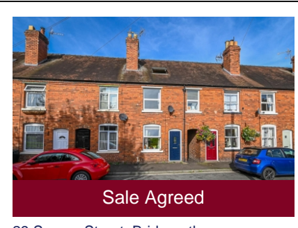
29 Severn Street, Bridgnorth