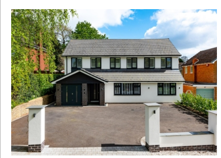
1 Chestnut Close, Codsall, WV8 2EZ