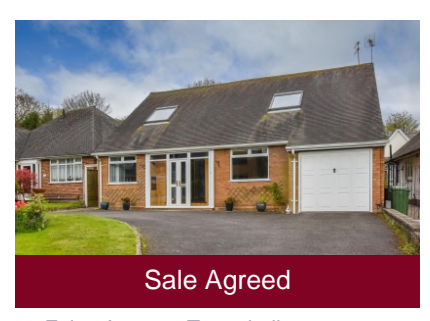
38 Foley Avenue, Tettenhall, Wolverhampton