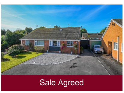
10 Captains Road, Bridgnorth