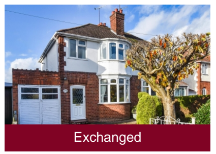
17 Fairview Road, Penn, Wolverhampton