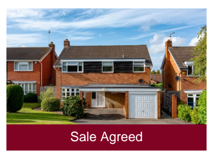
11 Copper Beech Drive, Wombourne, Wolverhampton