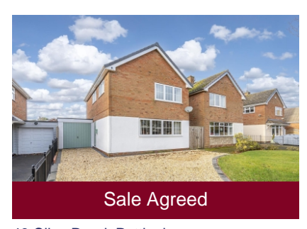
48 Clive Road, Pattingham, Wolverhampton