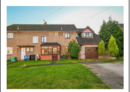
74 The Hobbins, Bridgnorth