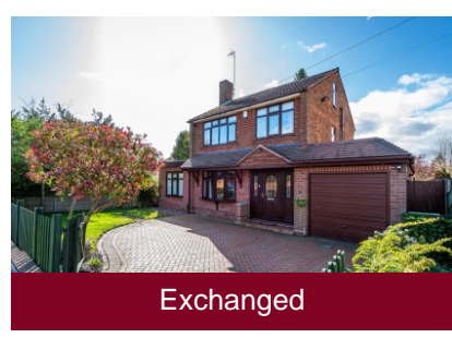
13 Springhill Lane, Wolverhampton