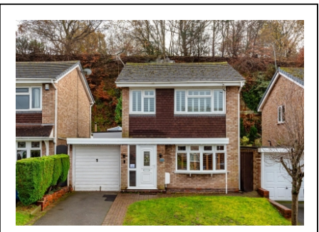
23 Redcliffe Drive, Wombourne, South Stafforshire