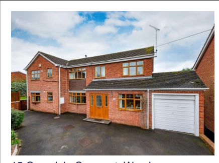
15 Ounsdale Crescent, Wombourne, Wolverhampton