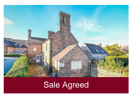
The Forge, 13 St. Marys Lane, Much Wenlock