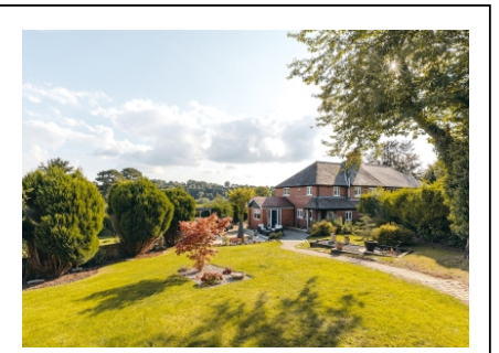
Sunnybank, 11b, Danesford, Bridgnorth