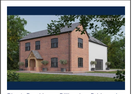
Plot 1, Bynd Lane, Billingsley, Bridgnorth