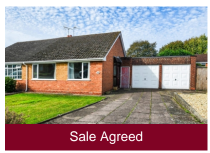
10 Gardeners Way, Wombourne, Wolverhampton