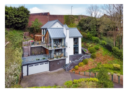
Hawthorn View, Hollybush Road, Bridgnorth