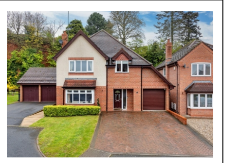
Hillside, Wombourne, Wolverhampton