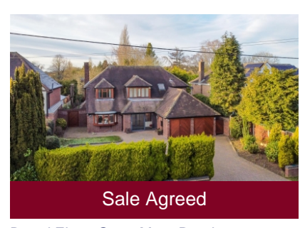
Broad Elms, Great Moor Road, Pattingham