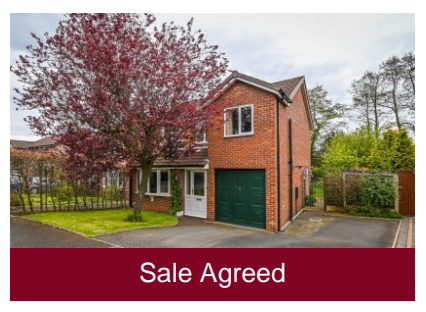
27 Greenway Avenue, Alveley, Bridgnorth