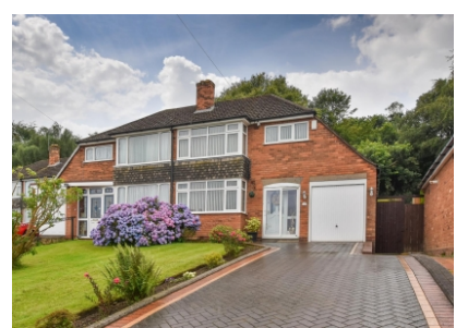
4 Chase View, Ettingshall Park, Wolverhampton