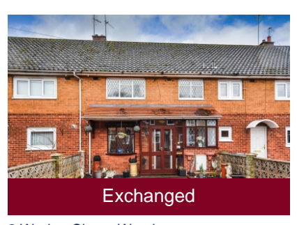
2 Woden Close, Wombourne, Wolverhampton