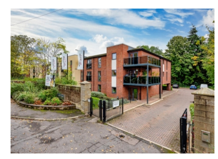
25 Thorneycroft, Wood Road, Tettenhall