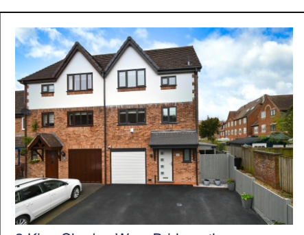
2 King Charles Way, Bridgnorth