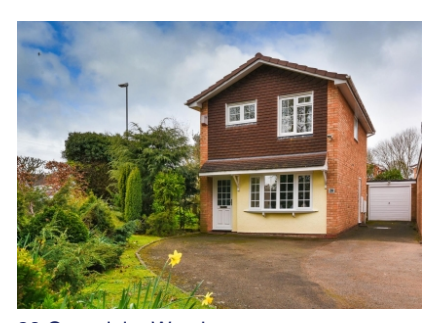
28 Quendale, Wombourne, Wolverhampton