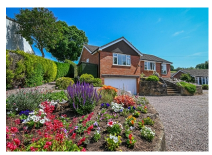
Three Ridges, Hilton, Bridgnorth