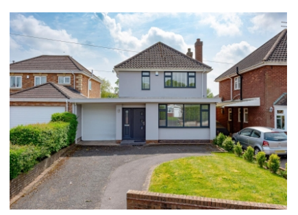
46 Wood Road, Codsall, Wolverhampton, WV8 1DN