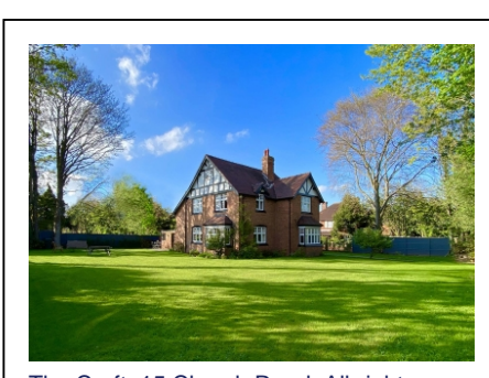
The Croft, 15 Church Road, Albrighton, Wolverhampton