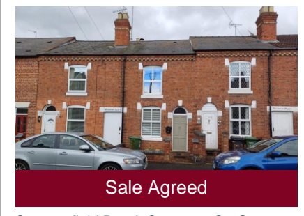
Summerfield Road, Stourport-On-Severn