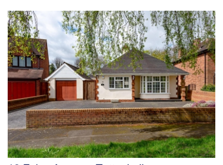
19 Foley Avenue, Tettenhall, Wolverhampton