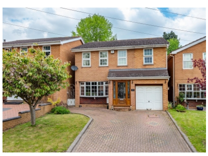
The Holloway, Swindon, Dudley