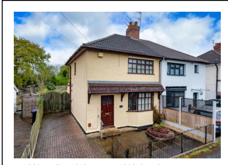
61 Woodland Avenue, Wolverhampton