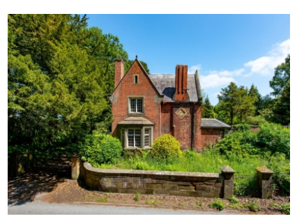
Wergs Hall Gardens, Wergs Hall Road, Tettenhall