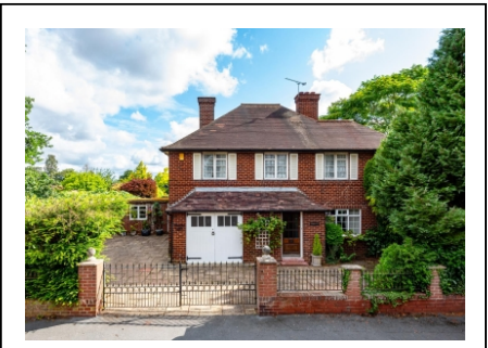
Oxleaze, Grange Road, Albrighton, Wolverhampton