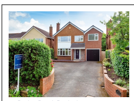
18 Rudge Road, Pattingham, Wolverhampton