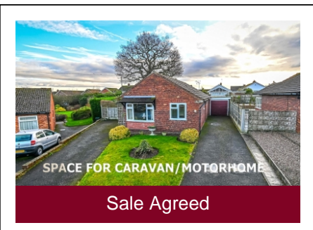
51 Linley View Drive, Bridgnorth