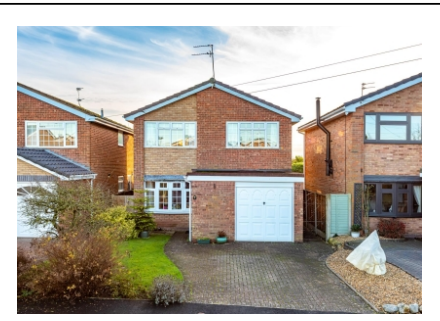
3 Braemar Road, Pattingham, Wolverhampton