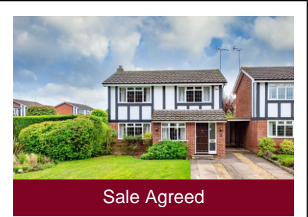
16 Meadow Vale, Codsall, Wolverhampton