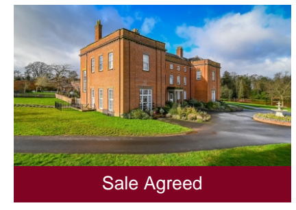
Upper Mill Meadow, Gatacre Hall, Gatacre, Claverley, Wolverhampton