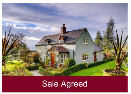
Trimpley Lane, Shatterford, Bewdley