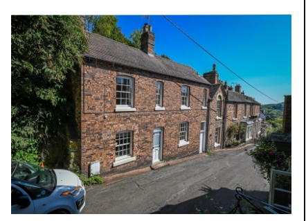
25 Church Hill, Ironbridge, Telford