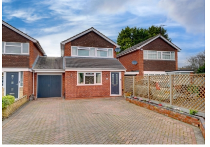
Elderberry Close, Stourport-On-Severn