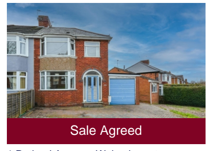
1 Rutland Avenue, Wolverhampton