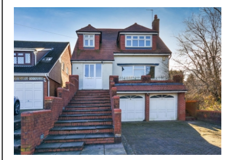
25 Bognop Road, Essington, Wolverhampton