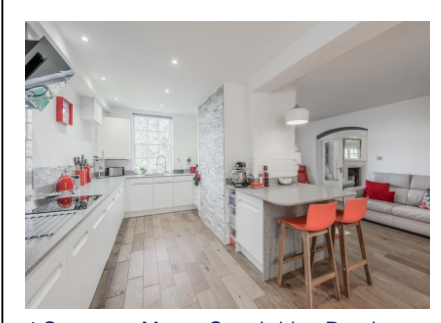
4 Stanmore Mews, Stourbridge Road, Stanmore, Bridgnorth