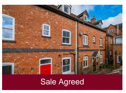
22a High Street, Bridgnorth