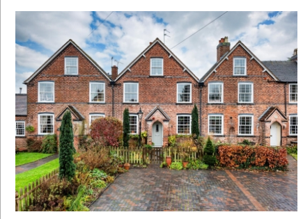
2 Labernum Cottages, Vicarage Road, Penn, Wolverhampton