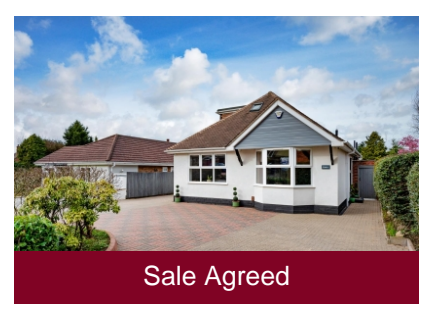
28a Wood Road, Tettenhall Wood