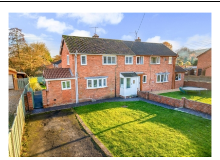
1 Brown Clee Road, Ditton Priors, Bridgnorth