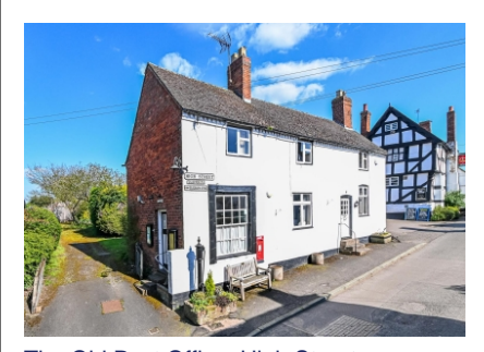
The Old Post Office, High Street, Claverley, Wolverhampton