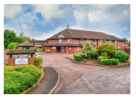
13 Saxon Park, High Street, Albrighton, Wolverhampton