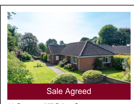
11 Compton Hill Drive, Compton, Wolverhampton