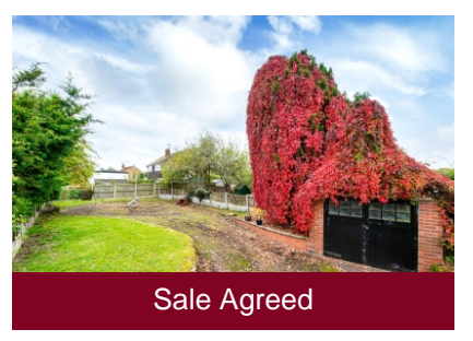
Planning Permission, 40 Moatbrook Lane, Codsall, WV8 1SD