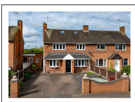
Giggetty Lane, Wombourne, Wolverhampton