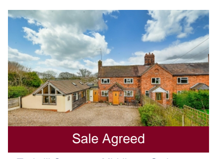
3 Tedstill Cottages, Middleton Scriven, Bridgnorth