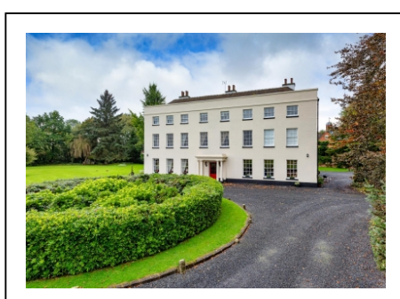
11 Leaton Hall, Church Lane, Bobbington, Stourbridge