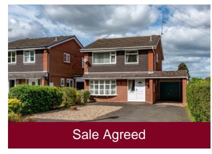
191 Common Road, Wombourne, Wolverhampton