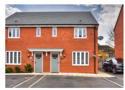
35 Foxglove Way, Himley