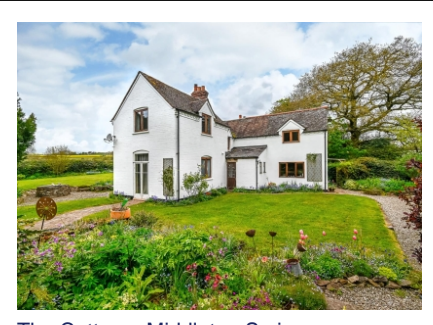
The Cottage, Middleton Scriven, Bridgnorth