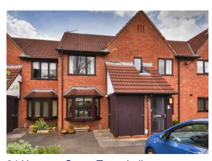
24 Hanover Court, Tettenhall, Wolverhampton