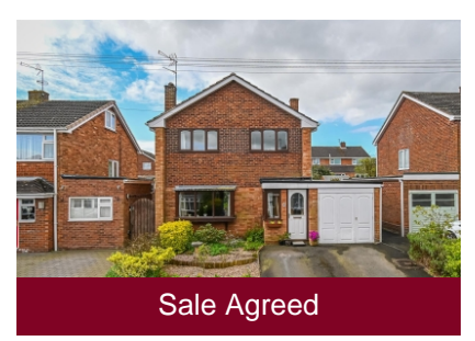
4 Whitmore Close, Bridgnorth