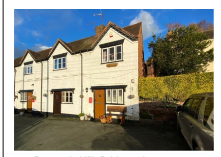
26c Bernards Hill, Bridgnorth