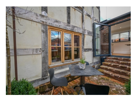
Park Cottage, Abbey Foregate, Shrewsbury