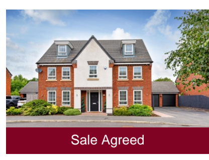
10 Lydiate Hill Road, Baggeridge Village