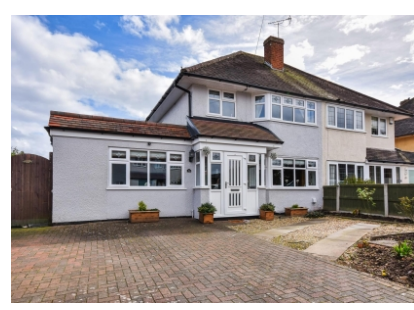
34 Delaware Avenue, Albrighton