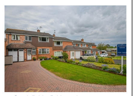
27 Castlefields, Bridgnorth