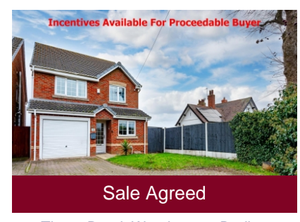
151 Tipton Road, Woodsetton, Dudley