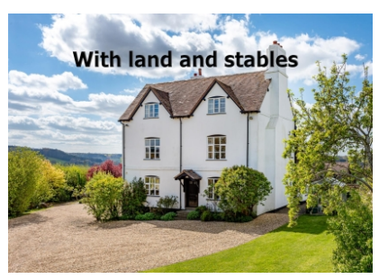
Ouseley Farm, Aston Eyre, Bridgnorth