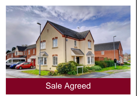
Greatwich Way, Kidderminster