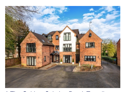
3 The Gables, Seisdon Road, Trysull, Wolverhampton