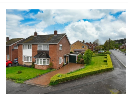
3 Hillside Avenue, Bridgnorth