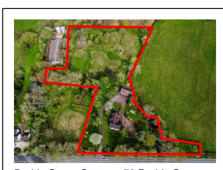
Dodds Green Cottage, 79 Dodds Green, Alveley, Bridgnorth