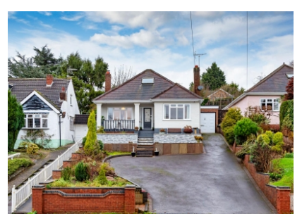
74 Bridgnorth Road, Compton