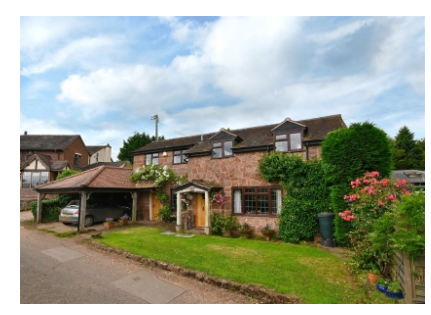
Finger Cottage, 123 Birds Green, Alveley, Bridgnorth