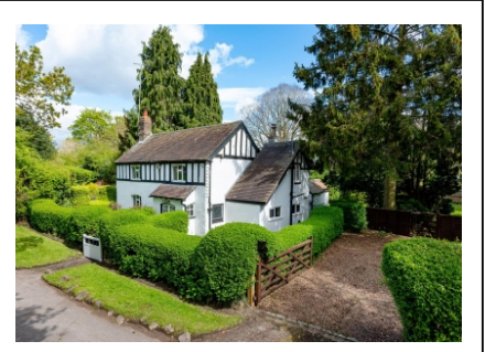
The Croft, 120 Post Office Road, Seisdon, Wolverhampton