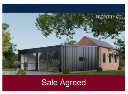
Plot 3, Bynd Lane, Billingsley, Bridgnorth