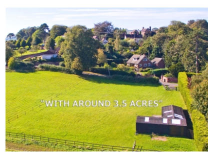
Half Acre House, Stableford, Bridgnorth