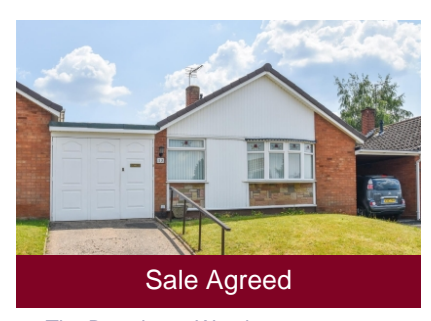
13 The Broadway, Wombourne, Wolverhampton