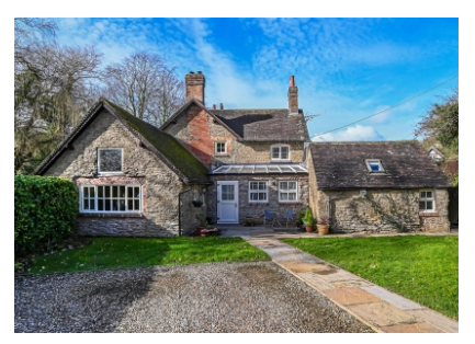
Brookside, Brockton, Much Wenlock