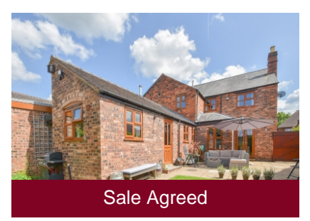
The Cottage, 18 Shop Lane, Oaken