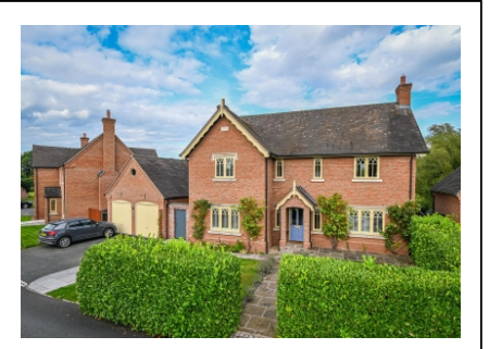
Fitzallen House, 3 Cound Park Drive, Cound, Shrewsbury