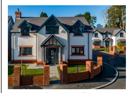
Alder House, Popes Lane, Tettenhall