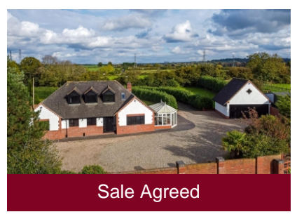
Rosebank, Ebstree Road, Seisdon, Nr Wolverhampton