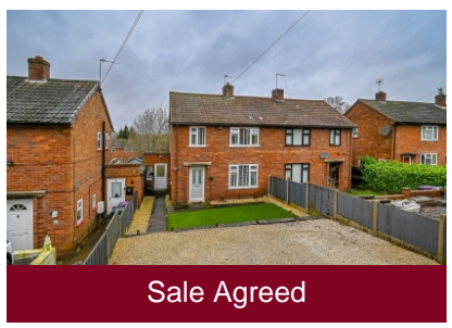
28 Lodge Lane, Bridgnorth