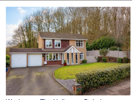
Wychaven, The Holloway, Swindon, Dudley