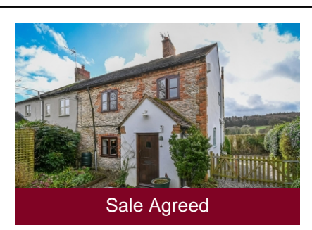
1 The Row, Easthope, Much Wenlock