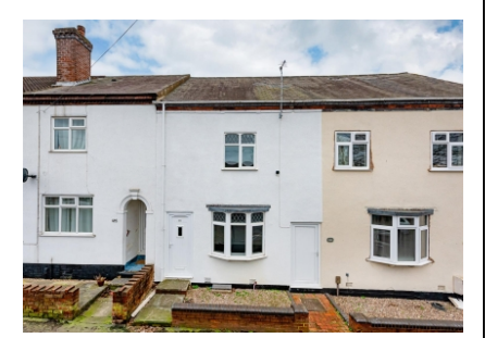
126a Clifton Street, Sedgley