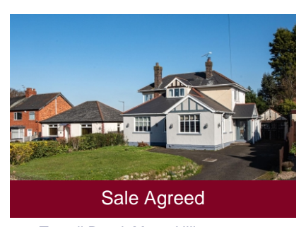
153 Trysull Road, Merry Hill, Wolverhampton