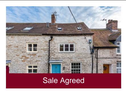
5a King Street, Much Wenlock, Shropshire