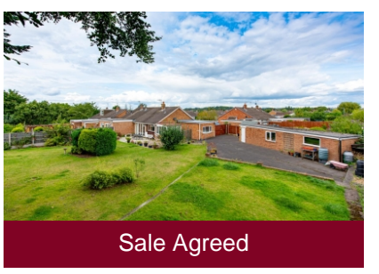
7 Blakeley Heath Drive, Wombourne, Wolverhampton