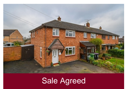
17 Racecourse Drive, Bridgnorth, Shropshire