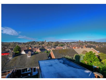
5 River View, Bridgnorth