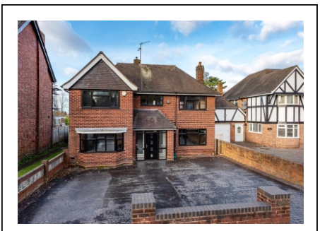
288b Penn Road, Wolverhampton