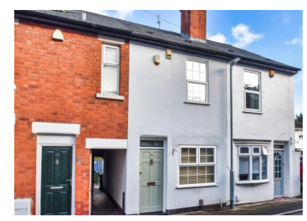
15 Nursery Walk, Tettenhall, Wolverhampton