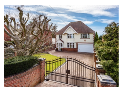
Catholic Lane, Sedgley, Dudley