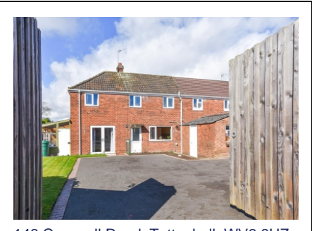
146 Cornwall Road, Tettenhall, WV6 8UZ