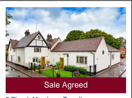
5 Plough Meadows, Trysull