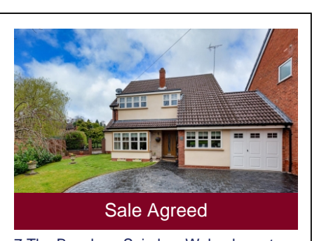
7 The Beeches, Seisdon, Wolverhampton