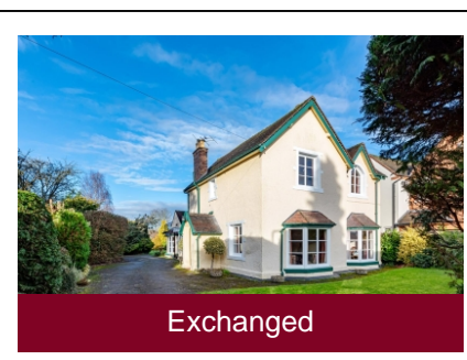
Ferndale, 7 Cross Road, Albrighton