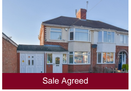
69 Fancourt Avenue, Wolverhampton