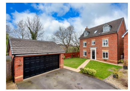
Oaklands, Wombourne, Wolverhampton