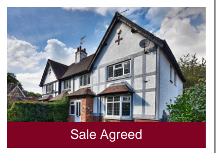
2 Danescourt Cottages, Danescourt Road, Tettenhall