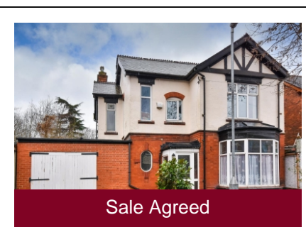
18 Elm Avenue, Bilston, Wolverhampton