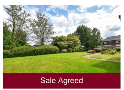
5 Saxon Park, High Street, Albrighton