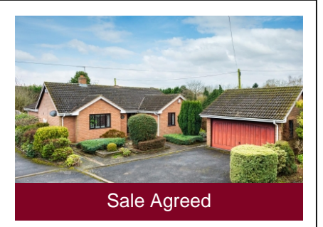
Shadowbrook, 4 Manor Fold, Middle Lane, Oaken