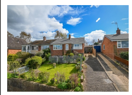
24 Greenfields Road, Bridgnorth