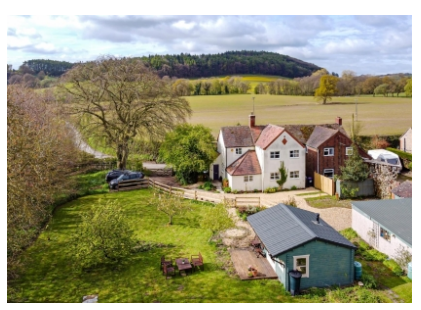
6 The Row, Easthope, Much Wenlock