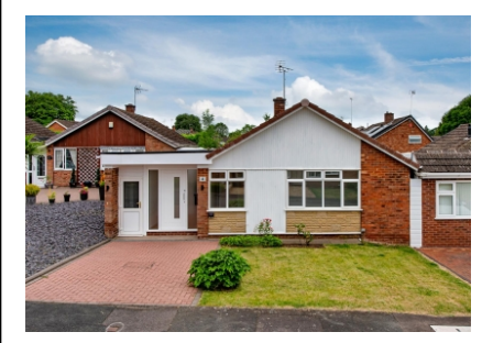
4 Mayfair Close, Albrighton, Wolverhampton