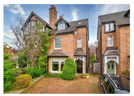
7 Westgate Villas, Salop Street, Bridgnorth