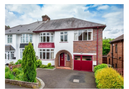
49 Canterbury Road, Penn, Wolverhampton