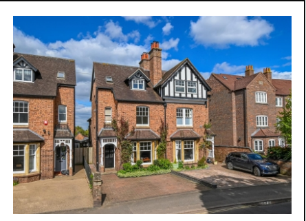
2 Westgate Villas, Salop Street, Bridgnorth