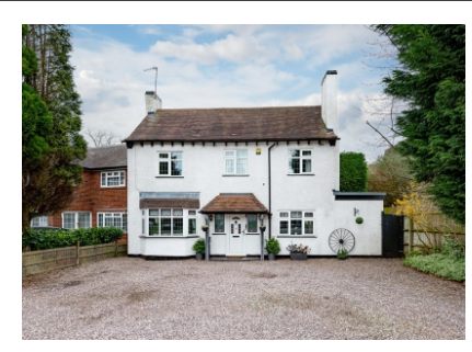
17 Stubbs Road, Wolverhampton