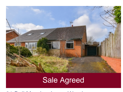
31 Bull Meadow Lane, Wombourne, Wolverhampton