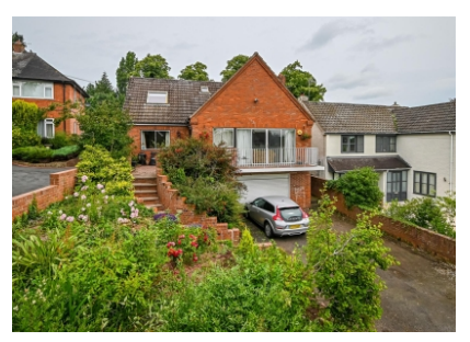
The Tyning, Westgate Drive, Bridgnorth