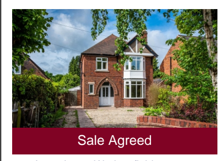
120 Amos Lane, Wednesfield