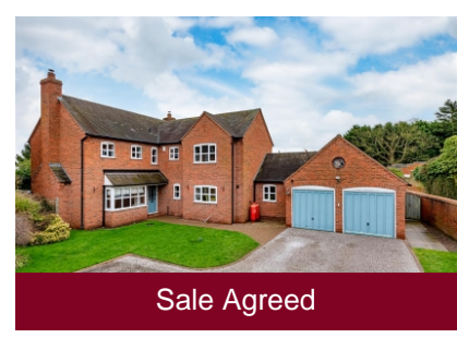
Rivendell, Park Lane, Lapley, Stafford