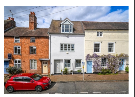
23 St Marys Street, Bridgnorth