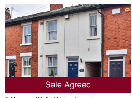
9 Nursery Walk, Wolverhampton