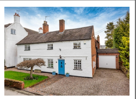
Garden Cottage, 4 Shop Lane, Brewood