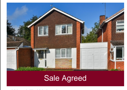
9 Westhill, Wolverhampton