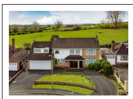
7 Wightwick Hall Road, Wightwick, WV6 8BZ