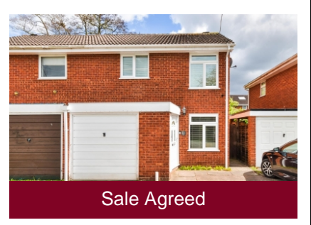
Forge Leys, Wombourne