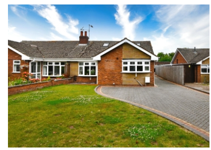
6 Lime Close, Alveley, Bridgnorth