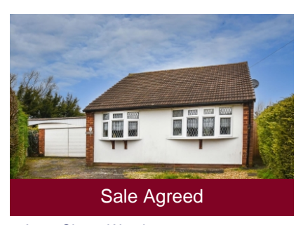
7 Apse Close, Wombourne, Wolverhampton