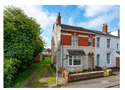
25 Newbridge Street, Newbridge, Wolverhampton, WV6 0EE