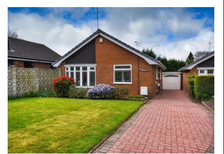
19 Finchdene Grove, Finchfield, Wolverhampton