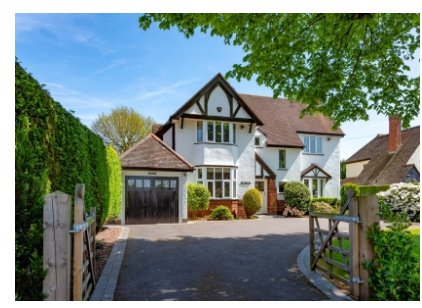
5 Coppice Road, Finchfield, Wolverhampton, WV3 8BJ