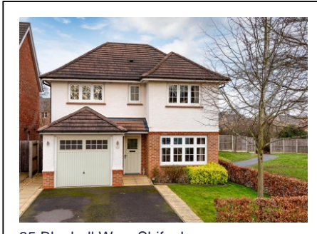
35 Bluebell Way, Shifnal