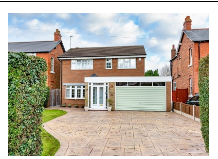
230a Trysull Road, Merry Hill, Wolverhampton