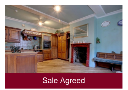
25a High Street, Bewdley