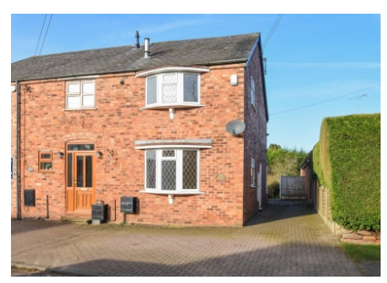
The Rambles, 16 Shop Lane, Oaken