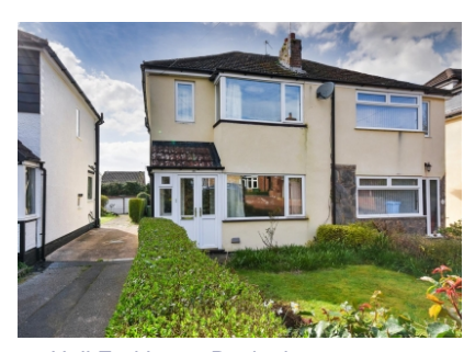
36 Hall End Lane, Pattingham, Wolverhampton