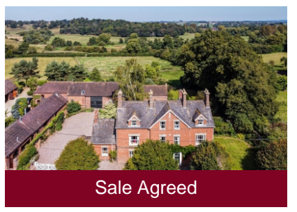
Roughton Farmhouse, Roughton, Bridgnorth