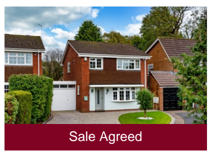
6 Tanglewood Grove, Dudley