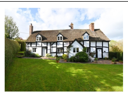
Clovers, Stableford, Bridgnorth