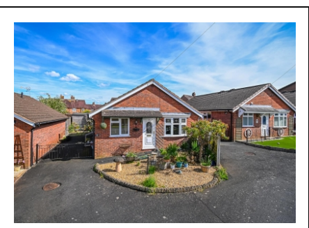
105 Hook Farm Road, Bridgnorth