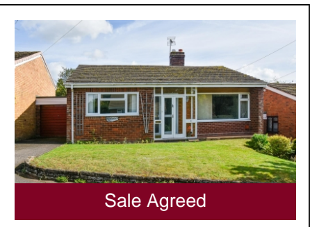
Foxcroft, 8 Fox Close, Seisdon