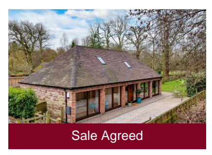
Eagle Barn, 4 Patshull Gardens, Albrighton