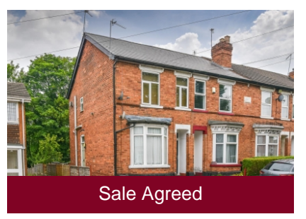
299 & 299a Hordern Road, Whitmore Reans