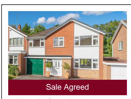
2 Whiteladies Court, Albrighton, Wolverhampton