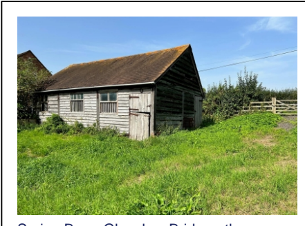
Spring Barn, Glazeley, Bridgnorth