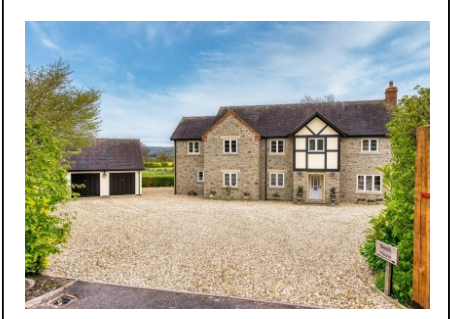
Beech House, Munslow, Shropshire