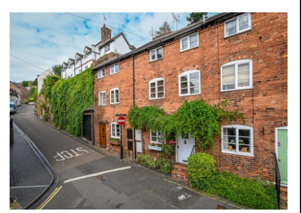
70 Cartway, Bridgnorth