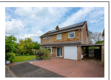
44 Romsley View, Alveley, Bridgnorth