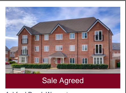
Ashford Road, Worcester