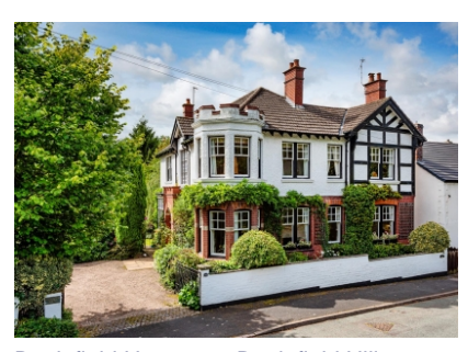
Battlefield House, 14 Battlefield Hill, Wombourne, Wolverhampton