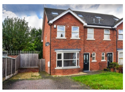
1 Marchant Road, Compton, Wolverhampton