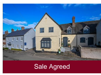
7 Bull Ring, Claverley, Wolverhampton