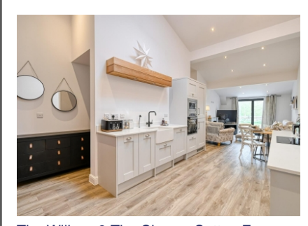
The Willow, 3 The Closes, Sutton Farm, Claverley, Wolverhampton