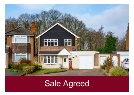
12 Hopstone Gardens, Penn, Wolverhampton