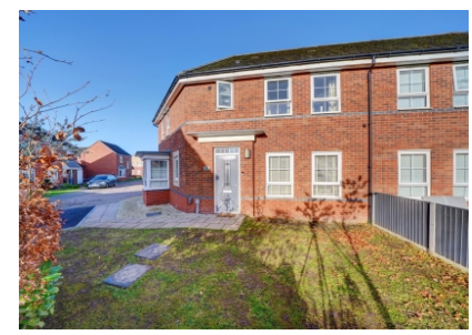
26 Rainsford Crescent, Kidderminster