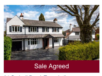
94 Codsall Road, Tettenhall, Wolverhampton