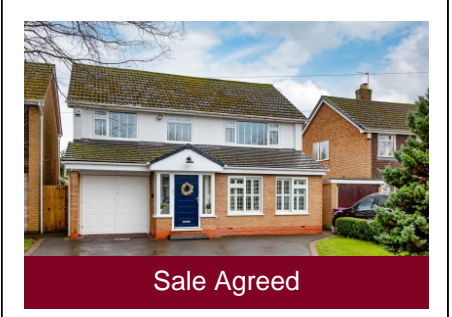
89 Redhouse Road, Tettenhall, Wolverhampton