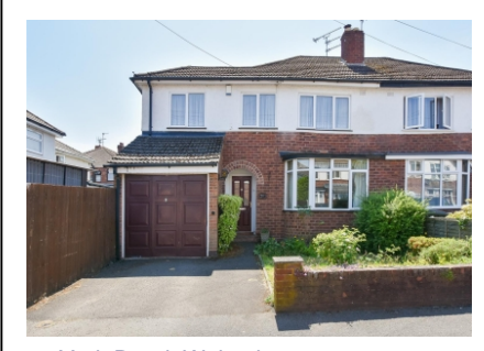
57 York Road, Wolverhampton