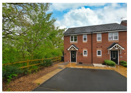
29 Hitchens Way, Highley, Bridgnorth