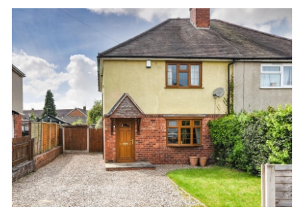
Redhill Avenue, Wombourne, Wolverhampton