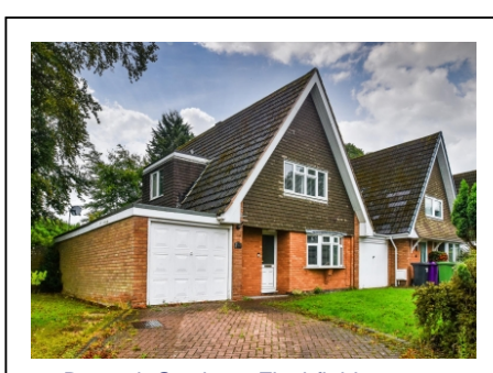
64 Bantock Gardens, Finchfield, Wolverhampton