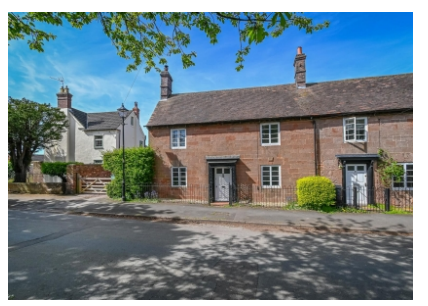
50 Ivy Place, Church Lane, Alveley, Bridgnorth