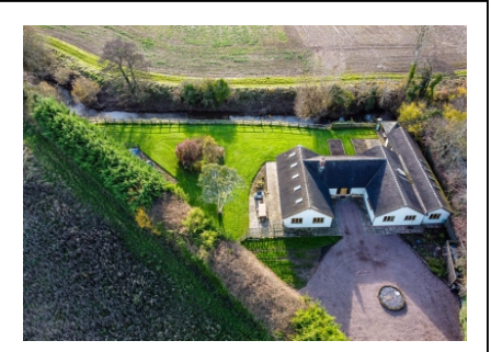
Riverside Bungalow, Muckley Cross, Acton Round, Bridgnorth