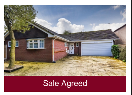
28a Mount Road, Mount Road, Tettenhall Wood