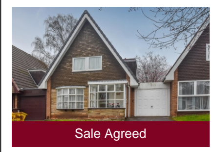
16 Surrey Drive, Finchfield, Wolverhampton