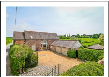
Trafalgar Barn, Worfield, Bridgnorth