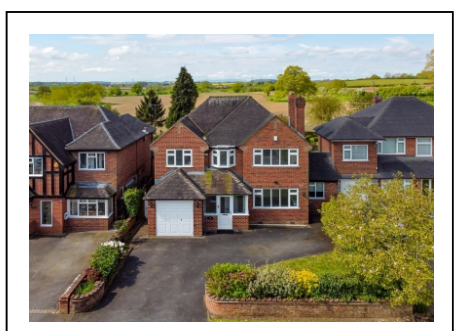
59 Sabrina Road, Wolverhampton