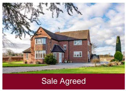
Trentham, Lapley Road, Wheaton Aston