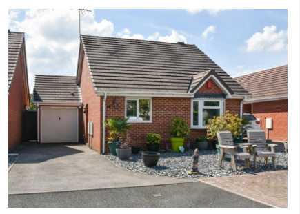
4 Hazelmere Drive, Castlecroft, Wolverhampton