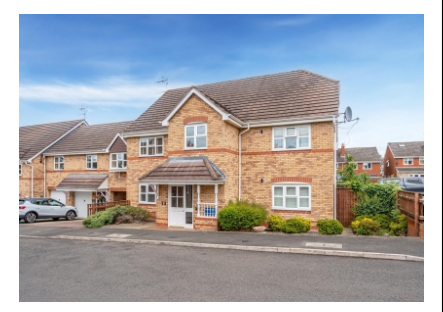
10 Cygnet Court, Wombourne, Wolverhampton