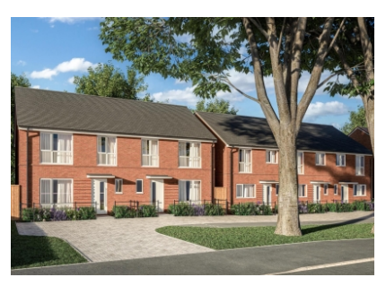
Plot 4 Nightingale Place, Vicarage Road, Wolverhampton