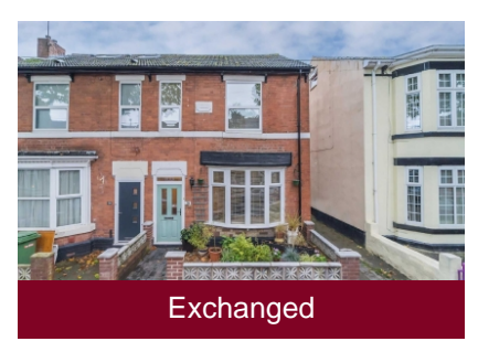
Allen Road, Whitmore Reans, Wolverhampton