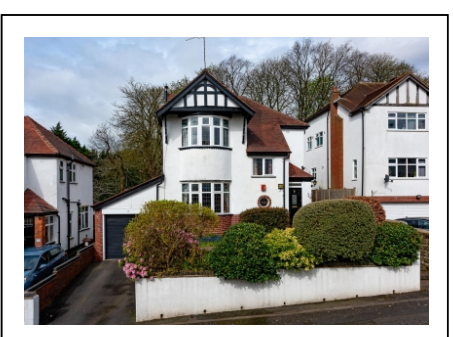
Tudor Crescent, Wolverhampton