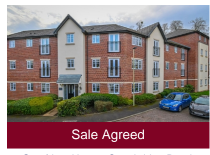
25 Greyfriars House, Stourbridge Road, Bridgnorth