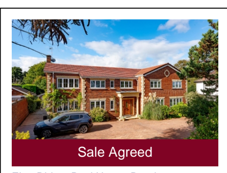
Elan Ridge. Pool House Road, Wombourne, Wolverhampton