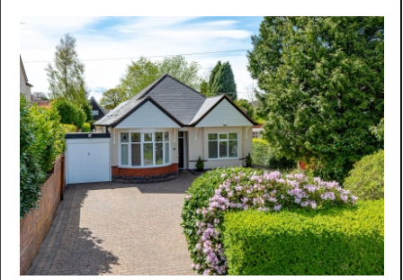
Mount Road, Penn, Wolverhampton