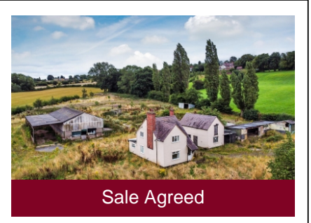
Robins Nest Farm, Dirty Foot Lane, Lower Penn, Wolverhampton