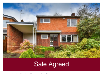
10 Ashfield Road, Compton, Wolverhampton