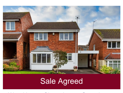
2 Woodthorne Close, Lower Gornal, Dudley