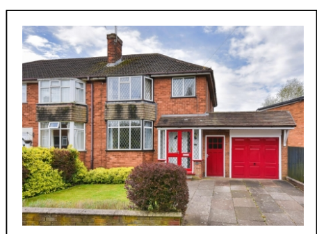
Wombourne Park, Wombourne