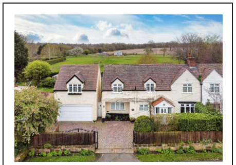
15 Birches Road, Codsall, Wolverhampton