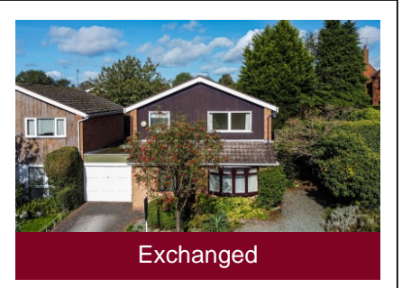
2 Beech Close, Pattingham, Wolverhampton