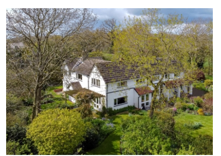
Leafields Farm, Shutt Green, Brewood, ST19 9LX