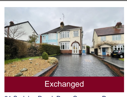
31 Sedgley Road, Penn Common, Penn