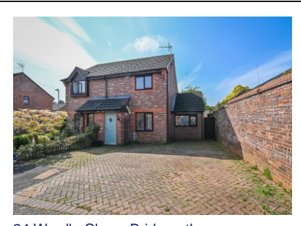
24 Wardle Close, Bridgnorth