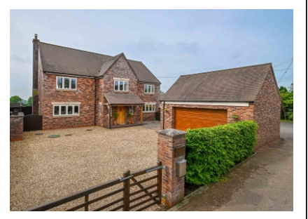
Faintree Heights, Faintree, Bridgnorth