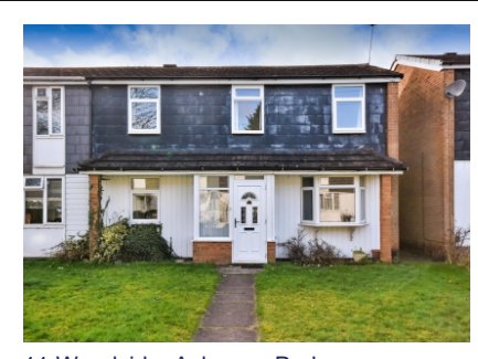
11 Woodside, Ashmore Park, Wolverhampton