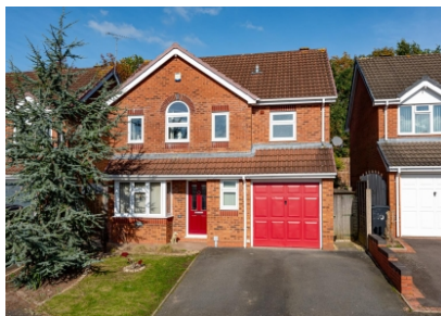
12 Dudmaston Way, Milking Bank, Dudley