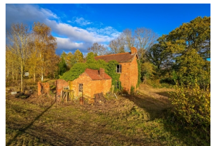
Plot 1, Bynd Lane, Billingsley, Bridgnorth