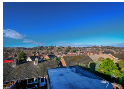
5 River View, Bridgnorth