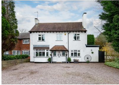
17 Stubbs Road, Wolverhampton