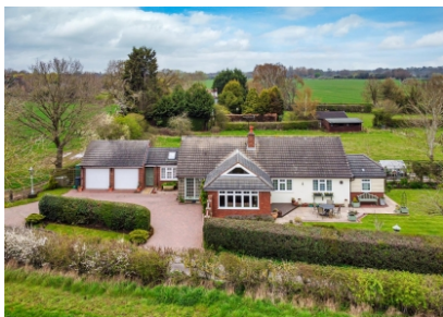
Holly Lodge, Church Lane, Boningale, Albrighton