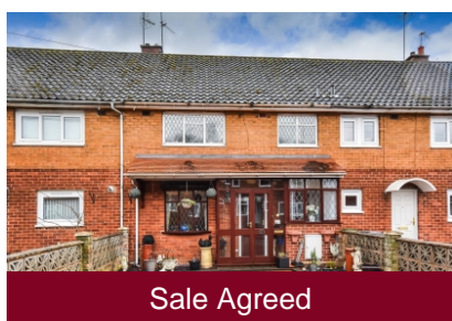
2 Woden Close, Wombourne, Wolverhampton