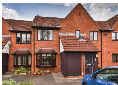
24 Hanover Court, Tettenhall, Wolverhampton