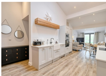
The Willow, 3 The Closes, Sutton Farm, Claverley, Wolverhampton