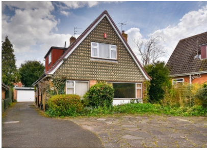
68 Mount Road, Tettenhall Wood, Wolverhampton