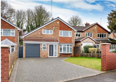
3 St. Marys Close, Dudley