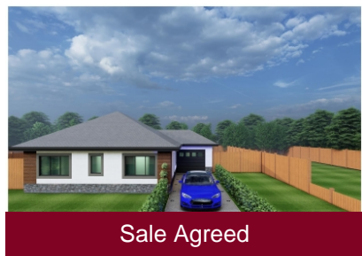
Plot 2 Hazelbrook, Hazel Lane, Great Wyrley