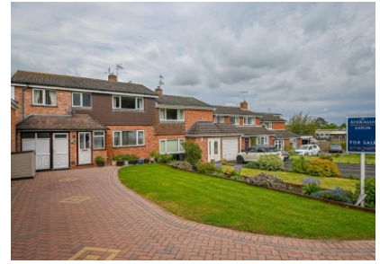
27 Castlefields, Bridgnorth