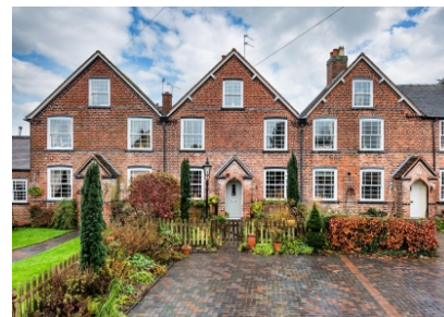
2 Labernum Cottages, Vicarage Road, Penn, Wolverhampton