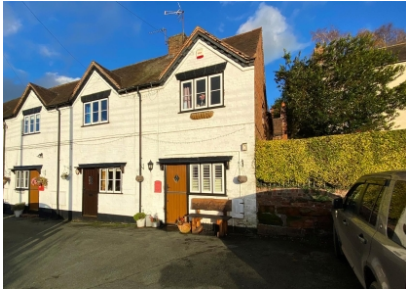
26c Bernards Hill, Bridgnorth