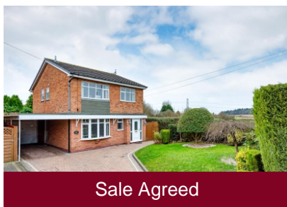
29 Windsor Road, Pattingham, Wolverhampton