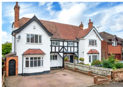
23 Hinckes Road, Tettenhall, Wolverhampton