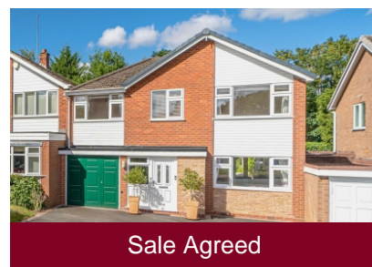
2 Whiteladies Court, Albrighton, Wolverhampton