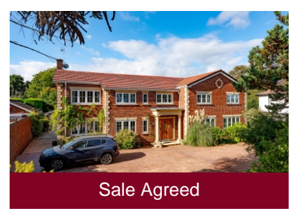
Elan Ridge. Pool House Road, Wombourne, Wolverhampton