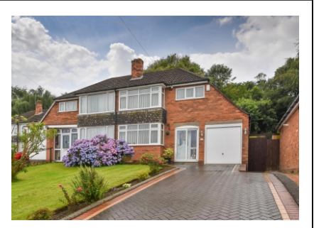
4 Chase View, Ettingshall Park, Wolverhampton