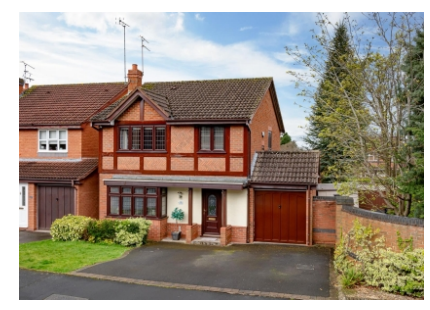
19 Penleigh Gardens, Wombourne, Wolverhampton