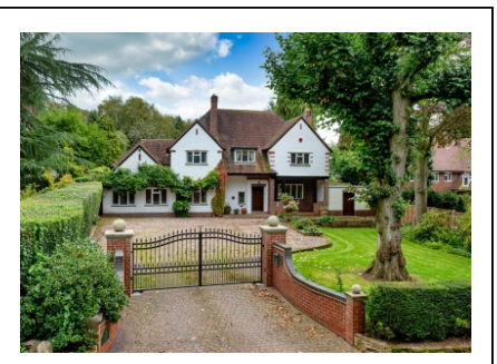
Hillside, 3 Tinacre Hill, Wightwick