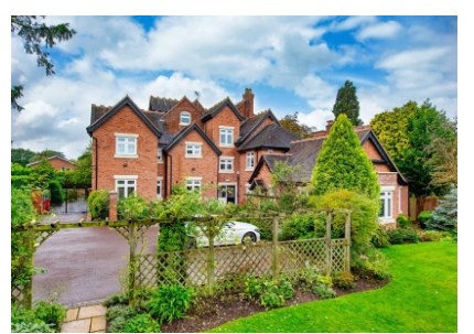
18f Southgate, Stockwell Road, Tettenhall, Wolverhampton