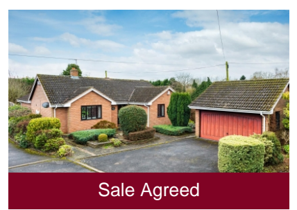
Shadowbrook, 4 Manor Fold, Middle Lane, Oaken