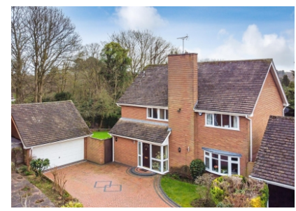
5 Mayswood Drive, Wightwick