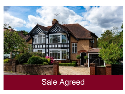
2 Highlands Road, Finchfield, Wolverhampton