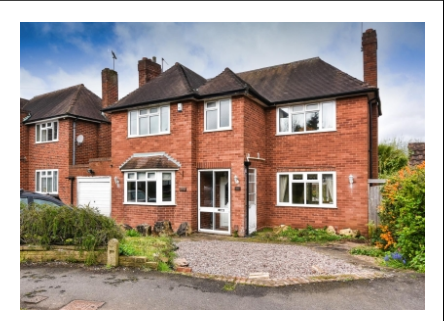
66 York Avenue, Finchfield, Wolverhampton