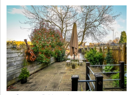
45 Cartway, Bridgnorth