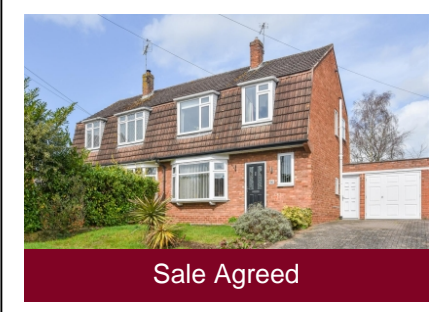
96 Planks Lane, Wombourne, Wolverhampton