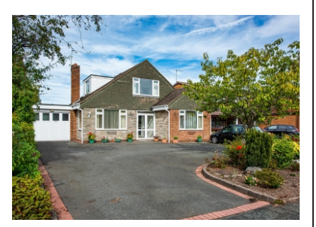
83 Cranmere Avenue, Tettenhall, Wolverhampton