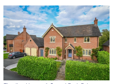
Fitzallen House, 3 Cound Park Drive, Cound, Shrewsbury