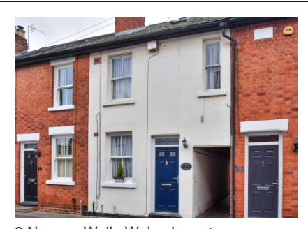
9 Nursery Walk, Wolverhampton