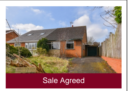
31 Bull Meadow Lane, Wombourne, Wolverhampton