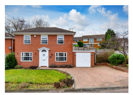
2 Heath House Drive, Wombourne, Wolverhampton