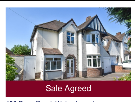
490 Penn Road, Wolverhampton