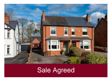
Medlicote, 79 Wood Road, Codsall