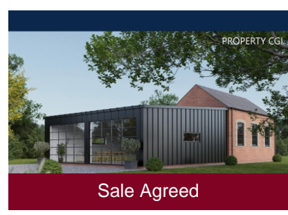
Plot 3, Bynd Lane, Billingsley, Bridgnorth