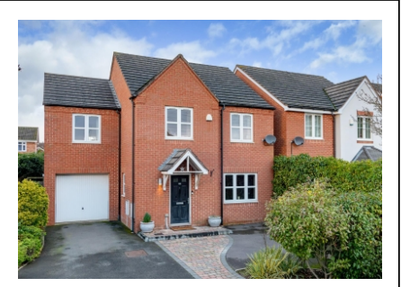
80 Brickbridge Lane, Wombourne, Wolverhampton