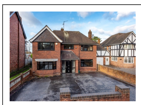
288b Penn Road, Wolverhampton