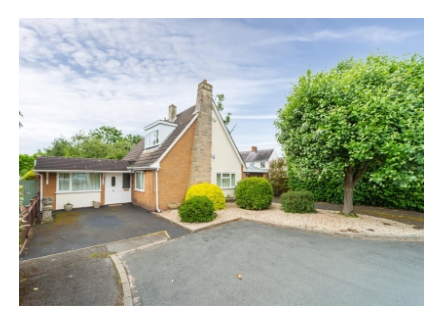
8 The Orchard, Albrighton