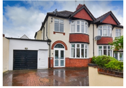
Pennhouse Avenue, Wolverhampton