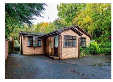
6 Finchfield Hill, Compton, Wolverhampton