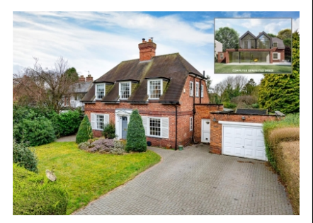
The Dormers, Finchfield Gardens, Finchfield