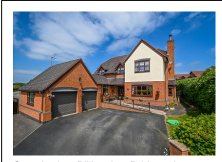
Cape Lodge, Billingsley, Bridgnorth