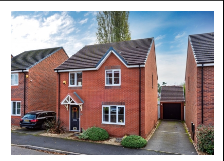
39 Rakegate Close, Oxley, Wolverhampton