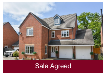
36 Hough Way, Shifnal