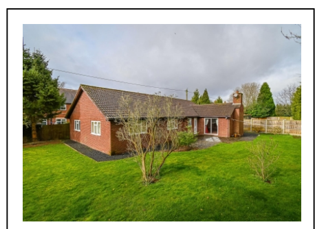
The Old Kiln, Church Lane, Bridgnorth