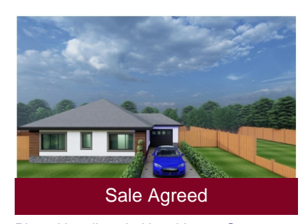
Plot 2 Hazelbrook, Hazel Lane, Great Wyrley