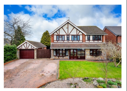
11 Waverley Gardens, Wombourne, Wolverhampton