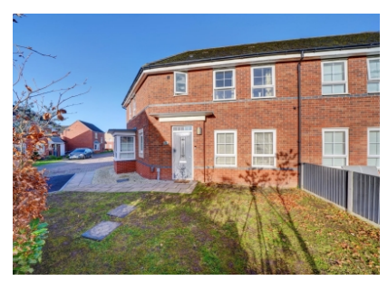
26 Rainsford Crescent, Kidderminster