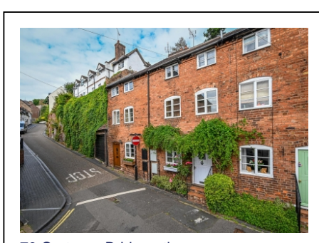
70 Cartway, Bridgnorth