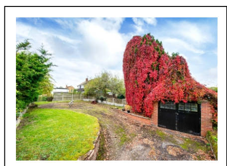
Planning Permission, 40 Moatbrook Lane, Codsall, WV8 1SD