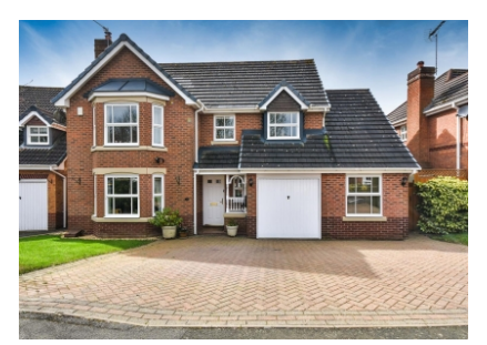
Kinloch Drive, Dudley