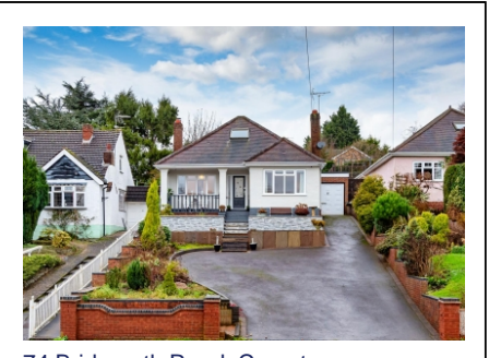
74 Bridgnorth Road, Compton