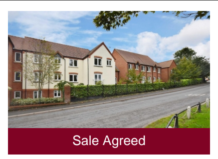
21 Farthings Court, Kings Loade, Bridgnorth