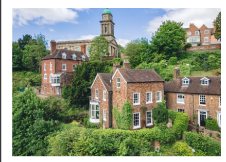
Castle Cliffe House, 24 St. Mary's Steps, Bridgnorth