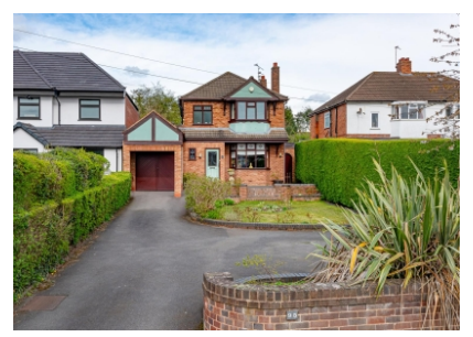
95 Windmill Lane, Castlecroft, Wolverhampton