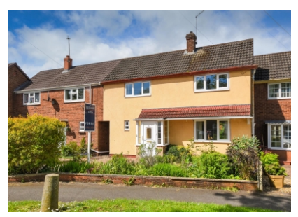
71 Cornwall Road, Tettenhall Wood