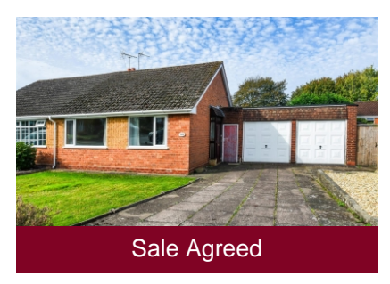
10 Gardeners Way, Wombourne, Wolverhampton