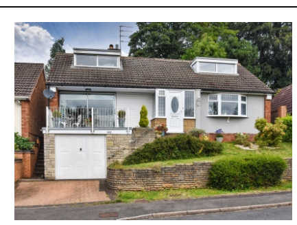
142 Bridgnorth Road, Wolverhampton