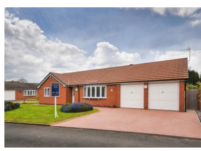
1 The Courts, Albrighton, Wolverhampton