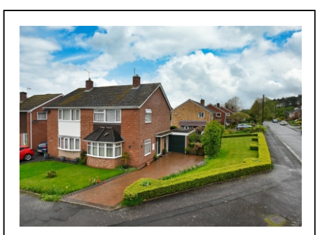
3 Hillside Avenue, Bridgnorth