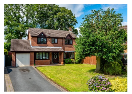
South View Close, Codsall, Wolverhampton