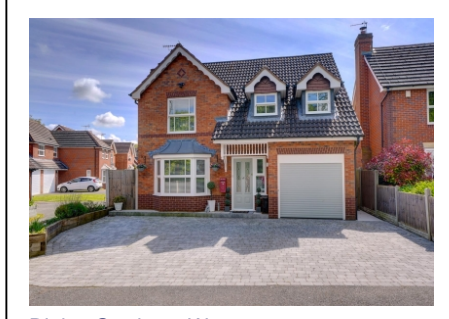
Ripley Gardens, Worcester