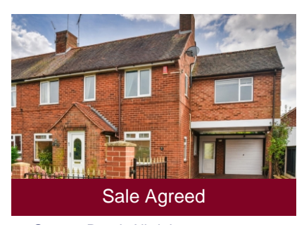
13 Grange Road, Albrighton, Wolverhampton