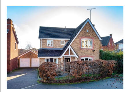
17 Holendene Way, Wombourne, Wolverhampton