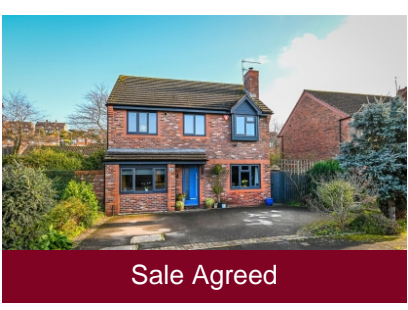
10 Washbrook Road, Bridgnorth