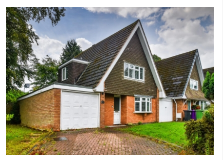
64 Bantock Gardens, Finchfield, Wolverhampton