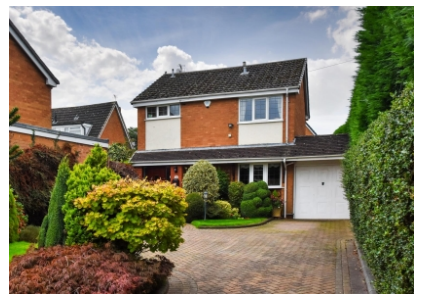
39 High Street, Pattingham, Wolverhampton