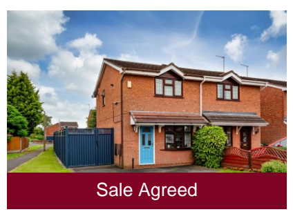
7 Leasowe Drive, Perton, Wolverhampton