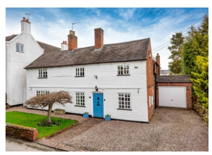
Garden Cottage, 4 Shop Lane, Brewood