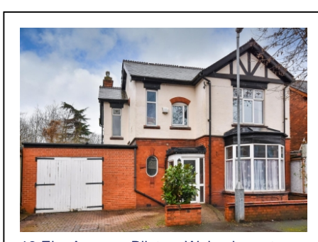
18 Elm Avenue, Bilston, Wolverhampton