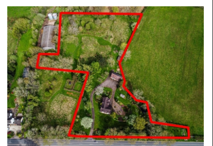
Dodds Green Cottage, 79 Dodds Green, Alveley, Bridgnorth