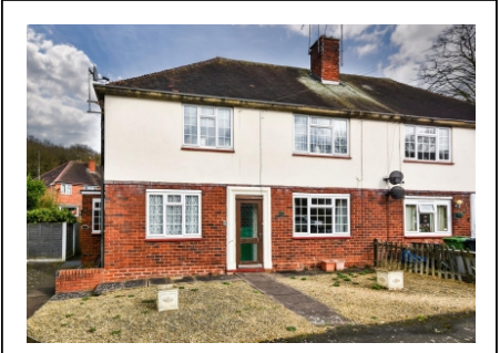
73 Meadow Lane, Wombourne, Wolverhampton