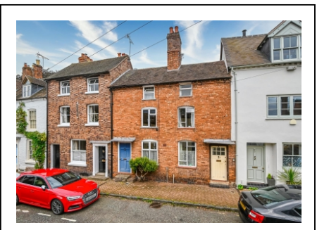
25 St. Marys Street, Bridgnorth