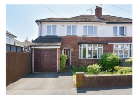
57 York Road, Wolverhampton