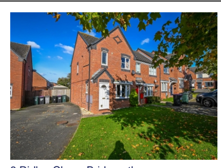
8 Ridley Close, Bridgnorth