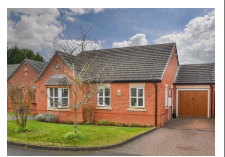
14 Berkeley Close, Perton, Wolverhampton