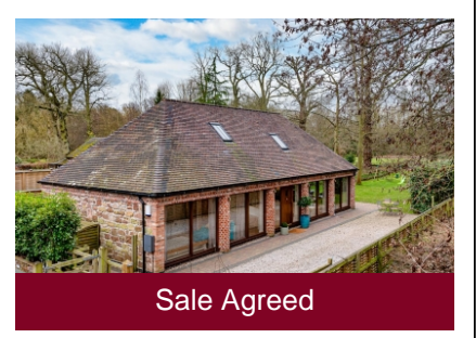
Eagle Barn, 4 Patshull Gardens, Albrighton