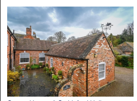
Corner House, 3 Stableford Hall, Stableford, Bridgnorth