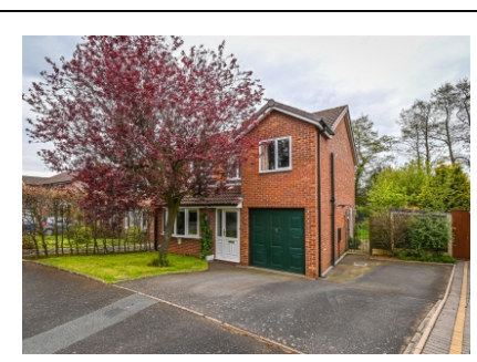
27 Greenway Avenue, Alveley, Bridgnorth