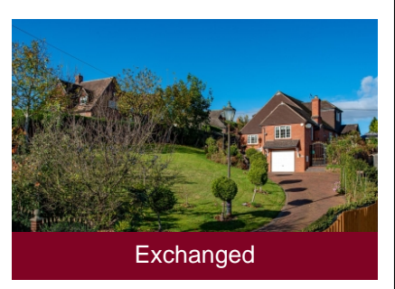
The Stable, 46 Ludlow Road, Bridgnorth