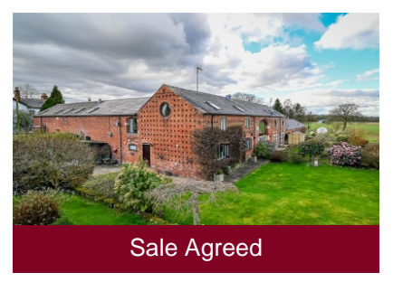
The Oak House, Oaklands Court, Lower Rudge, Pattingham