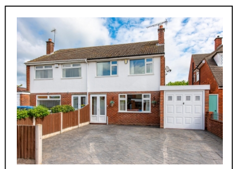
19 Chapel Street, Wombourne