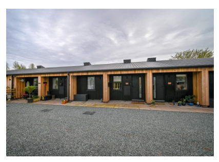
The Willow, 3 The Closes, Sutton Farm, Claverley, Wolverhampton