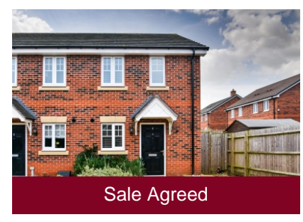
4 Leveson Crescent, Codsall, Wolverhampton