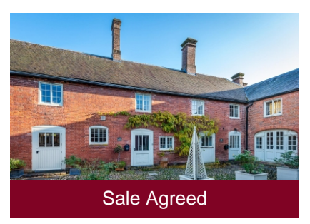
The Ostlers, 3 Patshull Hall Mews, Burnhill Green