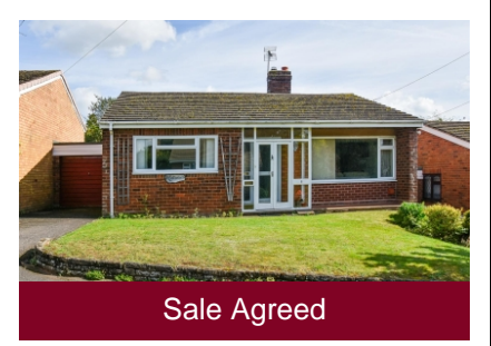
Foxcroft, 8 Fox Close, Seisdon