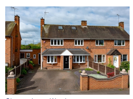
Giggetty Lane, Wombourne, Wolverhampton