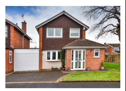
10 Ashley Gardens, Codsall, Wolverhampton