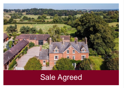
Roughton Farmhouse, Roughton, Bridgnorth