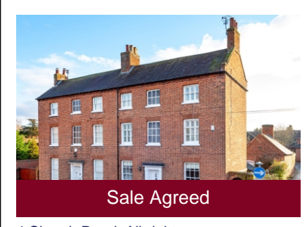
4 Church Road, Albrighton, Wolverhampton