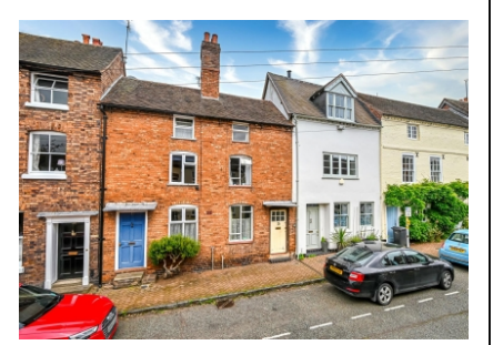
24 St. Marys Street, Bridgnorth