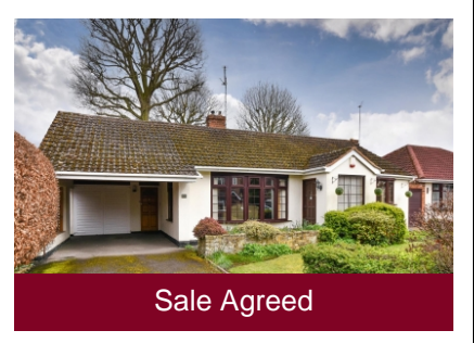
30 Sabrina Road, Wightwick, Wolverhampton