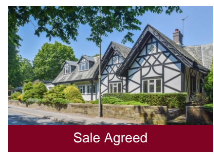
Woodhouse Lodge, Wood Road, Tettenhall Wood