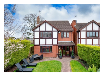
Waterford, Ball Lane, Coven Heath, Wolverhampton