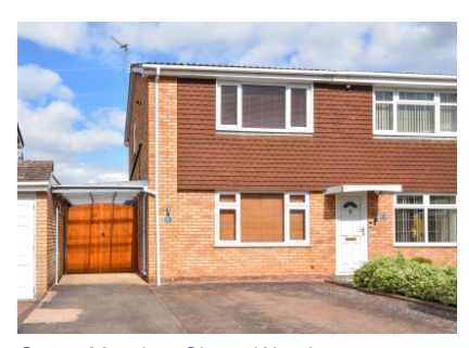
Green Meadow Close, Wombourne, Wolverhampton