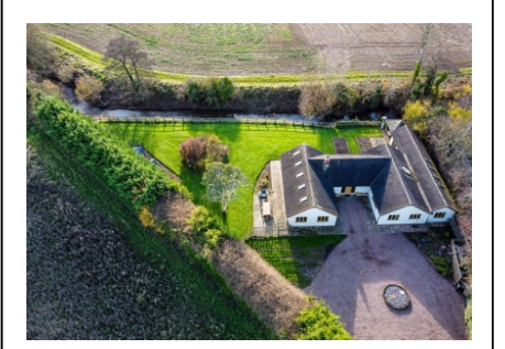
Riverside Bungalow, Muckley Cross, Acton Round, Bridgnorth