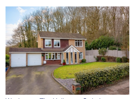
Wychaven, The Holloway, Swindon, Dudley