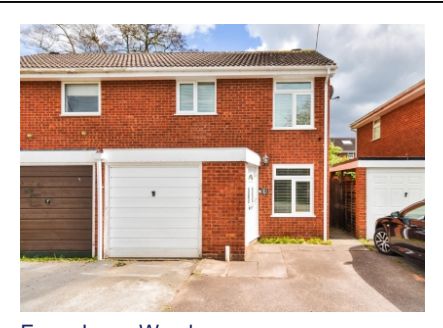
Forge Leys, Wombourne