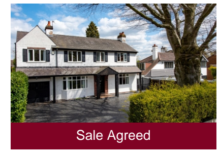
94 Codsall Road, Tettenhall, Wolverhampton