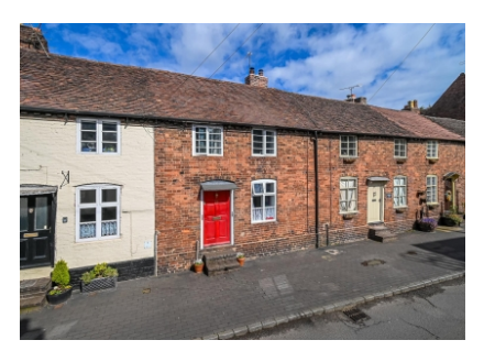
28 Whitburn Street, Bridgnorth