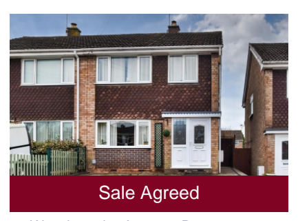
61 Wynchcombe Avenue, Penn, Wolverhampton