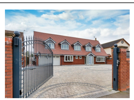
Alpine Cottage, 11 Kings Road, Calf Heath