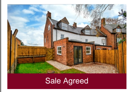
4 Rudge Road, Pattingham, Wolverhampton