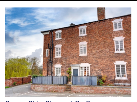
Severn Side, Stourport-On-Severn