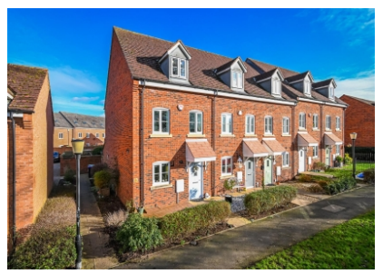
75 Rastrick Close, Bridgnorth