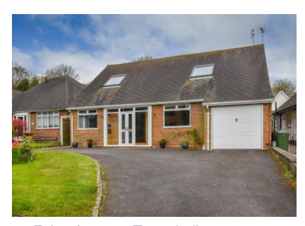
38 Foley Avenue, Tettenhall, Wolverhampton