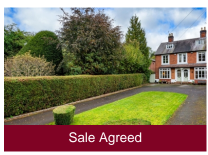
Fernleigh, 35 Oaken Lanes, Codsall