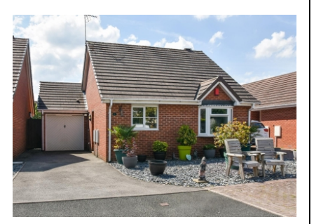
4 Hazelmere Drive, Castlecroft, Wolverhampton