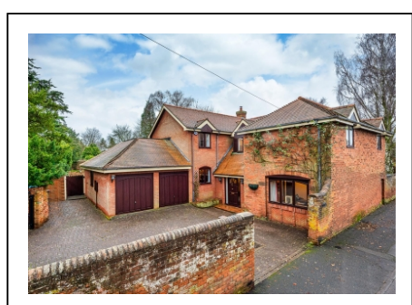
Manor Court, Cross Road, Albrighton, Wolverhampton