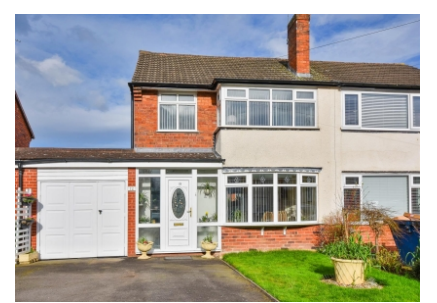
12 Oakfield Road, Codsall, Wolverhampton