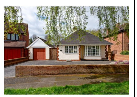
19 Foley Avenue, Tettenhall, Wolverhampton