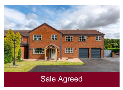
3 Mill Stream Close, Codsall, Wolverhampton