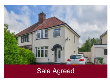
178 Marsh Lane, Fordhouses, Wolverhampton