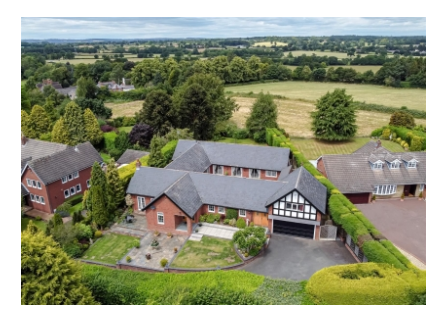
Courtneys, Oaken Drive, Oaken, Codsall