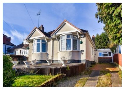
The Chalett, 78 Bridgnorth Road, Compton