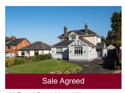
153 Trysull Road, Merry Hill, Wolverhampton