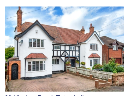
23 Hinckes Road, Tettenhall, Wolverhampton