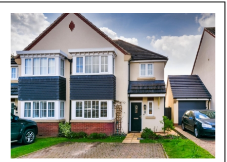
4 The Limes, Codsall Wood, Wolverhampton