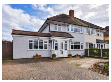
34 Delaware Avenue, Albrighton