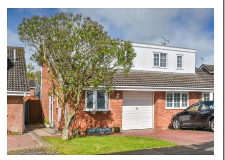
39 Mercia Drive, Perton, Wolverhampton