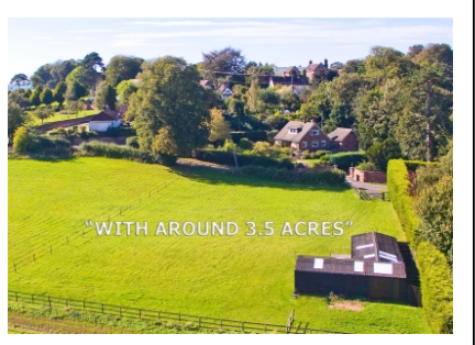
Half Acre House, Stableford, Bridgnorth