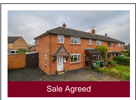
17 Racecourse Drive, Bridgnorth, Shropshire