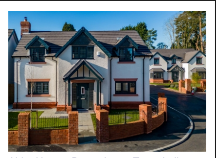
Alder House, Popes Lane, Tettenhall