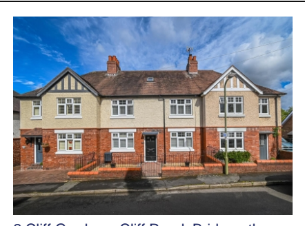
2 Cliff Gardens, Cliff Road, Bridgnorth