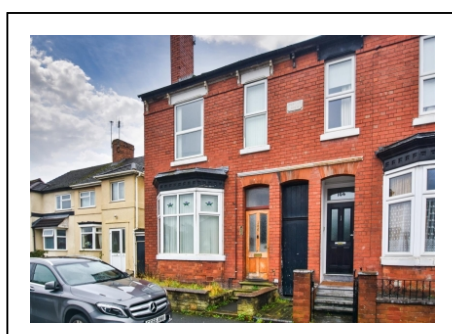
166 Crowther Road, Wolverhampton