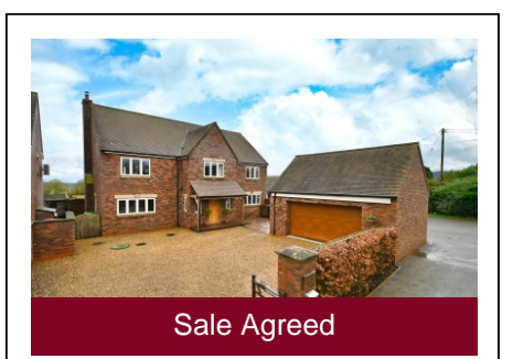
Faintree Heights, Faintree, Bridgnorth