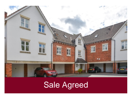
2 Albrighton House, The Water Gardens, Wolverhampton