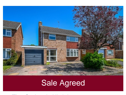
14 The Orchard, Albrighton, Wolverhampton