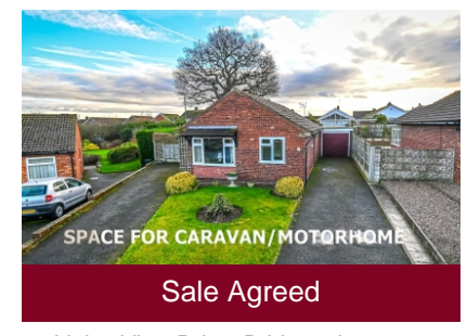
51 Linley View Drive, Bridgnorth