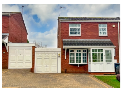
14 St James Street, Lower Gornal, Dudley