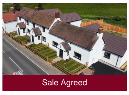
2 Ackleton Meadows, Stableford, Bridgnorth