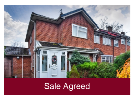
5 Manor Close, Codsall, Wolverhampton