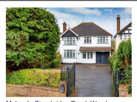
Maleesh, Stourbridge Road, Wombourne