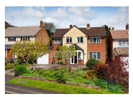
5 Torvale Road, Wightwick, WV6 8NW