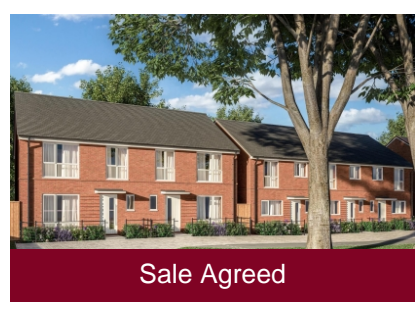
Plot 2 Nightingale Place, Vicarage Road, Wolverhampton