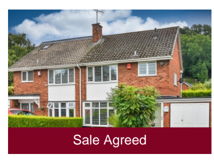
23 Chequers Avenue, Wombourne, Wolverhampton