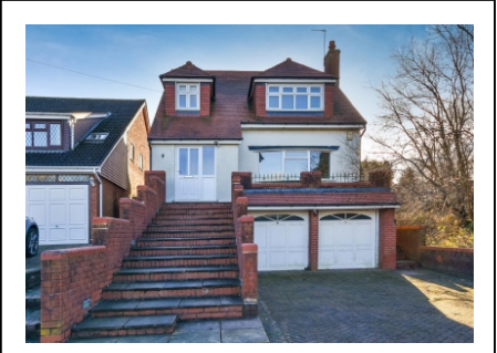
25 Bognop Road, Essington, Wolverhampton