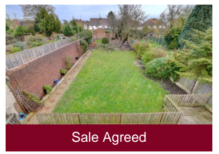
Grosvenor Avenue, Kidderminster