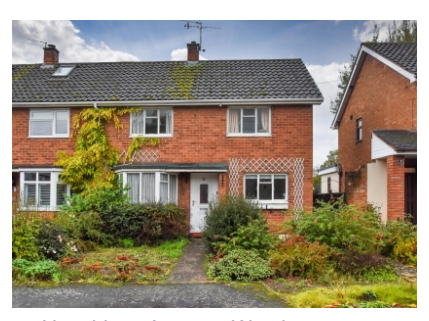
10 Neachless Avenue, Wombourne, Wolverhampton