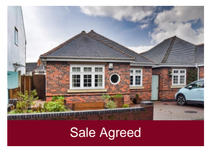
70 Finchfield Road, Wolverhampton