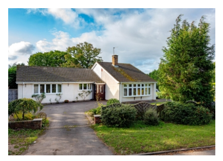
12 Keepers Lane, Codsall, Wolverhampton