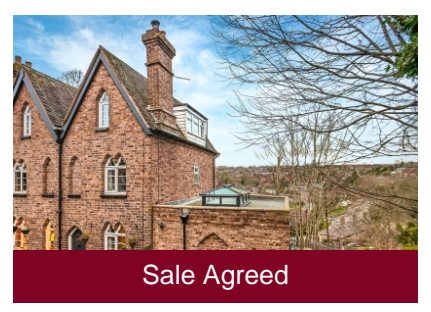
14 West Castle Street, Bridgnorth