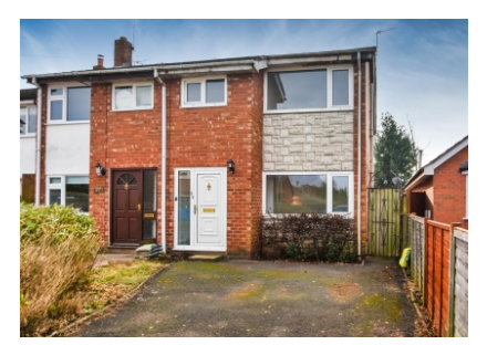
99 Hazel Grove, Wombourne, Wolverhampton