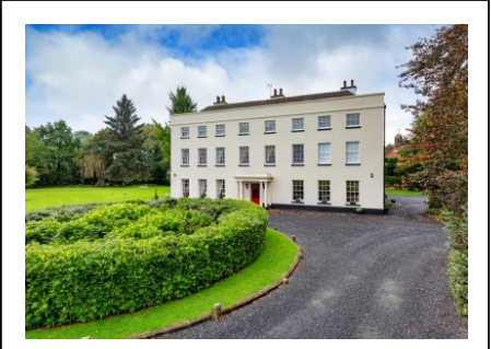
11 Leaton Hall, Church Lane, Bobbington, Stourbridge