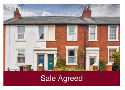
46 Merridale Road, Wolverhampton