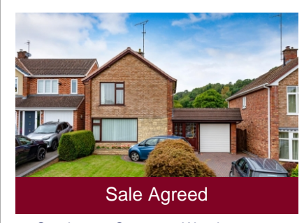
51 Strathmore Crescent, Wombourne