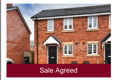
6 Sanderson Way, Codsall, Wolverhampton