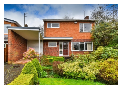
10 Ashfield Road, Compton, Wolverhampton