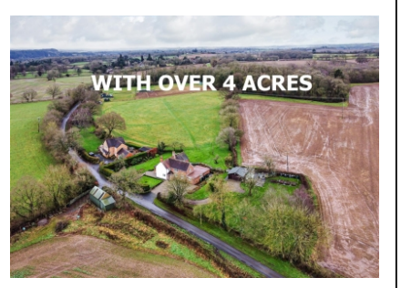
Keepers Cottage, Colemore Green, Bridgnorth