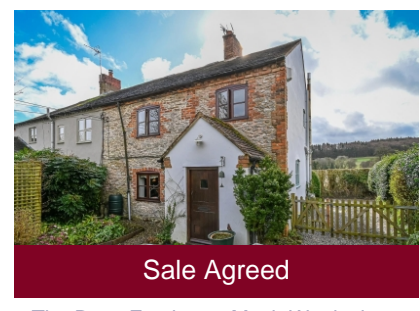
1 The Row, Easthope, Much Wenlock