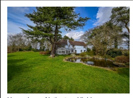
Horseshoes, Netherton, Highley, Bridgnorth