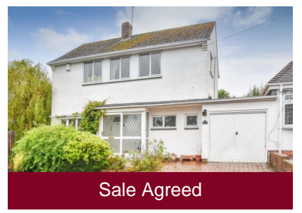
4 Newgate, Pattingham, Wolverhampton