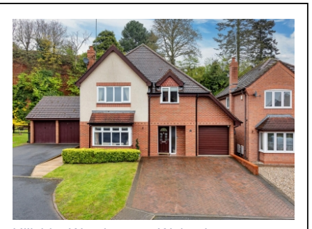
Hillside, Wombourne, Wolverhampton