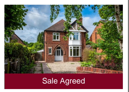
120 Amos Lane, Wednesfield