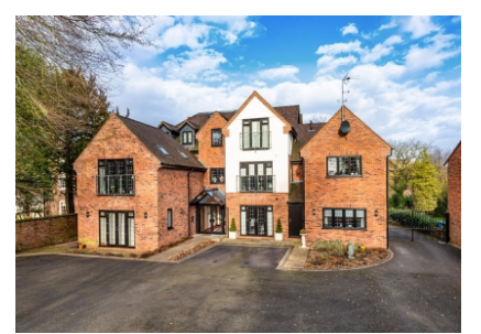
3 The Gables, Seisdon Road, Trysull, Wolverhampton