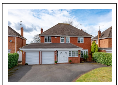
18 Corfton Drive, Tettenhall