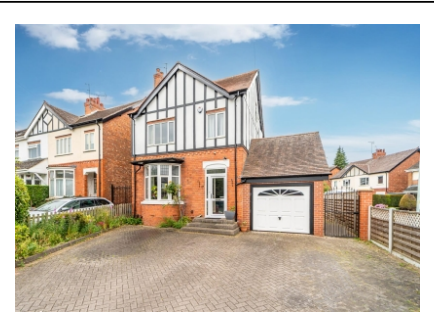
Tregunna, 27 Richmond Road, Finchfield