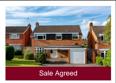
11 Copper Beech Drive, Wombourne, Wolverhampton