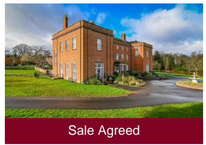
Upper Mill Meadow, Gatacre Hall, Gatacre, Claverley, Wolverhampton