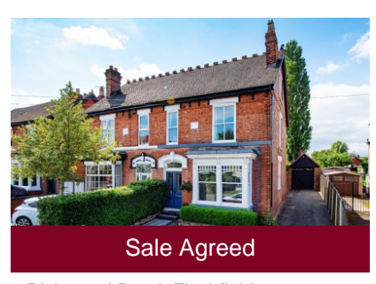
7 Richmond Road, Finchfield, Wolverhampton