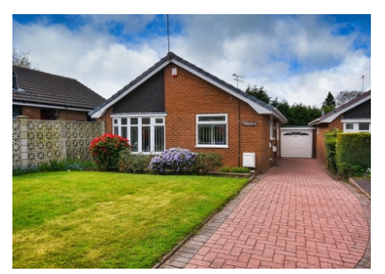
19 Finchdene Grove, Finchfield, Wolverhampton