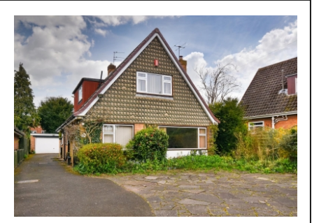
68 Mount Road, Tettenhall Wood, Wolverhampton