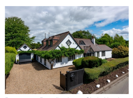
Pennygate, Paradise Lane, Slade Heath, Wolverhampton