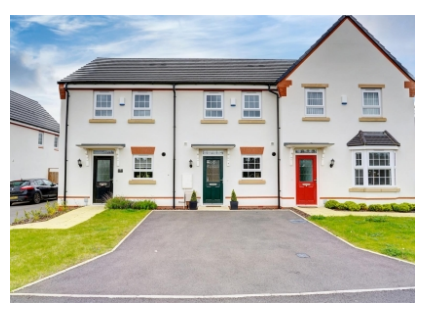
9 Narburgh Place, Alveley, Bridgnorth