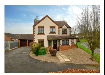
3 Danesbrook, Claverley, Wolverhampton