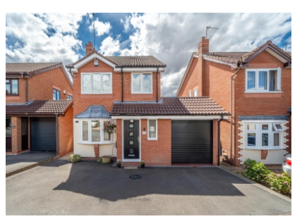
23 Penleigh Gardens, Wombourne