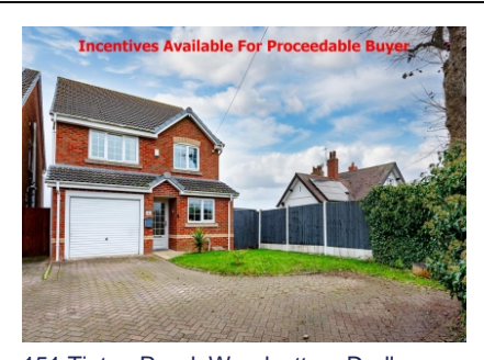
151 Tipton Road, Woodsetton, Dudley