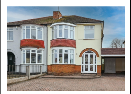
53 Woodland Road, Merry Hill, Wolverhampton