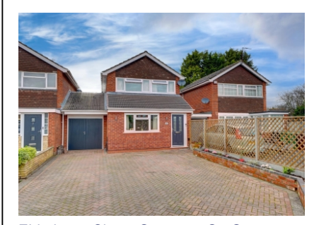
Elderberry Close, Stourport-On-Severn