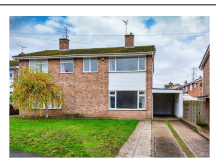
36 Wombourne Road, Swindon, Dudley