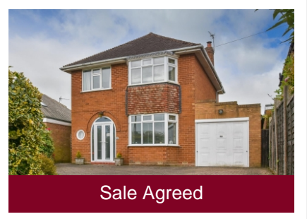
68 Clive Road, Pattingham, Wolverhampton