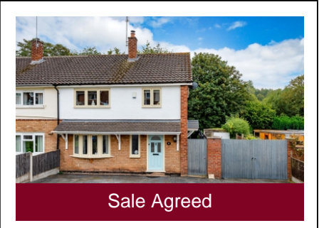
6 Moises Hall Road, Wombourne, Wolverhampton