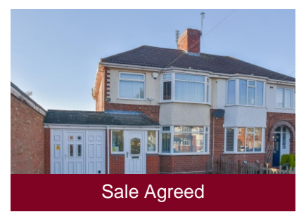
69 Fancourt Avenue, Wolverhampton