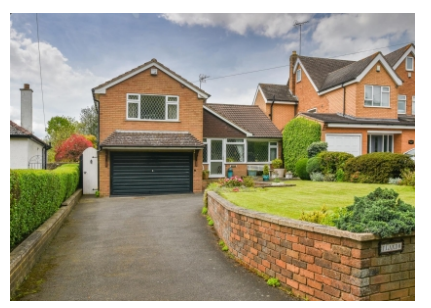
Stourbridge Road, Wombourne, Wolverhampton