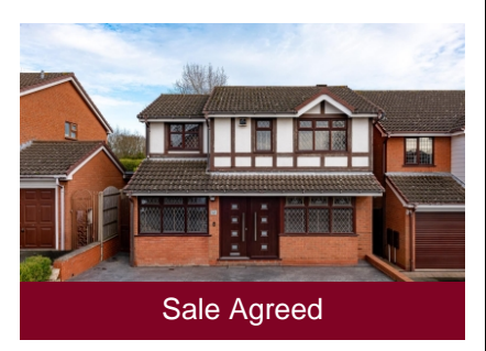
17 Fieldview Close, Coseley, Bilston