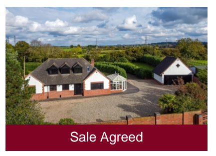
Rosebank, Ebstree Road, Seisdon, Nr Wolverhampton