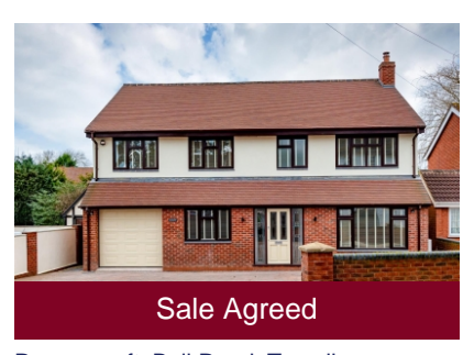
Ravenscroft, Bell Road, Trysull, Wolverhampton