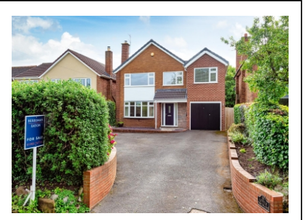
18 Rudge Road, Pattingham, Wolverhampton