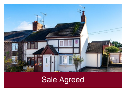
118 Common Road, Wombourne, Wolverhampton