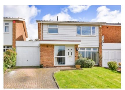
4 Forton Close, Compton, Wolverhampton