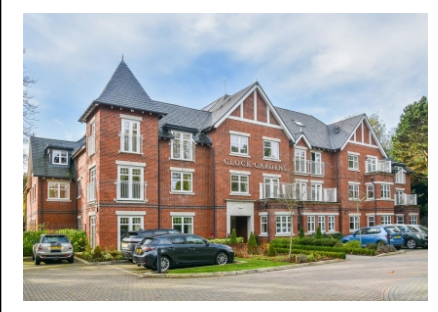
8 Clock Gardens, Stockwell Road, Wolverhampton