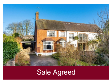
Newport House, 28 Newport Street, Brewood