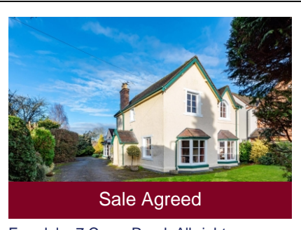
Ferndale, 7 Cross Road, Albrighton