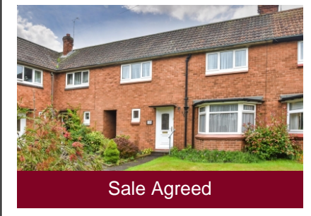
166 Cornwall Road, Tettenhall Wood, Wolverhampton

• 1 reception room Offers Around £199,950