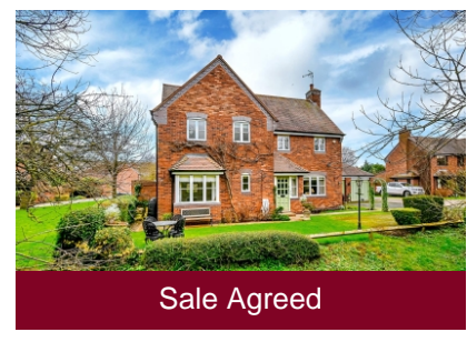
43 Pale Meadow Road, Bridgnorth