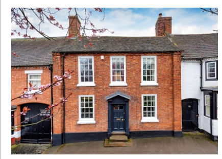
Saredon House, 28 Stafford Street, Brewood