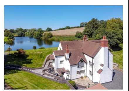
Hem Mill, The Hem, Shifnal