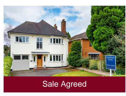
Randolph House, 55 Woodthorne Road, Wolverhampton