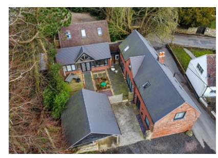
The Old Coach House, Little Wenlock, Telford