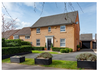
12 Larch Grove, Shifnal