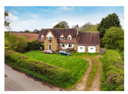
Mill Cottage, Lower Rudge, Pattingham, Wolverhampton