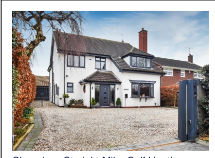
Clearview, Straight Mile, Calf Heath, Wolverhampton