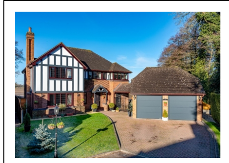
47 Fairfield Drive, Codsall, Wolverhampton