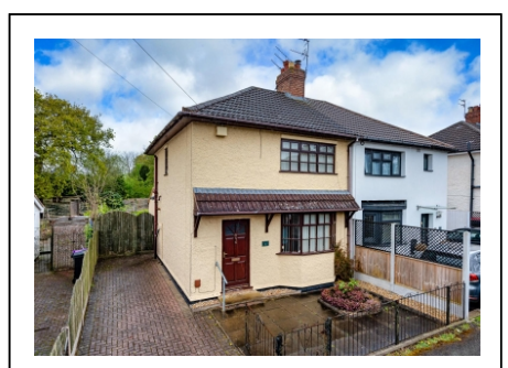
61 Woodland Avenue, Wolverhampton