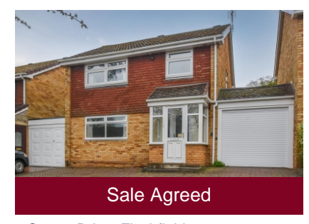
6 Surrey Drive, Finchfield