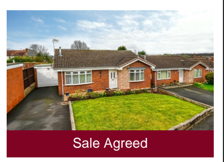
7 Claremont Drive, Bridgnorth