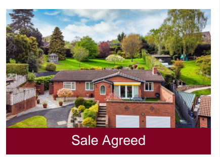
18 Bramble Ridge, Bridgnorth