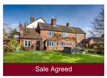
Vine Cottage, 36-38 Church Road, Codsall