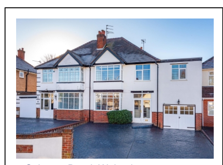
7 Osborne Road, Wolverhampton