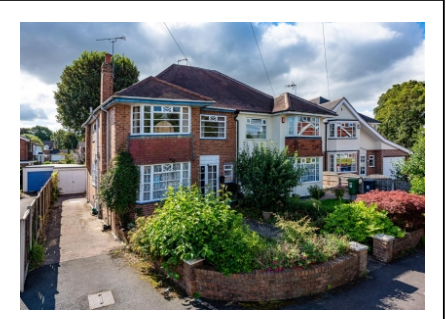
7 Newbridge Gardens, Newbridge, Wolverhampton