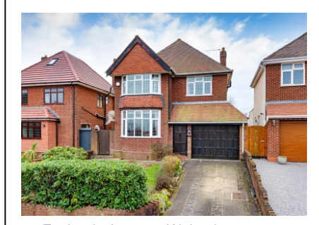
15 Foxlands Avenue, Wolverhampton