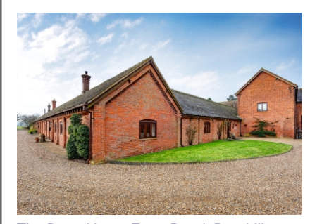
The Byre, Home Farm Road, Burnhill Green, Wolverhampton