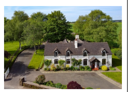
The Little Green, 2 Feiashill Road, Trysull, Wolverhampton