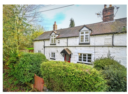
146 Broad Oak, Six Ashes