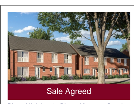
Plot 1 Nightingale Place, Vicarage Road, Wolverhampton