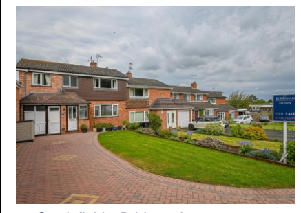
27 Castlefields, Bridgnorth