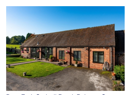
Barn End, Codsall Road, Palmers Cross, Wolverhampton