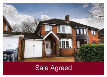
52 Wombourne Park, Wombourne, Wolverhampton