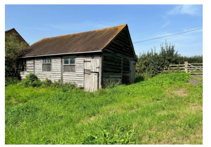
Spring Barn, Glazeley, Bridgnorth