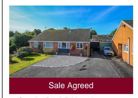
10 Captains Road, Bridgnorth