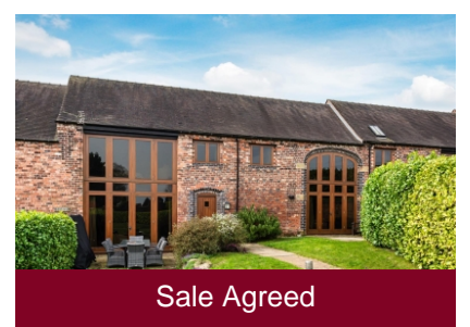
The Corn Barn, 3 East Trescott Barns Bridgnorth Road