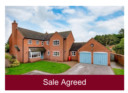
Rivendell, Park Lane, Lapley, Stafford