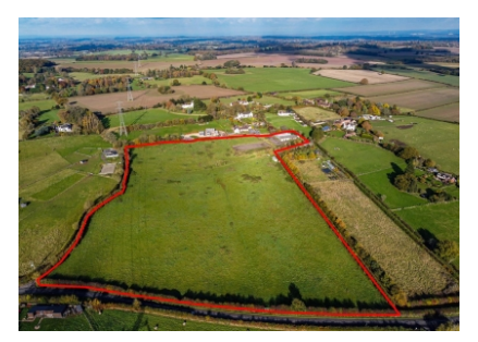
Plot of Land at Former Mill Riding Centre, Warstone Hill Road, Pattingham