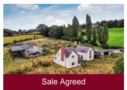
Robins Nest Farm, Dirty Foot Lane, Lower Penn, Wolverhampton