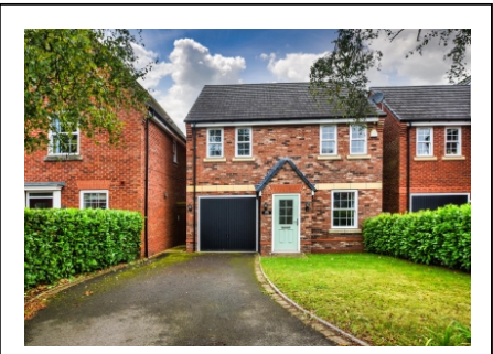
Eden House, Wombourne Road, Swindon, Dudley