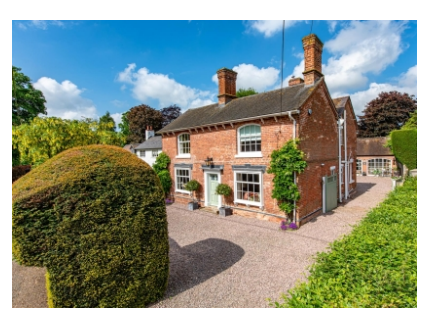
Beckbury House, Beckbury, Shifnal