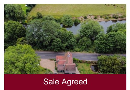
Holme Cottage, Knowle Sands, Bridgnorth