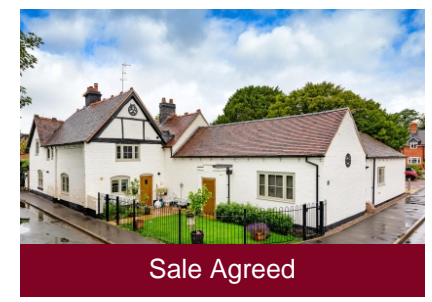
5 Plough Meadows, Trysull