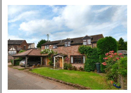
Finger Cottage, 123 Birds Green, Alveley, Bridgnorth