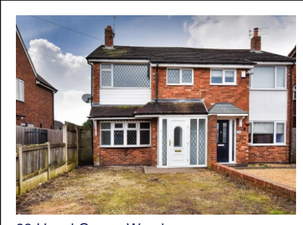
93 Hazel Grove, Wombourne, Wolverhampton