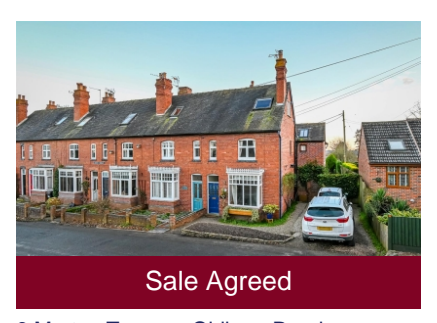
6 Merton Terrace, Oldbury Road, Bridgnorth