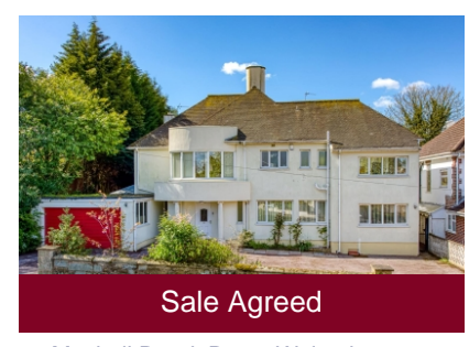
17 Muchall Road, Penn, Wolverhampton