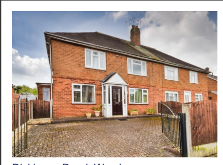
Dickinson Road, Wombourne, Wolverhampton