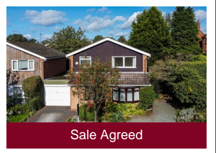
2 Beech Close, Pattingham, Wolverhampton