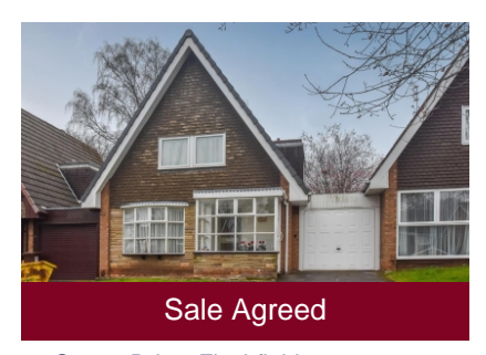
16 Surrey Drive, Finchfield, Wolverhampton