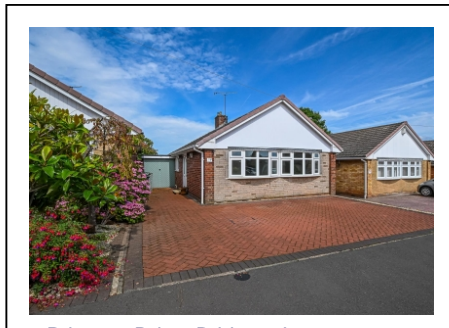
7 Princess Drive, Bridgnorth