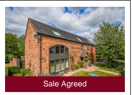
1 The Paddock, Claverley, Wolverhampton