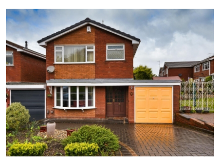
7 Marlborough Gardens, Newbridge, Wolverhampton