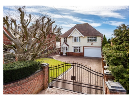
Catholic Lane, Sedgley, Dudley