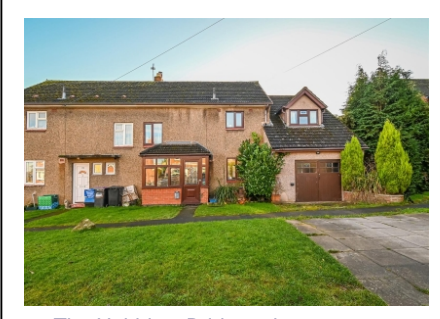
74 The Hobbins, Bridgnorth