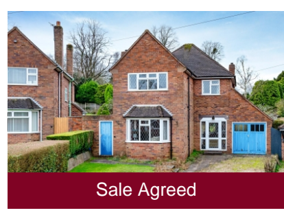
14 Peterdale Drive, Wolverhampton