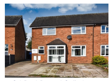
69 Oak Road, Brewood, Stafford