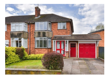
Wombourne Park, Wombourne