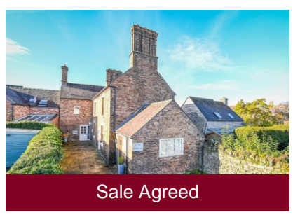
The Forge, 13 St. Marys Lane, Much Wenlock