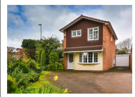
28 Quendale, Wombourne, Wolverhampton