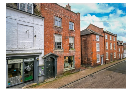
64 St. Marys Street, Bridgnorth