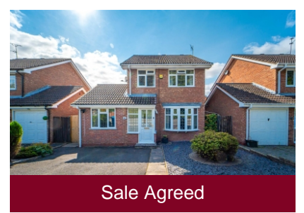
42 Gainsborough Drive, Perton, Wolverhampton