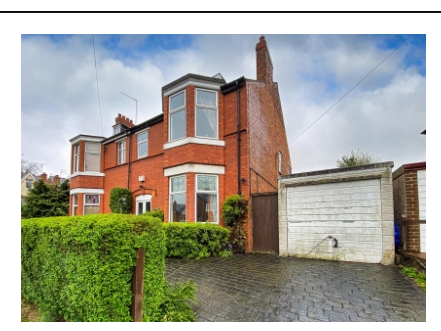
26 Marchant Road, Compton, WV3 9QG