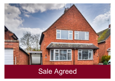
25 Bramber Drive, Wombourne, Wolverhampton