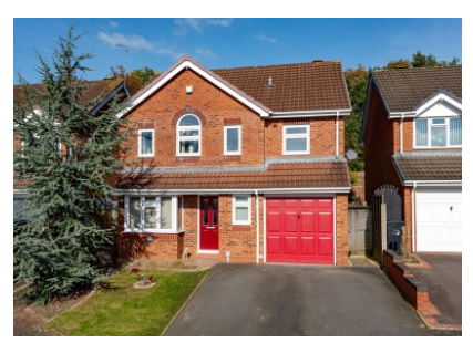
12 Dudmaston Way, Milking Bank, Dudley