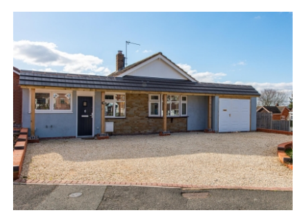
21 Uplands Drive, Wombourne, Wolverhampton