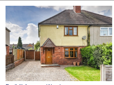
Redhill Avenue, Wombourne, Wolverhampton