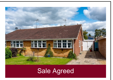
68 Clee View Road, Wombourne, Wolverhampton