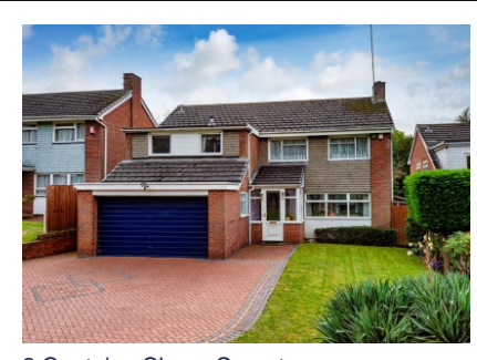
2 Captains Close, Compton, Wolverhampton