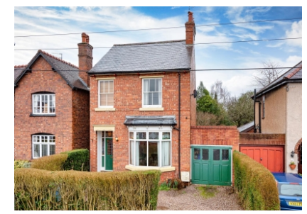
29 Walk Lane, Wombourne