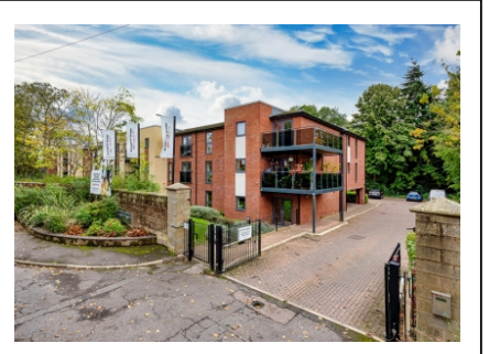
6 Thorneycroft, Wood Road, Tettenhall