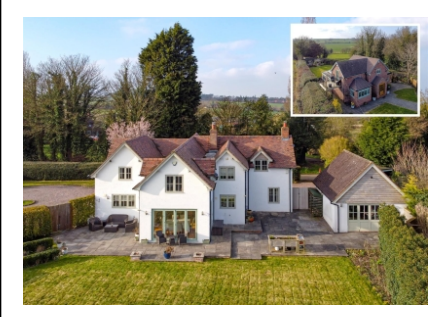
Oaklea and The Cottage, Damson Lane, Weston Heath, Shifnal