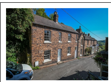
25 Church Hill, Ironbridge, Telford