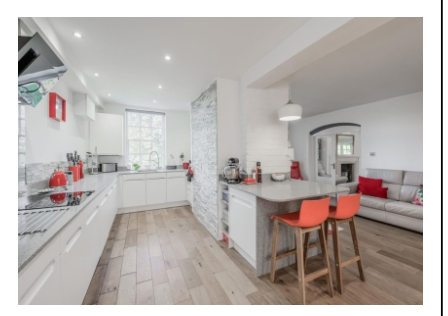
4 Stanmore Mews, Stourbridge Road, Stanmore, Bridgnorth