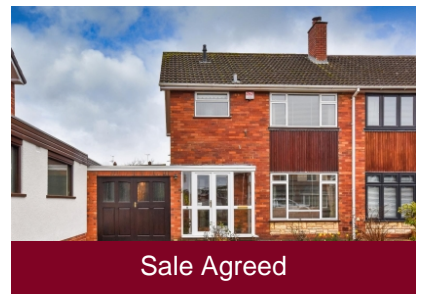
9 St. Benedicts Road, Wombourne, Wolverhampton