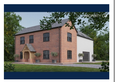
Plot 1, Bynd Lane, Billingsley, Bridgnorth