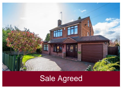
13 Springhill Lane, Wolverhampton