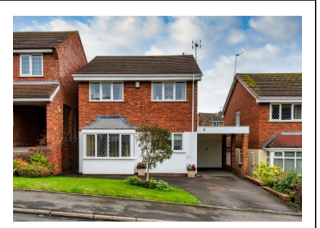
2 Woodthorne Close, Lower Gornal, Dudley