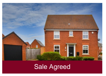
4 Lickey Close, Baggeridge Village, Dudley