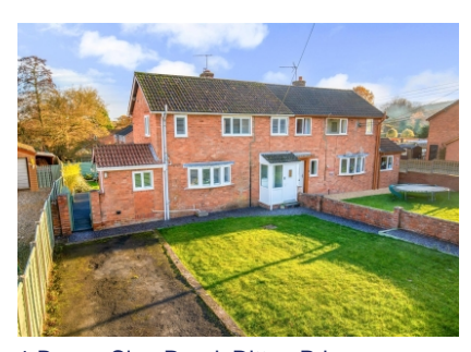
1 Brown Clee Road, Ditton Priors, Bridgnorth