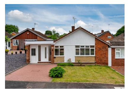
4 Mayfair Close, Albrighton, Wolverhampton