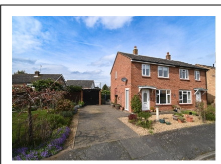
9 Wrekin Road, Bridgnorth