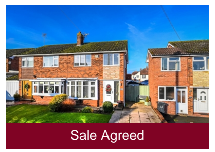
20 Orchard Drive, Bridgnorth