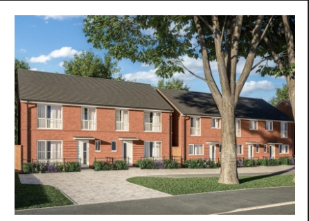
Plot 4 Nightingale Place, Vicarage Road, Wolverhampton