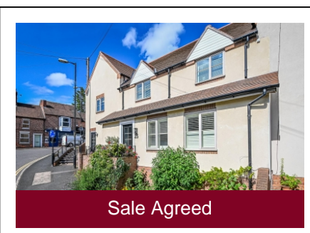
23 Pound Street, Bridgnorth