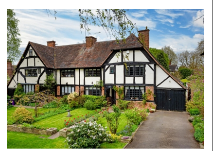
11 Castlecroft Gardens, Wolverhampton