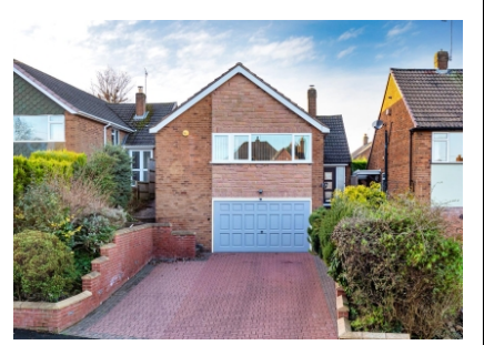
52 Church Hill, Penn, Wolverhampton