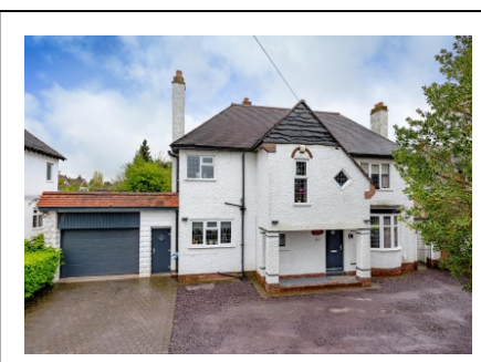
61 Codsall Road, Tettenhall, WV6 9QG