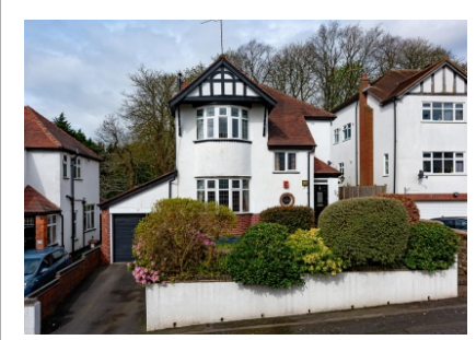
Tudor Crescent, Wolverhampton