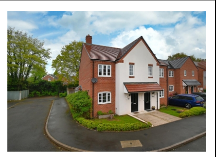
19 Staley Grove, Highley, Bridgnorth