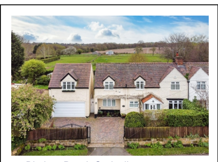
15 Birches Road, Codsall, Wolverhampton