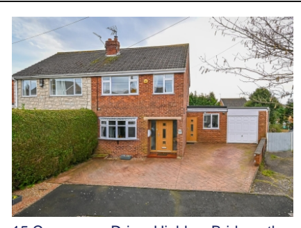
15 Crannmore Drive, Highley, Bridgnorth