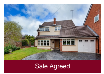
7 The Beeches, Seisdon, Wolverhampton