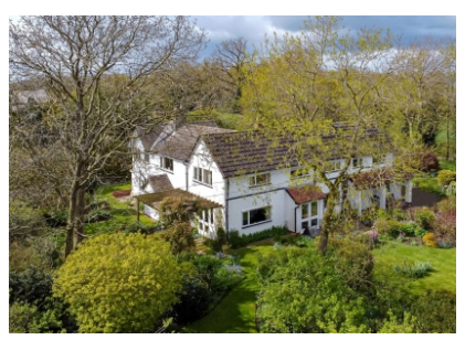
Leafields Farm, Shutt Green, Brewood, ST19 9LX