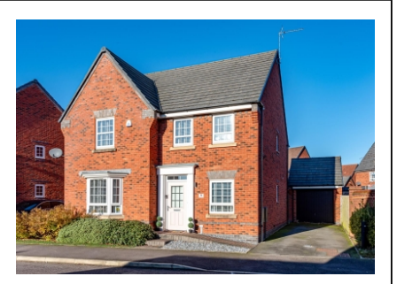
8 Brick Kiln Way, Baggeridge Village