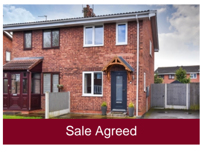
6 Troon Court, Perton, Wolverhampton