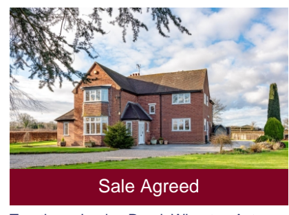
Trentham, Lapley Road, Wheaton Aston