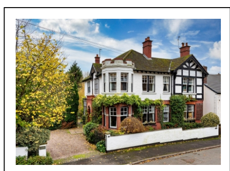
Battlefield House, 14 Battlefield Hill, Wombourne, Wolverhampton