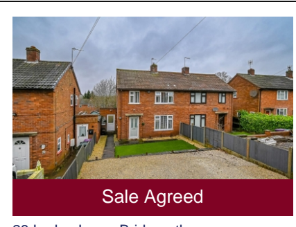
28 Lodge Lane, Bridgnorth