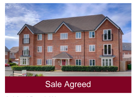
Ashford Road, Worcester