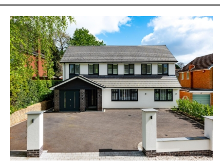
1 Chestnut Close, Codsall, WV8 2EZ