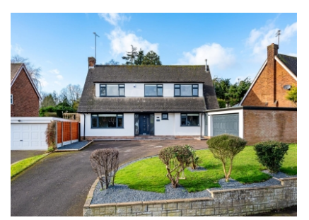
25 Perton Brook Vale, Wightwick