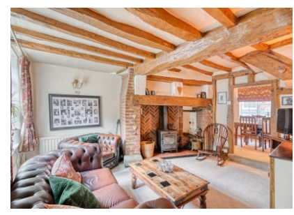
Bridgend Cottage, 43 Cartway, Bridgnorth