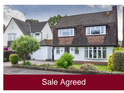
57 Oaken Park, Codsall, Wolverhampton