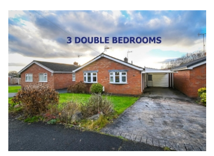
12 Redstone Drive, Highley, Bridgnorth