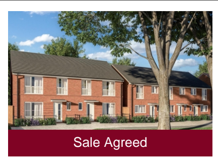
Plot 3 Nightingale Place, Vicarage Road, Wolverhampton