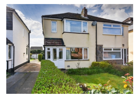
36 Hall End Lane, Pattingham, Wolverhampton