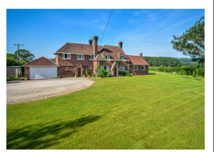
Footbridge House, Tasley, Bridgnorth