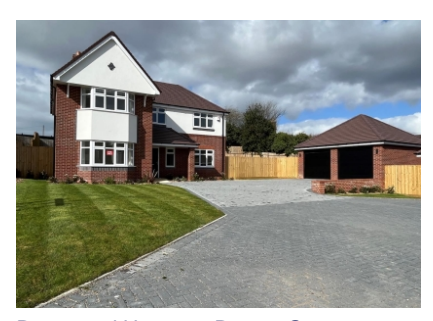
Rosewood House, 6 Rowan Grange, Broseley