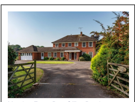
Meadow Farm, Post Office Road, Seisdon, Wolverhampton