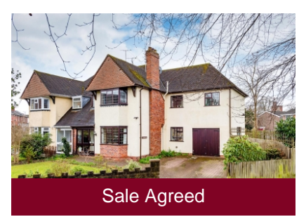
The Homestead, Westland Avenue, Compton