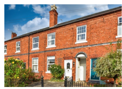
3 Shaw Lane, Albrighton, Wolverhampton