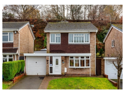
23 Redcliffe Drive, Wombourne, South Stafforshire