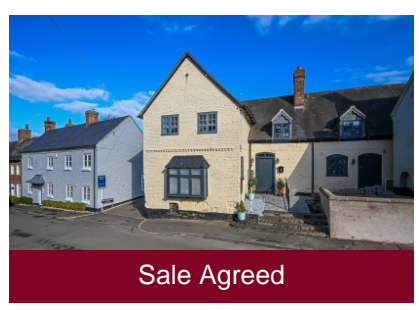
7 Bull Ring, Claverley, Wolverhampton