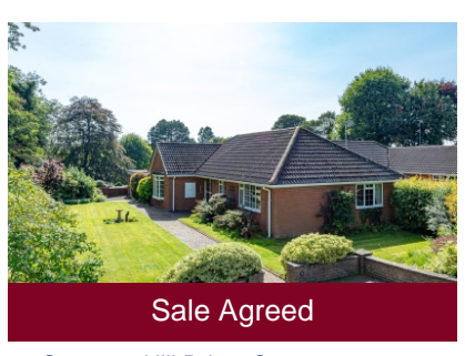
11 Compton Hill Drive, Compton, Wolverhampton