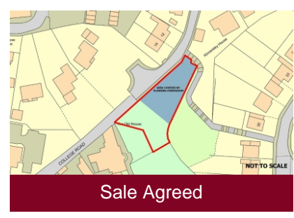
College Road, Tettenhall, Wolverhampton