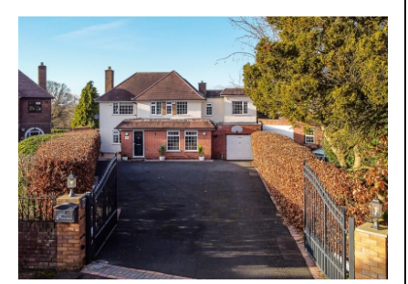
Fern House, Links Avenue, Tettenhall