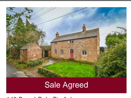
148 Broad Oak, Six Ashes