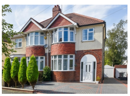
28 Links Road, Penn, Wolverhampton