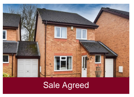
14 Alpine Way, Compton, Wolverhampton