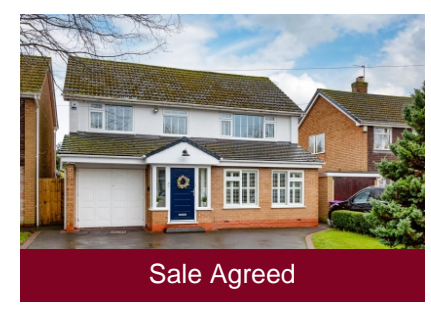
89 Redhouse Road, Tettenhall, Wolverhampton