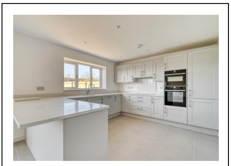
Green Acres, 3 Rowan Grange, Broseley