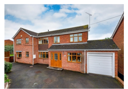
15 Ounsdale Crescent, Wombourne, Wolverhampton