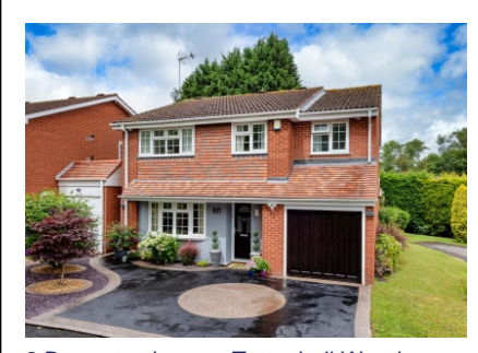
2 Brompton Lawns, Tettenhall Wood, Wolverhampton