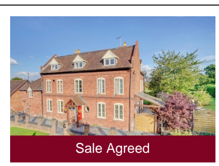
Austcliffe Road, Cookley, Kidderminster