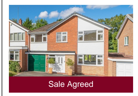
2 Whiteladies Court, Albrighton, Wolverhampton