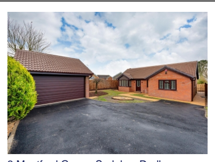
3 Montford Grove, Sedgley, Dudley