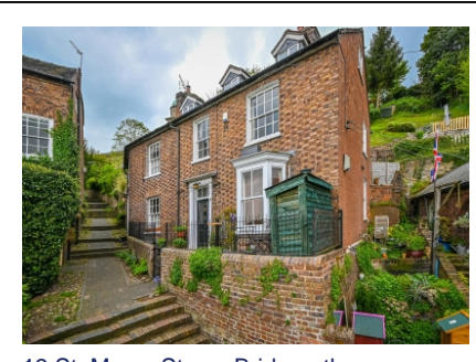
19 St. Marys Steps, Bridgnorth