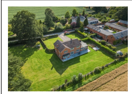
Oaklands Farm, Lower Rudge, Pattingham, Wolverhampton