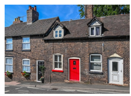
4 Pound Street, Bridgnorth