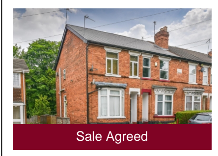
299 & 299a Hordern Road, Whitmore Reans