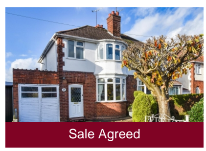
17 Fairview Road, Penn, Wolverhampton