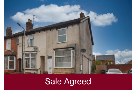
62 Merridale Street West, Wolverhampton