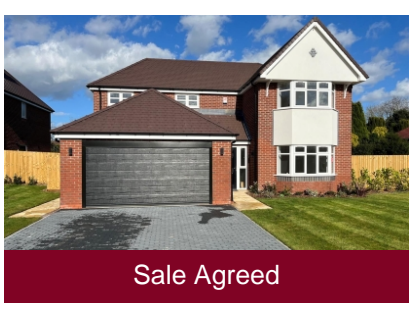
Holly House, 8 Rowan Grange, Broseley