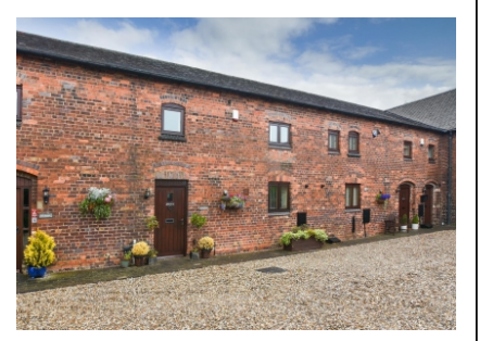
3 Manor Farm Barns, Bognop Road, Essington