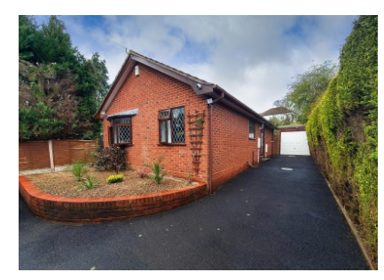
10 Planks Lane, Wombourne, Wolverhampton