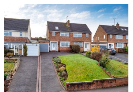
44 Common Road, Wombourne, Wolverhampton