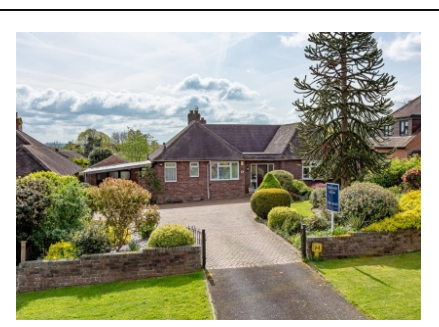
53 Conduit Lane, Bridgnorth