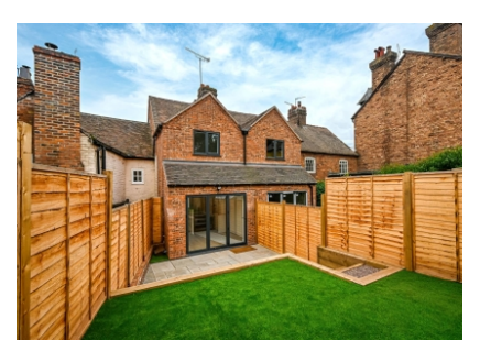
6 Salop Street, Bridgnorth