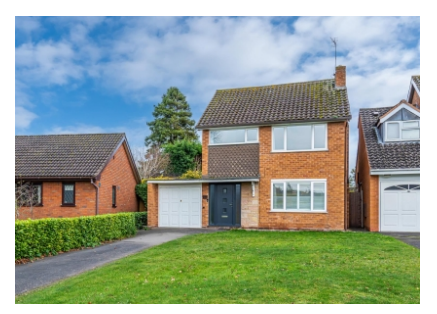
1 Redford Drive, Albrighton