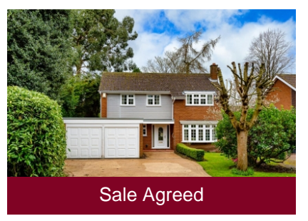
1 Mountwood Covert, Tettenhall Wood, Wolverhampton