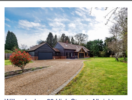
Willow Lodge, 23 High Street, Albrighton