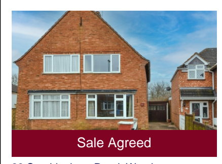
30 Sandringham Road, Wombourne, Wolverhampton