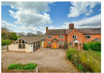
3 Tedstill Cottages, Middleton Scriven, Bridgnorth