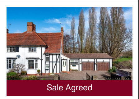
9 Myrtle Grove, Bradmore, Wolverhampton