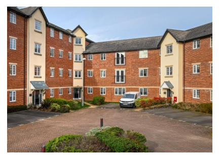
23 Greyfriars House, Kings Court, Stourbridge Road, Bridgnorth