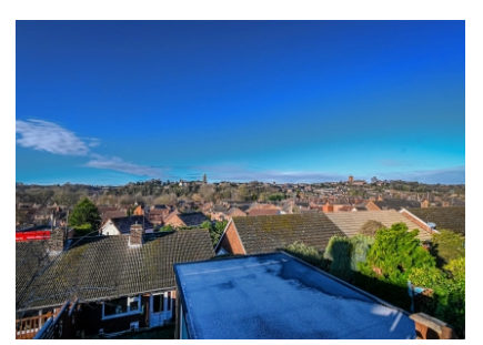
5 River View, Bridgnorth