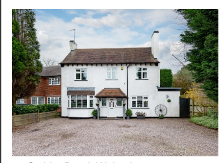
17 Stubbs Road, Wolverhampton