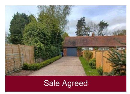
The Bungalow, Popes Lane, Wergs , Tettenhall