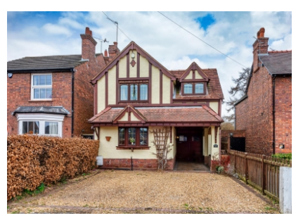
25 Walk Lane, Wombourne, Wolverhampton