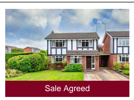
16 Meadow Vale, Codsall, Wolverhampton