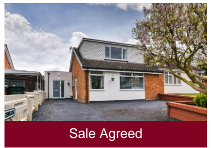
3 Greenfields Road, Wombourne, Wolverhampton