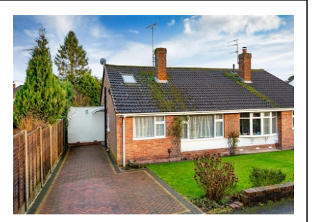
1 Norton Close, Penn, Wolverhampton