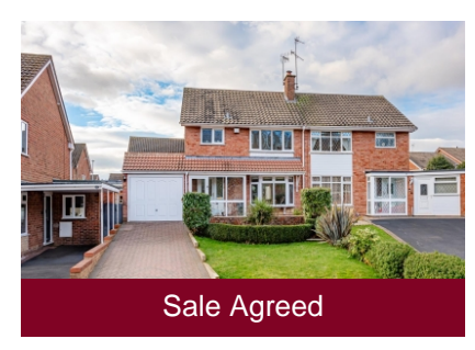
14 Chequers Avenue, Wombourne, Wolverhampton