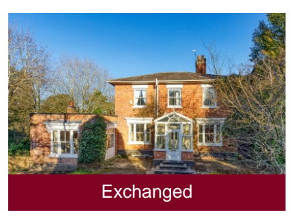
Ferndale, 33 Oaken Lanes, Codsall, Wolverhampton