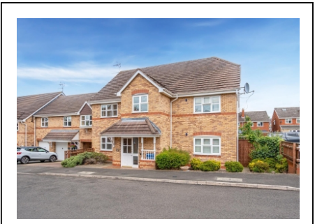
10 Cygnet Court, Wombourne, Wolverhampton