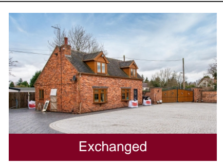
Granary Cottage, Dark Lane, Cross Green, Wolverhampton