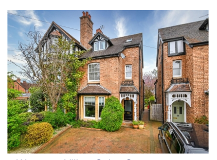
7 Westgate Villas, Salop Street, Bridgnorth