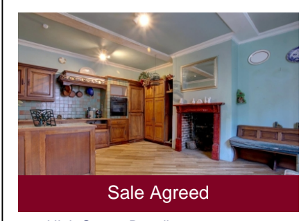
25a High Street, Bewdley