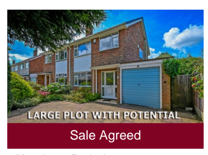
6 Moor Lane, Pattingham, Wolverhampton