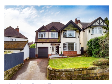
3 Lothians Road, Tettenhall, Wolverhampton