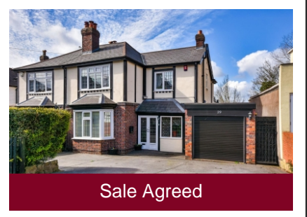
29 Goldthorn Avenue, Penn, Wolverhampton