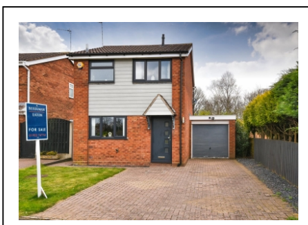
71 Mercia Drive, Perton, Wolverhampton