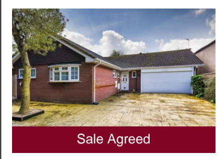
28a Mount Road, Mount Road, Tettenhall Wood