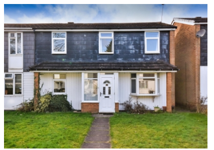
11 Woodside, Ashmore Park, Wolverhampton