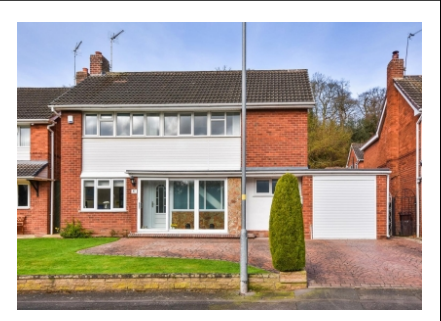
97 Henwood Road, Compton, Wolverhampton