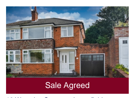
10 Waverley Crescent, Lanesfield, Wolverhampton