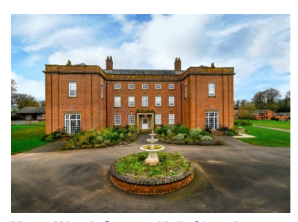
Home Wood, Gatacre Hall, Claverley, Wolverhampton