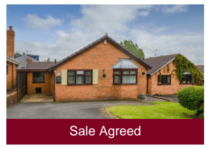
56 Coton Road, Wolverhampton