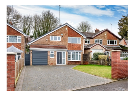
3 St. Marys Close, Dudley