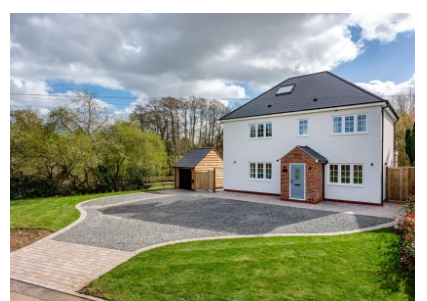
Holly Cottage, Wolverhampton Road, Pattingham