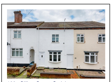
126a Clifton Street, Sedgley