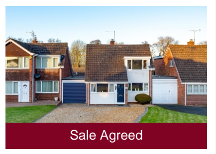
1 Bredon Close, Albrighton, Wolverhampton