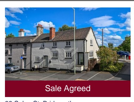
33 Salop St, Bridgnorth