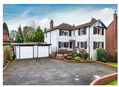
Quarry House, 30 Lansdowne Avenue, Codsall