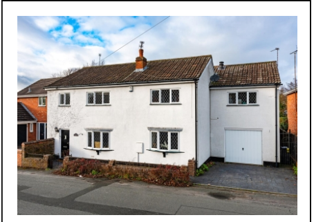
109 Rookery Road, Wombourne, Wolverhampton