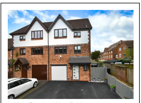
2 King Charles Way, Bridgnorth