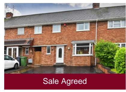
63 Pool Hall Road, Castlecroft, Wolverhampton