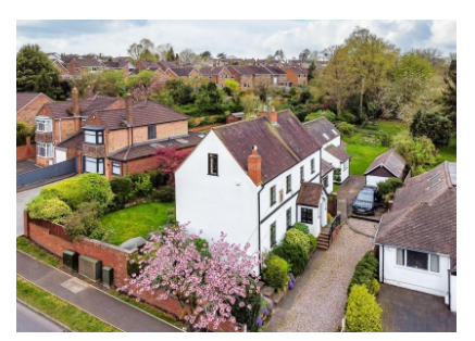
The Crofts and The Cottage, 32 Church Hill, Penn