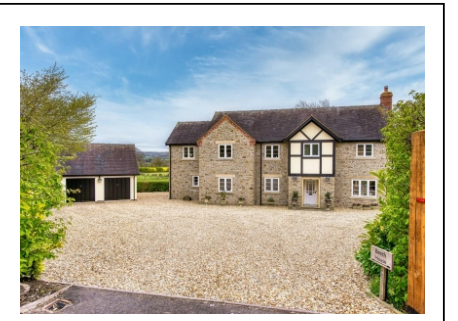
Beech House, Munslow, Shropshire