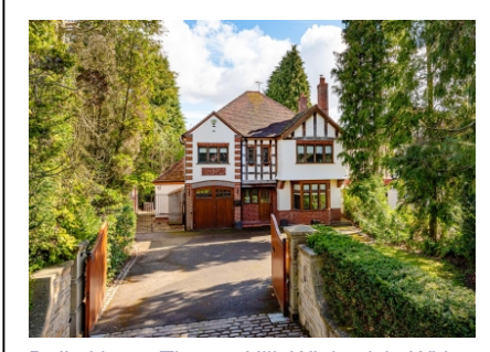
Dalkeith, 25 Tinacre Hill, Wightwick, WV6 8DB