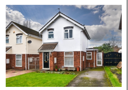
8 Laburnum Street, Wolverhampton