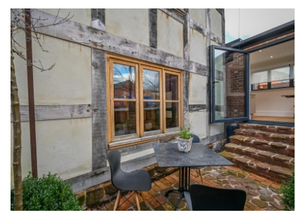
Park Cottage, Abbey Foregate, Shrewsbury