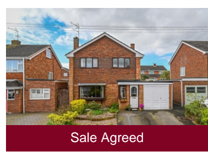
4 Whitmore Close, Bridgnorth