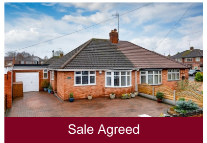
13 Kirkstone Crescent, Wombourne, Wolverhampton