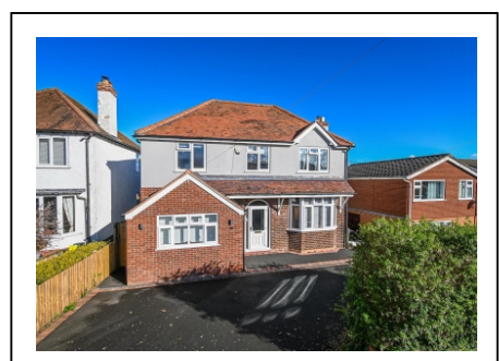
109 Victoria Road, Bridgnorth