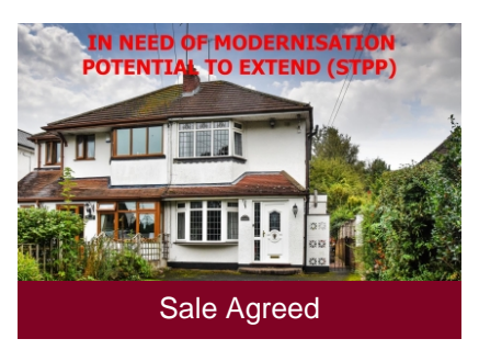
Hillcroft, Penstone Lane, Lower Penn