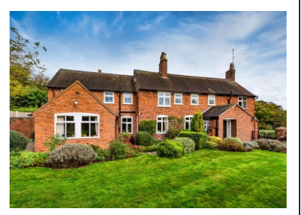
Pound Cottage, 8 School Road, Himley, Dudley