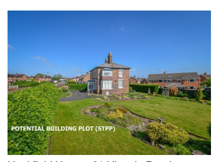
Hookfield House, 81 Victoria Road, Bridgnorth