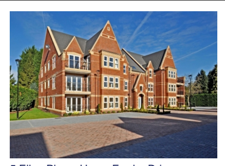
5 Ellen Place, Henry Fowler Drive, Tettenhall