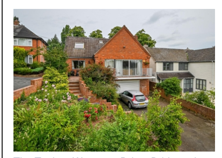
The Tyning, Westgate Drive, Bridgnorth