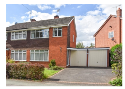
34 Castlecroft Road, Finchfield, Wolverhampton