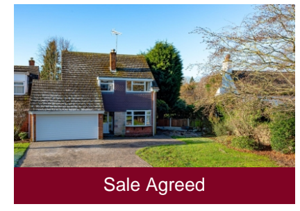
5 Post Office Road, Seisdon, Wolverhampton