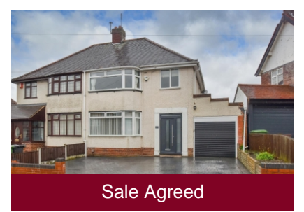
19 Sandringham Road, Penn, Wolverhampton