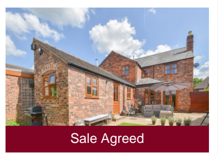
The Cottage, 18 Shop Lane, Oaken