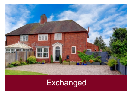
Bromyard road, Worcester