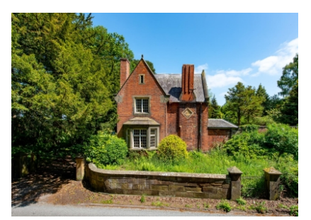
Wergs Hall Gardens, Wergs Hall Road, Tettenhall