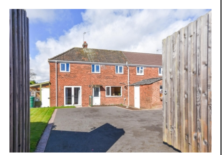
146 Cornwall Road, Tettenhall, WV6 8UZ