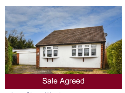
7 Apse Close, Wombourne, Wolverhampton