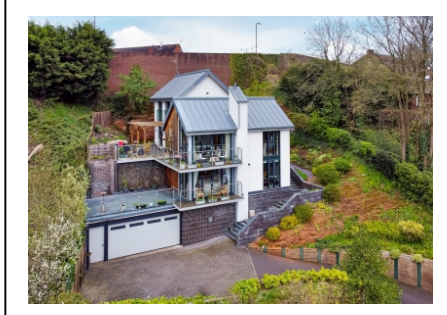
Hawthorn View, Hollybush Road, Bridgnorth