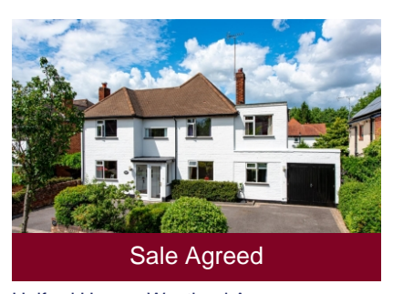
Helford House, Westland Avenue, Compton