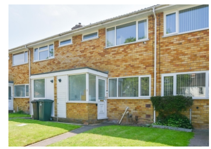
3 Ashfields, High Street, Albrighton