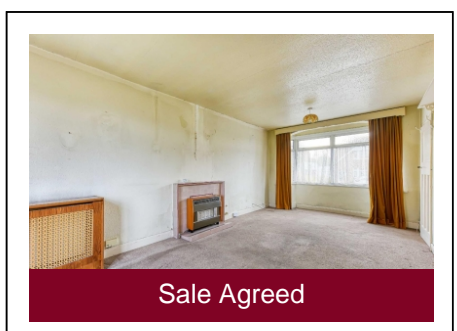
26 The Avenue, Castlecroft, Wolverhampton