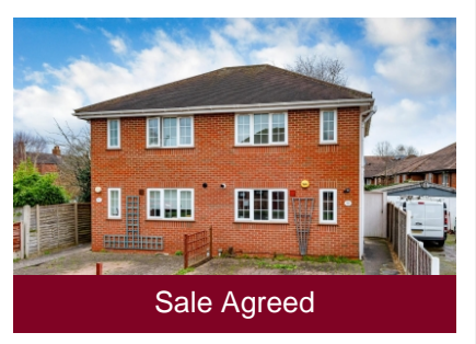
48 Abney Avenue, Albrighton