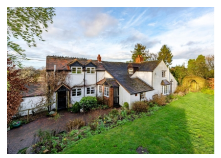
Greystoke Cottage, Kiddemore Green, Brewood