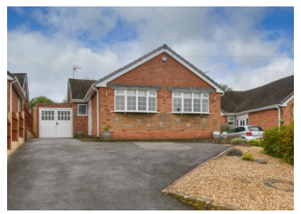
9 Brick Kiln Lane, Dudley