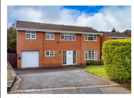
11 Swallowdale, Wightwick, Wolverhampton