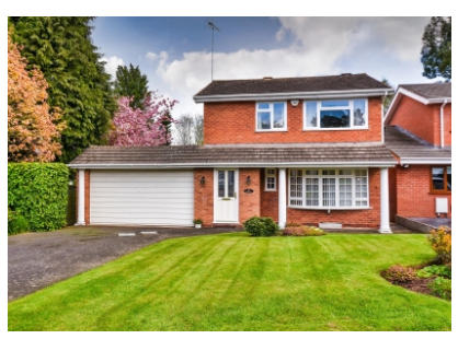
18 Fair Oak Drive, Wolverhampton