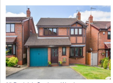
35 Penleigh Gardens, Wombourne, Wolverhampton