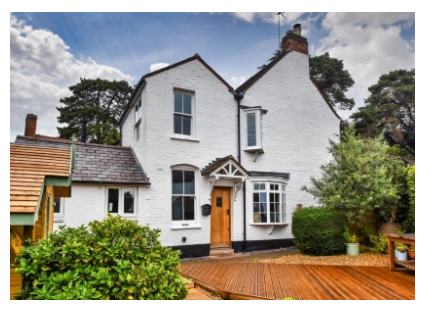
Beech Cottage, 8 The Holloway, Compton