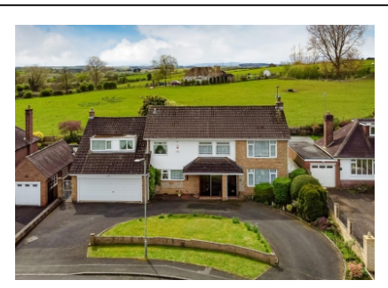
7 Wightwick Hall Road, Wightwick, WV6