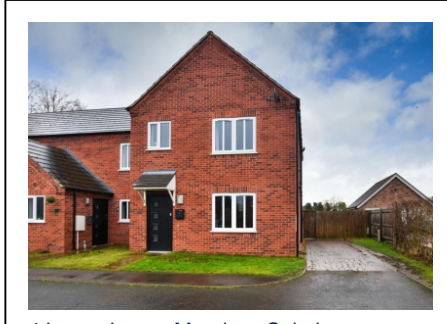
4 Lower Lanes Meadow, Seisdon, Wolverhampton