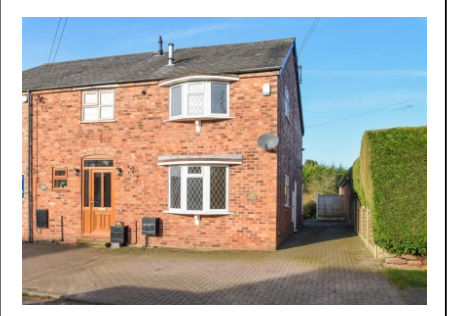
The Rambles, 16 Shop Lane, Oaken