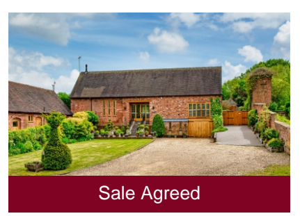
The Tythe Barn, Hyde Mill Lane, Brewood