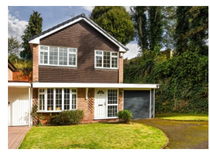
39 Alpine Way, Compton, Wolverhampton