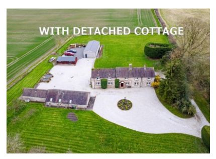
Lower Westwood Farm, Stretton Westwood, Much Wenlock