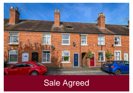
29 Severn Street, Bridgnorth