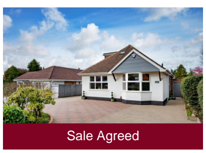
28a Wood Road, Tettenhall Wood