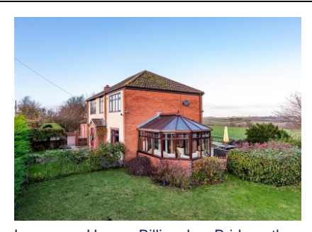
Longmoor House, Billingsley, Bridgnorth