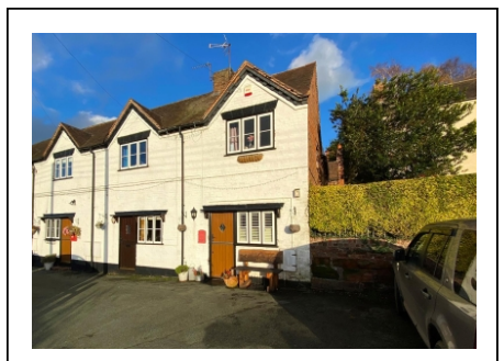
26c Bernards Hill, Bridgnorth