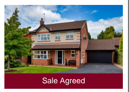
22 Bridgewater Drive, Wombourne, Wolverhampton