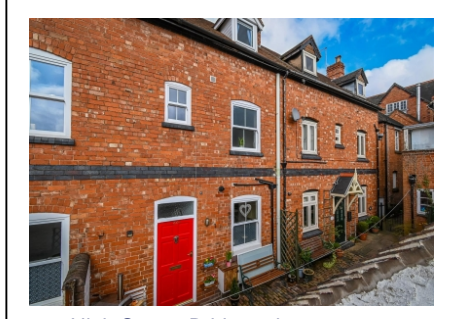
22a High Street, Bridgnorth