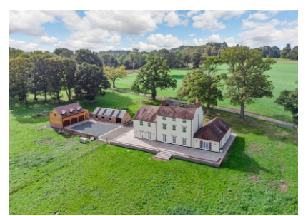
Home Farm, Gatacre, Claverley, Wolverhampton