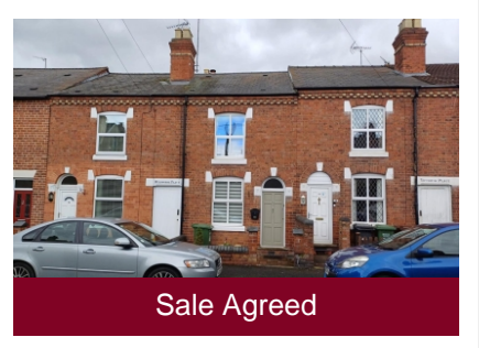
Summerfield Road, Stourport-On-Severn