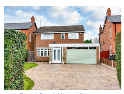
230a Trysull Road, Merry Hill, Wolverhampton