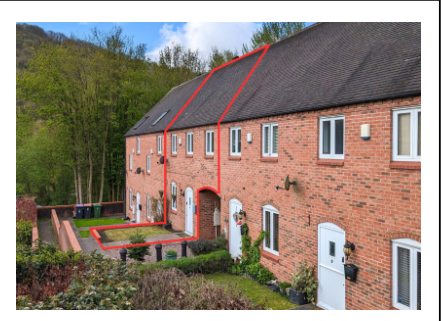
6 The Courtyard, Ironbridge, Telford