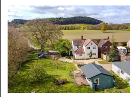
6 The Row, Easthope, Much Wenlock