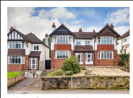
83 Lower Street, Wolverhampton