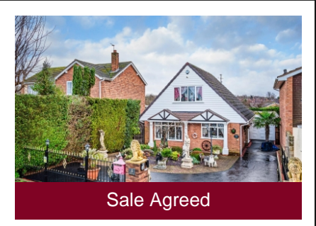
5 Bratch Common Road, Wombourne, Wolverhampton