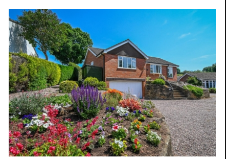
Three Ridges, Hilton, Bridgnorth