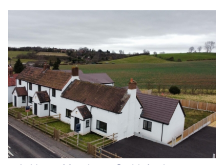
3 Ackleton Meadows, Stableford, Bridgnorth