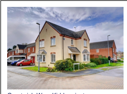
Greatwich Way, Kidderminster