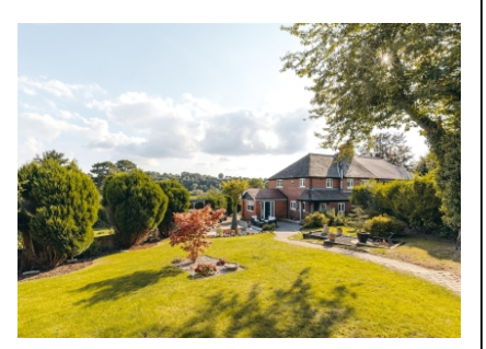
Sunnybank, 11b, Danesford, Bridgnorth