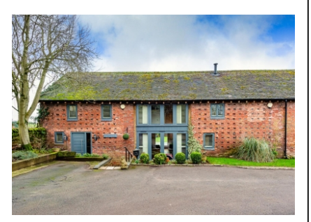
Clee View Barn, Westbeech Road, Pattingham, Wolverhampton