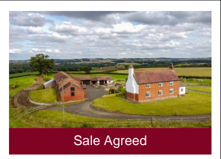
Lower Sutton Farm, Sutton, Chelmarsh, Bridgnorth