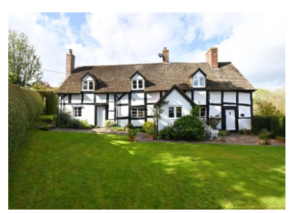
Clovers, Stableford, Bridgnorth