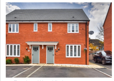
35 Foxglove Way, Himley