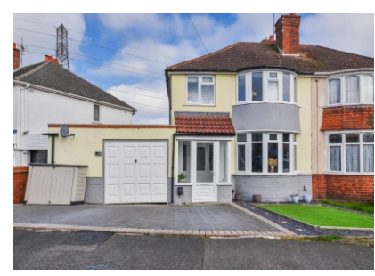
56 Hilston Avenue, Penn, Wolverhampton