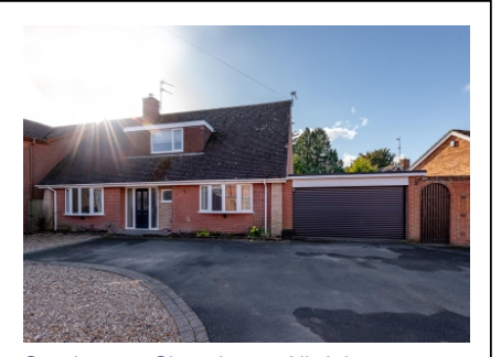
Strathmore, Shaw Lane, Albrighton