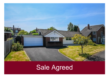
50 The Wold, Claverley, Shropshire