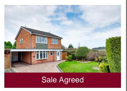
29 Windsor Road, Pattingham, Wolverhampton