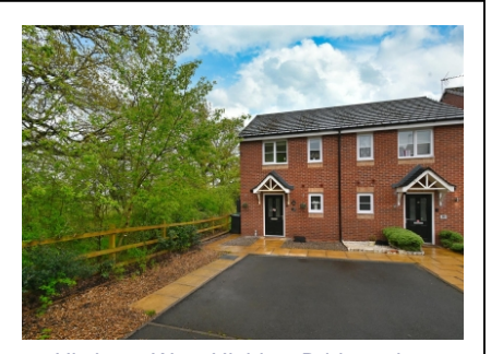
29 Hitchens Way, Highley, Bridgnorth