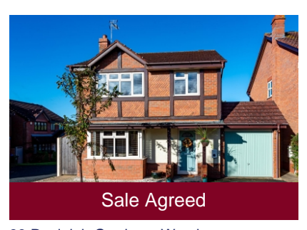
39 Penleigh Gardens, Wombourne, Wolverhampton