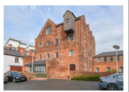
11 The Mill, Albion Street, Wolverhampton