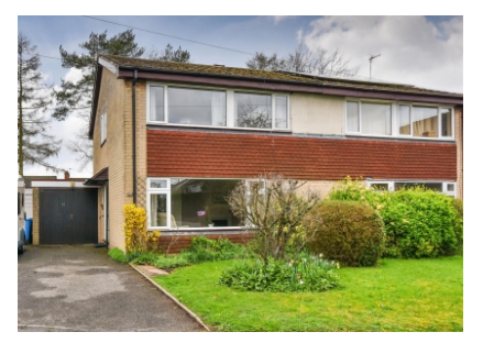
32 The Greenway, Pattingham, Wolverhampton