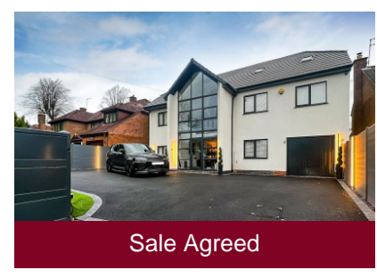
14 Lothians Road, Stockwell End