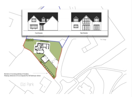
Land on the South of 2 Old Coppice Grange, Old Park, Telford