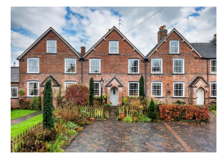
2 Labernum Cottages, Vicarage Road, Penn, Wolverhampton