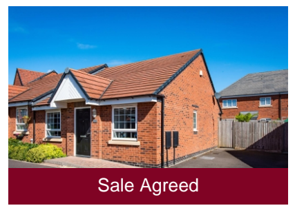
25 Brick Kiln Way, Baggeridge Village