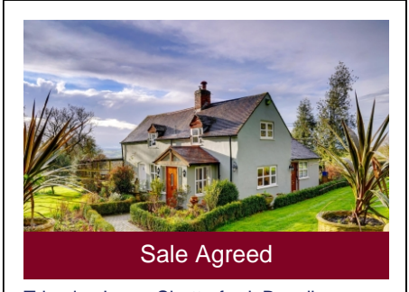
Trimpley Lane, Shatterford, Bewdley