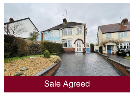
31 Sedgley Road, Penn Common, Penn