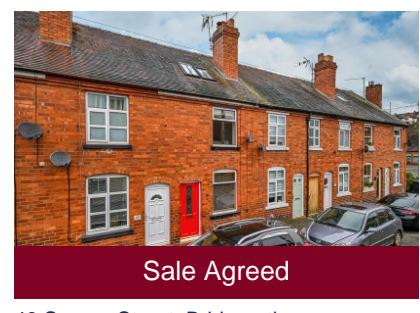
46 Severn Street, Bridgnorth