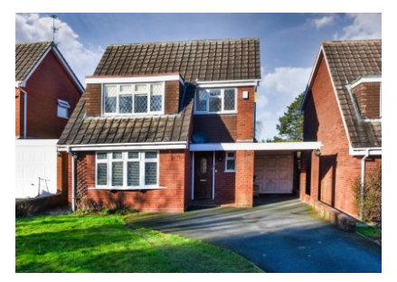
15 Histons Drive, Codsall, Wolverhampton