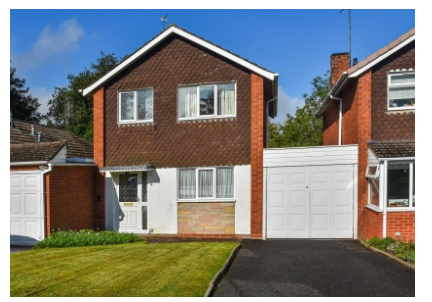
9 Westhill, Wolverhampton