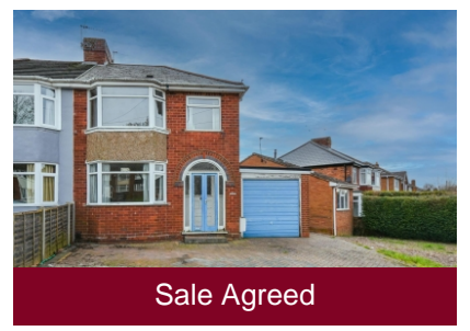
1 Rutland Avenue, Wolverhampton