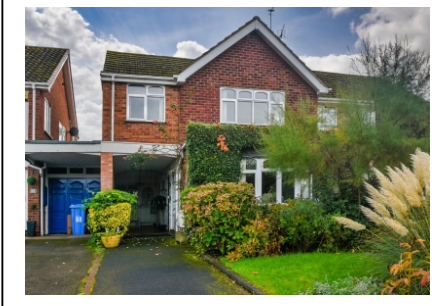
86 Van Diemans Road, Wombourne, Wolverhampton