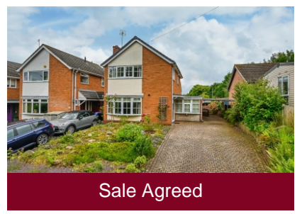
49 Oldbury Wells, Bridgnorth