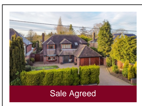
Broad Elms, Great Moor Road, Pattingham