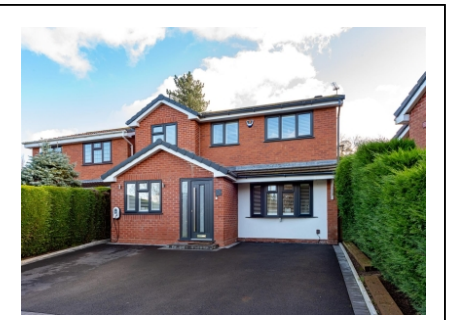
41 Ascot Drive, Dudley