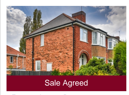
2 Fancourt Avenue, Penn, Wolverhampton