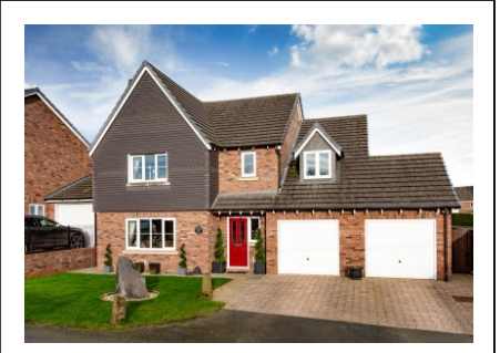
41 Kings Road, Calf Heath, Wolverhampton