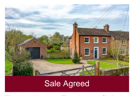
The Little House, 7 Tong Norton, Shifnal