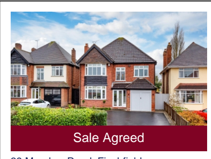
39 Meadow Road, Finchfield