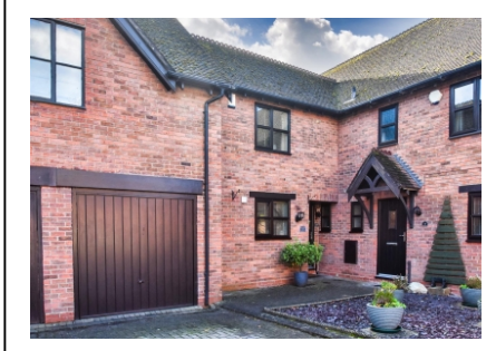
17 Bridgeman Court, Weston-Under-Lizard, Shifnal