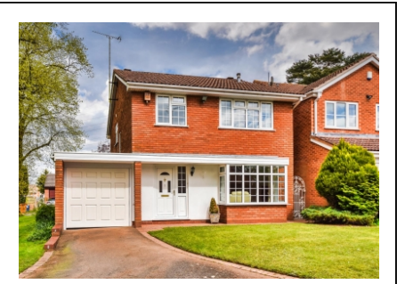
1 Foxlands Drive, Wolverhampton