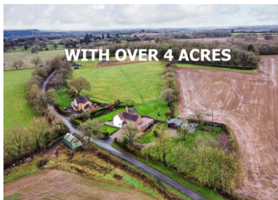
Keepers Cottage, Colemore Green, Bridgnorth