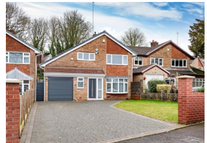
3 St. Marys Close, Dudley