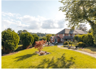
Sunnybank, 11b, Danesford, Bridgnorth