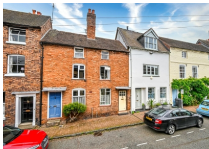
24 St. Marys Street, Bridgnorth