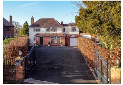
Fern House, Links Avenue, Tettenhall