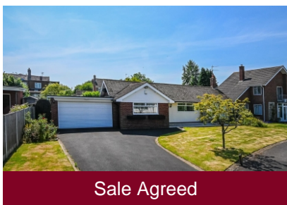
50 The Wold, Claverley, Shropshire