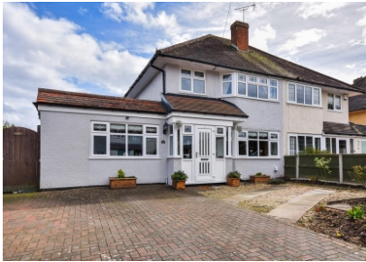
34 Delaware Avenue, Albrighton