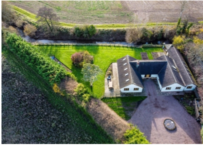
Riverside Bungalow, Muckley Cross, Acton Round, Bridgnorth