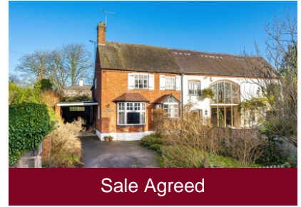
Newport House, 28 Newport Street, Brewood