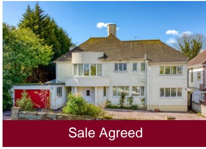
17 Muchall Road, Penn, Wolverhampton