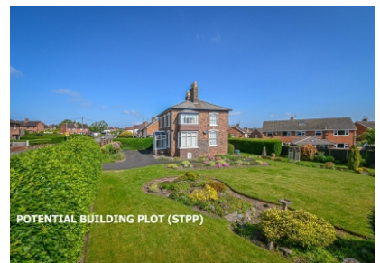
Hookfield House, 81 Victoria Road, Bridgnorth