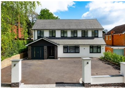
1 Chestnut Close, Codsall, WV8 2EZ