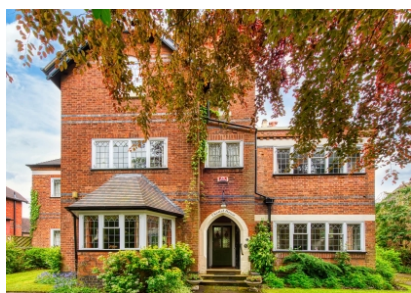
Cheviot House, 20 Stockwell Road, Tettenhall