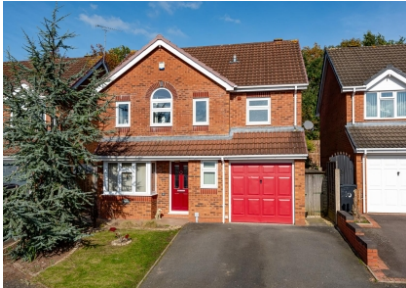
12 Dudmaston Way, Milking Bank, Dudley