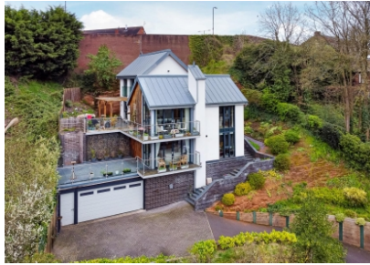
Hawthorn View, Hollybush Road, Bridgnorth