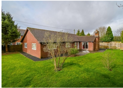
The Old Kiln, Church Lane, Bridgnorth