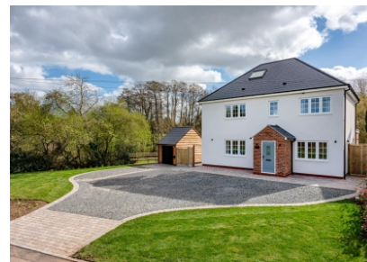
Holly Cottage, Wolverhampton Road, Pittingham