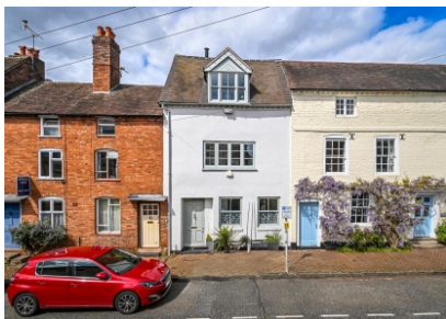
23 St Marys Street, Bridgnorth