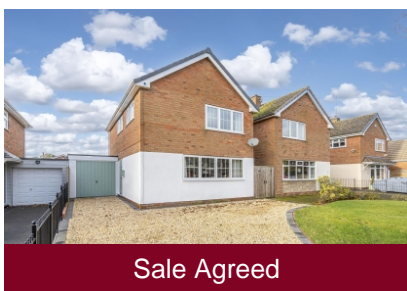
48 Clive Road, Pattingham, Wolverhampton