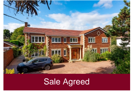
Elan Ridge, Pool House Road, Wombourne, Wolverhampton