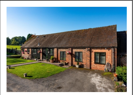
Barn End, Codsall Road, Palmers Cross, Wolverhampton