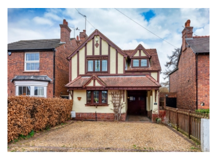
25 Walk Lane, Wombourne, Wolverhampton