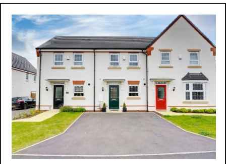
9 Narburgh Place, Alveley, Bridgnorth