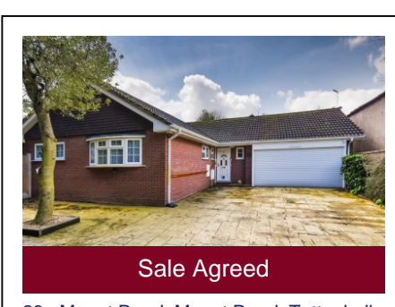
28a Mount Road, Mount Road, Tettenhall Wood