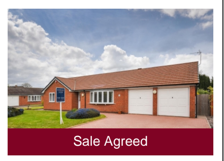
1 The Courts, Albrighton, Wolverhampton