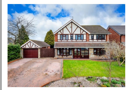
11 Waverley Gardens, Wombourne, Wolverhampton