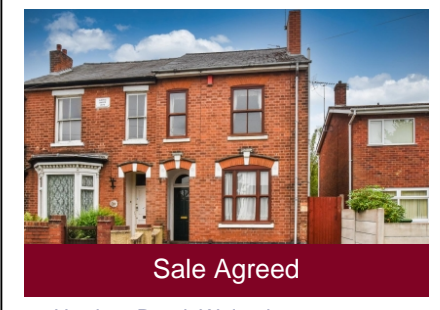
41 Hordern Road, Wolverhampton