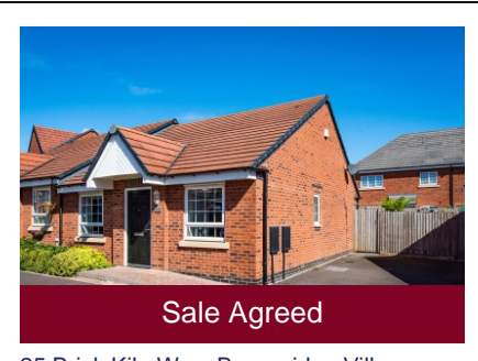
25 Brick Kiln Way, Baggeridge Village