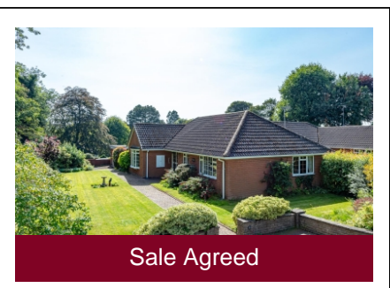
11 Compton Hill Drive, Compton, Wolverhampton