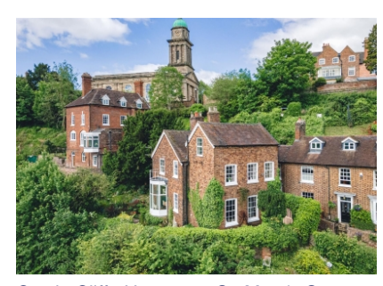
Castle Cliffe House, 24 St. Mary's Steps, Bridgnorth