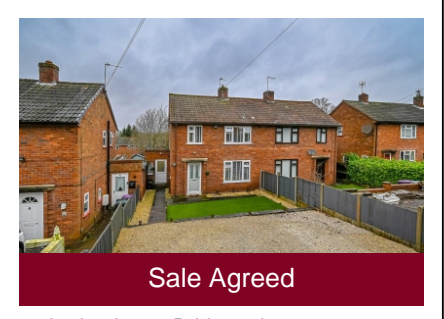
28 Lodge Lane, Bridgnorth