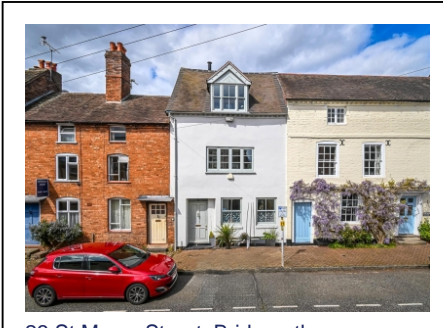
23 St Marys Street, Bridgnorth