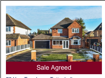
75 Yew Tree Lane, Tettenhall