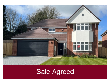
Valley View, 5 Rowan Grange, Broseley