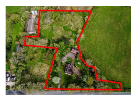
Dodds Green Cottage, 79 Dodds Green, Alveley, Bridgnorth