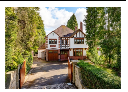
Dalkeith, 25 Tinacre Hill, Wightwick, WV6 8DB