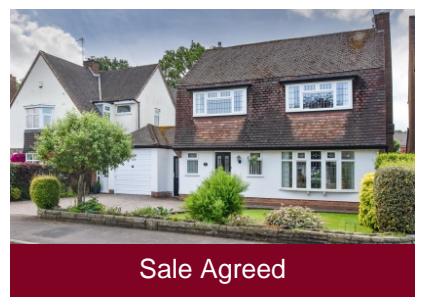
57 Oaken Park, Codsall, Wolverhampton