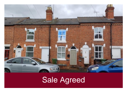
Summerfield Road, Stourport-On-Severn