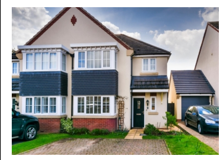
4 The Limes, Codsall Wood, Wolverhampton