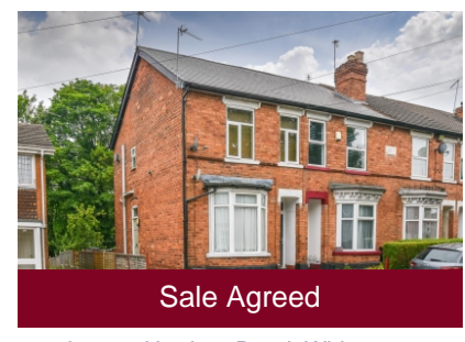
299 & 299a Hordern Road, Whitmore Reans