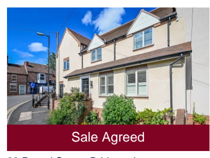
23 Pound Street, Bridgnorth