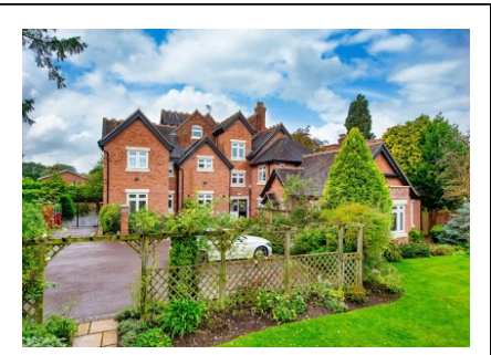
18f Southgate, Stockwell Road, Tettenhall, Wolverhampton