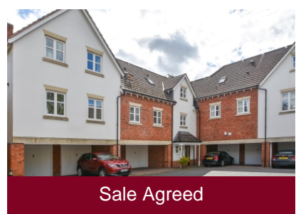
2 Albrighton House, The Water Gardens, Wolverhampton