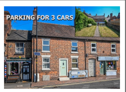
50 Whitburn Street, Bridgnorth