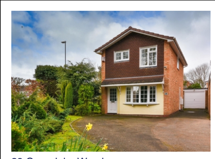
28 Quendale, Wombourne, Wolverhampton