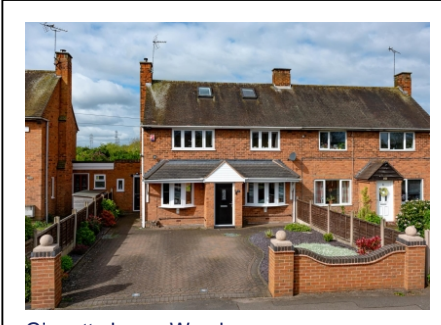
Giggetty Lane, Wombourne, Wolverhampton