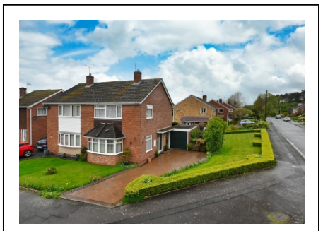
3 Hillside Avenue, Bridgnorth