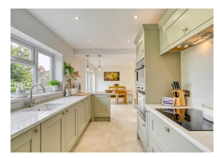
18 Stretton Close, Bridgnorth