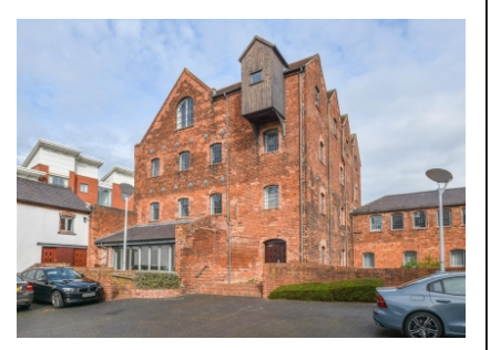
11 The Mill, Albion Street, Wolverhampton