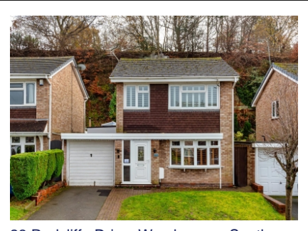
23 Redcliffe Drive, Wombourne, South Stafforshire