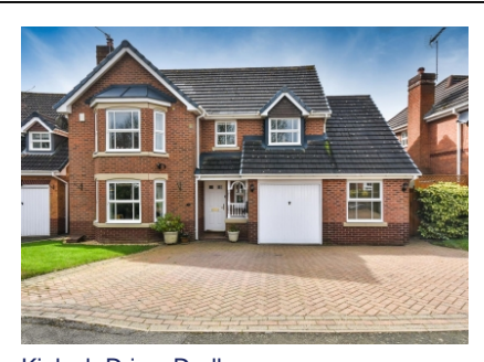
Kinloch Drive, Dudley