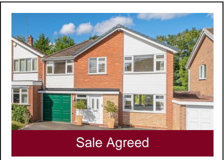
2 Whiteladies Court, Albrighton, Wolverhampton