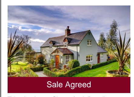
Trimpley Lane, Shatterford, Bewdley