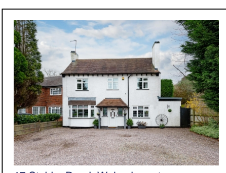
17 Stubbs Road, Wolverhampton