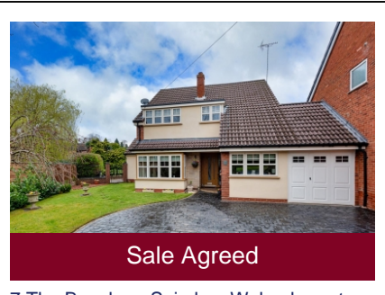
7 The Beeches, Seisdon, Wolverhampton