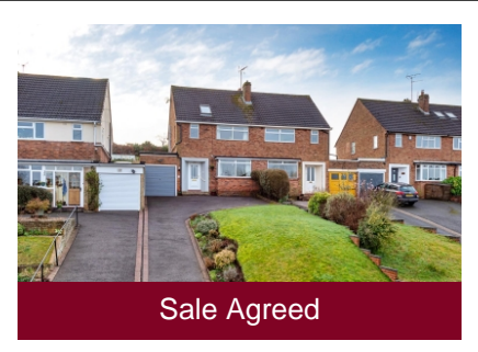
44 Common Road, Wombourne, Wolverhampton