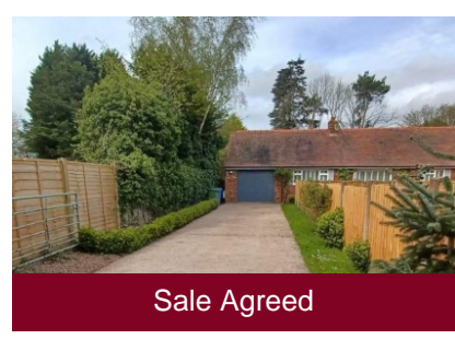
The Bungalow, Popes Lane, Wergs , Tettenhall