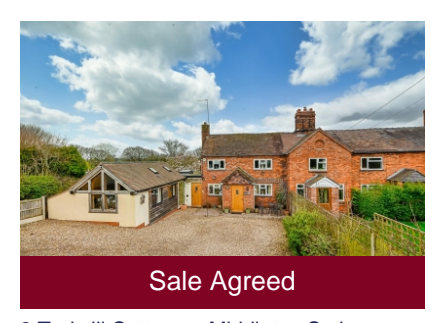
3 Tedstill Cottages, Middleton Scriven, Bridgnorth