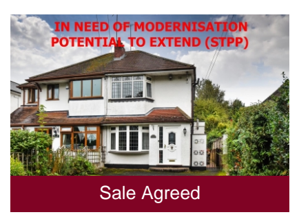
Hillcroft, Penstone Lane, Lower Penn