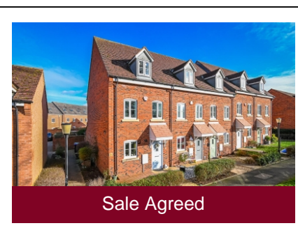
75 Rastrick Close, Bridgnorth