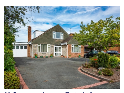
83 Cranmere Avenue, Tettenhall, Wolverhampton