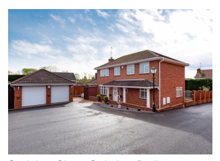
St. Johns Close, Swindon, Dudley