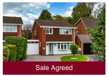
6 Tanglewood Grove, Dudley