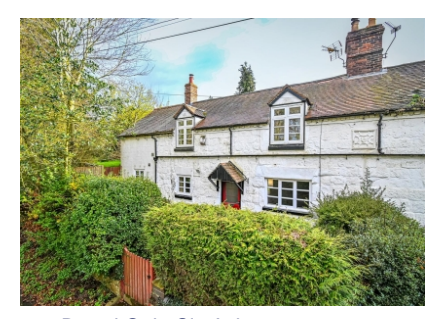
146 Broad Oak, Six Ashes