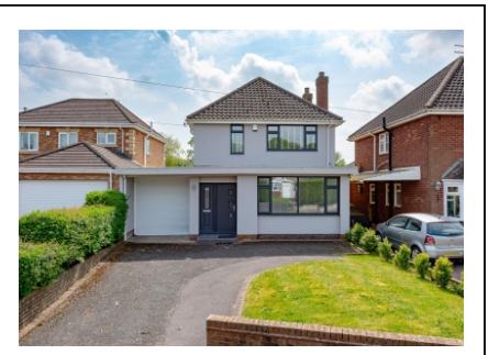
46 Wood Road, Codsall, Wolverhampton, WV8 1DN