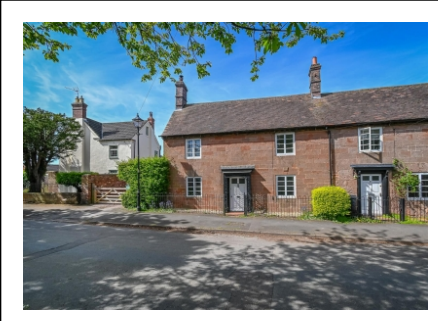
50 Ivy Place, Church Lane, Alveley, Bridgnorth