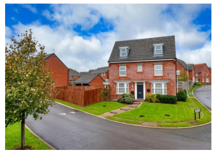
35 Chalmers Road, Baggeridge Village, Dudlev