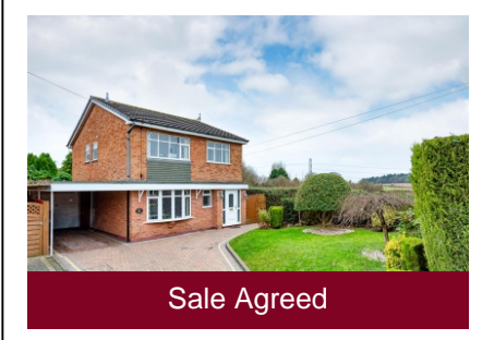
29 Windsor Road, Pattingham, Wolverhampton