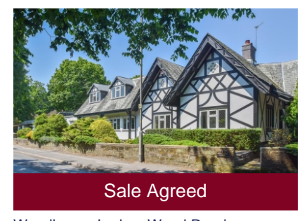
Woodhouse Lodge, Wood Road, Tettenhall Wood