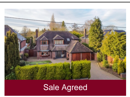
Broad Elms, Great Moor Road, Pattingham