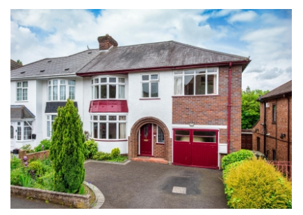
49 Canterbury Road, Penn, Wolverhampton