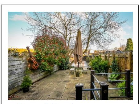
45 Cartway, Bridgnorth