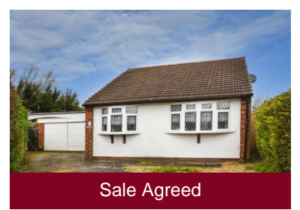
7 Apse Close, Wombourne, Wolverhampton