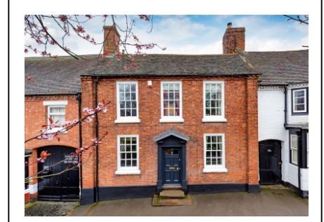
Saredon House, 28 Stafford Street, Brewood