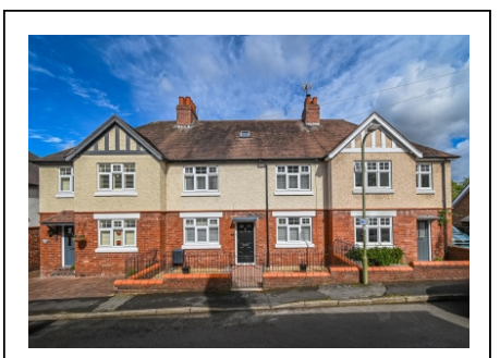
2 Cliff Gardens, Cliff Road, Bridgnorth