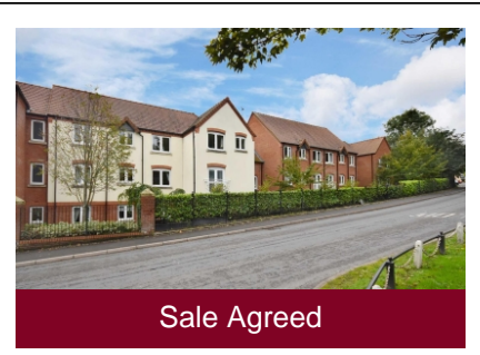
21 Farthings Court, Kings Loade, Bridgnorth