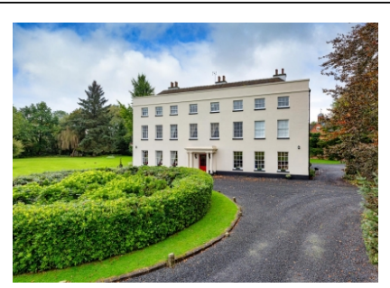
11 Leaton Hall, Church Lane, Bobbington, Stourbridge