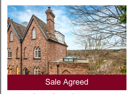
14 West Castle Street, Bridgnorth