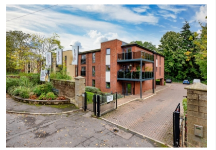
6 Thorneycroft, Wood Road, Tettenhall