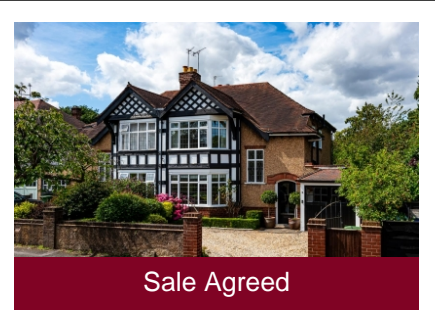
2 Highlands Road, Finchfield, Wolverhampton