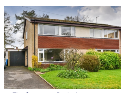
32 The Greenway, Pattingham, Wolverhampton