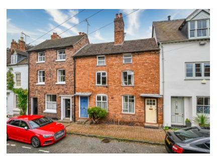
25 St. Marys Street, Bridgnorth