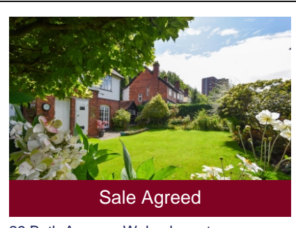
29 Bath Avenue, Wolverhampton