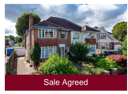
7 Newbridge Gardens, Newbridge, Wolverhampton