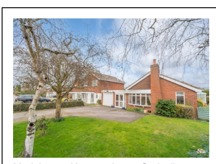
Madeira, 45 Keepers Lane, Codsall, Wolverhampton