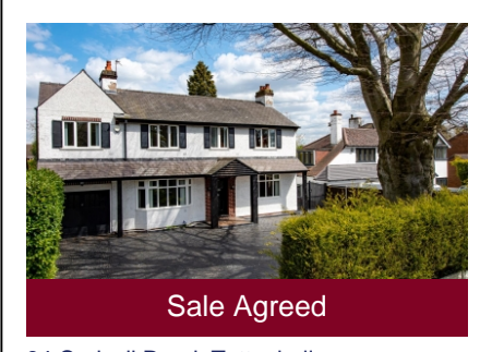
94 Codsall Road, Tettenhall, Wolverhampton