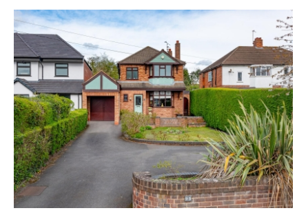
95 Windmill Lane, Castlecroft, Wolverhampton