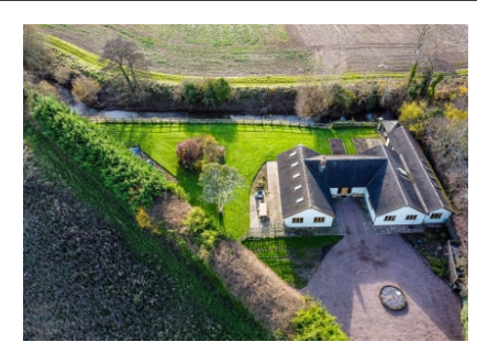
Riverside Bungalow, Muckley Cross, Acton Round, Bridgnorth