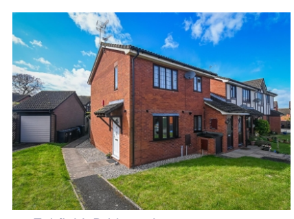
10 Fairfield, Bridgnorth