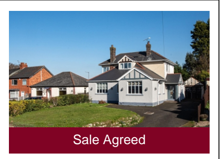
153 Trysull Road, Merry Hill, Wolverhampton