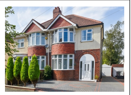
28 Links Road, Penn, Wolverhampton