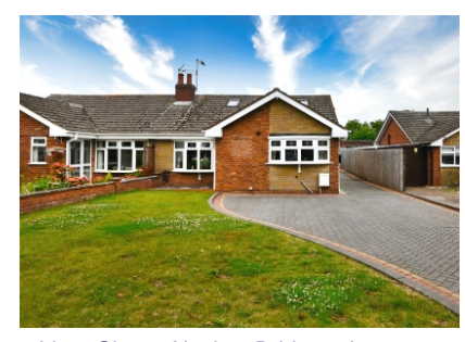
6 Lime Close, Alveley, Bridgnorth