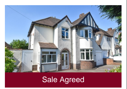
490 Penn Road, Wolverhampton