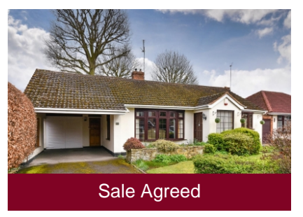
30 Sabrina Road, Wightwick, Wolverhampton