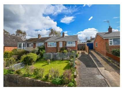
24 Greenfields Road, Bridgnorth