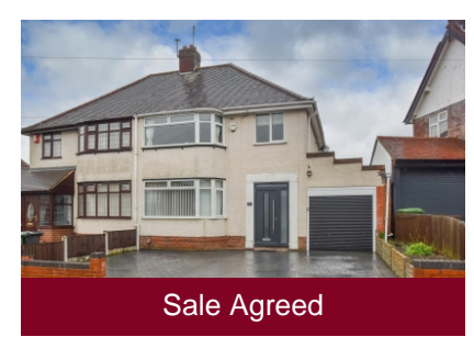
19 Sandringham Road, Penn, Wolverhampton