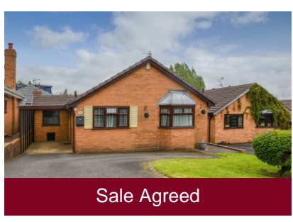
56 Coton Road, Wolverhampton