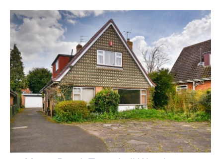
68 Mount Road, Tettenhall Wood, Wolverhampton