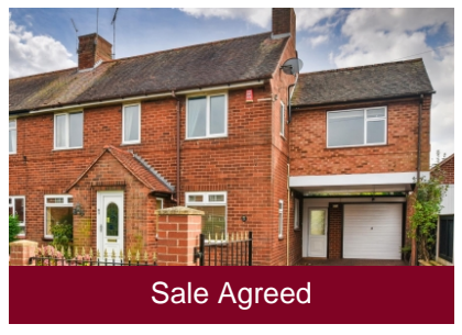
13 Grange Road, Albrighton, Wolverhampton