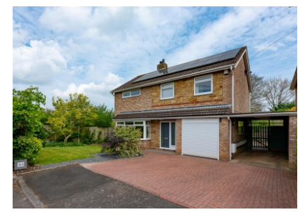
44 Romsley View, Alveley, Bridgnorth