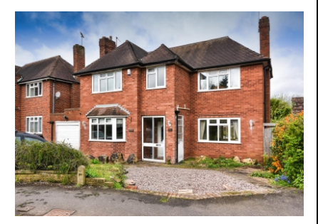
66 York Avenue, Finchfield, Wolverhampton