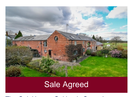
The Oak House, Oaklands Court, Lower Rudge, Pattingham