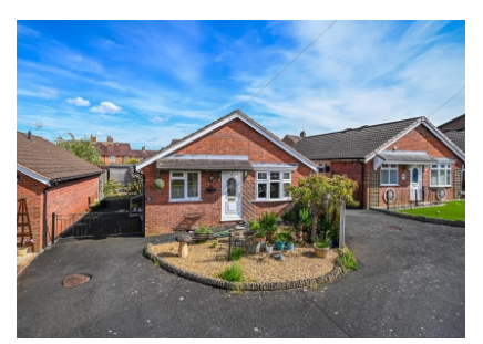
105 Hook Farm Road, Bridgnorth