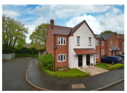
19 Staley Grove, Highley, Bridgnorth