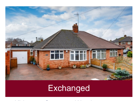
13 Kirkstone Crescent, Wombourne, Wolverhampton