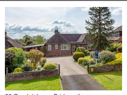
53 Conduit Lane, Bridgnorth