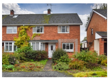
10 Neachless Avenue, Wombourne, Wolverhampton