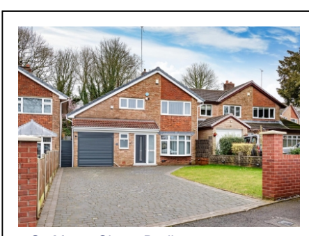
3 St. Marys Close, Dudley