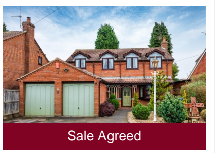
92 Bridgnorth Road, Wombourne, Wolverhampton