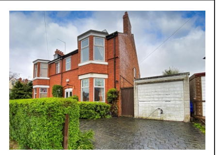
26 Marchant Road, Compton, WV3 9QG