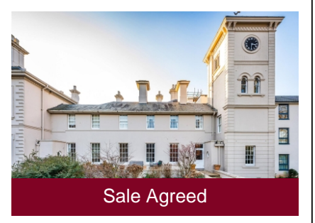
2 Old Hall, Wergs Hall Road, Tettenhall