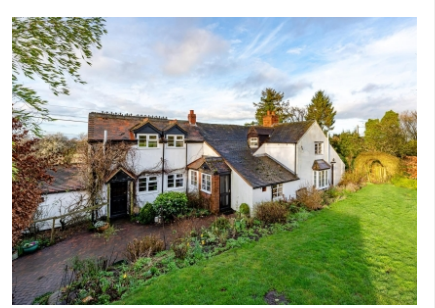
Greystoke Cottage, Kiddemore Green, Brewood