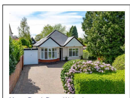
Mount Road, Penn, Wolverhampton