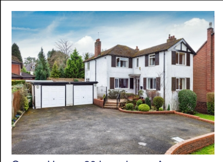
Quarry House, 30 Lansdowne Avenue, Codsall