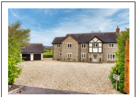
Beech House, Munslow, Shropshire