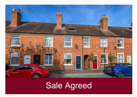
29 Severn Street, Bridgnorth