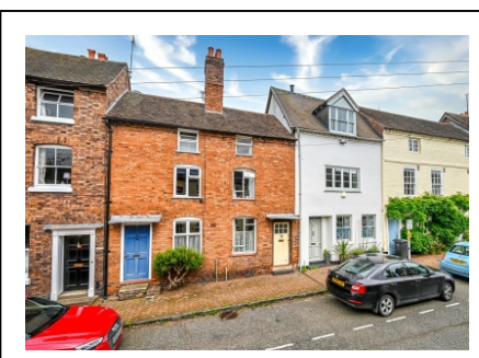
24 St. Marys Street, Bridgnorth