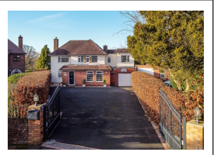
Fern House, Links Avenue, Tettenhall