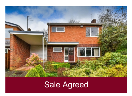
10 Ashfield Road, Compton, Wolverhampton