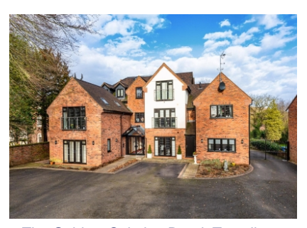
3 The Gables, Seisdon Road, Trysull, Wolverhampton