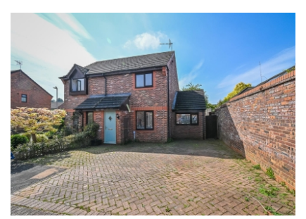
24 Wardle Close, Bridgnorth