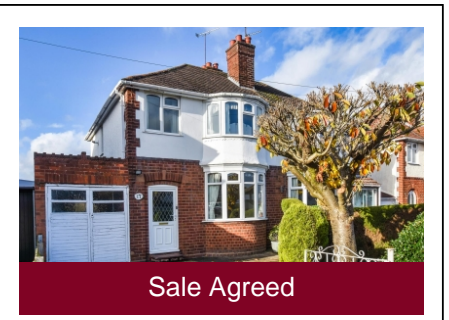
17 Fairview Road, Penn, Wolverhampton