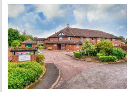
13 Saxon Park, High Street, Albrighton, Wolverhampton