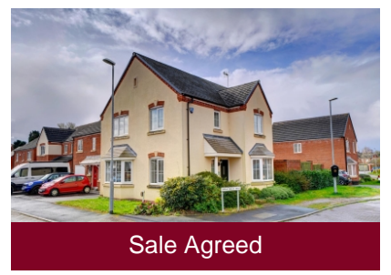
Greatwich Way, Kidderminster