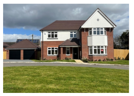
Cedar House, 7 Rowan Grange, Broseley