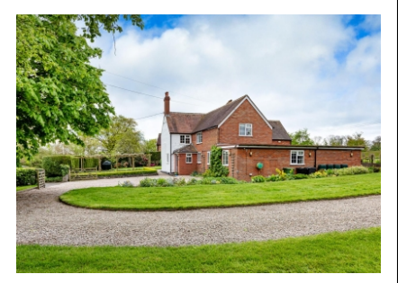
Keepers Cottage, Colemore Green, Bridgnorth