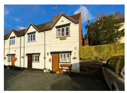
26c Bernards Hill, Bridgnorth