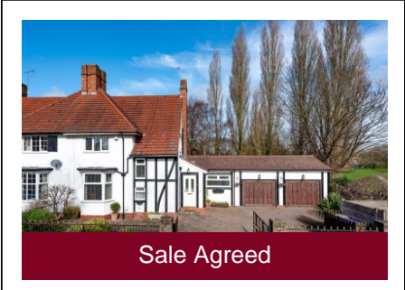
9 Myrtle Grove, Bradmore, Wolverhampton