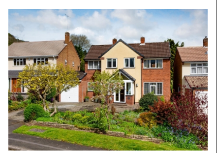
5 Torvale Road, Wightwick, WV6 8NW