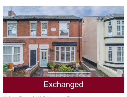
Allen Road, Whitmore Reans, Wolverhampton