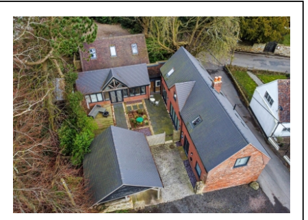
The Old Coach House, Little Wenlock, Telford