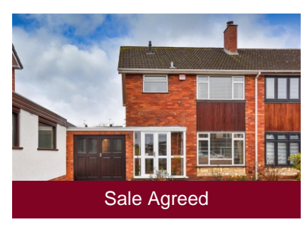
9 St. Benedicts Road, Wombourne, Wolverhampton