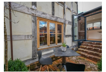
Park Cottage, Abbey Foregate, Shrewsbury