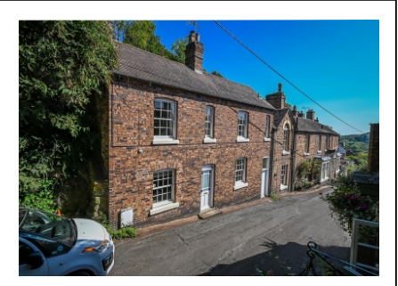
25 Church Hill, Ironbridge, Telford