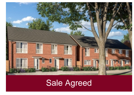
Plot 3 Nightingale Place, Vicarage Road, Wolverhampton