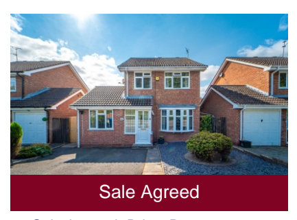
42 Gainsborough Drive, Perton, Wolverhampton