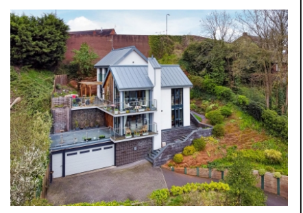
Hawthorn View, Hollybush Road, Bridgnorth