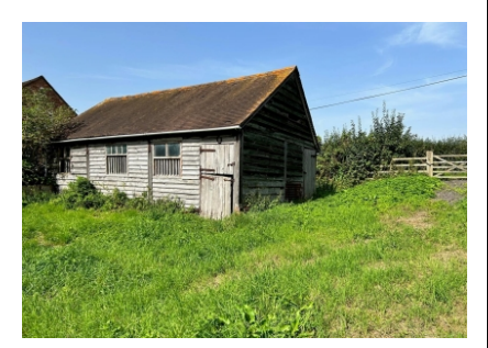
Spring Barn, Glazeley, Bridgnorth