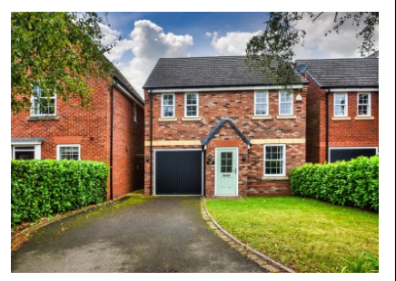
Eden House, Wombourne Road, Swindon, Dudley