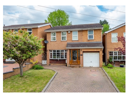
The Holloway, Swindon, Dudley