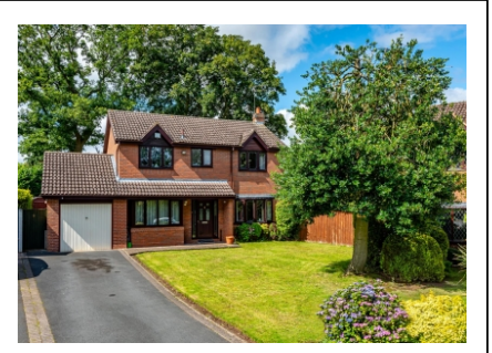
South View Close, Codsall, Wolverhampton