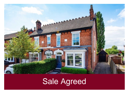
7 Richmond Road, Finchfield, Wolverhampton