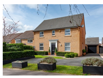
12 Larch Grove, Shifnal