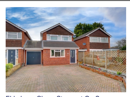
Elderberry Close, Stourport-On-Severn