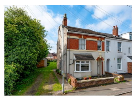
25 Newbridge Street, Newbridge, Wolverhampton, WV6 0EE