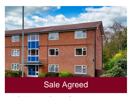
139 Bridgnorth Road, Compton, Wolverhampton