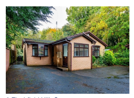
6 Finchfield Hill, Compton, Wolverhampton