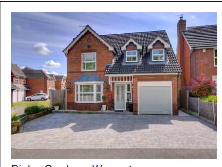
Ripley Gardens, Worcester