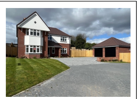
Rosewood House, 6 Rowan Grange, Broseley