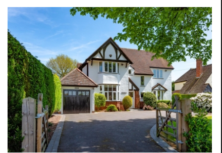
5 Coppice Road, Finchfield, Wolverhampton, WV3 8BJ