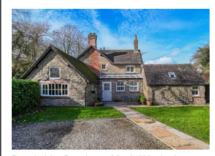
Brookside, Brockton, Much Wenlock