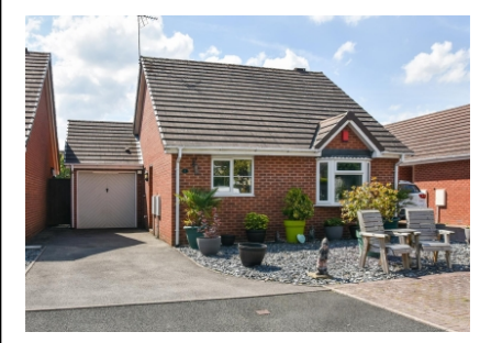
4 Hazelmere Drive, Castlecroft, Wolverhampton