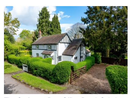
The Croft, 120 Post Office Road, Seisdon, Wolverhampton