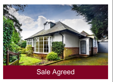
The Grey Cottage 19 Clifton Road, Wolverhampton