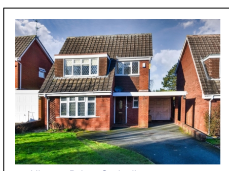
15 Histons Drive, Codsall, Wolverhampton