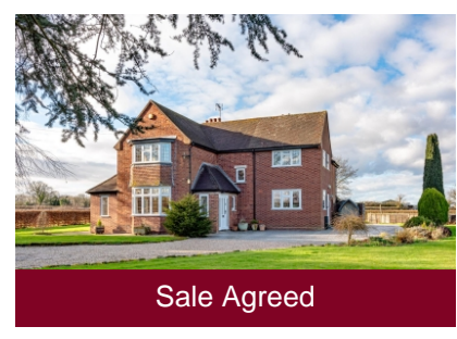
Trentham, Lapley Road, Wheaton Aston