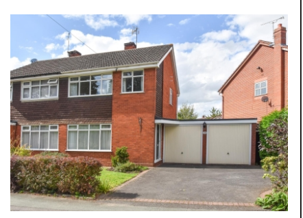
34 Castlecroft Road, Finchfield, Wolverhampton