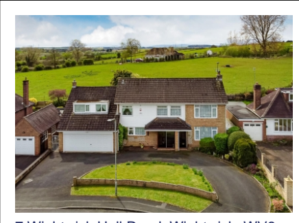
7 Wightwick Hall Road, Wightwick, WV6 8BZ