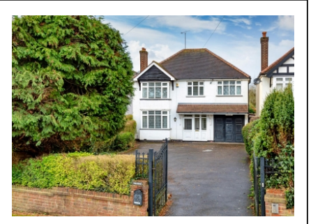
Maleesh, Stourbridge Road, Wombourne