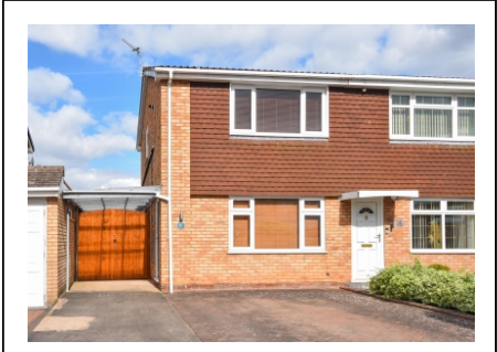
Green Meadow Close, Wombourne, Wolverhampton