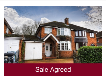
52 Wombourne Park, Wombourne, Wolverhampton