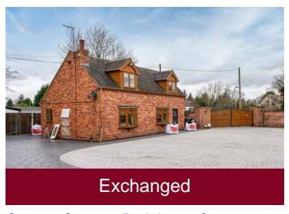
Granary Cottage, Dark Lane, Cross Green, Wolverhampton