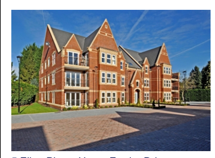
5 Ellen Place, Henry Fowler Drive, Tettenhall