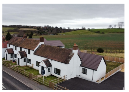
3 Ackleton Meadows, Stableford, Bridgnorth