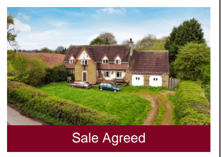
Mill Cottage, Lower Rudge, Pattingham, Wolverhampton