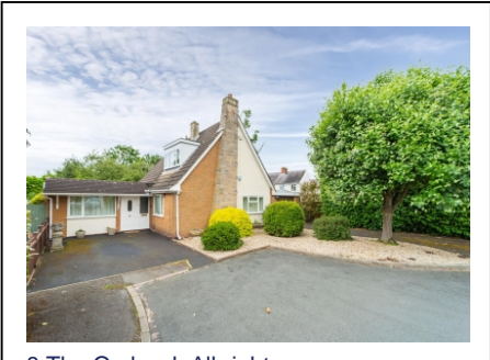
8 The Orchard, Albrighton