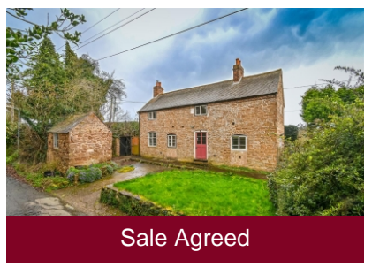
148 Broad Oak, Six Ashes