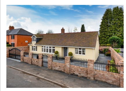
4 Mayfield Road, Albrighton, WV7 3JY