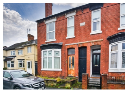
166 Crowther Road, Wolverhampton