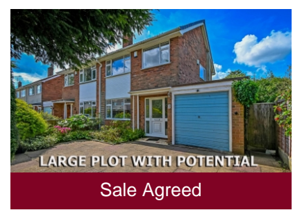
6 Moor Lane, Pattingham, Wolverhampton