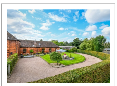
The Stables, Chesterton, Bridgnorth