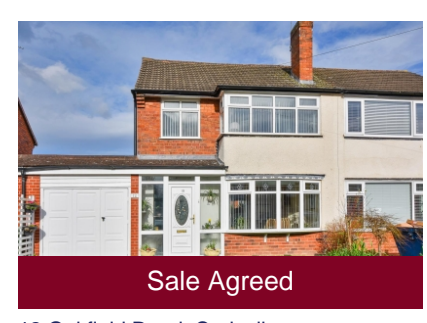
12 Oakfield Road, Codsall, Wolverhampton