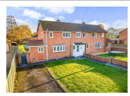
1 Brown Clee Road, Ditton Priors, Bridgnorth