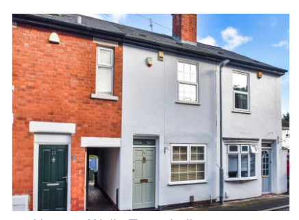
15 Nursery Walk, Tettenhall, Wolverhampton