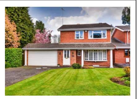
18 Fair Oak Drive, Wolverhampton