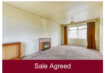
26 The Avenue, Castlecroft, Wolverhampton