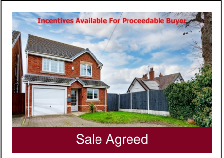
151 Tipton Road, Woodsetton, Dudley