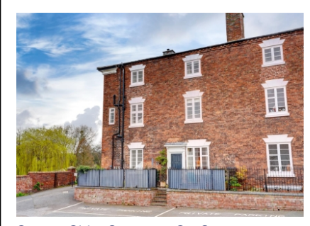
Severn Side, Stourport-On-Severn