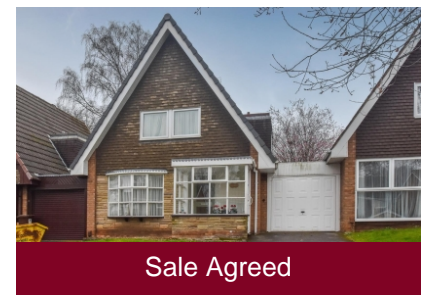
16 Surrey Drive, Finchfield, Wolverhampton