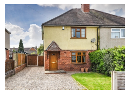
Redhill Avenue, Wombourne, Wolverhampton