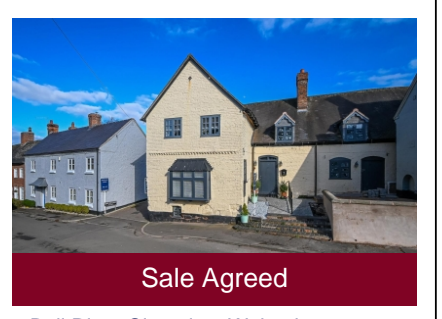
7 Bull Ring, Claverley, Wolverhampton