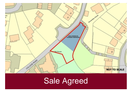
College Road, Tettenhall, Wolverhampton