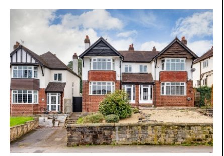
83 Lower Street, Wolverhampton