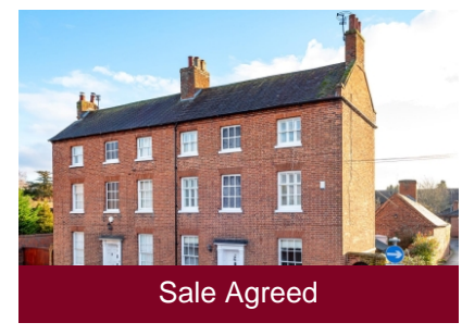
4 Church Road, Albrighton, Wolverhampton