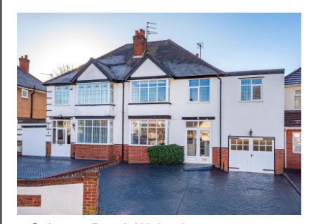
7 Osborne Road, Wolverhampton