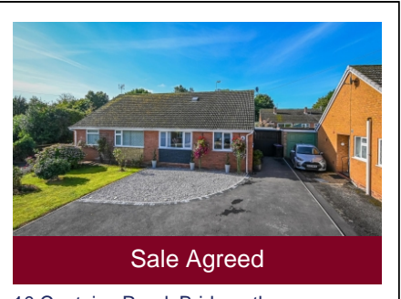
10 Captains Road, Bridgnorth