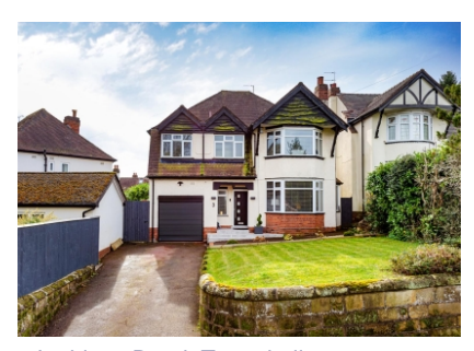
3 Lothians Road, Tettenhall, Wolverhampton