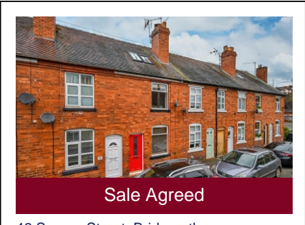
46 Severn Street, Bridgnorth