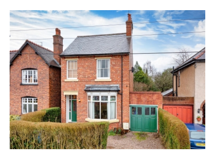
29 Walk Lane, Wombourne