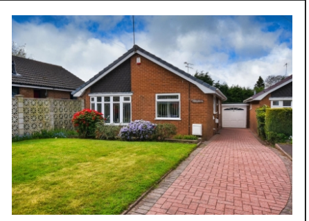
19 Finchdene Grove, Finchfield, Wolverhampton