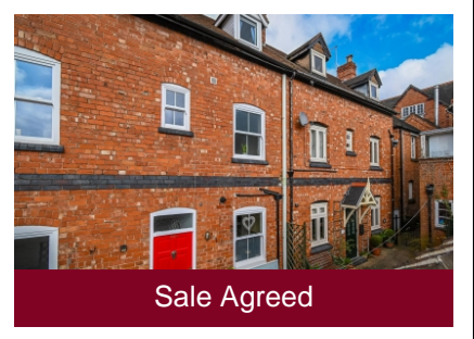
22a High Street, Bridgnorth