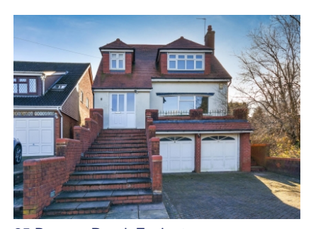
25 Bognop Road, Essington, Wolverhampton