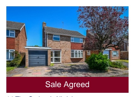
14 The Orchard, Albrighton, Wolverhampton