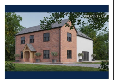
Plot 1, Bynd Lane, Billingsley, Bridgnorth