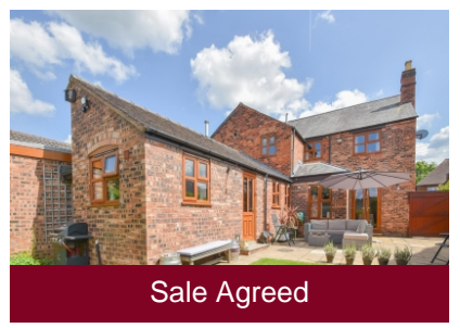
The Cottage, 18 Shop Lane, Oaken