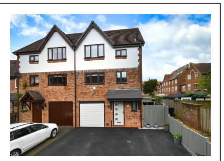
2 King Charles Way, Bridgnorth