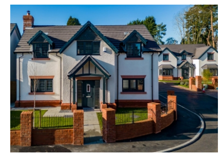
Alder House, Popes Lane, Tettenhall