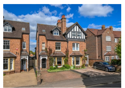
2 Westgate Villas, Salop Street, Bridgnorth