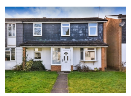
11 Woodside, Ashmore Park, Wolverhampton