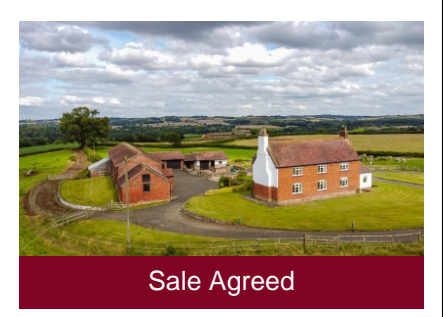
Lower Sutton Farm, Sutton, Chelmarsh, Bridgnorth