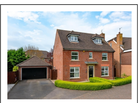
49 Old Farm Drive, Codsall, Wolverhampton, WV8 1GF