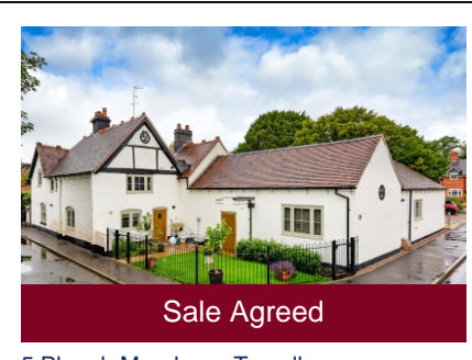
5 Plough Meadows, Trysull