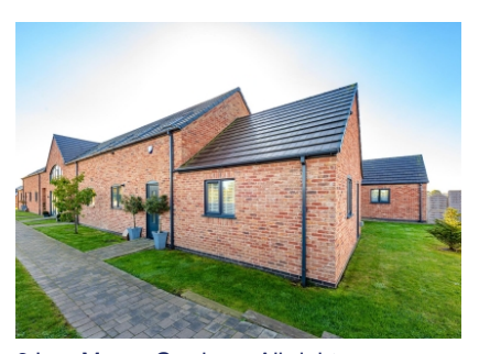
6 Lea Manor Gardens, Albrighton, Wolverhampton