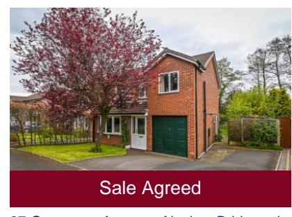
27 Greenway Avenue, Alveley, Bridgnorth