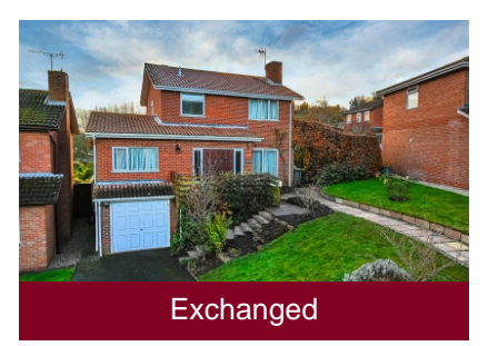
15 Bramble Ridge, Bridgnorth