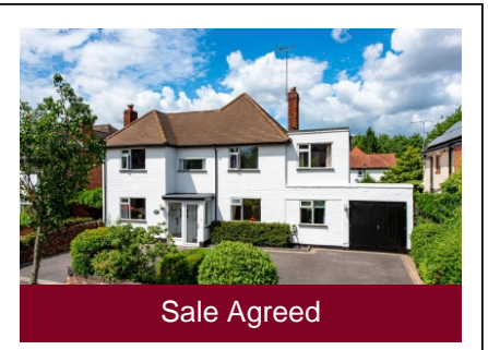
Helford House, Westland Avenue, Compton