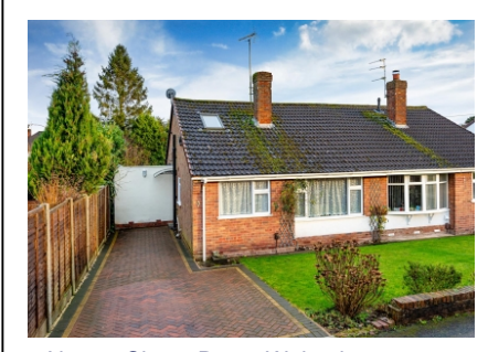
1 Norton Close, Penn, Wolverhampton