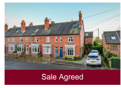
6 Merton Terrace, Oldbury Road, Bridgnorth