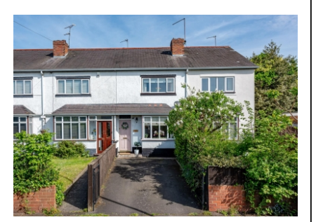
Planks Lane, Wombourne, Wolverhampton