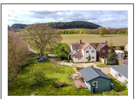
6 The Row, Easthope, Much Wenlock