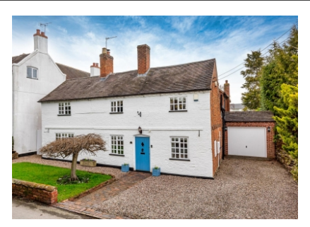
Garden Cottage, 4 Shop Lane, Brewood