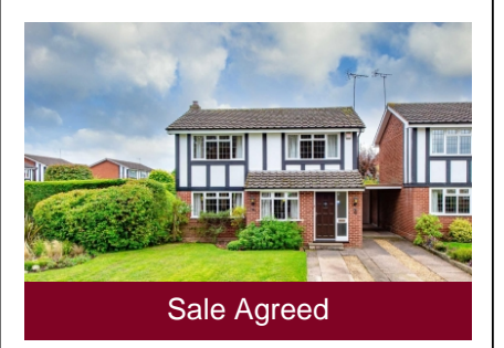
16 Meadow Vale, Codsall, Wolverhampton