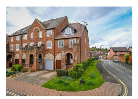
36 Southwell Riverside, Bridgnorth