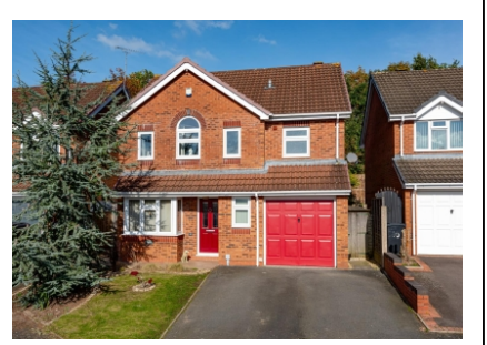
12 Dudmaston Way, Milking Bank, Dudley