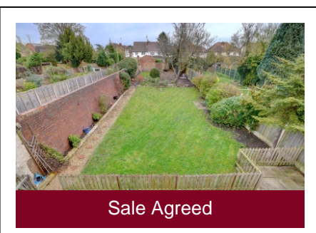
Grosvenor Avenue, Kidderminster