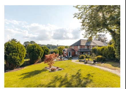
Sunnybank, 11b, Danesford, Bridgnorth