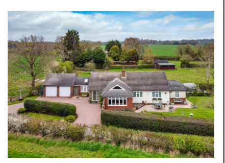
Holly Lodge, Church Lane, Boningale, Albrighton