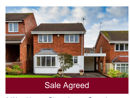
2 Woodthorne Close, Lower Gornal, Dudley