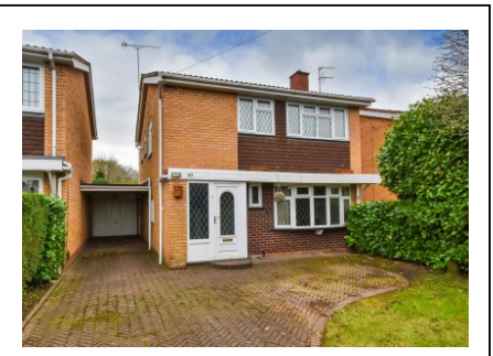
30 Sytch Lane, Wombourne, Wolverhampton