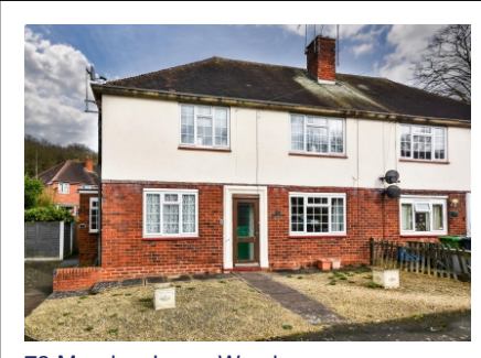
73 Meadow Lane, Wombourne, Wolverhampton