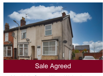
62 Merridale Street West, Wolverhampton