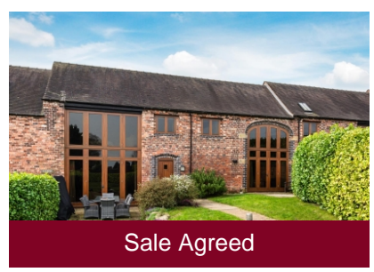
The Corn Barn, 3 East Trescott Barns Bridgnorth Road