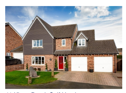
41 Kings Road, Calf Heath, Wolverhampton