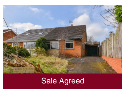
31 Bull Meadow Lane, Wombourne, Wolverhampton