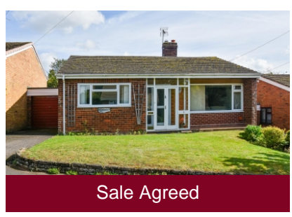
Foxcroft, 8 Fox Close, Seisdon