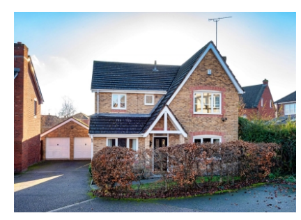
17 Holendene Way, Wombourne, Wolverhampton