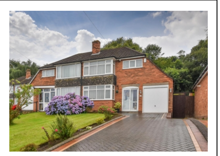
4 Chase View, Ettingshall Park, Wolverhampton