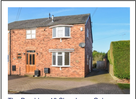
The Rambles, 16 Shop Lane, Oaken