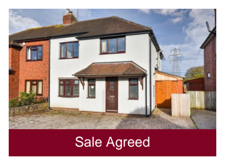
44 Market Lane, Lower Penn, Wolverhampton