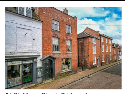
64 St. Marys Street, Bridgnorth