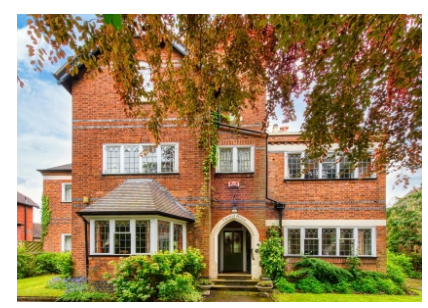
Cheviot House, 20 Stockwell Road, Tettenhall