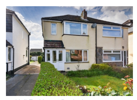
36 Hall End Lane, Pattingham, Wolverhampton