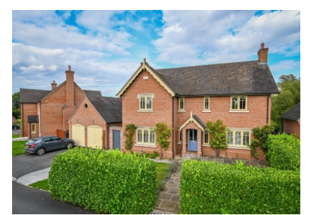
Fitzallen House, 3 Cound Park Drive, Cound, Shrewsbury