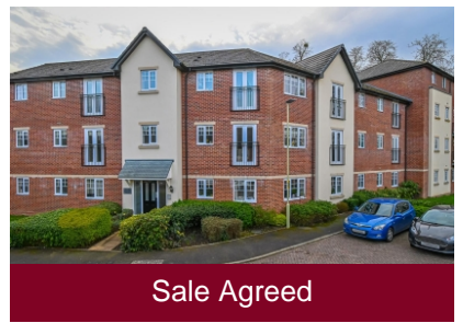
25 Greyfriars House, Stourbridge Road, Bridgnorth