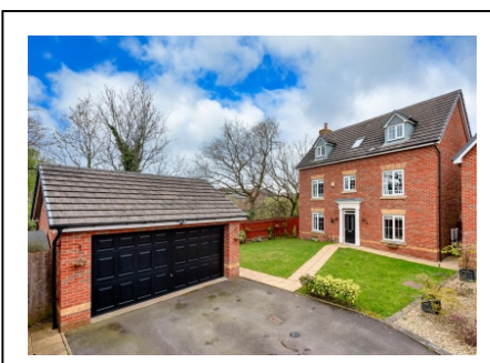
Oaklands, Wombourne, Wolverhampton