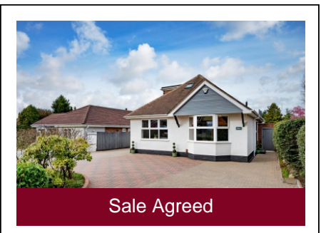
28a Wood Road, Tettenhall Wood