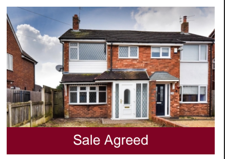
93 Hazel Grove, Wombourne, Wolverhampton