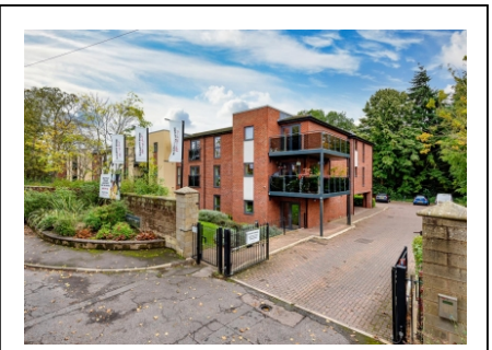
55 Thorneycroft, Wood Road, Tettenhall