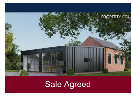
Plot 3, Bynd Lane, Billingsley, Bridgnorth