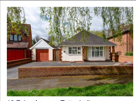
19 Foley Avenue, Tettenhall, Wolverhampton