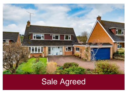
18 Quail Green, Wightwick, Wolverhampton