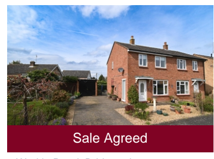
9 Wrekin Road, Bridgnorth