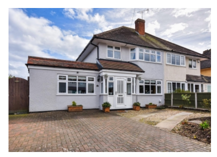
34 Delaware Avenue, Albrighton