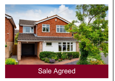
9 Windsor Road, Pattingham