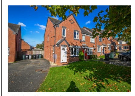
8 Ridley Close, Bridgnorth