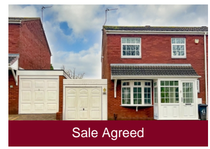
14 St James Street, Lower Gornal, Dudley