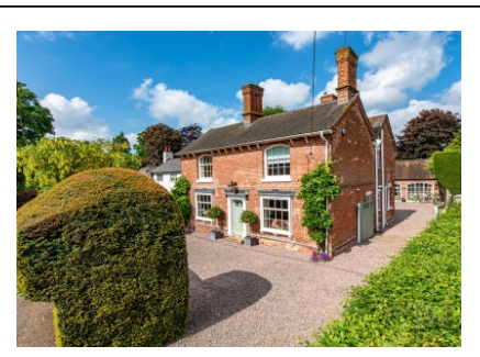
Beckbury House, Beckbury, Shifnal