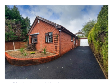
10 Planks Lane, Wombourne, Wolverhampton