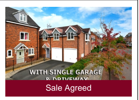
14 Rastrick Close, Bridgnorth