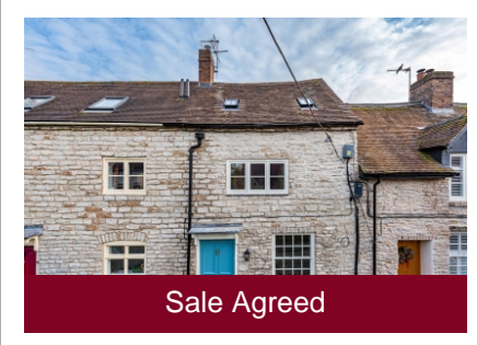
5a King Street, Much Wenlock, Shropshire