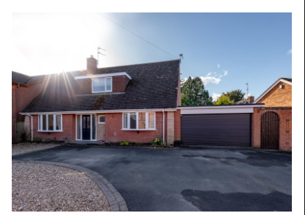
Strathmore, Shaw Lane, Albrighton