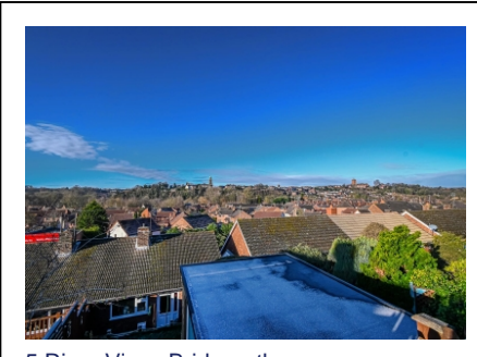
5 River View, Bridgnorth