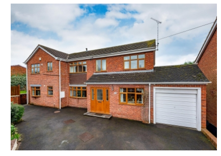
15 Ounsdale Crescent, Wombourne, Wolverhampton