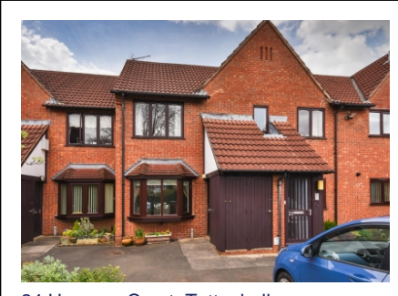
24 Hanover Court, Tettenhall, Wolverhampton