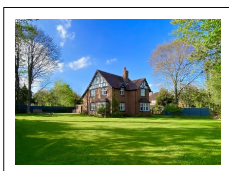
The Croft, 15 Church Road, Albrighton, Wolverhampton