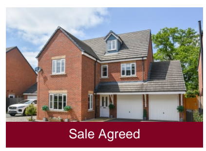
36 Hough Way, Shifnal