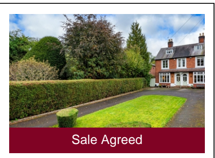
Fernleigh, 35 Oaken Lanes, Codsall