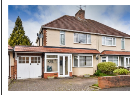
Linton Road, Wolverhampton