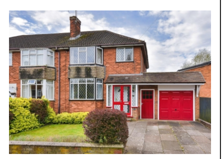
Wombourne Park, Wombourne