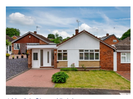
4 Mayfair Close, Albrighton, Wolverhampton