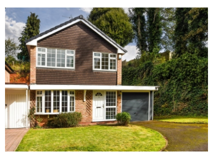
39 Alpine Way, Compton, Wolverhampton