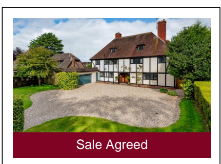
Findon, Haughton Lane, Shifnal