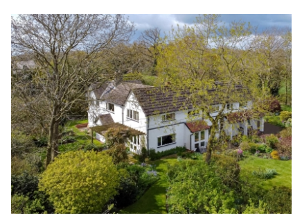
Leafields Farm, Shutt Green, Brewood, ST19 9LX