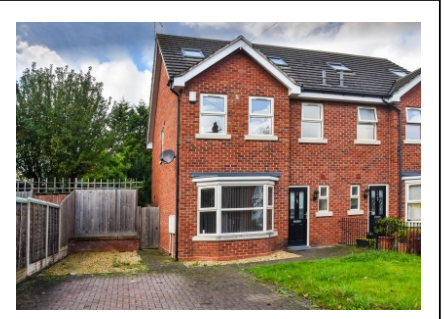
1 Marchant Road, Compton, Wolverhampton