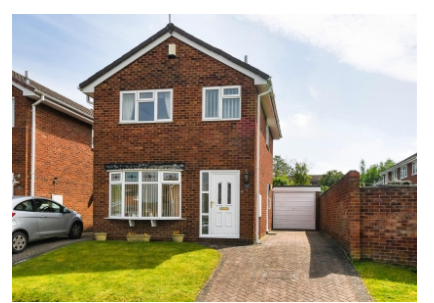
Millfields Way, Wombourne, Wolverhampton