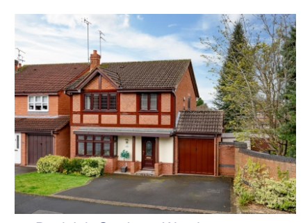
19 Penleigh Gardens, Wombourne, Wolverhampton