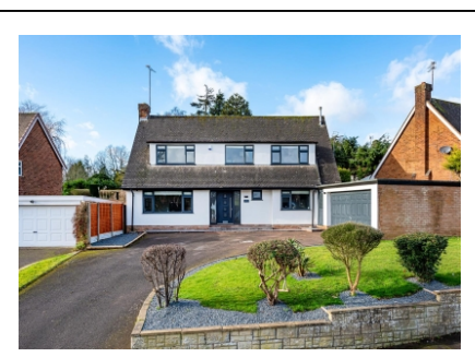
25 Perton Brook Vale, Wightwick