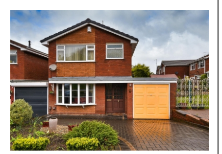
7 Marlborough Gardens, Newbridge, Wolverhampton