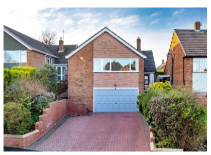
52 Church Hill, Penn, Wolverhampton