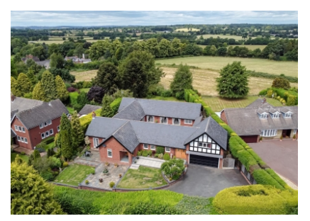
Courtneys, Oaken Drive, Oaken, Codsall