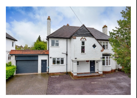
61 Codsall Road, Tettenhall, WV6 9QG