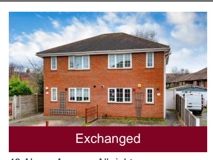
48 Abney Avenue, Albrighton