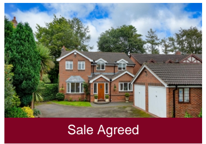
17 Hall End Lane, Pattingham, Wolverhampton