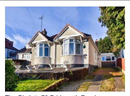
The Chalett, 78 Bridgnorth Road, Compton