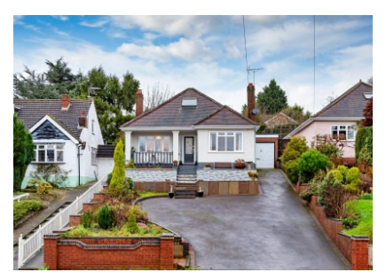
74 Bridgnorth Road, Compton