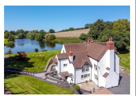
Hem Mill, The Hem, Shifnal