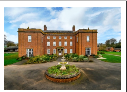
Home Wood, Gatacre Hall, Claverley, Wolverhampton