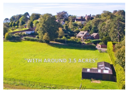
Half Acre House, Stableford, Bridgnorth