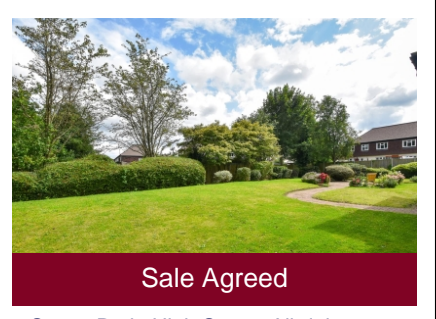
5 Saxon Park, High Street, Albrighton