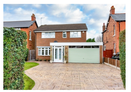
230a Trysull Road, Merry Hill, Wolverhampton