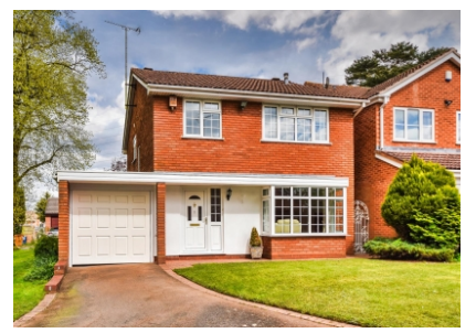
1 Foxlands Drive, Wolverhampton