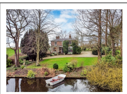
The Mill House, Badger, Wolverhampton