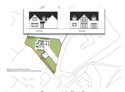
Land on the South of 2 Old Coppice Grange, Old Park, Telford