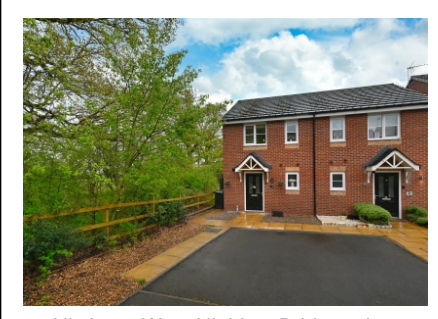
29 Hitchens Way, Highley, Bridgnorth