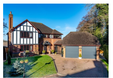
47 Fairfield Drive, Codsall, Wolverhampton