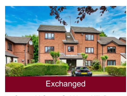
10 Cotswold Court, Goldthorn Hill, Penn, Wolverhampton