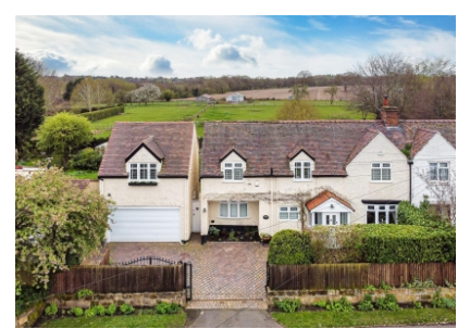
15 Birches Road, Codsall, Wolverhampton