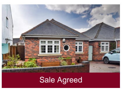
70 Finchfield Road, Wolverhampton