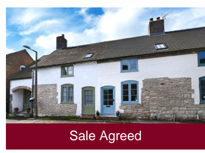
41 Barrow Street, Much Wenlock