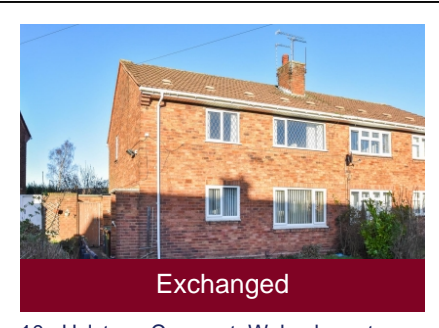
10a Hylstone Crescent, Wolverhampton