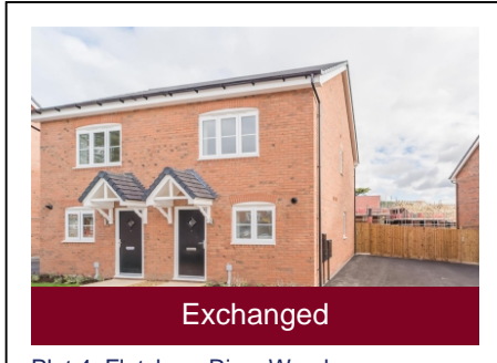
Plot 4, Fletchers Rise, Wombourne