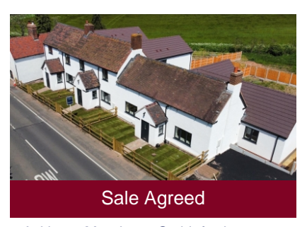
2 Ackleton Meadows, Stableford, Bridgnorth