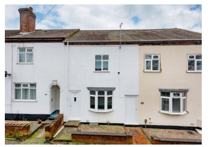
126a Clifton Street, Sedgley