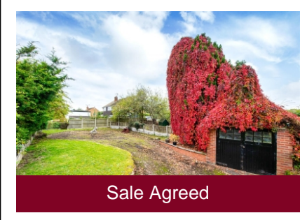
Planning Permission, 40 Moatbrook Lane, Codsall, WV8 1SD