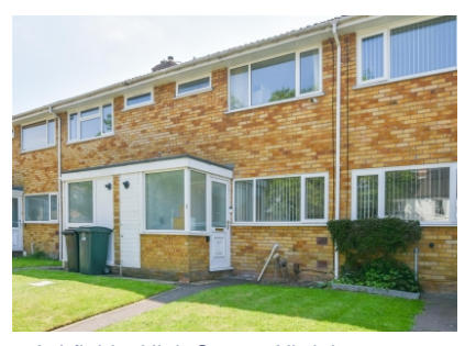
3 Ashfields, High Street, Albrighton