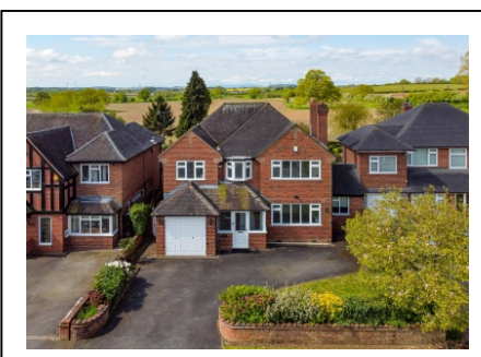
59 Sabrina Road, Wolverhampton