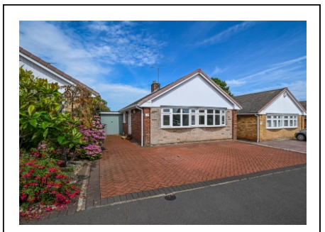
7 Princess Drive, Bridgnorth