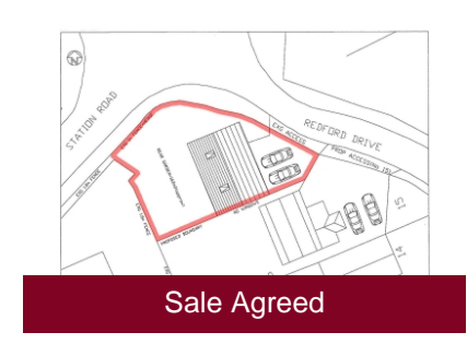
Land to the North of 15 Redford Drive, Albrighton