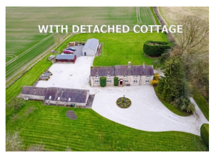
Lower Westwood Farm, Stretton Westwood, Much Wenlock