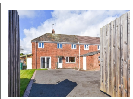
146 Cornwall Road, Tettenhall, WV6 8UZ