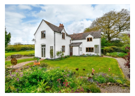
The Cottage, Middleton Scriven, Bridgnorth