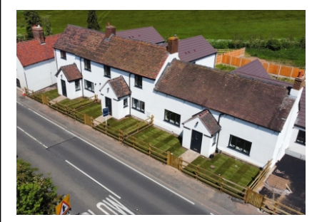
1 Ackleton Meadows, Stableford, Bridgnorth