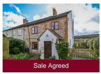
1 The Row, Easthope, Much Wenlock