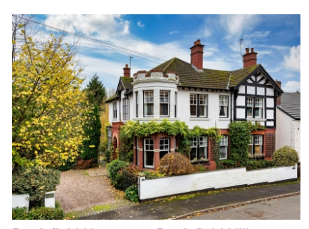
Battlefield House, 14 Battlefield Hill, Wombourne, Wolverhampton