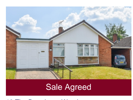
13 The Broadway, Wombourne, Wolverhampton