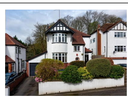
Tudor Crescent, Wolverhampton