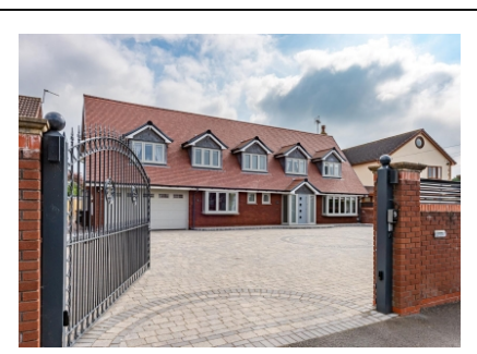
Alpine Cottage, 11 Kings Road, Calf Heath