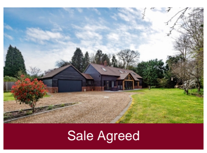
Willow Lodge, 23 High Street, Albrighton