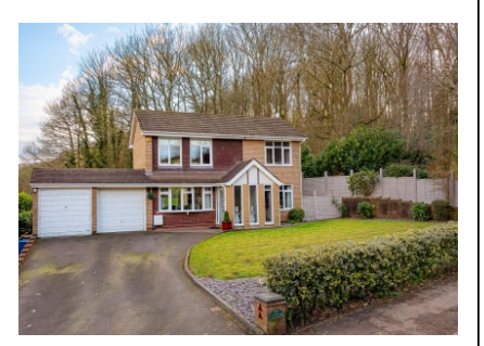
Wychaven, The Holloway, Swindon, Dudley