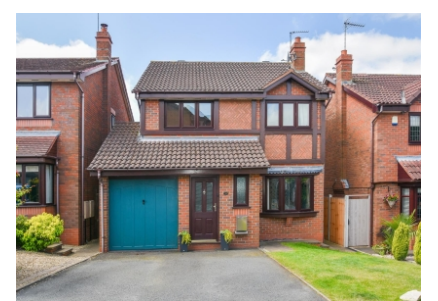
35 Penleigh Gardens, Wombourne, Wolverhampton