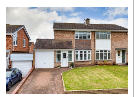
34 Sandy Lane, Codsall, WV8 1EJ