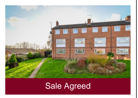
47 Tasley Close, Bridgnorth