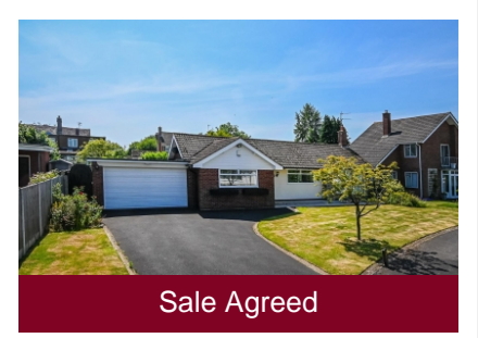
50 The Wold, Claverley, Shropshire