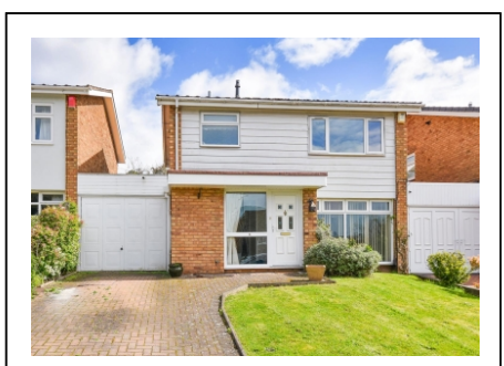
4 Forton Close, Compton, Wolverhampton