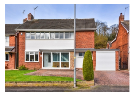
97 Henwood Road, Compton, Wolverhampton