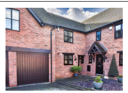
17 Bridgeman Court, Weston-Under-Lizard, Shifnal