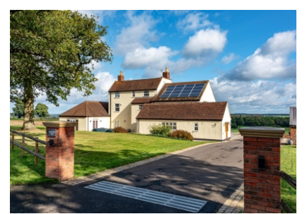
Home Farm, Gatacre, Claverley, Wolverhampton