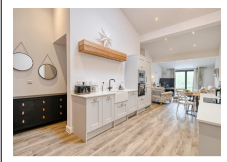
The Willow, 3 The Closes, Sutton Farm, Claverley, Wolverhampton