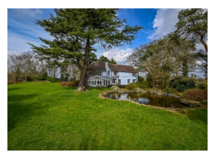
Horseshoes, Netherton, Highley, Bridgnorth