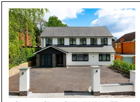
1 Chestnut Close, Codsall, WV8 2EZ