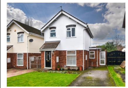
8 Laburnum Street, Wolverhampton