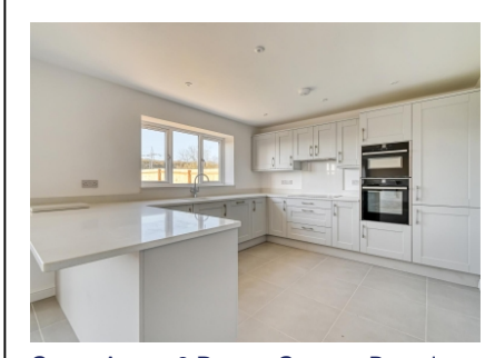
Green Acres, 3 Rowan Grange, Broseley