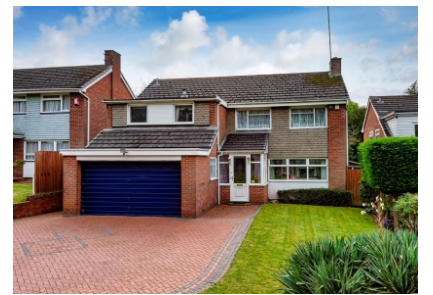
2 Captains Close, Compton, Wolverhampton