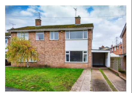
36 Wombourne Road, Swindon, Dudley