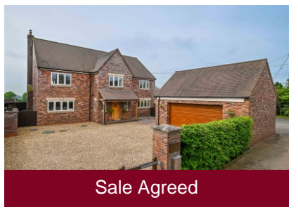
Faintree Heights, Faintree, Bridgnorth