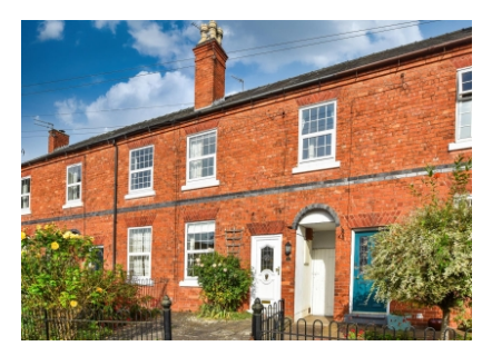
3 Shaw Lane, Albrighton, Wolverhampton