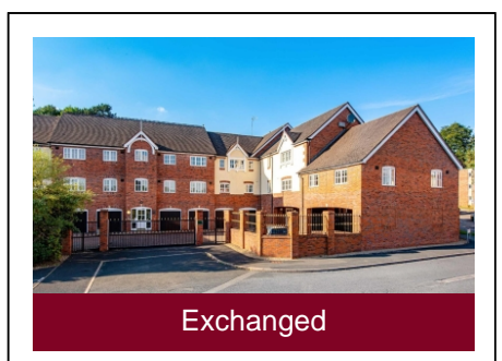
11 Cygnet Close, Compton, Wolverhampton