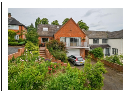
The Tyning, Westgate Drive, Bridgnorth