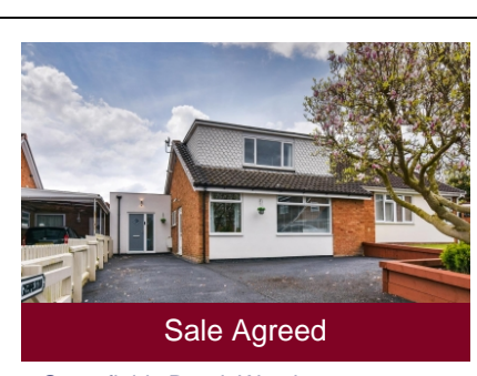
3 Greenfields Road, Wombourne, Wolverhampton