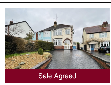
31 Sedgley Road, Penn Common, Penn