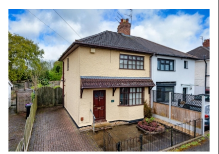
61 Woodland Avenue, Wolverhampton