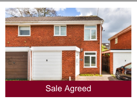
Forge Leys, Wombourne