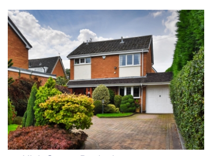
39 High Street, Pattingham, Wolverhampton