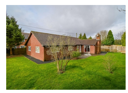
The Old Kiln, Church Lane, Bridgnorth