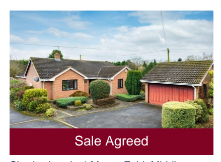
Shadowbrook, 4 Manor Fold, Middle Lane, Oaken