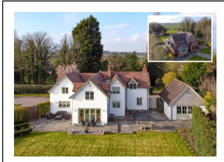
Oaklea and The Cottage, Damson Lane, Weston Heath, Shifnal