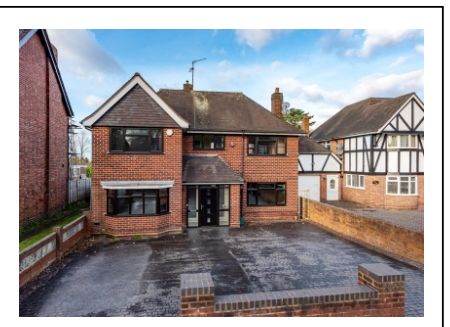
288b Penn Road, Wolverhampton