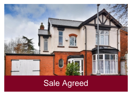
18 Elm Avenue, Bilston, Wolverhampton