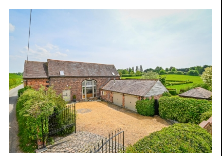
Trafalgar Barn, Worfield, Bridgnorth