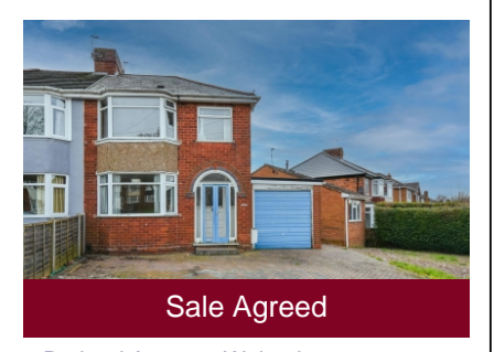
1 Rutland Avenue, Wolverhampton