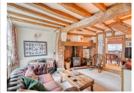
Bridgend Cottage, 43 Cartway, Bridgnorth