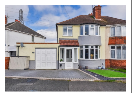
56 Hilston Avenue, Penn, Wolverhampton