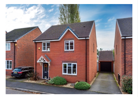
39 Rakegate Close, Oxley, Wolverhampton