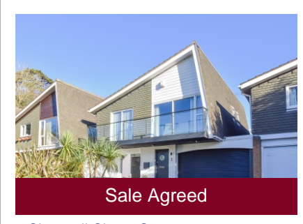
2 Cheswell Close, Compton, Wolverhampton