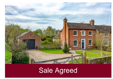
The Little House, 7 Tong Norton, Shifnal