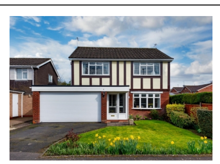
4 Rivendell Gardens, Tettenhall