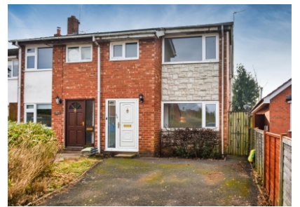
99 Hazel Grove, Wombourne, Wolverhampton