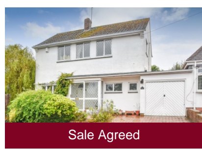
4 Newgate, Pattingham, Wolverhampton