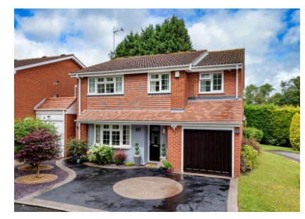
2 Brompton Lawns, Tettenhall Wood, Wolverhampton