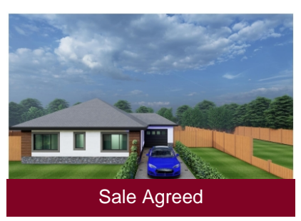
Plot 2 Hazelbrook, Hazel Lane, Great Wyrley