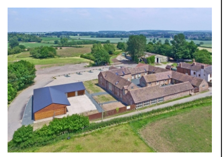
Saxon Meadow Cottage 5, The Wyke, Shifnal