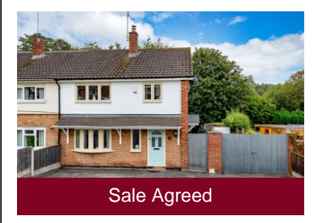
6 Moises Hall Road, Wombourne, Wolverhampton