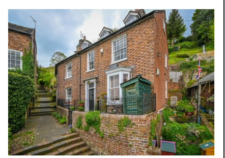
19 St. Marys Steps, Bridgnorth