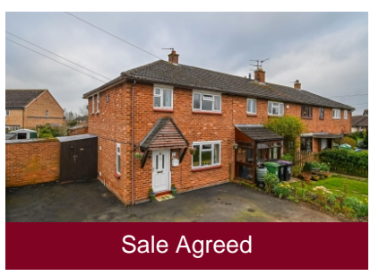
17 Racecourse Drive, Bridgnorth, Shropshire