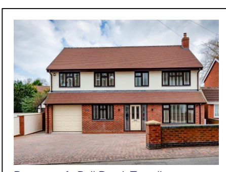
Ravenscroft, Bell Road, Trysull, Wolverhampton