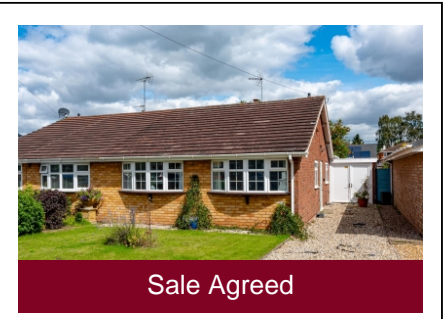
68 Clee View Road, Wombourne, Wolverhampton