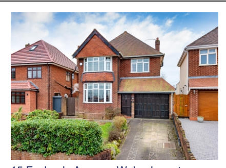
15 Foxlands Avenue, Wolverhampton