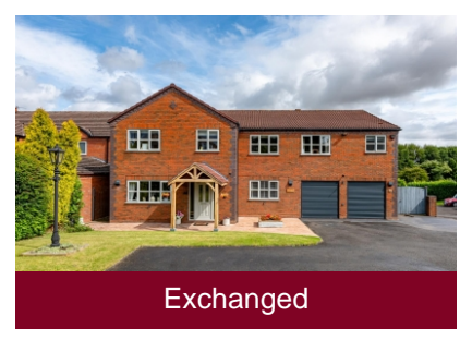
3 Mill Stream Close, Codsall, Wolverhampton