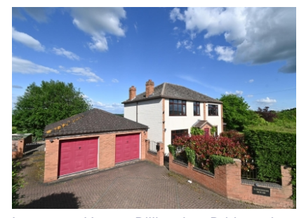
Longmoor House, Billingsley, Bridgnorth