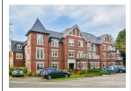
8 Clock Gardens, Stockwell Road, Wolverhampton