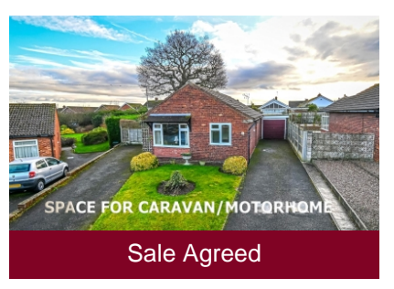
51 Linley View Drive, Bridgnorth