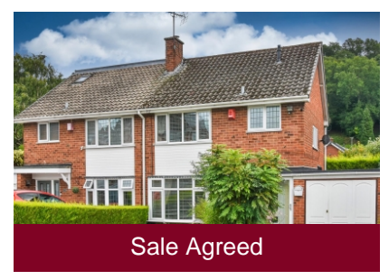
23 Chequers Avenue, Wombourne, Wolverhampton