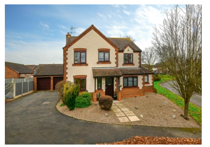
3 Danesbrook, Claverley, Wolverhampton