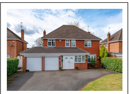
18 Corfton Drive, Tettenhall