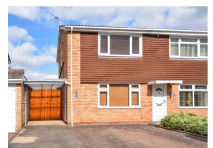
Green Meadow Close, Wombourne, Wolverhampton