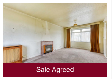
26 The Avenue, Castlecroft, Wolverhampton