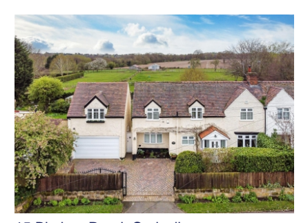
15 Birches Road, Codsall, Wolverhampton