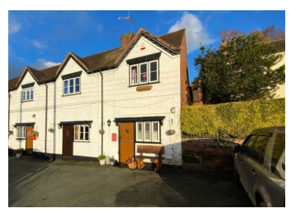
26c Bernards Hill, Bridgnorth