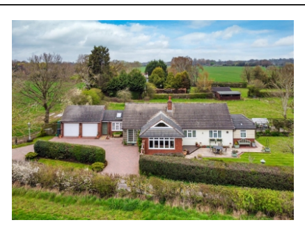
Holly Lodge, Church Lane, Boningale, Albrighton