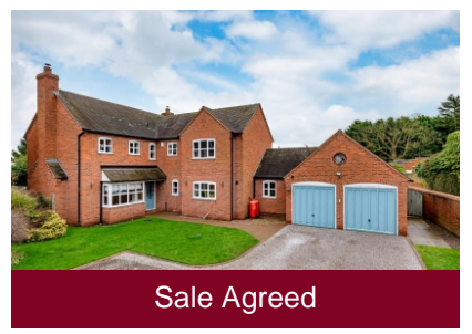
Rivendell, Park Lane, Lapley, Stafford