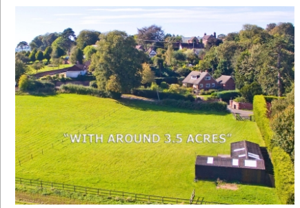
Half Acre House, Stableford, Bridgnorth