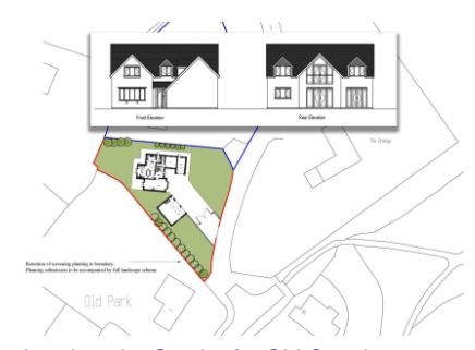
Land on the South of 2 Old Coppice Grange, Old Park, Telford