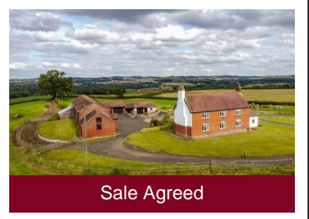
Lower Sutton Farm, Sutton, Chelmarsh, Bridgnorth