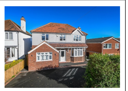
109 Victoria Road, Bridgnorth