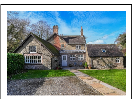
Brookside, Brockton, Much Wenlock