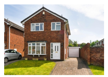
Millfields Way, Wombourne, Wolverhampton