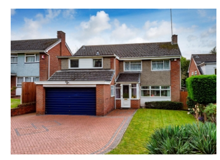
2 Captains Close, Compton, Wolverhampton