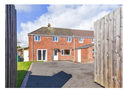
146 Cornwall Road, Tettenhall, WV6 8UZ