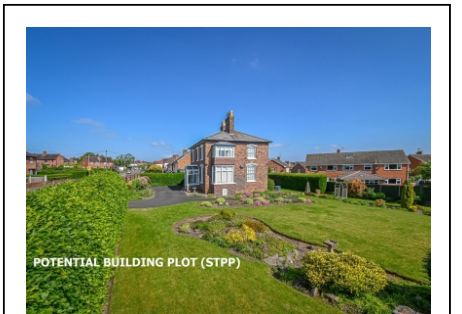
Hookfield House, 81 Victoria Road, Bridgnorth