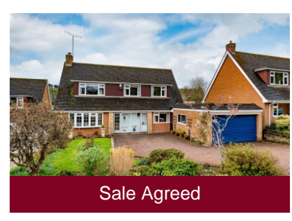
18 Quail Green, Wightwick, Wolverhampton