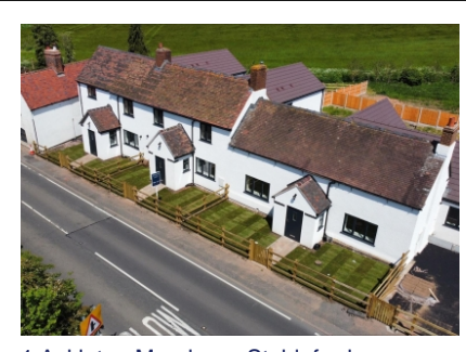
1 Ackleton Meadows, Stableford, Bridgnorth