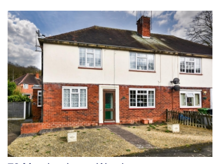
73 Meadow Lane, Wombourne, Wolverhampton