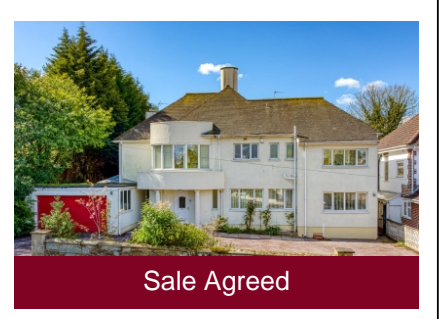
17 Muchall Road, Penn, Wolverhampton