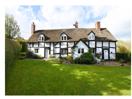
Clovers, Stableford, Bridgnorth