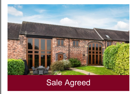
The Corn Barn, 3 East Trescott Barns Bridgnorth Road