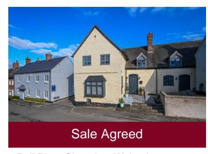
7 Bull Ring, Claverley, Wolverhampton