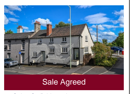
33 Salop St, Bridgnorth