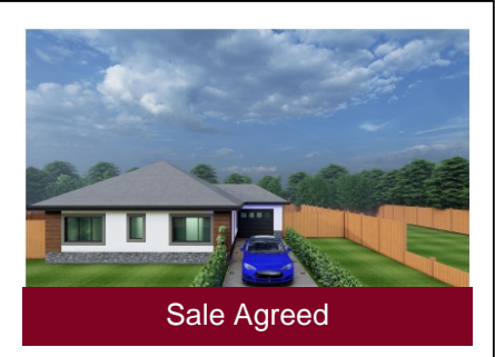
Plot 2 Hazelbrook, Hazel Lane, Great Wyrley