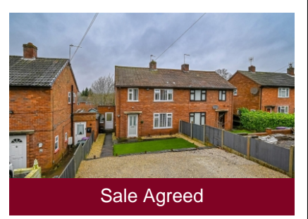
28 Lodge Lane, Bridgnorth