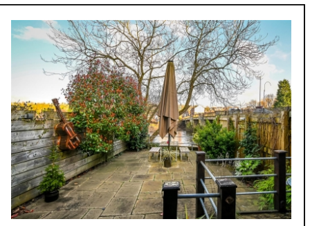
45 Cartway, Bridgnorth