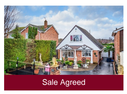
5 Bratch Common Road, Wombourne, Wolverhampton