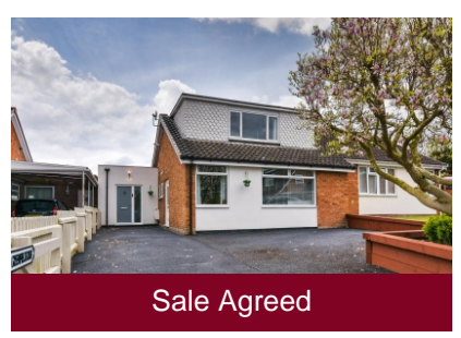
3 Greenfields Road, Wombourne, Wolverhampton