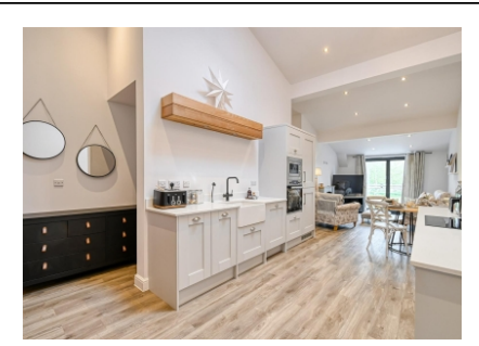
The Willow, 3 The Closes, Sutton Farm, Claverley, Wolverhampton