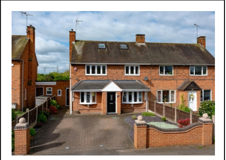
Giggetty Lane, Wombourne, Wolverhampton