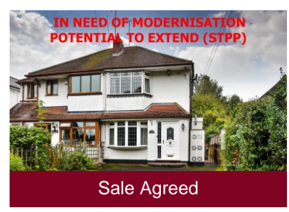
Hillcroft, Penstone Lane, Lower Penn