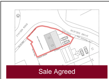
Land to the North of 15 Redford Drive, Albrighton