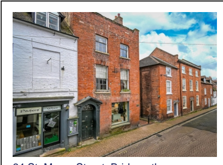
64 St. Marys Street, Bridgnorth