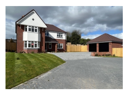
Rosewood House, 6 Rowan Grange, Broseley