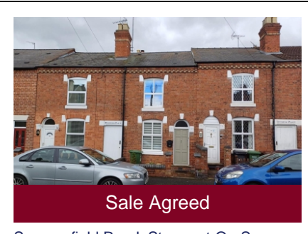
Summerfield Road, Stourport-On-Severn