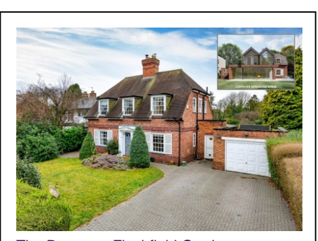
The Dormers, Finchfield Gardens, Finchfield