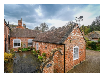
Corner House, 3 Stableford Hall, Stableford, Bridgnorth