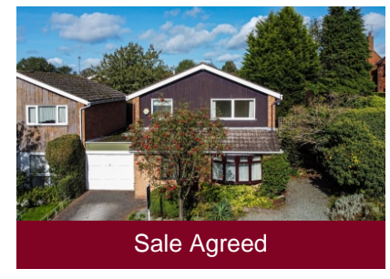
2 Beech Close, Pattingham, Wolverhampton