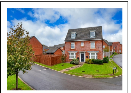
35 Chalmers Road, Baggeridge Village, Dudley