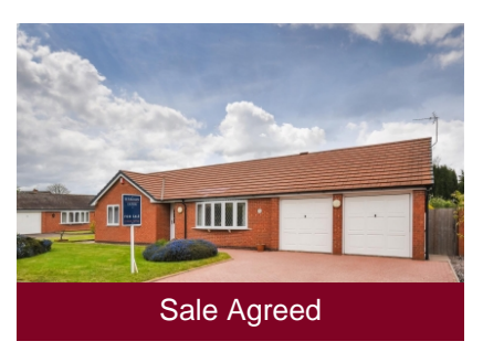
1 The Courts, Albrighton, Wolverhampton