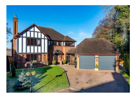
47 Fairfield Drive, Codsall, Wolverhampton