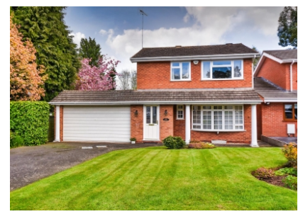
18 Fair Oak Drive, Wolverhampton