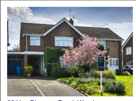
86 Van Diemans Road, Wombourne, Wolverhampton