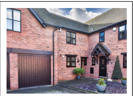
17 Bridgeman Court, Weston-Under-Lizard, Shifnal