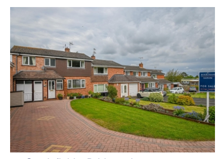
27 Castlefields, Bridgnorth