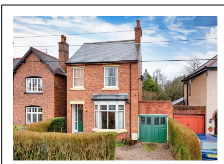
29 Walk Lane, Wombourne