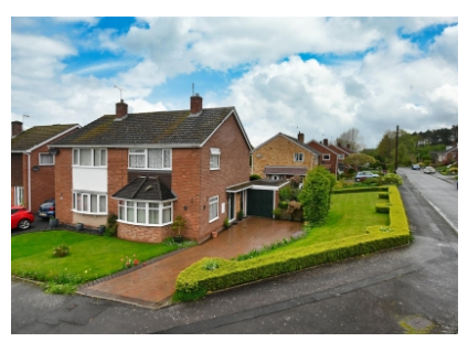
3 Hillside Avenue, Bridgnorth