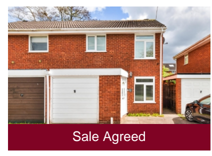
Forge Leys, Wombourne