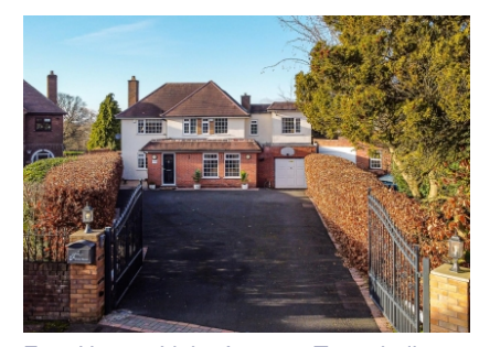
Fern House, Links Avenue, Tettenhall