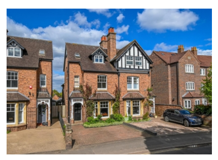
2 Westgate Villas, Salop Street, Bridgnorth