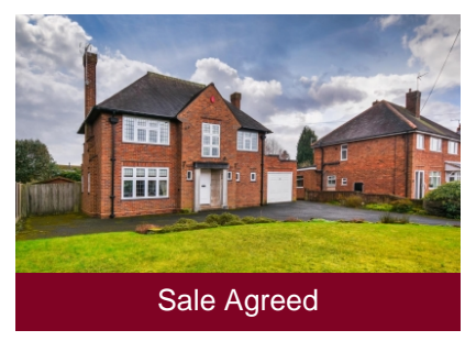
61 Brickbridge Lane, Wombourne, Wolverhampton