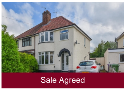
178 Marsh Lane, Fordhouses, Wolverhampton