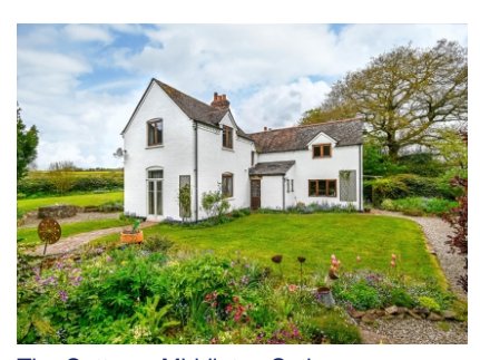
The Cottage, Middleton Scriven, Bridgnorth