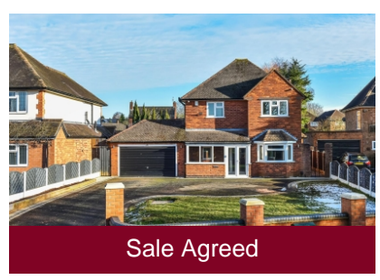
75 Yew Tree Lane, Tettenhall