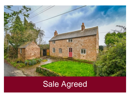
148 Broad Oak, Six Ashes