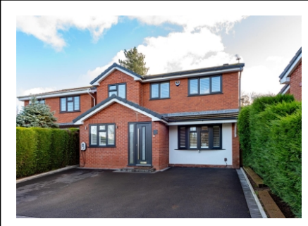
41 Ascot Drive, Dudley