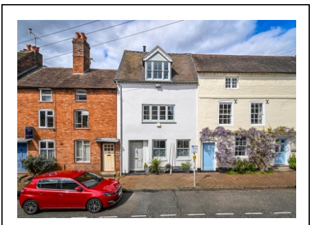
23 St Marys Street, Bridgnorth