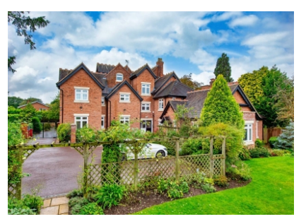
18f Southgate, Stockwell Road, Tettenhall, Wolverhampton