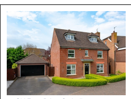
49 Old Farm Drive, Codsall, Wolverhampton. WV8 1GF