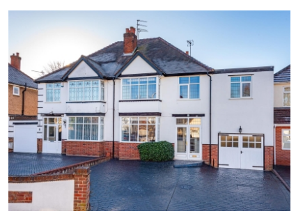
7 Osborne Road, Wolverhampton