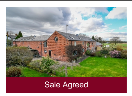
The Oak House, Oaklands Court, Lower Rudge, Pattingham