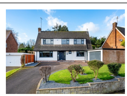
25 Perton Brook Vale, Wightwick