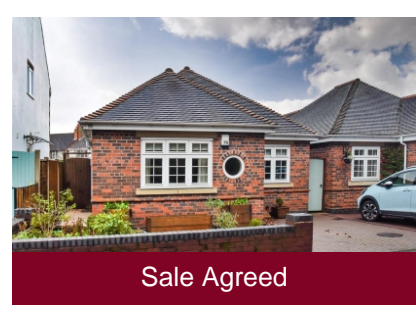
70 Finchfield Road, Wolverhampton