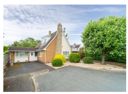
8 The Orchard, Albrighton