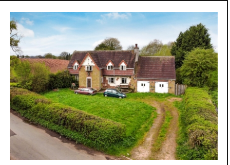
Mill Cottage, Lower Rudge, Pattingham, Wolverhampton