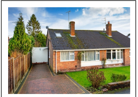
1 Norton Close, Penn, Wolverhampton