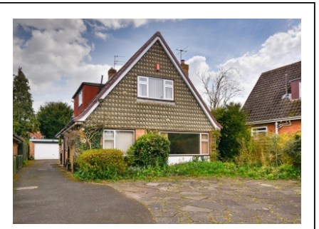
68 Mount Road, Tettenhall Wood, Wolverhampton