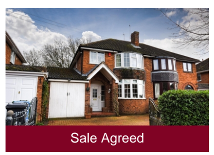
52 Wombourne Park, Wombourne, Wolverhampton