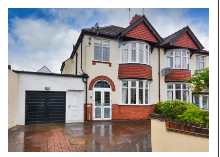
Pennhouse Avenue, Wolverhampton