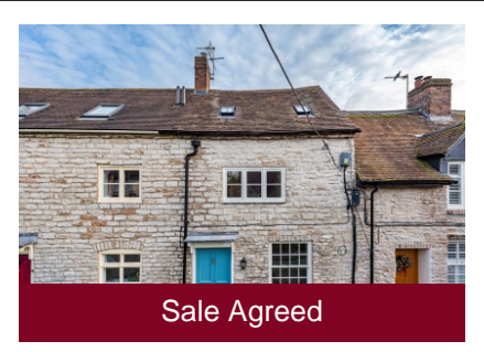
5a King Street, Much Wenlock, Shropshire