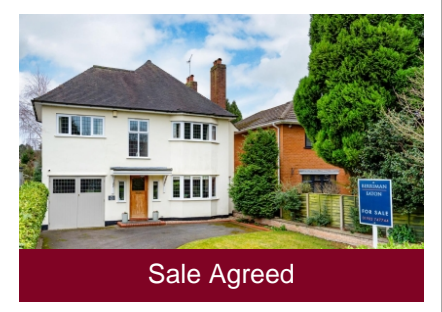
Randolph House, 55 Woodthorne Road, Wolverhampton