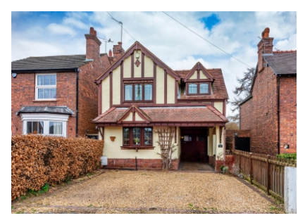
25 Walk Lane, Wombourne, Wolverhampton