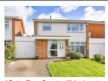
4 Forton Close, Compton, Wolverhampton