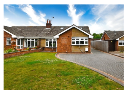
6 Lime Close, Alveley, Bridgnorth