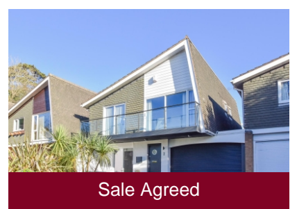
2 Cheswell Close, Compton, Wolverhampton