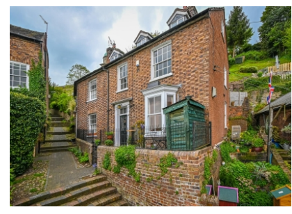
19 St. Marys Steps, Bridgnorth