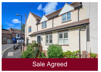
23 Pound Street, Bridgnorth