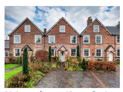
2 Labernum Cottages, Vicarage Road, Penn, Wolverhampton