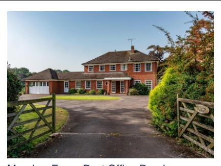
Meadow Farm, Post Office Road, Seisdon, Wolverhampton