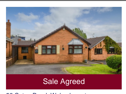
56 Coton Road, Wolverhampton