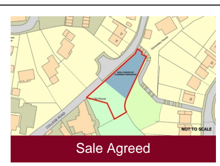
College Road, Tettenhall, Wolverhampton