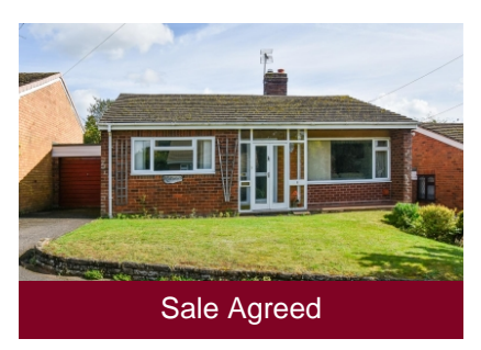
Foxcroft, 8 Fox Close, Seisdon