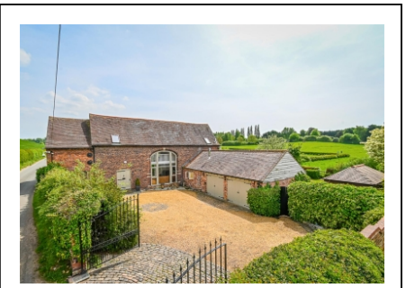
Trafalgar Barn, Worfield, Bridgnorth