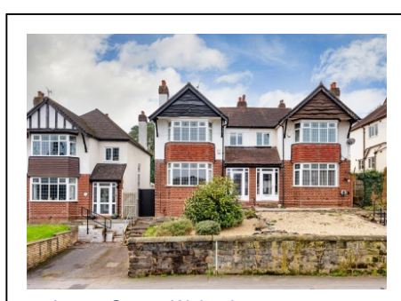
83 Lower Street, Wolverhampton