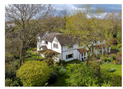
Leafields Farm, Shutt Green, Brewood, ST19 9LX