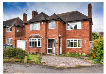
66 York Avenue, Finchfield, Wolverhampton