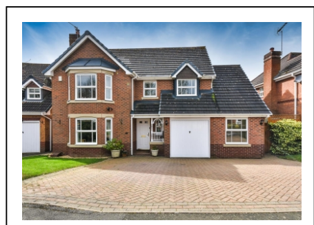
Kinloch Drive, Dudley