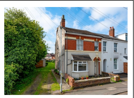
25 Newbridge Street, Newbridge, Wolverhampton, WV6 0EE