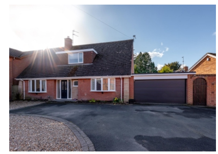
Strathmore, Shaw Lane, Albrighton