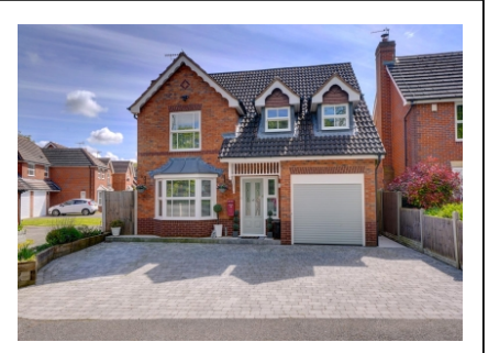
Ripley Gardens, Worcester