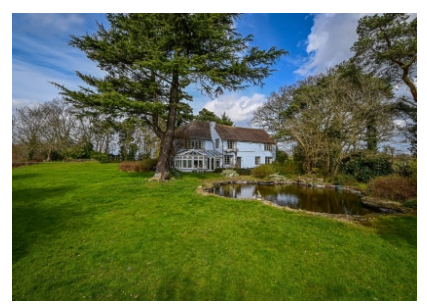
Horseshoes, Netherton, Highley, Bridgnorth