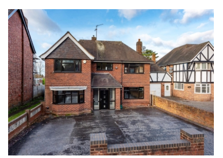
288b Penn Road, Wolverhampton