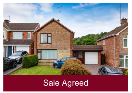
51 Strathmore Crescent, Wombourne