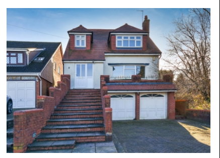
25 Bognop Road, Essington, Wolverhampton