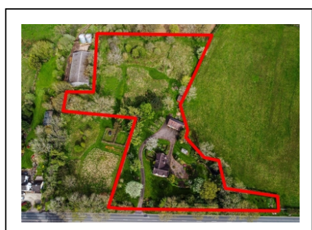
Dodds Green Cottage, 79 Dodds Green, Alveley, Bridgnorth