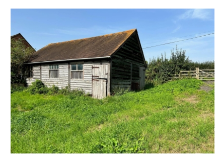
Spring Barn, Glazeley, Bridgnorth