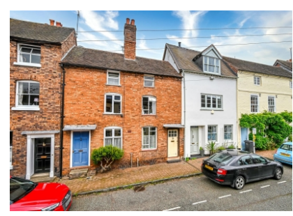
24 St. Marys Street, Bridgnorth