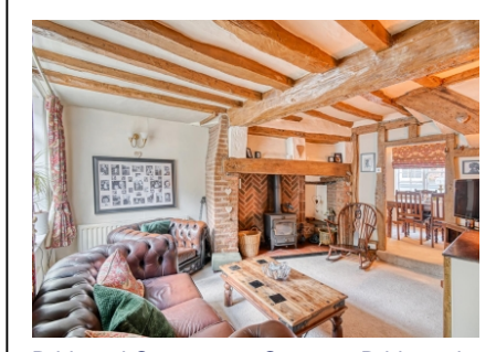
Bridgend Cottage, 43 Cartway, Bridgnorth