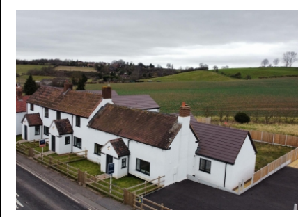
3 Ackleton Meadows, Stableford, Bridgnorth