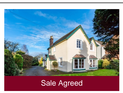
Ferndale, 7 Cross Road, Albrighton