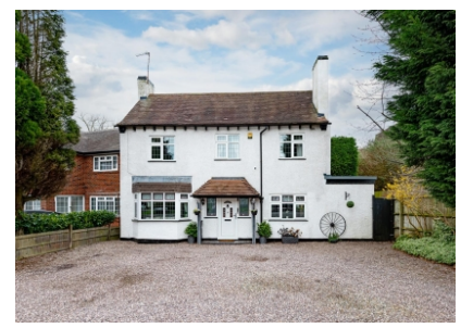
17 Stubbs Road, Wolverhampton