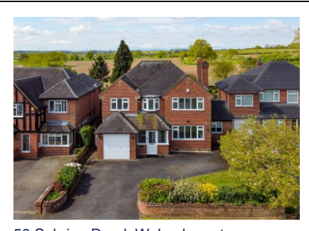
59 Sabrina Road, Wolverhampton