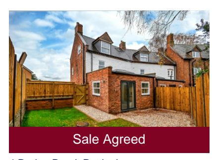
4 Rudge Road, Pattingham, Wolverhampton