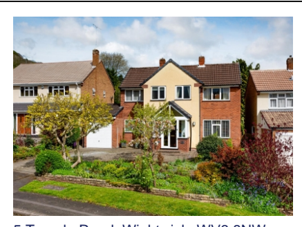
5 Torvale Road, Wightwick, WV6 8NW