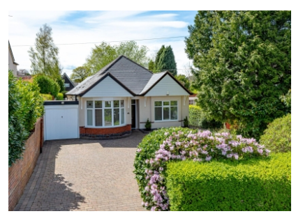
Mount Road, Penn, Wolverhampton