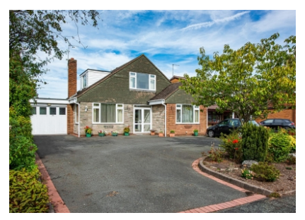
83 Cranmere Avenue, Tettenhall, Wolverhampton