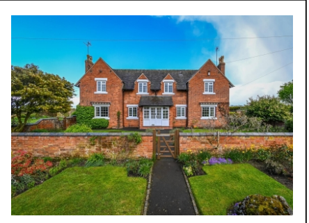
Lower Snowdon Cottage, Snowdon Road, Burnhill Green, Wolverhampton