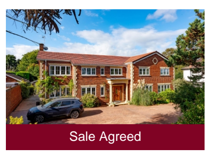
Elan Ridge. Pool House Road, Wombourne, Wolverhampton