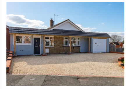
21 Uplands Drive, Wombourne, Wolverhampton