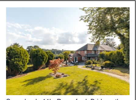
Sunnybank, 11b, Danesford, Bridgnorth