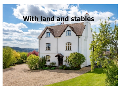
Ouseley Farm, Aston Eyre, Bridgnorth