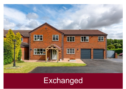
3 Mill Stream Close, Codsall, Wolverhampton