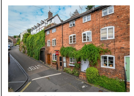
70 Cartway, Bridgnorth