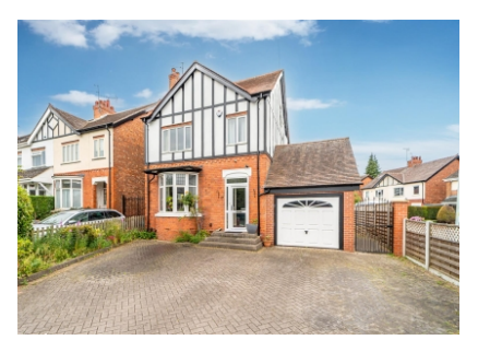
Tregunna, 27 Richmond Road, Finchfield