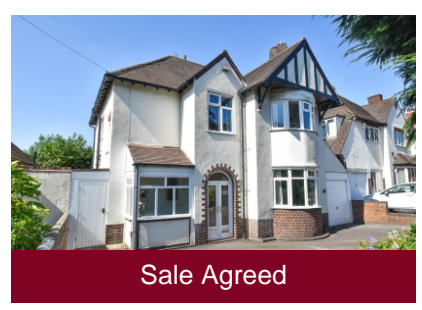
490 Penn Road, Wolverhampton