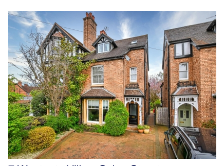
7 Westgate Villas, Salop Street, Bridgnorth