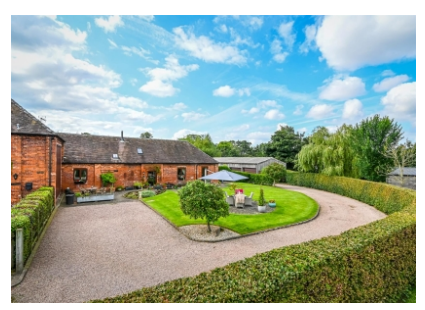
The Stables, Chesterton, Bridgnorth