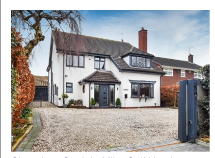
Clearview, Straight Mile, Calf Heath, Wolverhampton