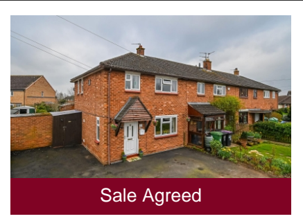
17 Racecourse Drive, Bridgnorth, Shropshire