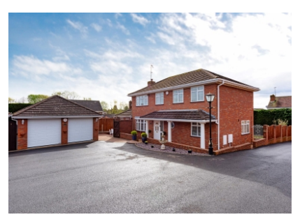
St. Johns Close, Swindon, Dudley