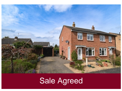
9 Wrekin Road, Bridgnorth