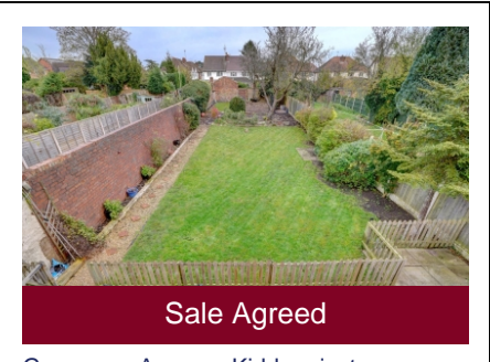
Grosvenor Avenue, Kidderminster