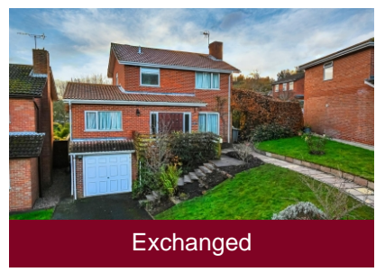
15 Bramble Ridge, Bridgnorth