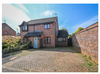
24 Wardle Close, Bridgnorth