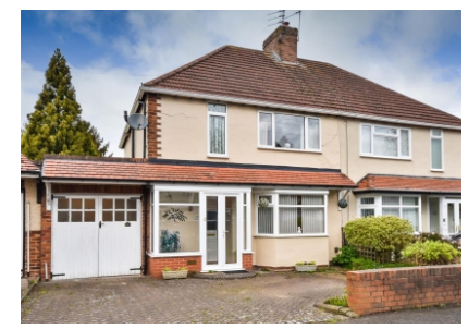
Linton Road, Wolverhampton