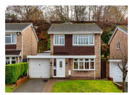
23 Redcliffe Drive, Wombourne, South Stafforshire