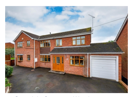
15 Ounsdale Crescent, Wombourne, Wolverhampton