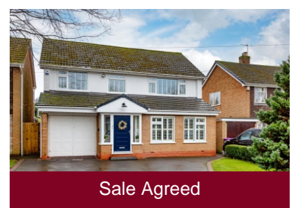
89 Redhouse Road, Tettenhall, Wolverhampton