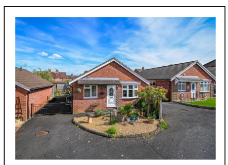
105 Hook Farm Road, Bridgnorth