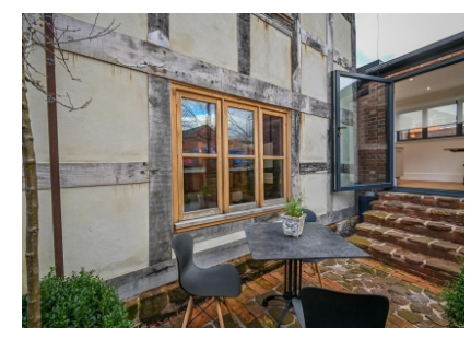
Park Cottage, Abbey Foregate, Shrewsbury