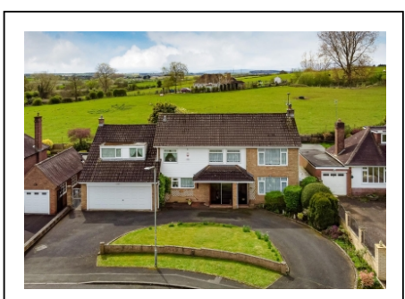
7 Wightwick Hall Road, Wightwick, WV6 8BZ