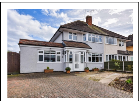
34 Delaware Avenue, Albrighton