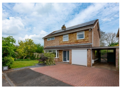
44 Romsley View, Alveley, Bridgnorth