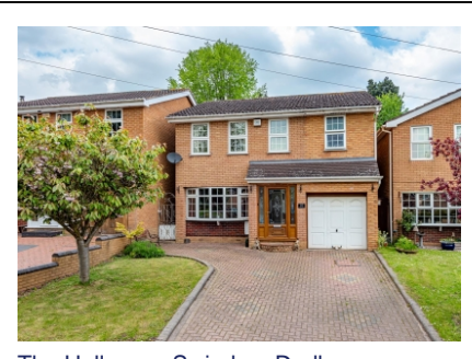
The Holloway, Swindon, Dudley