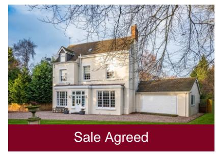
Grove House, 25 Oaken Lanes, Codsall