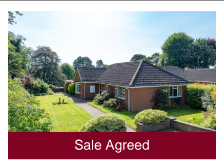
11 Compton Hill Drive, Compton, Wolverhampton