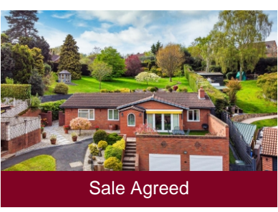
18 Bramble Ridge, Bridgnorth