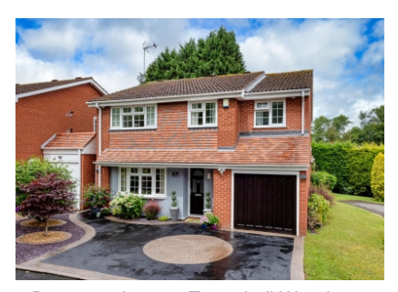
2 Brompton Lawns, Tettenhall Wood, Wolverhampton