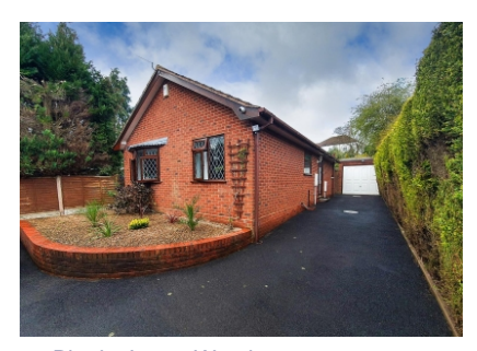
10 Planks Lane, Wombourne, Wolverhampton