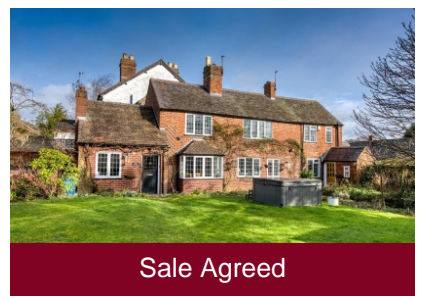
Vine Cottage, 36-38 Church Road, Codsall