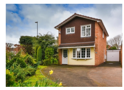
28 Quendale, Wombourne, Wolverhampton