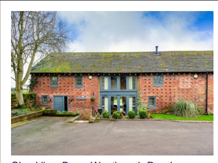
Clee View Barn, Westbeech Road, Pattingham, Wolverhampton