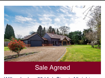
Willow Lodge, 23 High Street, Albrighton