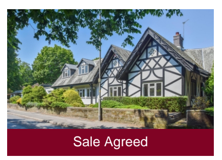
Woodhouse Lodge, Wood Road, Tettenhall Wood