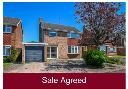
14 The Orchard, Albrighton, Wolverhampton