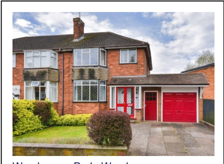
Wombourne Park, Wombourne