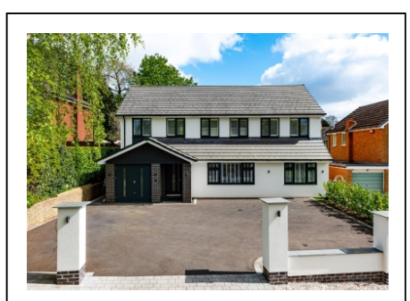
1 Chestnut Close, Codsall, WV8 2EZ