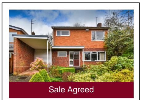
10 Ashfield Road, Compton, Wolverhampton