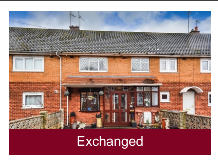
2 Woden Close, Wombourne, Wolverhampton