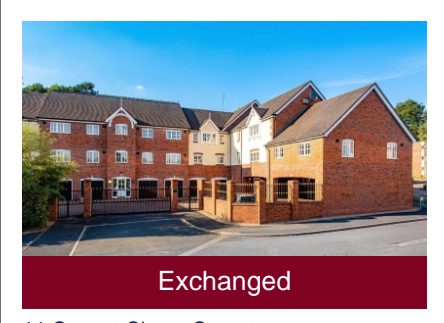
11 Cygnet Close, Compton, Wolverhampton