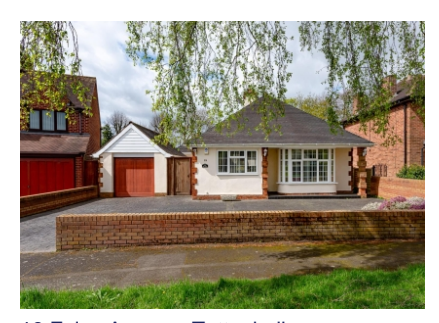
19 Foley Avenue, Tettenhall, Wolverhampton