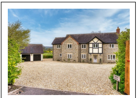
Beech House, Munslow, Shropshire