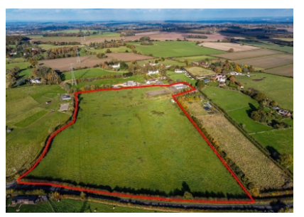
Plot of Land at Former Mill Riding Centre, Warstone Hill Road, Pattingham