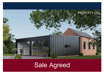
Plot 3, Bynd Lane, Billingsley, Bridgnorth