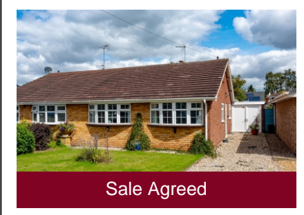
68 Clee View Road, Wombourne, Wolverhampton