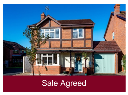
39 Penleigh Gardens, Wombourne, Wolverhampton