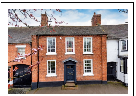
Saredon House, 28 Stafford Street, Brewood