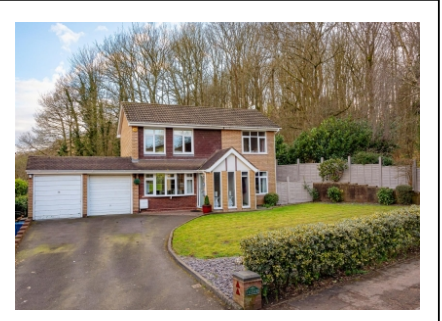
Wychaven, The Holloway, Swindon, Dudley