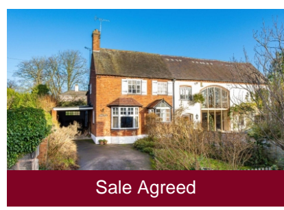
Newport House, 28 Newport Street, Brewood