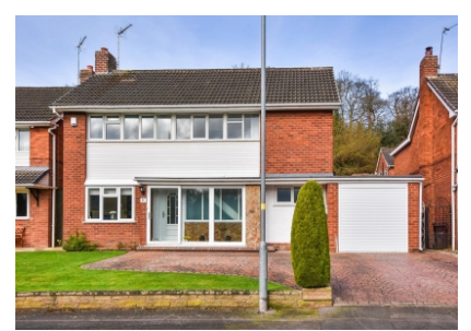
97 Henwood Road, Compton, Wolverhampton