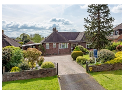
53 Conduit Lane, Bridgnorth