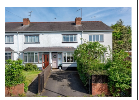
Planks Lane, Wombourne, Wolverhampton