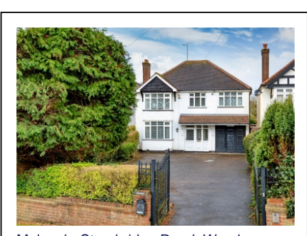
Maleesh, Stourbridge Road, Wombourne