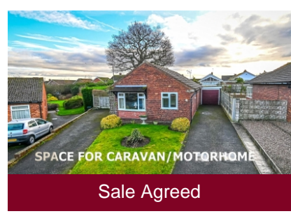
51 Linley View Drive, Bridgnorth