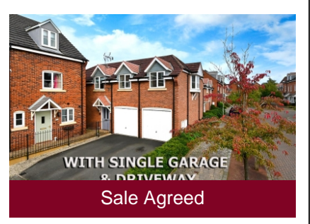
14 Rastrick Close, Bridgnorth