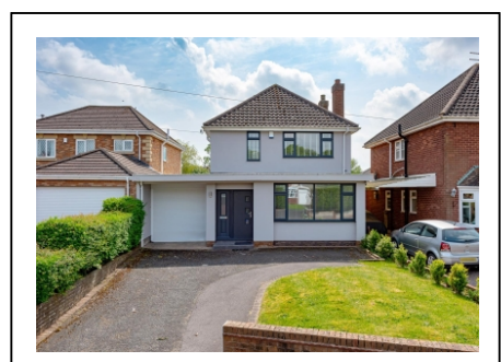
46 Wood Road, Codsall, Wolverhampton, WV8 1DN