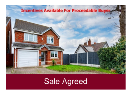
151 Tipton Road, Woodsetton, Dudley