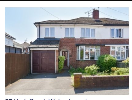
57 York Road, Wolverhampton