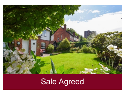
29 Bath Avenue, Wolverhampton