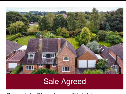
Rossleigh, Shaw Lane, Albrighton