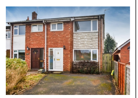
99 Hazel Grove, Wombourne, Wolverhampton