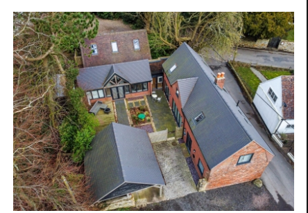
The Old Coach House, Little Wenlock, Telford