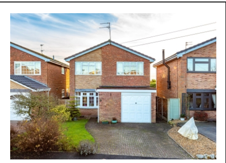
3 Braemar Road, Pattingham, Wolverhampton