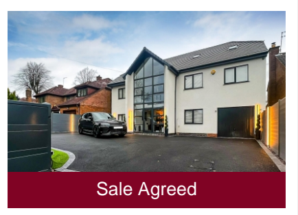
14 Lothians Road, Stockwell End