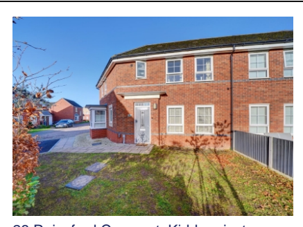
26 Rainsford Crescent, Kidderminster