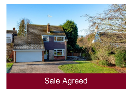
5 Post Office Road, Seisdon, Wolverhampton