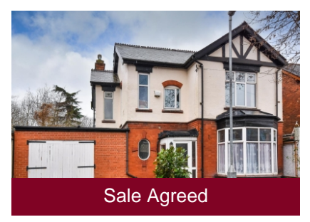
18 Elm Avenue, Bilston, Wolverhampton