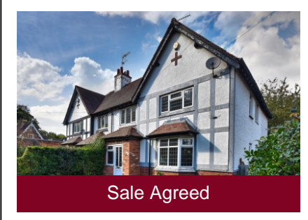
2 Danescourt Cottages, Danescourt Road, Tettenhall