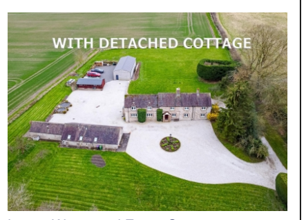
Lower Westwood Farm, Stretton Westwood, Much Wenlock