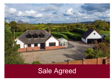
Rosebank, Ebstree Road, Seisdon, Nr Wolverhampton