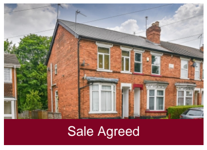
299 & 299a Hordern Road, Whitmore Reans