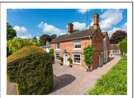
Beckbury House, Beckbury, Shifnal