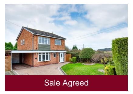
29 Windsor Road, Pattingham, Wolverhampton