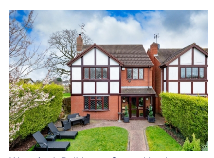
Waterford, Ball Lane, Coven Heath, Wolverhampton