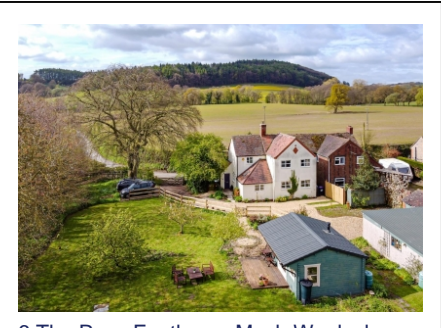
6 The Row, Easthope, Much Wenlock