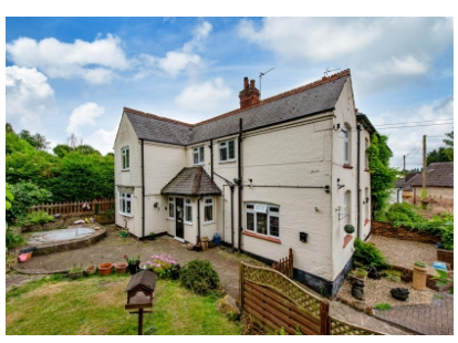
1 & 2 New Cottages, Oaken Lane, Oaken