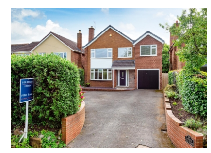
18 Rudge Road, Pattingham, Wolverhampton