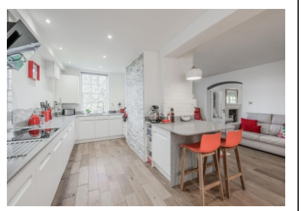
4 Stanmore Mews, Stourbridge Road, Stanmore, Bridgnorth