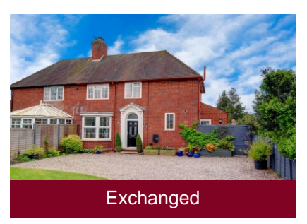
Bromyard road, Worcester