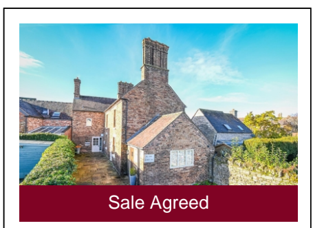
The Forge, 13 St. Marys Lane, Much Wenlock