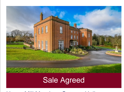
Upper Mill Meadow, Gatacre Hall, Gatacre, Claverley, Wolverhampton