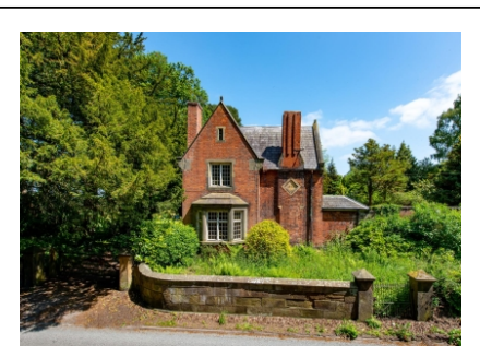
Wergs Hall Gardens, Wergs Hall Road, Tettenhall