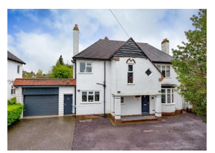
61 Codsall Road, Tettenhall, WV6 9QG