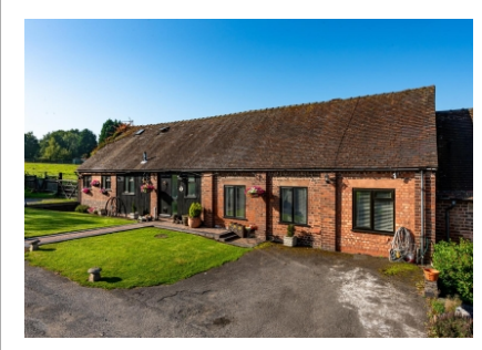
Barn End, Codsall Road, Palmers Cross, Wolverhampton