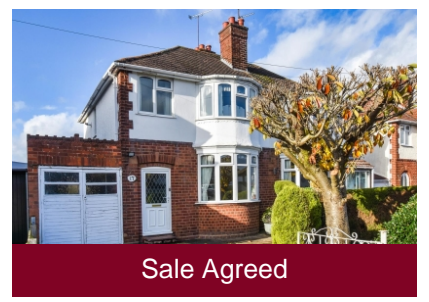
17 Fairview Road, Penn, Wolverhampton