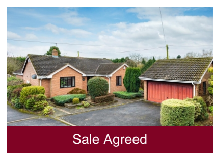
Shadowbrook, 4 Manor Fold, Middle Lane, Oaken