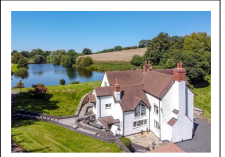
Hem Mill, The Hem, Shifnal