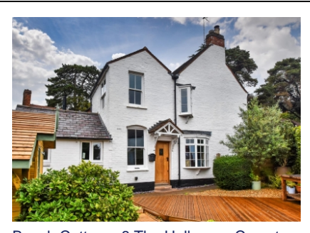
Beech Cottage, 8 The Holloway, Compton