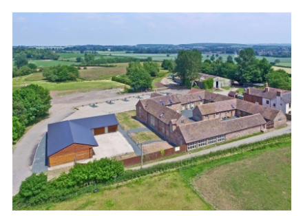
Saxon Meadow Cottage 5, The Wyke, Shifnal