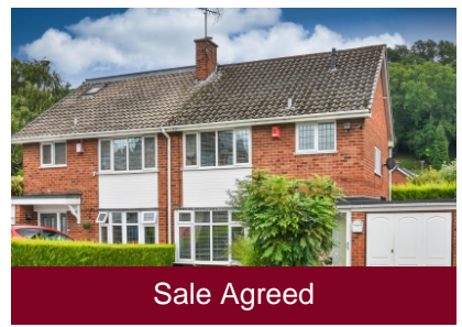
23 Chequers Avenue, Wombourne, Wolverhampton