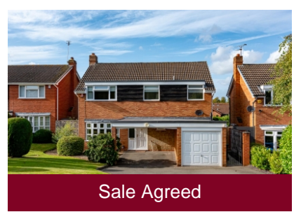
11 Copper Beech Drive, Wombourne, Wolverhampton