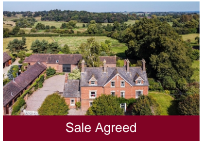
Roughton Farmhouse, Roughton, Bridgnorth