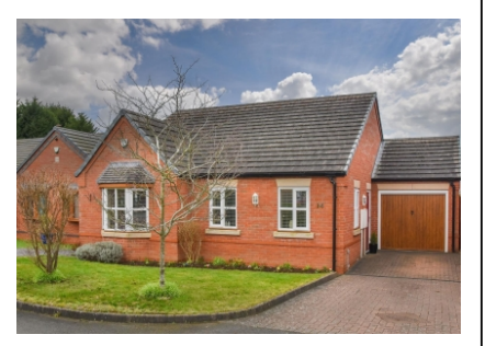
14 Berkeley Close, Perton, Wolverhampton