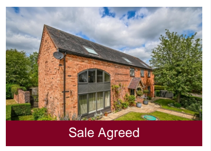
1 The Paddock, Claverley, Wolverhampton