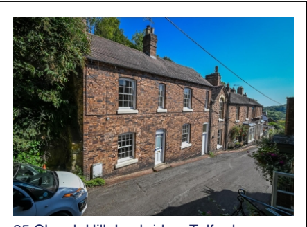
25 Church Hill, Ironbridge, Telford