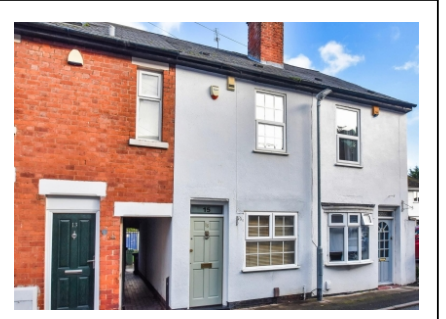
15 Nursery Walk, Tettenhall, Wolverhampton