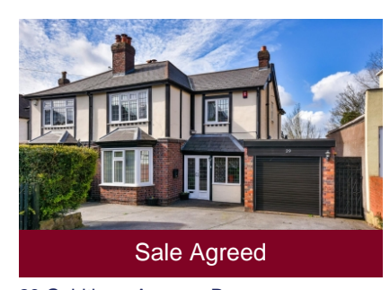
29 Goldthorn Avenue, Penn, Wolverhampton