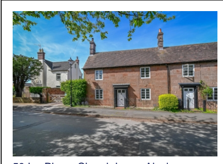
50 Ivy Place, Church Lane, Alveley, Bridgnorth