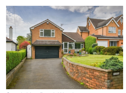
Stourbridge Road, Wombourne, Wolverhampton