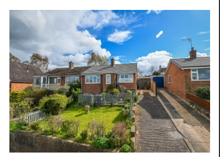
24 Greenfields Road, Bridgnorth