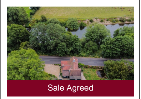
Holme Cottage, Knowle Sands, Bridgnorth