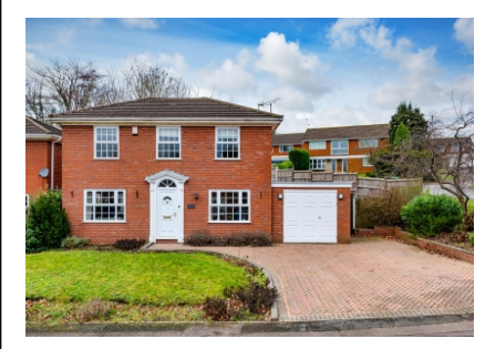
2 Heath House Drive, Wombourne, Wolverhampton