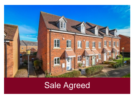
75 Rastrick Close, Bridgnorth