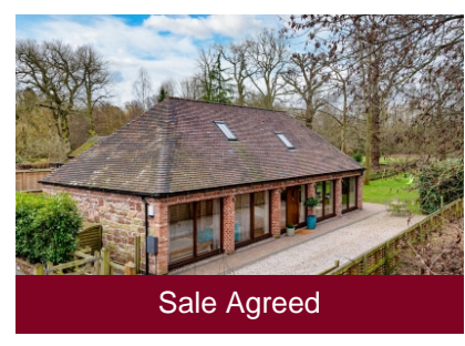
Eagle Barn, 4 Patshull Gardens, Albrighton