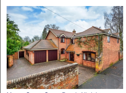
Manor Court, Cross Road, Albrighton, Wolverhampton