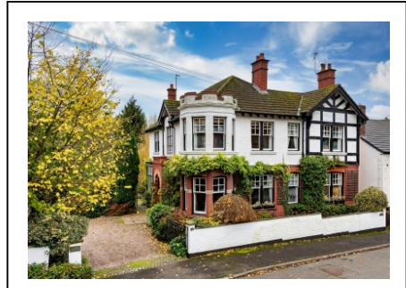
Battlefield House, 14 Battlefield Hill, Wombourne, Wolverhampton