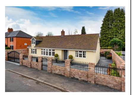
4 Mayfield Road, Albrighton, WV7 3JY