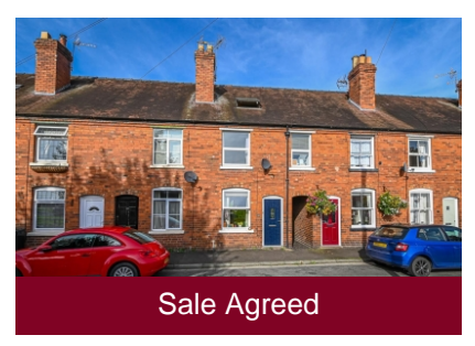
29 Severn Street, Bridgnorth