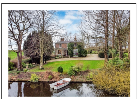
The Mill House, Badger, Wolverhampton