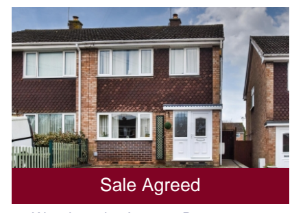
61 Wynchcombe Avenue, Penn, Wolverhampton