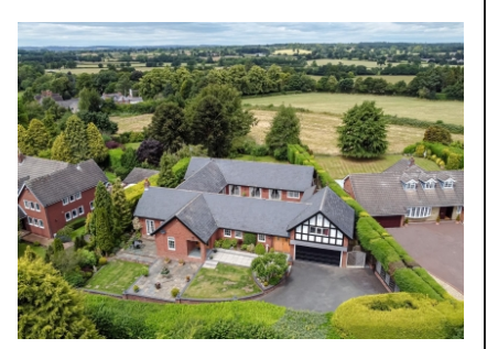
Courtneys, Oaken Drive, Oaken, Codsall