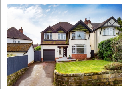
3 Lothians Road, Tettenhall, Wolverhampton