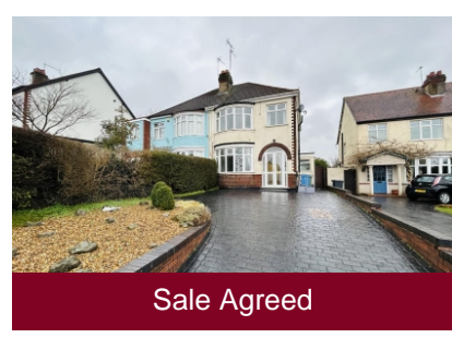
31 Sedgley Road, Penn Common, Penn