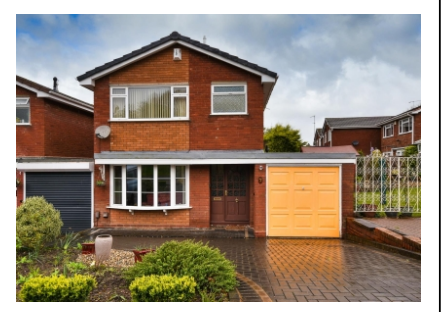
7 Marlborough Gardens, Newbridge, Wolverhampton