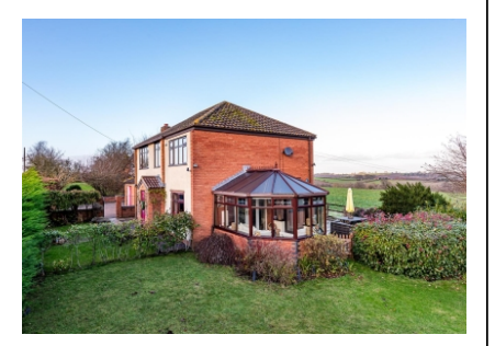
Longmoor House, Billingsley, Bridgnorth