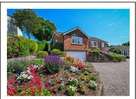
Three Ridges, Hilton, Bridgnorth