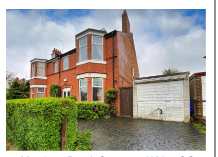
26 Marchant Road, Compton, WV3 9QG