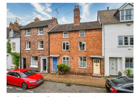
25 St. Marys Street, Bridgnorth