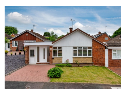
4 Mayfair Close, Albrighton, Wolverhampton