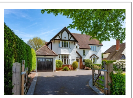
5 Coppice Road, Finchfield, Wolverhampton, WV3 8BJ