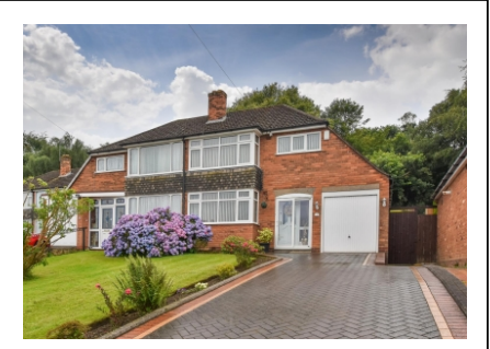
4 Chase View, Ettingshall Park, Wolverhampton