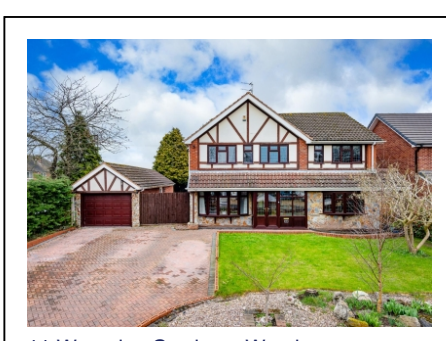
11 Waverley Gardens, Wombourne, Wolverhampton