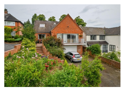
The Tyning, Westgate Drive, Bridgnorth