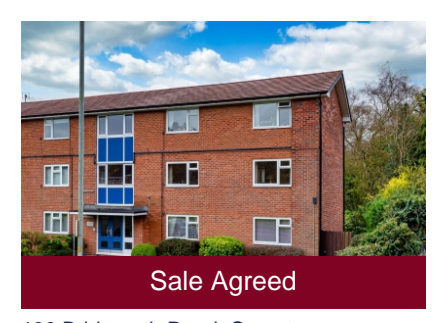
139 Bridgnorth Road, Compton, Wolverhampton