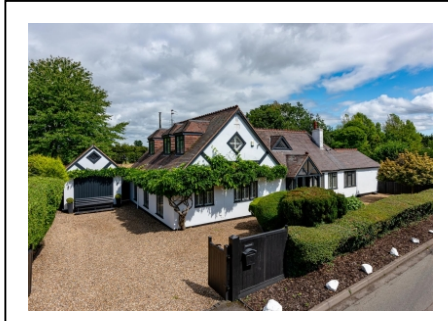
Pennygate, Paradise Lane, Slade Heath, Wolverhampton