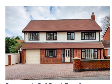
Ravenscroft, Bell Road, Trysull, Wolverhampton