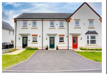
9 Narburgh Place, Alveley, Bridgnorth