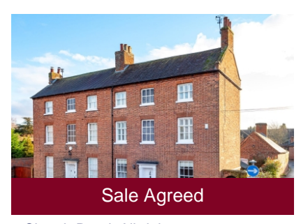
4 Church Road, Albrighton, Wolverhampton