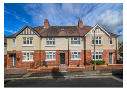
2 Cliff Gardens, Cliff Road, Bridgnorth