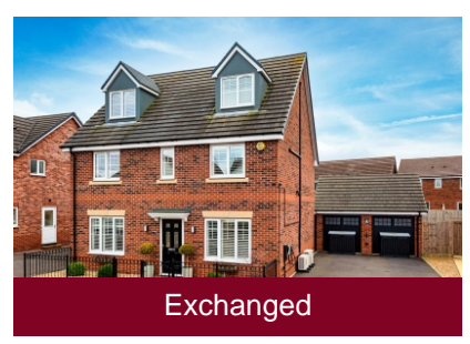
43 Farran Drive, Codsall, Wolverhampton