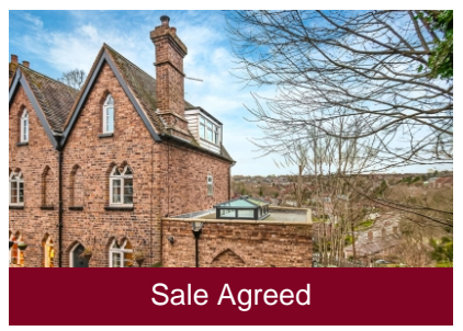
14 West Castle Street, Bridgnorth