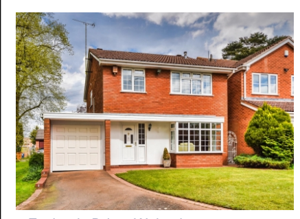
1 Foxlands Drive, Wolverhampton