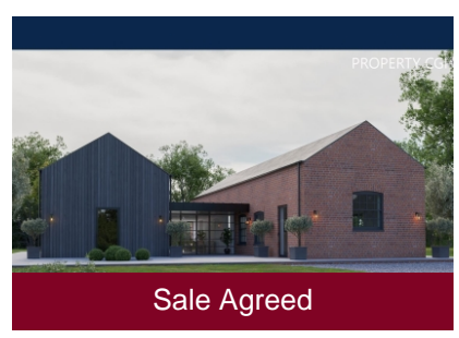
Plot 2, Bynd Lane, Billingsley, Bridgnorth