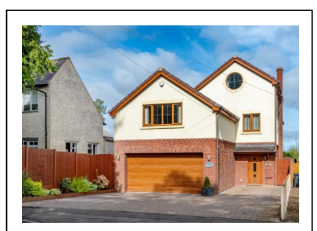
Mimosa Lodge, Histons Hill, Codsall