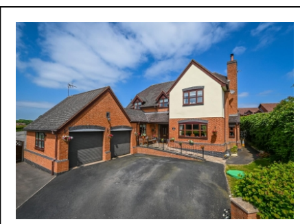
Cape Lodge, Billingsley, Bridgnorth