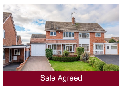
14 Chequers Avenue, Wombourne, Wolverhampton