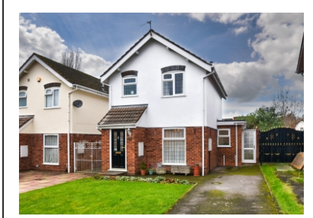
8 Laburnum Street, Wolverhampton