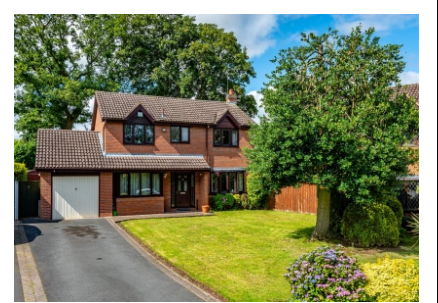
South View Close, Codsall, Wolverhampton