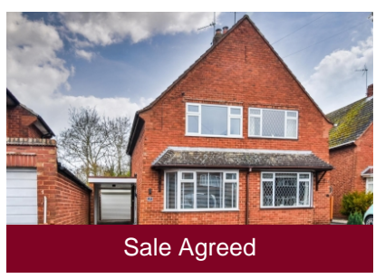
25 Bramber Drive, Wombourne, Wolverhampton