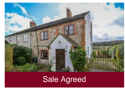
1 The Row, Easthope, Much Wenlock