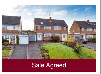
44 Common Road, Wombourne, Wolverhampton