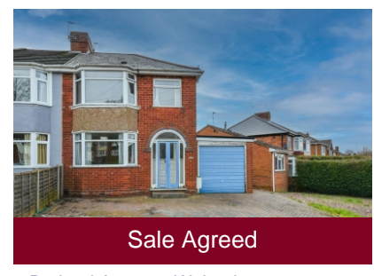
1 Rutland Avenue, Wolverhampton