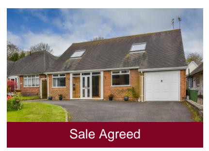
38 Foley Avenue, Tettenhall, Wolverhampton