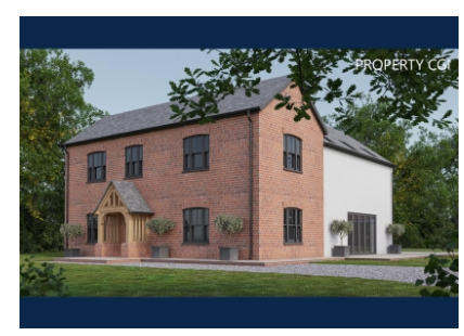
Plot 1, Bynd Lane, Billingsley, Bridgnorth