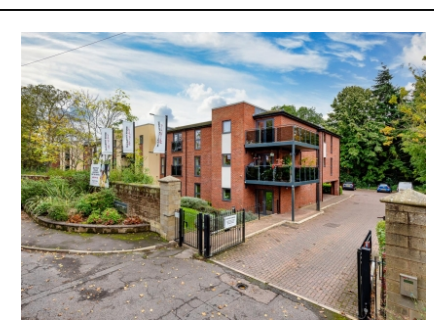
6 Thorneycroft, Wood Road, Tettenhall