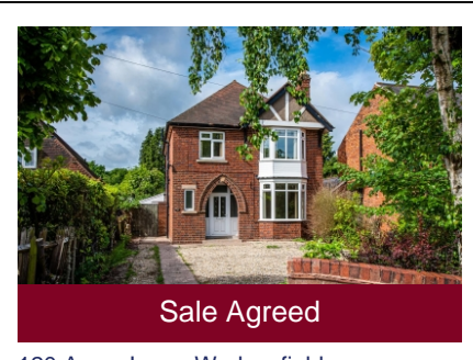
120 Amos Lane, Wednesfield