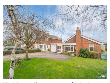
Madeira, 45 Keepers Lane, Codsall, Wolverhampton