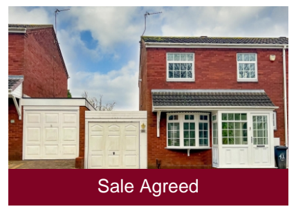
14 St James Street, Lower Gornal, Dudley