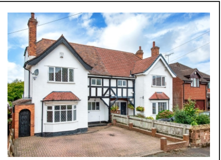
23 Hinckes Road, Tettenhall, Wolverhampton