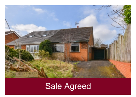
31 Bull Meadow Lane, Wombourne, Wolverhampton