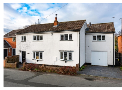
109 Rookery Road, Wombourne, Wolverhampton