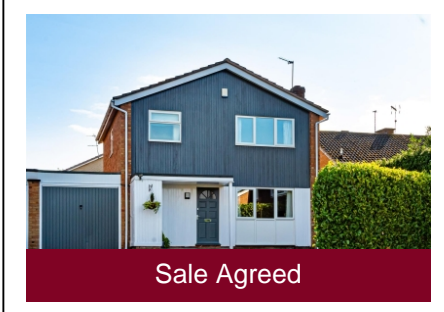
4 Beech Close, Pattingham, Wolverhampton