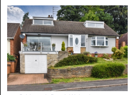
142 Bridgnorth Road, Wolverhampton