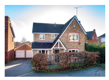
17 Holendene Way, Wombourne, Wolverhampton