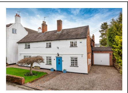
Garden Cottage, 4 Shop Lane, Brewood