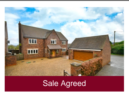
Faintree Heights, Faintree, Bridgnorth