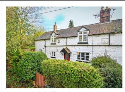
146 Broad Oak, Six Ashes