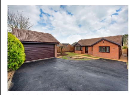
3 Montford Grove, Sedgley, Dudley