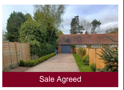
The Bungalow, Popes Lane, Wergs, Tettenhall