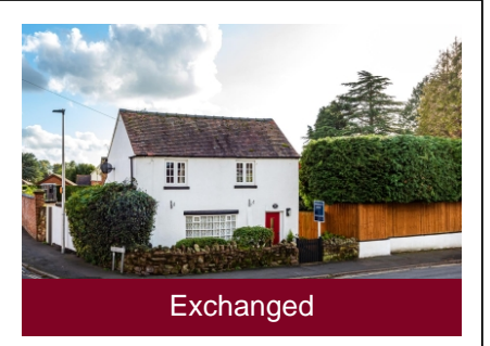
Station Cottage, 58 Station Road, Albrighton