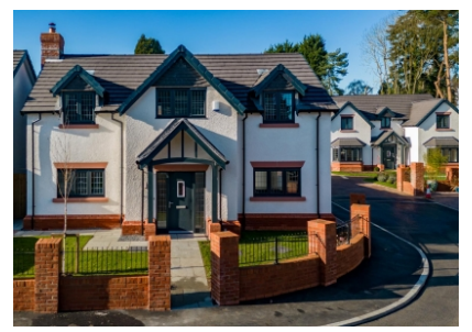
Alder House, Popes Lane, Tettenhall