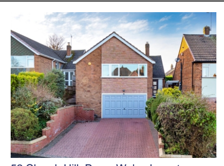
52 Church Hill, Penn, Wolverhampton