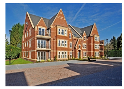
5 Ellen Place, Henry Fowler Drive, Tettenhall