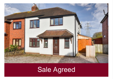
44 Market Lane, Lower Penn, Wolverhampton