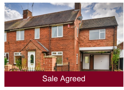
13 Grange Road, Albrighton, Wolverhampton