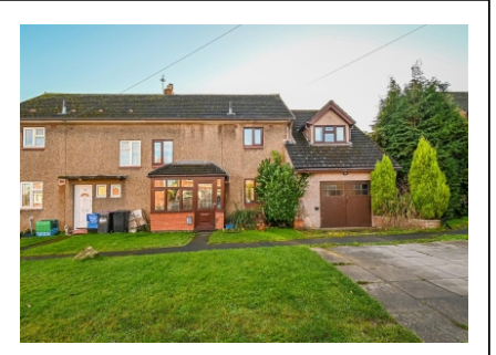
74 The Hobbins, Bridgnorth