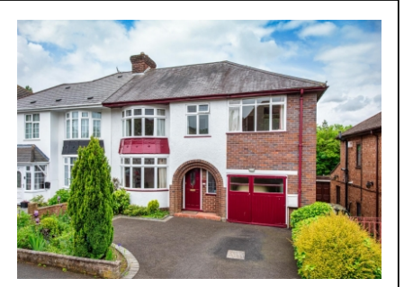
49 Canterbury Road, Penn, Wolverhampton