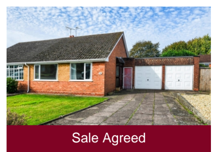
10 Gardeners Way, Wombourne, Wolverhampton