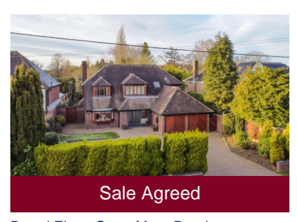
Broad Elms, Great Moor Road, Pattingham