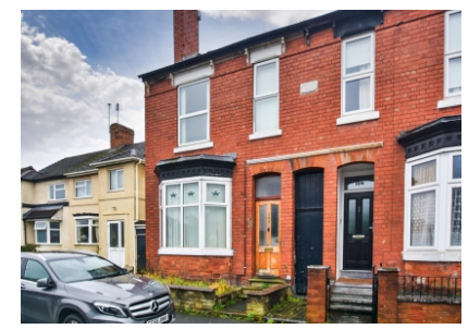
166 Crowther Road, Wolverhampton