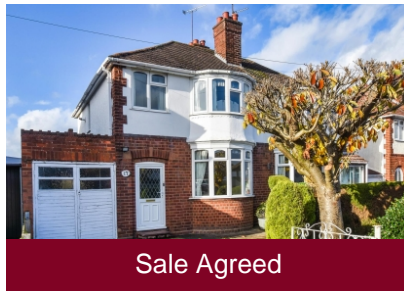
17 Fairview Road, Penn, Wolverhampton