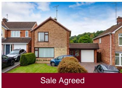
51 Strathmore Crescent, Wombourne