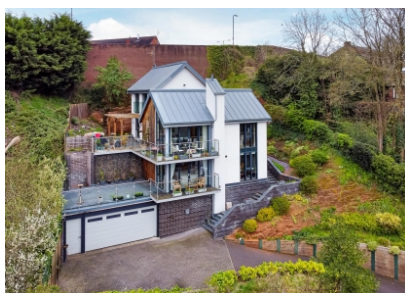
Hawthorn View, Hollybush Road, Bridgnorth