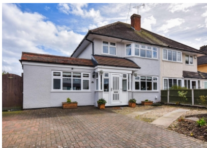
34 Delaware Avenue, Albrighton