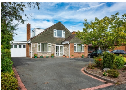
83 Cranmere Avenue, Tettenhall, Wolverhampton