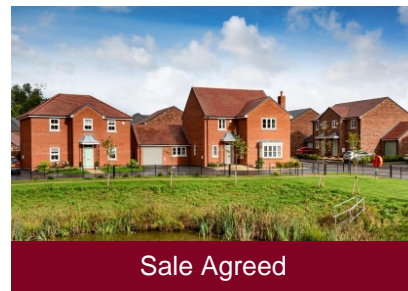
1 Millfield Road, Albrighton, Wolverhampton