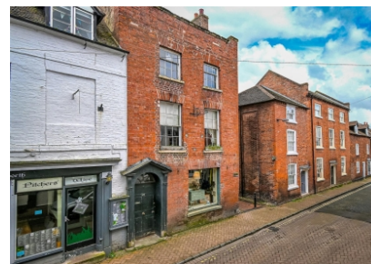
64 St. Marys Street, Bridgnorth