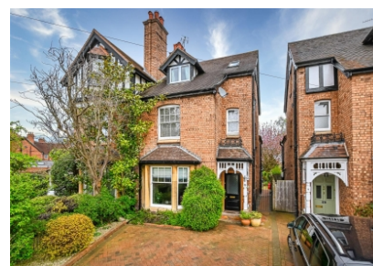
7 Westgate Villas, Salop Street, Bridgnorth