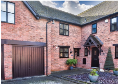
17 Bridgeman Court, Weston-Under-Lizard, Shifnal