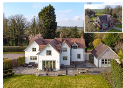
Oaklea and The Cottage, Damson Lane, Weston Heath, Shifnal