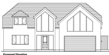
38 Cranmere Avenue, Tettenhall, Wolverhampton