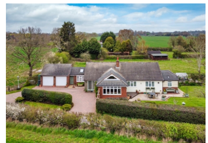
Holly Lodge, Church Lane, Boningale, Albrighton