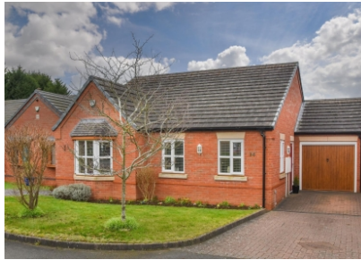
14 Berkeley Close, Perton, Wolverhampton