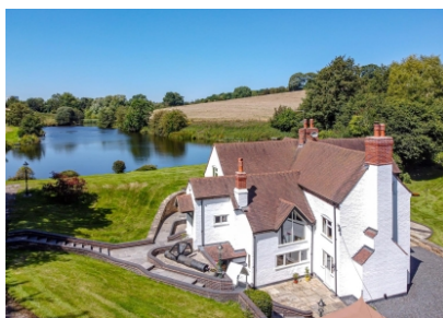
Hem Mill, The Hem, Shifnal