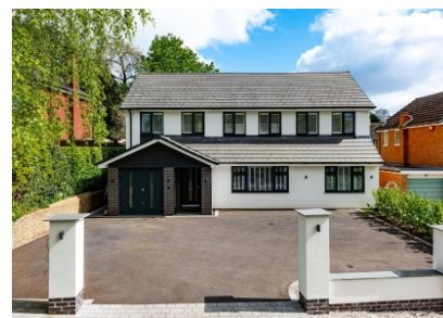
1 Chestnut Close, Codsall, WV8 2EZ