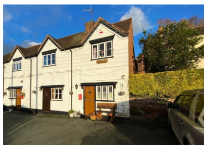
26c Bernards Hill, Bridgnorth