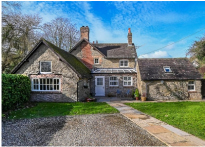
Brookside, Brockton, Much Wenlock