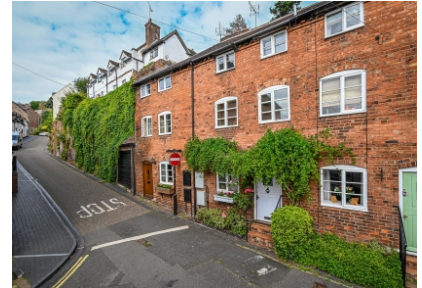
70 Cartway, Bridgnorth