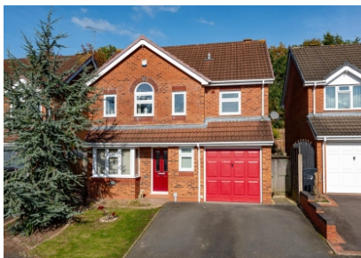
12 Dudmaston Way, Milking Bank, Dudley