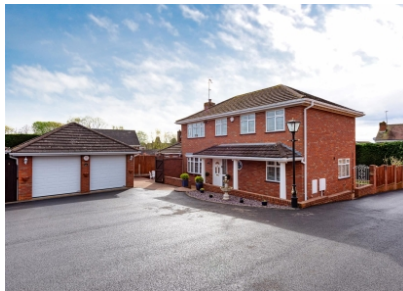
St. Johns Close, Swindon, Dudley