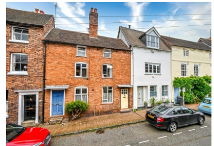
24 St. Marys Street, Bridgnorth