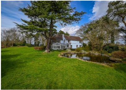
Horseshoes, Netherton, Highley, Bridgnorth