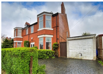
26 Marchant Road, Compton, WV3 9QG