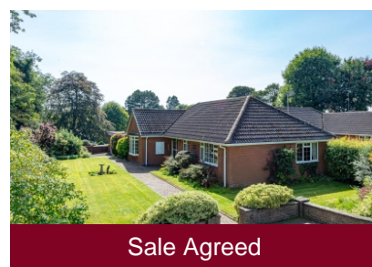
11 Compton Hill Drive, Compton, Wolverhampton