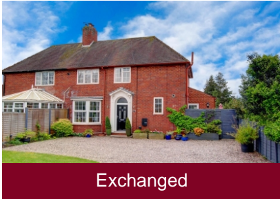
Bromyard road, Worcester