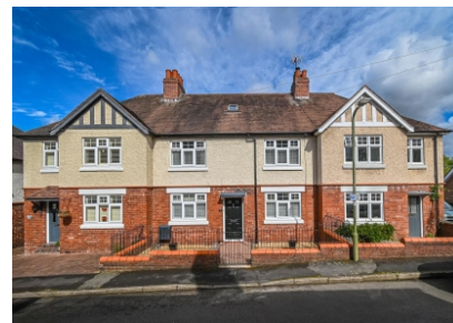
2 Cliff Gardens, Cliff Road, Bridgnorth