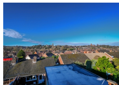
5 River View, Bridgnorth