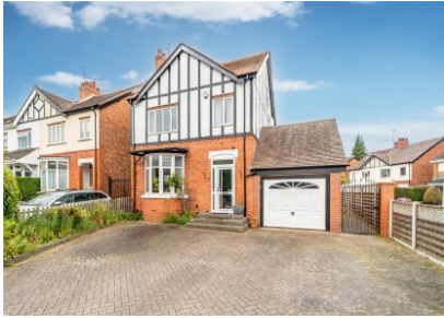
Tregunna, 27 Richmond Road, Finchfield