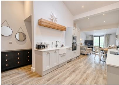
The Willow, 3 The Closes, Sutton Farm, Claverley, Wolverhampton