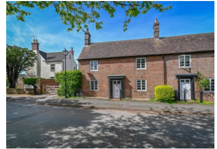
50 Ivy Place, Church Lane, Alveley, Bridgnorth