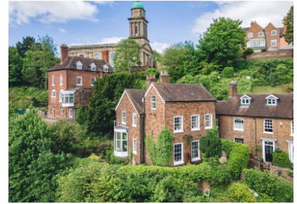
Castle Cliffe House, 24 St. Mary's Steps, Bridgnorth