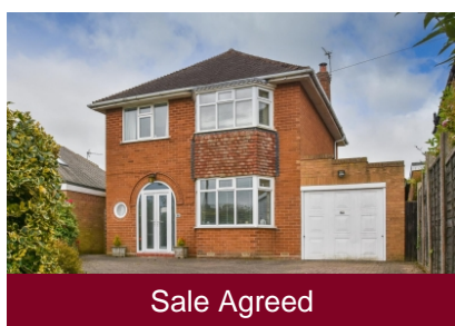
68 Clive Road, Pattingham, Wolverhampton