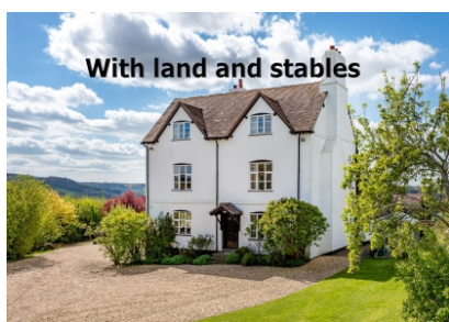
Ouseley Farm, Aston Eyre, Bridgnorth