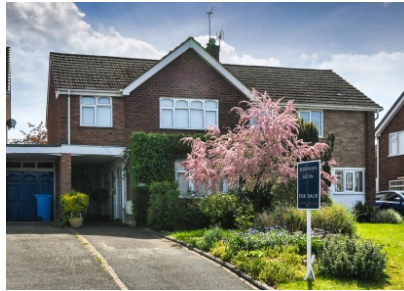
86 Van Diemens Road, Wombourne, Wolverhampton