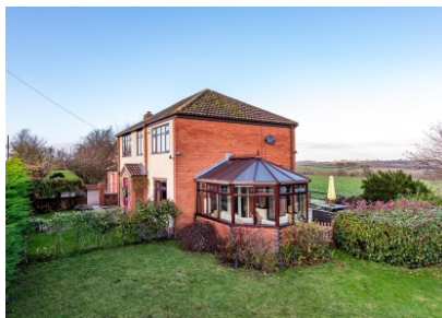
Longmoor House, Billingsley, Bridgnorth