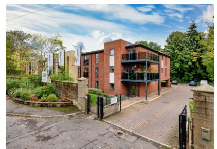
6 Thorneycroft, Wood Road, Tettenhall