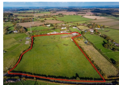
Plot of Land at Former Mill Riding Centre, Warstone Hill Road, Pittingham