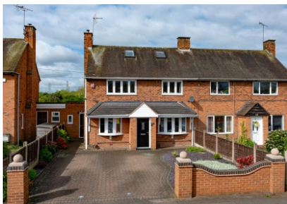
Giggetty Lane, Wombourne, Wolverhampton