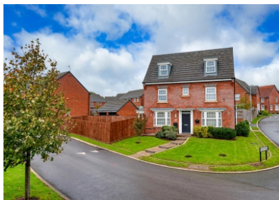
35 Chalmers Road, Bagderidge Village, Dudley