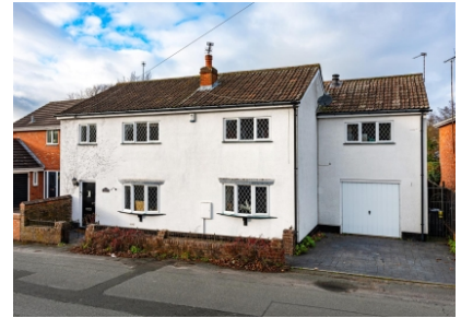
109 Rookery Road, Wombourne, Wolverhampton