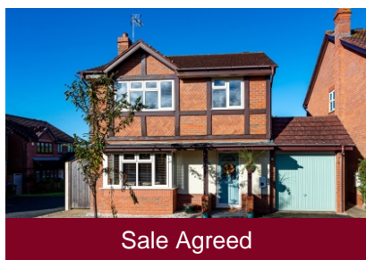
39 Penleigh Gardens, Wombourne, Wolverhampton