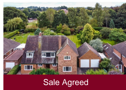
Rossleigh, Shaw Lane, Albrighton