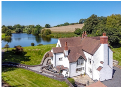
Hem Mill, The Hem, Shifnal