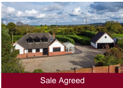
Rosebank, Ebstree Road, Seisdon, Nr Wolverhampton