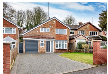
3 St. Marys Close, Dudley