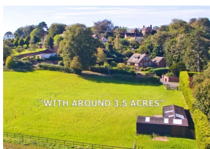
Half Acre House, Stableford, Bridgnorth