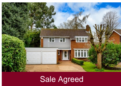
1 Mountwood Covert, Tettenhall Wood, Wolverhampton