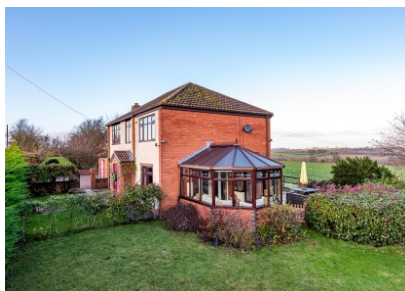
Longmoor House, Billingsley, Bridgnorth