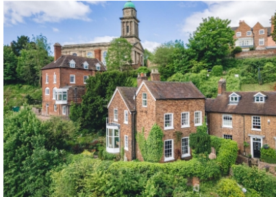
Castle Cliffe House, 24 St. Mary's Steps, Bridgnorth