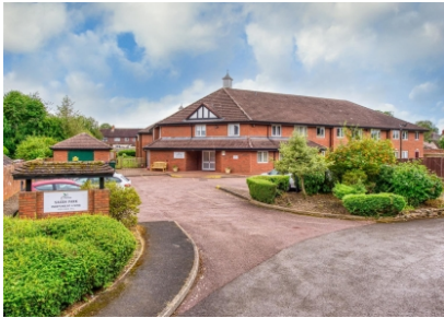
13 Saxon Park, High Street, Albrighton, Wolverhampton