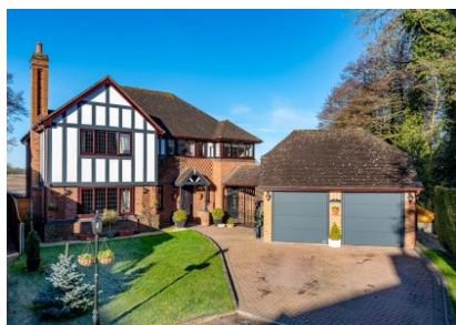
47 Fairfield Drive, Codsall, Wolverhampton