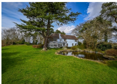
Horseshoes, Netherton, Highley, Bridgnorth