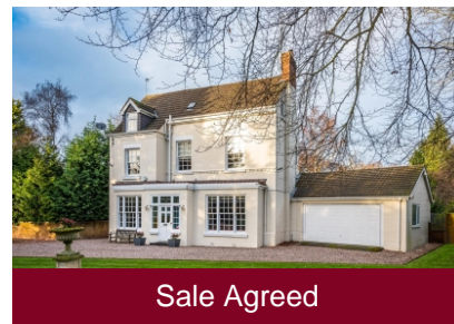
Grove House, 25 Oaken Lanes, Codsall