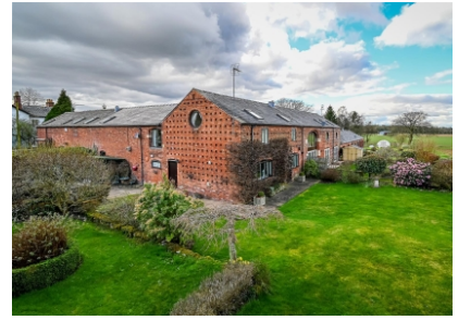
The Oak House, Oaklands Court, Lower Rudge, Pattingham