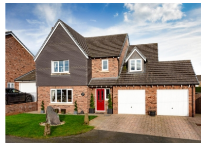
41 Kings Road, Calf Heath, Wolverhampton