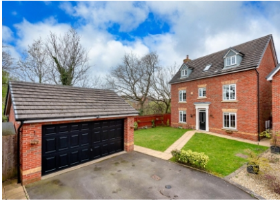
Oaklands, Wombourne, Wolverhampton