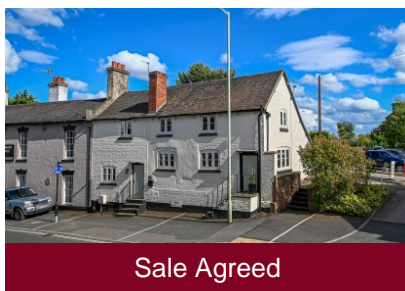
33 Salop St, Bridgnorth