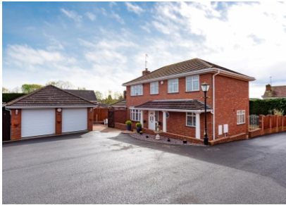
St. Johns Close, Swindon, Dudley