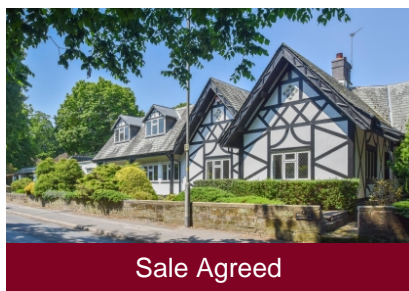
Woodhouse Lodge, Wood Road, Tettenhall Wood