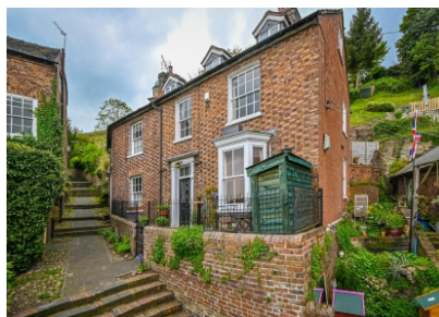
19 St. Marys Steps, Bridgnorth