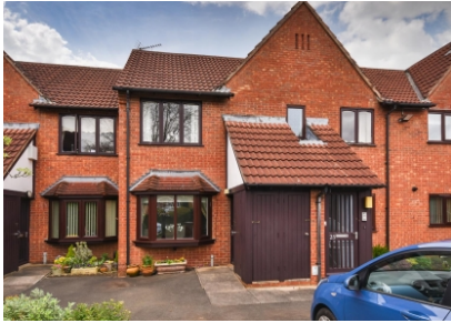
24 Hanover Court, Tettenhall, Wolverhampton