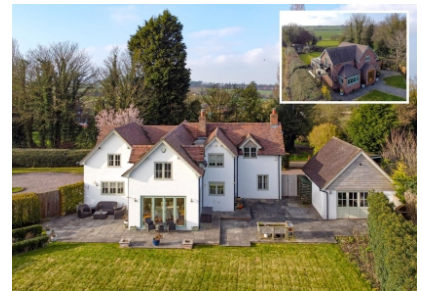
Oaklea and The Cottage, Damson Lane, Weston Heath, Shifnal