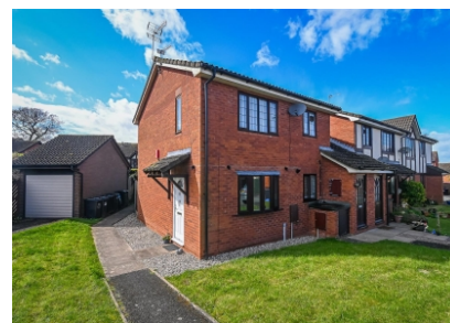
10 Fairfield, Bridgnorth