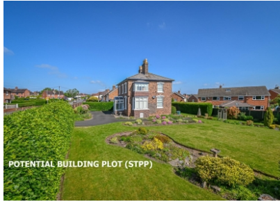
Hookfield House, 81 Victoria Road, Bridgnorth