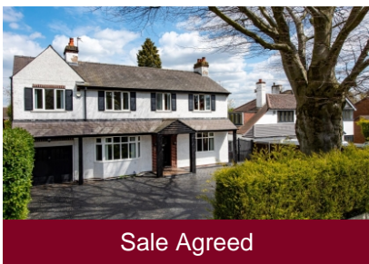
94 Codsall Road, Tettenhall, Wolverhampton