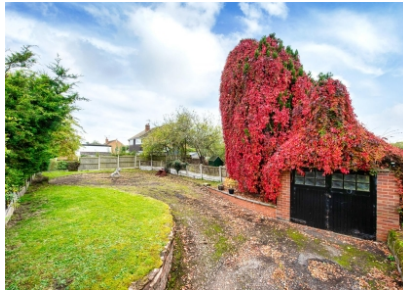
Planning Permission, 40 Moatbrook Lane, Codsall, WV8 1SD