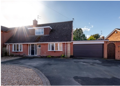
Strathmore, Shaw Lane, Albrighton