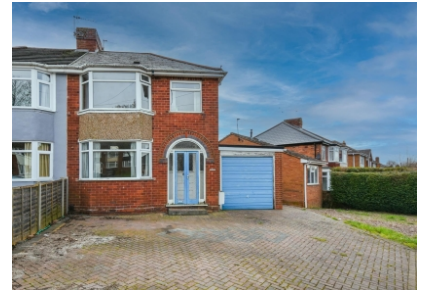
1 Rutland Avenue, Wolverhampton