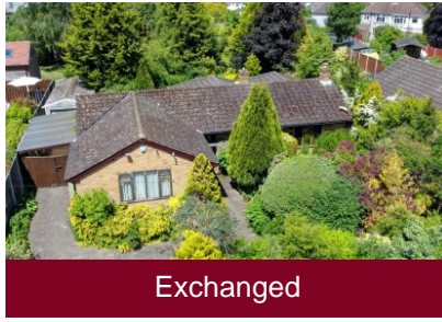
Hazelwood Close, Kidderminster