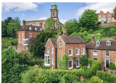
Castle Cliffe House, 24 St. Mary's Steps, Bridgnorth