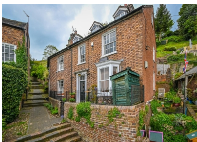
19 St. Marys Steps, Bridgnorth