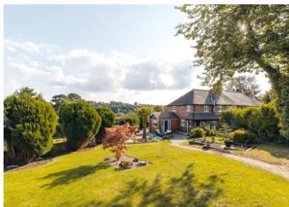
Sunnybank, 11b, Danesford, Bridgnorth