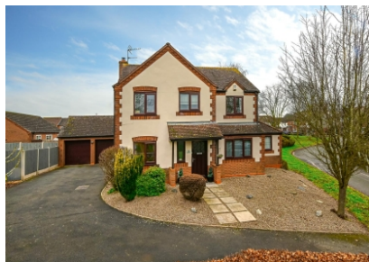
3 Danesbrook, Claverley, Wolverhampton