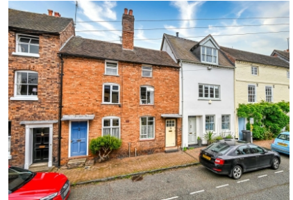
24 St. Marys Street, Bridgnorth