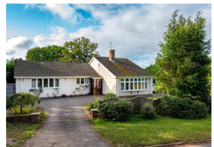
12 Keepers Lane, Codsall, Wolverhampton