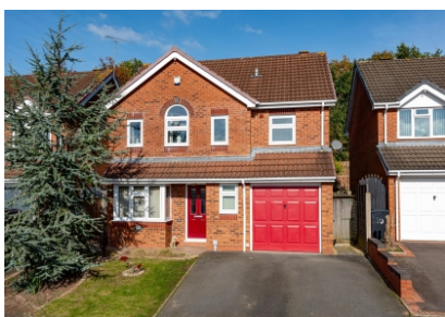
12 Dudmaston Way, Milking Bank, Dudley