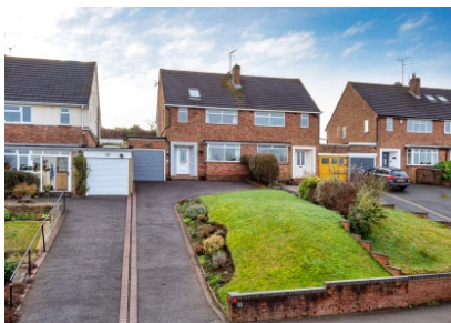
44 Common Road, Wombourne, Wolverhampton