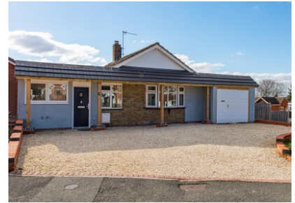
21 Uplands Drive, Wombourne, Wolverhampton