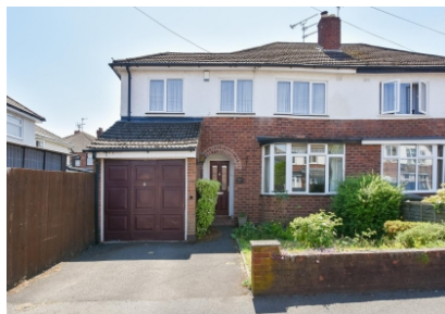
57 York Road, Wolverhampton