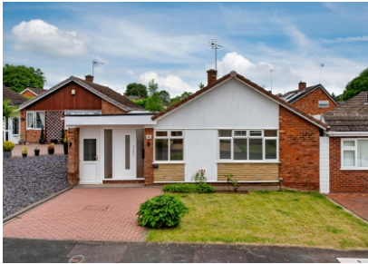
4 Mayfair Close, Albrighton, Wolverhampton