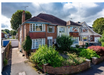
7 Newbridge Gardens, Newbridge, Wolverhampton