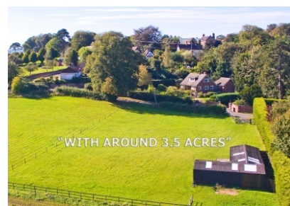
Half Acre House, Stableford, Bridgnorth