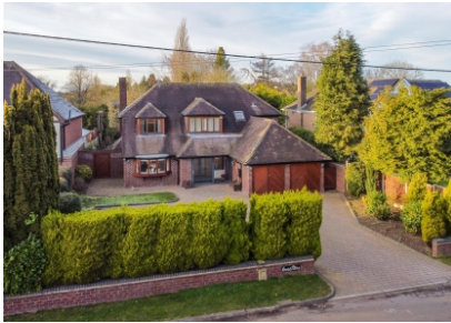
Broad Elms, Great Moor Road, Pattingham