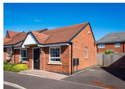
25 Brick Kiln Way, Baggeridge Village