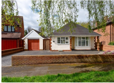
19 Foley Avenue, Tettenhall, Wolverhampton