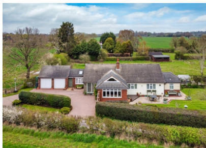
Holly Lodge, Church Lane, Boningale, Albrighton