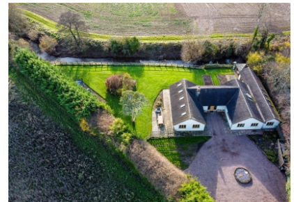
Riverside Bungalow, Muckley Cross, Acton Round, Bridgnorth