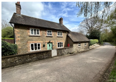
Brookside, Brockton, Much Wenlock