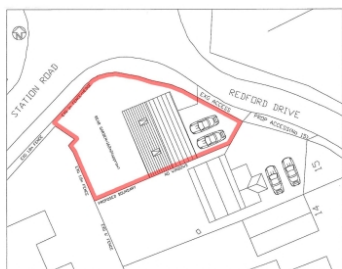
Land to the North of 15 Redford Drive, Albrighton