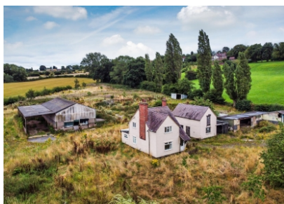
Robins Nest Farm, Dirty Foot Lane, Lower Penn, Wolverhampton