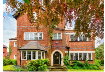
Cheviot House, 20 Stockwell Road, Tettenhall