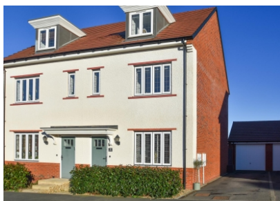
11 Marshall Way, Codsall, Wolverhampton