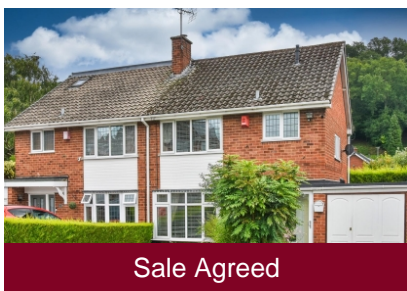
23 Chequers Avenue, Wombourne, Wolverhampton