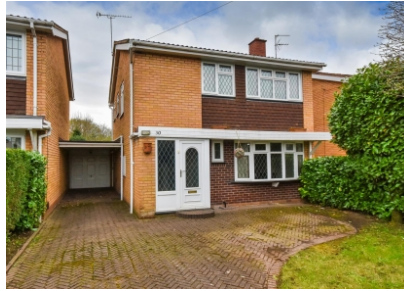
30 Sytch Lane, Wombourne, Wolverhampton