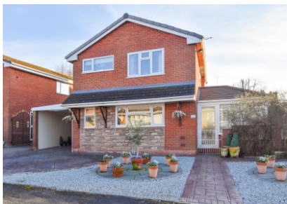
23 Bellencroft Gardens, Merry Hill, Wolverhampton