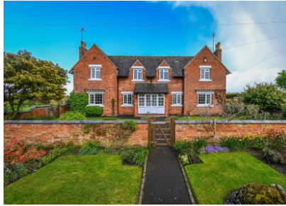
Lower Snowdon Cottage, Snowdon Road, Burnhill Green, Wolverhampton