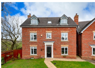
Oaklands, Wombourne, Wolverhampton