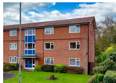
139 Bridgnorth Road, Compton, Wolverhampton