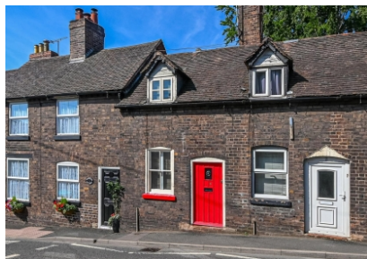
4 Pound Street, Bridgnorth