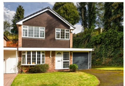
39 Alpine Way, Compton, Wolverhampton