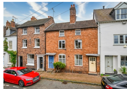
25 St. Marys Street, Bridgnorth