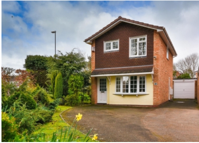
28 Quendale, Wombourne, Wolverhampton