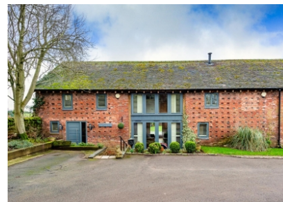
Clee View Barn, Westbeech Road, Patttingham, Wolverhampton