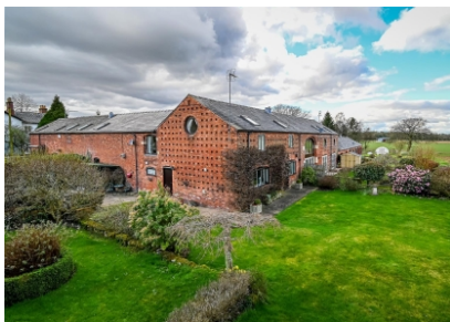
The Oak House, Oaklands Court, Lower Rudge, Pattingham