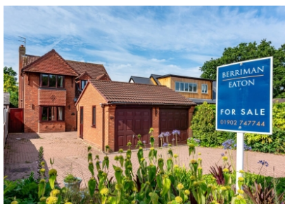
Bridgeside, 187 Birches Road, Codsall