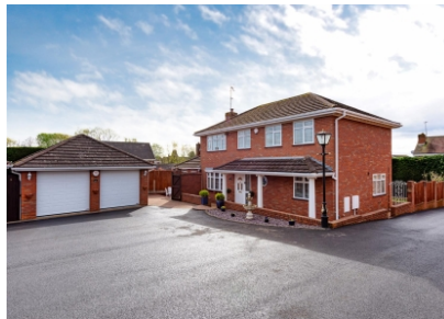
St. Johns Close, Swindon, Dudley