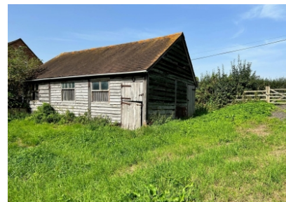
Spring Barn, Glazeley, Bridgnorth