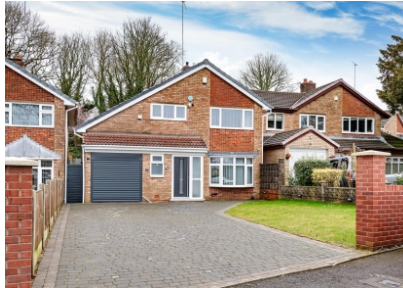
3 St. Marys Close, Dudley