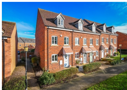
75 Rastrick Close, Bridgnorth