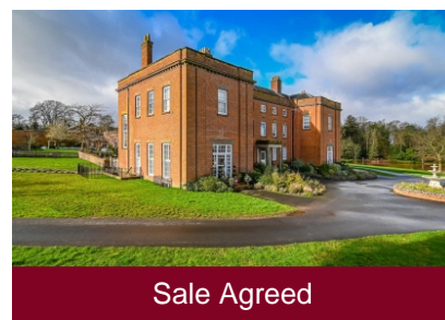
Upper Mill Meadow, Gatacre Hall, Gatacre, Claverley, Wolverhampton