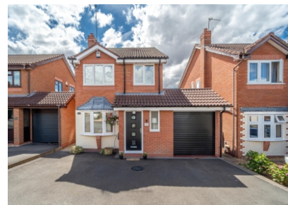
23 Penleigh Gardens, Wombourne