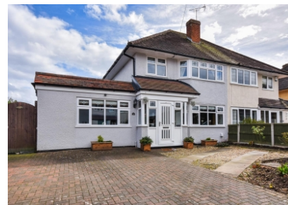
34 Delaware Avenue, Albrighton