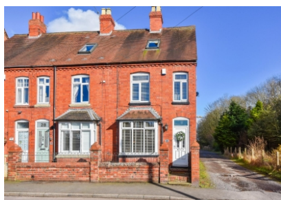
26 Innage Road, Shifnal