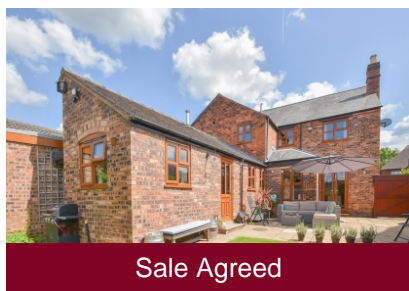
The Cottage, 18 Shop Lane, Oaken