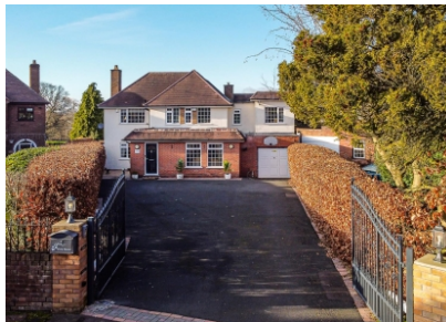
Fern House, Links Avenue, Tettenhall