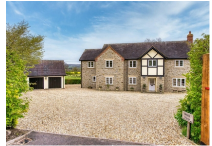
Beech House, Munslow, Shropshire