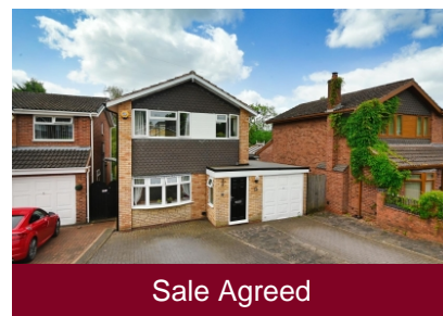
36 Bridge Road, Alveley, Bridgnorth