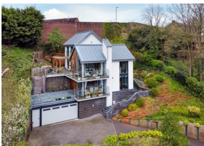
Hawthorn View, Hollybush Road, Bridgnorth