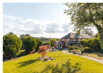
Sunnybank, 11b, Danesford, Bridgnorth