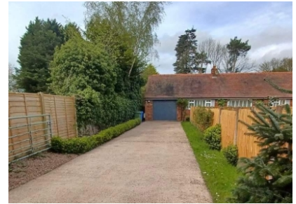
The Bungalow, Popes Lane, Wergs , Tettenhall