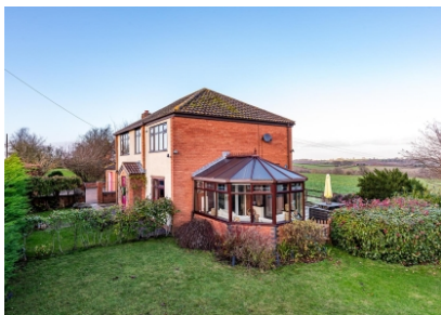
Longmoor House, Billingsley, Bridgnorth