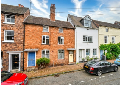
24 St. Marys Street, Bridgnorth