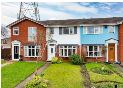
3 Swinford Leys, Wombourne, WV5 8HT