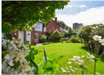
29 Bath Avenue, Wolverhampton