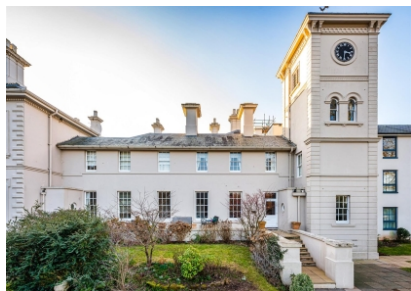
2 Old Hall, Wergs Hall Road, Tettenhall