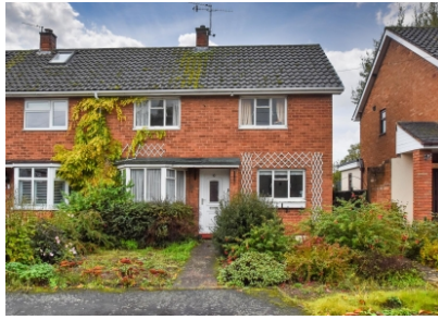
10 Neachless Avenue, Wombourne, Wolverhampton