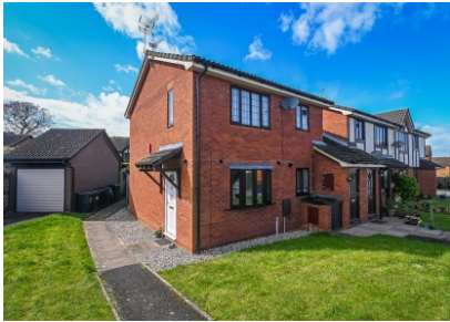
10 Fairfield, Bridgnorth