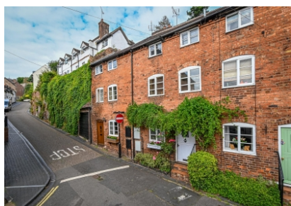
70 Cartway, Bridgnorth