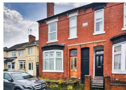
166 Crowther Road, Wolverhampton