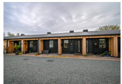
The Willow, 3 The Closes, Sutton Farm, Claverley, Wolverhampton