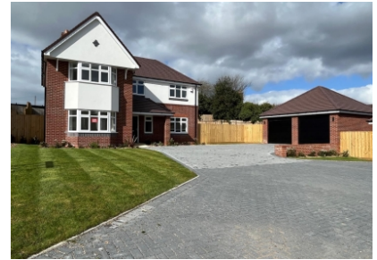
Rosewood House, 6 Rowan Grange, Broseley