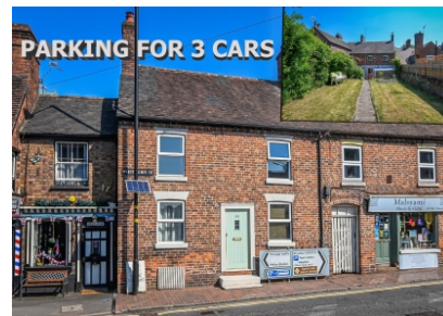
50 Whitburn Street, Bridgnorth