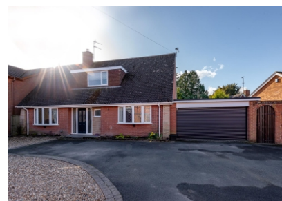
Strathmore, Shaw Lane, Albrighton