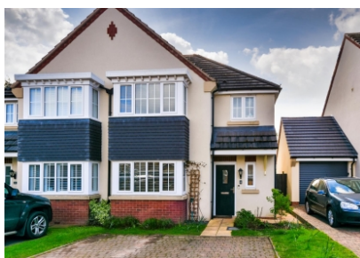
4 The Limes, Codsall Wood, Wolverhampton