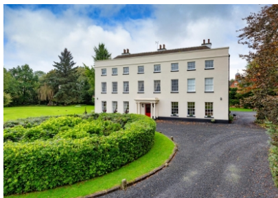
11 Leaton Hall, Church Lane, Bobbington, Stourbridge