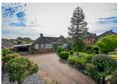
53 Conduit Lane, Bridgnorth