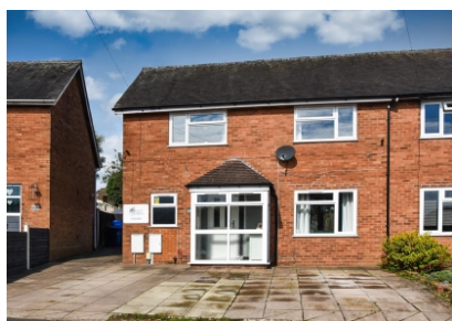
69 Oak Road, Brewwood, Stafford