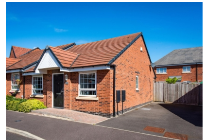
25 Brick Kiln Way, Baggeridge Village