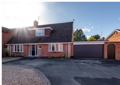
Strathmore, Shaw Lane, Albrighton