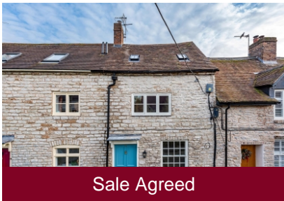
5a King Street, Much Wenlock, Shropshire