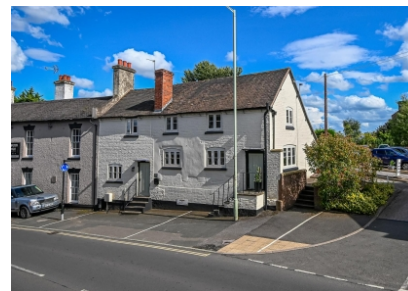
33 Salop St, Bridgnorth