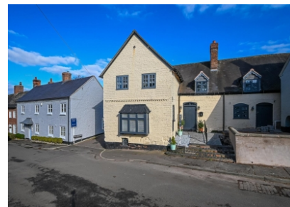
7 Bull Ring, Claverley, Wolverhampton