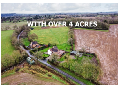
Keepers Cottage, Colemore Green, Bridgnorth