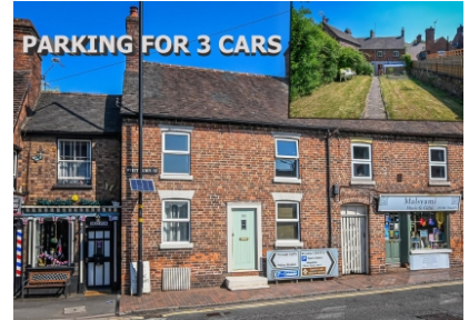
50 Whitburn Street, Bridgnorth