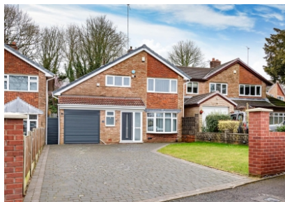
3 St. Marys Close, Dudley