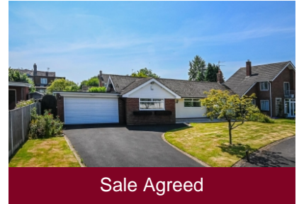
50 The Wold, Claverley, Shropshire