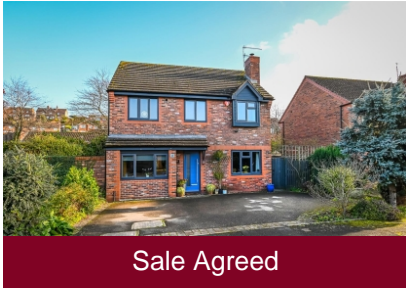
10 Washbrook Road, Bridgnorth