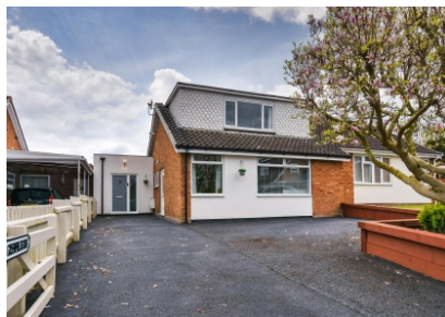
3 Greenfields Road, Wombourne, Wolverhampton