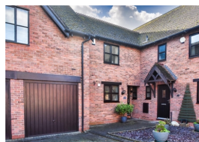
17 Bridgeman Court, Weston-Under- Lizard, Shifnal