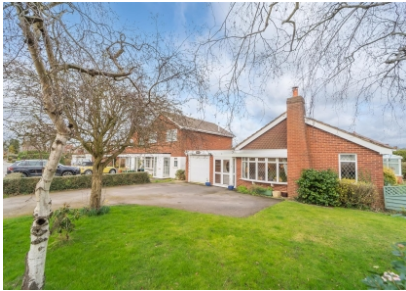
Madeira, 45 Keepers Lane, Codsall, Wolverhampton