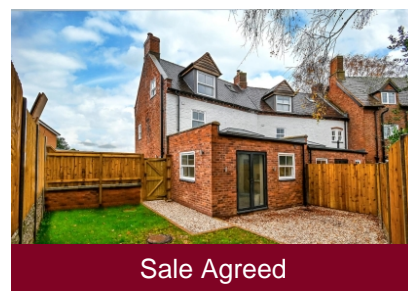
4 Rudge Road, Pattingham, Wolverhampton