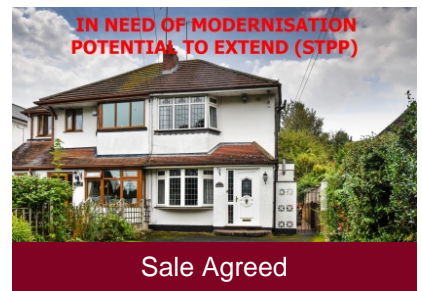
Hillcroft, Penstone Lane, Lower Penn