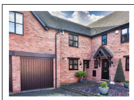
17 Bridgeman Court, Weston-Under-Lizard, Shifnal