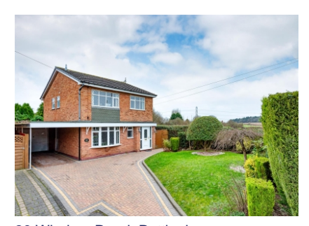
29 Windsor Road, Pattingham, Wolverhampton