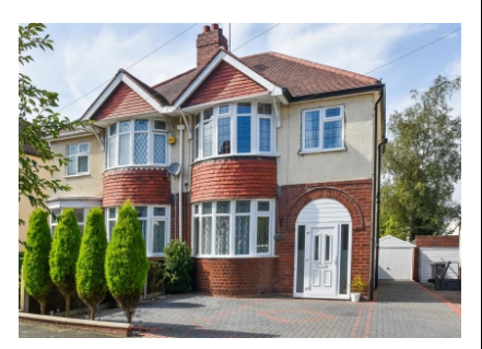
28 Links Road, Penn, Wolverhampton