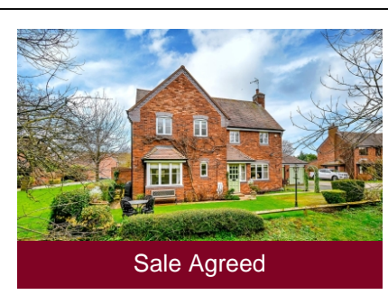
43 Pale Meadow Road, Bridgnorth