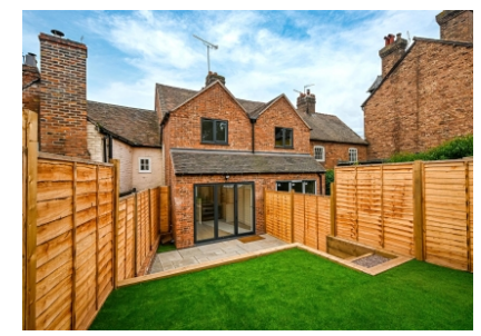
6 Salop Street, Bridgnorth