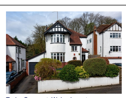
Tudor Crescent, Wolverhampton