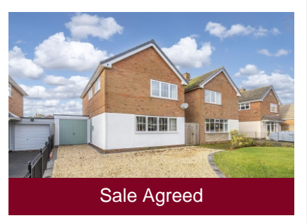
48 Clive Road, Pattingham, Wolverhampton