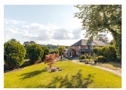
Sunnybank, 11b, Danesford, Bridgnorth