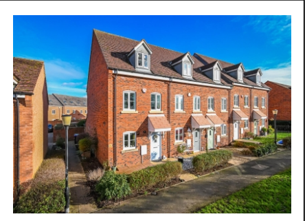
75 Rastrick Close, Bridgnorth