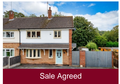
6 Moises Hall Road, Wombourne, Wolverhampton