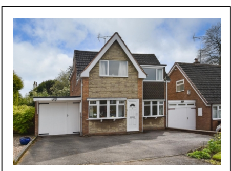
56 Bantock Gardens, Finchfield