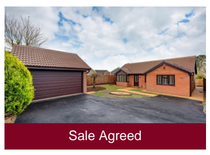
3 Montford Grove, Sedgley, Dudley