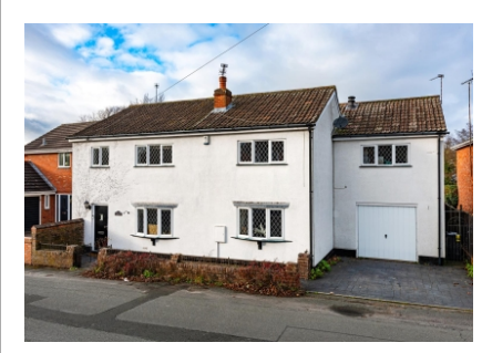
109 Rookery Road, Wombourne, Wolverhampton