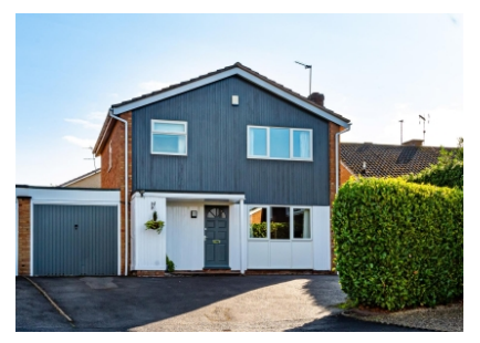
4 Beech Close, Pattingham, Wolverhampton