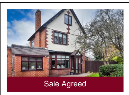
1 Cedar Grove, Bradmore, Wolverhampton