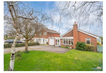
Madeira, 45 Keepers Lane, Codsall, Wolverhampton