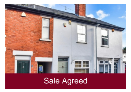
15 Nursery Walk, Tettenhall, Wolverhampton