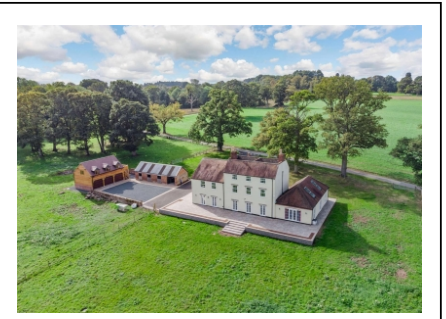
Home Farm, Gatacre, Claverley, Wolverhampton