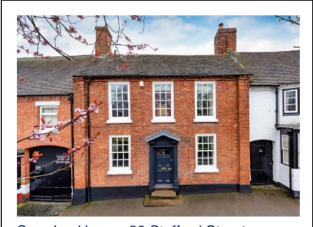
Saredon House, 28 Stafford Street, Brewood