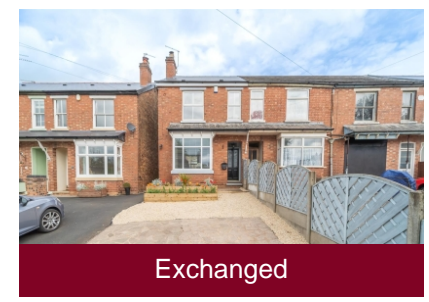
67 Wood Road, Codsall