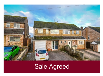
34 Honeybourne Road, Alveley, Bridgnorth