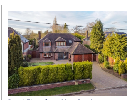
Broad Elms, Great Moor Road, Pattingham