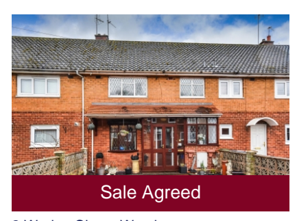
2 Woden Close, Wombourne, Wolverhampton