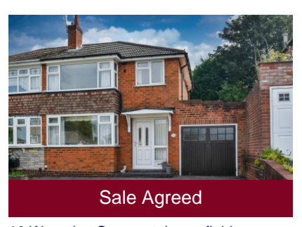
10 Waverley Crescent, Lanesfield, Wolverhampton