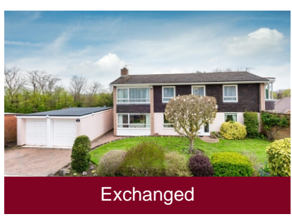
16 Dippons Mill Close, Tettenhall Wood