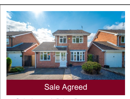
42 Gainsborough Drive, Perton, Wolverhampton