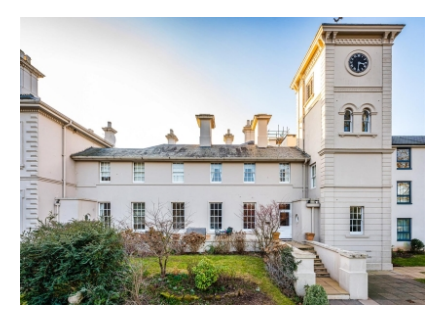
2 Old Hall, Wergs Hall Road, Tettenhall