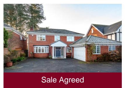
2 Greenhill Court, Wombourne, Wolverhampton