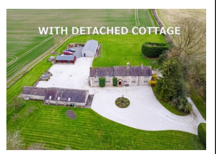
Lower Westwood Farm, Stretton Westwood, Much Wenlock