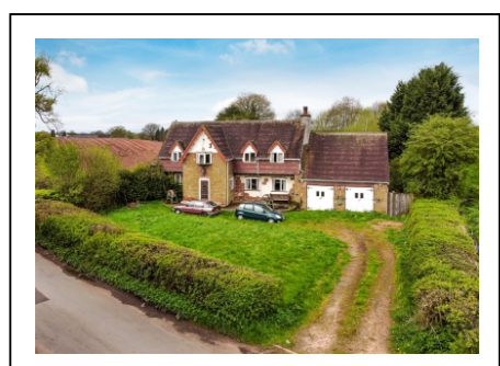
Mill Cottage, Lower Rudge, Pattingham, Wolverhampton