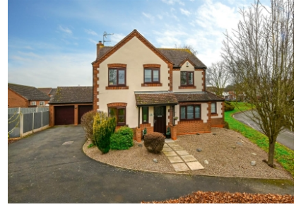
3 Danesbrook, Claverley, Wolverhampton