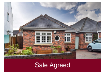
70 Finchfield Road, Wolverhampton