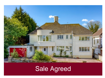
17 Muchall Road, Penn, Wolverhampton