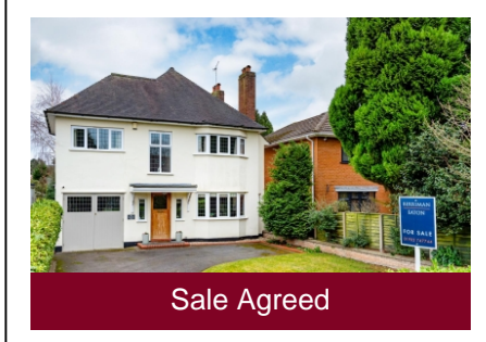
Randolph House, 55 Woodthorne Road, Wolverhampton