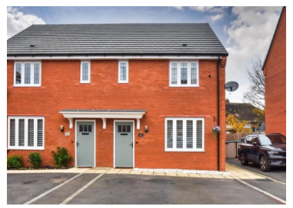
35 Foxglove Way, Himley