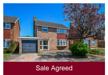
14 The Orchard, Albrighton, Wolverhampton