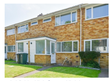
3 Ashfields, High Street, Albrighton