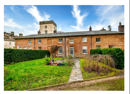
2 Apley Park Mews, Apley, Bridgnorth