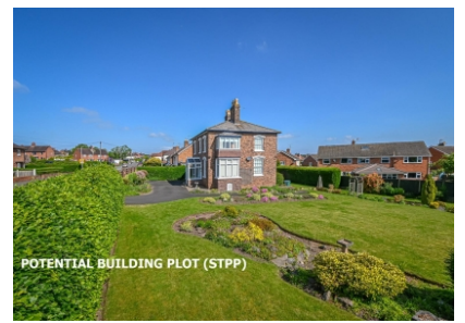
Hookfield House, 81 Victoria Road, Bridgnorth