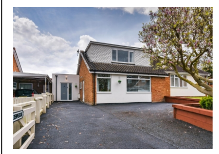
3 Greenfields Road, Wombourne, Wolverhampton