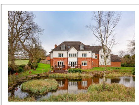
4 Albrighton House, The Water Gardens, Wolverhampton