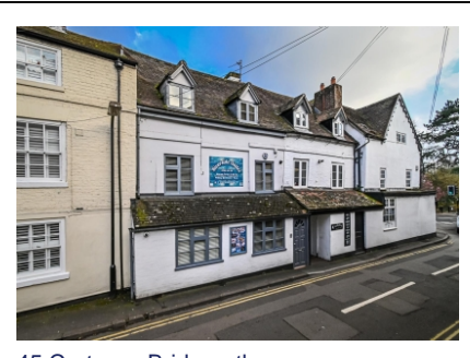
45 Cartway, Bridgnorth