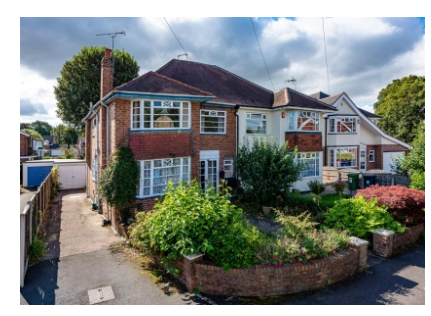
7 Newbridge Gardens, Newbridge, Wolverhampton