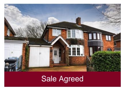
52 Wombourne Park, Wombourne, Wolverhampton