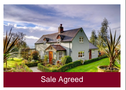
Trimpley Lane, Shatterford, Bewdley