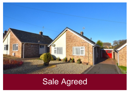
11 Greenleys Crescent, Alveley, Bridgnorth