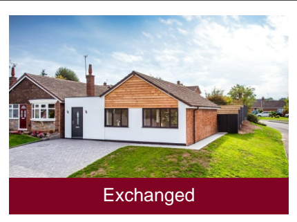
1 Barclay Close, Albrighton, Wolverhampton