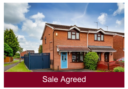
7 Leasowe Drive, Perton, Wolverhampton