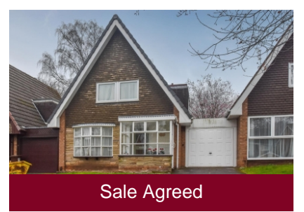
16 Surrey Drive, Finchfield, Wolverhampton