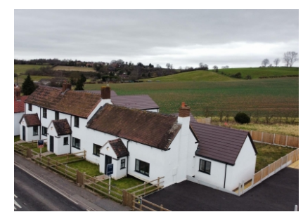
3 Ackleton Meadows, Stableford, Bridgnorth