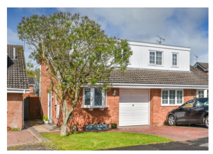
39 Mercia Drive, Perton, Wolverhampton