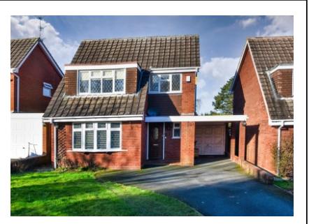
15 Histons Drive, Codsall, Wolverhampton