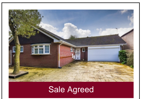
28a Mount Road, Mount Road, Tettenhall Wood