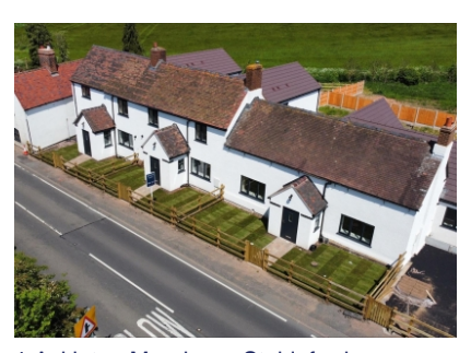
1 Ackleton Meadows, Stableford, Bridgnorth