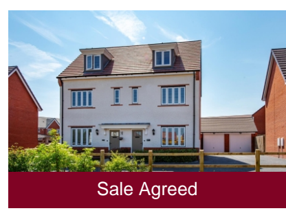
8 Marshall Way, Codsall, Wolverhampton