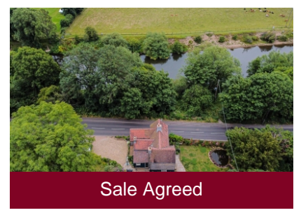
Holme Cottage, Knowle Sands, Bridgnorth