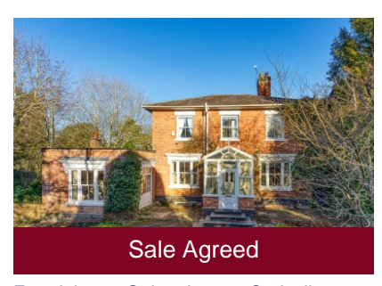
Ferndale, 33 Oaken Lanes, Codsall, Wolverhampton