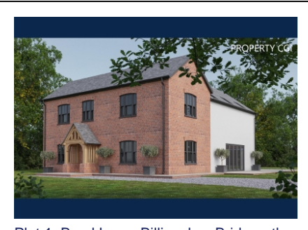
Plot 1, Bynd Lane, Billingsley, Bridgnorth