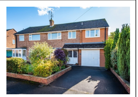
36 Delaware Avenue, Albrighton, Wolverhampton