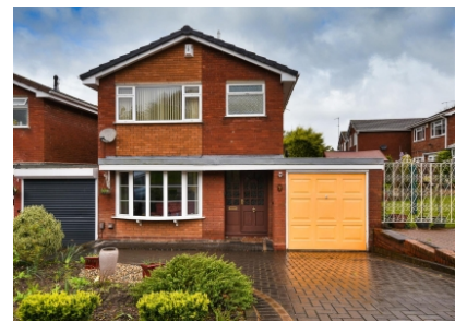
7 Marlborough Gardens, Newbridge, Wolverhampton