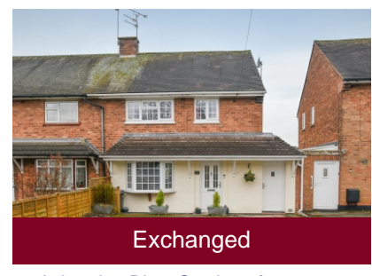
25 Ashenden Rise, Castlecroft, Wolverhampton