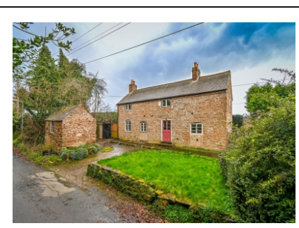
148 Broad Oak, Six Ashes