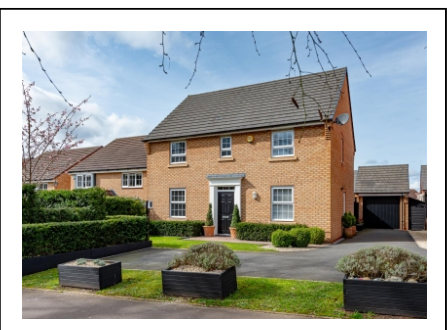
12 Larch Grove, Shifnal