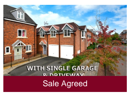
14 Rastrick Close, Bridgnorth