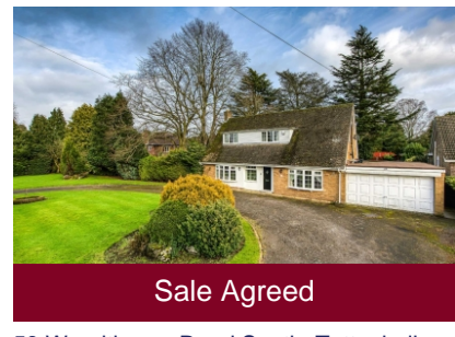
59 Woodthorne Road South, Tettenhall