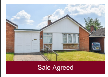
13 The Broadway, Wombourne, Wolverhampton