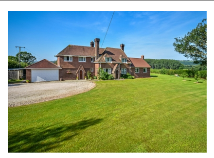
Footbridge House, Tasley, Bridgnorth