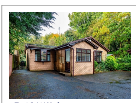
6 Finchfield Hill, Compton, Wolverhampton