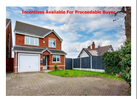
151 Tipton Road, Woodsetton, Dudley