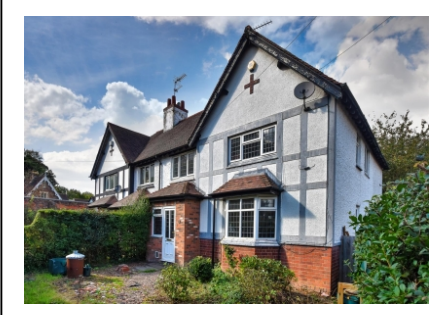
2 Danescourt Cottages, Danescourt Road, Tettenhall