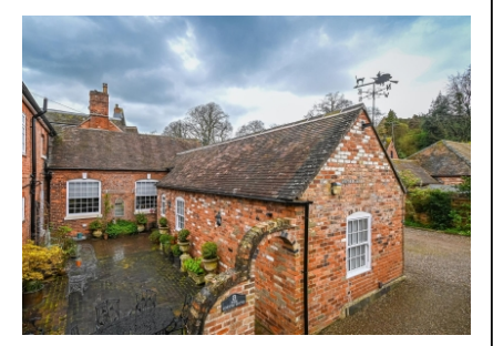
Corner House, 3 Stableford Hall, Stableford, Bridgnorth