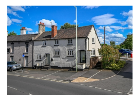
33 Salop St, Bridgnorth