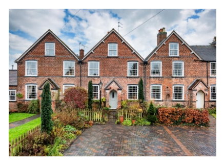
2 Labernum Cottages, Vicarage Road, Penn, Wolverhampton