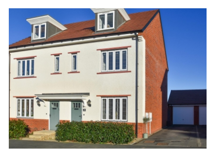
11 Marshall Way, Codsall, Wolverhampton