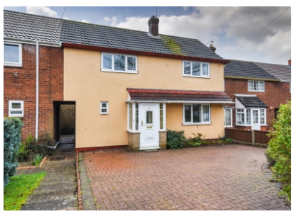
71 Cornwall Road, Tettenhall Wood