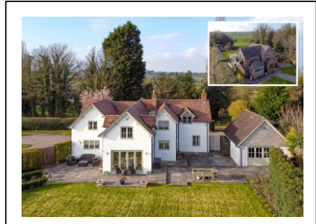
Oaklea and The Cottage, Damson Lane, Weston Heath, Shifnal