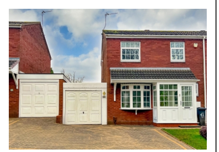
14 St James Street, Lower Gornal, Dudley