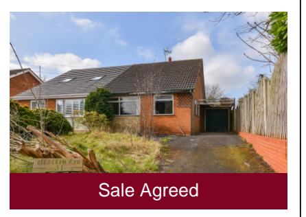
31 Bull Meadow Lane, Wombourne, Wolverhampton