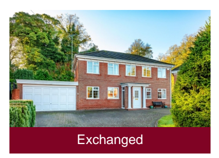
Enderby Drive, Wolverhampton