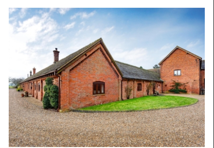
The Byre, Home Farm Road, Burnhill Green, Wolverhampton