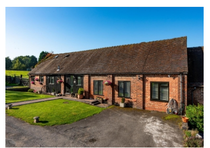
Barn End, Codsall Road, Palmers Cross, Wolverhampton