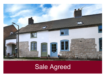
41 Barrow Street, Much Wenlock