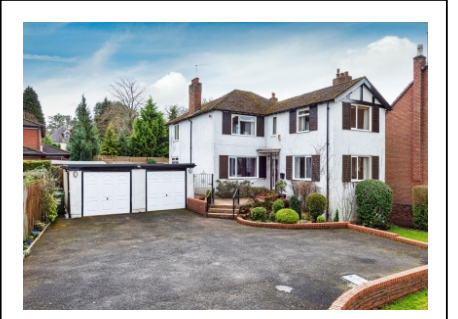
Quarry House, 30 Lansdowne Avenue, Codsall