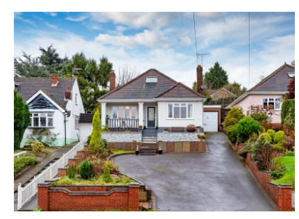
74 Bridgnorth Road, Compton