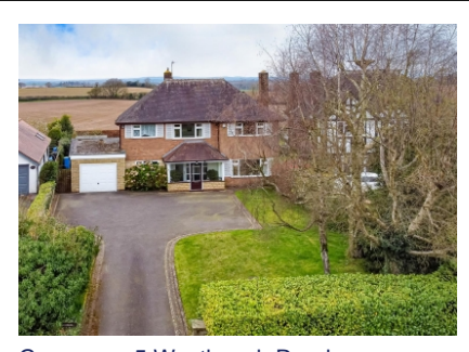
Grasmere, 5 Westbeech Road, Pattingham