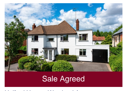
Helford House, Westland Avenue, Compton