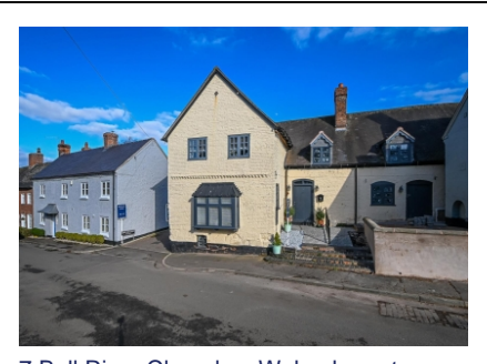
7 Bull Ring, Claverley, Wolverhampton