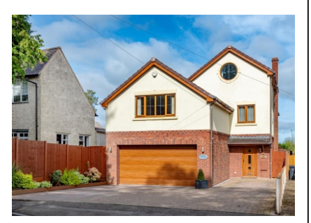
Mimosa Lodge, Histons Hill, Codsall