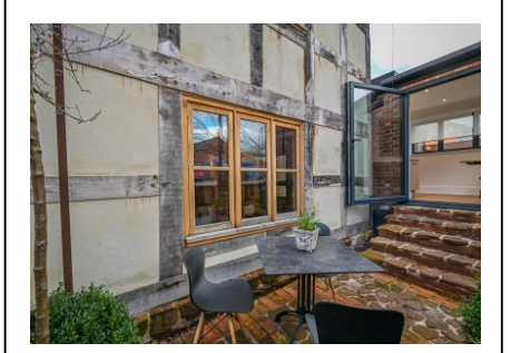
Park Cottage, Abbey Foregate, Shrewsbury