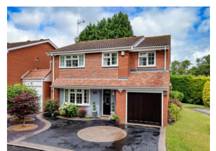
2 Brompton Lawns, Tettenhall Wood, Wolverhampton