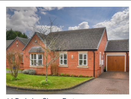
14 Berkeley Close, Perton, Wolverhampton