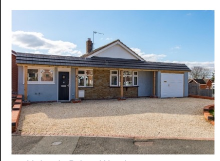
21 Uplands Drive, Wombourne, Wolverhampton