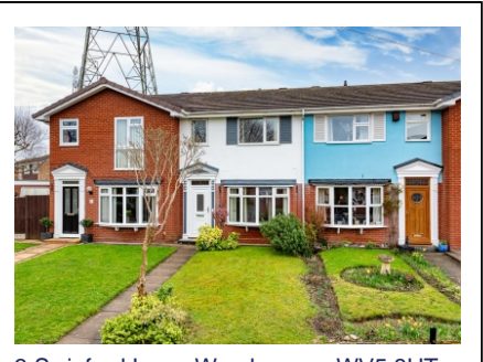
3 Swinford Leys, Wombourne, WV5 8HT