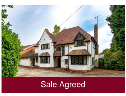
Greenways and Building Plots, 45 Perton Road