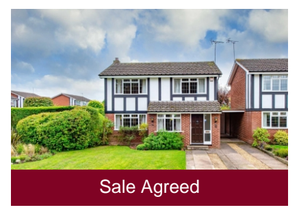
16 Meadow Vale, Codsall, Wolverhampton