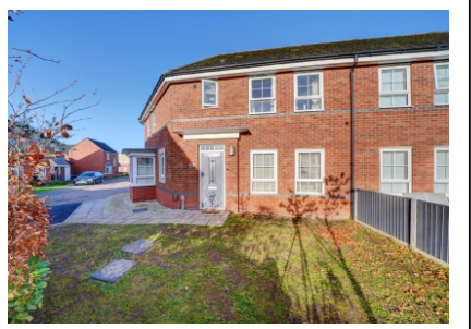
26 Rainsford Crescent, Kidderminster