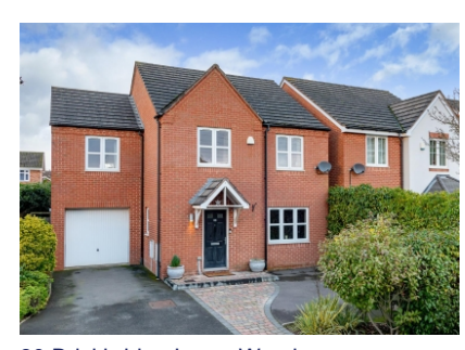
80 Brickbridge Lane, Wombourne, Wolverhampton