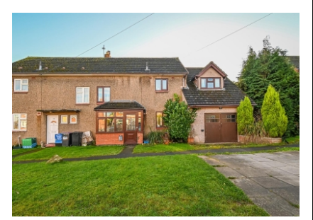
74 The Hobbins, Bridgnorth