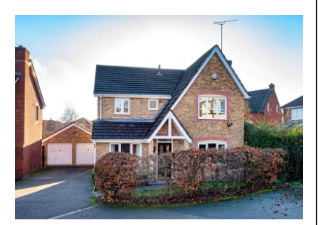
17 Holendene Way, Wombourne, Wolverhampton