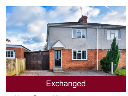
34 Hazel Grove, Wombourne, Wolverhampton