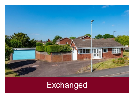
44 Woodcote Road, Wolverhampton