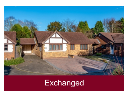
38b Redhouse Road, Tettenhall, Wolverhampton