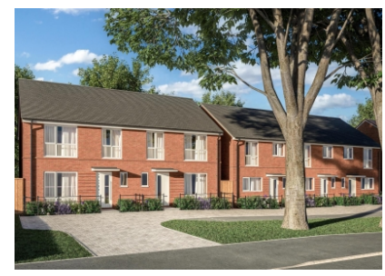
Plot 4 Nightingale Place, Vicarage Road, Wolverhampton