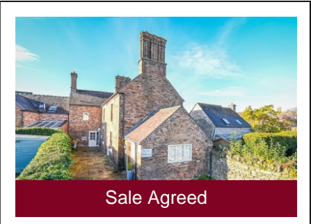
The Forge, 13 St. Marys Lane, Much Wenlock