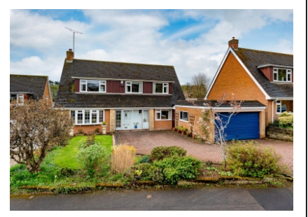
18 Quail Green, Wightwick, Wolverhampton