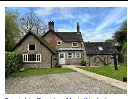
Brookside, Brockton, Much Wenlock