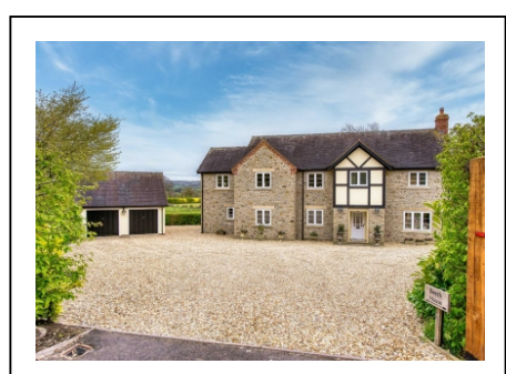
Beech House, Munslow, Shropshire