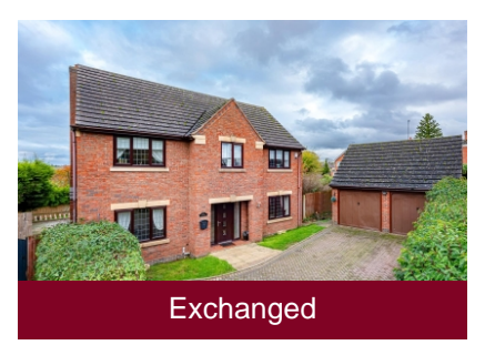
Wodehouse Lane, Dudley