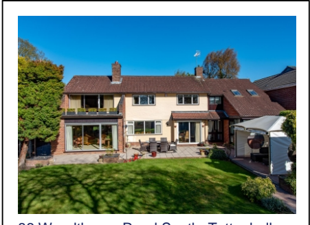
86 Woodthorne Road South, Tettenhall