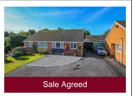
10 Captains Road, Bridgnorth