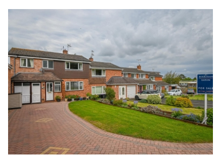
27 Castlefields, Bridgnorth