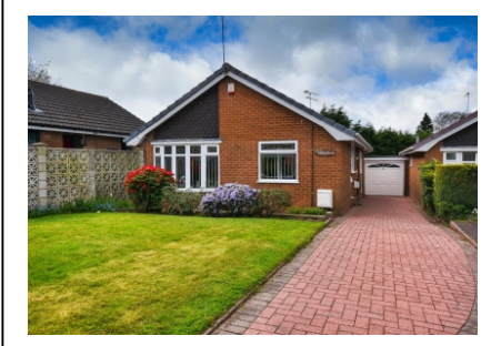
19 Finchdene Grove, Finchfield, Wolverhampton