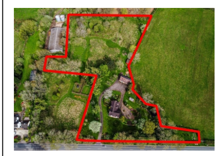
Dodds Green Cottage, 79 Dodds Green, Alveley, Bridgnorth