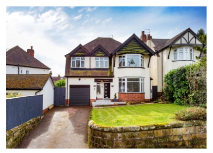
3 Lothians Road, Tettenhall, Wolverhampton