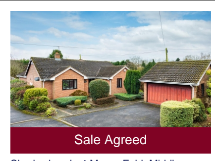
Shadowbrook, 4 Manor Fold, Middle Lane, Oaken