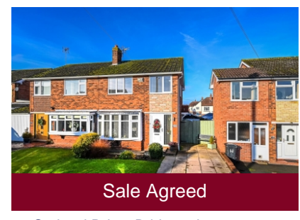
20 Orchard Drive, Bridgnorth