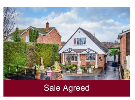
5 Bratch Common Road, Wombourne, Wolverhampton