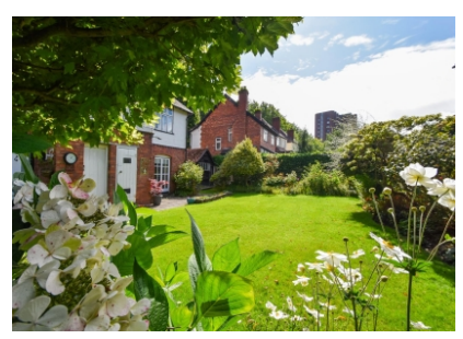
29 Bath Avenue, Wolverhampton