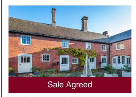
The Ostlers, 3 Patshull Hall Mews, Burnhill Green