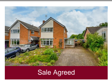
49 Oldbury Wells, Bridgnorth