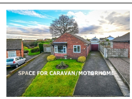
51 Linley View Drive, Bridgnorth