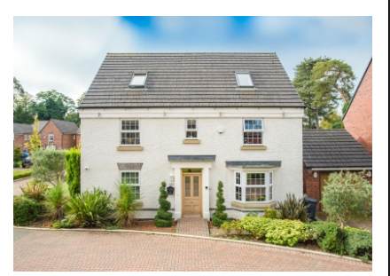
7 Great Hall Grove, Wolverhampton