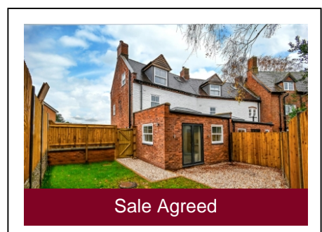
4 Rudge Road, Pattingham, Wolverhampton