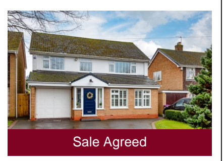
89 Redhouse Road, Tettenhall, Wolverhampton