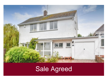
4 Newgate, Pattingham, Wolverhampton