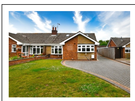
6 Lime Close, Alveley, Bridgnorth