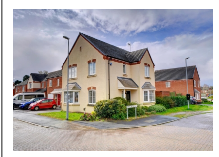
Greatwich Way, Kidderminster