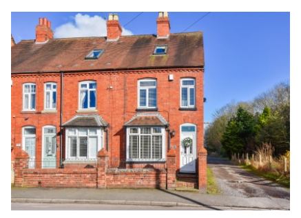
26 Innage Road, Shifnal