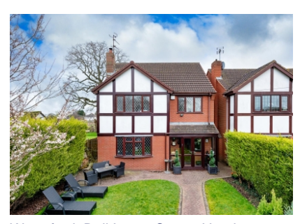
Waterford, Ball Lane, Coven Heath, Wolverhampton