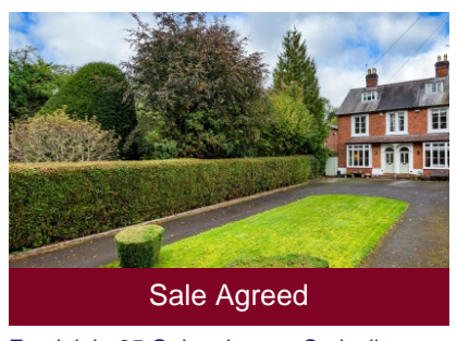
Fernleigh, 35 Oaken Lanes, Codsall