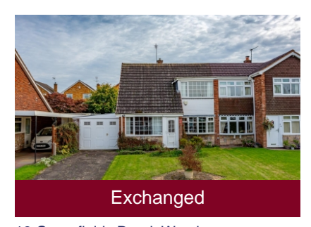
13 Greenfields Road, Wombourne, Wolverhampton