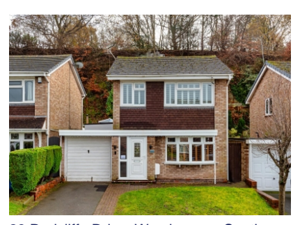
23 Redcliffe Drive, Wombourne, South Stafforshire