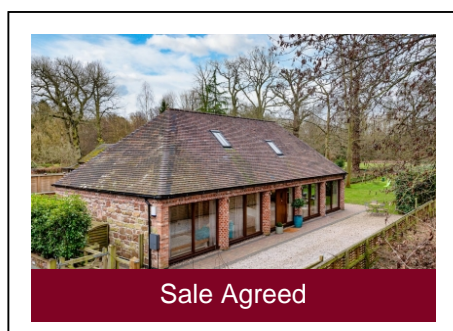
Eagle Barn, 4 Patshull Gardens, Albrighton