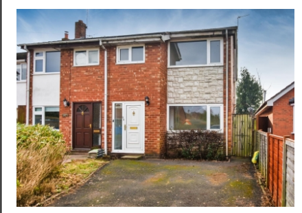
99 Hazel Grove, Wombourne, Wolverhampton