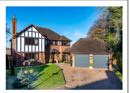
47 Fairfield Drive, Codsall, Wolverhampton