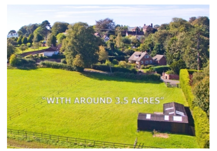
Half Acre House, Stableford, Bridgnorth