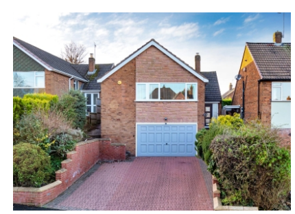
52 Church Hill, Penn, Wolverhampton