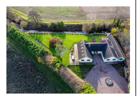
Riverside Bungalow, Muckley Cross, Acton Round, Bridgnorth