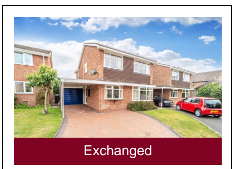
13 Dartmouth Avenue, Pattingham, Wolverhampton