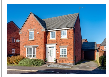
8 Brick Kiln Way, Baggeridge Village