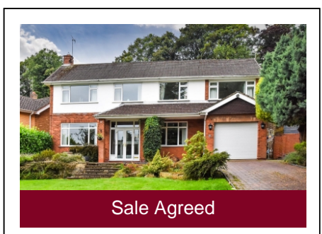
5 Firsway, Wightwick