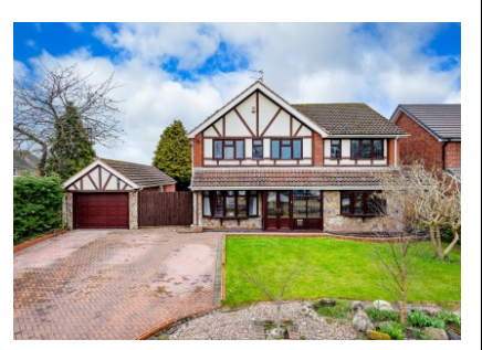
11 Waverley Gardens, Wombourne, Wolverhampton