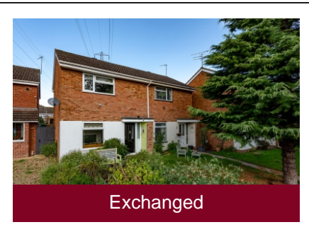
23 Brookside Close, Wombourne, Wolverhampton