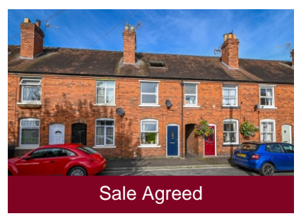
29 Severn Street, Bridgnorth