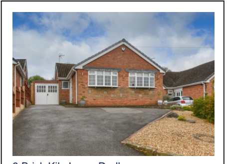
9 Brick Kiln Lane, Dudley