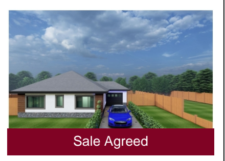
Plot 2 Hazelbrook, Hazel Lane, Great Wyrley