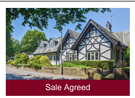
Woodhouse Lodge, Wood Road, Tettenhall Wood