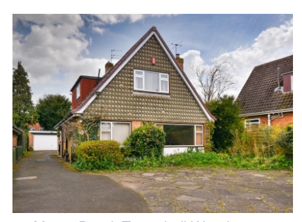
68 Mount Road, Tettenhall Wood, Wolverhampton