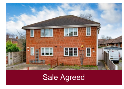
48 Abney Avenue, Albrighton