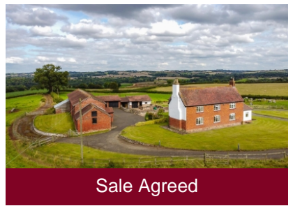
Lower Sutton Farm, Sutton, Chelmarsh, Bridgnorth