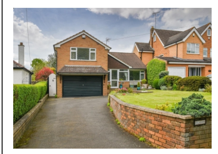
Stourbridge Road, Wombourne, Wolverhampton