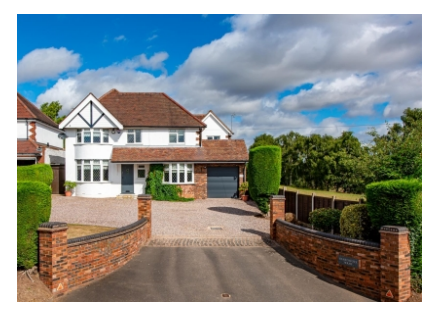
Hearthcote House, Poolhouse Road, Wombourne