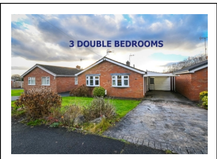
12 Redstone Drive, Highley, Bridgnorth