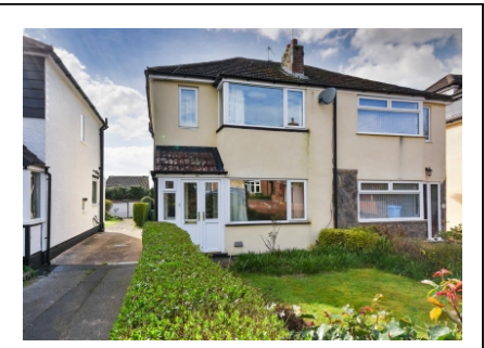
36 Hall End Lane, Pattingham, Wolverhampton