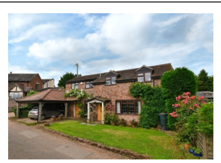
Finger Cottage, 123 Birds Green, Alveley, Bridgnorth