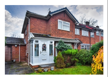
5 Manor Close, Codsall, Wolverhampton