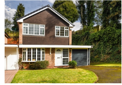
39 Alpine Way, Compton, Wolverhampton