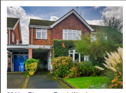
86 Van Diemans Road, Wombourne, Wolverhampton