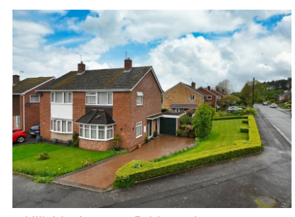
3 Hillside Avenue, Bridgnorth