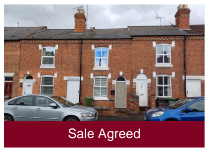
Summerfield Road, Stourport-On-Severn