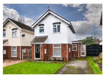
8 Laburnum Street, Wolverhampton