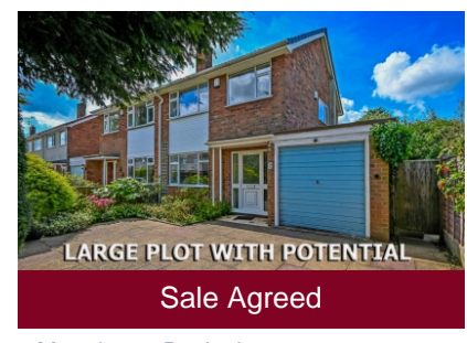
6 Moor Lane, Pattingham, Wolverhampton