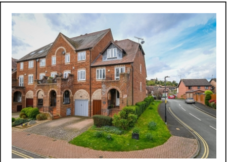
36 Southwell Riverside, Bridgnorth