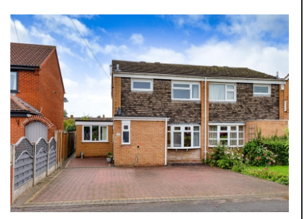
148a Birches Road, Codsall, Wolverhampton