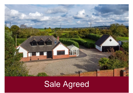
Rosebank, Ebstree Road, Seisdon, Nr Wolverhampton