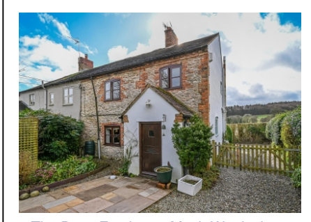
1 The Row, Easthope, Much Wenlock