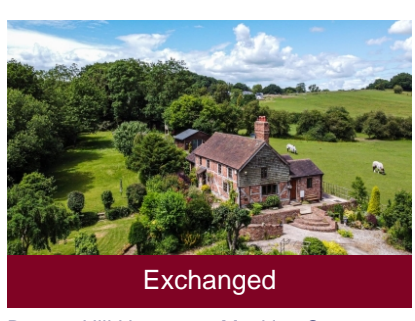
Beggar Hill House, 62 Muckley Cross, Acton Round, Bridgnorth