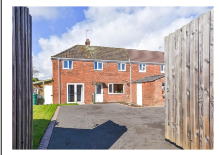
146 Cornwall Road, Wolverhampton