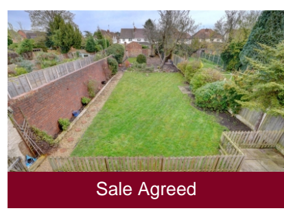
Grosvenor Avenue, Kidderminster