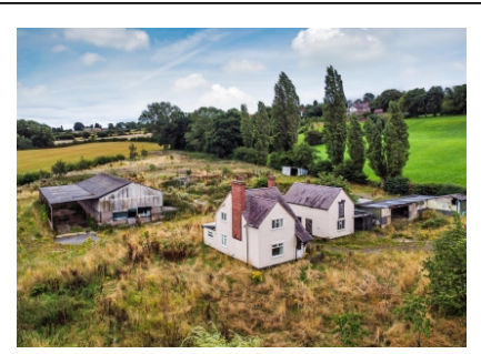
Robins Nest Farm, Dirty Foot Lane, Lower Penn, Wolverhampton