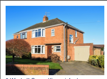
9 Windmill Grove, Kingswinford