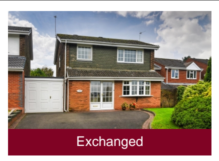
39 Bantock Gardens, Finchfield, Wolverhampton