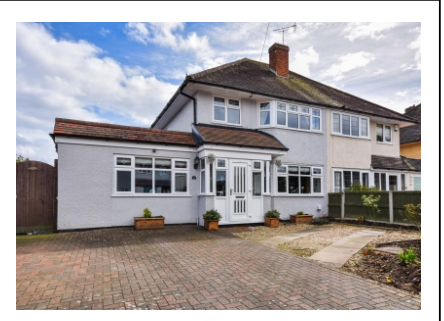
34 Delaware Avenue, Albrighton