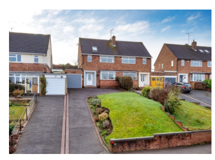
44 Common Road, Wombourne, Wolverhampton