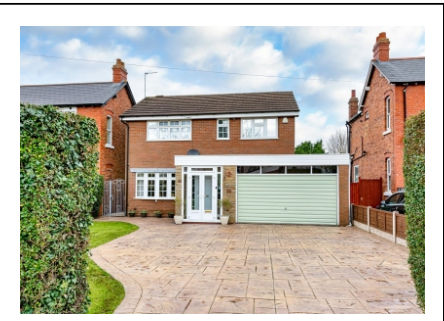
230a Trysull Road, Merry Hill, Wolverhampton