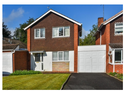
9 Westhill, Wolverhampton