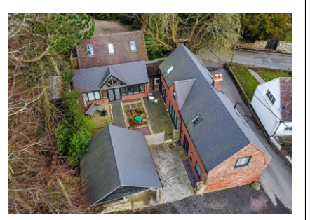
The Old Coach House, Little Wenlock, Telford