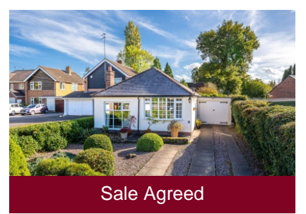
91 Suckling Green Lane, Codsall, Wolverhampton