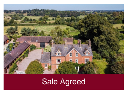
Roughton Farmhouse, Roughton, Bridgnorth