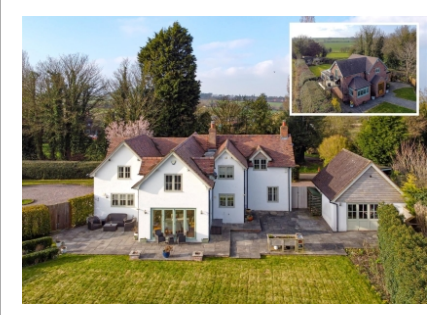
Oaklea and The Cottage, Damson Lane, Weston Heath, Shifnal