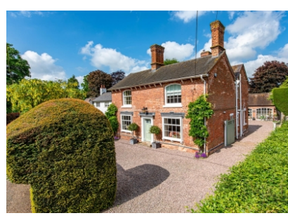
Beckbury House, Beckbury, Shifnal