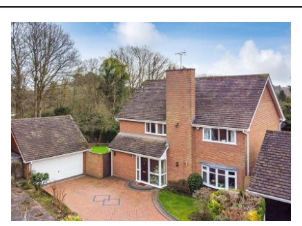
5 Mayswood Drive, Wightwick