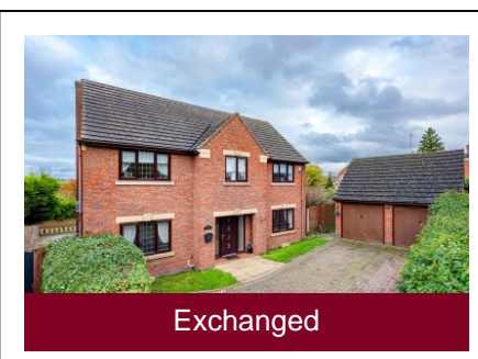
Wodehouse Lane, Dudley