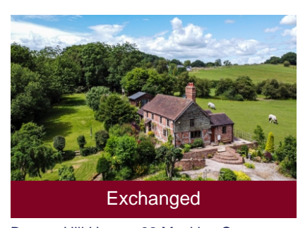
Beggar Hill House, 62 Muckley Cross, Acton Round, Bridgnorth