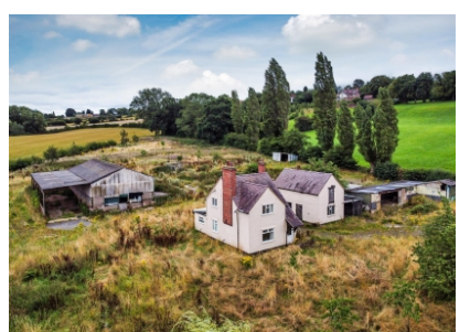
Robins Nest Farm, Dirty Foot Lane, Lower Penn, Wolverhampton