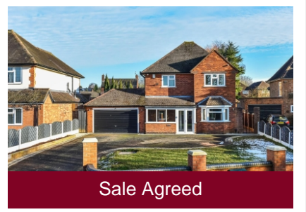
75 Yew Tree Lane, Tettenhall