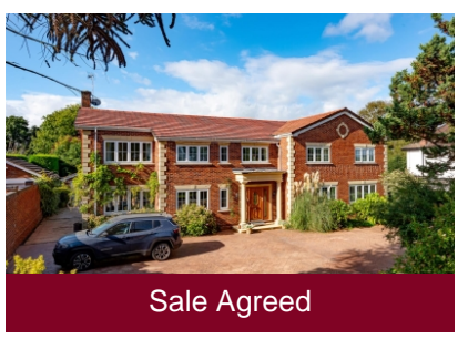
Elan Ridge. Pool House Road, Wombourne, Wolverhampton