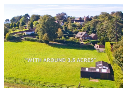
Half Acre House, Stableford, Bridgnorth