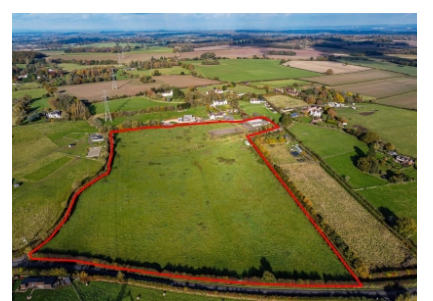
Plot of Land at Former Mill Riding Centre, Warstone Hill Road, Pattingham