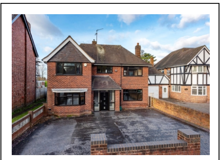
288b Penn Road, Wolverhampton