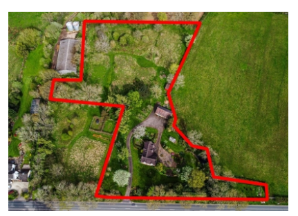
Dodds Green Cottage, 79 Dodds Green, Alveley, Bridgnorth