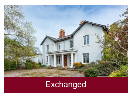
The Oaklands, Lower Rudge, Pattingham