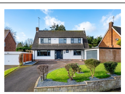
25 Perton Brook Vale, Wightwick