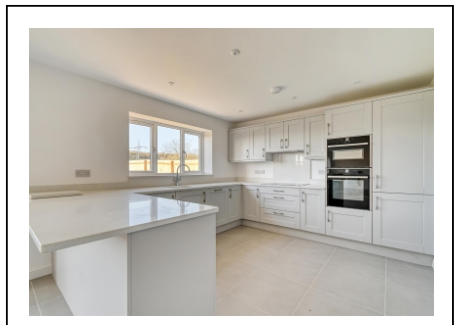
Green Acres, 3 Rowan Grange, Broseley