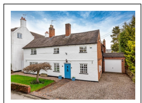
Garden Cottage, 4 Shop Lane, Brewood