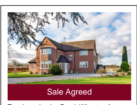
Trentham, Lapley Road, Wheaton Aston