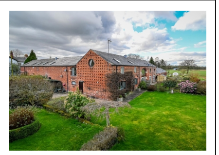
The Oak House, Oaklands Court, Lower Rudge, Pattingham