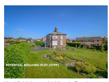
Hookfield House, 81 Victoria Road, Bridgnorth