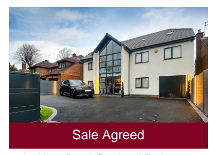
14 Lothians Road, Stockwell End