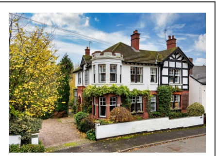
Battlefield House, 14 Battlefield Hill, Wombourne, Wolverhampton