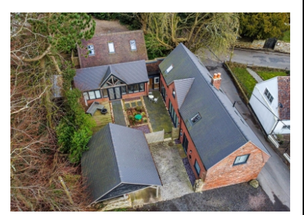
The Old Coach House, Little Wenlock, Telford