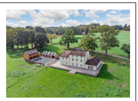
Home Farm, Gatacre, Claverley, Wolverhampton