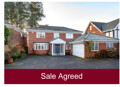
2 Greenhill Court, Wombourne, Wolverhampton