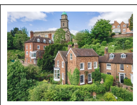
Castle Cliffe House, 24 St. Mary's Steps, Bridgnorth