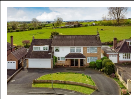
7 Wightwick Hall Road, Wightwick, WV6 8BZ