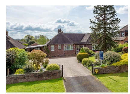
53 Conduit Lane, Bridgnorth