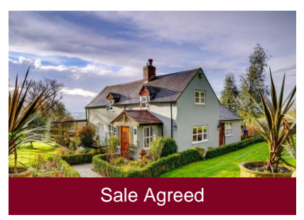
Trimpley Lane, Shatterford, Bewdley