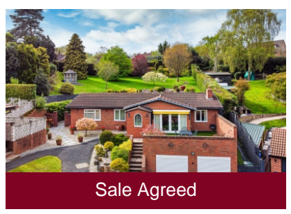
18 Bramble Ridge, Bridgnorth