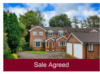
17 Hall End Lane, Pattingham, Wolverhampton