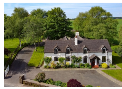
The Little Green, 2 Feiashill Road, Trysull, Wolverhampton