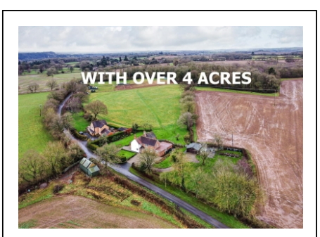
Keepers Cottage, Colemore Green, Bridgnorth