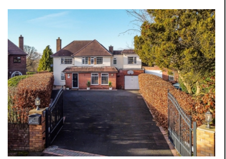
Fern House, Links Avenue, Tettenhall