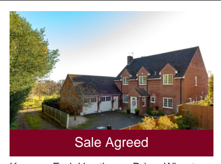
Keepers End, Hawthorne Drive, Wheaton Aston