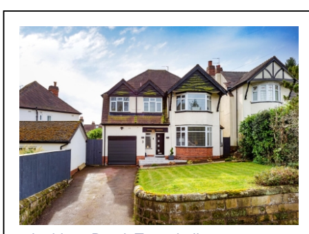
3 Lothians Road, Tettenhall, Wolverhampton