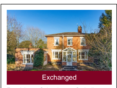
Ferndale, 33 Oaken Lanes, Codsall, Wolverhampton