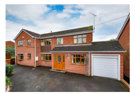
15 Ounsdale Crescent, Wombourne, Wolverhampton