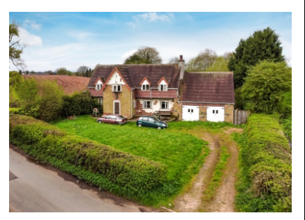
Mill Cottage, Lower Rudge, Pattingham, Wolverhampton