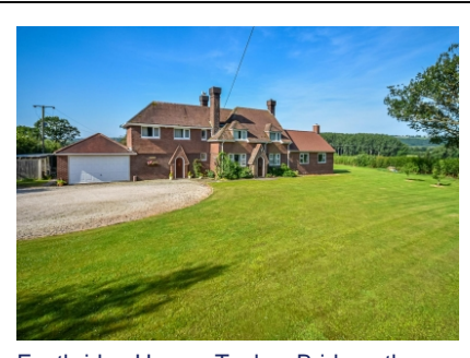
Footbridge House, Tasley, Bridgnorth