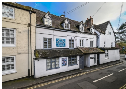
45 Cartway, Bridgnorth