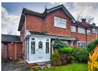
5 Manor Close, Codsall, Wolverhampton