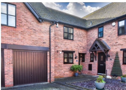
17 Bridgeman Court, Weston-Under- Lizard, Shifnal