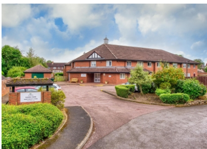
13 Saxon Park, High Street, Albrighton, Wolverhampton