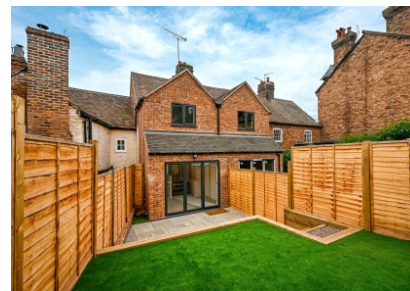
6 Salop Street, Bridgnorth