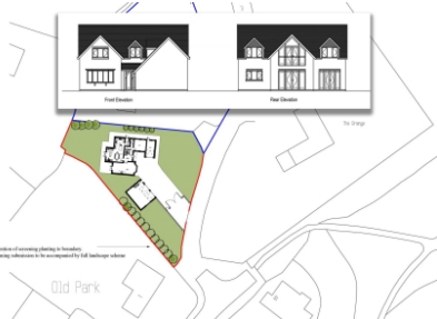
Land on the South of 2 Old Coppice Grange, Old Park, Telford