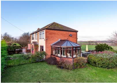
Longmoor House, Billingsley, Bridgnorth