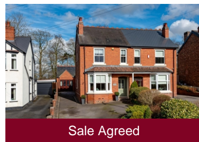
Medicote, 79 Wood Road, Codsall