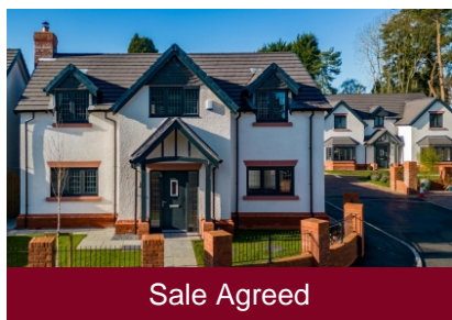
Alder House, Popes Lane, Tettenhall