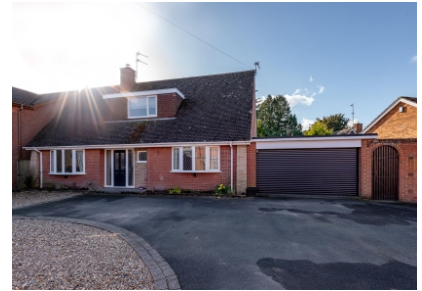
Strathmore, Shaw Lane, Albrighton