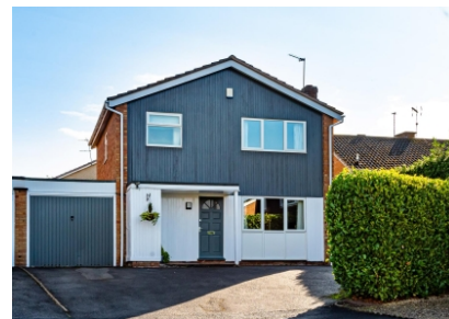
4 Beech Close, Pattingham, Wolverhampton