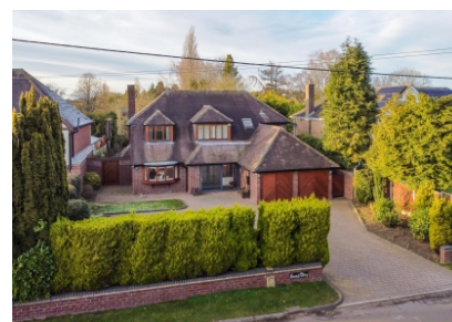
Broad Elms, Great Moor Road, Pattingham