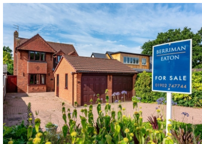
Bridgeside, 187 Birches Road, Codsall