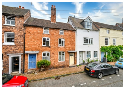
24 St. Marys Street, Bridgnorth