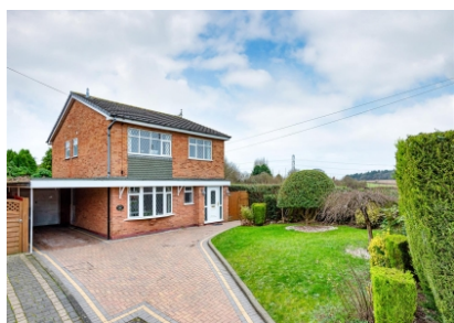
29 Windsor Road, Pattingham, Wolverhampton