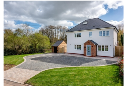
Holly Cottage, Wolverhampton Road, Pattingham