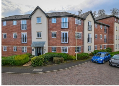
25 Greyfriars House, Stourbridge Road, Bridgnorth