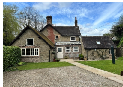
Brookside, Brockton, Much Wenlock