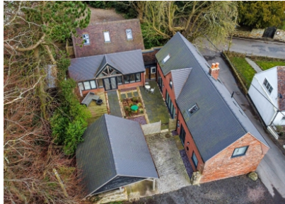
The Old Coach House, Little Wenlock, Telford