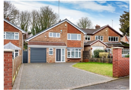
3 St. Marys Close, Dudley