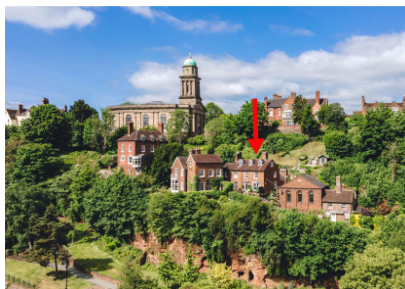
19 St. Marys Steps, Bridgnorth