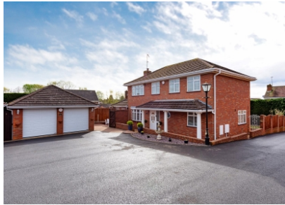
St. Johns Close, Swindon, Dudley