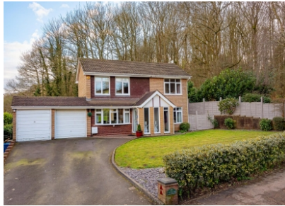
Wychaven, The Holloway, Swindon, Dudley