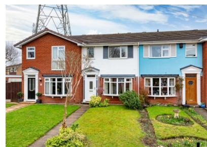
3 Swinford Leys, Wombourne, WV5 8HT