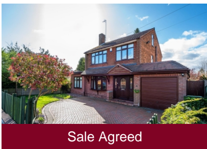
13 Springhill Lane, Wolverhampton