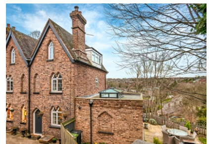
14 West Castle Street, Bridgnorth