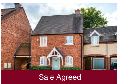
Stanham Close, Wombourne, Wolverhampton