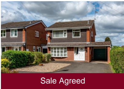
191 Common Road, Wombourne, Wolverhampton