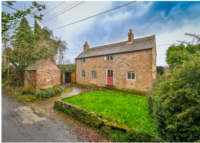
148 Broad Oak, Six Ashes