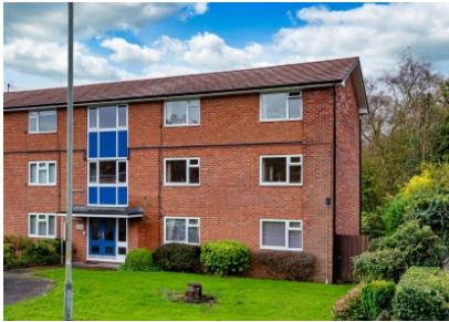
139 Bridgnorth Road, Compton, Wolverhampton