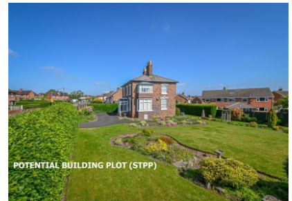
Hookfield House, 81 Victoria Road, Bridgnorth