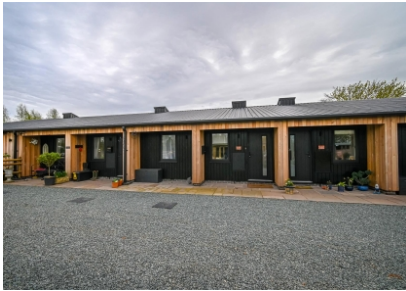
The Willow, 3 The Closes, Sutton Farm, Claverley, Wolverhampton