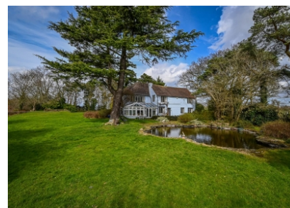
Horseshoes, Netherton, Highley, Bridgnorth