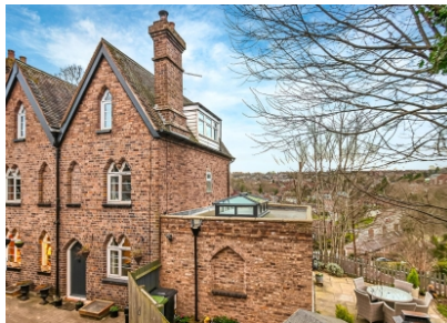
14 West Castle Street, Bridgnorth