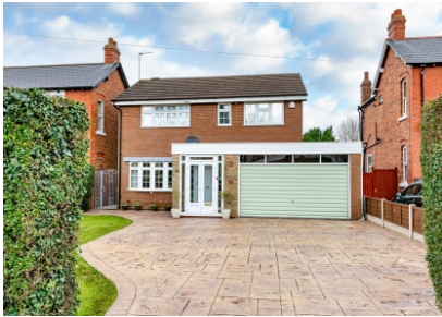
230a Trysull Road, Merry Hill, Wolverhampton