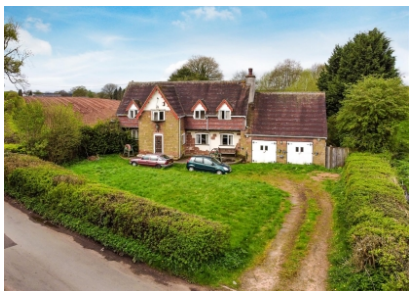
Lower Rudge, Pattingham, Wolverhampton