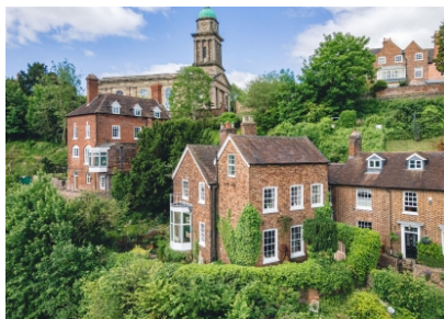
Castle Cliffe House, 24 St. Mary's Steps, Bridgnorth