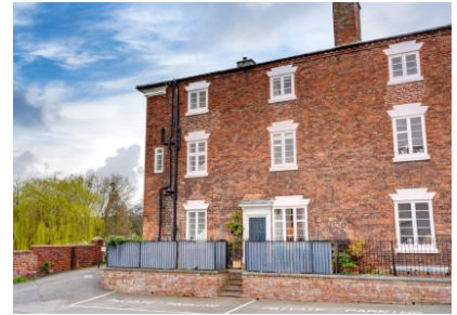
Severn Side, Stourport-On-Severn