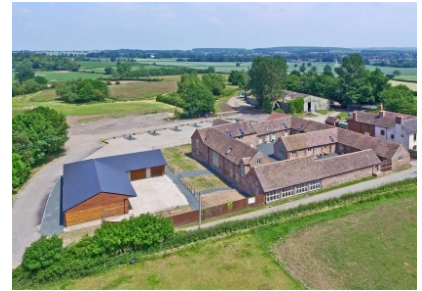
Saxon Meadow Cottage 5, The Wyke, Shifnal