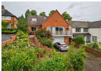
The Tying, Westgate Drive, Bridgnorth