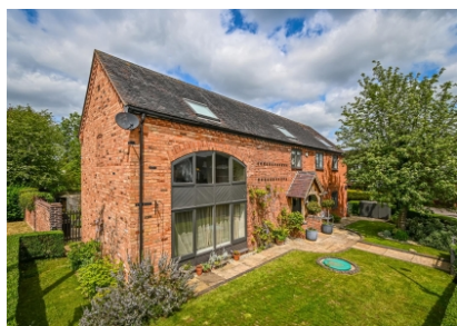
1 The Paddock, Claverley, Wolverhampton