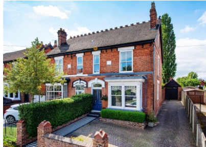
7 Richmond Road, Finchfield, Wolverhampton