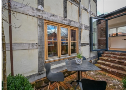
Park Cottage, Abbey Foregate, Shrewsbury