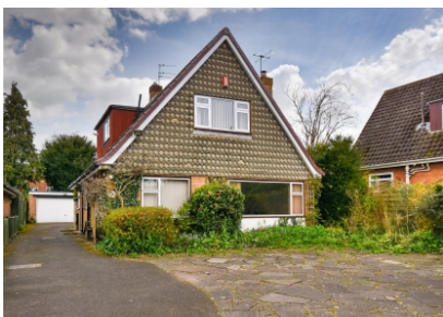
68 Mount Road, Tettenhall Wood, Wolverhampton