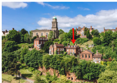
19 St. Marys Steps, Bridgnorth