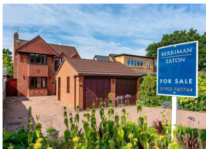
Bridgeside, 187 Birches Road, Codsall