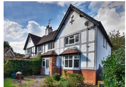
2 Danescourt Cottages, Danescourt Road, Tettenhall