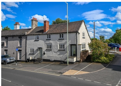
33 Salop St, Bridgnorth