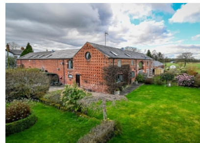
The Oak House, Oaklands Court, Lower Rudge, Pattingham