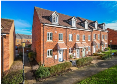
75 Rastrick Close, Bridgnorth