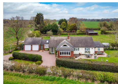
Holly Lodge, Church Lane, Boningale, Albrighton