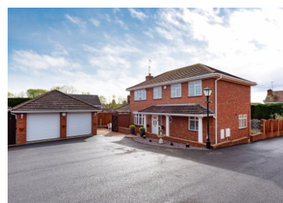
St. Johns Close, Swindon, Dudley