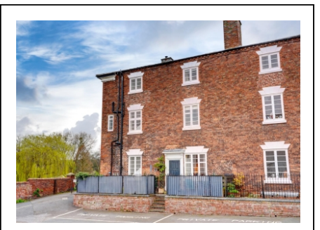
Severn Side, Stourport-On-Severn