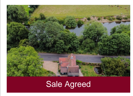
Holme Cottage, Knowle Sands, Bridgnorth