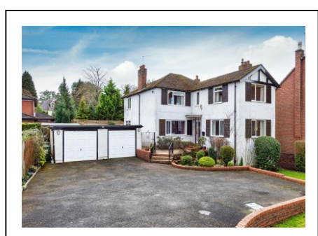
Quarry House, 30 Lansdowne Avenue, Codsall