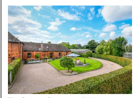
The Stables, Chesterton, Bridgnorth