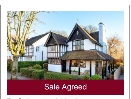
Far Croft, 19 Newbridge Avenue, Newbridge