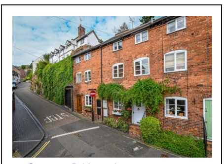
70 Cartway, Bridgnorth