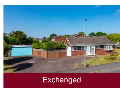
44 Woodcote Road, Wolverhampton