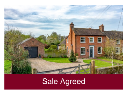
The Little House, 7 Tong Norton, Shifnal