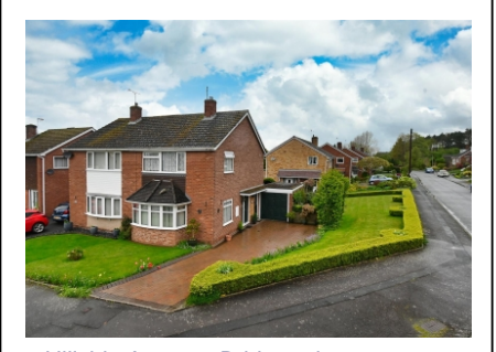
3 Hillside Avenue, Bridgnorth