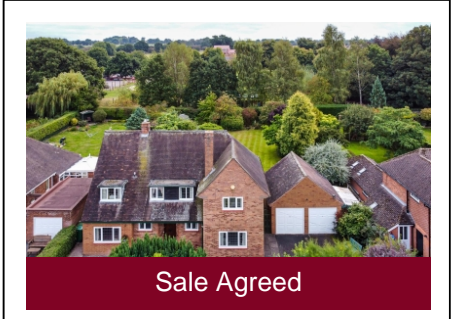
Rossleigh, Shaw Lane, Albrighton