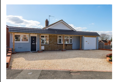
21 Uplands Drive, Wombourne, Wolverhampton