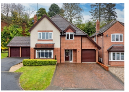
Hillside, Wombourne, Wolverhampton