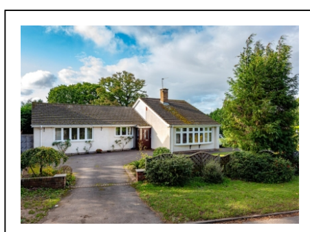
12 Keepers Lane, Codsall, Wolverhampton