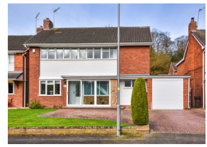
97 Henwood Road, Compton, Wolverhampton