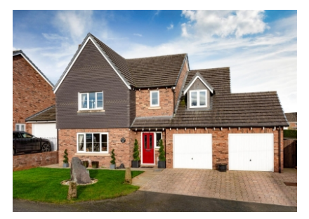
41 Kings Road, Calf Heath, Wolverhampton