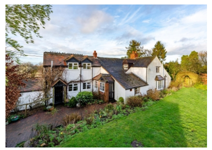
Greystoke Cottage, Kiddemore Green, Brewood