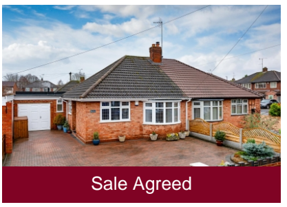
13 Kirkstone Crescent, Wombourne, Wolverhampton