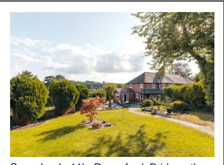
Sunnybank, 11b, Danesford, Bridgnorth