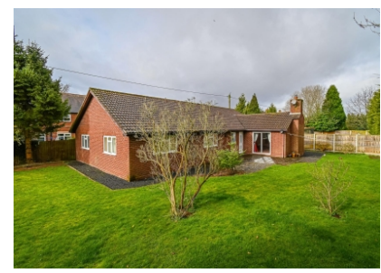
The Old Kiln, Church Lane, Bridgnorth