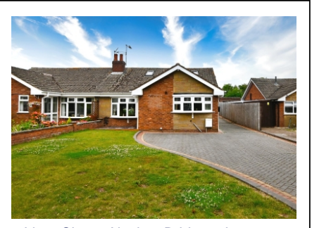
6 Lime Close, Alveley, Bridgnorth