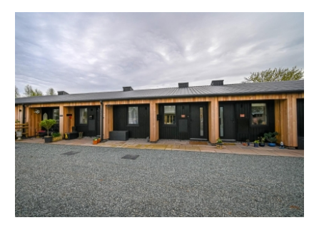
The Willow, 3 The Closes, Sutton Farm, Claverley, Wolverhampton