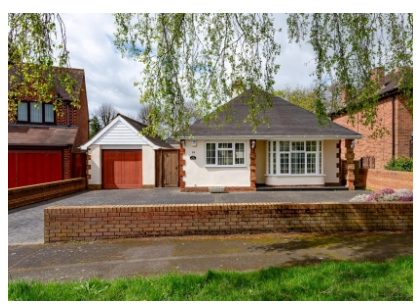
19 Foley Avenue, Tettenhall, Wolverhampton