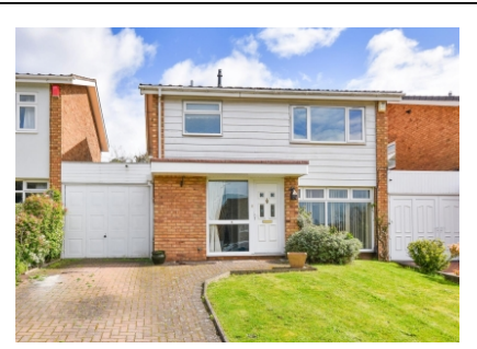
4 Forton Close, Compton, Wolverhampton