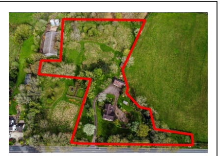
Dodds Green Cottage, 79 Dodds Green, Alveley, Bridgnorth