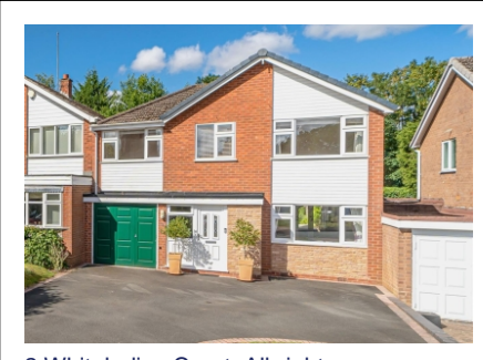
2 Whiteladies Court, Albrighton, Wolverhampton