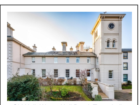
2 Old Hall, Wergs Hall Road, Tettenhall