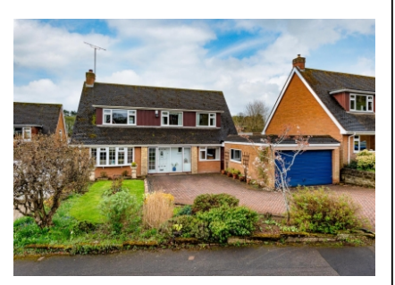
18 Quail Green, Wightwick, Wolverhampton