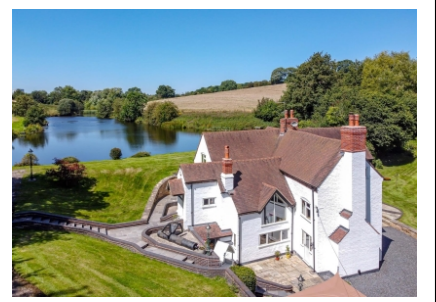
Hem Mill, The Hem, Shifnal