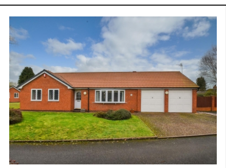
1 The Courts, Albrighton, Wolverhampton