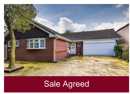
28a Mount Road, Mount Road, Tettenhall Wood