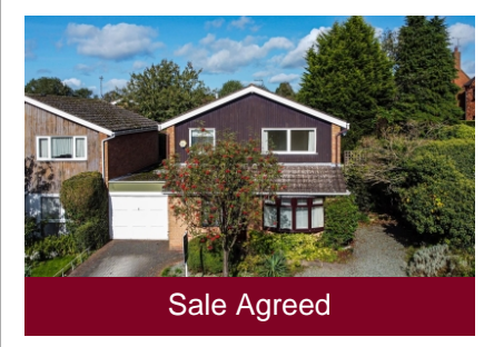
2 Beech Close, Pattingham, Wolverhampton