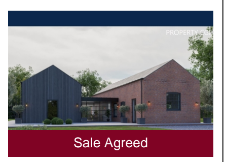
Plot 2, Bynd Lane, Billingsley, Bridgnorth