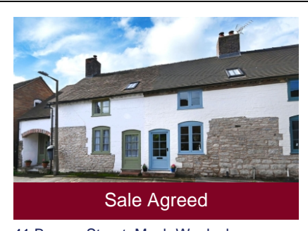
41 Barrow Street, Much Wenlock