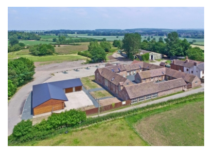
Saxon Meadow Cottage 5, The Wyke, Shifnal