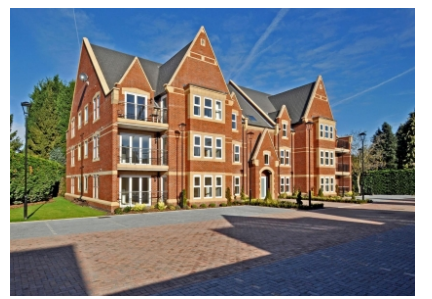
5 Ellen Place, Henry Fowler Drive, Tettenhall