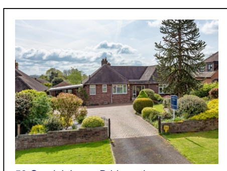
53 Conduit Lane, Bridgnorth