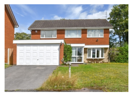
4 The Heathlands, Wombourne, Wolverhampton