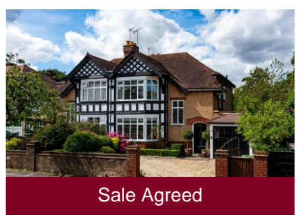
2 Highlands Road, Finchfield, Wolverhampton