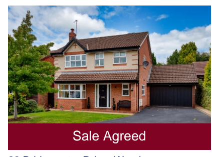
22 Bridgewater Drive, Wombourne, Wolverhampton