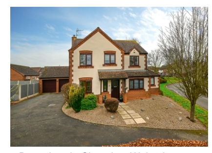
3 Danesbrook, Claverley, Wolverhampton