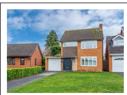
1 Redford Drive, Albrighton