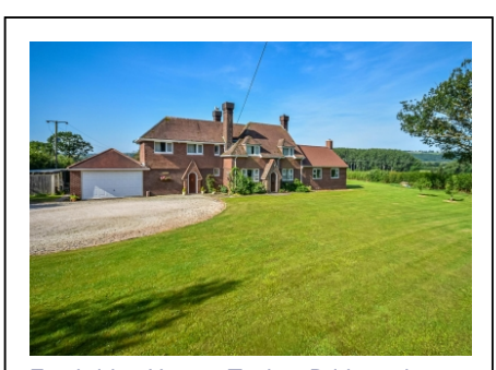
Footbridge House, Tasley, Bridgnorth