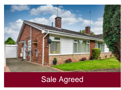
10 Wombourne Road, Swindon, Dudley