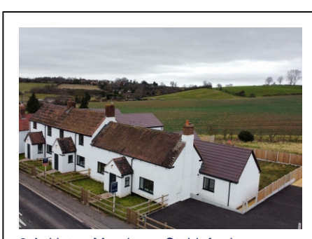
3 Ackleton Meadows, Stableford, Bridgnorth