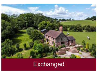
Beggar Hill House, 62 Muckley Cross, Acton Round, Bridgnorth