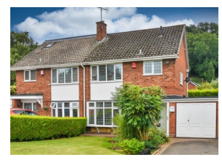
23 Chequers Avenue, Wombourne, Wolverhampton