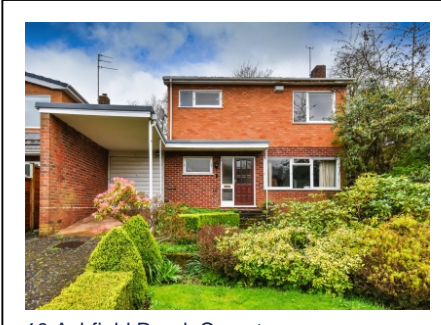
10 Ashfield Road, Compton, Wolverhampton