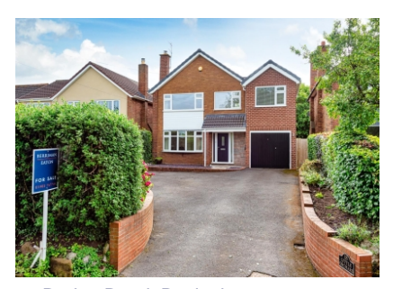
18 Rudge Road, Pattingham, Wolverhampton