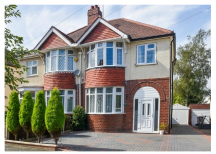
28 Links Road, Penn, Wolverhampton