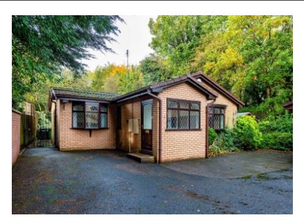
6 Finchfield Hill, Compton, Wolverhampton