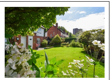
29 Bath Avenue, Wolverhampton