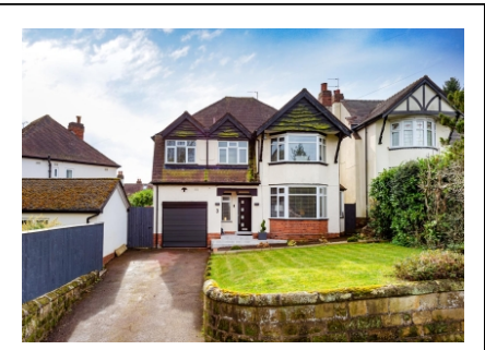
3 Lothians Road, Tettenhall, Wolverhampton