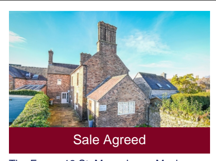
The Forge, 13 St. Marys Lane, Much Wenlock