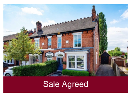
7 Richmond Road, Finchfield, Wolverhampton