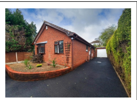
10 Planks Lane, Wombourne, Wolverhampton