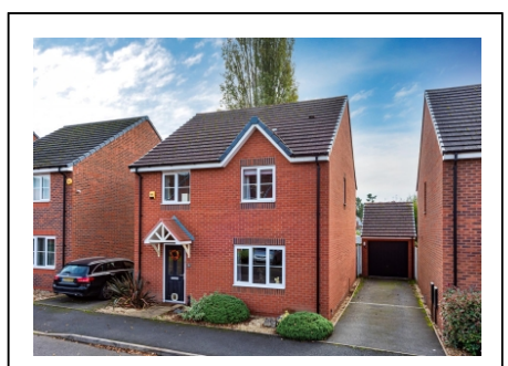
39 Rakegate Close, Oxley, Wolverhampton