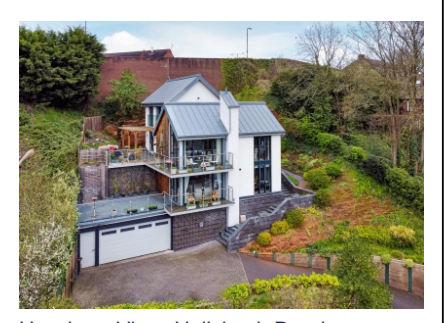
Hawthorn View, Hollybush Road, Bridgnorth