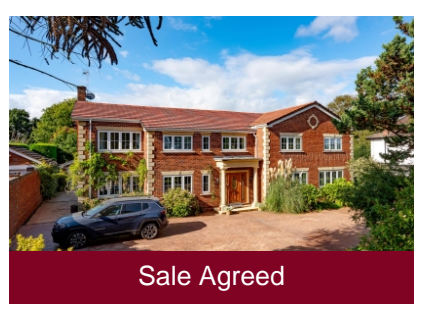
Elan Ridge. Pool House Road, Wombourne, Wolverhampton