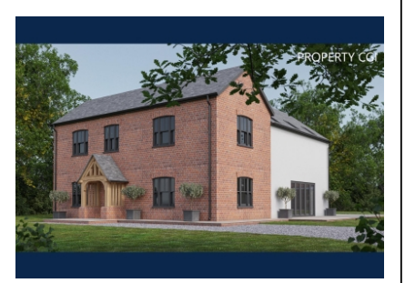
Plot 1, Bynd Lane, Billingsley, Bridgnorth