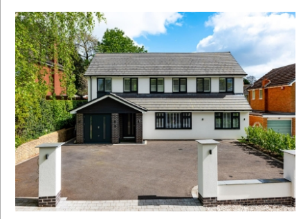
1 Chestnut Close, Codsall, WV8 2EZ