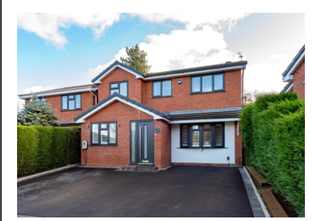
41 Ascot Drive, Dudley