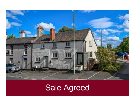
33 Salop St, Bridgnorth