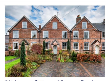
2 Labernum Cottages, Vicarage Road, Penn, Wolverhampton