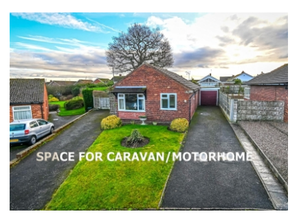
51 Linley View Drive, Bridgnorth