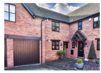
17 Bridgeman Court, Weston-Under-Lizard, Shifnal