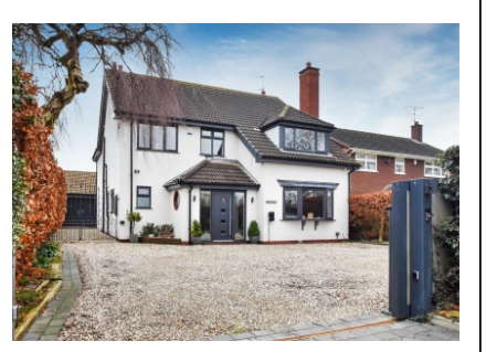
Clearview, Straight Mile, Calf Heath, Wolverhampton