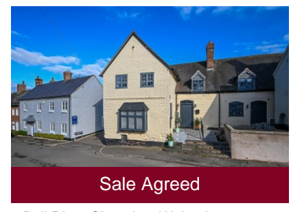
7 Bull Ring, Claverley, Wolverhampton