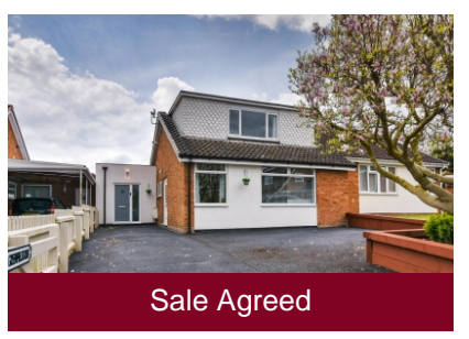
3 Greenfields Road, Wombourne, Wolverhampton