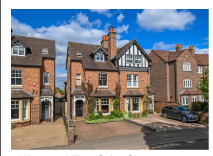
2 Westgate Villas, Salop Street, Bridgnorth