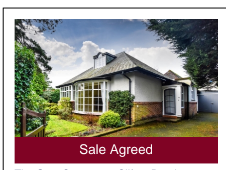
The Grey Cottage 19 Clifton Road, Wolverhampton