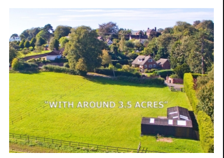
Half Acre House, Stableford, Bridgnorth