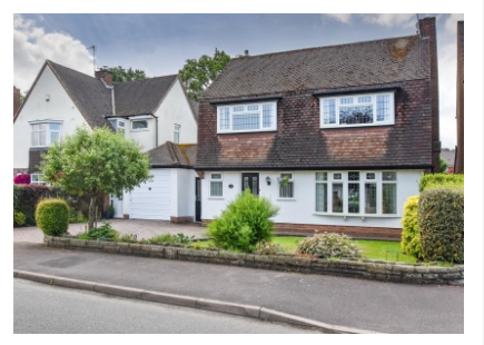
57 Oaken Park, Codsall, Wolverhampton