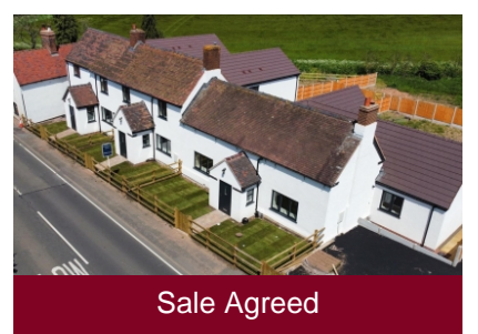
2 Ackleton Meadows, Stableford, Bridgnorth