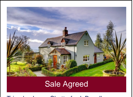
Trimpley Lane, Shatterford, Bewdley