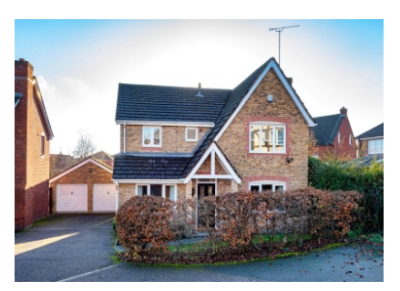
17 Holendene Way, Wombourne, Wolverhampton