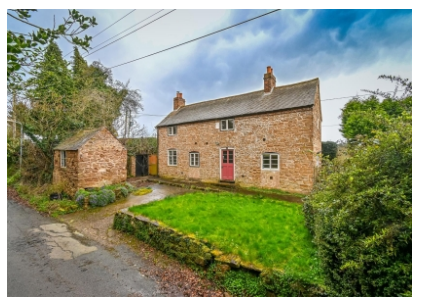
148 Broad Oak, Six Ashes