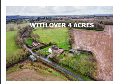
Keepers Cottage, Colemore Green, Bridgnorth