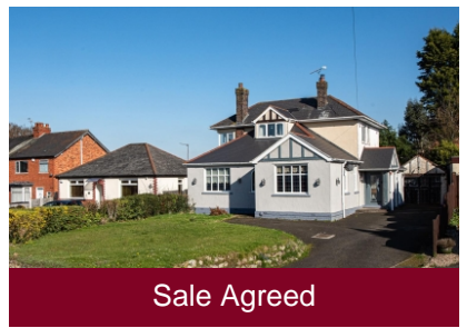
153 Trysull Road, Merry Hill, Wolverhampton