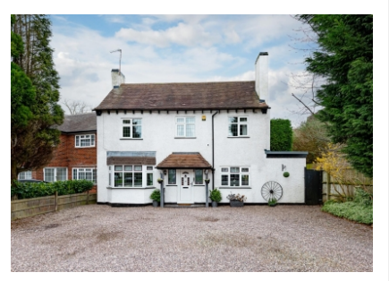
17 Stubbs Road, Wolverhampton