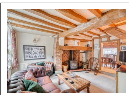
Bridgend Cottage, 43 Cartway, Bridgnorth