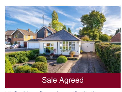
91 Suckling Green Lane, Codsall, Wolverhampton