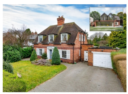
The Dormers, Finchfield Gardens, Finchfield