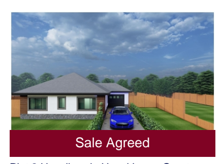
Plot 2 Hazelbrook, Hazel Lane, Great Wyrley