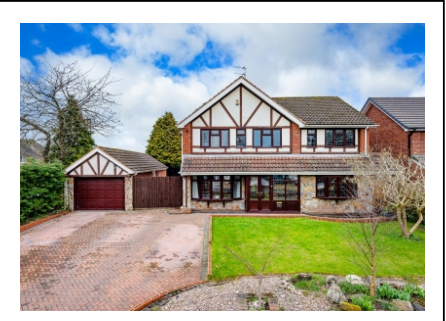
11 Waverley Gardens, Wombourne, Wolverhampton