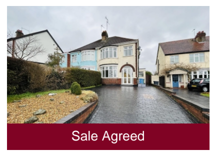
31 Sedgley Road, Penn Common, Penn