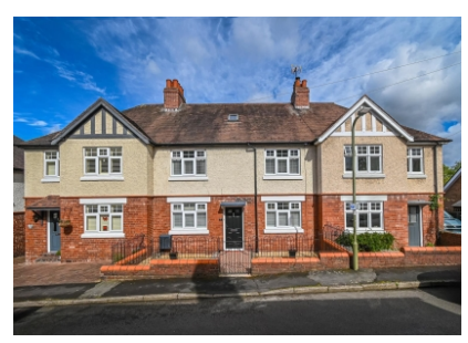
2 Cliff Gardens, Cliff Road, Bridgnorth