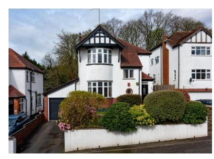
Tudor Crescent, Wolverhampton