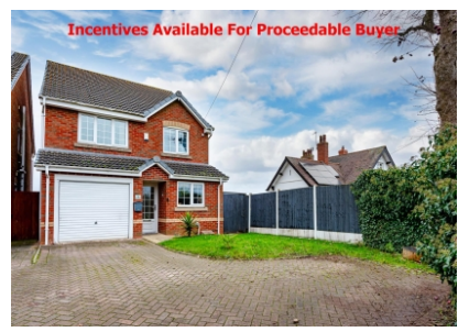
151 Tipton Road, Woodsetton, Dudley