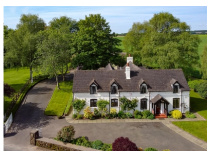
The Little Green, 2 Feiashill Road, Trysull, Wolverhampton