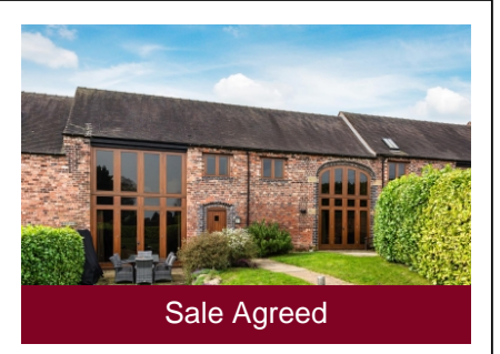
The Corn Barn, 3 East Trescott Barns Bridgnorth Road