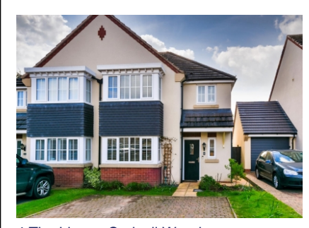
4 The Limes, Codsall Wood, Wolverhampton