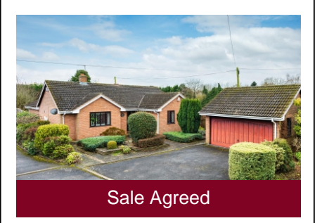
Shadowbrook, 4 Manor Fold, Middle Lane, Oaken