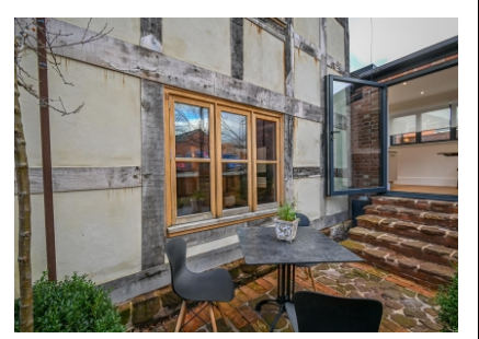
Park Cottage, Abbey Foregate, Shrewsbury