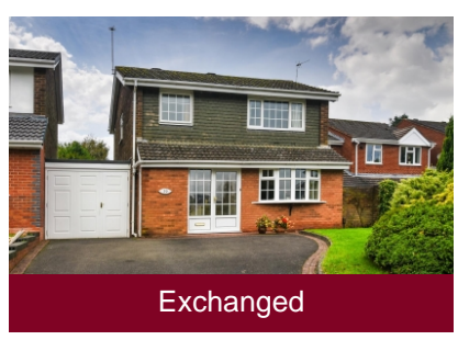
39 Bantock Gardens, Finchfield, Wolverhampton