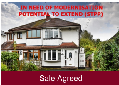
Hillcroft, Penstone Lane, Lower Penn