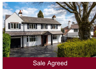
94 Codsall Road, Tettenhall, Wolverhampton