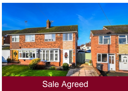
20 Orchard Drive, Bridgnorth