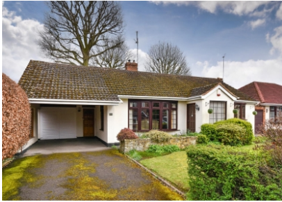
30 Sabrina Road, Wightwick, Wolverhampton