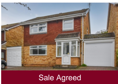
6 Surrey Drive, Finchfield