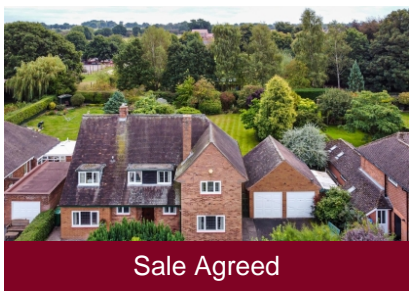
Rossleigh, Shaw Lane, Albrighton