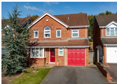
12 Dudmaston Way, Milking Bank, Dudley