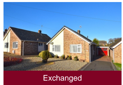
11 Greenleys Crescent, Alveley, Bridgnorth