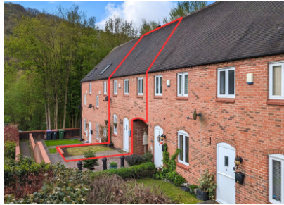
6 The Courtyard, Ironbridge, Telford