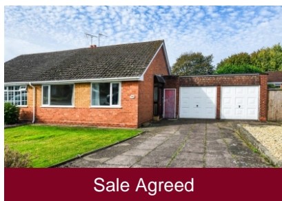
10 Gardeners Way, Wombourne, Wolverhampton