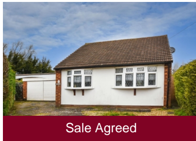
7 Apse Close, Wombourne, Wolverhampton