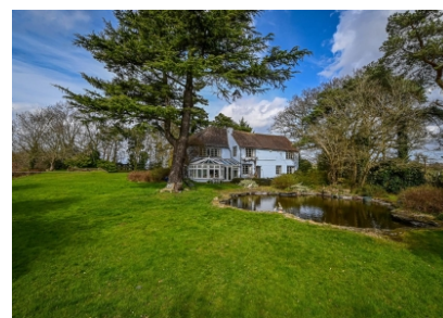
Horseshoes, Netherton, Highley, Bridgnorth