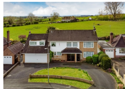
7 Wightwick Hall Road, Wightwick, WV6 8BZ