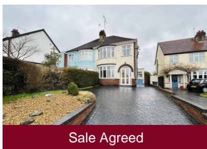
31 Sedgley Road, Penn Common, Penn