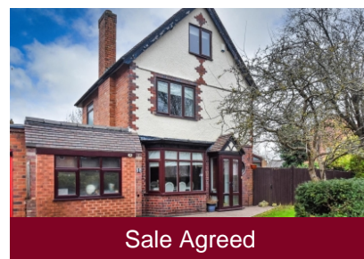
1 Cedar Grove, Bradmore, Wolverhampton