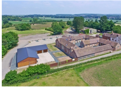
Saxon Meadow Cottage 5, The Wyke, Shifnal