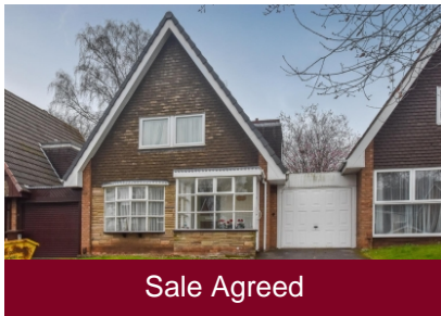
16 Surrey Drive, Finchfield, Wolverhampton