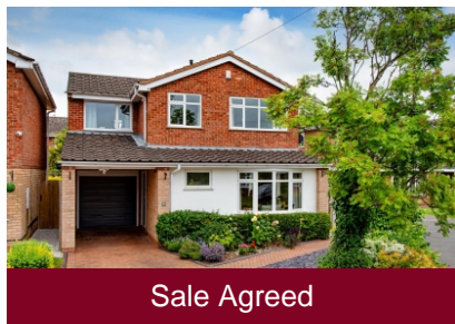
9 Windsor Road, Pattingham