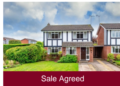
16 Meadow Vale, Codsall, Wolverhampton