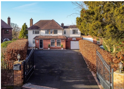
Fern House, Links Avenue, Tettenhall