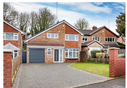
3 St. Marys Close, Dudley