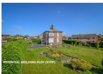
Hookfield House, 81 Victoria Road, Bridgnorth