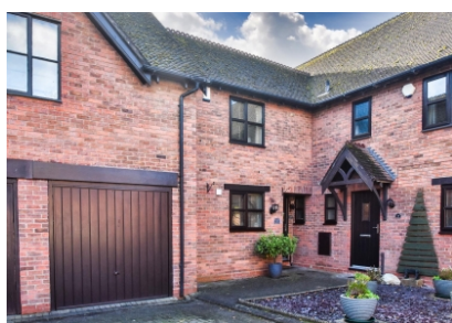
17 Bridgeman Court, Weston-Under- Lizard, Shifnal