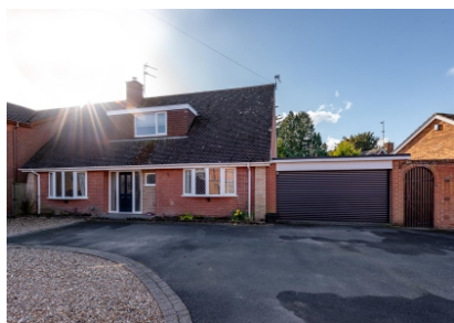
Strathmore, Shaw Lane, Albrighton