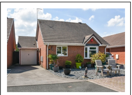
4 Hazelmere Drive, Castlecroft, Wolverhampton