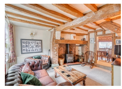
Bridgend Cottage, 43 Cartway, Bridgnorth