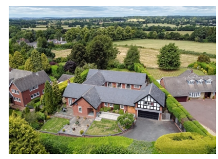
Courtneys, Oaken Drive, Oaken, Codsall