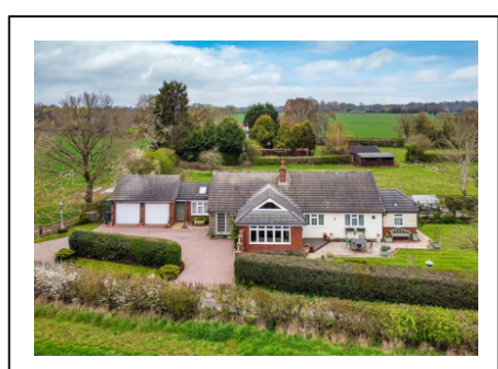
Holly Lodge, Church Lane, Boningale, Albrighton