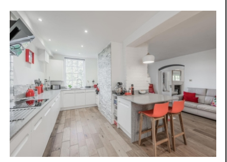
4 Stanmore Mews, Stourbridge Road, Stanmore, Bridgnorth