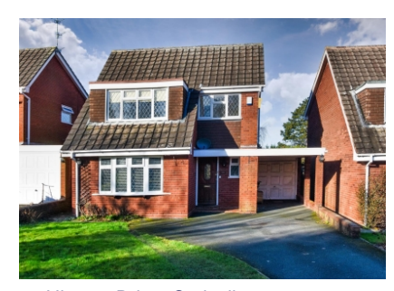
15 Histons Drive, Codsall, Wolverhampton