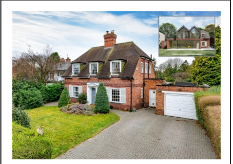
The Dormers, Finchfield Gardens, Finchfield