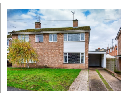
36 Wombourne Road, Swindon, Dudley