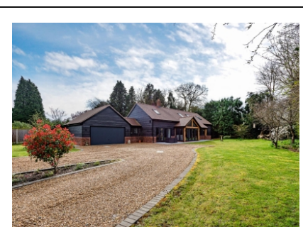
Willow Lodge, 23 High Street, Albrighton