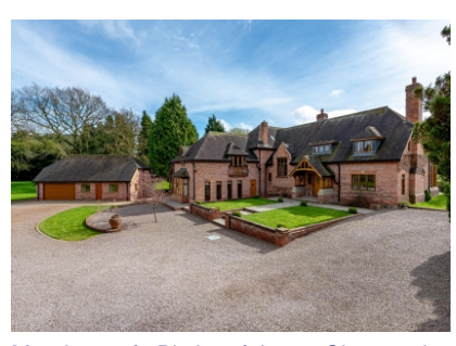
Meadowcroft, Pitchcroft Lane, Chetwynd Aston, Newport, Shropshire, TF10 9AU