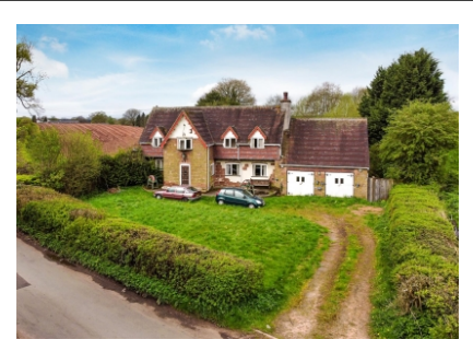
Mill Cottage, Lower Rudge, Pattingham, Wolverhampton