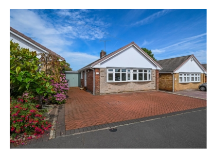
7 Princess Drive, Bridgnorth