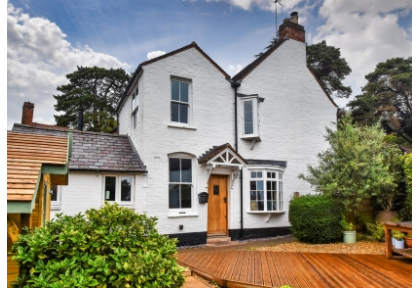
Beech Cottage, 8 The Holloway, Compton