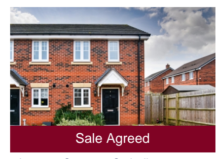
4 Leveson Crescent, Codsall, Wolverhampton