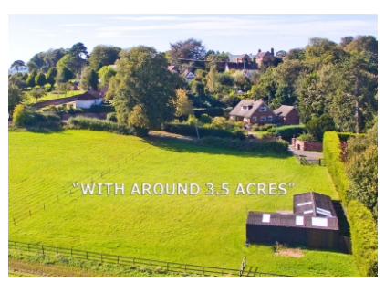
Half Acre House, Stableford, Bridgnorth