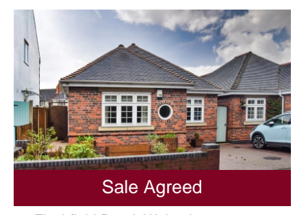
70 Finchfield Road, Wolverhampton