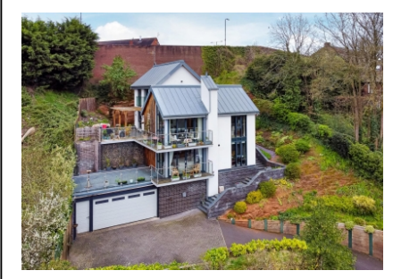
Hawthorn View, Hollybush Road, Bridgnorth