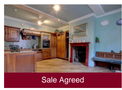
25a High Street, Bewdley