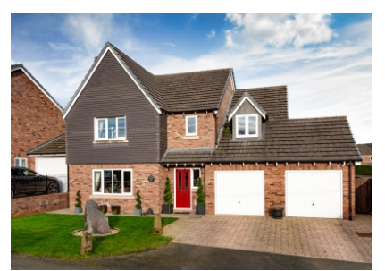
41 Kings Road, Calf Heath, Wolverhampton