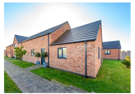
6 Lea Manor Gardens, Albrighton, Wolverhampton