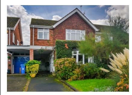
86 Van Diemans Road, Wombourne, Wolverhampton