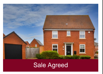
4 Lickey Close, Baggeridge Village, Dudley