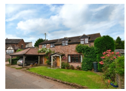
Finger Cottage, 123 Birds Green, Alveley, Bridgnorth