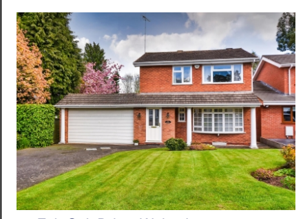
18 Fair Oak Drive, Wolverhampton