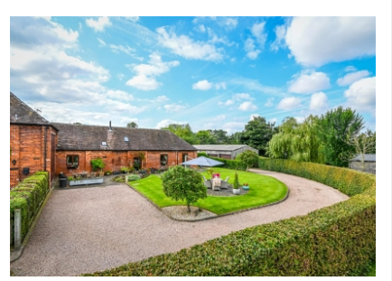
The Stables, Chesterton, Bridgnorth