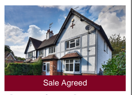
2 Danescourt Cottages, Danescourt Road, Tettenhall