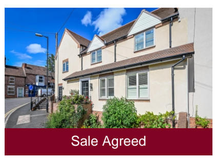
23 Pound Street, Bridgnorth