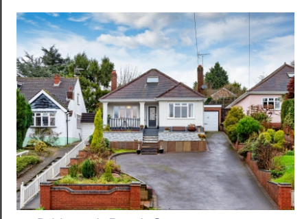
74 Bridgnorth Road, Compton