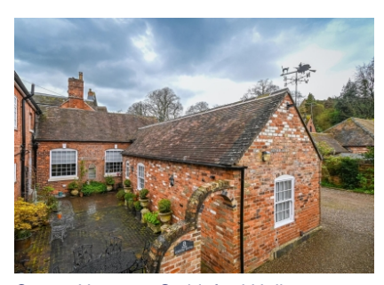
Corner House, 3 Stableford Hall, Stableford, Bridgnorth