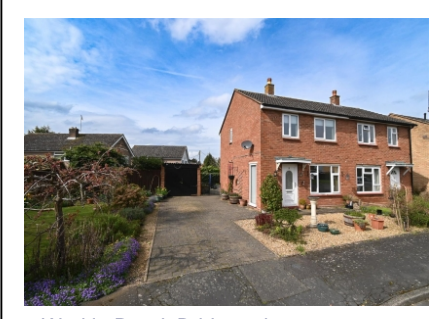
9 Wrekin Road, Bridgnorth