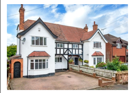
23 Hinckes Road, Tettenhall, Wolverhampton