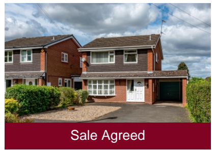
191 Common Road, Wombourne, Wolverhampton