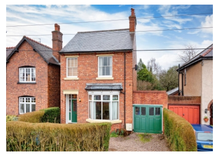
29 Walk Lane, Wombourne