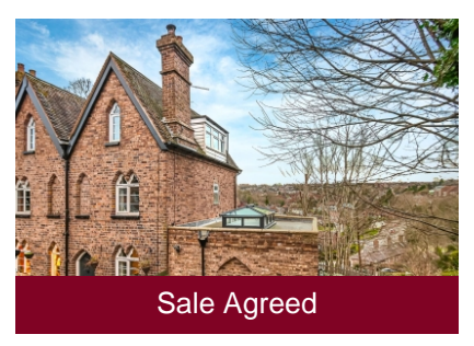
14 West Castle Street, Bridgnorth