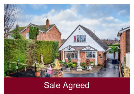
5 Bratch Common Road, Wombourne, Wolverhampton