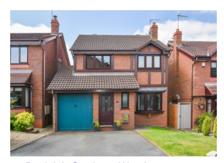
35 Penleigh Gardens, Wombourne, Wolverhampton