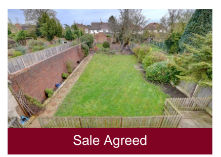
Grosvenor Avenue. Kidderminster