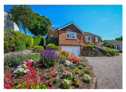
Three Ridges, Hilton, Bridgnorth