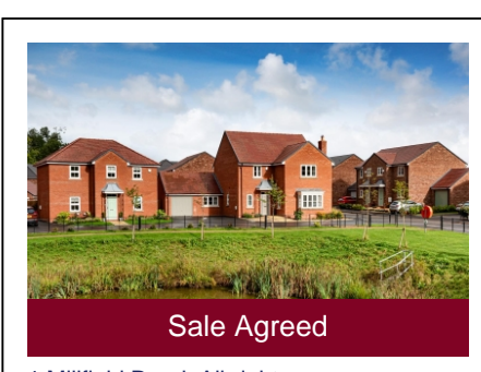
1 Millfield Road, Albrighton, Wolverhampton