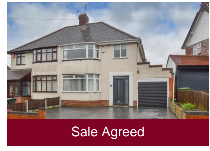
19 Sandringham Road, Penn, Wolverhampton