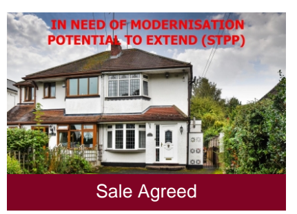
Hillcroft, Penstone Lane, Lower Penn