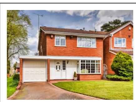
1 Foxlands Drive, Wolverhampton