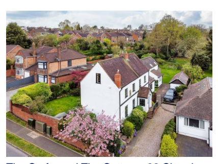
The Crofts and The Cottage, 32 Church Hill, Penn