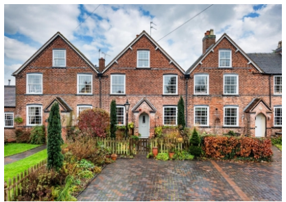
2 Labernum Cottages, Vicarage Road, Penn, Wolverhampton