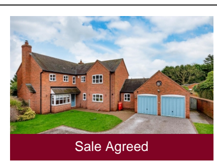
Rivendell, Park Lane, Lapley, Stafford