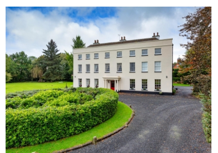
11 Leaton Hall, Church Lane, Bobbington, Stourbridge