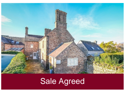
The Forge, 13 St. Marys Lane, Much Wenlock