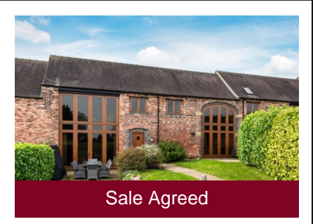
The Corn Barn, 3 East Trescott Barns Bridgnorth Road