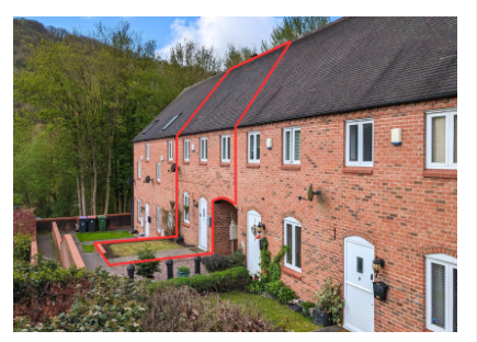
6 The Courtyard, Ironbridge, Telford