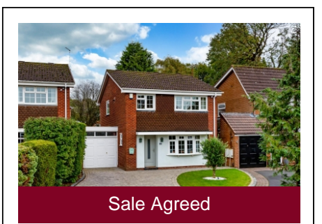
6 Tanglewood Grove, Dudley