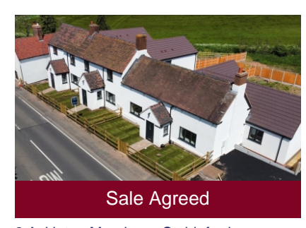
2 Ackleton Meadows, Stableford, Bridgnorth