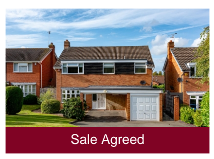
11 Copper Beech Drive, Wombourne, Wolverhampton