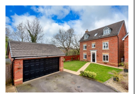
Oaklands, Wombourne, Wolverhampton