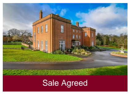
Upper Mill Meadow, Gatacre Hall, Gatacre, Claverley, Wolverhampton