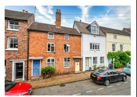
24 St. Marys Street, Bridgnorth