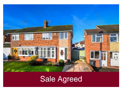
20 Orchard Drive, Bridgnorth