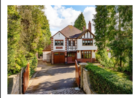
Dalkeith, 25 Tinacre Hill, Wightwick, WV6 8DB