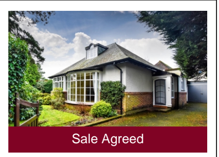
The Grey Cottage 19 Clifton Road, Wolverhampton