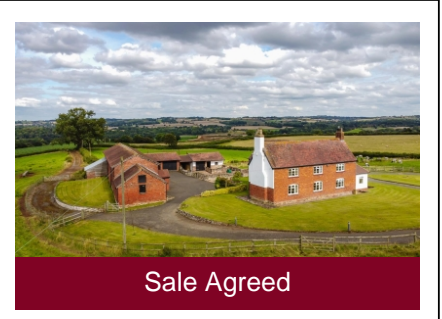
Lower Sutton Farm, Sutton, Chelmarsh, Bridgnorth