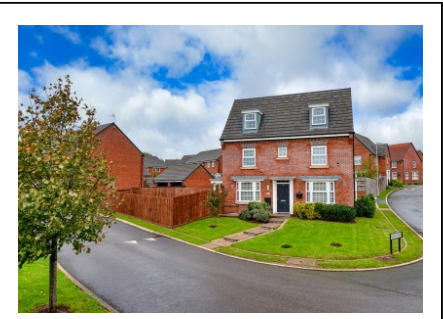
35 Chalmers Road, Baggeridge Village, Dudley