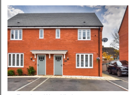
35 Foxglove Way, Himley