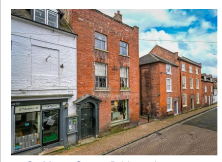
64 St. Marys Street, Bridgnorth