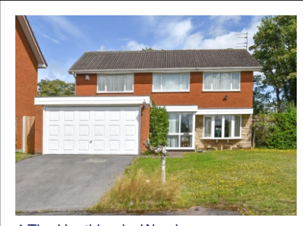
4 The Heathlands, Wombourne, Wolverhampton