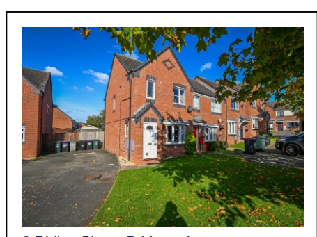
8 Ridley Close, Bridgnorth