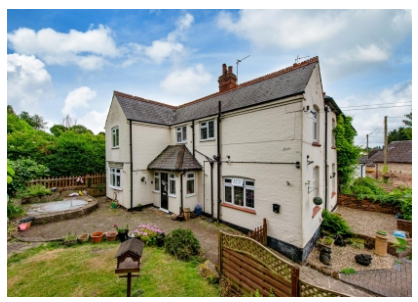
1 & 2 New Cottages, Oaken Lane, Oaken