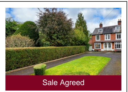
Fernleigh, 35 Oaken Lanes, Codsall