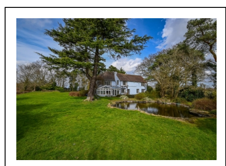
Horseshoes, Netherton, Highley, Bridgnorth