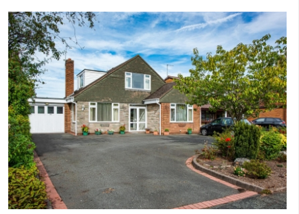
83 Cranmere Avenue, Tettenhall, Wolverhampton