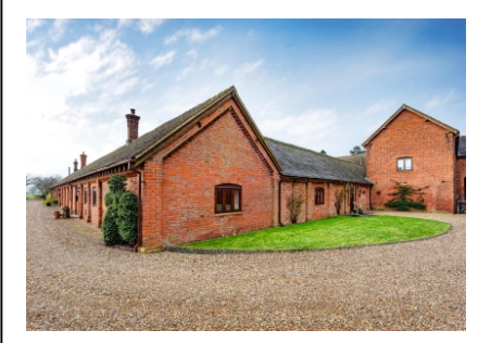
The Byre, Home Farm Road, Burnhill Green, Wolverhampton