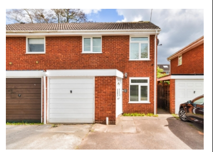
Forge Leys, Wombourne