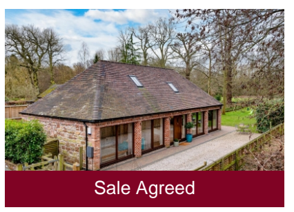
Eagle Barn, 4 Patshull Gardens, Albrighton