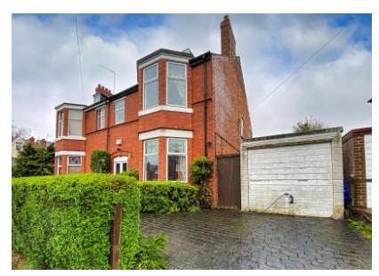
26 Marchant Road, Compton, WV3 9QG