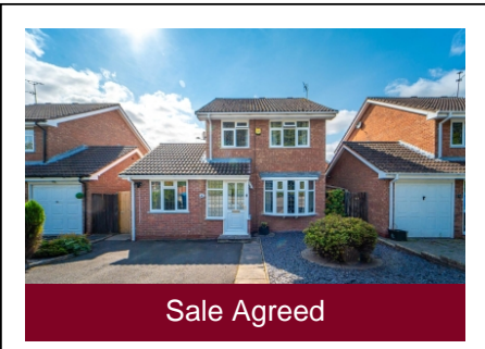
42 Gainsborough Drive, Perton, Wolverhampton