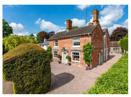
Beckbury House, Beckbury, Shifnal