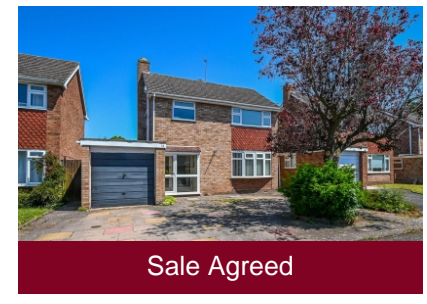
14 The Orchard, Albrighton, Wolverhampton