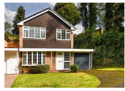
39 Alpine Way, Compton, Wolverhampton