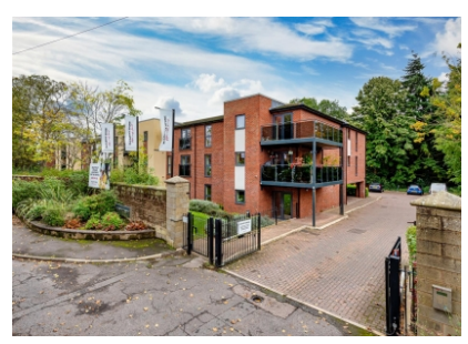
6 Thorneycroft, Wood Road, Tettenhall