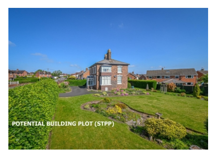
Hookfield House, 81 Victoria Road, Bridgnorth