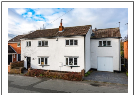
109 Rookery Road, Wombourne, Wolverhampton