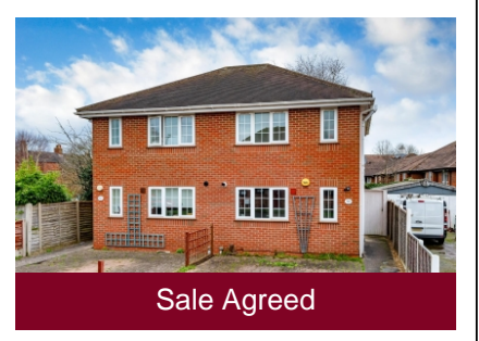
48 Abney Avenue, Albrighton