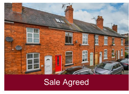
46 Severn Street, Bridgnorth