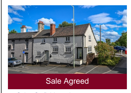
33 Salop St, Bridgnorth