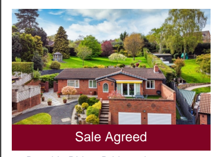
18 Bramble Ridge, Bridgnorth