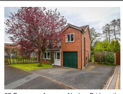
27 Greenway Avenue, Alveley, Bridgnorth