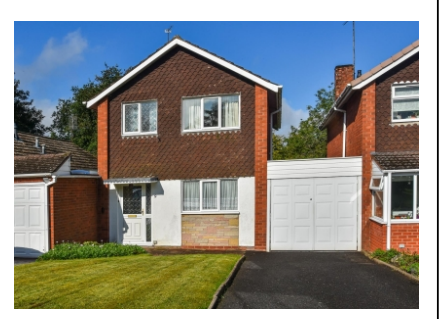
9 Westhill, Wolverhampton