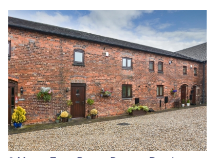
3 Manor Farm Barns, Bognop Road, Essington