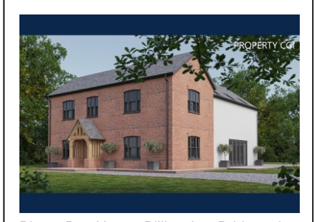
Plot 1, Bynd Lane, Billingsley, Bridgnorth