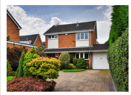
39 High Street, Pattingham, Wolverhampton