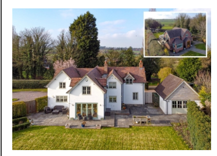
Oaklea and The Cottage, Damson Lane, Weston Heath, Shifnal