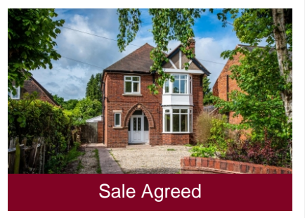
120 Amos Lane, Wednesfield