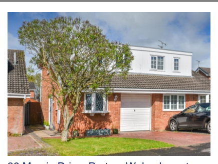
39 Mercia Drive, Perton, Wolverhampton