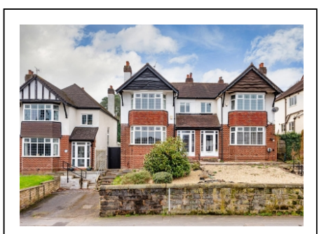
83 Lower Street, Wolverhampton