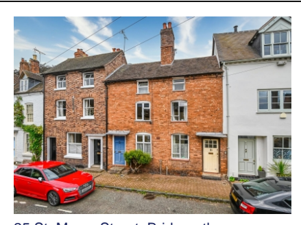
25 St. Marys Street, Bridgnorth