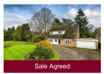
59 Woodthorne Road South. Tettenhall