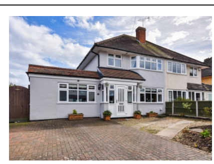
34 Delaware Avenue, Albrighton