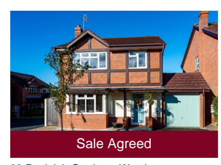
39 Penleigh Gardens, Wombourne, Wolverhampton