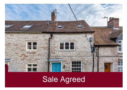
5a King Street, Much Wenlock, Shropshire