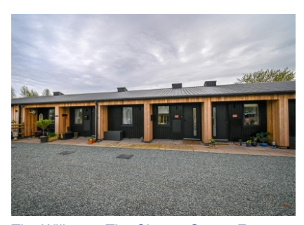
The Willow, 3 The Closes, Sutton Farm, Claverley, Wolverhampton