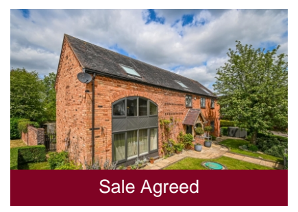
1 The Paddock, Claverley, Wolverhampton