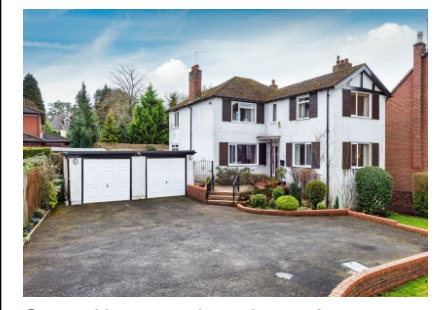
Quarry House, 30 Lansdowne Avenue, Codsall