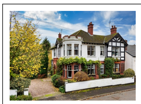
Battlefield House, 14 Battlefield Hill, Wombourne, Wolverhampton