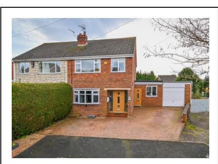
15 Crannmore Drive, Highley, Bridgnorth