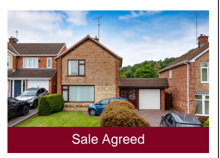
51 Strathmore Crescent, Wombourne