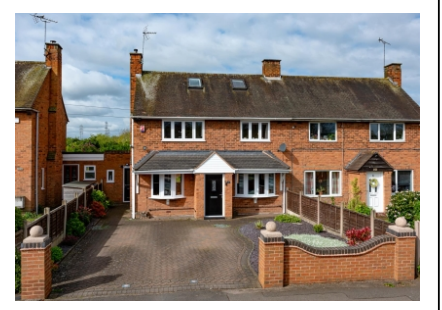
Giggetty Lane, Wombourne, Wolverhampton