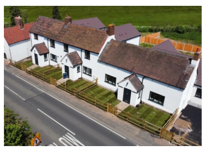
1 Ackleton Meadows, Stableford, Bridgnorth