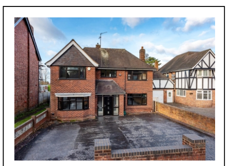
288b Penn Road, Wolverhampton