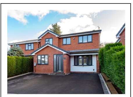
41 Ascot Drive, Dudley