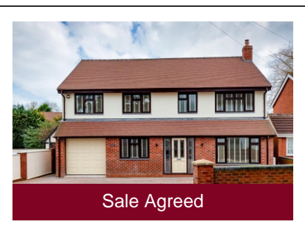
Ravenscroft, Bell Road, Trysull, Wolverhampton