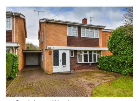
30 Sytch Lane, Wombourne, Wolverhampton