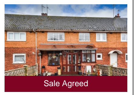
2 Woden Close, Wombourne, Wolverhampton