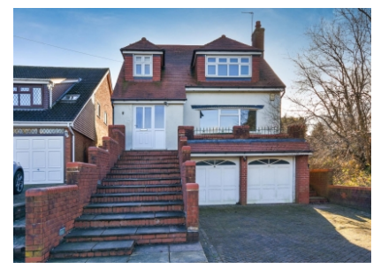
25 Bognop Road, Essington, Wolverhampton