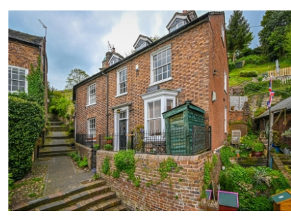
19 St. Marys Steps, Bridgnorth