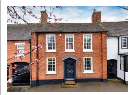
Saredon House, 28 Stafford Street, Brewood