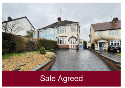
31 Sedgley Road, Penn Common, Penn