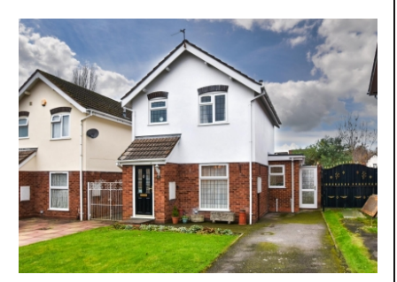
8 Laburnum Street, Wolverhampton