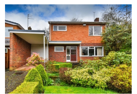
10 Ashfield Road, Compton, Wolverhampton