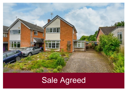
49 Oldbury Wells, Bridgnorth