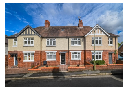
2 Cliff Gardens, Cliff Road, Bridgnorth