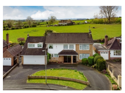
7 Wightwick Hall Road, Wightwick, WV6