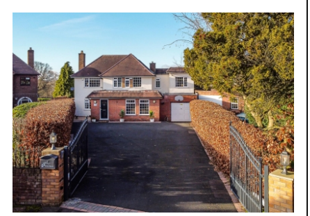
Fern House, Links Avenue, Tettenhall