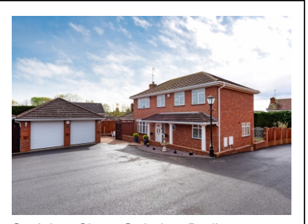
St. Johns Close, Swindon, Dudley