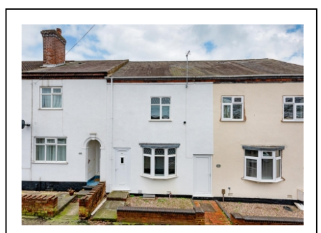
126a Clifton Street, Sedgley