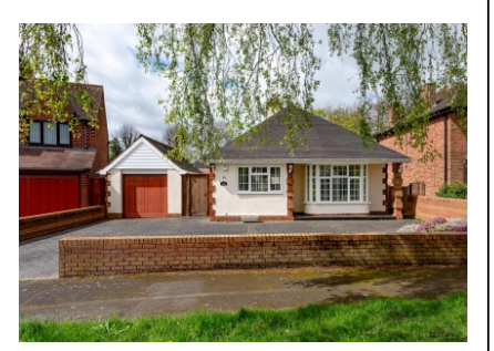
19 Foley Avenue, Tettenhall, Wolverhampton