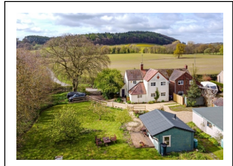
6 The Row, Easthope, Much Wenlock