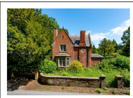
Wergs Hall Gardens, Wergs Hall Road, Tettenhall