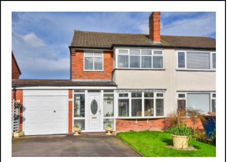
12 Oakfield Road, Codsall, Wolverhampton