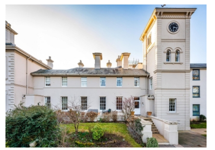
2 Old Hall, Wergs Hall Road, Tettenhall