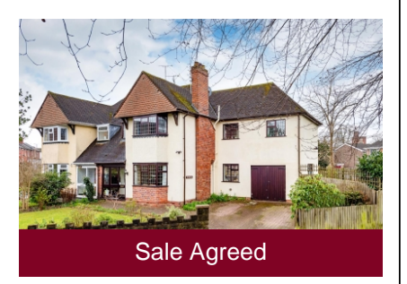
The Homestead, Westland Avenue, Compton