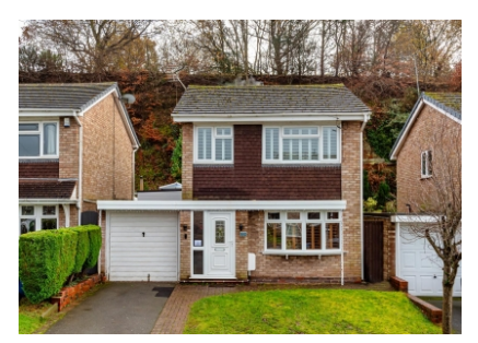
23 Redcliffe Drive, Wombourne, South Stafforshire