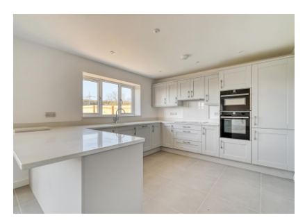
Green Acres, 3 Rowan Grange, Broseley