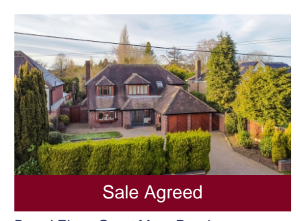
Broad Elms, Great Moor Road, Pattingham