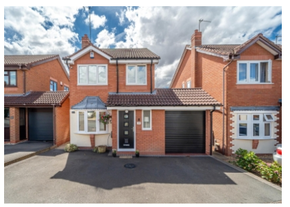
23 Penleigh Gardens, Wombourne