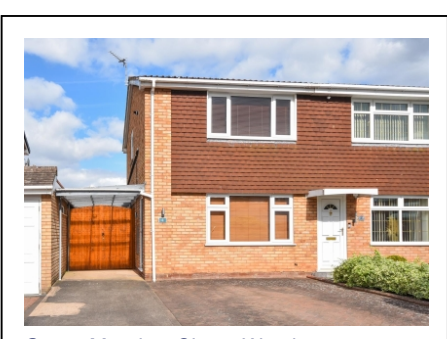
Green Meadow Close, Wombourne, Wolverhampton