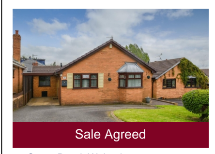
56 Coton Road, Wolverhampton