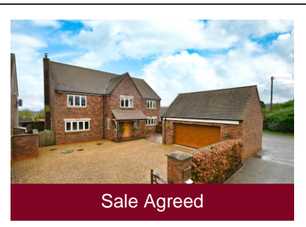
Faintree Heights, Faintree, Bridgnorth