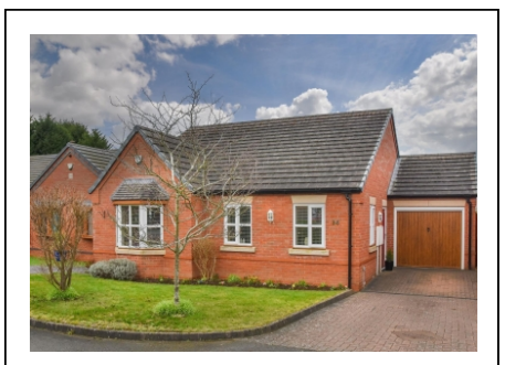
14 Berkeley Close, Perton, Wolverhampton