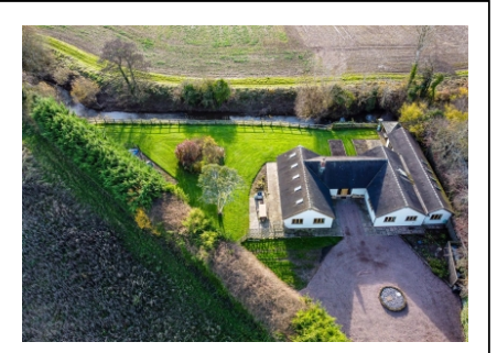
Riverside Bungalow, Muckley Cross, Acton Round, Bridgnorth