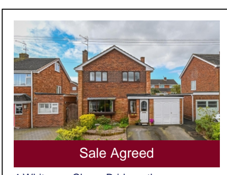
4 Whitmore Close, Bridgnorth