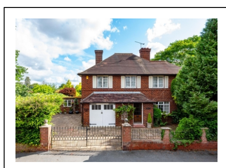
Oxleaze, Grange Road, Albrighton