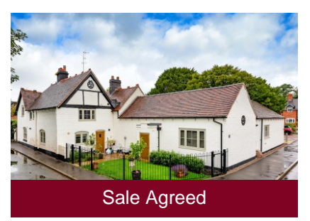
5 Plough Meadows, Trysull