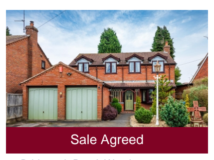
92 Bridgnorth Road, Wombourne, Wolverhampton