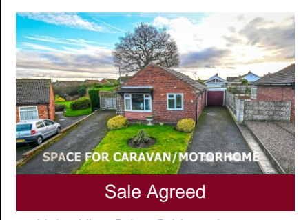
51 Linley View Drive, Bridgnorth