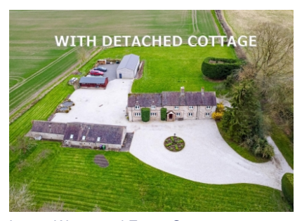
Lower Westwood Farm, Stretton Westwood, Much Wenlock