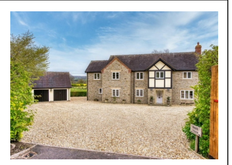
Beech House, Munslow, Shropshire