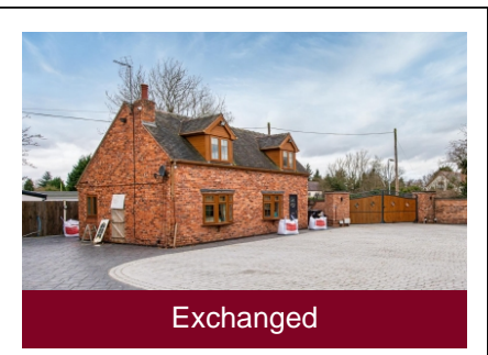
Granary Cottage, Dark Lane, Cross Green, Wolverhampton