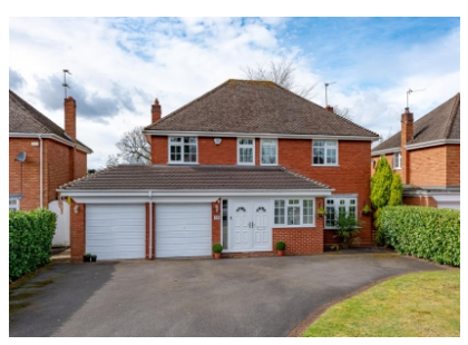
18 Corfton Drive, Tettenhall