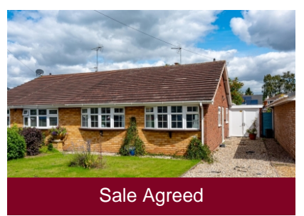
68 Clee View Road, Wombourne, Wolverhampton