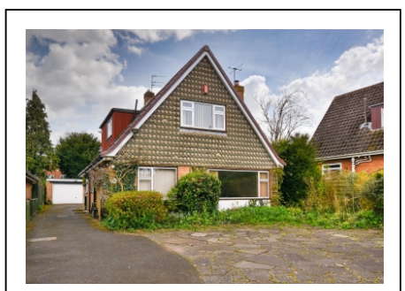
68 Mount Road, Tettenhall Wood, Wolverhampton