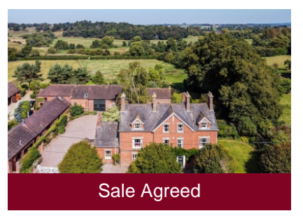
Roughton Farmhouse, Roughton, Bridgnorth