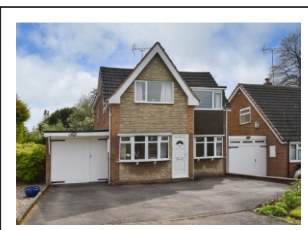
56 Bantock Gardens, Finchfield