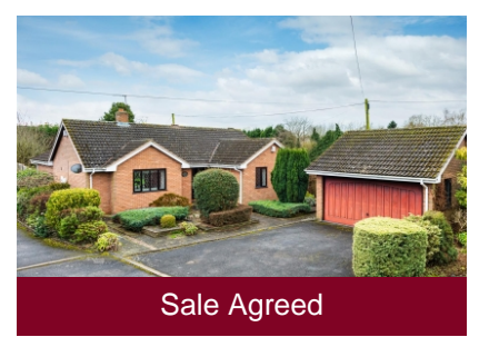
Shadowbrook, 4 Manor Fold, Middle Lane, Oaken