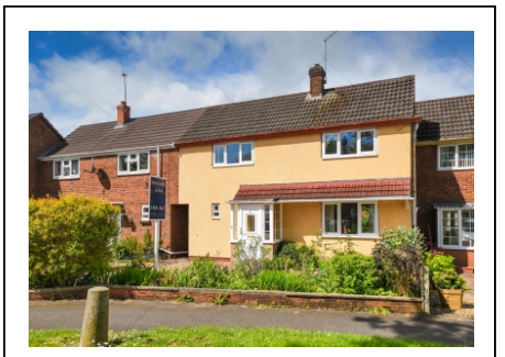
71 Cornwall Road, Tettenhall Wood