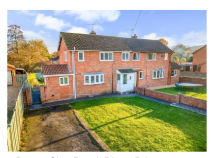
1 Brown Clee Road, Ditton Priors, Bridgnorth