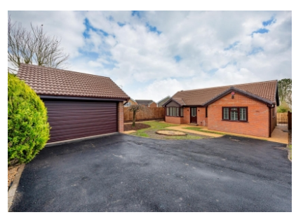
3 Montford Grove, Sedgley, Dudley