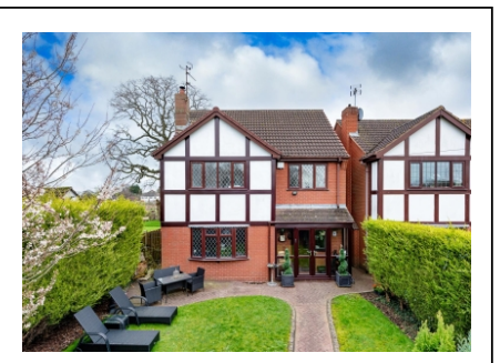
Waterford, Ball Lane, Coven Heath, Wolverhampton