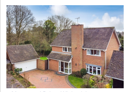
5 Mayswood Drive, Wightwick