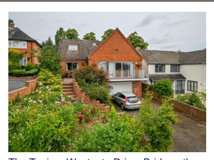
The Tyning, Westgate Drive, Bridgnorth