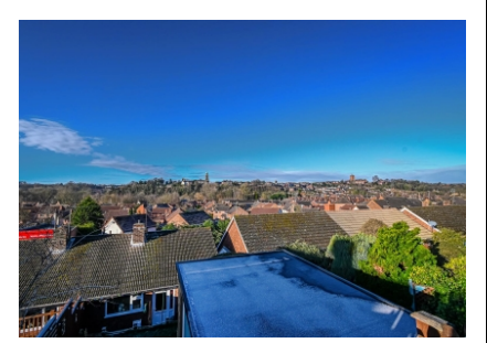
5 River View, Bridgnorth