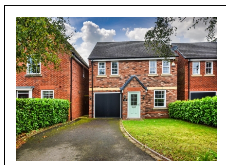
Eden House, Wombourne Road, Swindon, Dudley