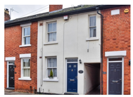
9 Nursery Walk, Wolverhampton