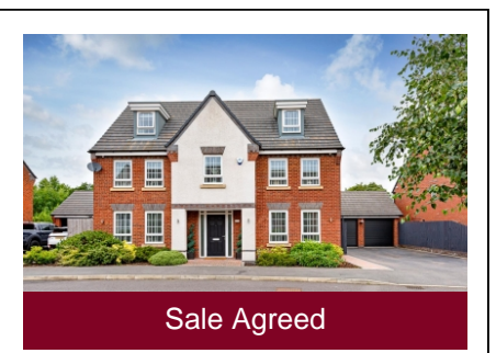
10 Lydiate Hill Road, Baggeridge Village