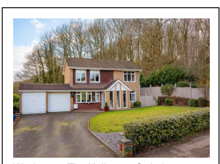
Wychaven, The Holloway, Swindon, Dudley