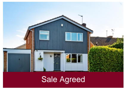
4 Beech Close, Pattingham, Wolverhampton