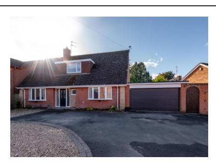
Strathmore, Shaw Lane, Albrighton