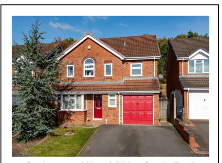
12 Dudmaston Way, Milking Bank, Dudley