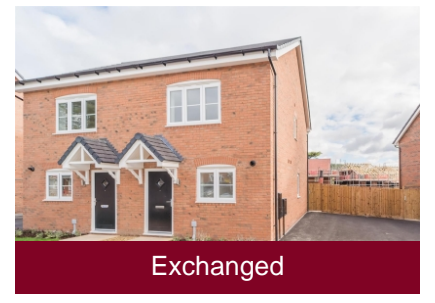
Plot 4, Fletchers Rise, Wombourne