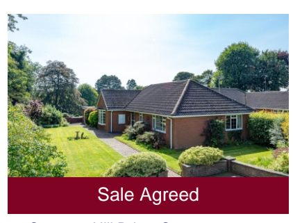
11 Compton Hill Drive, Compton, Wolverhampton