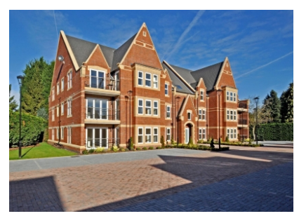
5 Ellen Place, Henry Fowler Drive, Tettenhall