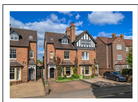
2 Westgate Villas, Salop Street, Bridgnorth