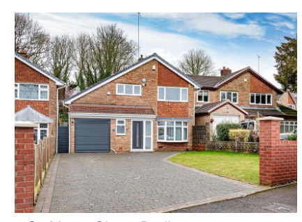
3 St. Marys Close, Dudley