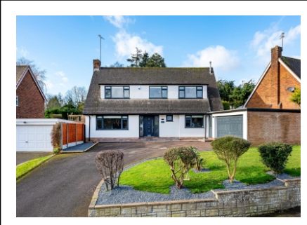
25 Perton Brook Vale, Wightwick