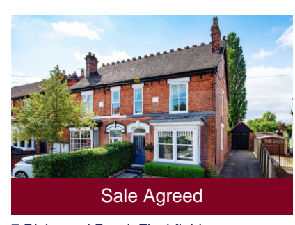
7 Richmond Road, Finchfield, Wolverhampton