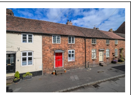
28 Whitburn Street, Bridgnorth