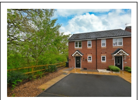
29 Hitchens Way, Highley, Bridgnorth