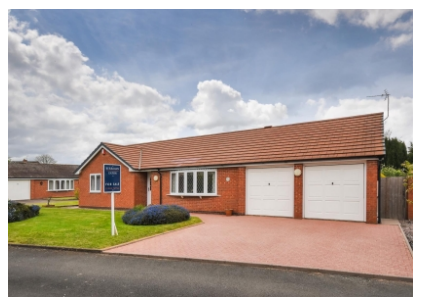
1 The Courts, Albrighton, Wolverhampton