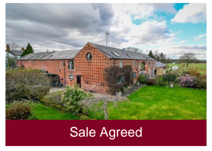
The Oak House, Oaklands Court, Lower Rudge, Pattingham