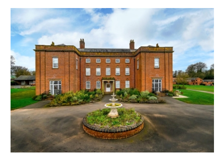
Home Wood, Gatacre Hall, Claverley, Wolverhampton