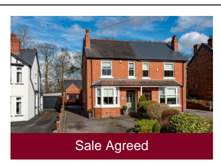
Medlicote, 79 Wood Road, Codsall