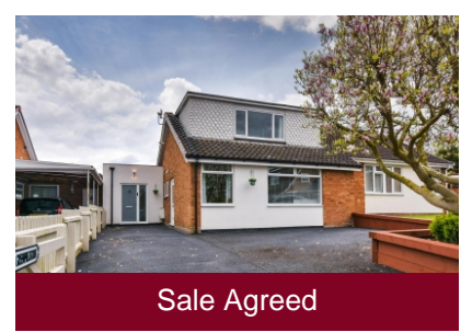
3 Greenfields Road, Wombourne, Wolverhampton