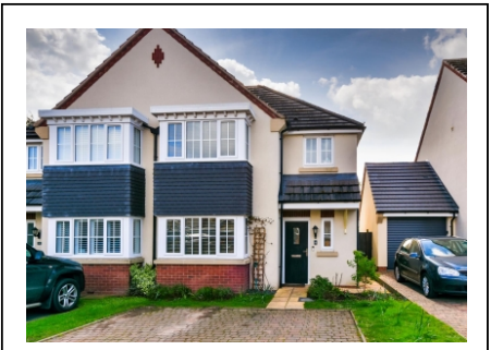
4 The Limes, Codsall Wood, Wolverhampton