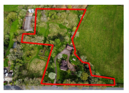
Dodds Green Cottage, 79 Dodds Green, Alveley, Bridgnorth