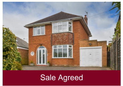
68 Clive Road, Pattingham, Wolverhampton