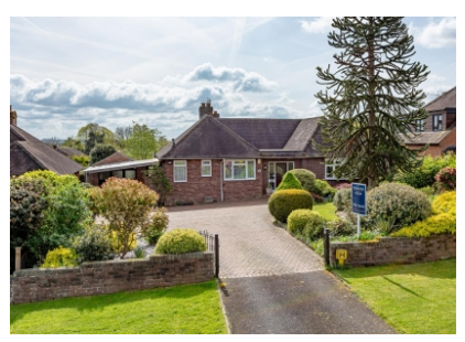
53 Conduit Lane, Bridgnorth