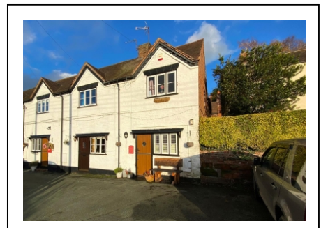
26c Bernards Hill, Bridgnorth