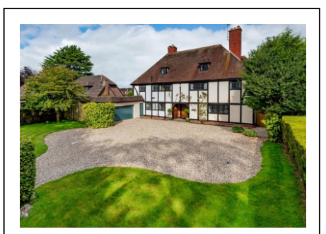
Findon, Haughton Lane, Shifnal