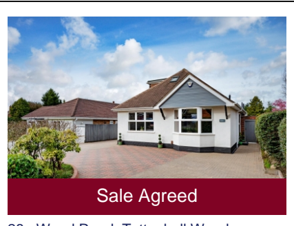
28a Wood Road, Tettenhall Wood