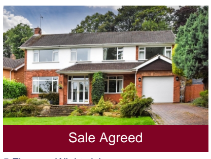
5 Firsway, Wightwick