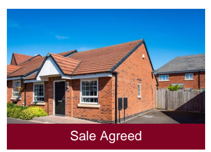
25 Brick Kiln Way, Baggeridge Village