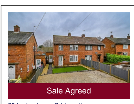
28 Lodge Lane, Bridgnorth