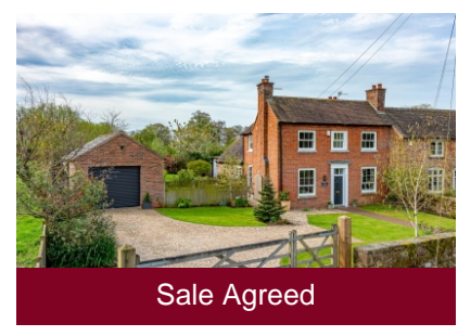
The Little House, 7 Tong Norton, Shifnal