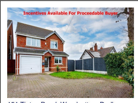
151 Tipton Road, Woodsetton, Dudley