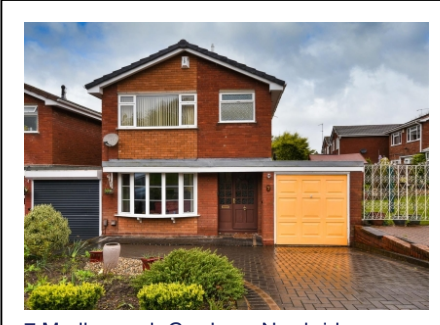
7 Marlborough Gardens, Newbridge, Wolverhampton