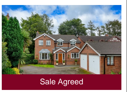
17 Hall End Lane, Pattingham, Wolverhampton