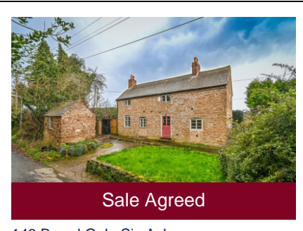
148 Broad Oak, Six Ashes