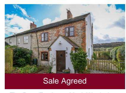
1 The Row, Easthope, Much Wenlock