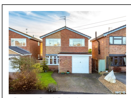
3 Braemar Road, Pattingham, Wolverhampton