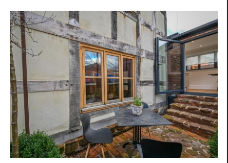
Park Cottage, Abbey Foregate, Shrewsbury