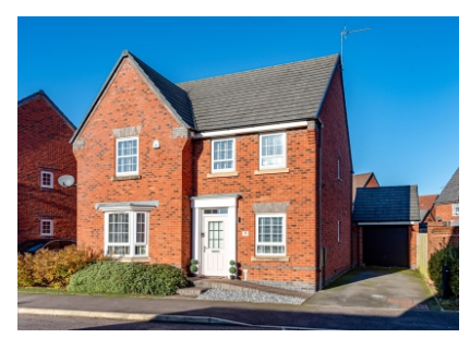
8 Brick Kiln Way, Baggeridge Village