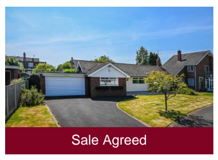
50 The Wold, Claverley, Shropshire