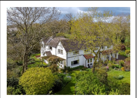
Leafields Farm, Shutt Green, Brewood, ST19 9LX