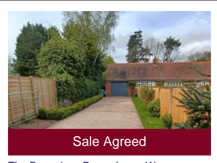
The Bungalow, Popes Lane, Wergs , Tettenhall