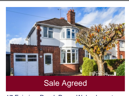
17 Fairview Road, Penn, Wolverhampton