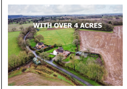
Keepers Cottage, Colemore Green, Bridgnorth