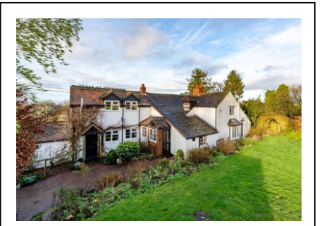
Greystoke Cottage, Kiddemore Green, Brewood