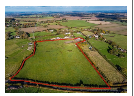
Plot of Land at Former Mill Riding Centre, Warstone Hill Road, Pattingham