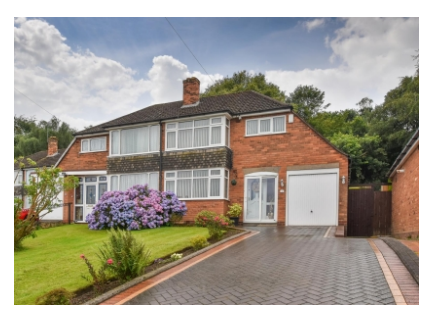
4 Chase View, Ettingshall Park, Wolverhampton