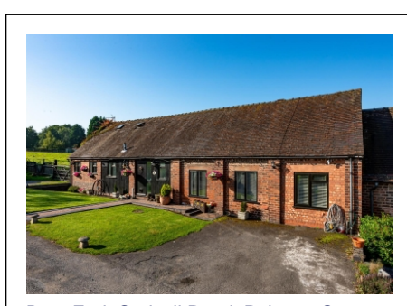
Barn End, Codsall Road, Palmers Cross, Wolverhampton