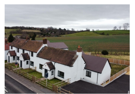
3 Ackleton Meadows, Stableford, Bridgnorth