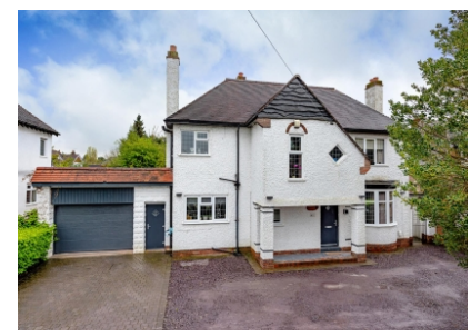
61 Codsall Road, Tettenhall, WV6 9QG