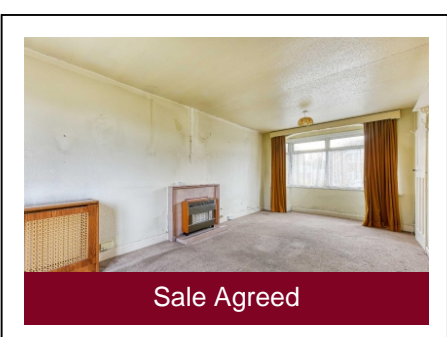
26 The Avenue, Castlecroft, Wolverhampton