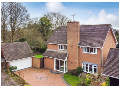
5 Mayswood Drive, Wightwick