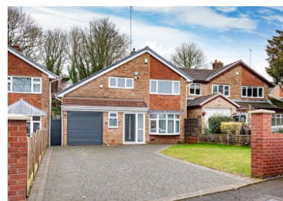
3 St. Marys Close, Dudley