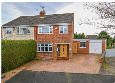
15 Crannmore Drive, Highley, Bridgnorth