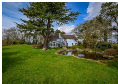
Horseshoes, Netherton, Highley, Bridgnorth