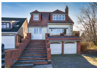
25 Bognop Road, Essington, Wolverhampton