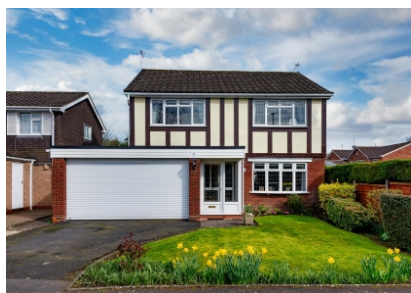
4 Rivendell Gardens, Tettenhall