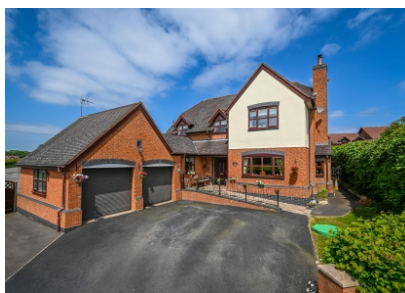
Cape Lodge, Billingsley, Bridgnorth