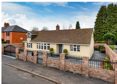
4 Mayfield Road, Albrighton, WV7 3JY