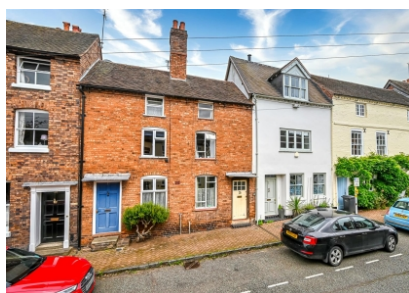
24 St. Marys Street, Bridgnorth