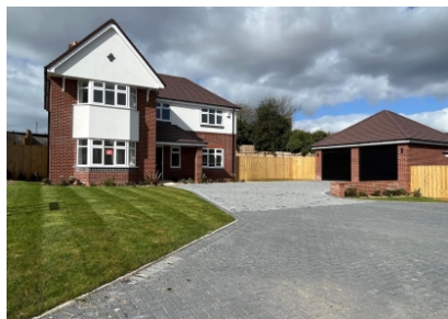
Rosewood House, 6 Rowan Grange, Broseley