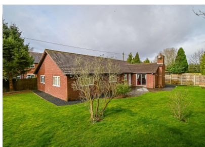
The Old Kiln, Church Lane, Bridgnorth