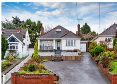
74 Bridgnorth Road, Compton