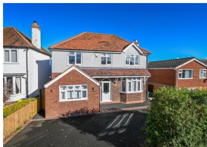
109 Victoria Road, Bridgnorth