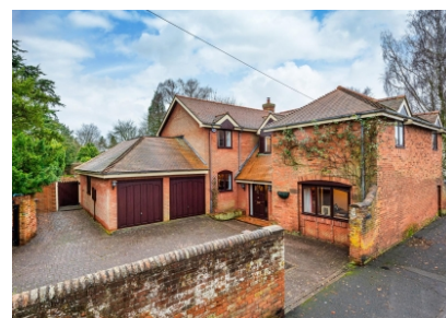
Manor Court, Cross Road, Albrighton, Wolverhampton