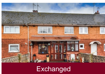
2 Woden Close, Wombourne, Wolverhampton