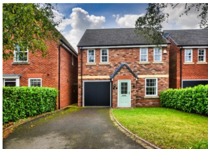
Eden House, Wombourne Road, Swindon, Dudley