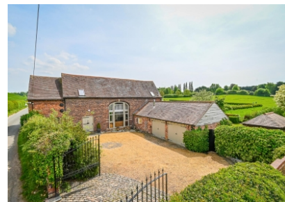
Trafalgar Barn, Worfield, Bridgnorth