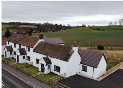
3 Ackleton Meadows, Stableford, Bridgnorth