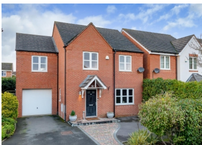
80 Brickbridge Lane, Wombourne, Wolverhampton