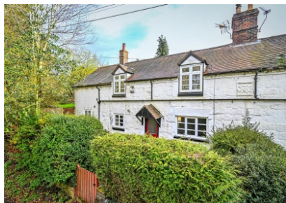
146 Broad Oak, Six Ashes