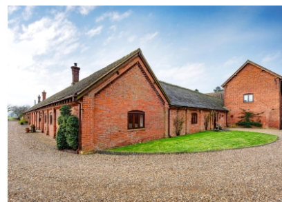
The Byre, Home Farm Road, Burnhill Green, Wolverhampton