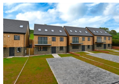
Plot 2 Stourbridge Road, Wootton, Bridgnorth