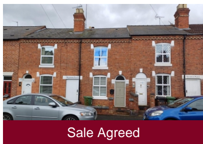
Summerfield Road, Stourport-On-Severn