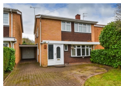
30 Sytch Lane, Wombourne, Wolverhampton