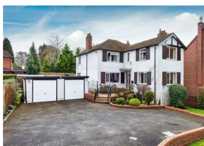
Quarry House, 30 Lansdowne Avenue, Codsall