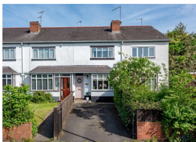
Planks Lane, Wombourne, Wolverhampton