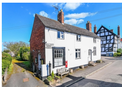
The Old Post Office, High Street, Claverley, Wolverhampton