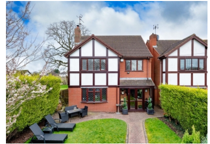
Waterford, Ball Lane, Coven Heath, Wolverhampton