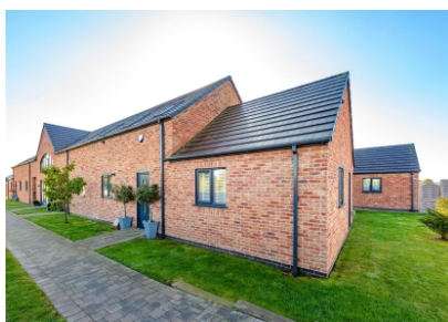
6 Lea Manor Gardens, Albrighton, Wolverhampton