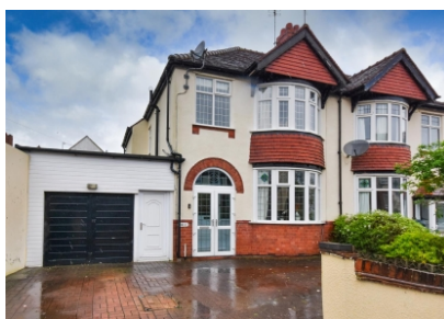
Pennhouse Avenue, Wolverhampton