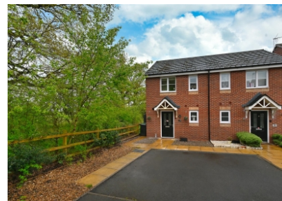
29 Hitchens Way, Highley, Bridgnorth