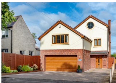
Mimosa Lodge, Histons Hill, Codsall