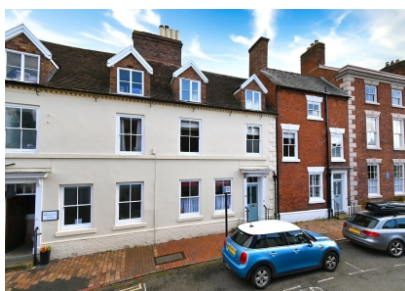
28 East Castle Street, Bridgnorth