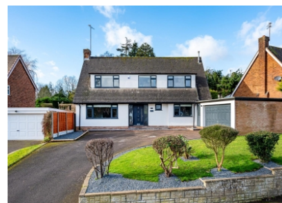
25 Perton Brook Vale, Wightwick