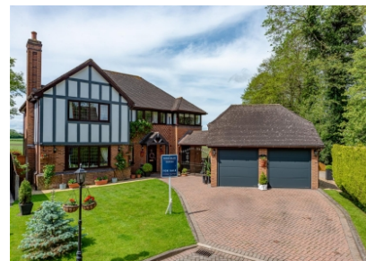
47 Fairfield Drive, Codsall, Wolverhampton