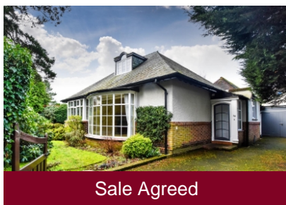
The Grey Cottage 19 Clifton Road, Wolverhampton