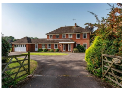
Meadow Farm, Post Office Road, Seisdon, Wolverhampton