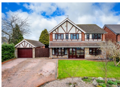
11 Waverley Gardens, Wombourne, Wolverhampton