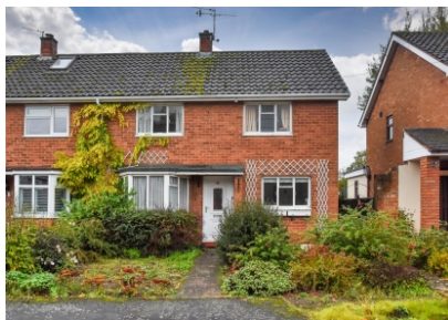
10 Neachless Avenue, Wombourne, Wolverhampton