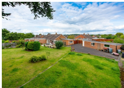
7 Blakeley Heath Drive, Wombourne, Wolverhampton