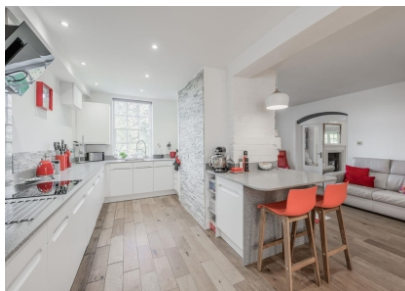
4 Stanmore Mews, Stourbridge Road, Stanmore, Bridgnorth