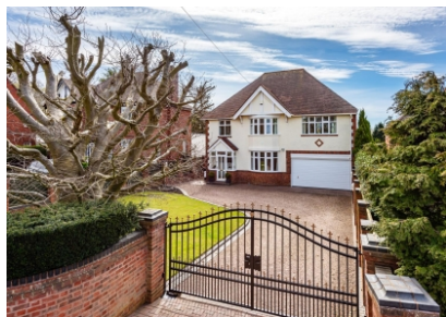
Catholic Lane, Sedgley, Dudley