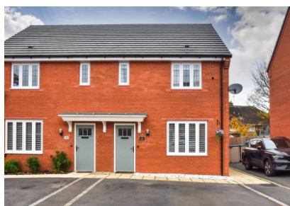
35 Foxglove Way, Himley