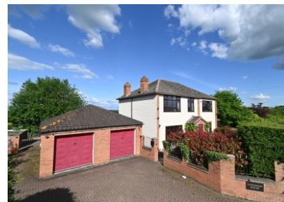
Longmoor House, Billingsley, Bridgnorth