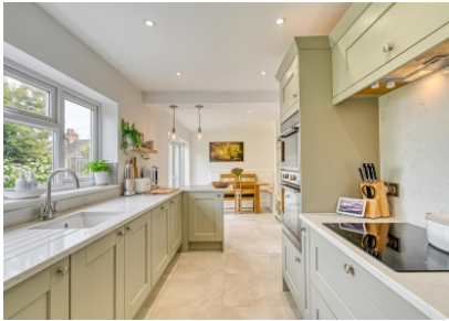
18 Stretton Close, Bridgnorth