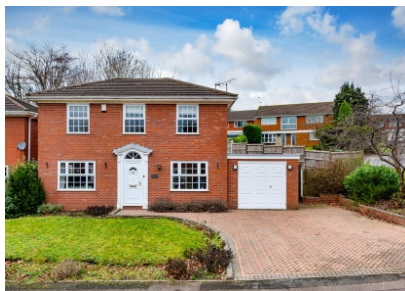
2 Heath House Drive, Wombourne, Wolverhampton