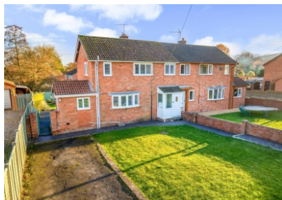
1 Brown Clee Road, Ditton Priors, Bridgnorth