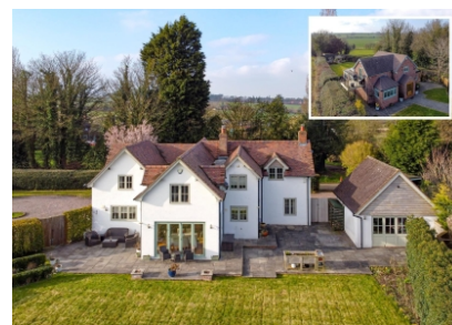
Oaklea and The Cottage, Damson Lane, Weston Heath, Shifnal