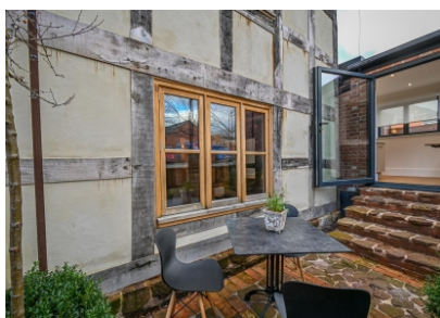
Park Cottage, Abbey Foregate, Shrewsbury