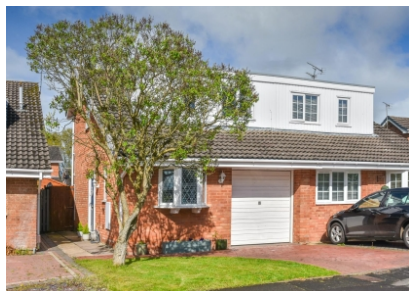
39 Mercia Drive, Perton, Wolverhampton