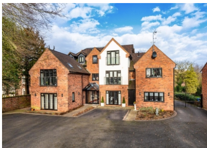
3 The Gables, Seisdon Road, Trysull, Wolverhampton