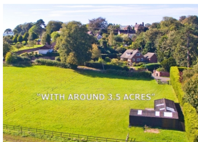
Half Acre House, Stableford, Bridgnorth