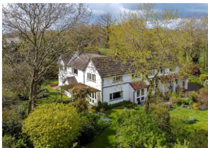
Leafields Farm, Shutt Green, Brewood, ST19 9LX