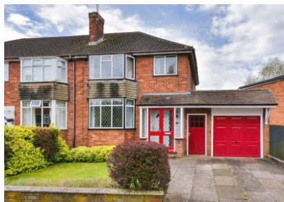
Wombourne Park, Wombourne