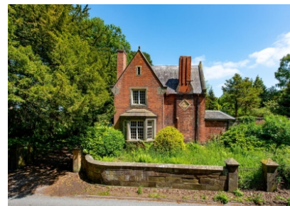
Wergs Hall Gardens, Wergs Hall Road, Tettenhall