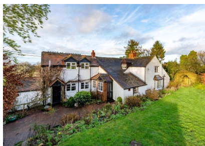
Greystoke Cottage, Kiddemore Green, Brewood