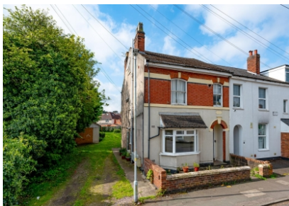
25 Newbridge Street, Newbridge, Wolverhampton, WV6 0EE