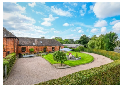
The Stables, Chesterton, Bridgnorth