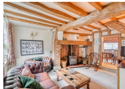
Bridgend Cottage, 43 Cartway, Bridgnorth