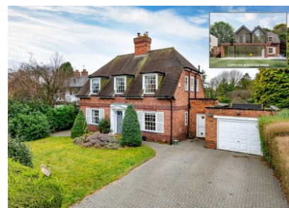
The Dormers, Finchfield Gardens, Finchfield