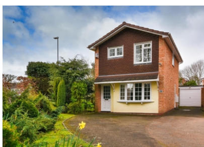
28 Quendale, Wombourne, Wolverhampton