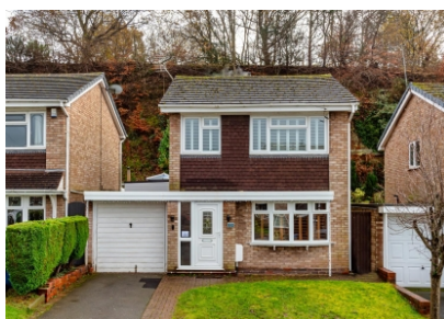
23 Redcliffe Drive, Wombourne, South Staffordshire