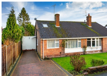
1 Norton Close, Penn, Wolverhampton