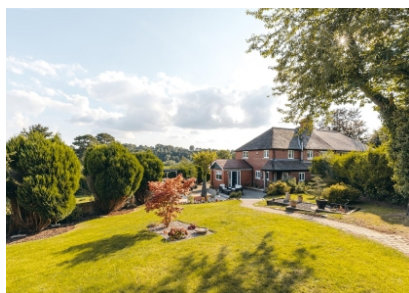
Sunnybank, 11b, Danesford, Bridgnorth