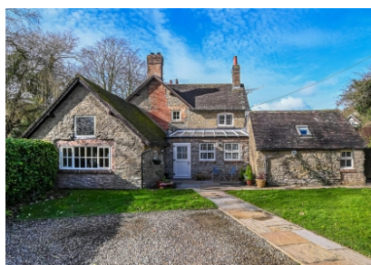
Brookside, Brockton, Much Wenlock