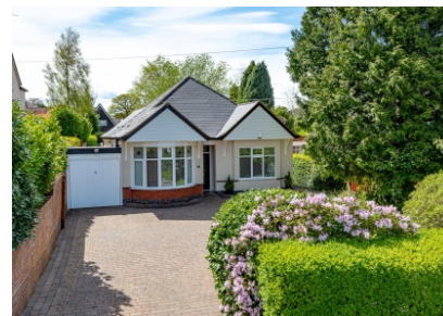
Mount Road, Penn, Wolverhampton