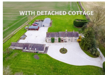
Lower Westwood Farm, Stretton Westwood, Much Wenlock