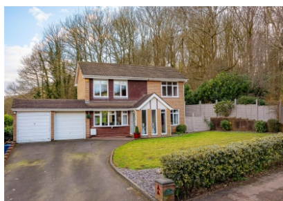
Wychaven, The Holloway, Swindon, Dudley