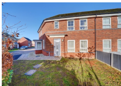
26 Rainsford Crescent, Kidderminster