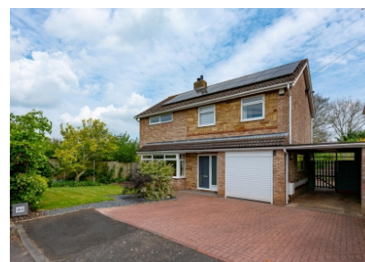
44 Romsley View, Alveley, Bridgnorth