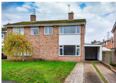
36 Wombourne Road, Swindon, Dudley