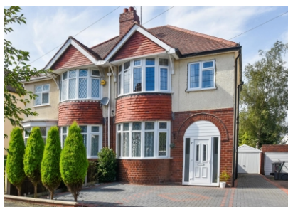
28 Links Road, Penn, Wolverhampton