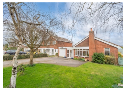
Madeira, 45 Keepers Lane, Codsall, Wolverhampton