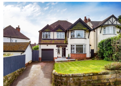
3 Lothians Road, Tettenhall, Wolverhampton