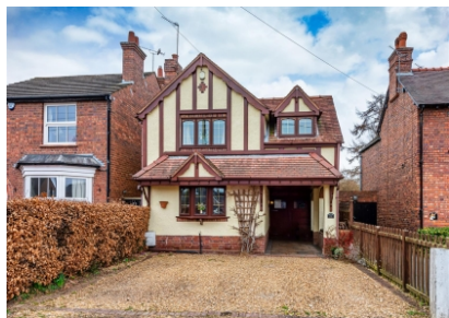
25 Walk Lane, Wombourne, Wolverhampton