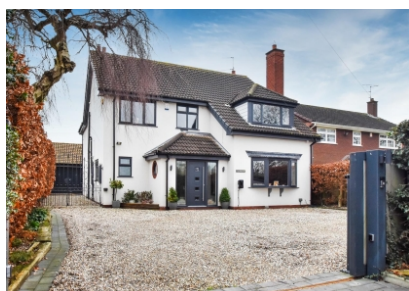
Clearview, Straight Mile, Calf Heath, Wolverhampton