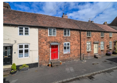
28 Whitburn Street, Bridgnorth