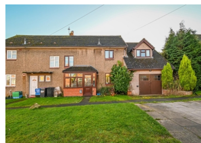
74 The Hobbins, Bridgnorth