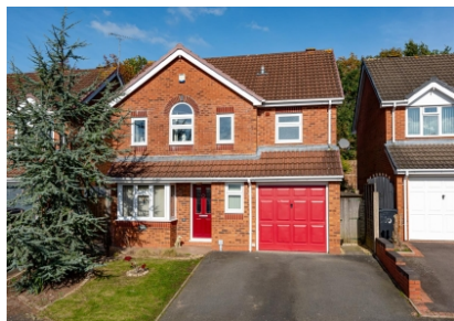
12 Dudmaston Way, Milking Bank, Dudley