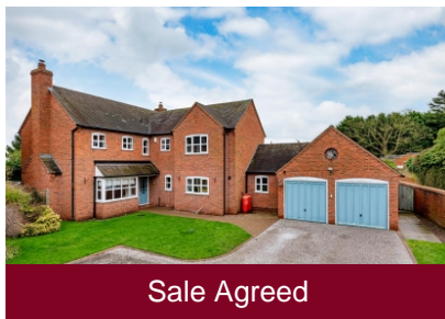
Rivendell, Park Lane, Lapley, Stafford