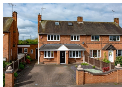
Giggetty Lane, Wombourne, Wolverhampton