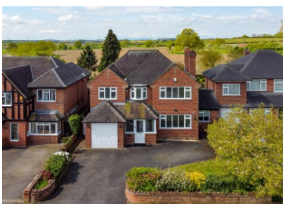
59 Sabrina Road, Wolverhampton