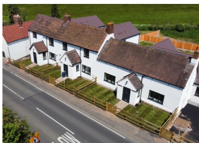
1 Ackleton Meadows, Stableford, Bridgnorth