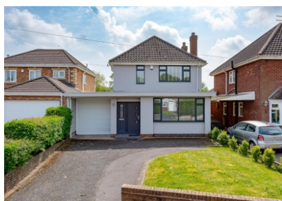
46 Wood Road, Codsall, Wolverhampton, WV8 1DN