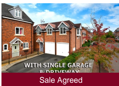
14 Rastrick Close, Bridgnorth