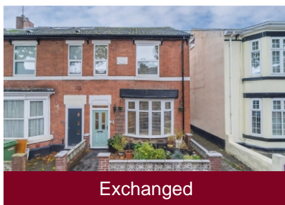
Allen Road, Whitmore Reans, Wolverhampton