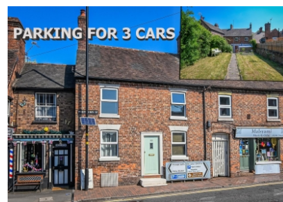
50 Whitburn Street, Bridgnorth