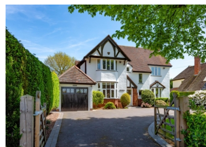
5 Coppice Road, Finchfield, Wolverhampton, WV3 8BJ