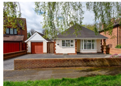
19 Foley Avenue, Tettenhall, Wolverhampton