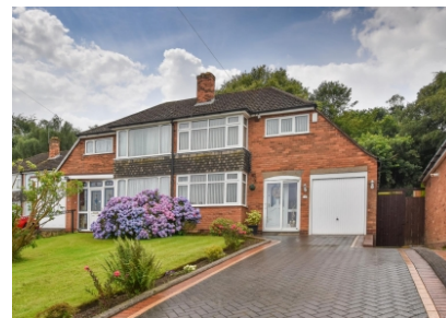
4 Chase View, Ettingshall Park, Wolverhampton