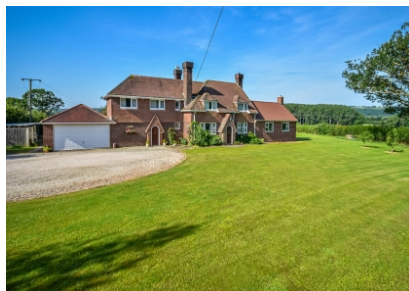
Footbridge House, Tasley, Bridgnorth