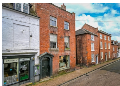
64 St. Marys Street, Bridgnorth