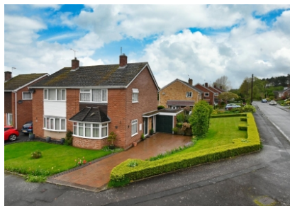
3 Hillside Avenue, Bridgnorth