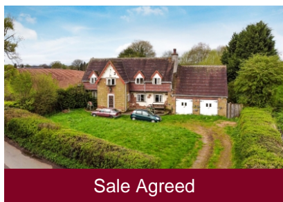
Mill Cottage, Lower Rudge, Pattingham, Wolverhampton