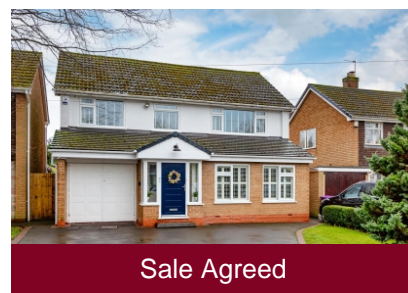
89 Redhouse Road, Tettenhall, Wolverhampton