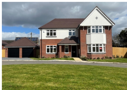
Cedar House, 7 Rowan Grange, Broseley