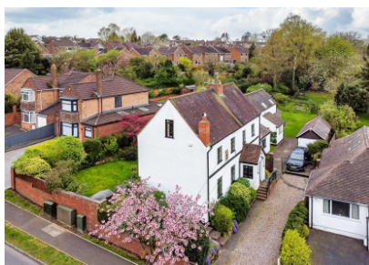
The Crofts and The Cottage, 32 Church Hill, Penn