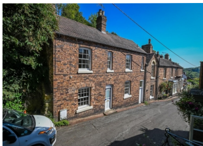
25 Church Hill, Ironbridge, Telford