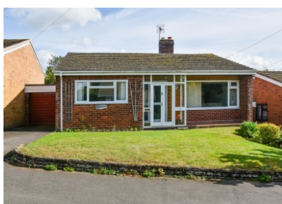
Foxcroft, 8 Fox Close, Seisdon