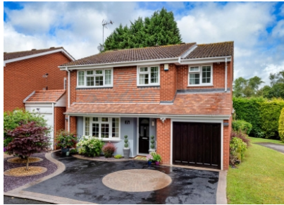
2 Brompton Lawns, Tettenhall Wood, Wolverhampton