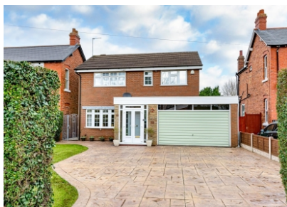
230a Trysull Road, Merry Hill, Wolverhampton