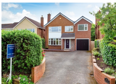
18 Rudge Road, Pattingham, Wolverhampton