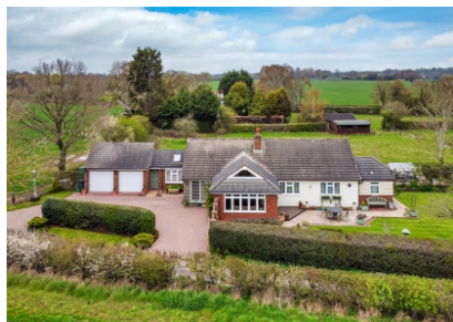
Holly Lodge, Church Lane, Boningale, Albrighton