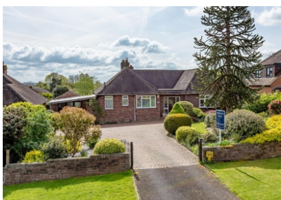
53 Conduit Lane, Bridgnorth