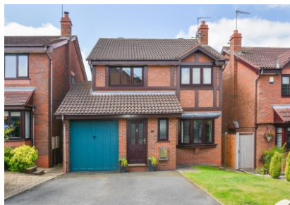
35 Penleigh Gardens, Wombourne, Wolverhampton