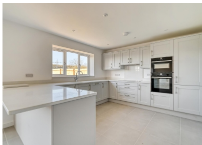
Green Acres, 3 Rowan Grange, Broseley