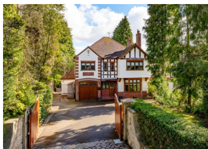
Dalkeith, 25 Tinacre Hill, Wightwick, WV6 8DB