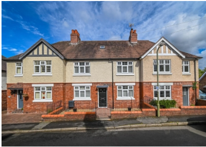
2 Cliff Gardens, Cliff Road, Bridgnorth