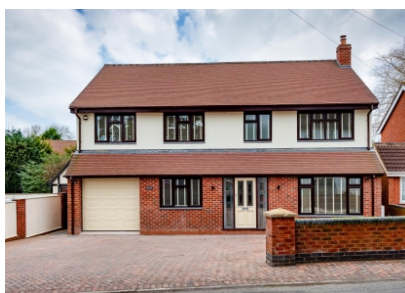
Ravenscroft, Bell Road, Trysull, Wolverhampton