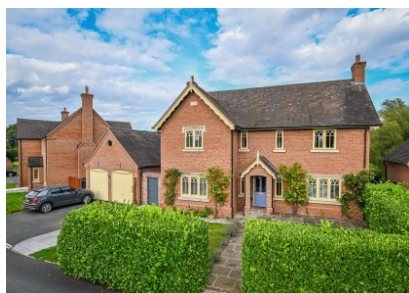
Fitzallen House, 3 Cound Park Drive, Cound, Shrewsbury