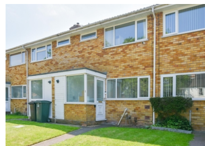
3 Ashfields, High Street, Albrighton