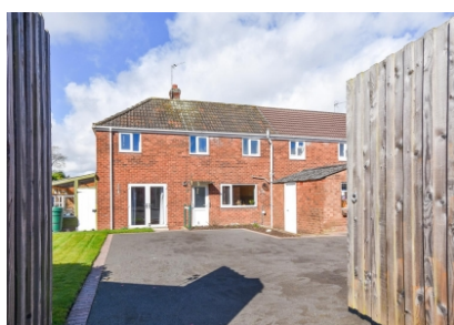
146 Cornwall Road, Tettenhall, WV6 8UZ