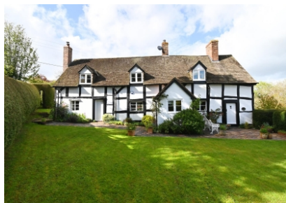
Clovers, Stableford, Bridgnorth