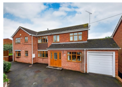
15 Ounsdale Crescent, Wombourne, Wolverhampton