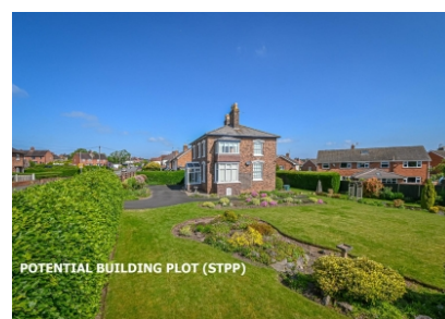
Hookfield House, 81 Victoria Road, Bridgnorth