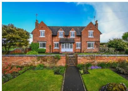
Lower Snowdon Cottage, Snowdon Road, Burnhill Green, Wolverhampton