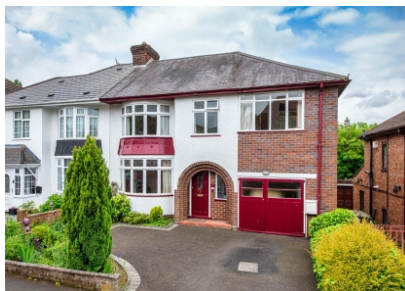
49 Canterbury Road, Penn, Wolverhampton