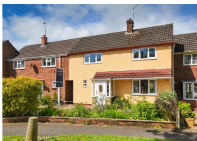
71 Cornwall Road, Tettenhall Wood