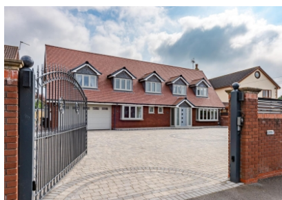
Alpine Cottage, 11 Kings Road, Calf Heath