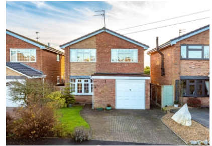
3 Braemar Road, Pattingham, Wolverhampton