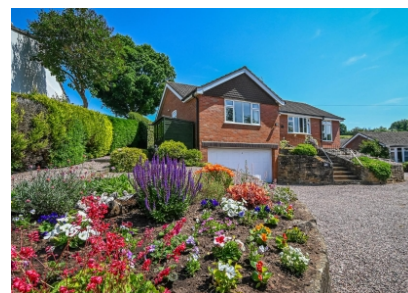
Three Ridges, Hilton, Bridgnorth