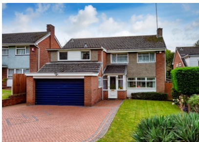
2 Captains Close, Compton, Wolverhampton