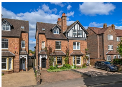
2 Westgate Villas, Salop Street, Bridgnorth