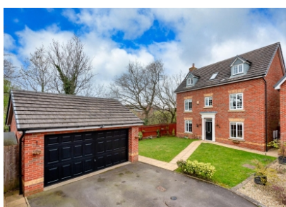
Oaklands, Wombourne, Wolverhampton