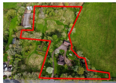
Dodds Green Cottage, 79 Dodds Green, Alveley, Bridgnorth