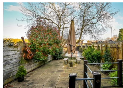
45 Cartway, Bridgnorth