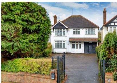
Maleesh, Stourbridge Road, Wombourne