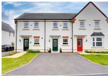
9 Narburgh Place, Alveley, Bridgnorth