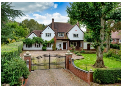
Hillside, 3 Tinacre Hill, Wightwick