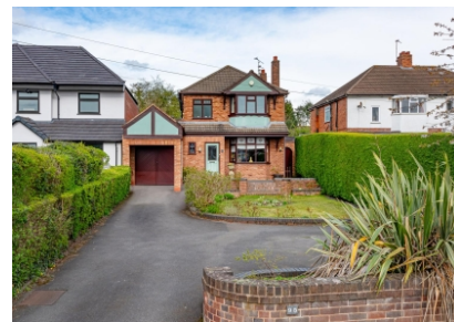
95 Windmill Lane, Castlecroft, Wolverhampton