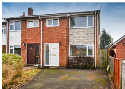
99 Hazel Grove, Wombourne, Wolverhampton