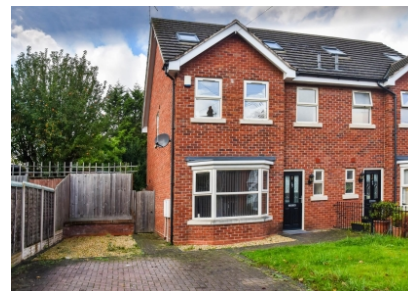
1 Marchant Road, Compton, Wolverhampton