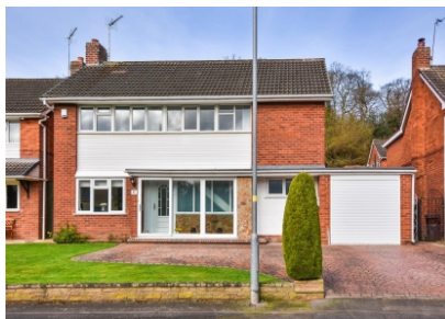
97 Henwood Road, Compton, Wolverhampton