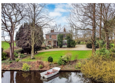
The Mill House, Badger, Wolverhampton