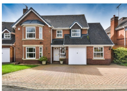
Kinloch Drive, Dudley