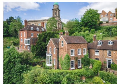
Castle Cliffe House, 24 St. Mary's Steps, Bridgnorth