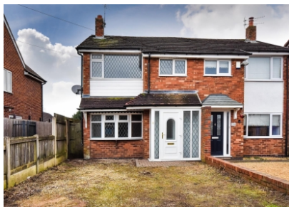
93 Hazel Grove, Wombourne, Wolverhampton