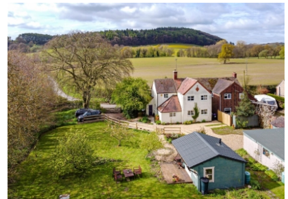
6 The Row, Easthope, Much Wenlock