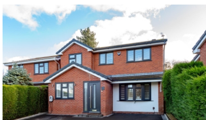
41 Ascot Drive, Dudley