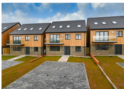
Plot 3, Sandybank, Stourbridge Road, Wootton, Bridgnorth