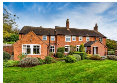
Pound Cottage, 8 School Road, Himley, Dudley