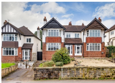
83 Lower Street, Wolverhampton