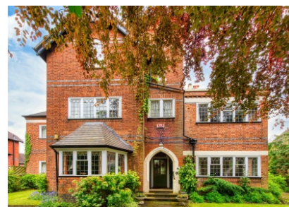
Cheviot House, 20 Stockwell Road, Tettenhall