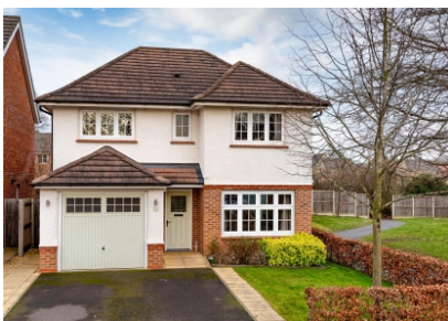
35 Bluebell Way, Shifnal