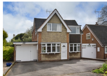
56 Bantock Gardens, Finchfield