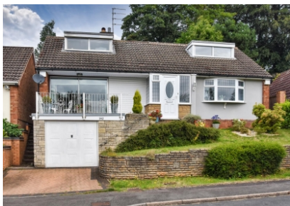
142 Bridgnorth Road, Wolverhampton