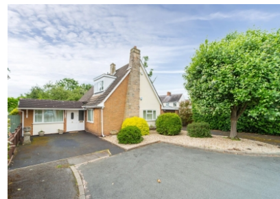
8 The Orchard, Albrighton