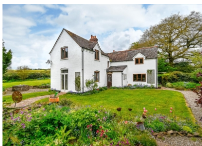
The Cottage, Middleton Scriven, Bridgnorth