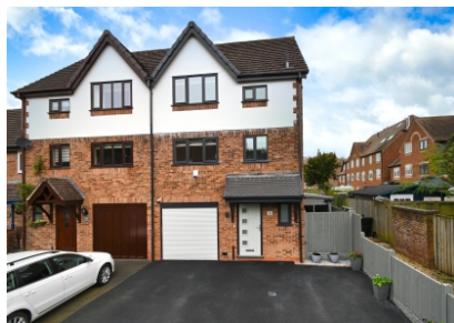
2 King Charles Way, Bridgnorth