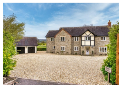
Beech House, Munslow, Shropshire