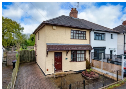
61 Woodland Avenue, Wolverhampton