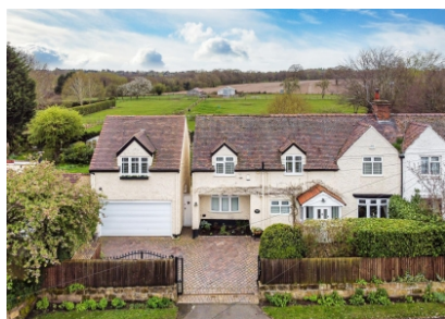
15 Birches Road, Codsall, Wolverhampton