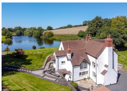
Hem Mill, The Hem, Shifnal