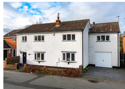
109 Rookery Road, Wombourne, Wolverhampton