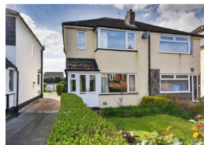
36 Hall End Lane, Pattingham, Wolverhampton