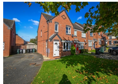
8 Ridley Close, Bridgnorth