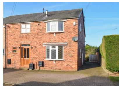
The Rambles, 16 Shop Lane, Oaken