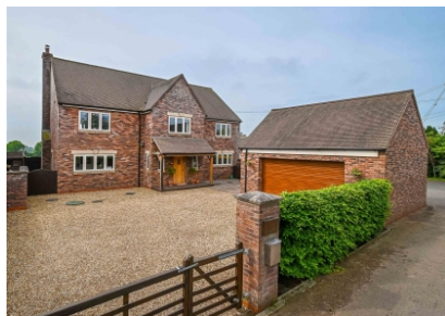
Faintree Heights, Faintree, Bridgnorth