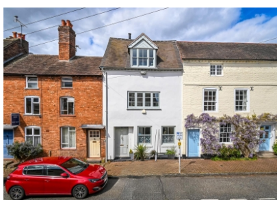
23 St Marys Street, Bridgnorth