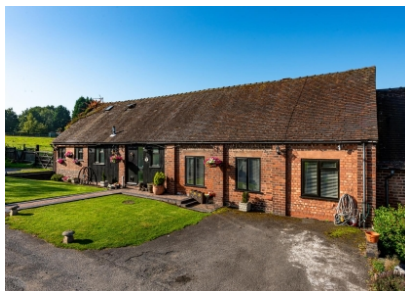
Barn End, Codsall Road, Palmers Cross, Wolverhampton