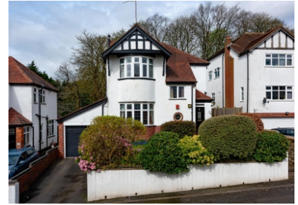
Tudor Crescent, Wolverhampton