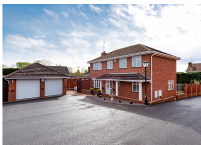
St. Johns Close, Swindon, Dudley