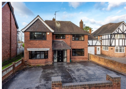
288b Penn Road, Wolverhampton