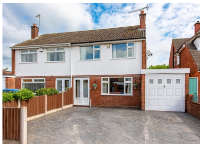
19 Chapel Street, Wombourne