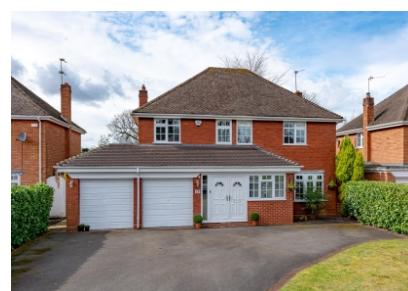
18 Corfton Drive, Tettenhall