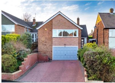
52 Church Hill, Penn, Wolverhampton