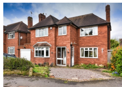
66 York Avenue, Finchfield, Wolverhampton