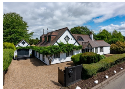
Pennygate, Paradise Lane, Slade Heath, Wolverhampton