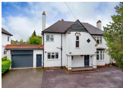
61 Codsall Road, Tettenhall, WV6 9QG