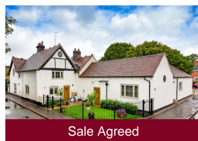
5 Plough Meadows, Trysull