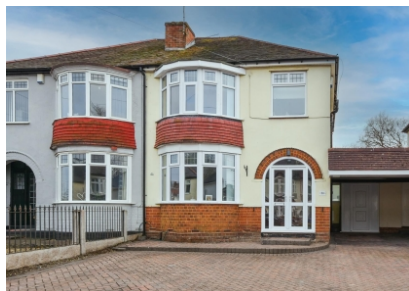
53 Woodland Road, Merry Hill, Wolverhampton