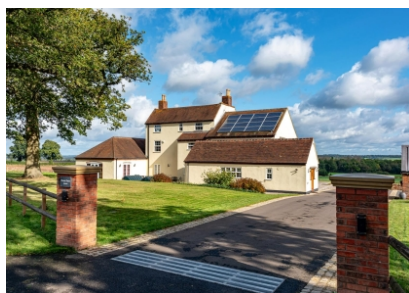
Home Farm, Gatacre, Claverley, Wolverhampton