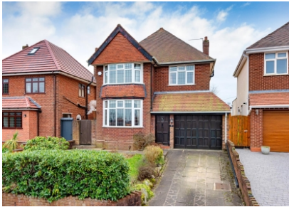
15 Foxlands Avenue, Wolverhampton