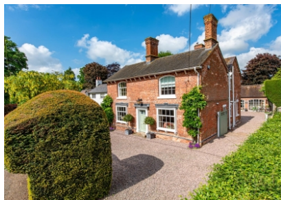
Beckbury House, Beckbury, Shifnal