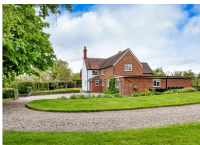
Keepers Cottage, Colemore Green, Bridgnorth