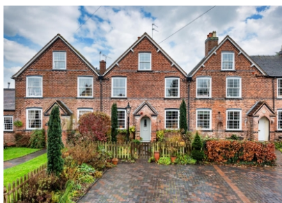
2 Labernum Cottages, Vicarage Road, Penn, Wolverhampton