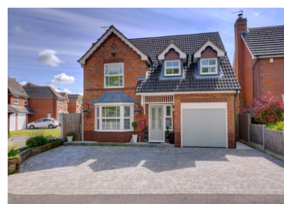
Ripley Gardens, Worcester