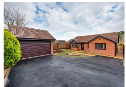
3 Montford Grove, Sedgley, Dudley