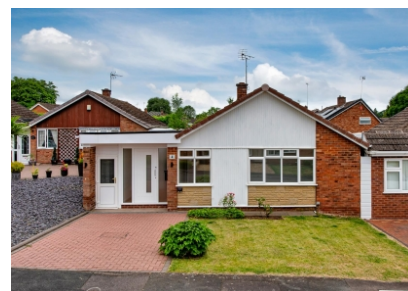
4 Mayfair Close, Albrighton, Wolverhampton