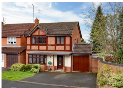
19 Penleigh Gardens, Wombourne, Wolverhampton