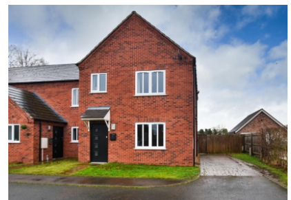
4 Lower Lanes Meadow, Seisdon, Wolverhampton