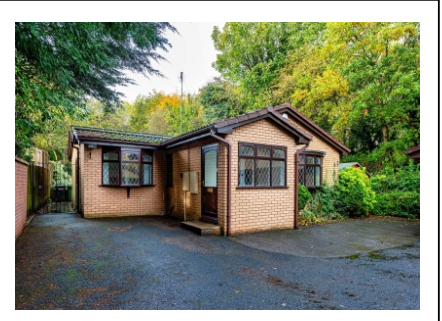
6 Finchfield Hill, Compton, Wolverhampton