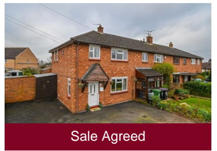
17 Racecourse Drive, Bridgnorth, Shropshire