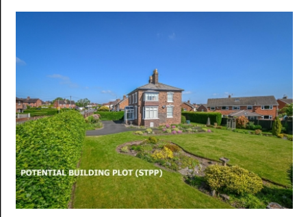
Hookfield House, 81 Victoria Road, Bridgnorth