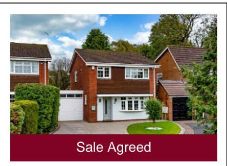
6 Tanglewood Grove, Dudley