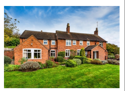
Pound Cottage, 8 School Road, Himley, Dudley