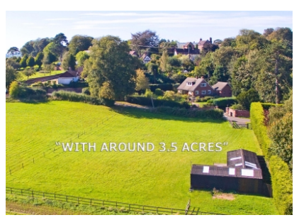
Half Acre House, Stableford, Bridgnorth