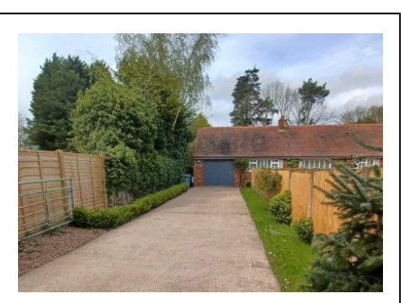
The Bungalow, Popes Lane, Wergs , Tettenhall