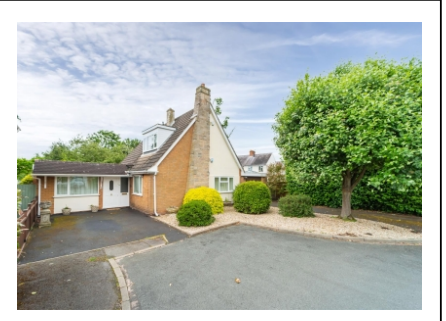
8 The Orchard, Albrighton