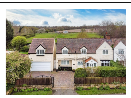
15 Birches Road, Codsall, Wolverhampton