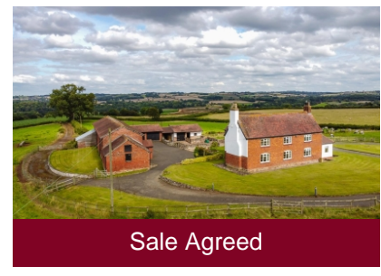
Lower Sutton Farm, Sutton, Chelmarsh, Bridgnorth