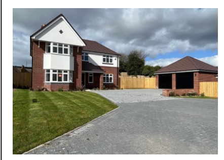
Rosewood House, 6 Rowan Grange, Broseley