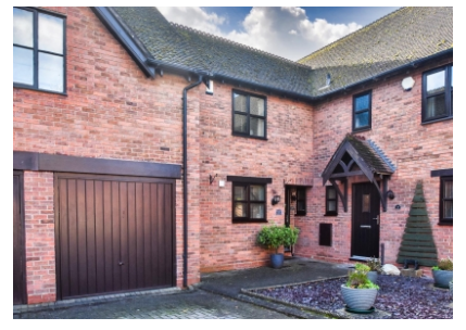
17 Bridgeman Court, Weston-Under-Lizard, Shifnal