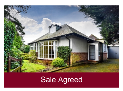
The Grey Cottage 19 Clifton Road, Wolverhampton