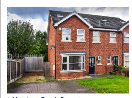
1 Marchant Road, Compton, Wolverhampton