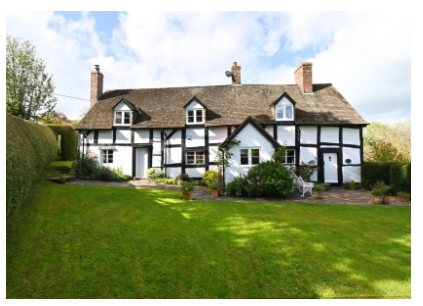
Clovers, Stableford, Bridgnorth