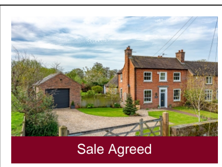
The Little House, 7 Tong Norton, Shifnal