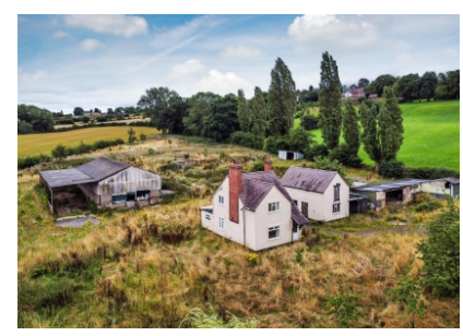
Robins Nest Farm, Dirty Foot Lane, Lower Penn, Wolverhampton