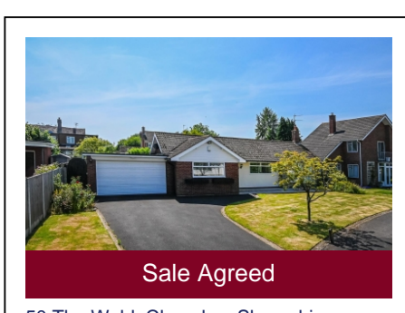
50 The Wold, Claverley, Shropshire