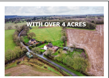
Keepers Cottage, Colemore Green, Bridgnorth