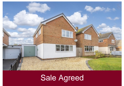
48 Clive Road, Pattingham, Wolverhampton