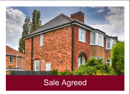
2 Fancourt Avenue, Penn, Wolverhampton