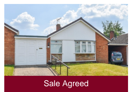
13 The Broadway, Wombourne, Wolverhampton