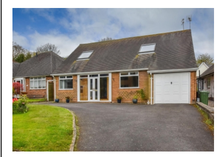
38 Foley Avenue, Tettenhall, Wolverhampton