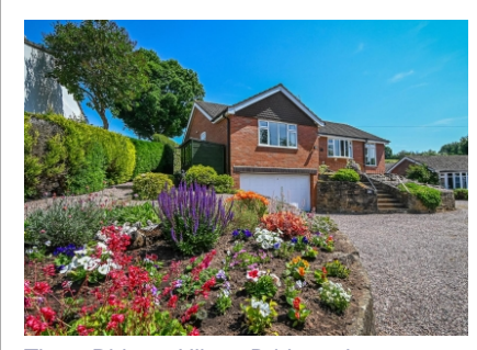
Three Ridges, Hilton, Bridgnorth