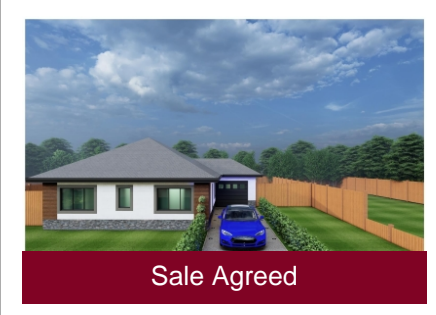
Plot 2 Hazelbrook, Hazel Lane, Great Wyrley