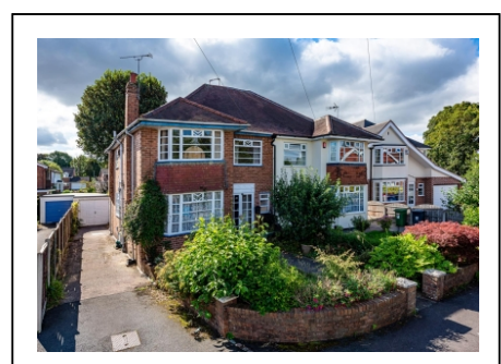
7 Newbridge Gardens, Newbridge, Wolverhampton