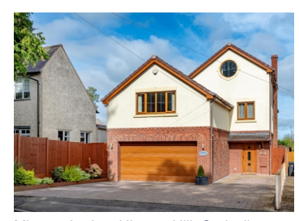
Mimosa Lodge, Histons Hill, Codsall