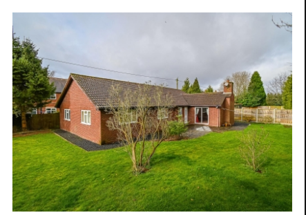
The Old Kiln, Church Lane, Bridgnorth