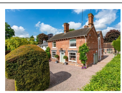
Beckbury House, Beckbury, Shifnal