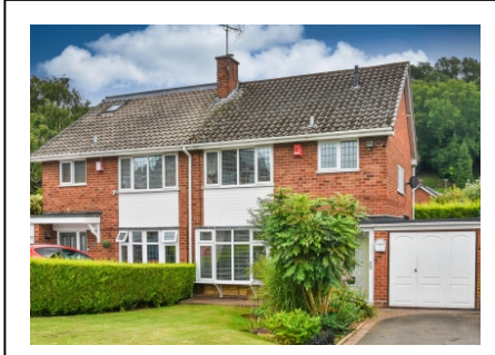
23 Chequers Avenue, Wombourne, Wolverhampton