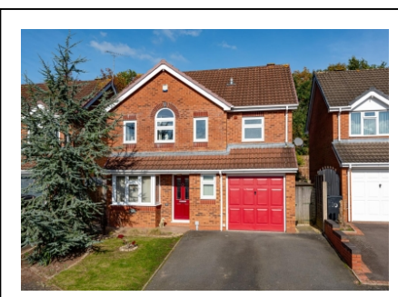
12 Dudmaston Way, Milking Bank, Dudley