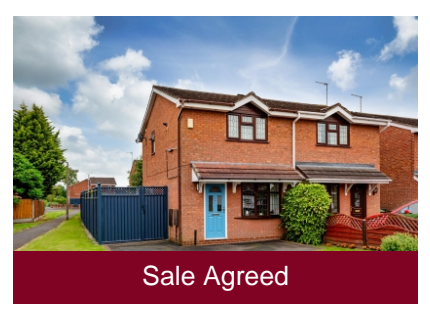
7 Leasowe Drive, Perton, Wolverhampton