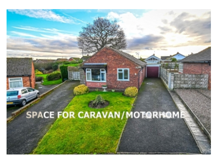
51 Linley View Drive, Bridgnorth