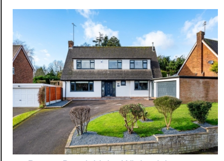
25 Perton Brook Vale, Wightwick