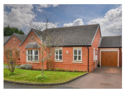
14 Berkeley Close, Perton, Wolverhampton