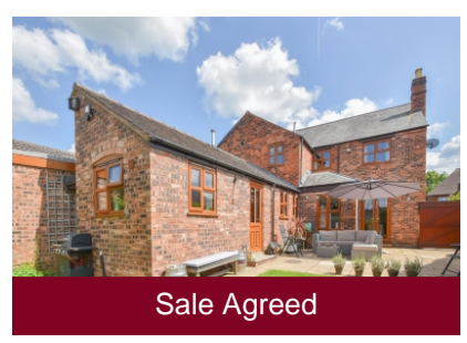
The Cottage, 18 Shop Lane, Oaken