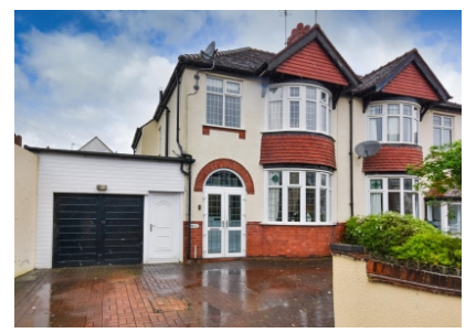
Pennhouse Avenue, Wolverhampton