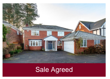
2 Greenhill Court, Wombourne, Wolverhampton