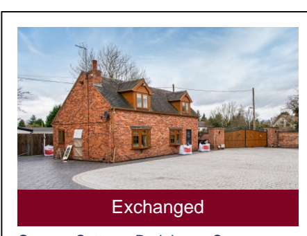
Granary Cottage, Dark Lane, Cross Green, Wolverhampton