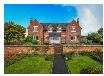
Lower Snowdon Cottage, Snowdon Road, Burnhill Green, Wolverhampton