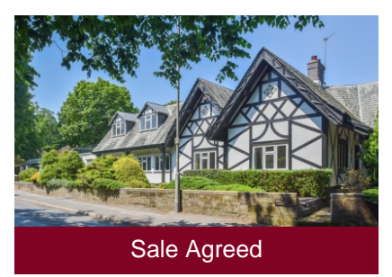
Woodhouse Lodge, Wood Road, Tettenhall Wood