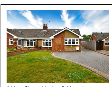
6 Lime Close, Alveley, Bridgnorth