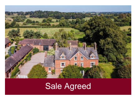
Roughton Farmhouse, Roughton, Bridgnorth