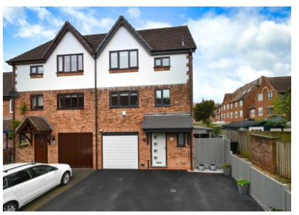
2 King Charles Way, Bridgnorth