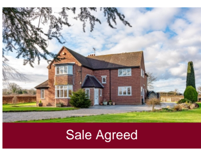
Trentham, Lapley Road, Wheaton Aston