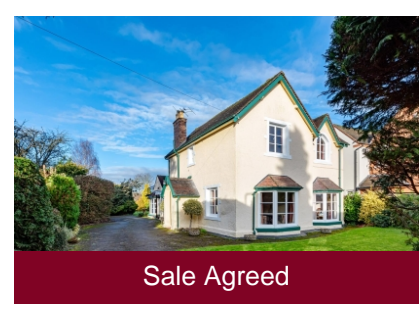
Ferndale, 7 Cross Road, Albrighton