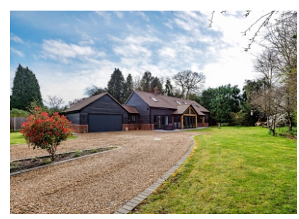
Willow Lodge, 23 High Street, Albrighton