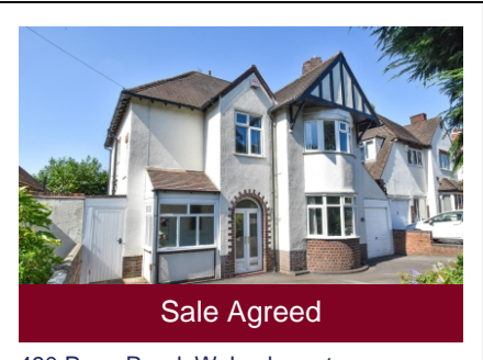
490 Penn Road, Wolverhampton