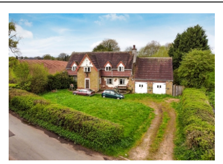
Mill Cottage, Lower Rudge, Pattingham, Wolverhampton