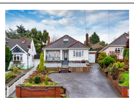
74 Bridgnorth Road, Compton