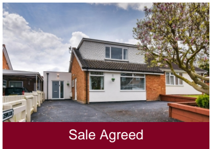
3 Greenfields Road, Wombourne, Wolverhampton