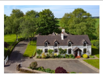
The Little Green, 2 Feiashill Road, Trysull, Wolverhampton