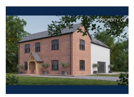
Plot 1, Bynd Lane, Billingsley, Bridgnorth