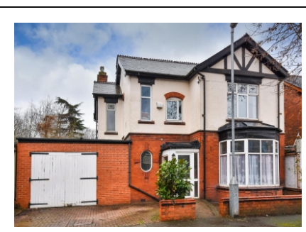
18 Elm Avenue, Bilston, Wolverhampton