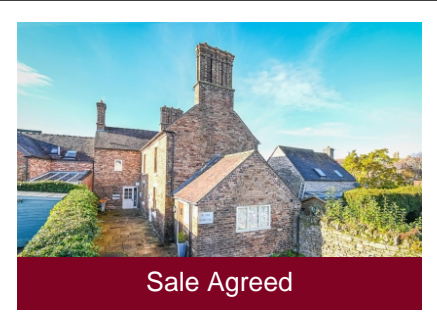
The Forge, 13 St. Marys Lane, Much Wenlock