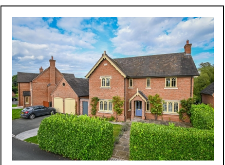
Fitzallen House, 3 Cound Park Drive, Cound, Shrewsbury