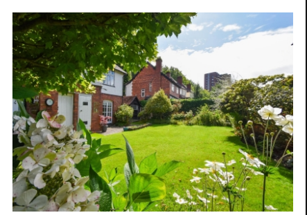
29 Bath Avenue, Wolverhampton