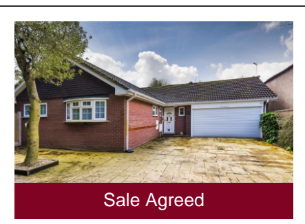
28a Mount Road, Mount Road, Tettenhall