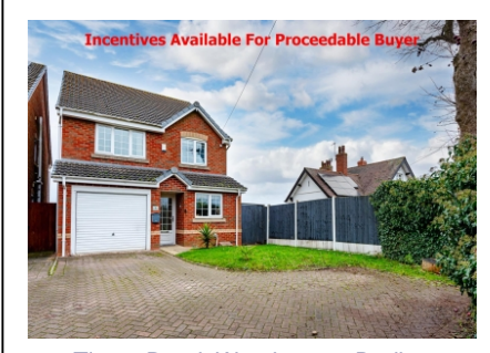
151 Tipton Road, Woodsetton, Dudley