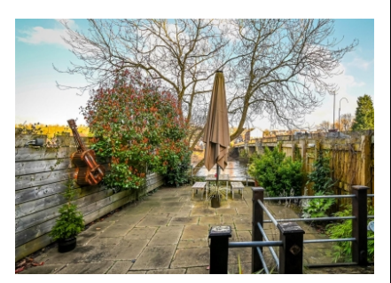
45 Cartway, Bridgnorth