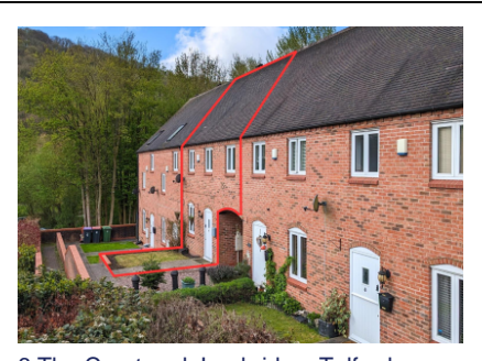
6 The Courtyard, Ironbridge, Telford