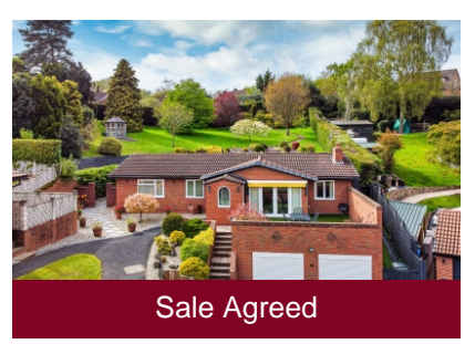
18 Bramble Ridge, Bridgnorth