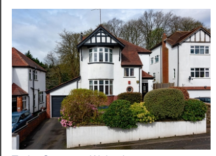
Tudor Crescent, Wolverhampton