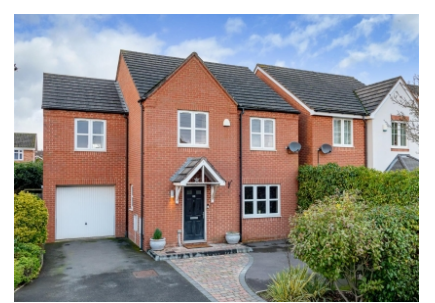
80 Brickbridge Lane, Wombourne, Wolverhampton