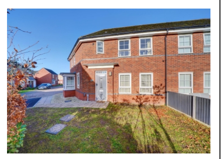
26 Rainsford Crescent, Kidderminster