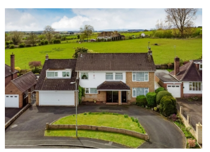
7 Wightwick Hall Road, Wightwick, WV6