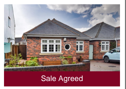
70 Finchfield Road, Wolverhampton