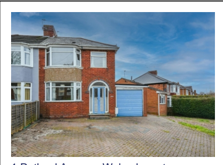
1 Rutland Avenue, Wolverhampton