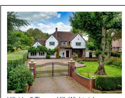
Hillside, 3 Tinacre Hill, Wightwick