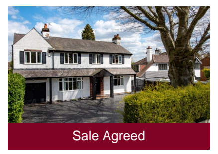
94 Codsall Road, Tettenhall, Wolverhampton