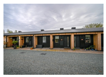
The Willow, 3 The Closes, Sutton Farm, Claverley, Wolverhampton