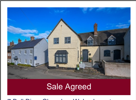
7 Bull Ring, Claverley, Wolverhampton