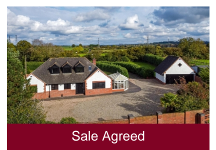
Rosebank, Ebstree Road, Seisdon, Nr Wolverhampton