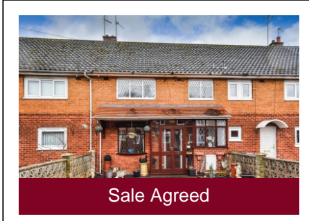
2 Woden Close, Wombourne, Wolverhampton