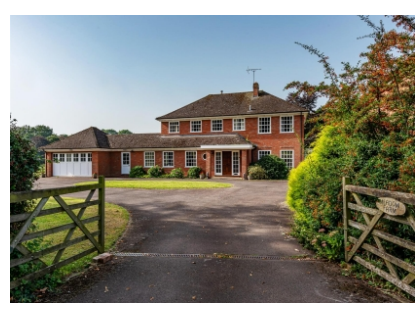
Meadow Farm, Post Office Road, Seisdon, Wolverhampton