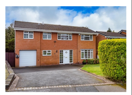
11 Swallowdale, Wightwick, Wolverhampton