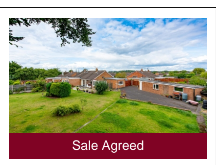
7 Blakeley Heath Drive, Wombourne, Wolverhampton