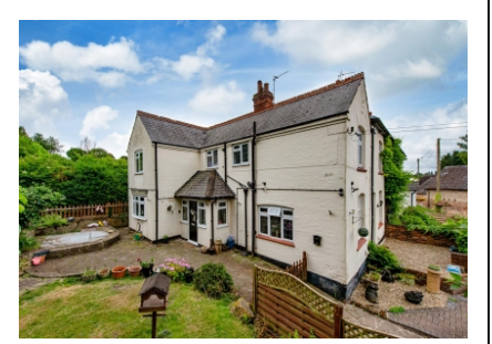
1 & 2 New Cottages, Oaken Lane, Oaken