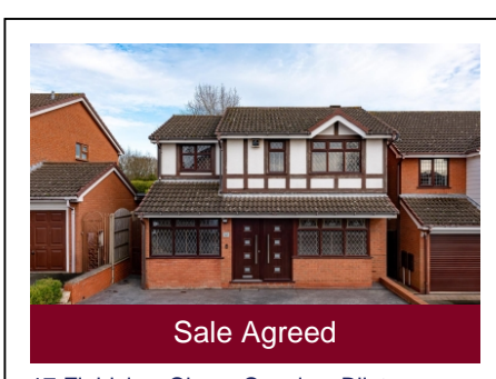
17 Fieldview Close, Coseley, Bilston