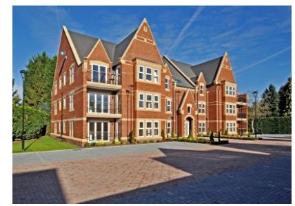
5 Ellen Place, Henry Fowler Drive, Tettenhall