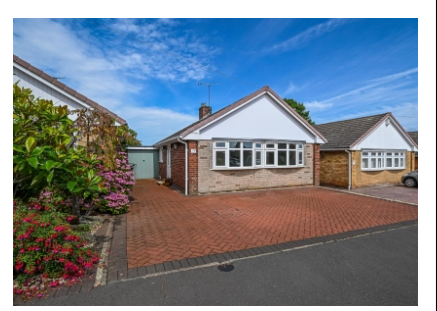
7 Princess Drive, Bridgnorth