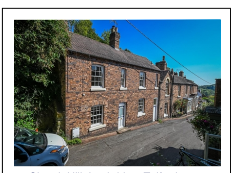
25 Church Hill, Ironbridge, Telford