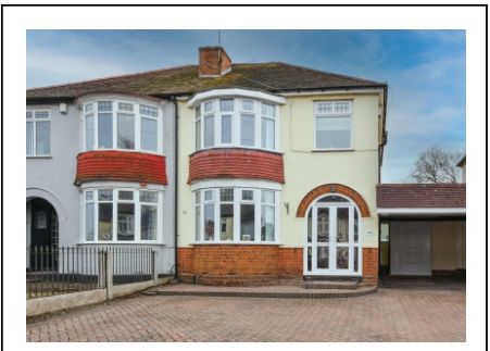
53 Woodland Road, Merry Hill, Wolverhampton