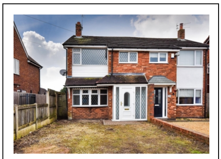
93 Hazel Grove, Wombourne, Wolverhampton