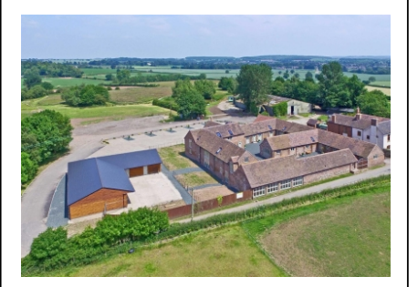
Saxon Meadow Cottage 5, The Wyke, Shifnal