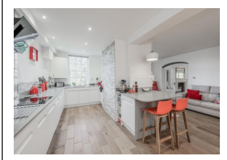
4 Stanmore Mews, Stourbridge Road, Stanmore, Bridgnorth