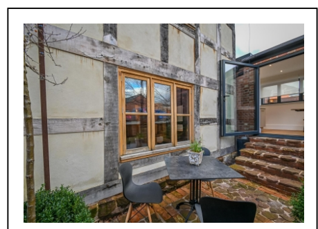
Park Cottage, Abbey Foregate, Shrewsbury