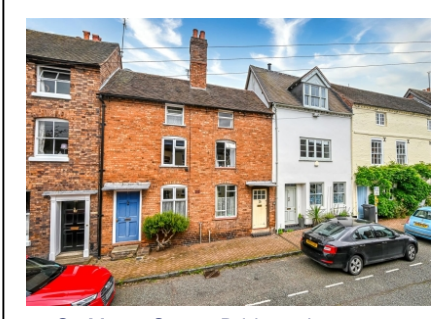
24 St. Marys Street, Bridgnorth