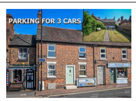
50 Whitburn Street, Bridgnorth