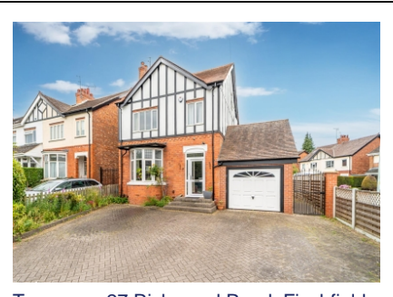
Tregunna, 27 Richmond Road, Finchfield