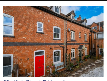
22a High Street, Bridgnorth