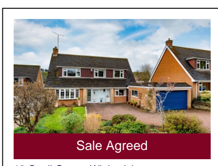
18 Quail Green, Wightwick, Wolverhampton