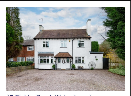
17 Stubbs Road, Wolverhampton