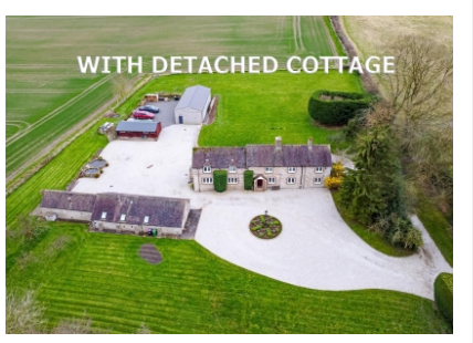
Lower Westwood Farm, Stretton Westwood, Much Wenlock