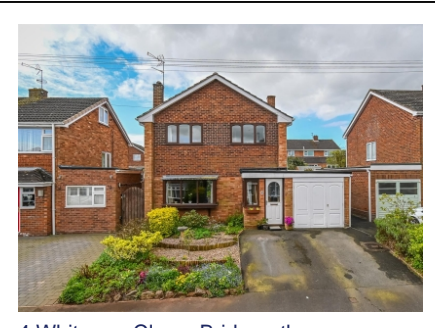
4 Whitmore Close, Bridgnorth