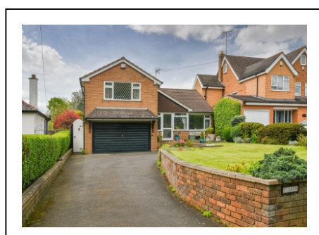
Stourbridge Road, Wombourne, Wolverhampton