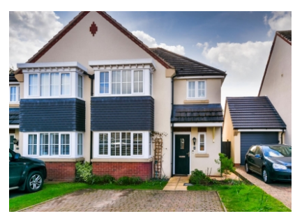
4 The Limes, Codsall Wood, Wolverhampton