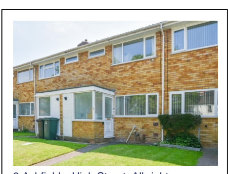
3 Ashfields, High Street, Albrighton