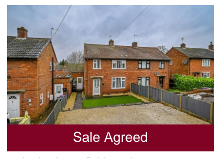
28 Lodge Lane, Bridgnorth