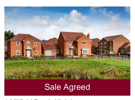
1 Millfield Road, Albrighton, Wolverhampton