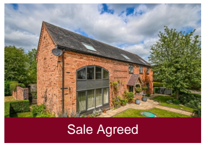
1 The Paddock, Claverley, Wolverhampton