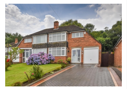
4 Chase View, Ettingshall Park, Wolverhampton