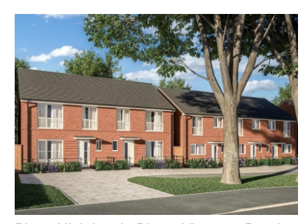
Plot 4 Nightingale Place, Vicarage Road, Wolverhampton