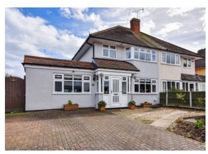
34 Delaware Avenue, Albrighton