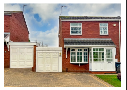
14 St James Street, Lower Gornal, Dudley