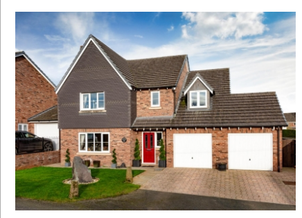
41 Kings Road, Calf Heath, Wolverhampton