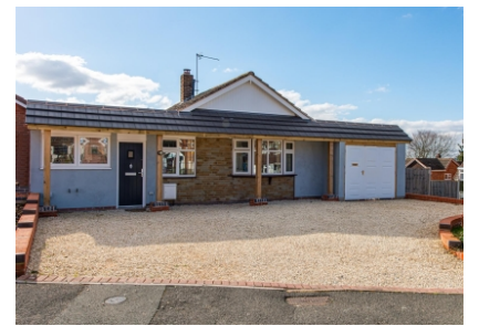
21 Uplands Drive, Wombourne, Wolverhampton