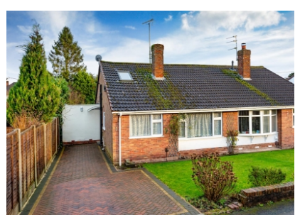
1 Norton Close, Penn, Wolverhampton