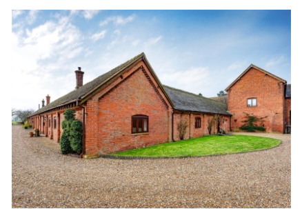
The Byre, Home Farm Road, Burnhill Green, Wolverhampton