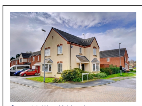
Greatwich Way, Kidderminster