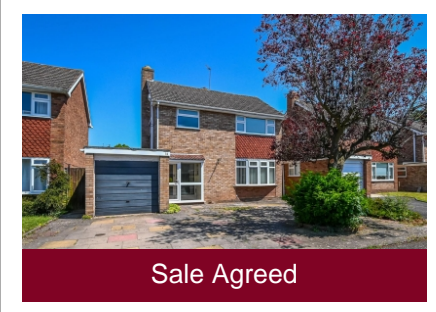
14 The Orchard, Albrighton, Wolverhampton