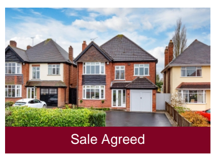
39 Meadow Road, Finchfield