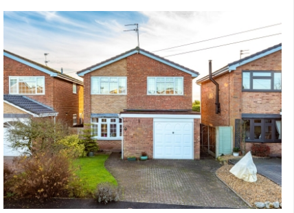
3 Braemar Road, Pattingham, Wolverhampton