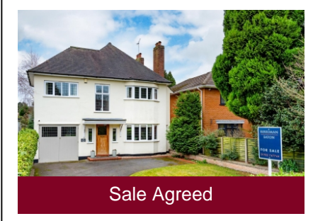
Randolph House, 55 Woodthorne Road, Wolverhampton