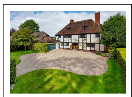
Findon, Haughton Lane, Shifnal