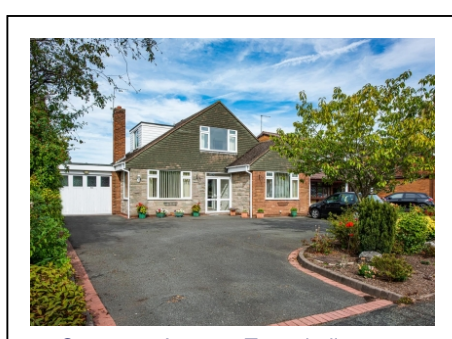
83 Cranmere Avenue, Tettenhall, Wolverhampton