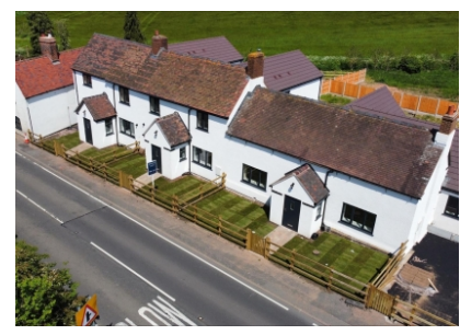
1 Ackleton Meadows, Stableford, Bridgnorth