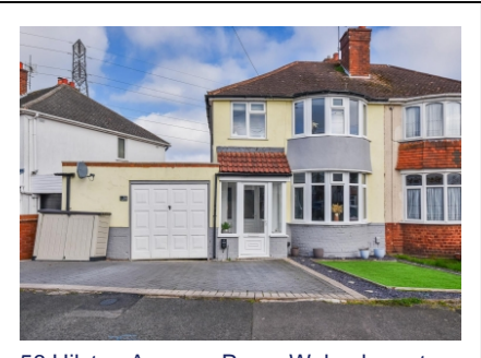
56 Hilston Avenue, Penn, Wolverhampton