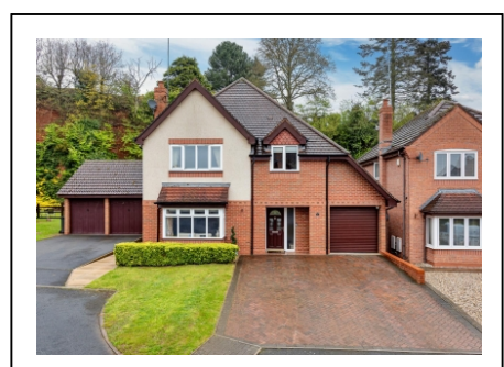
Hillside, Wombourne, Wolverhampton