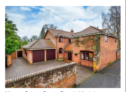
Manor Court, Cross Road, Albrighton, Wolverhampton