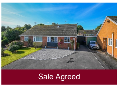
10 Captains Road, Bridgnorth