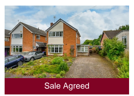
49 Oldbury Wells, Bridgnorth