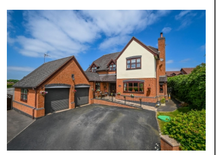
Cape Lodge, Billingsley, Bridgnorth