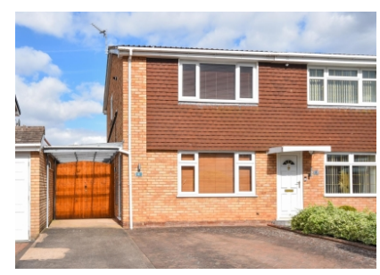
Green Meadow Close, Wombourne, Wolverhampton