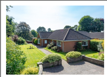
11 Compton Hill Drive, Compton, Wolverhampton