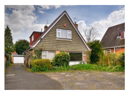
68 Mount Road, Tettenhall Wood, Wolverhampton