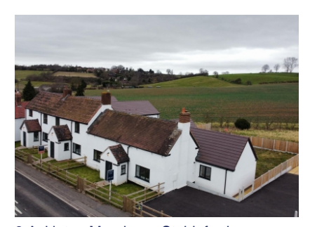
3 Ackleton Meadows, Stableford, Bridgnorth