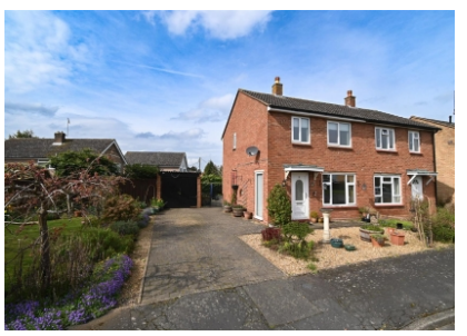
9 Wrekin Road, Bridgnorth