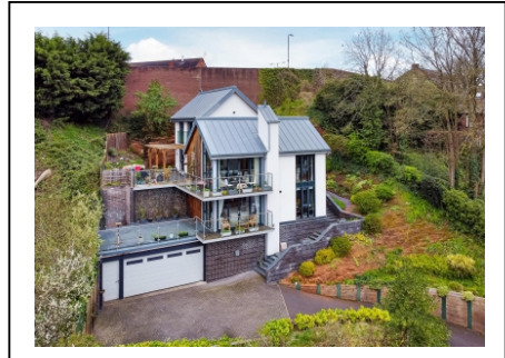
Hawthorn View, Hollybush Road, Bridgnorth