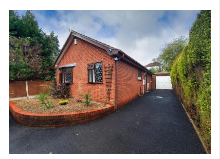
10 Planks Lane, Wombourne, Wolverhampton