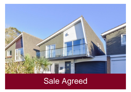
2 Cheswell Close, Compton, Wolverhampton