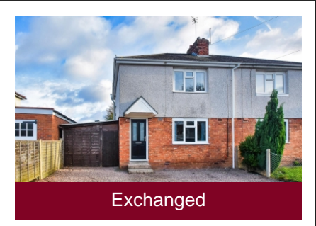
34 Hazel Grove, Wombourne, Wolverhampton