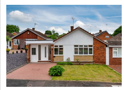
4 Mayfair Close, Albrighton, Wolverhampton