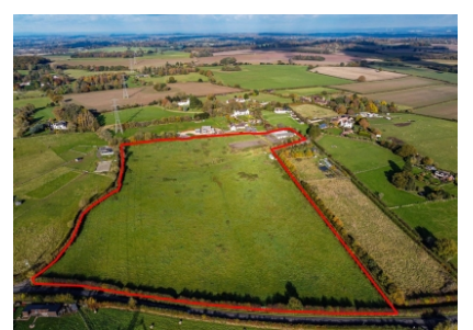
Plot of Land at Former Mill Riding Centre, Warstone Hill Road, Pattingham