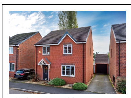
39 Rakegate Close, Oxley, Wolverhampton