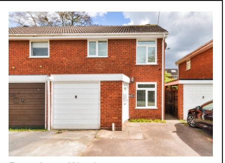
Forge Leys, Wombourne