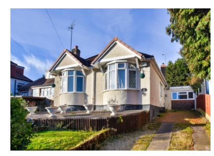
The Chalett, 78 Bridgnorth Road, Compton