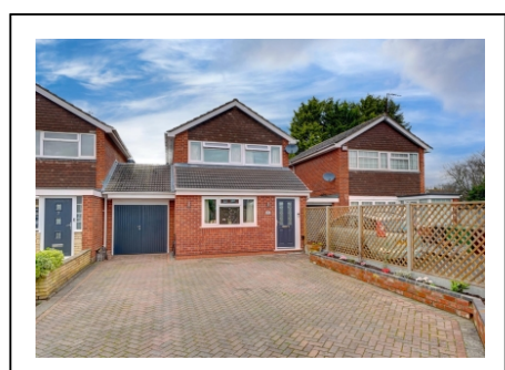
Elderberry Close, Stourport-On-Severn