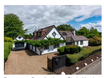
Pennygate, Paradise Lane, Slade Heath, Wolverhampton