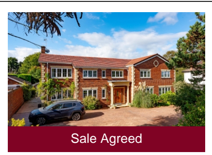
Elan Ridge. Pool House Road, Wombourne, Wolverhampton