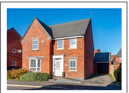
8 Brick Kiln Way, Baggeridge Village