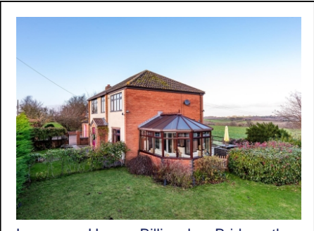
Longmoor House, Billingsley, Bridgnorth