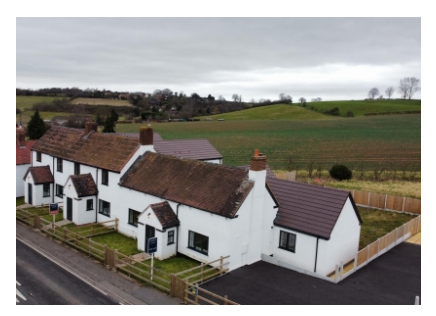
3 Ackleton Meadows, Stableford, Bridgnorth