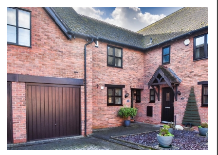
17 Bridgeman Court, Weston-Under-Lizard, Shifnal