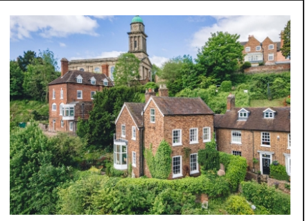
Castle Cliffe House, 24 St. Mary's Steps, Bridgnorth