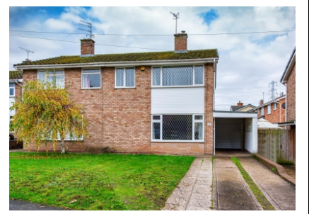
36 Wombourne Road, Swindon, Dudley