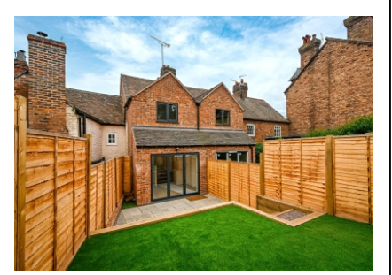
6 Salop Street, Bridgnorth