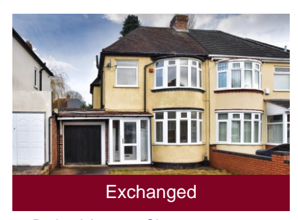
68 Burland Avenue, Claregate, Wolverhampton