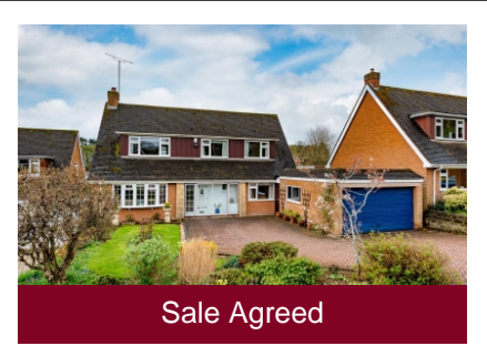
18 Quail Green, Wightwick, Wolverhampton