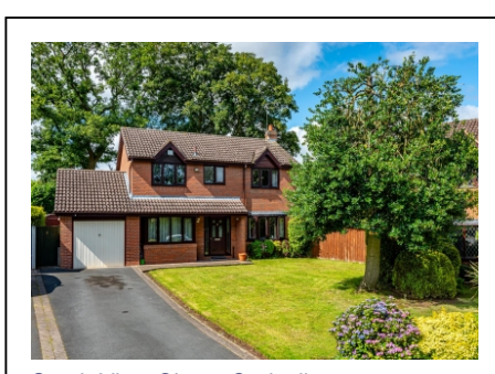
South View Close, Codsall, Wolverhampton