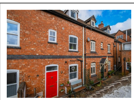
22a High Street, Bridgnorth