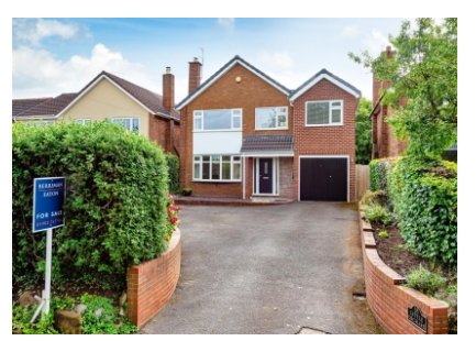
18 Rudge Road, Pattingham, Wolverhampton