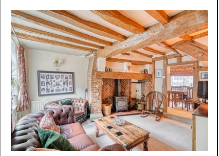
Bridgend Cottage, 43 Cartway, Bridgnorth