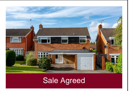
11 Copper Beech Drive, Wombourne, Wolverhampton