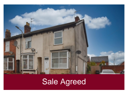
62 Merridale Street West, Wolverhampton