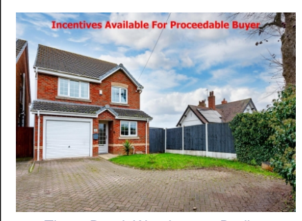
151 Tipton Road, Woodsetton, Dudley