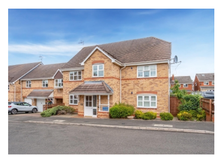
10 Cygnet Court, Wombourne, Wolverhampton