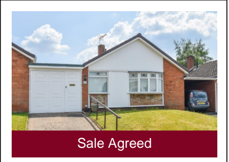
13 The Broadway, Wombourne, Wolverhampton