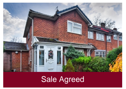
5 Manor Close, Codsall, Wolverhampton