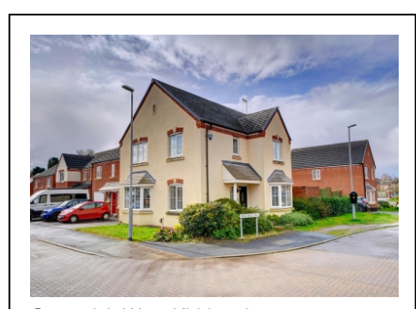
Greatwich Way, Kidderminster