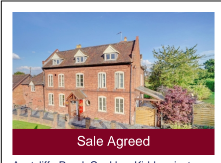
Austcliffe Road, Cookley, Kidderminster