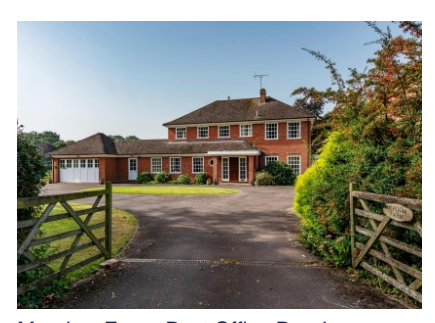
Meadow Farm, Post Office Road, Seisdon, Wolverhampton