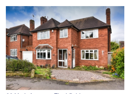
66 York Avenue, Finchfield, Wolverhampton