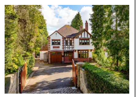
Dalkeith, 25 Tinacre Hill, Wightwick, WV6 8DB