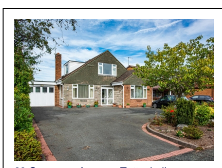
83 Cranmere Avenue, Tettenhall, Wolverhampton