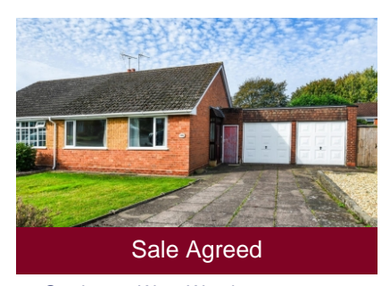
10 Gardeners Way, Wombourne, Wolverhampton