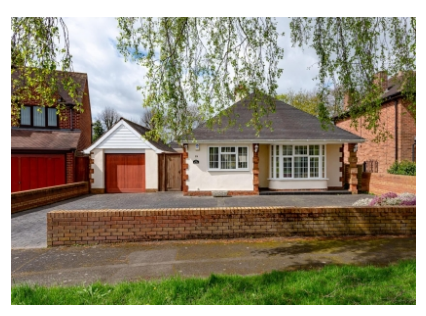
19 Foley Avenue, Tettenhall, Wolverhampton