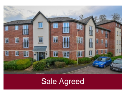
25 Greyfriars House, Stourbridge Road, Bridgnorth