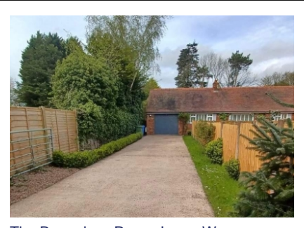
The Bungalow, Popes Lane, Wergs , Tettenhall