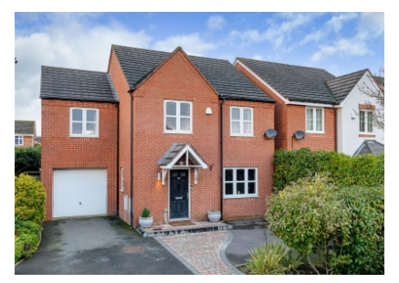
80 Brickbridge Lane, Wombourne, Wolverhampton