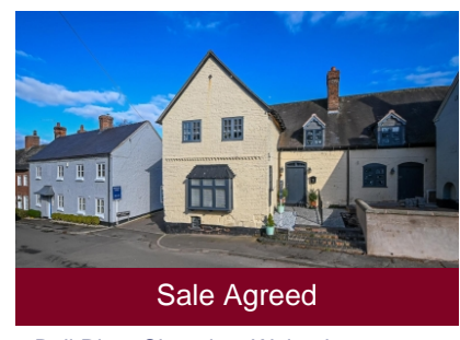
7 Bull Ring, Claverley, Wolverhampton