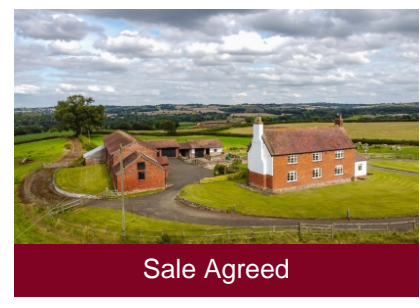
Lower Sutton Farm, Sutton, Chelmarsh, Bridgnorth