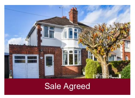
17 Fairview Road, Penn, Wolverhampton