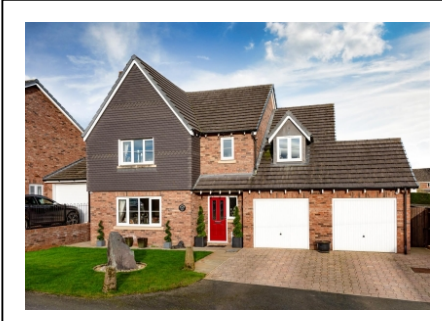
41 Kings Road, Calf Heath, Wolverhampton