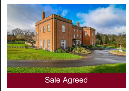
Upper Mill Meadow, Gatacre Hall, Gatacre, Claverley, Wolverhampton