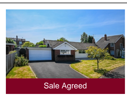
50 The Wold, Claverley, Shropshire