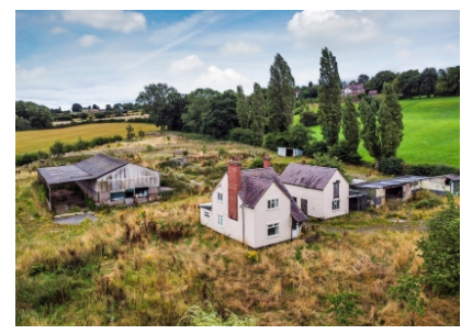
Robins Nest Farm, Dirty Foot Lane, Lower Penn, Wolverhampton