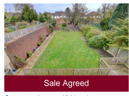
Grosvenor Avenue, Kidderminster