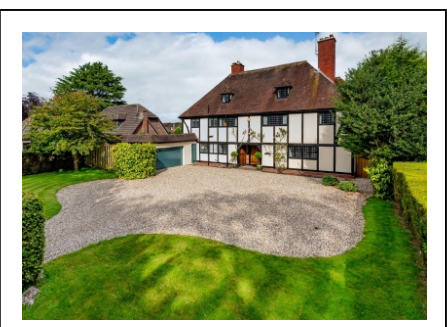
Findon, Haughton Lane, Shifnal