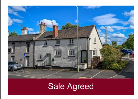
33 Salop St, Bridgnorth