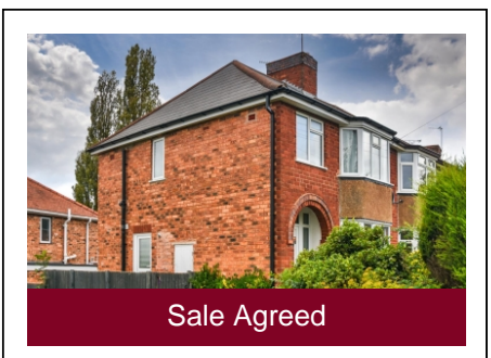
2 Fancourt Avenue, Penn, Wolverhampton