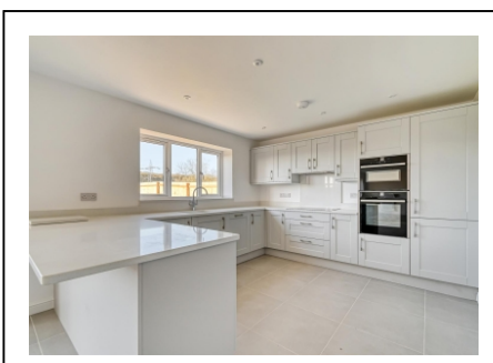
Green Acres, 3 Rowan Grange, Broseley