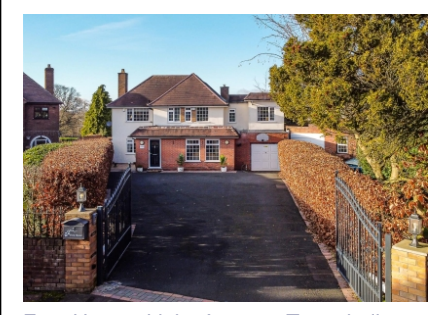
Fern House, Links Avenue, Tettenhall