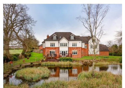
4 Albrighton House, The Water Gardens, Wolverhampton