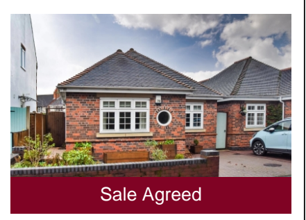
70 Finchfield Road, Wolverhampton