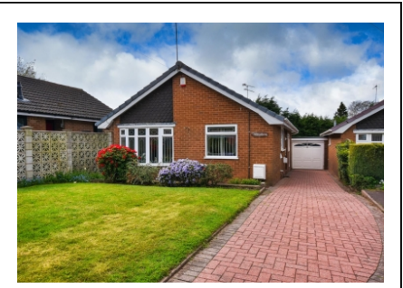
19 Finchdene Grove, Finchfield, Wolverhampton