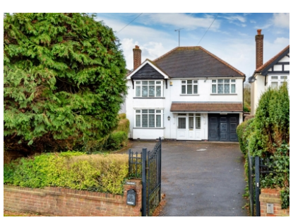
Maleesh, Stourbridge Road, Wombourne