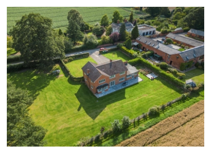
Oaklands Farm, Lower Rudge, Pattingham, Wolverhampton