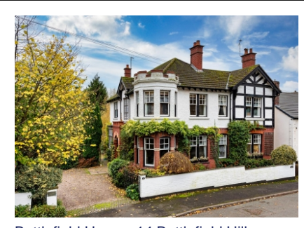
Battlefield House, 14 Battlefield Hill, Wombourne, Wolverhampton