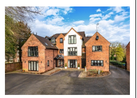
3 The Gables, Seisdon Road, Trysull, Wolverhampton