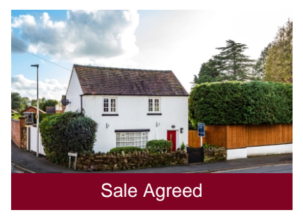
Station Cottage, 58 Station Road, Albrighton