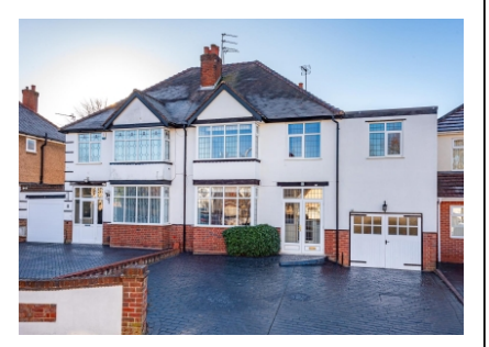
7 Osborne Road, Wolverhampton