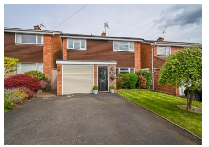
18 Stretton Close, Bridgnorth