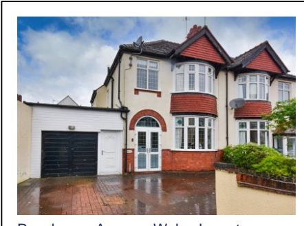
Pennhouse Avenue, Wolverhampton