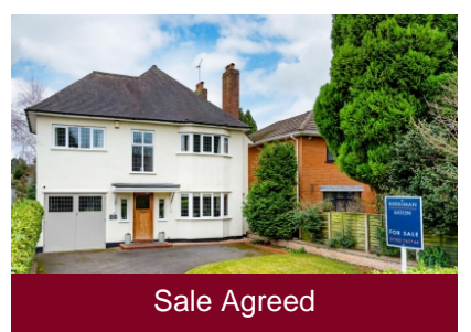
Randolph House, 55 Woodthorne Road, Wolverhampton