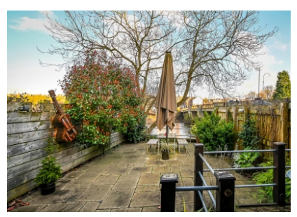
45 Cartway, Bridgnorth