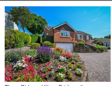
Three Ridges, Hilton, Bridgnorth