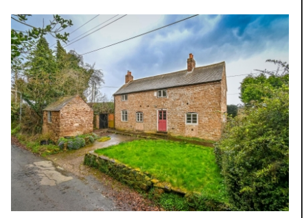
148 Broad Oak, Six Ashes