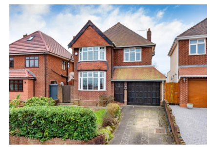
15 Foxlands Avenue, Wolverhampton