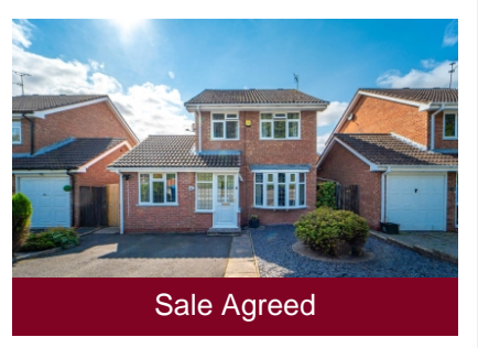
42 Gainsborough Drive, Perton, Wolverhampton