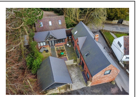
The Old Coach House, Little Wenlock, Telford