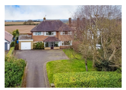
Grasmere, 5 Westbeech Road, Pattingham