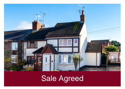
118 Common Road, Wombourne, Wolverhampton