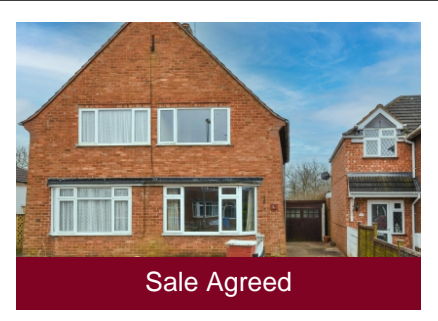
30 Sandringham Road, Wombourne, Wolverhampton