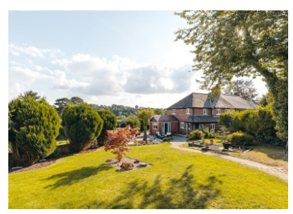
Sunnybank, 11b, Danesford, Bridgnorth