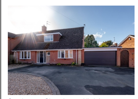
Strathmore, Shaw Lane, Albrighton