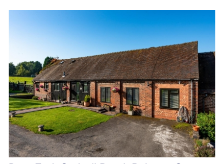
Barn End, Codsall Road, Palmers Cross, Wolverhampton