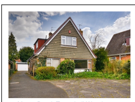
68 Mount Road, Tettenhall Wood, Wolverhampton