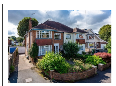
7 Newbridge Gardens, Newbridge, Wolverhampton