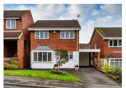
2 Woodthorne Close, Lower Gornal, Dudley