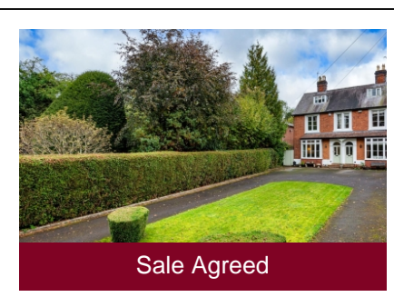
Fernleigh, 35 Oaken Lanes, Codsall