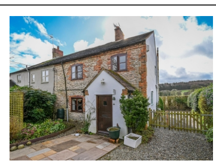
1 The Row, Easthope, Much Wenlock