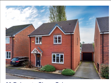
39 Rakegate Close, Oxley, Wolverhampton