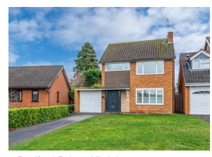
1 Redford Drive, Albrighton