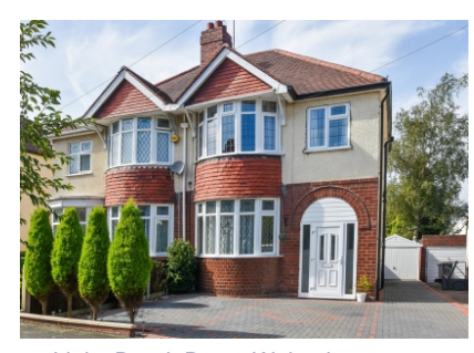
28 Links Road, Penn, Wolverhampton