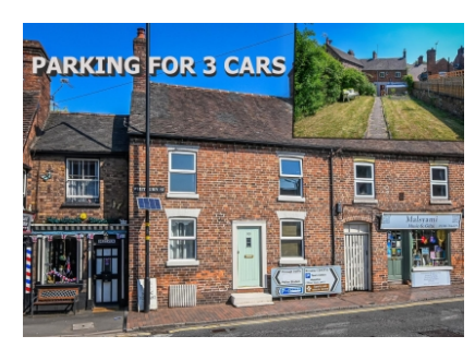
50 Whitburn Street, Bridgnorth