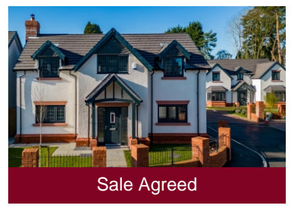
Alder House, Popes Lane, Tettenhall