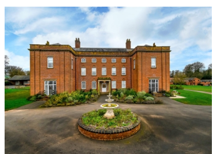
Home Wood, Gatacre Hall, Claverley, Wolverhampton