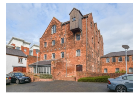
11 The Mill, Albion Street, Wolverhampton