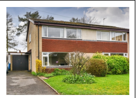
32 The Greenway, Pattingham, Wolverhampton