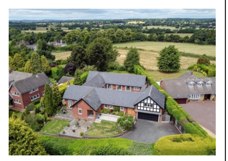
Courtneys, Oaken Drive, Oaken, Codsall