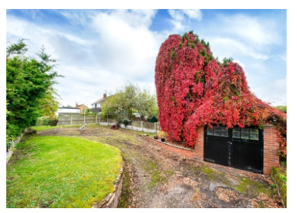
Planning Permission, 40 Moatbrook Lane, Codsall, WV8 1SD