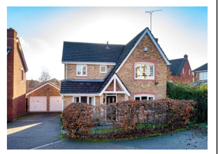
17 Holendene Way, Wombourne, Wolverhampton