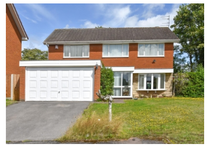
4 The Heathlands, Wombourne, Wolverhampton