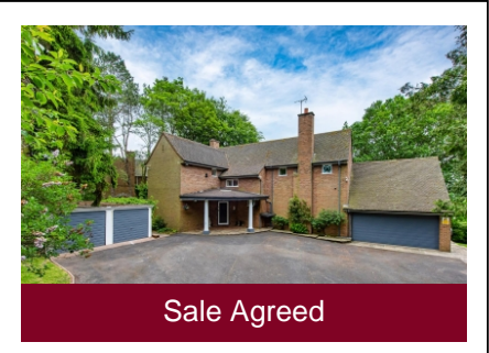
Farthings Hill, Pattingham Road, Perton Ridge