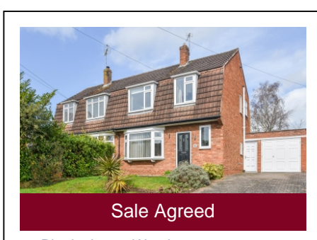
96 Planks Lane, Wombourne, Wolverhampton