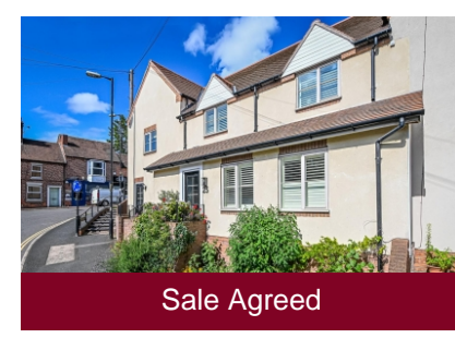
23 Pound Street, Bridgnorth