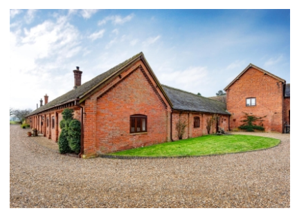
The Byre, Home Farm Road, Burnhill Green, Wolverhampton