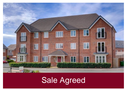
Ashford Road, Worcester