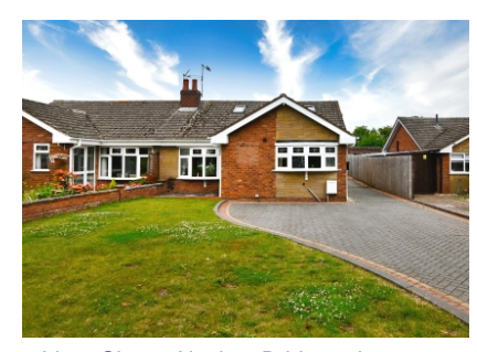
6 Lime Close, Alveley, Bridgnorth