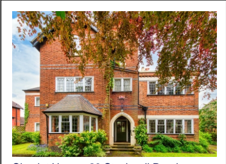
Cheviot House, 20 Stockwell Road, Tettenhall