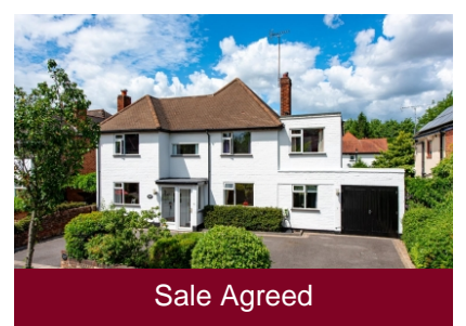
Helford House, Westland Avenue, Compton