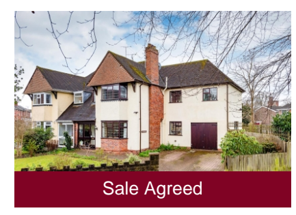
The Homestead, Westland Avenue, Compton