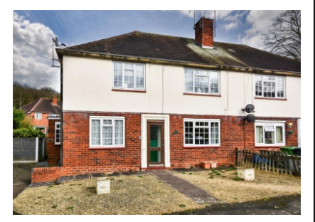
73 Meadow Lane, Wombourne, Wolverhampton