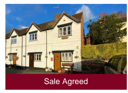
26c Bernards Hill, Bridgnorth