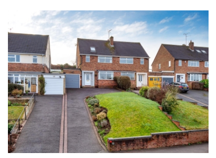
44 Common Road, Wombourne, Wolverhampton