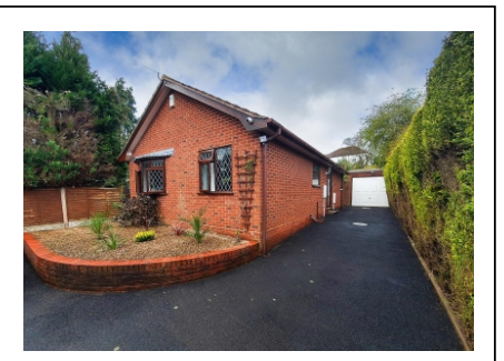
10 Planks Lane, Wombourne, Wolverhampton