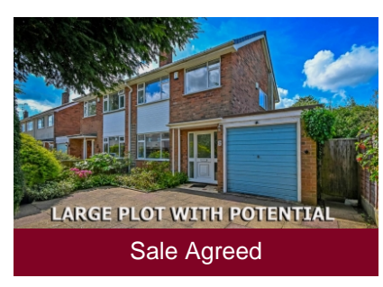
6 Moor Lane, Pattingham, Wolverhampton