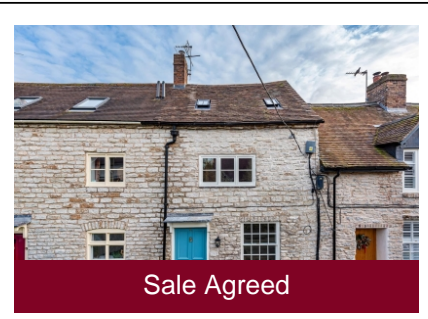
5a King Street, Much Wenlock, Shropshire