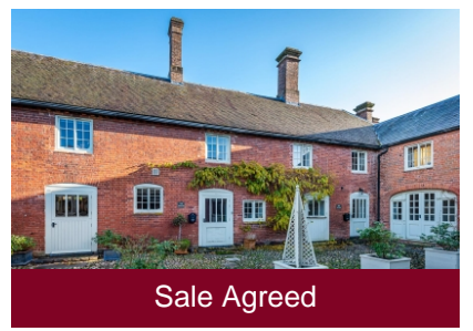
The Ostlers, 3 Patshull Hall Mews, Burnhill Green