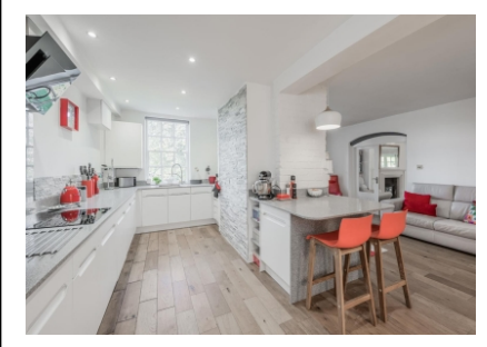
4 Stanmore Mews, Stourbridge Road, Stanmore, Bridgnorth