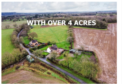
Keepers Cottage, Colemore Green, Bridgnorth