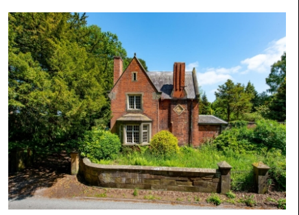
Wergs Hall Gardens, Wergs Hall Road, Tettenhall