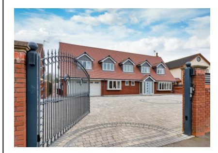
Alpine Cottage, 11 Kings Road, Calf Heath