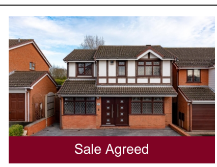
17 Fieldview Close, Coseley, Bilston