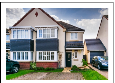
4 The Limes, Codsall Wood, Wolverhampton