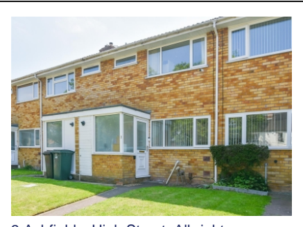
3 Ashfields, High Street, Albrighton