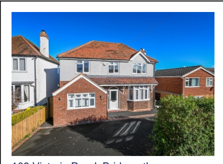
109 Victoria Road, Bridgnorth