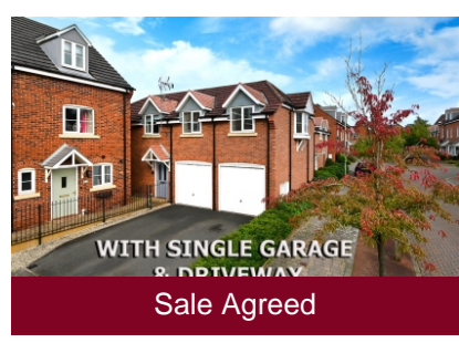
14 Rastrick Close, Bridgnorth