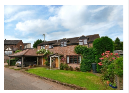
Finger Cottage, 123 Birds Green, Alveley, Bridgnorth