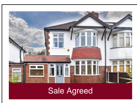
103 Windsor Avenue, Penn, Wolverhampton