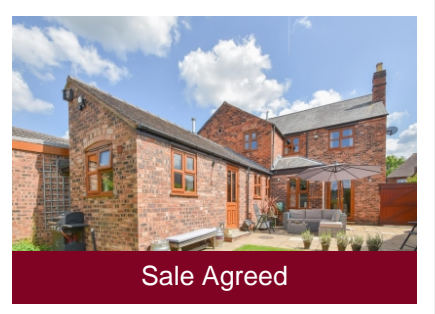
The Cottage, 18 Shop Lane, Oaken