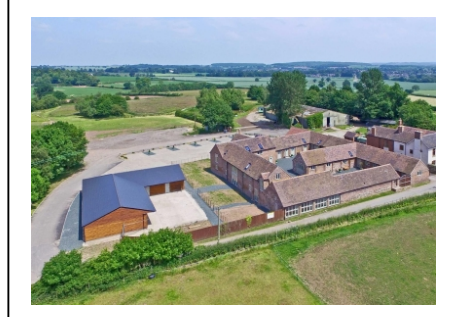
Saxon Meadow Cottage 5, The Wyke, Shifnal