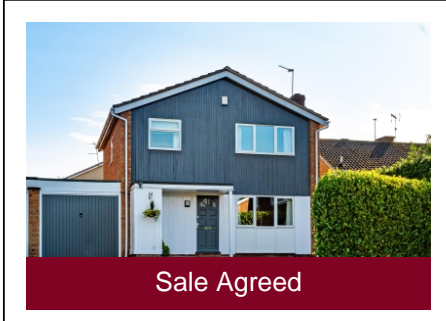
4 Beech Close, Pattingham, Wolverhampton