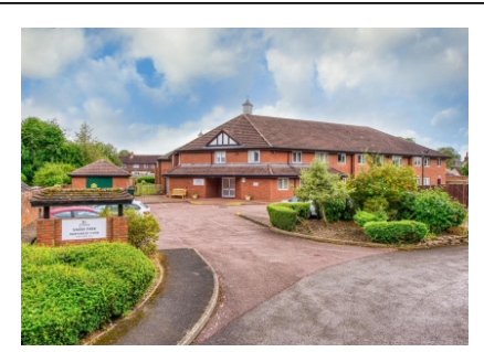
13 Saxon Park, High Street, Albrighton, Wolverhampton