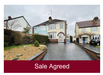
31 Sedgley Road, Penn Common, Penn