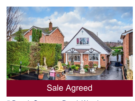
5 Bratch Common Road, Wombourne, Wolverhampton