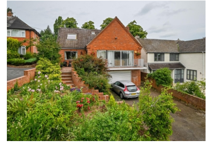
The Tyning, Westgate Drive, Bridgnorth