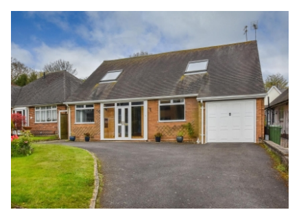
38 Foley Avenue, Tettenhall, Wolverhampton