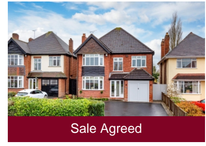
39 Meadow Road, Finchfield