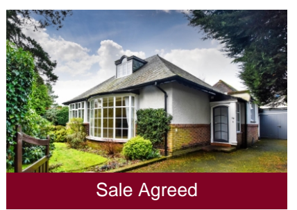
The Grey Cottage 19 Clifton Road, Wolverhampton