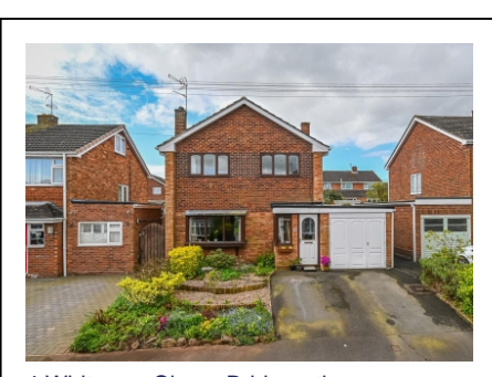
4 Whitmore Close, Bridgnorth