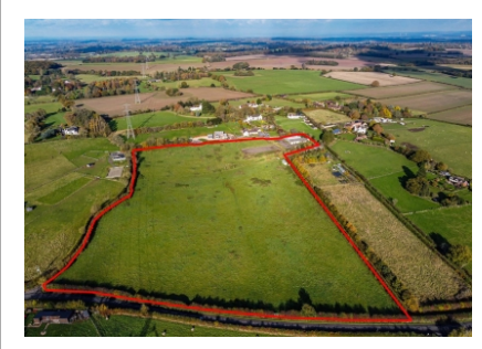
Plot of Land at Former Mill Riding Centre, Warstone Hill Road, Pattingham