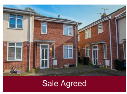
17 Orchard Square, Highley, Bridgnorth