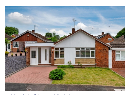
4 Mayfair Close, Albrighton, Wolverhampton