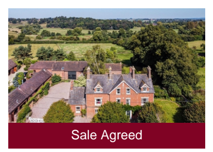
Roughton Farmhouse, Roughton, Bridgnorth