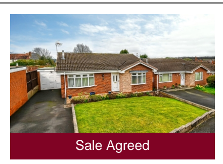
7 Claremont Drive, Bridgnorth