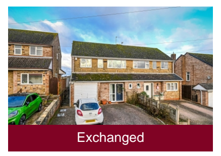
34 Honeybourne Road, Alveley, Bridgnorth