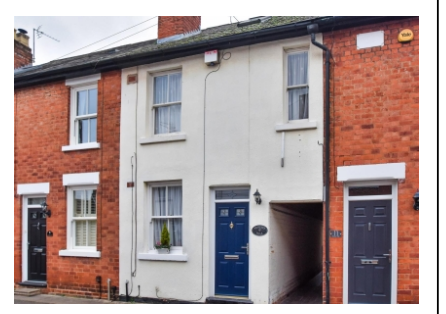
9 Nursery Walk, Wolverhampton