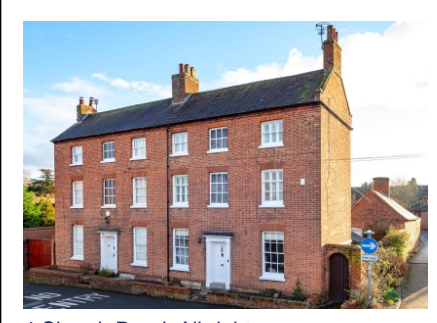
4 Church Road, Albrighton, Wolverhampton