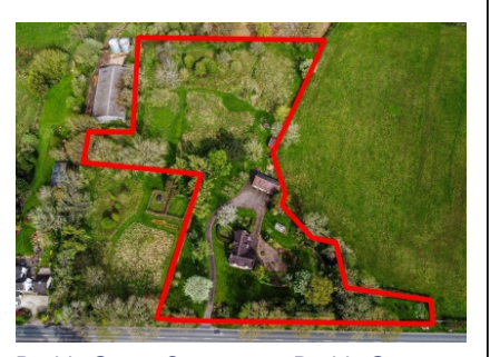
Dodds Green Cottage, 79 Dodds Green, Alveley, Bridgnorth