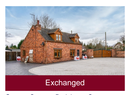
Granary Cottage, Dark Lane, Cross Green, Wolverhampton