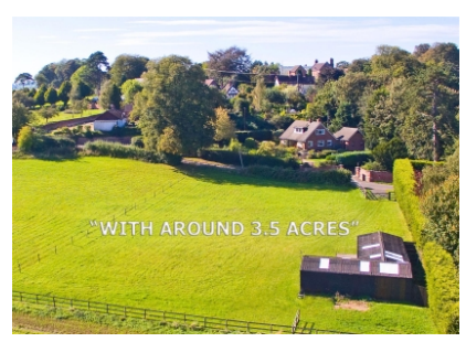
Half Acre House, Stableford, Bridgnorth