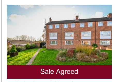
47 Tasley Close, Bridgnorth