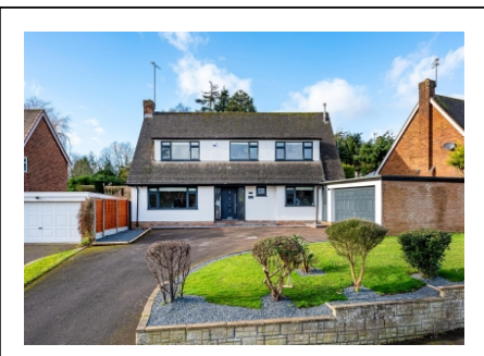
25 Perton Brook Vale, Wightwick