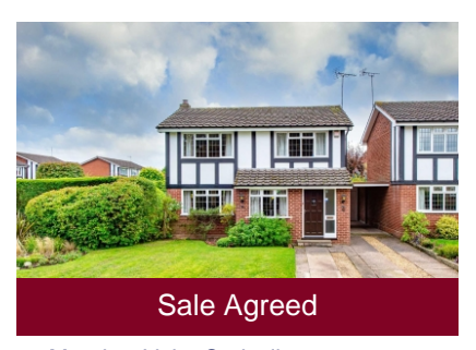
16 Meadow Vale, Codsall, Wolverhampton