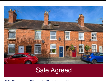
29 Severn Street, Bridgnorth