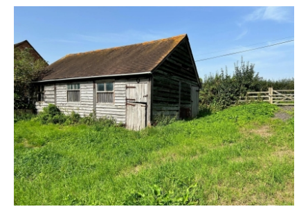
Spring Barn, Glazeley, Bridgnorth