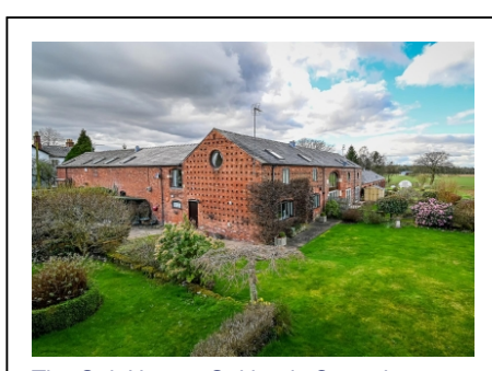
The Oak House, Oaklands Court, Lower Rudge, Pattingham