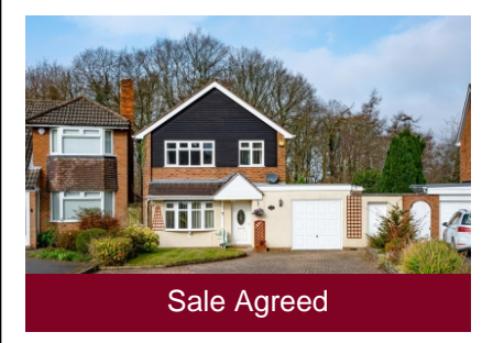
12 Hopstone Gardens, Penn, Wolverhampton