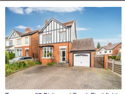
Tregunna, 27 Richmond Road, Finchfield