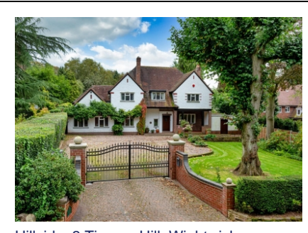
Hillside, 3 Tinacre Hill, Wightwick