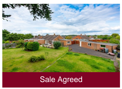
7 Blakeley Heath Drive, Wombourne, Wolverhampton