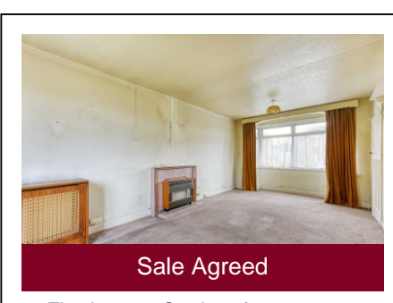
26 The Avenue, Castlecroft, Wolverhampton