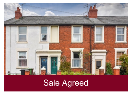
46 Merridale Road, Wolverhampton