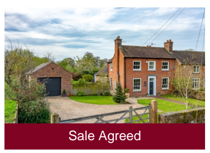
The Little House, 7 Tong Norton, Shifnal