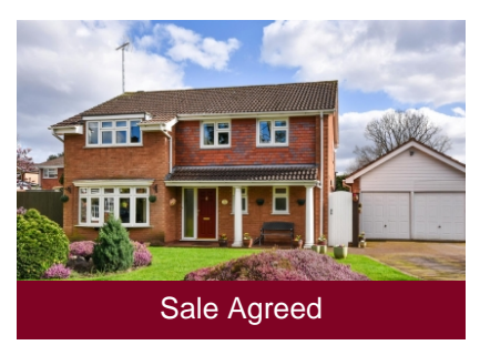
Oaken Covert, Codsall, Wolverhampton