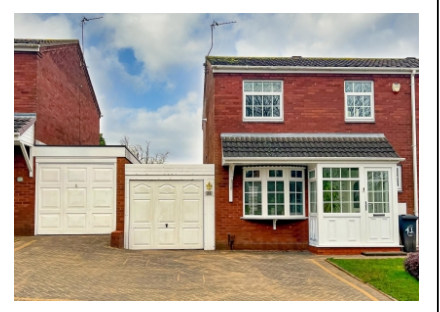
14 St James Street, Lower Gornal, Dudley