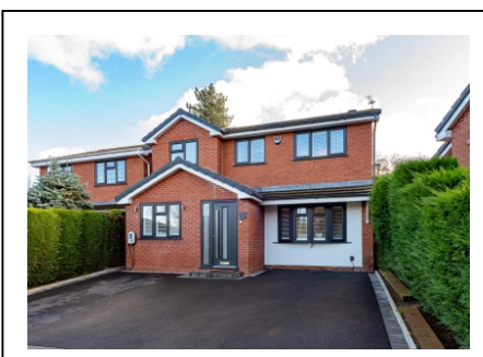
41 Ascot Drive, Dudley