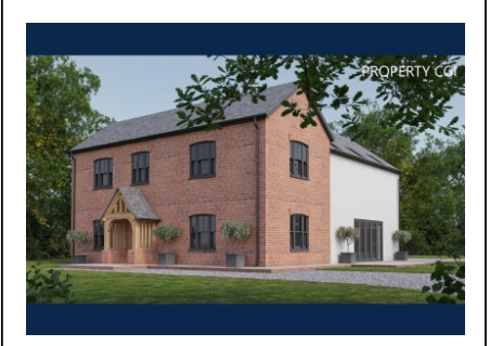
Plot 1, Bynd Lane, Billingsley, Bridgnorth