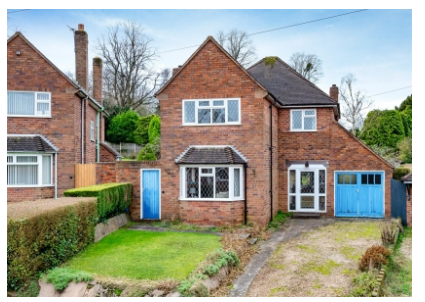
14 Peterdale Drive, Wolverhampton