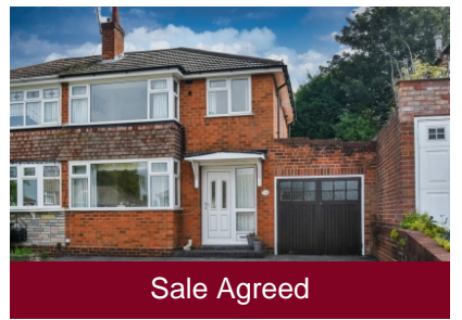
10 Waverley Crescent, Lanesfield, Wolverhampton