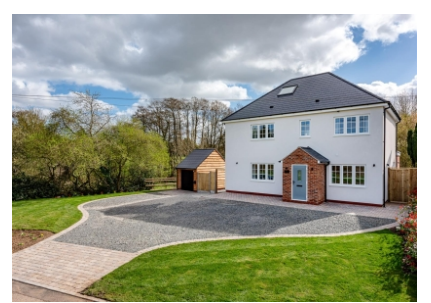
Holly Cottage, Wolverhampton Road, Pattingham