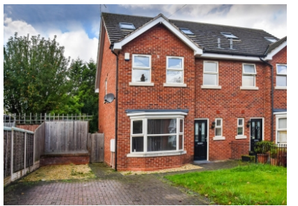
1 Marchant Road, Compton, Wolverhampton