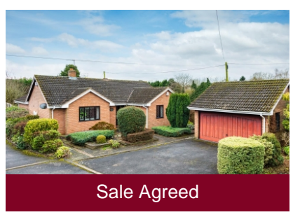
Shadowbrook, 4 Manor Fold, Middle Lane, Oaken