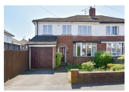
57 York Road, Wolverhampton