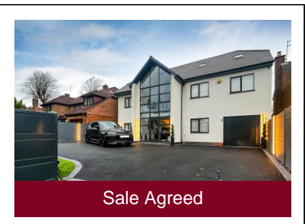
14 Lothians Road, Stockwell End