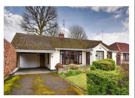
30 Sabrina Road, Wightwick, Wolverhampton