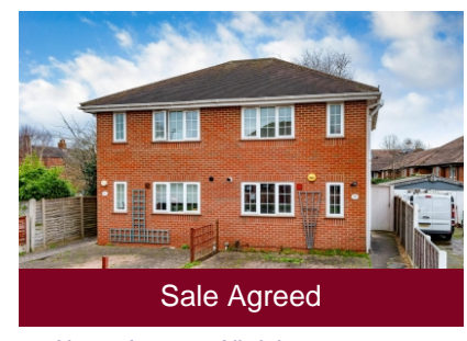
48 Abney Avenue, Albrighton