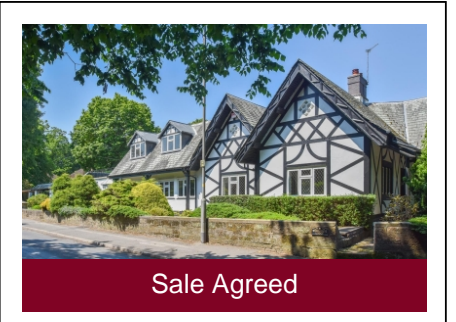
Woodhouse Lodge, Wood Road, Tettenhall Wood