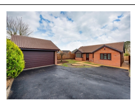
3 Montford Grove, Sedgley, Dudley