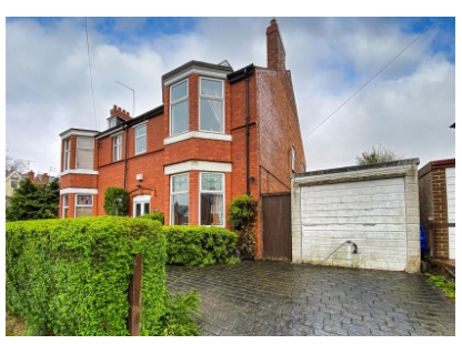
26 Marchant Road, Compton, WV3 9QG