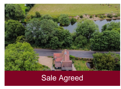
Holme Cottage, Knowle Sands, Bridgnorth