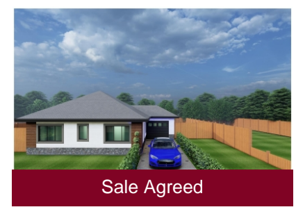
Plot 2 Hazelbrook, Hazel Lane, Great Wyrley