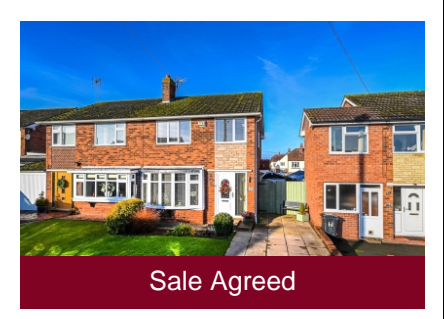
20 Orchard Drive, Bridgnorth