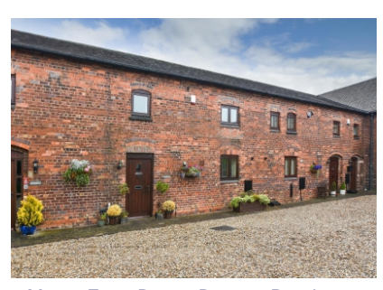
3 Manor Farm Barns, Bognop Road, Essington