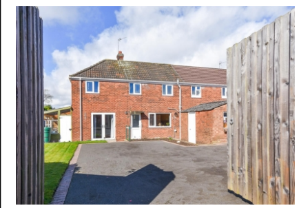
146 Cornwall Road, Wolverhampton