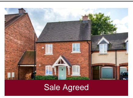
Stanham Close, Wombourne, Wolverhampton