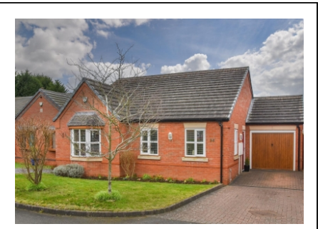
14 Berkeley Close, Perton, Wolverhampton