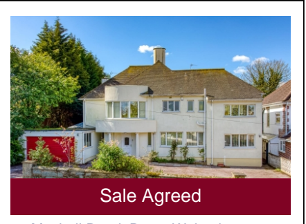
17 Muchall Road, Penn, Wolverhampton