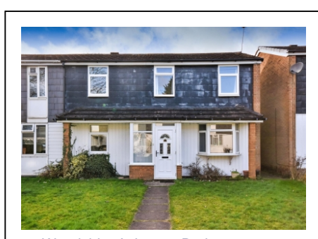
11 Woodside, Ashmore Park, Wolverhampton