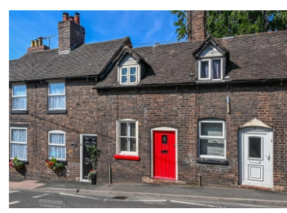
4 Pound Street, Bridgnorth