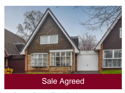
16 Surrey Drive, Finchfield, Wolverhampton