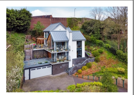
Hawthorn View, Hollybush Road, Bridgnorth