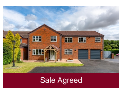
3 Mill Stream Close, Codsall, Wolverhampton