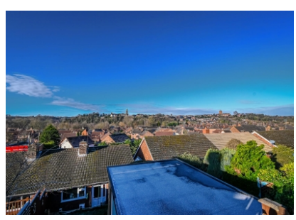
5 River View, Bridgnorth