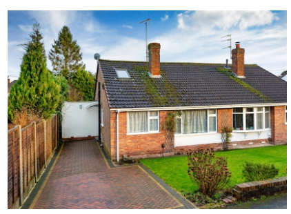
1 Norton Close, Penn, Wolverhampton