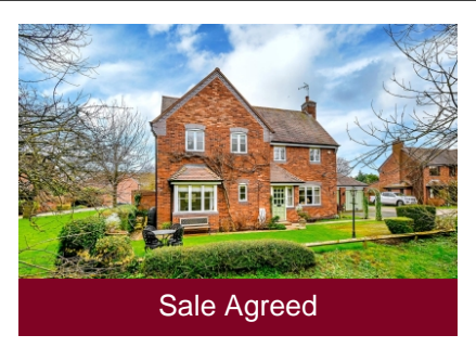
43 Pale Meadow Road, Bridgnorth