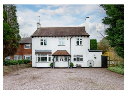
17 Stubbs Road, Wolverhampton