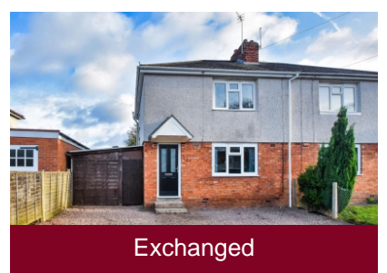
34 Hazel Grove, Wombourne, Wolverhampton