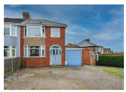
1 Rutland Avenue, Wolverhampton