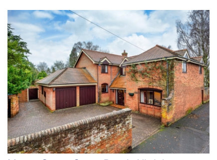
Manor Court, Cross Road, Albrighton, Wolverhampton