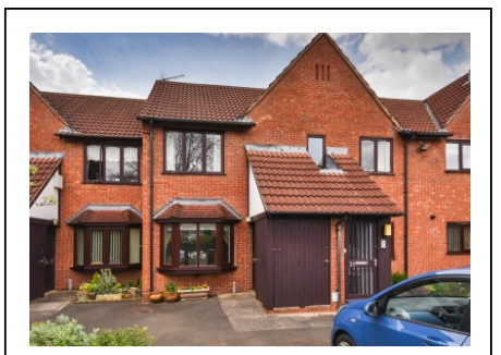
24 Hanover Court, Tettenhall, Wolverhampton