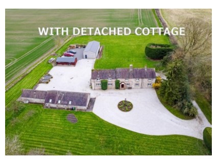
Lower Westwood Farm, Stretton Westwood, Much Wenlock