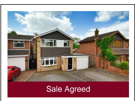
36 Bridge Road, Alveley, Bridgnorth