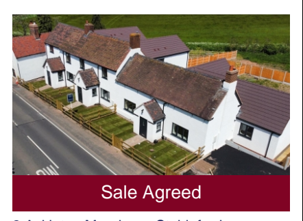
2 Ackleton Meadows, Stableford, Bridgnorth