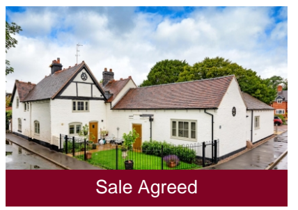
5 Plough Meadows, Trysull