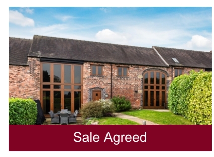
The Corn Barn, 3 East Trescott Barns Bridgnorth Road