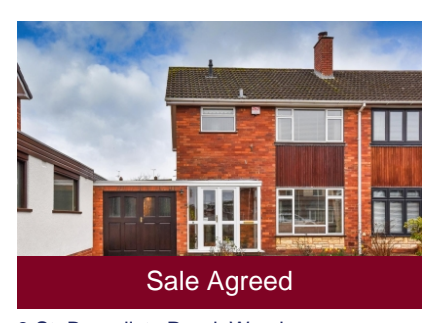
9 St. Benedicts Road, Wombourne, Wolverhampton