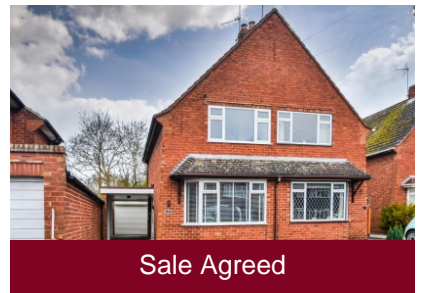
25 Bramber Drive, Wombourne, Wolverhampton