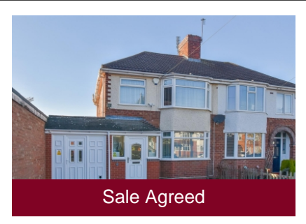
69 Fancourt Avenue, Wolverhampton