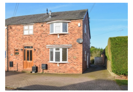
The Rambles, 16 Shop Lane, Oaken