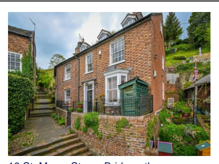
19 St. Marys Steps, Bridgnorth