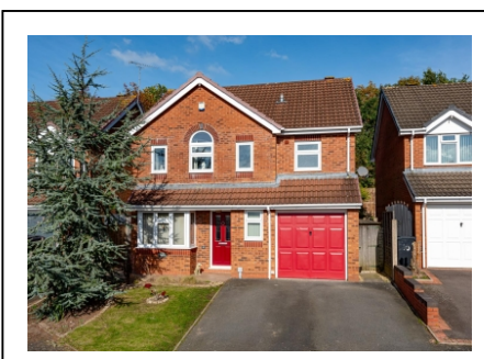
12 Dudmaston Way, Milking Bank, Dudley