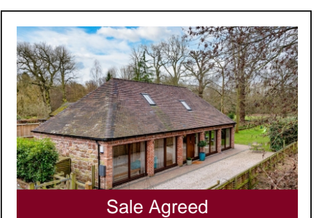
Eagle Barn, 4 Patshull Gardens, Albrighton