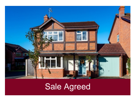
39 Penleigh Gardens, Wombourne, Wolverhampton