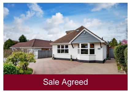
28a Wood Road, Tettenhall Wood