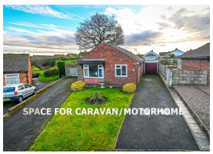
51 Linley View Drive, Bridgnorth