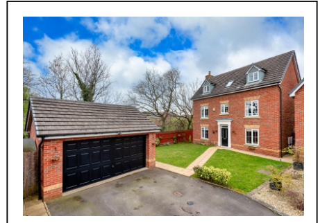
Oaklands, Wombourne, Wolverhampton