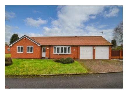
1 The Courts, Albrighton, Wolverhampton