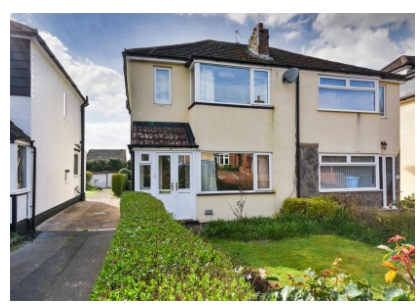
36 Hall End Lane, Pattingham, Wolverhampton