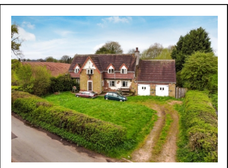
Mill Cottage, Lower Rudge, Pattingham, Wolverhampton