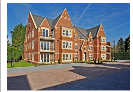
5 Ellen Place, Henry Fowler Drive, Tettenhall