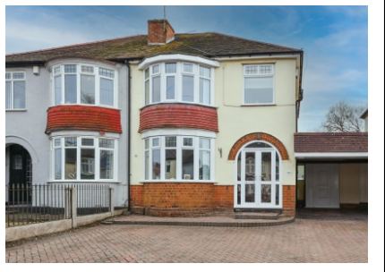
53 Woodland Road, Merry Hill, Wolverhampton