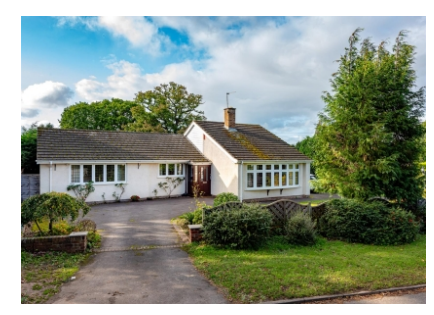
12 Keepers Lane, Codsall, Wolverhampton