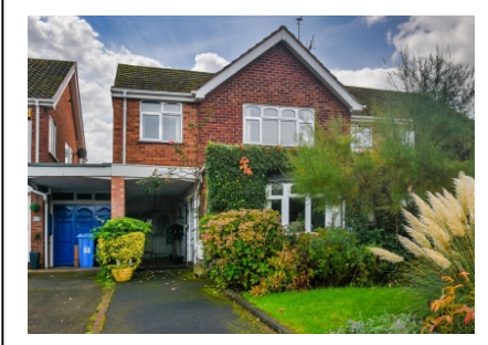
86 Van Diemans Road, Wombourne, Wolverhampton