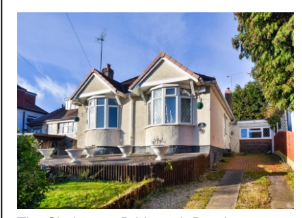
The Chalett, 78 Bridgnorth Road, Compton