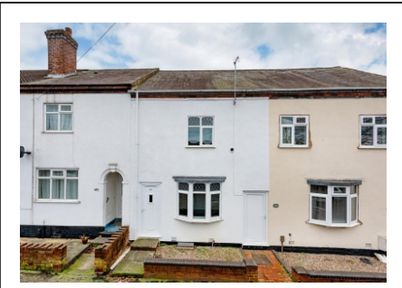
126a Clifton Street, Sedgley