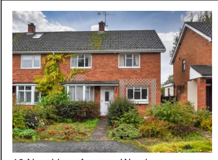
10 Neachless Avenue, Wombourne, Wolverhampton