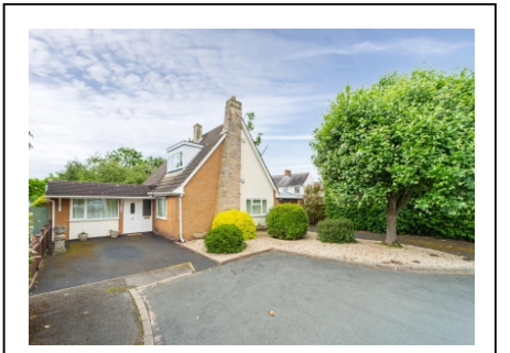
8 The Orchard, Albrighton