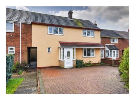
71 Cornwall Road, Tettenhall Wood