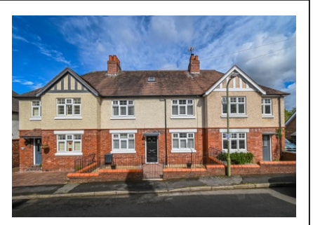
2 Cliff Gardens, Cliff Road, Bridgnorth