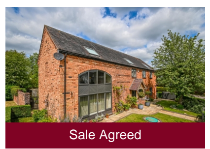
1 The Paddock, Claverley, Wolverhampton