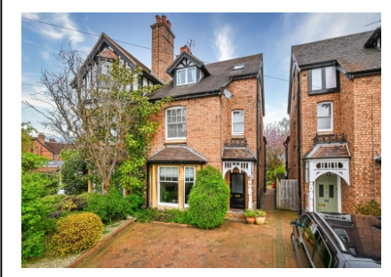
7 Westgate Villas, Salop Street, Bridgnorth