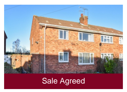
10a Hylstone Crescent, Wolverhampton