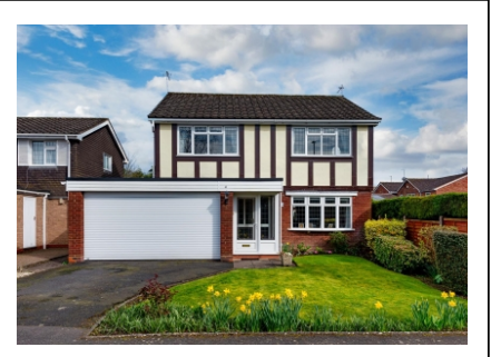
4 Rivendell Gardens, Tettenhall