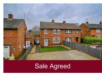
28 Lodge Lane, Bridgnorth