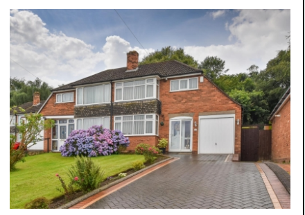
4 Chase View, Ettingshall Park, Wolverhampton