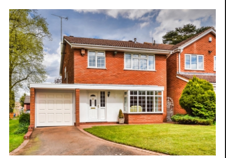
1 Foxlands Drive, Wolverhampton