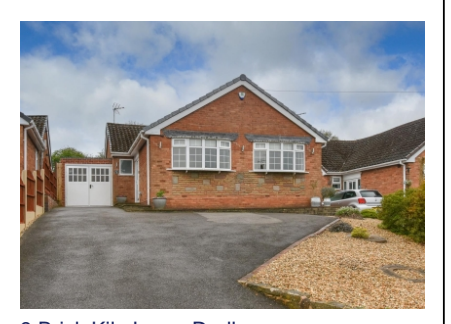
9 Brick Kiln Lane, Dudley