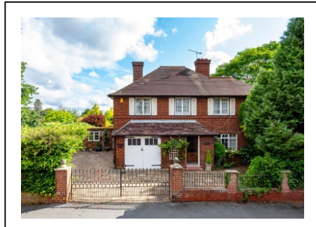
Oxleaze, Grange Road, Albrighton