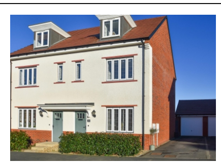
11 Marshall Way, Codsall, Wolverhampton