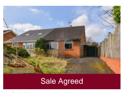
31 Bull Meadow Lane, Wombourne, Wolverhampton