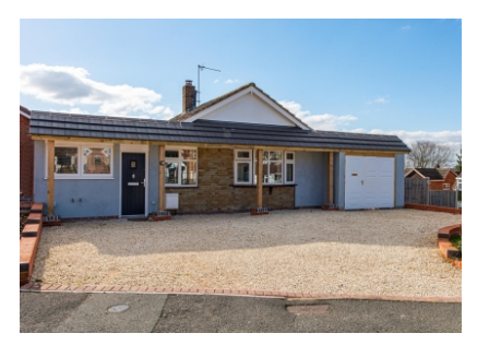
21 Uplands Drive, Wombourne, Wolverhampton