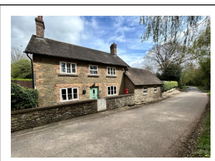
Brookside, Brockton, Much Wenlock