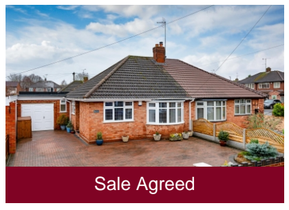
13 Kirkstone Crescent, Wombourne, Wolverhampton