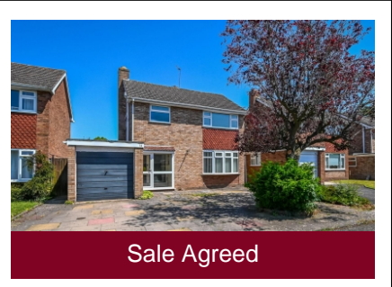
14 The Orchard, Albrighton, Wolverhampton