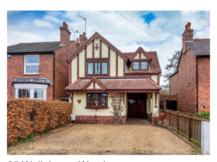
25 Walk Lane, Wombourne, Wolverhampton