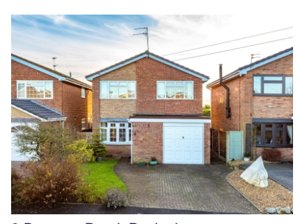
3 Braemar Road, Pattingham, Wolverhampton