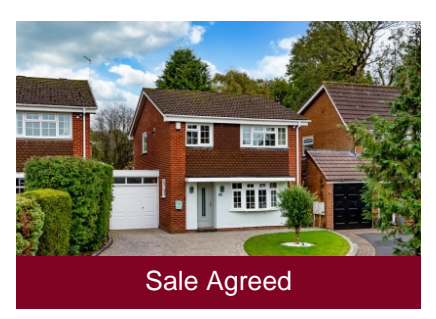
6 Tanglewood Grove, Dudley