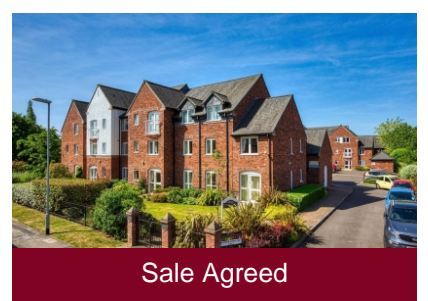
17 Wombrook Court, Wombourne, Wolverhampton