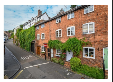
70 Cartway, Bridgnorth