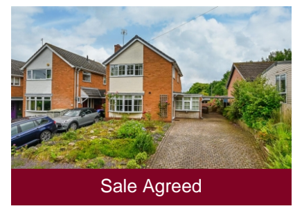
49 Oldbury Wells, Bridgnorth