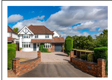
Hearthcote House, Poolhouse Road, Wombourne