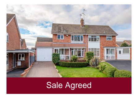
14 Chequers Avenue, Wombourne, Wolverhampton