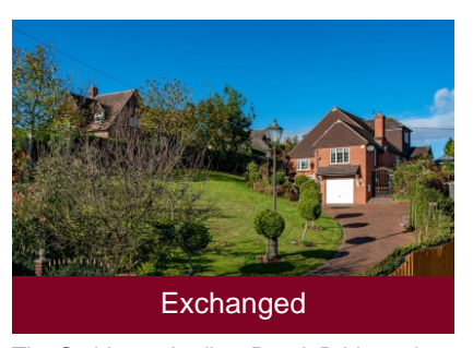
The Stable, 46 Ludlow Road, Bridgnorth