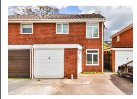
Forge Leys, Wombourne