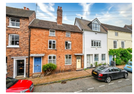
24 St. Marys Street, Bridgnorth