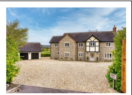
Beech House, Munslow, Shropshire