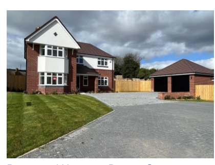
Rosewood House, 6 Rowan Grange, Broseley