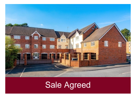
11 Cygnet Close, Compton, Wolverhampton