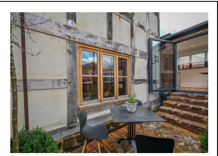
Park Cottage, Abbey Foregate, Shrewsbury