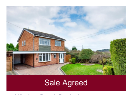
29 Windsor Road, Pattingham, Wolverhampton