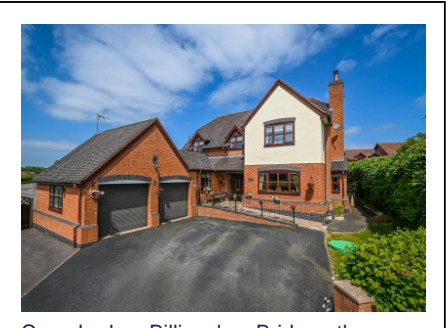
Cape Lodge, Billingsley, Bridgnorth