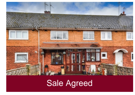
2 Woden Close, Wombourne, Wolverhampton