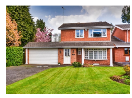
18 Fair Oak Drive, Wolverhampton