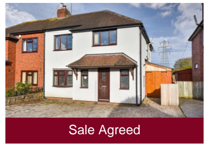
44 Market Lane, Lower Penn, Wolverhampton