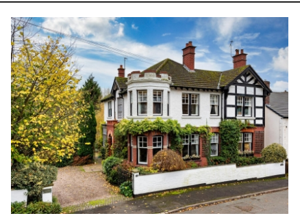
Battlefield House, 14 Battlefield Hill, Wombourne, Wolverhampton