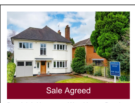
Randolph House, 55 Woodthorne Road, Wolverhampton