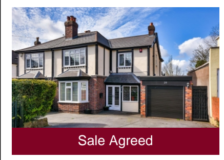
29 Goldthorn Avenue, Penn, Wolverhampton