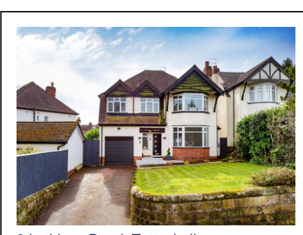
3 Lothians Road, Tettenhall, Wolverhampton