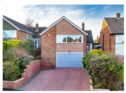
52 Church Hill, Penn, Wolverhampton