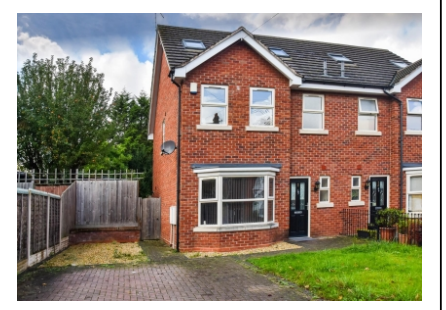
1 Marchant Road, Compton, Wolverhampton