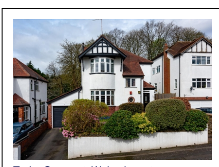
Tudor Crescent, Wolverhampton