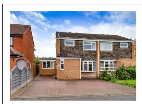
148a Birches Road, Codsall, Wolverhampton