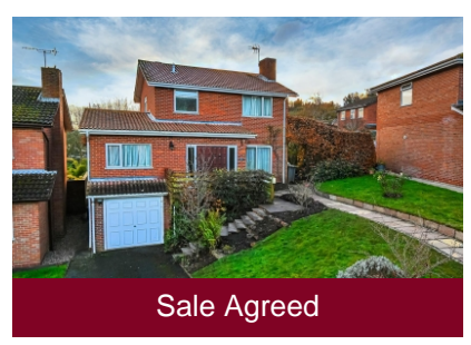
15 Bramble Ridge, Bridgnorth