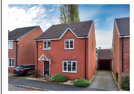
39 Rakegate Close, Oxley, Wolverhampton