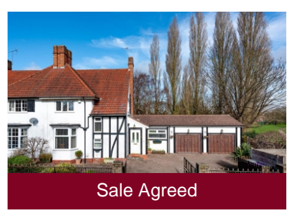
9 Myrtle Grove, Bradmore, Wolverhampton