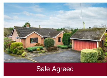
Shadowbrook, 4 Manor Fold, Middle Lane, Oaken