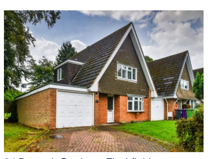
64 Bantock Gardens, Finchfield, Wolverhampton