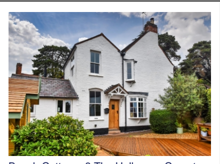
Beech Cottage, 8 The Holloway, Compton