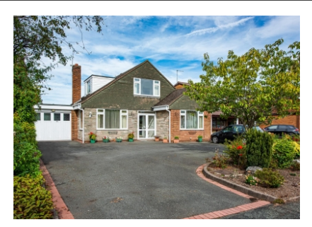
83 Cranmere Avenue, Tettenhall, Wolverhampton