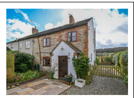
1 The Row, Easthope, Much Wenlock