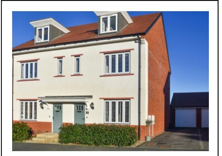
11 Marshall Way, Codsall, Wolverhampton