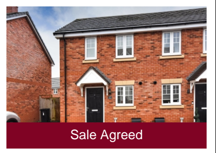
6 Sanderson Way, Codsall, Wolverhampton