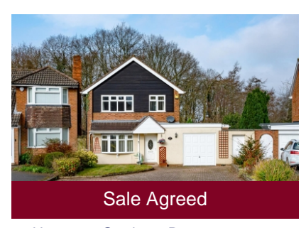
12 Hopstone Gardens, Penn, Wolverhampton