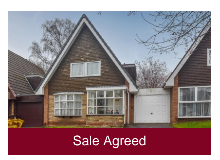
16 Surrey Drive, Finchfield, Wolverhampton