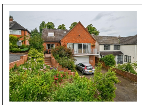
The Tyning, Westgate Drive, Bridgnorth