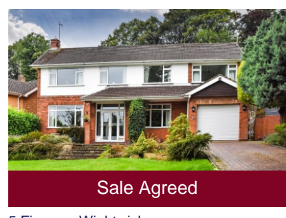
5 Firsway, Wightwick