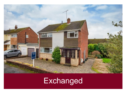
3 Newgate, Pattingham, Wolverhampton