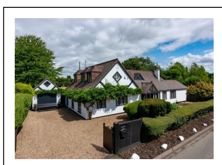
Pennygate, Paradise Lane, Slade Heath, Wolverhampton