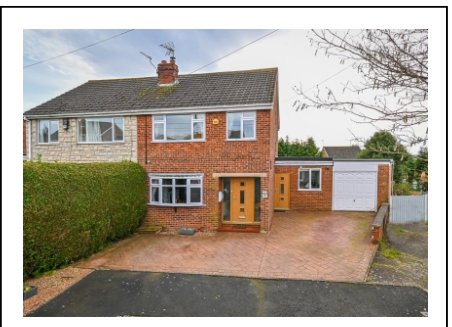
15 Crannmore Drive, Highley, Bridgnorth