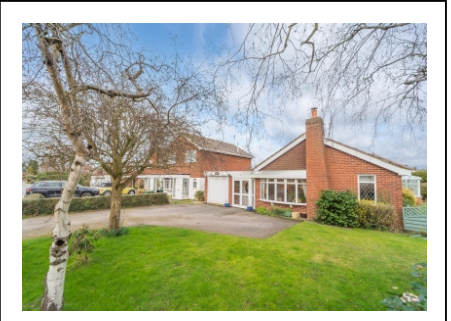
Madeira, 45 Keepers Lane, Codsall, Wolverhampton