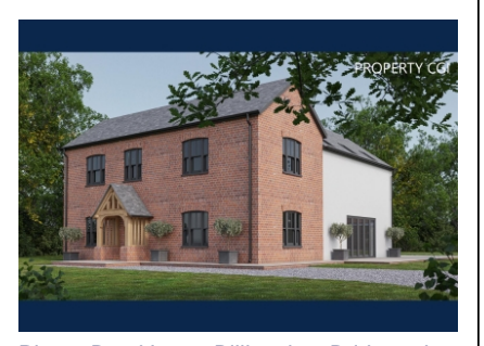
Plot 1, Bynd Lane, Billingsley, Bridgnorth