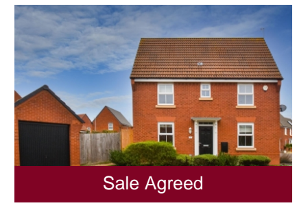
4 Lickey Close, Baggeridge Village, Dudley