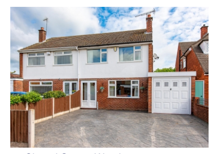
19 Chapel Street, Wombourne