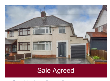
19 Sandringham Road, Penn, Wolverhampton