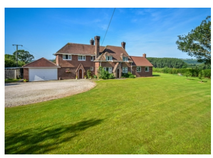
Footbridge House, Tasley, Bridgnorth