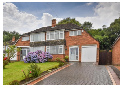
4 Chase View, Ettingshall Park, Wolverhampton