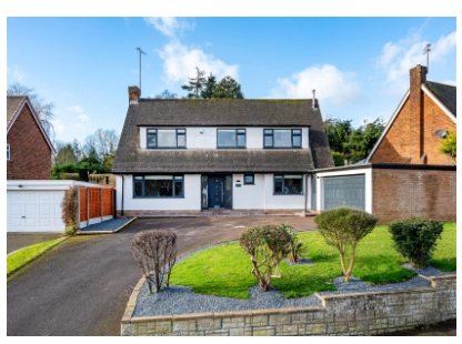
25 Perton Brook Vale, Wightwick