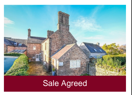
The Forge, 13 St. Marys Lane, Much Wenlock