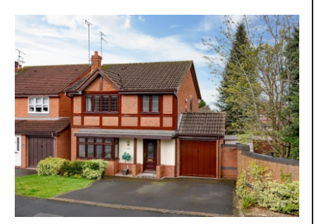
19 Penleigh Gardens, Wombourne, Wolverhampton