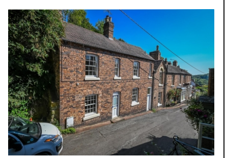
25 Church Hill, Ironbridge, Telford