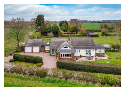
Holly Lodge, Church Lane, Boningale, Albrighton