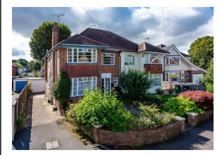
7 Newbridge Gardens, Newbridge, Wolverhampton