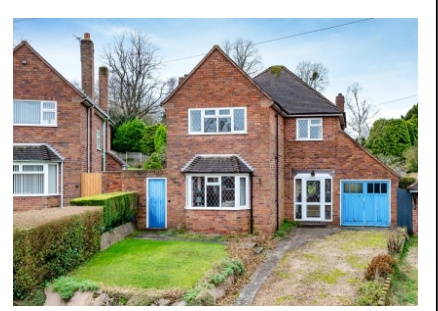
14 Peterdale Drive, Wolverhampton