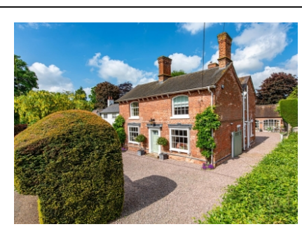
Beckbury House, Beckbury, Shifnal