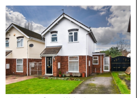
8 Laburnum Street, Wolverhampton