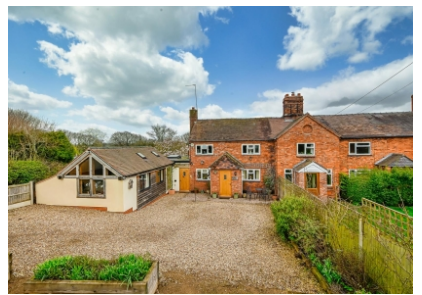
3 Tedstill Cottages, Middleton Scriven, Bridgnorth