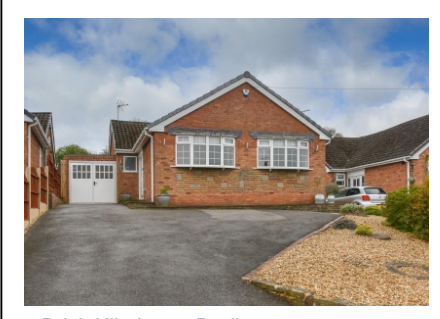
9 Brick Kiln Lane, Dudley