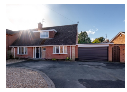
Strathmore, Shaw Lane, Albrighton