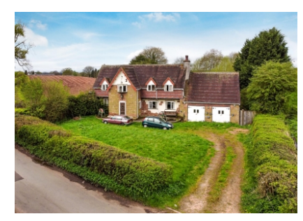
Mill Cottage, Lower Rudge, Pattingham, Wolverhampton