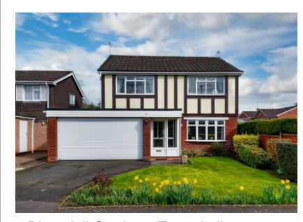
4 Rivendell Gardens, Tettenhall