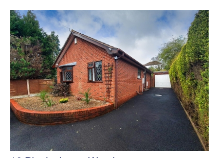
10 Planks Lane, Wombourne, Wolverhampton