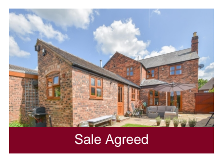
The Cottage, 18 Shop Lane, Oaken