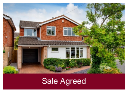
9 Windsor Road, Pattingham