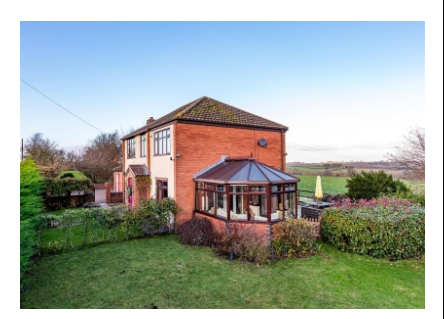
Longmoor House, Billingsley, Bridgnorth