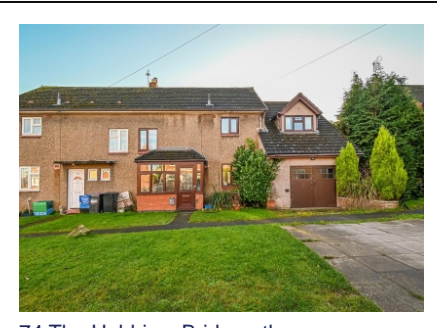
74 The Hobbins, Bridgnorth