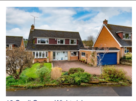
18 Quail Green, Wightwick, Wolverhampton