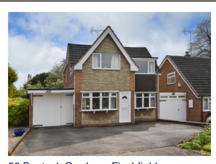
56 Bantock Gardens, Finchfield