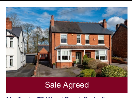
Medlicote, 79 Wood Road, Codsall