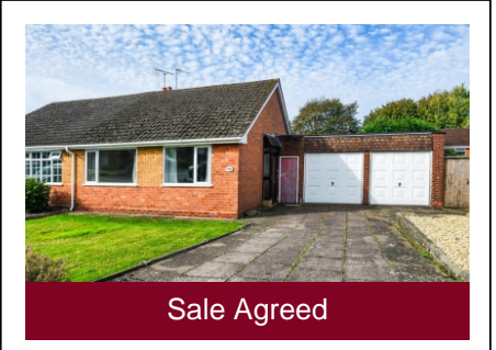
10 Gardeners Way, Wombourne, Wolverhampton