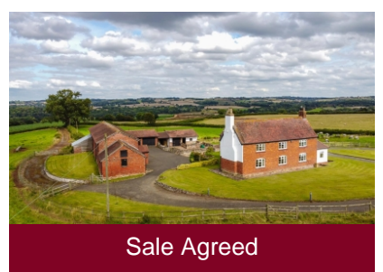
Lower Sutton Farm, Sutton, Chelmarsh, Bridgnorth