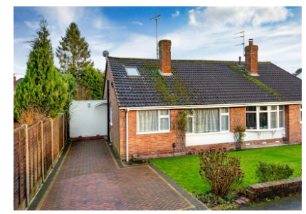
1 Norton Close, Penn, Wolverhampton