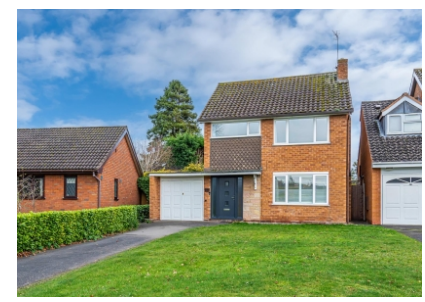
1 Redford Drive, Albrighton