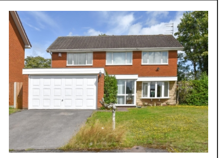
4 The Heathlands, Wombourne, Wolverhampton