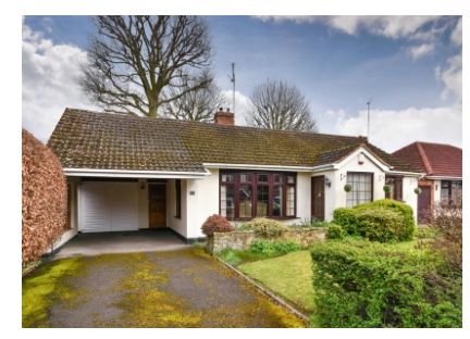
30 Sabrina Road, Wightwick, Wolverhampton