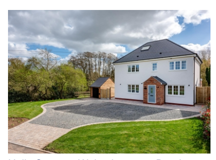
Holly Cottage, Wolverhampton Road, Pattingham