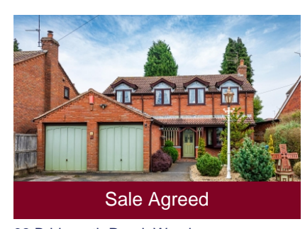
92 Bridgnorth Road, Wombourne, Wolverhampton