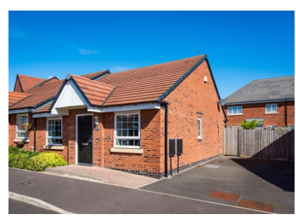
25 Brick Kiln Way, Baggeridge Village