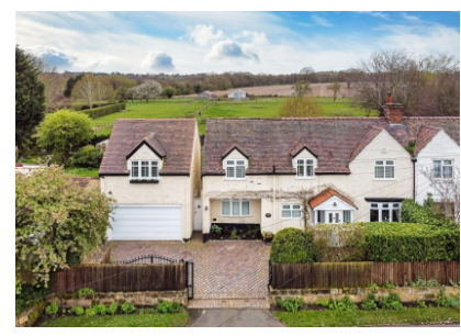
15 Birches Road, Codsall, Wolverhampton