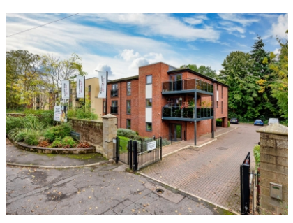
31 Thorneycroft, Wood Road, Tettenhall