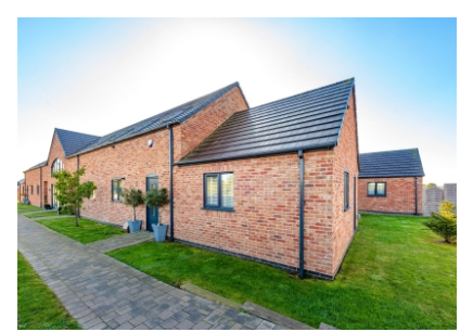
6 Lea Manor Gardens, Albrighton, Wolverhampton