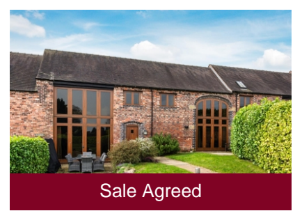
The Corn Barn, 3 East Trescott Barns Bridgnorth Road