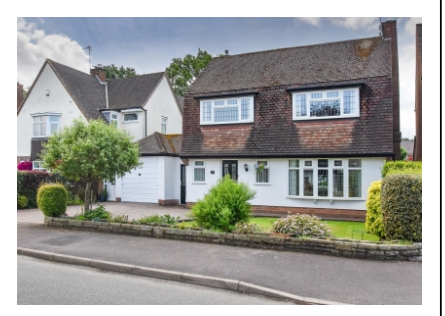
57 Oaken Park, Codsall, Wolverhampton