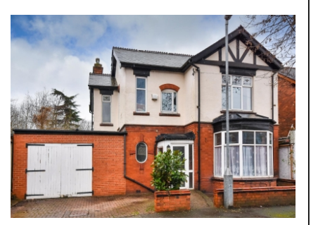
18 Elm Avenue, Bilston, Wolverhampton