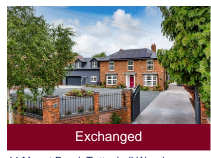
44 Mount Road, Tettenhall Wood