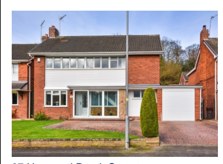
97 Henwood Road, Compton, Wolverhampton