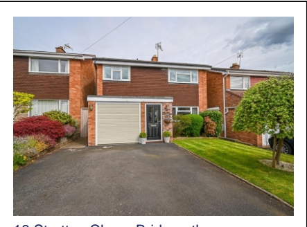
18 Stretton Close, Bridgnorth