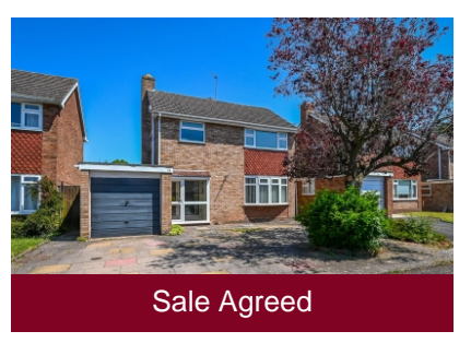
14 The Orchard, Albrighton, Wolverhampton