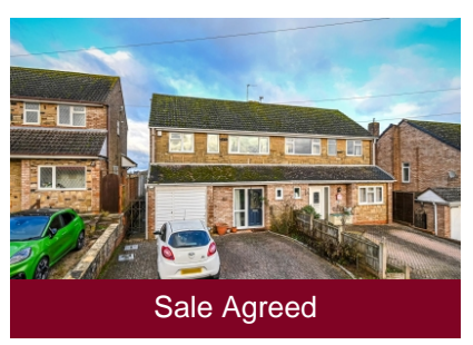
34 Honeybourne Road, Alveley, Bridgnorth