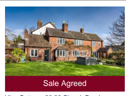
Vine Cottage, 36-38 Church Road, Codsall