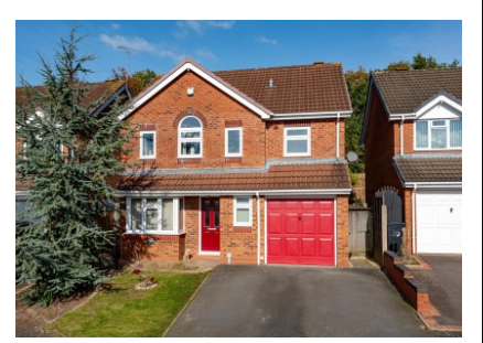
12 Dudmaston Way, Milking Bank, Dudley