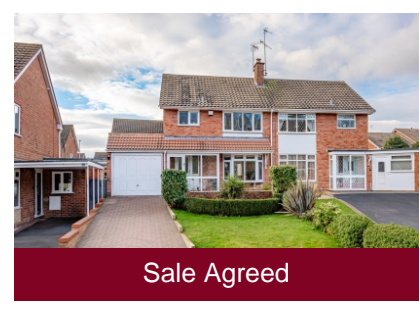
14 Chequers Avenue, Wombourne, Wolverhampton