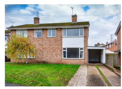
36 Wombourne Road, Swindon, Dudley