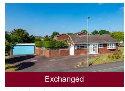
44 Woodcote Road, Wolverhampton