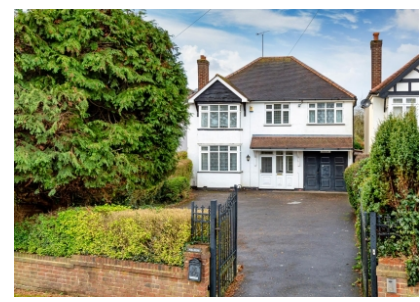
Maleesh, Stourbridge Road, Wombourne