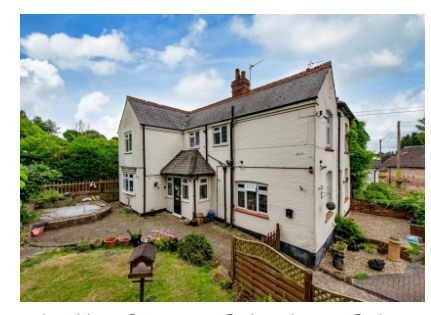
1 & 2 New Cottages, Oaken Lane, Oaken