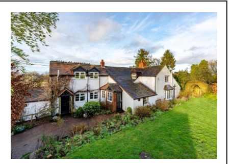
Greystoke Cottage, Kiddemore Green, Brewood