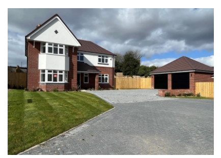
Rosewood House, 6 Rowan Grange, Broseley

Minimum price: £0 Maximum price: Unlimited Bedrooms: 0+