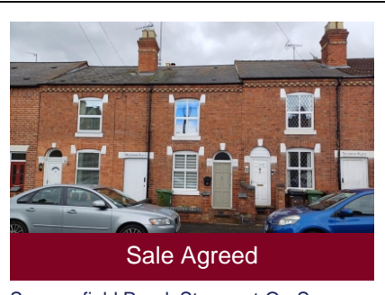
Summerfield Road, Stourport-On-Severn