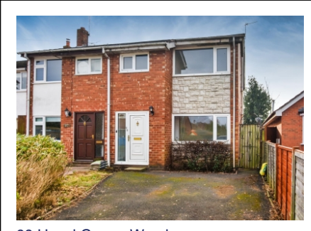
99 Hazel Grove, Wombourne, Wolverhampton