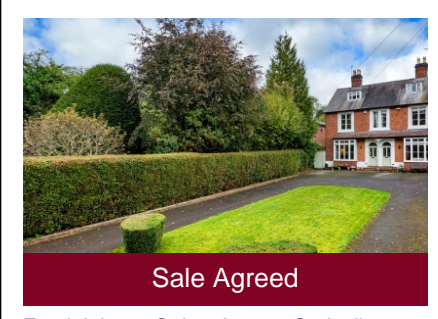
Fernleigh, 35 Oaken Lanes, Codsall