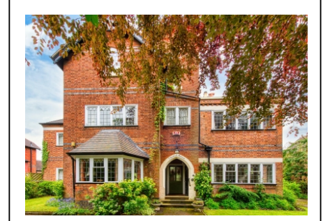
Cheviot House, 20 Stockwell Road, Tettenhall