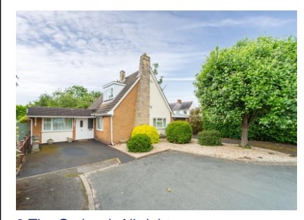
8 The Orchard, Albrighton