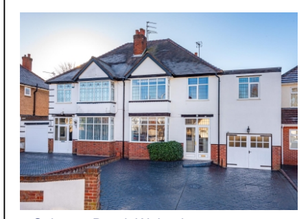
7 Osborne Road, Wolverhampton