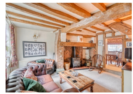
Bridgend Cottage, 43 Cartway, Bridgnorth