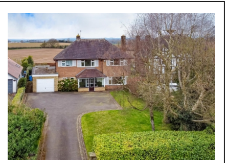
Grasmere, 5 Westbeech Road, Pattingham