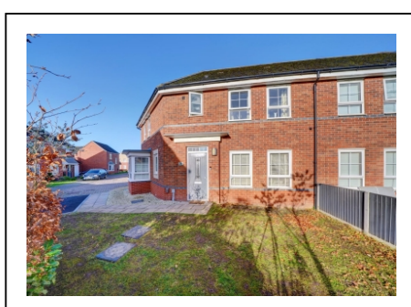
26 Rainsford Crescent, Kidderminster