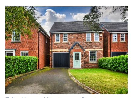
Eden House, Wombourne Road, Swindon, Dudley