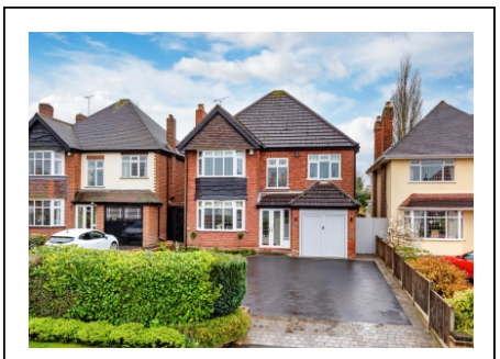
39 Meadow Road, Finchfield