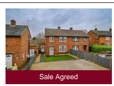
28 Lodge Lane, Bridgnorth