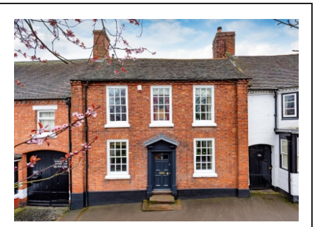
Saredon House, 28 Stafford Street, Brewood