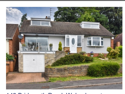
142 Bridgnorth Road, Wolverhampton