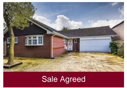
28a Mount Road, Mount Road, Tettenhall Wood