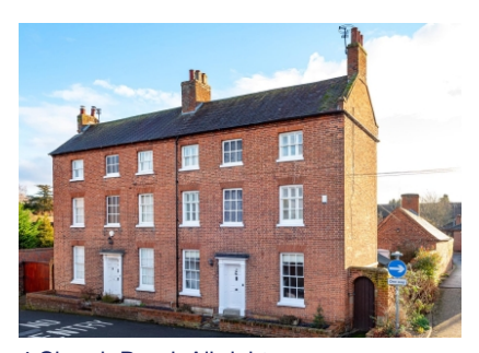
4 Church Road, Albrighton, Wolverhampton