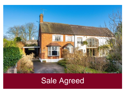
Newport House, 28 Newport Street, Brewood