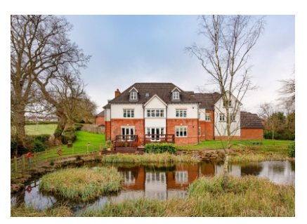
4 Albrighton House, The Water Gardens, Wolverhampton