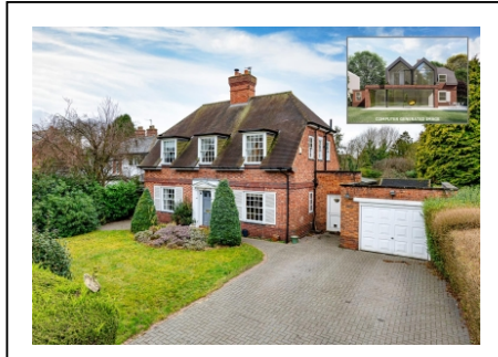
The Dormers, Finchfield Gardens, Finchfield