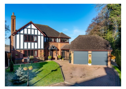
47 Fairfield Drive, Codsall, Wolverhampton