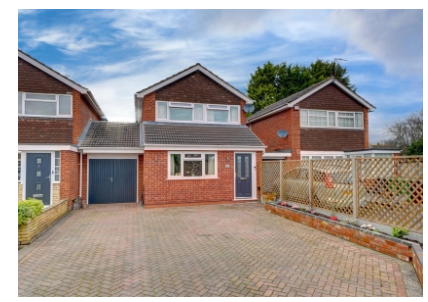
Elderberry Close, Stourport-On-Severn