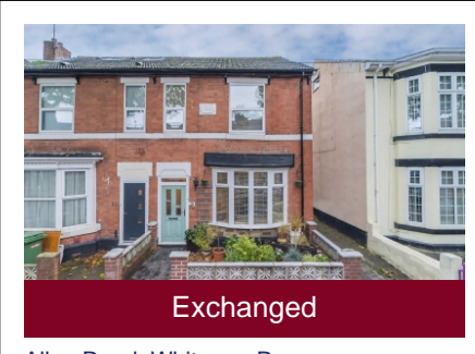
Allen Road, Whitmore Reans, Wolverhampton