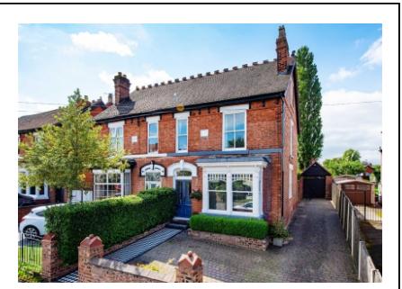
7 Richmond Road, Finchfield, Wolverhampton