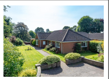
11 Compton Hill Drive, Compton, Wolverhampton