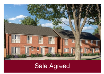
Plot 3 Nightingale Place, Vicarage Road, Wolverhampton