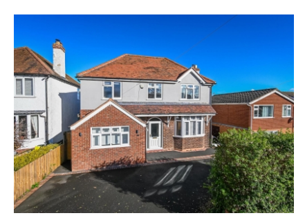
109 Victoria Road, Bridgnorth