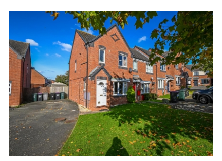
8 Ridley Close, Bridgnorth