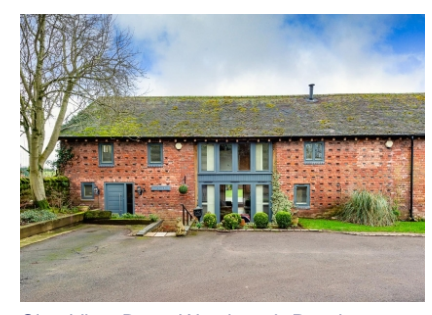
Clee View Barn, Westbeech Road, Pattingham, Wolverhampton