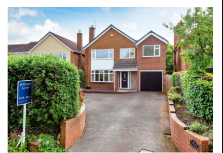
18 Rudge Road, Pattingham, Wolverhampton