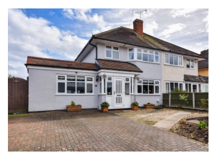
34 Delaware Avenue, Albrighton