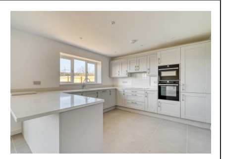
Green Acres, 3 Rowan Grange, Broseley