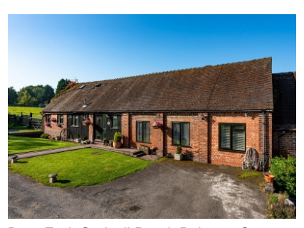
Barn End, Codsall Road, Palmers Cross, Wolverhampton