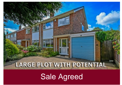
6 Moor Lane, Pattingham, Wolverhampton