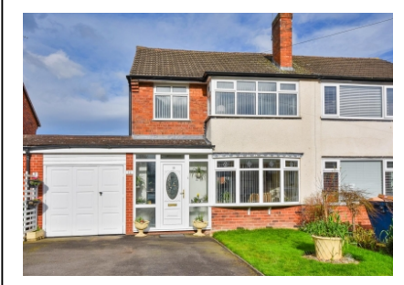
12 Oakfield Road, Codsall, Wolverhampton