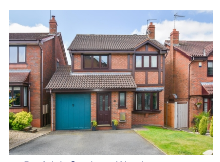
35 Penleigh Gardens, Wombourne, Wolverhampton