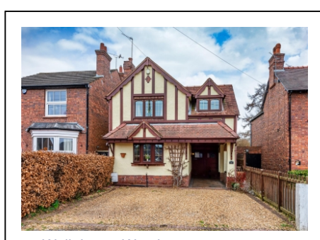
25 Walk Lane, Wombourne, Wolverhampton