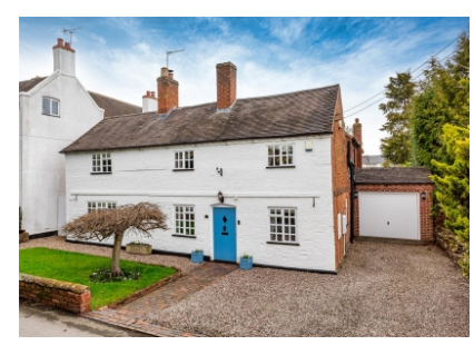
Garden Cottage, 4 Shop Lane, Brewood