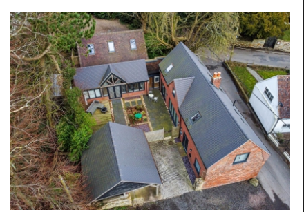
The Old Coach House, Little Wenlock, Telford