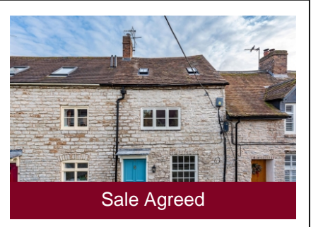
5a King Street, Much Wenlock, Shropshire