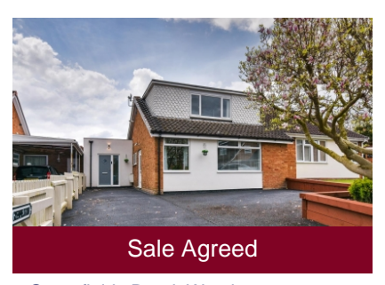
3 Greenfields Road, Wombourne, Wolverhampton