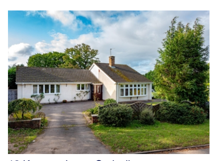
12 Keepers Lane, Codsall, Wolverhampton