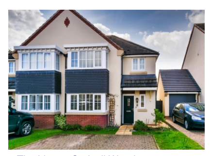
4 The Limes, Codsall Wood, Wolverhampton