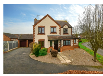
3 Danesbrook, Claverley, Wolverhampton