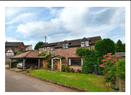
Finger Cottage, 123 Birds Green, Alveley, Bridgnorth