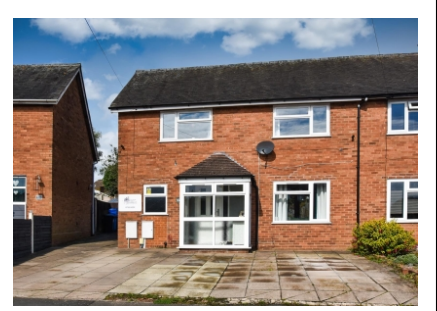
69 Oak Road, Brewood, Stafford