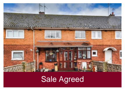
2 Woden Close, Wombourne, Wolverhampton