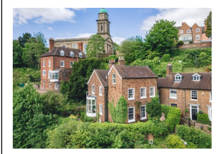
Castle Cliffe House, 24 St. Mary's Steps, Bridgnorth