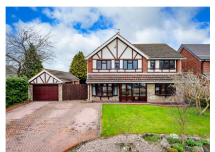
11 Waverley Gardens, Wombourne, Wolverhampton