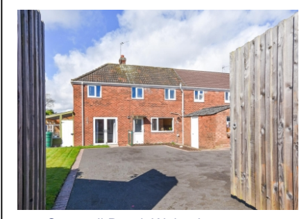
146 Cornwall Road, Wolverhampton