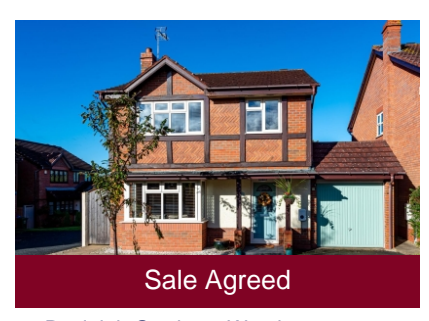
39 Penleigh Gardens, Wombourne, Wolverhampton