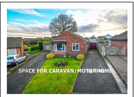
51 Linley View Drive, Bridgnorth