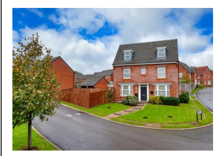
35 Chalmers Road, Baggeridge Village, Dudley