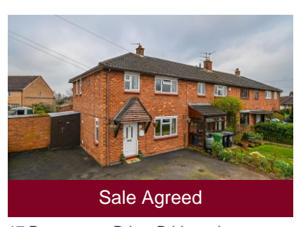
17 Racecourse Drive, Bridgnorth, Shropshire