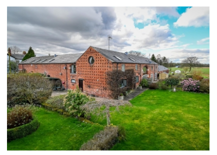
The Oak House, Oaklands Court, Lower Rudge, Pattingham