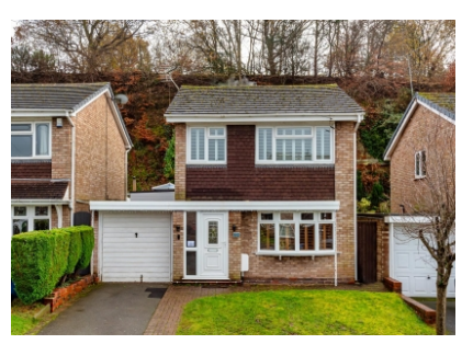
23 Redcliffe Drive, Wombourne, South Stafforshire