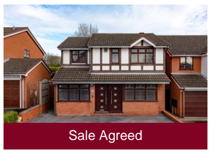
17 Fieldview Close, Coseley, Bilston