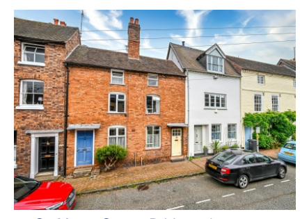
24 St. Marys Street, Bridgnorth