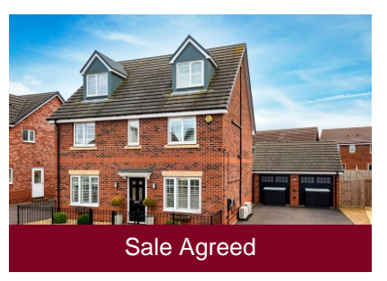
43 Farran Drive, Codsall, Wolverhampton