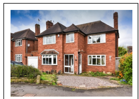
66 York Avenue, Finchfield, Wolverhampton