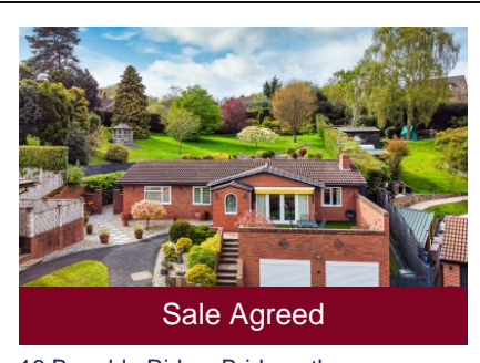
18 Bramble Ridge, Bridgnorth