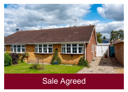
68 Clee View Road, Wombourne, Wolverhampton