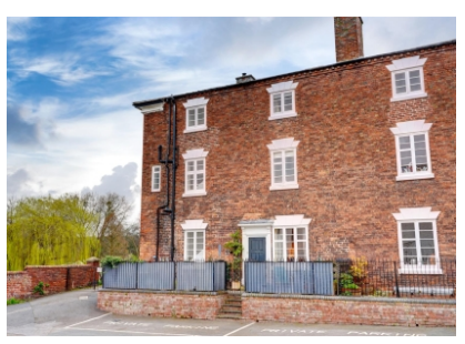
Severn Side, Stourport-On-Severn