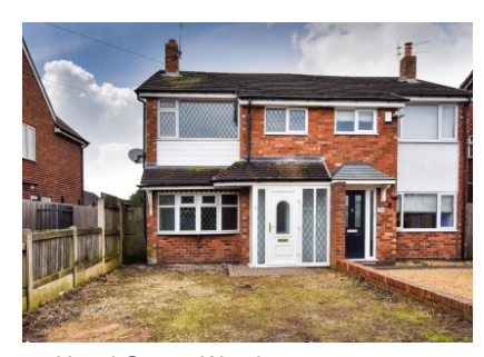
93 Hazel Grove, Wombourne, Wolverhampton