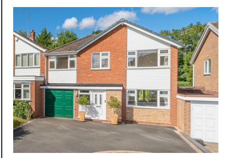
2 Whiteladies Court, Albrighton, Wolverhampton