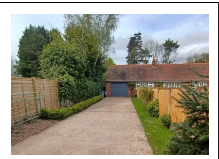
The Bungalow, Popes Lane, Wergs , Tettenhall