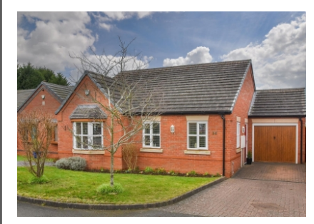
14 Berkeley Close, Perton, Wolverhampton