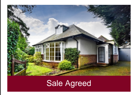
The Grey Cottage 19 Clifton Road, Wolverhampton