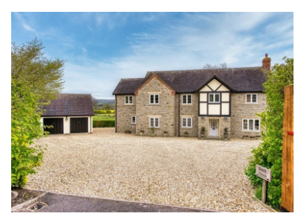
Beech House, Munslow, Shropshire