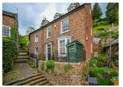
19 St. Marys Steps, Bridgnorth