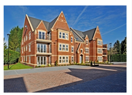
5 Ellen Place, Henry Fowler Drive, Tettenhall