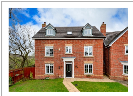
Oaklands, Wombourne, Wolverhampton