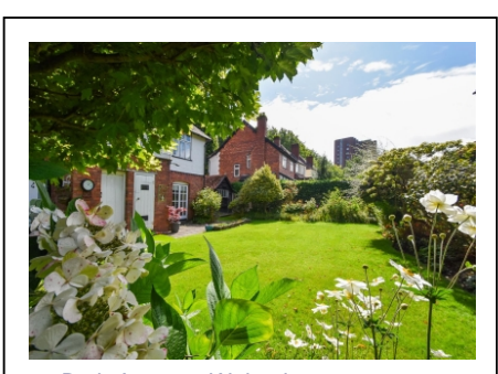
29 Bath Avenue, Wolverhampton