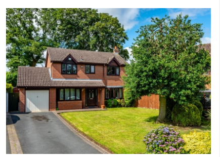
South View Close, Codsall, Wolverhampton