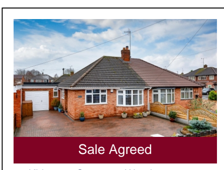
13 Kirkstone Crescent, Wombourne, Wolverhampton