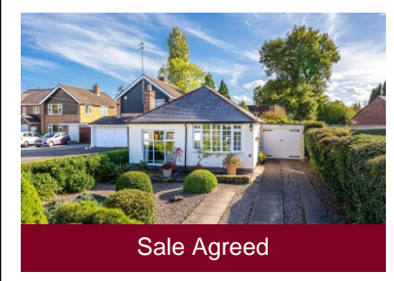
91 Suckling Green Lane, Codsall, Wolverhampton