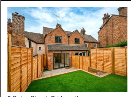
6 Salop Street, Bridgnorth