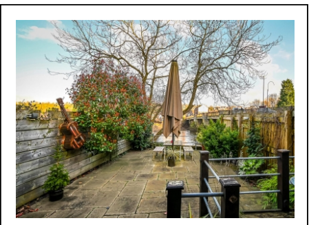
45 Cartway, Bridgnorth