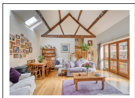
Tedstill Barn, Glazeley, Bridgnorth