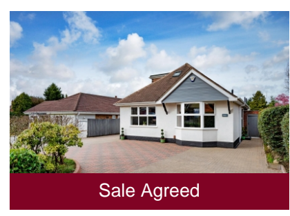
28a Wood Road, Tettenhall Wood