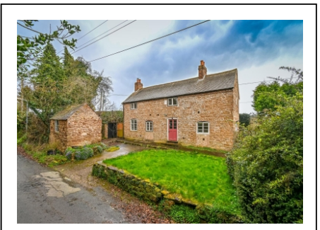
148 Broad Oak, Six Ashes