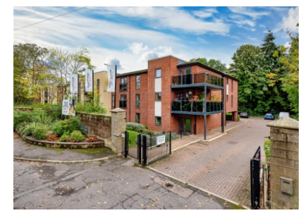
18 Thorneycroft, Wood Road, Tettenhall