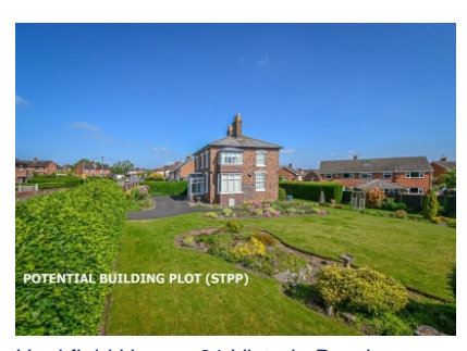
Hookfield House, 81 Victoria Road, Bridgnorth