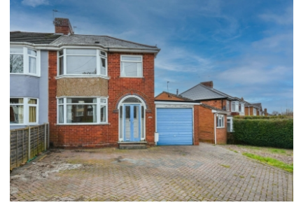
1 Rutland Avenue, Wolverhampton