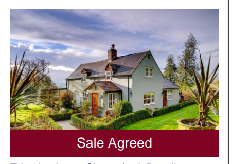
Trimpley Lane, Shatterford, Bewdley