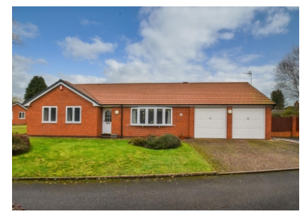
1 The Courts, Albrighton, Wolverhampton