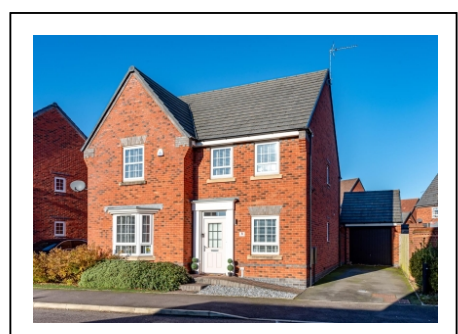
8 Brick Kiln Way, Baggeridge Village