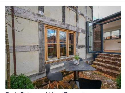
Park Cottage, Abbey Foregate, Shrewsbury