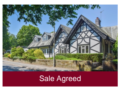
Woodhouse Lodge, Wood Road, Tettenhall Wood