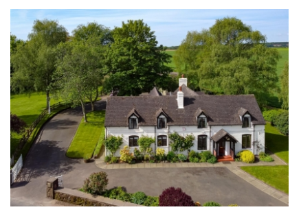
The Little Green, 2 Feiashill Road, Trysull, Wolverhampton