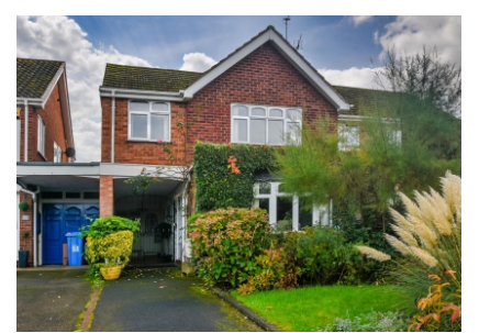
86 Van Diemans Road, Wombourne, Wolverhampton