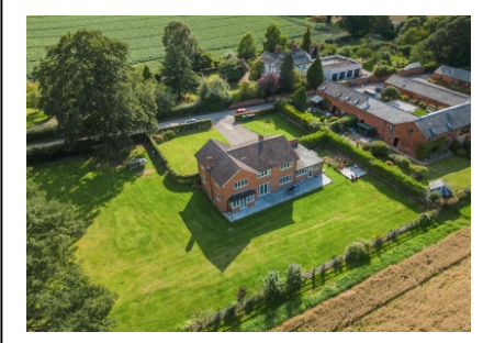
Oaklands Farm, Lower Rudge, Pattingham, Wolverhampton