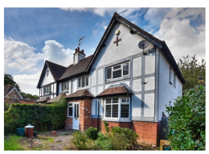
2 Danescourt Cottages, Danescourt Road, Tettenhall