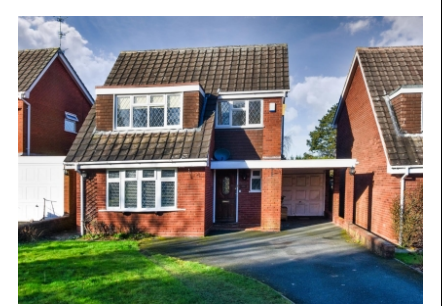
15 Histons Drive, Codsall, Wolverhampton