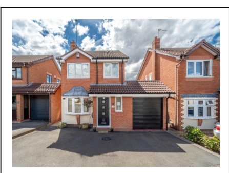
23 Penleigh Gardens, Wombourne