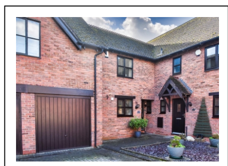
17 Bridgeman Court, Weston-Under-Lizard, Shifnal