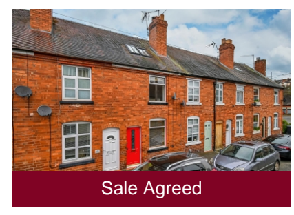
46 Severn Street, Bridgnorth