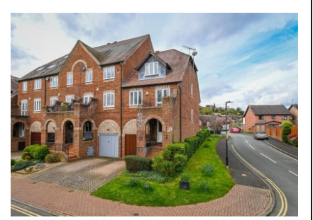
36 Southwell Riverside, Bridgnorth