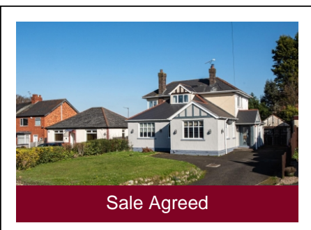
153 Trysull Road, Merry Hill, Wolverhampton