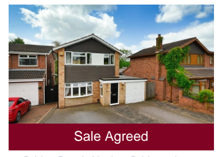
36 Bridge Road, Alveley, Bridgnorth