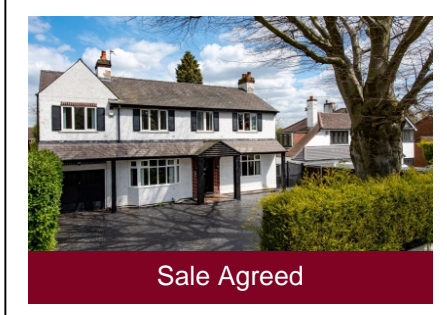
94 Codsall Road, Tettenhall, Wolverhampton