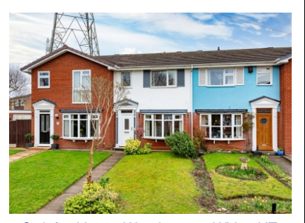
3 Swinford Leys, Wombourne, WV5 8HT