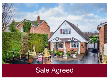
5 Bratch Common Road, Wombourne, Wolverhampton