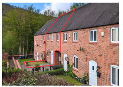
6 The Courtyard, Ironbridge, Telford