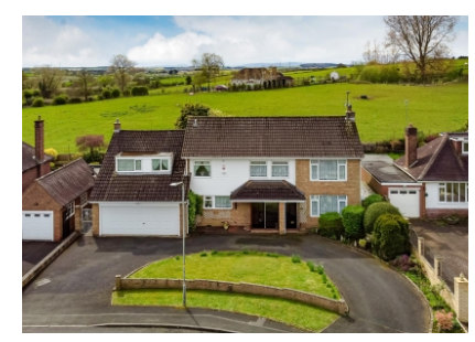
7 Wightwick Hall Road, Wightwick, WV6 8BZ