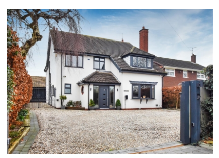
Clearview, Straight Mile, Calf Heath, Wolverhampton