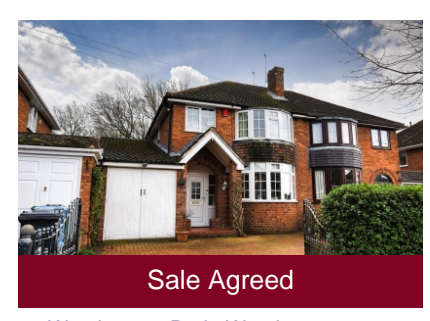
52 Wombourne Park, Wombourne, Wolverhampton