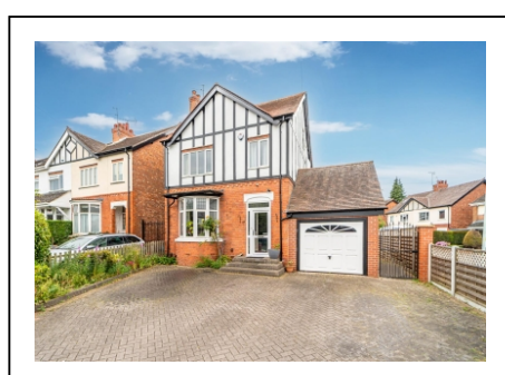
Tregunna, 27 Richmond Road, Finchfield