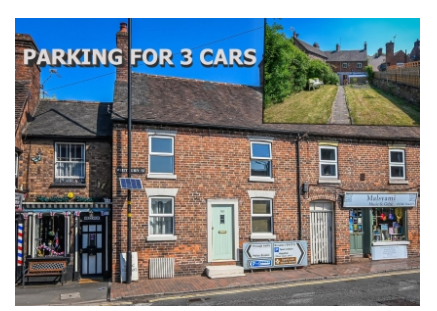
50 Whitburn Street, Bridgnorth