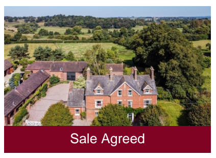
Roughton Farmhouse, Roughton, Bridgnorth