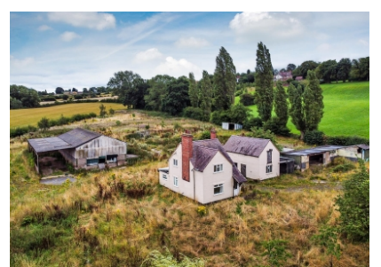
Robins Nest Farm, Dirty Foot Lane, Lower Penn, Wolverhampton