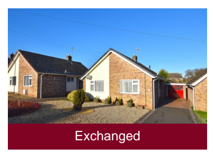
11 Greenleys Crescent, Alveley, Bridgnorth