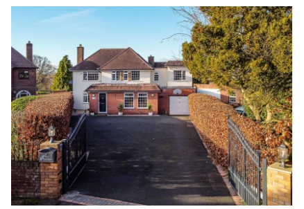
Fern House, Links Avenue, Tettenhall