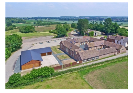
Saxon Meadow Cottage 5, The Wyke, Shifnal