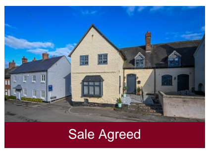
7 Bull Ring, Claverley, Wolverhampton