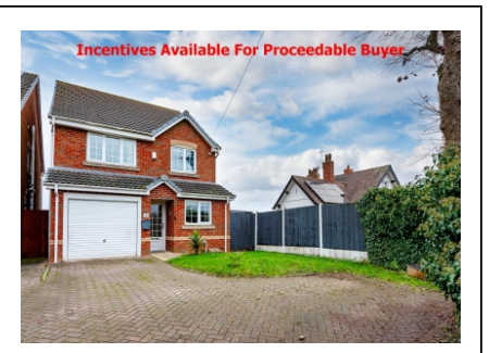
151 Tipton Road, Woodsetton, Dudley