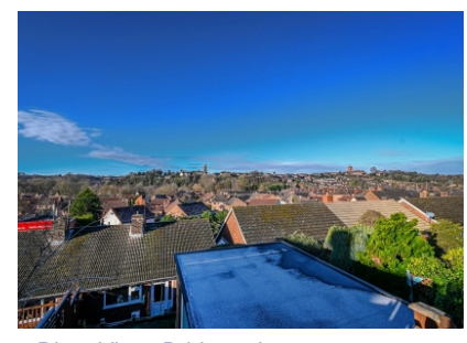
5 River View, Bridgnorth