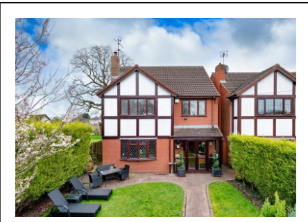
Waterford, Ball Lane, Coven Heath, Wolverhampton