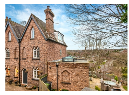
14 West Castle Street, Bridgnorth