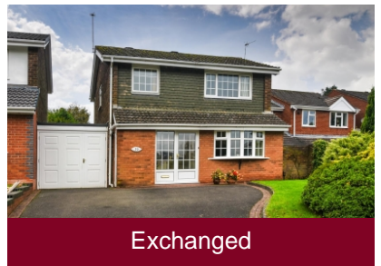
39 Bantock Gardens, Finchfield, Wolverhampton