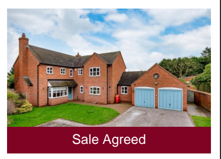
Rivendell, Park Lane, Lapley, Stafford