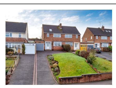
44 Common Road, Wombourne, Wolverhampton