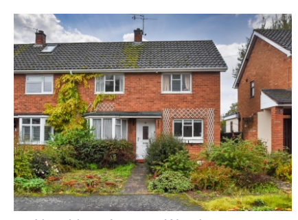
10 Neachless Avenue, Wombourne, Wolverhampton