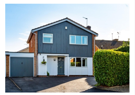
4 Beech Close, Pattingham, Wolverhampton