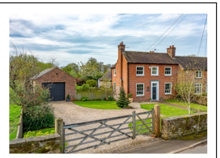
The Little House, 7 Tong Norton, Shifnal