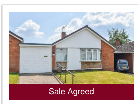
13 The Broadway, Wombourne, Wolverhampton