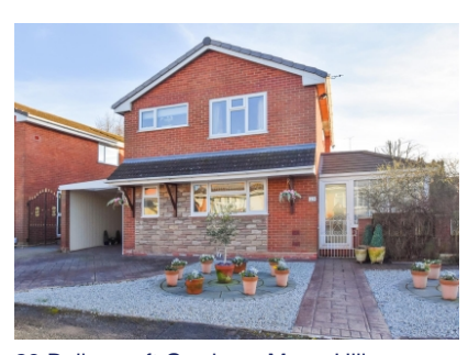
23 Bellencroft Gardens, Merry Hill, Wolverhampton