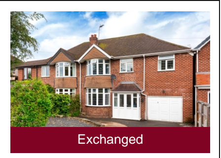
14 Bratch Lane, Wombourne, Wolverhampton