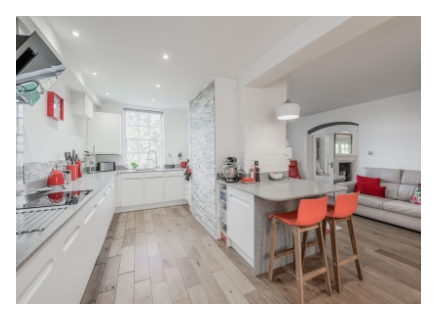
4 Stanmore Mews, Stourbridge Road, Stanmore, Bridgnorth