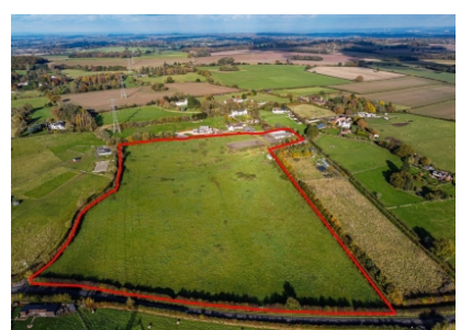
Plot of Land at Former Mill Riding Centre, Warstone Hill Road, Pattingham