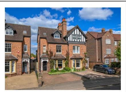
2 Westgate Villas, Salop Street, Bridgnorth