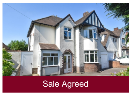
490 Penn Road, Wolverhampton