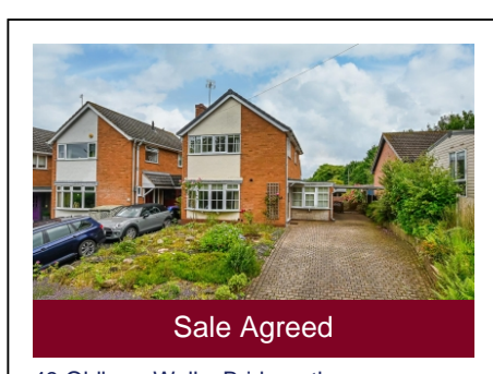
49 Oldbury Wells, Bridgnorth