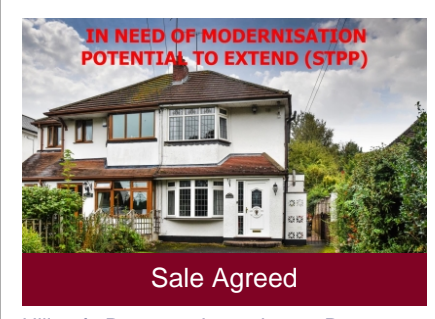
Hillcroft, Penstone Lane, Lower Penn