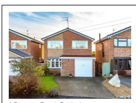
3 Braemar Road, Pattingham, Wolverhampton