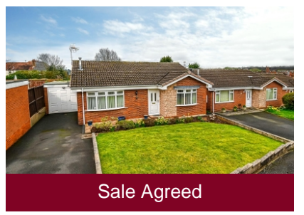
7 Claremont Drive, Bridgnorth