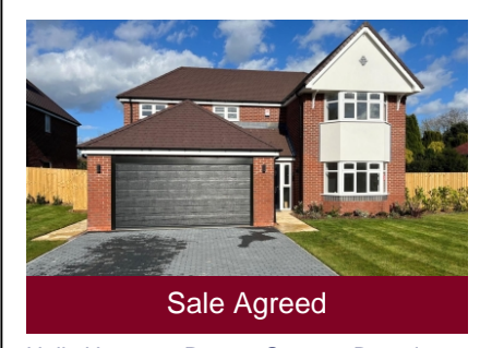
Holly House, 8 Rowan Grange, Broseley