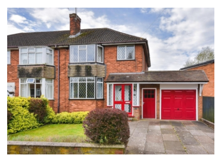
Wombourne Park, Wombourne