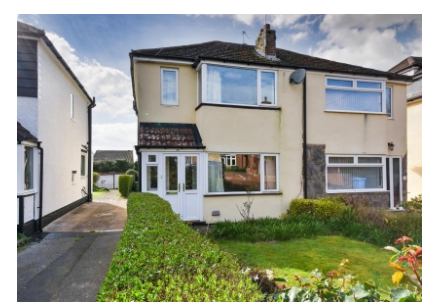
36 Hall End Lane, Pattingham, Wolverhampton