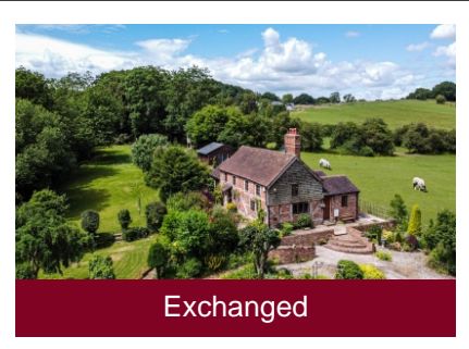
Beggar Hill House, 62 Muckley Cross, Acton Round, Bridgnorth