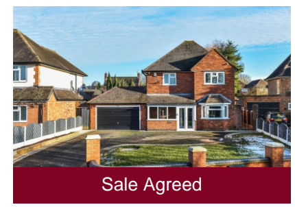
75 Yew Tree Lane, Tettenhall