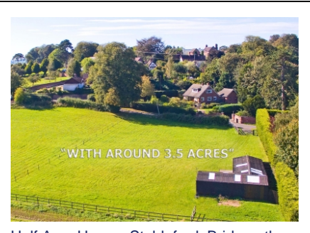
Half Acre House, Stableford, Bridgnorth