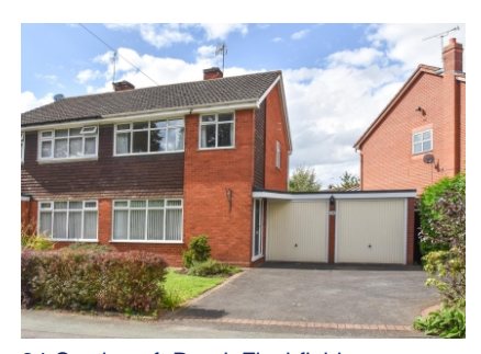
34 Castlecroft Road, Finchfield, Wolverhampton