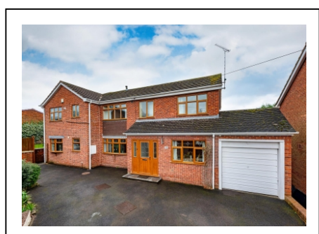
15 Ounsdale Crescent, Wombourne, Wolverhampton