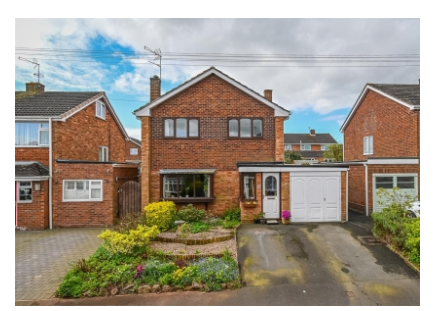
4 Whitmore Close, Bridgnorth