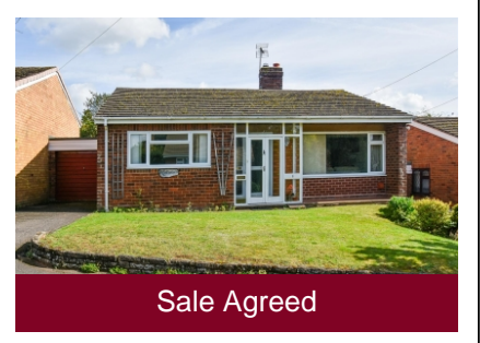
Foxcroft, 8 Fox Close, Seisdon