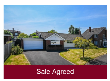
50 The Wold, Claverley, Shropshire