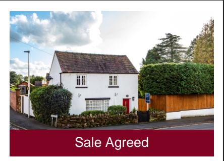
Station Cottage, 58 Station Road, Albrighton