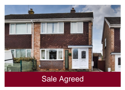
61 Wynchcombe Avenue, Penn, Wolverhampton