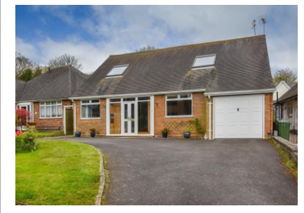
38 Foley Avenue, Tettenhall, Wolverhampton