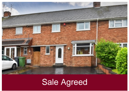
63 Pool Hall Road, Castlecroft, Wolverhampton