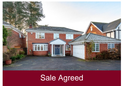
2 Greenhill Court, Wombourne, Wolverhampton