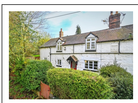
146 Broad Oak, Six Ashes