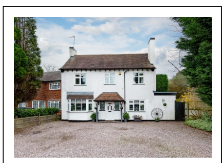
17 Stubbs Road, Wolverhampton