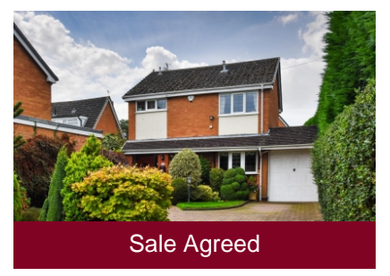
39 High Street, Pattingham, Wolverhampton