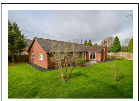
The Old Kiln, Church Lane, Bridgnorth