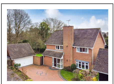
5 Mayswood Drive, Wightwick