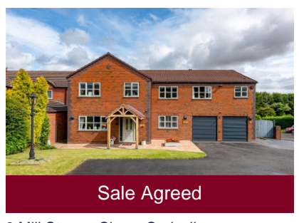
3 Mill Stream Close, Codsall, Wolverhampton