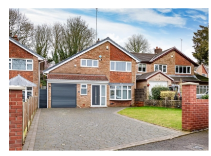
3 St. Marys Close, Dudley