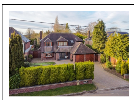
Broad Elms, Great Moor Road, Pattingham