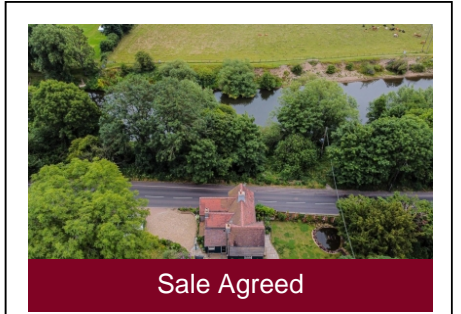
Holme Cottage, Knowle Sands, Bridgnorth