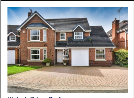
Kinloch Drive, Dudley