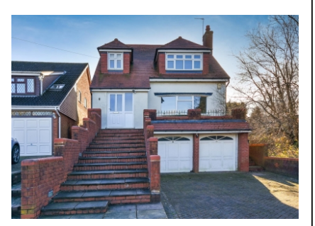
25 Bognop Road, Essington, Wolverhampton