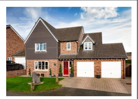
41 Kings Road, Calf Heath, Wolverhampton