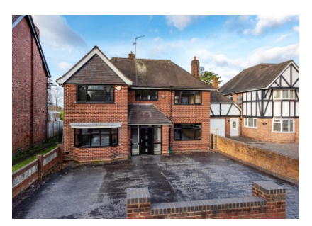
288b Penn Road, Wolverhampton