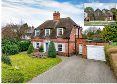
The Dormers, Finchfield Gardens, Finchfield