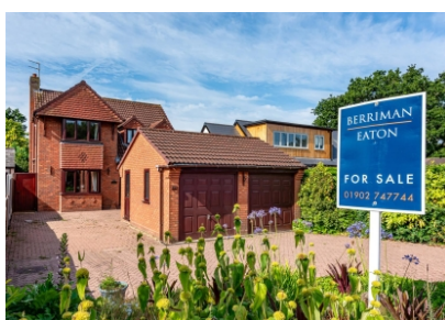
Bridgeside, 187 Birches Road, Codsall