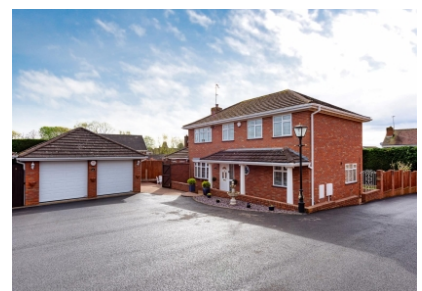
St. Johns Close, Swindon, Dudley