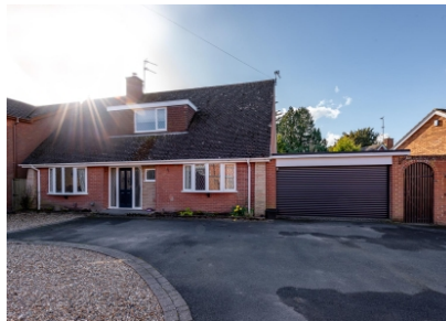
Strathmore, Shaw Lane, Albrighton