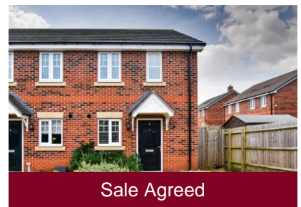
4 Leveson Crescent, Codsall, Wolverhampton