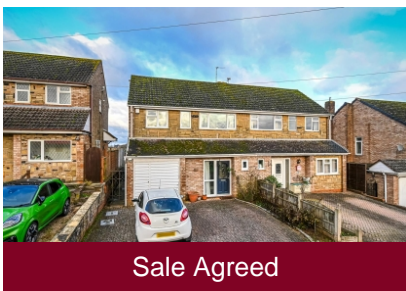
34 Honeybourne Road, Alveley, Bridgnorth