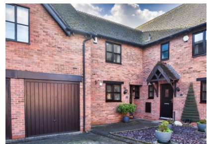
17 Bridgeman Court, Weston-Under- Lizard, Shifnal