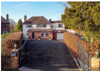
Fern House, Links Avenue, Tettenhall