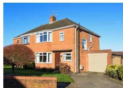
9 Windmill Grove, Kingswinford