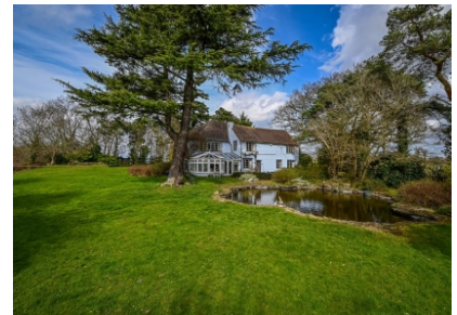
Horseshoes, Netherton, Highley, Bridgnorth