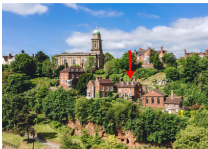
19 St. Marys Steps, Bridgnorth