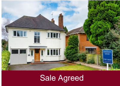
Randolph House, 55 Woodthorne Road, Wolverhampton