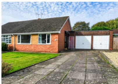
10 Gardeners Way, Wombourne, Wolverhampton