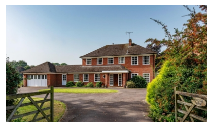
Meadow Farm, Post Office Road, Seisdon, Wolverhampton