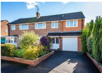
36 Delaware Avenue, Albrighton, Wolverhampton