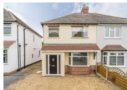
141 Pinfold Lane, Penn, Wolverhampton