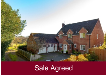
Keepers End, Hawthorne Drive, Wheaton Aston