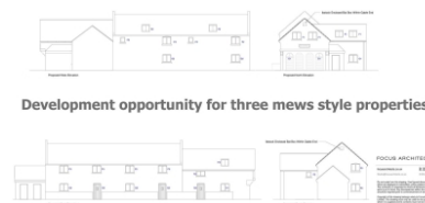
14 Station Road, Albrighton, Wolverhampton