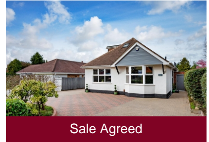
28a Wood Road, Tettenhall Wood