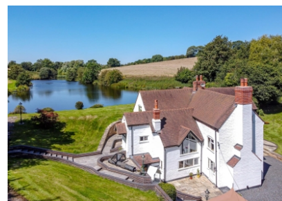
Hem Mill, The Hem, Shifnal