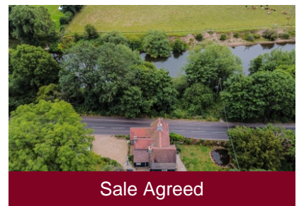
Holme Cottage, Knowle Sands, Bridgnorth