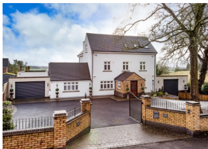
Penn Moor, Vicarage Road, Penn, Wolverhampton