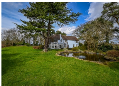
Horseshoes, Netherton, Highley, Bridgnorth