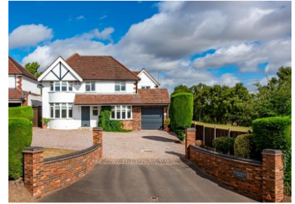
Hearthcote House, Poolhouse Road, Wombourne