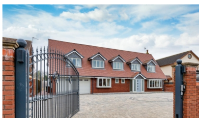
Alpine Cottage, 11 Kings Road, Calf Heath