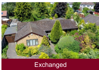
Hazelwood Close, Kidderminster