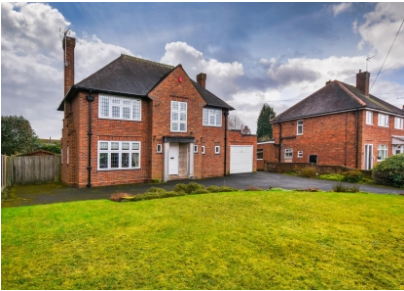
61 Brickbridge Lane, Wombourne, Wolverhampton