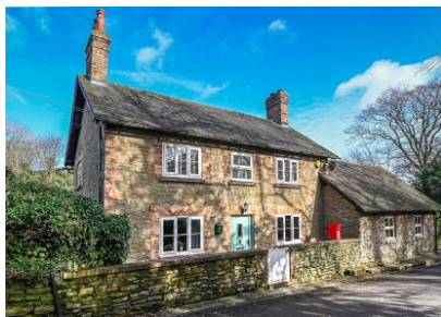
Brookside, Brockton, Much Wenlock