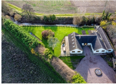
Riverside Bungalow, Muckley Cross, Acton Round, Bridgnorth