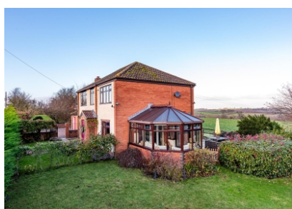
Longmoor House, Billingsley, Bridgnorth