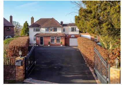
Fern House, Links Avenue, Tettenhall