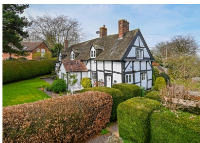
Clovers, Stableford, Bridgnorth