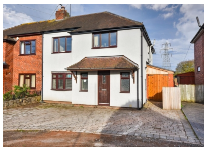
44 Market Lane, Lower Penn, Wolverhampton