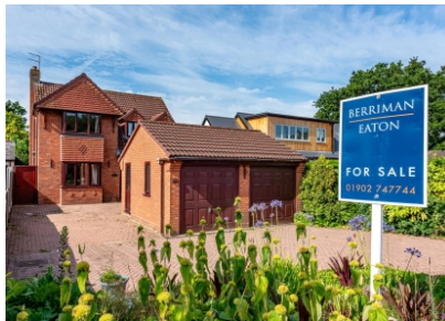
Bridgeside, 187 Birches Road, Codsall