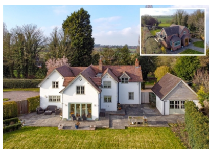
Oaklea and The Cottage, Damson Lane, Weston Heath, Shifnal