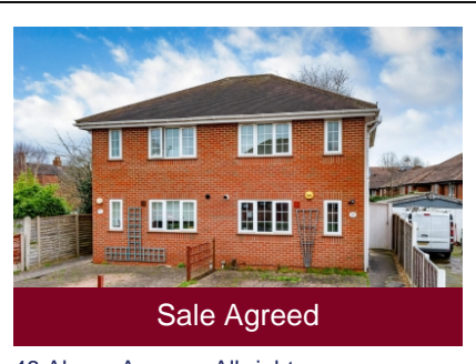
48 Abney Avenue, Albrighton