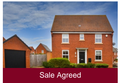
4 Lickey Close, Baggeridge Village, Dudley