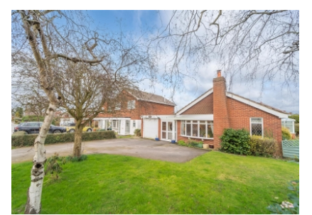
Madeira, 45 Keepers Lane, Codsall, Wolverhampton