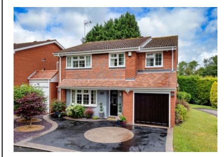
2 Brompton Lawns, Tettenhall Wood, Wolverhampton