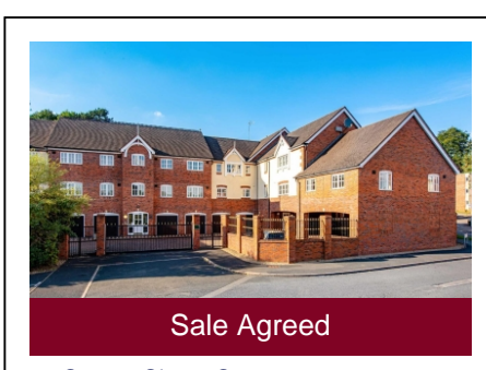
11 Cygnet Close, Compton, Wolverhampton