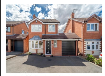
23 Penleigh Gardens, Wombourne