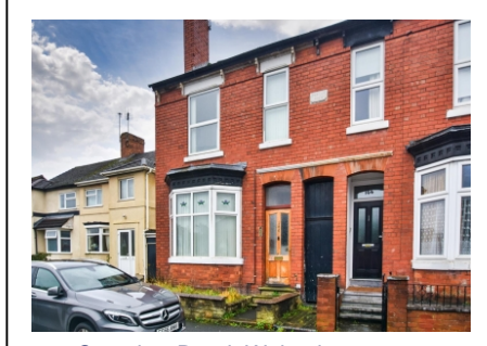
166 Crowther Road, Wolverhampton