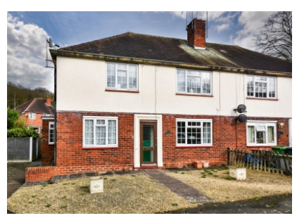
73 Meadow Lane, Wombourne, Wolverhampton