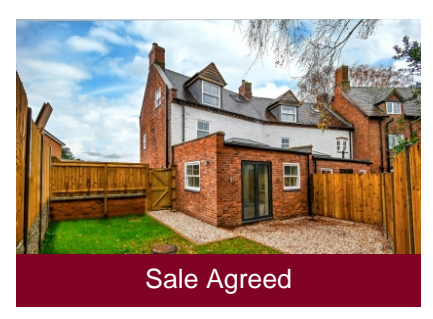
4 Rudge Road, Pattingham, Wolverhampton