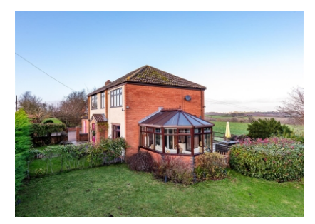
Longmoor House, Billingsley, Bridgnorth