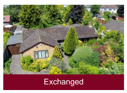
Hazelwood Close, Kidderminster