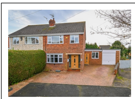
15 Crannmore Drive, Highley, Bridgnorth