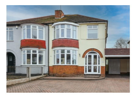
53 Woodland Road, Merry Hill, Wolverhampton