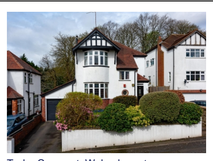
Tudor Crescent, Wolverhampton