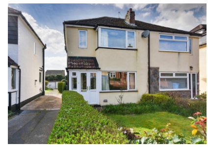
36 Hall End Lane, Pattingham, Wolverhampton