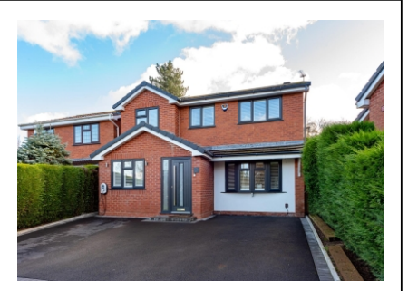
41 Ascot Drive, Dudley