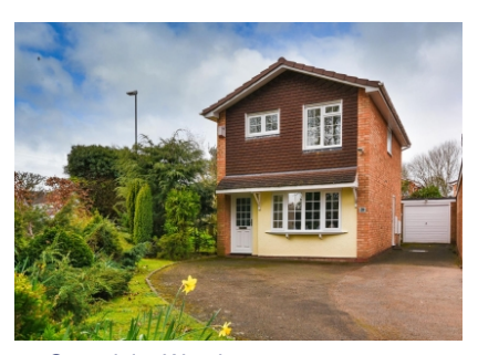
28 Quendale, Wombourne, Wolverhampton