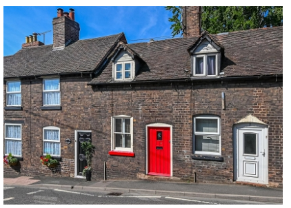
4 Pound Street, Bridgnorth