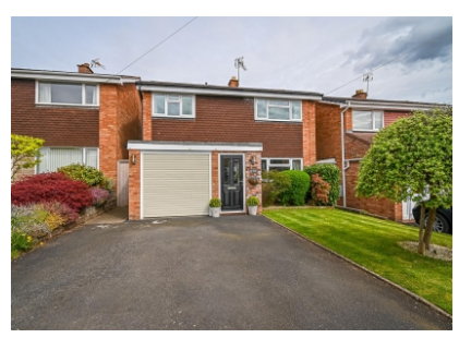
18 Stretton Close, Bridgnorth