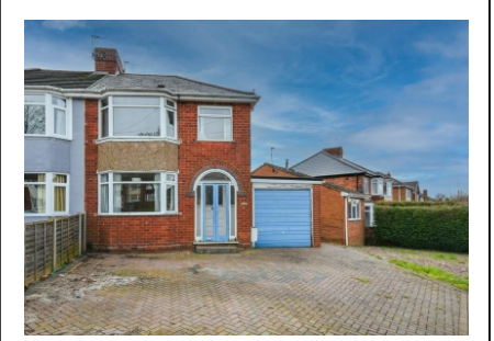
1 Rutland Avenue, Wolverhampton