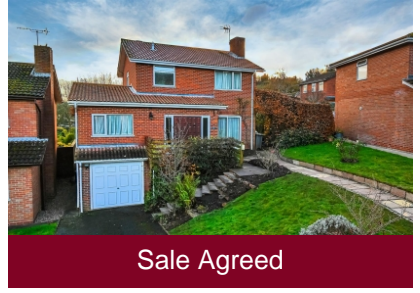
15 Bramble Ridge, Bridgnorth