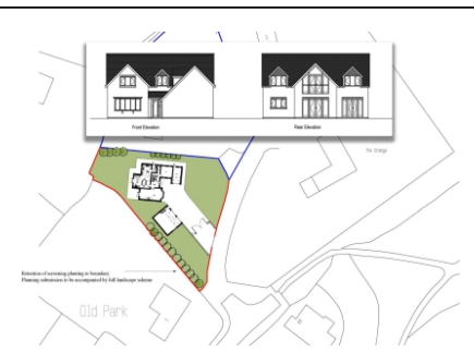
Land on the South of 2 Old Coppice Grange, Old Park, Telford