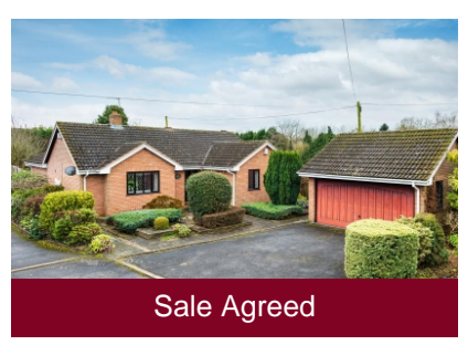
Shadowbrook, 4 Manor Fold, Middle Lane, Oaken