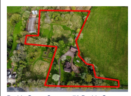
Dodds Green Cottage, 79 Dodds Green, Alveley, Bridgnorth