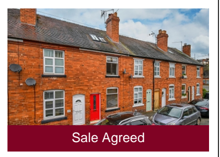
46 Severn Street, Bridgnorth