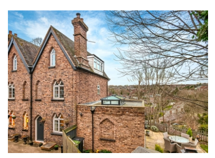
14 West Castle Street, Bridgnorth