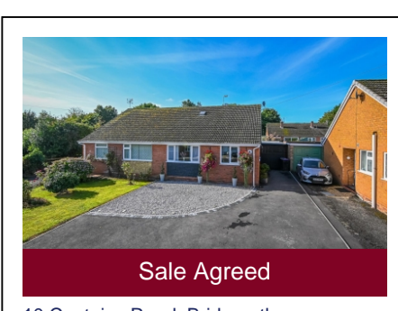
10 Captains Road, Bridgnorth