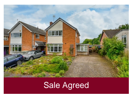
49 Oldbury Wells, Bridgnorth