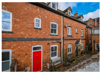
22a High Street, Bridgnorth