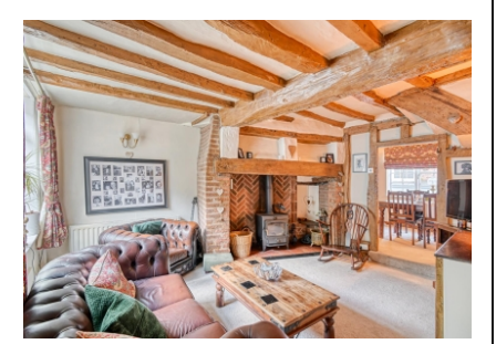
Bridgend Cottage, 43 Cartway, Bridgnorth