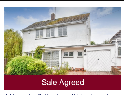
4 Newgate, Pattingham, Wolverhampton