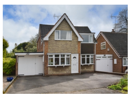
56 Bantock Gardens, Finchfield