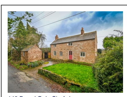
148 Broad Oak, Six Ashes