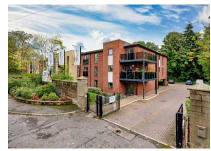
55 Thorneycroft, Wood Road, Tettenhall