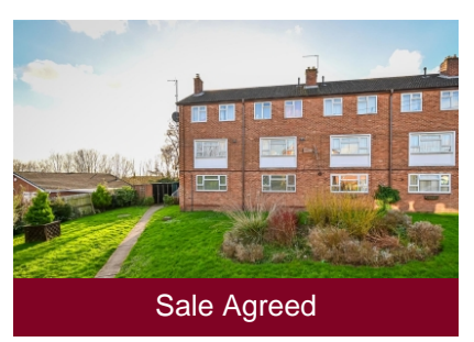
47 Tasley Close, Bridgnorth