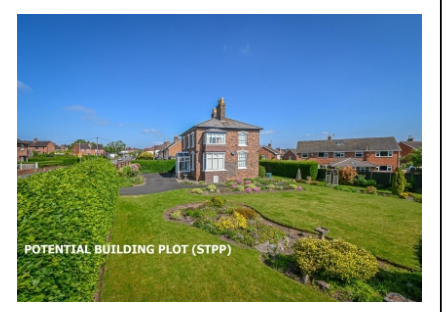
Hookfield House, 81 Victoria Road, Bridgnorth