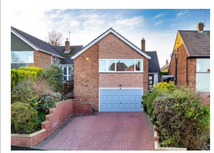
52 Church Hill, Penn, Wolverhampton