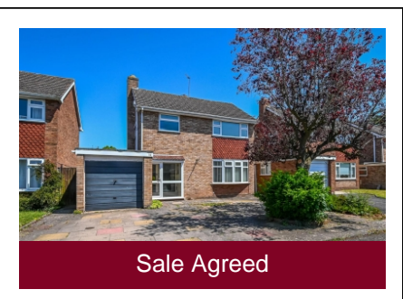
14 The Orchard, Albrighton, Wolverhampton