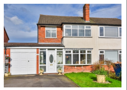
12 Oakfield Road, Codsall, Wolverhampton