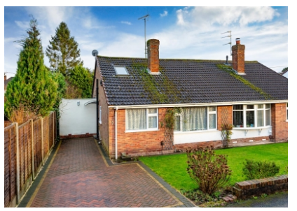
1 Norton Close, Penn, Wolverhampton