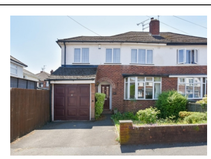
57 York Road, Wolverhampton