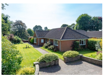
11 Compton Hill Drive, Compton, Wolverhampton