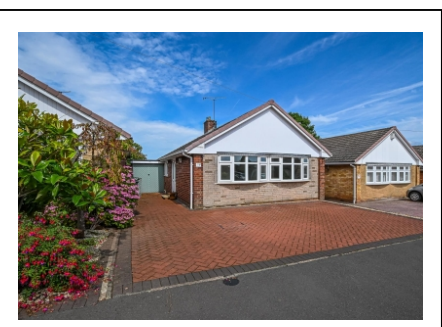
7 Princess Drive, Bridgnorth