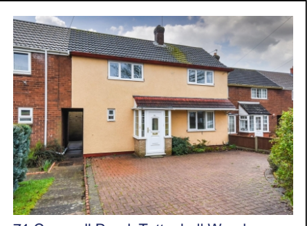
71 Cornwall Road, Tettenhall Wood