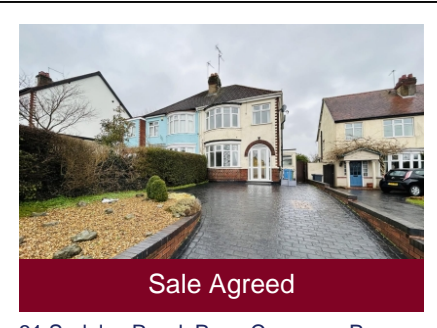
31 Sedgley Road, Penn Common, Penn