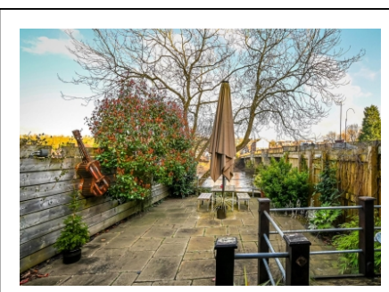
45 Cartway, Bridgnorth