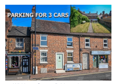
50 Whitburn Street, Bridgnorth