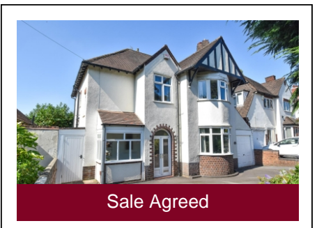
490 Penn Road, Wolverhampton