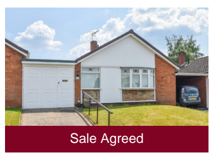
13 The Broadway, Wombourne, Wolverhampton