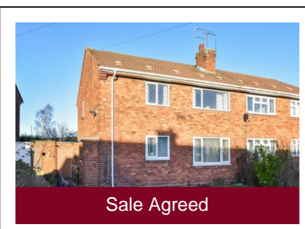
10a Hylstone Crescent, Wolverhampton