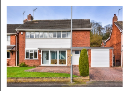
97 Henwood Road, Compton, Wolverhampton