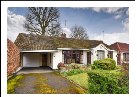
30 Sabrina Road, Wightwick, Wolverhampton