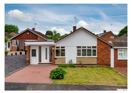
4 Mayfair Close, Albrighton, Wolverhampton