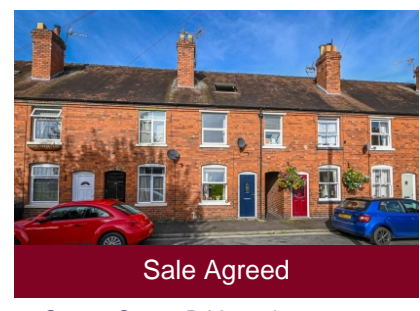
29 Severn Street, Bridgnorth