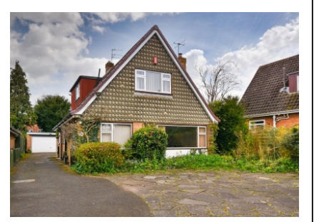
68 Mount Road, Tettenhall Wood, Wolverhampton