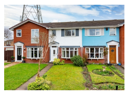
3 Swinford Leys, Wombourne, WV5 8HT