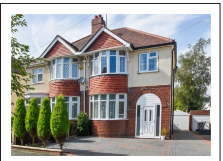
28 Links Road, Penn, Wolverhampton