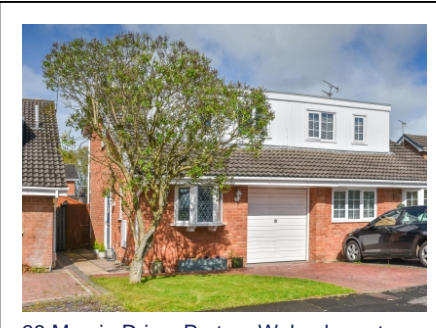
39 Mercia Drive, Perton, Wolverhampton