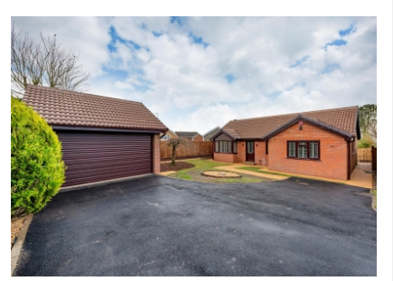
3 Montford Grove, Sedgley, Dudley