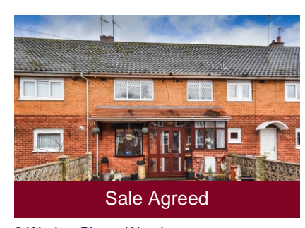
2 Woden Close, Wombourne, Wolverhampton