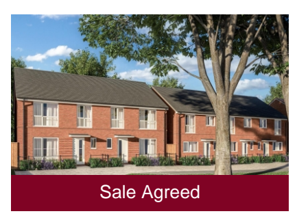
Plot 1 Nightingale Place, Vicarage Road, Wolverhampton