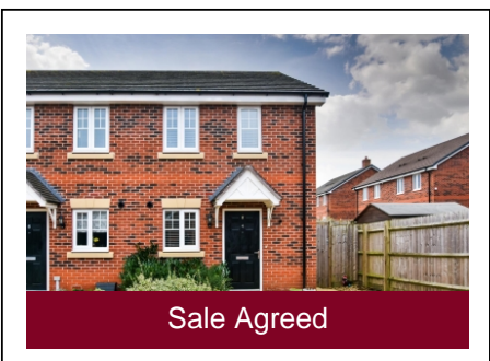
4 Leveson Crescent, Codsall, Wolverhampton