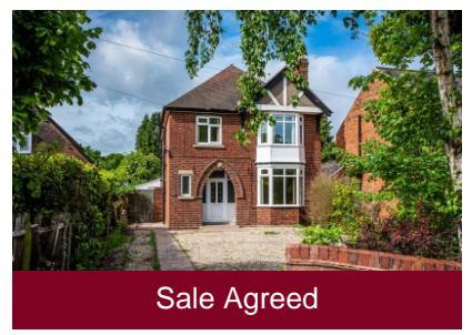
120 Amos Lane. Wednesfield