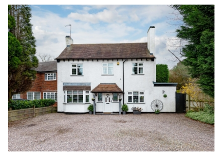
17 Stubbs Road, Wolverhampton