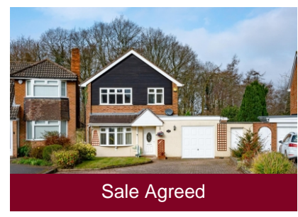
12 Hopstone Gardens, Penn, Wolverhampton