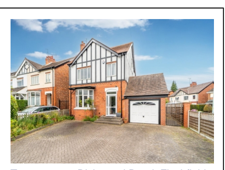
Tregunna, 27 Richmond Road, Finchfield