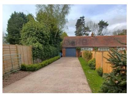
The Bungalow, Popes Lane, Wergs , Tettenhall