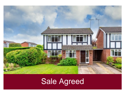
16 Meadow Vale, Codsall, Wolverhampton