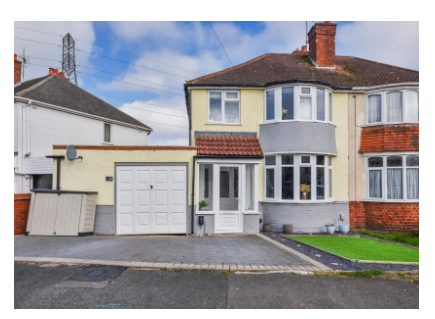
56 Hilston Avenue, Penn, Wolverhampton