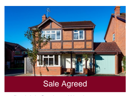
39 Penleigh Gardens, Wombourne, Wolverhampton