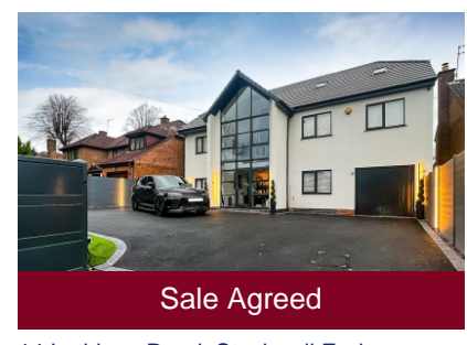
14 Lothians Road, Stockwell End