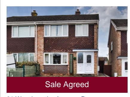
61 Wynchcombe Avenue, Penn, Wolverhampton