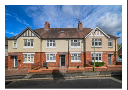
2 Cliff Gardens, Cliff Road, Bridgnorth