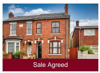
41 Hordern Road, Wolverhampton