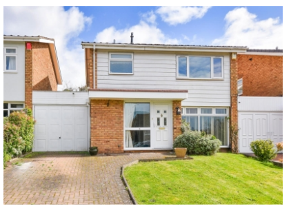
4 Forton Close, Compton, Wolverhampton