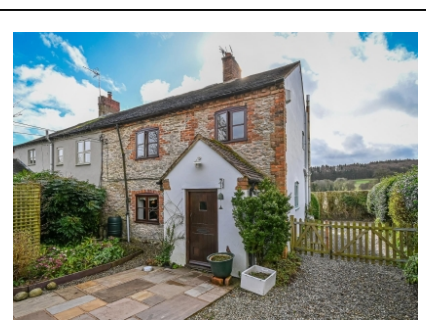
1 The Row, Easthope, Much Wenlock