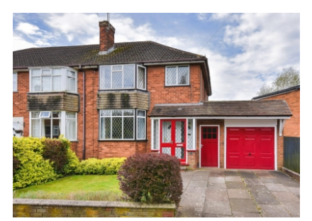
Wombourne Park, Wombourne