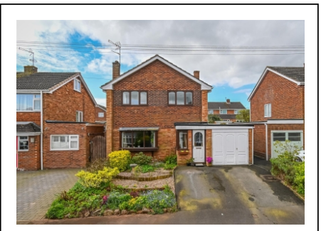
4 Whitmore Close, Bridgnorth