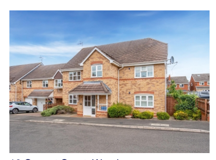
10 Cygnet Court, Wombourne, Wolverhampton