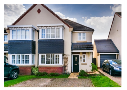
4 The Limes, Codsall Wood, Wolverhampton