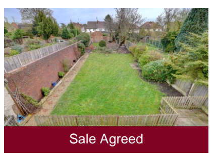
Grosvenor Avenue, Kidderminster