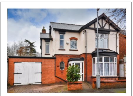
18 Elm Avenue, Bilston, Wolverhampton