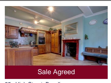
25a High Street, Bewdley