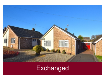
11 Greenleys Crescent, Alveley, Bridgnorth