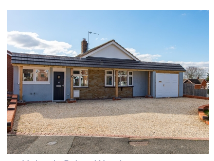
21 Uplands Drive, Wombourne, Wolverhampton