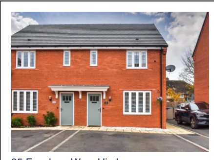
35 Foxglove Way, Himley