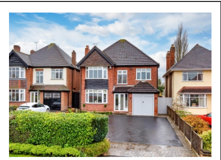
39 Meadow Road, Finchfield