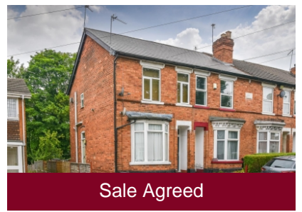
299 & 299a Hordern Road, Whitmore Reans