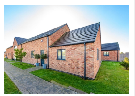
6 Lea Manor Gardens, Albrighton, Wolverhampton