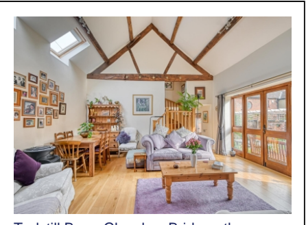
Tedstill Barn, Glazeley, Bridgnorth