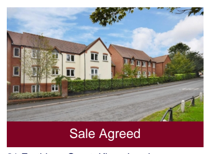
21 Farthings Court, Kings Loade, Bridgnorth