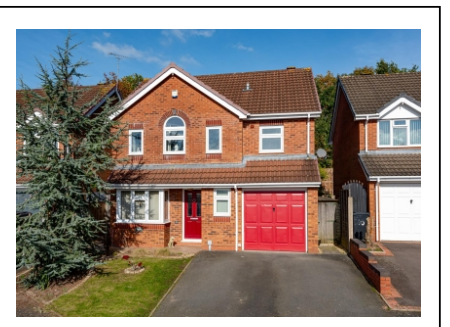
12 Dudmaston Way, Milking Bank, Dudley