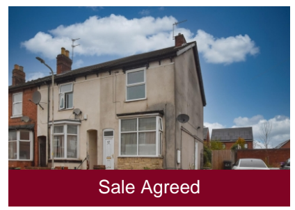
62 Merridale Street West, Wolverhampton