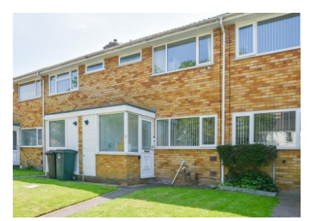
3 Ashfields, High Street, Albrighton