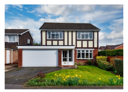
4 Rivendell Gardens, Tettenhall