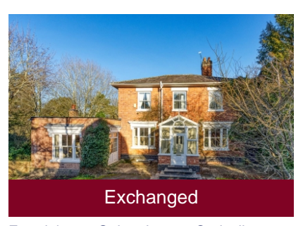
Ferndale, 33 Oaken Lanes, Codsall, Wolverhampton