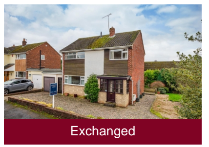
3 Newgate, Pattingham, Wolverhampton