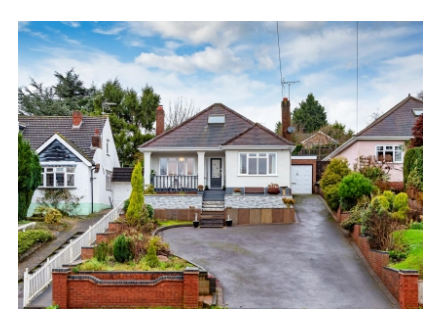
74 Bridgnorth Road, Compton