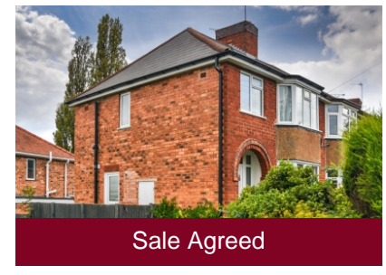
2 Fancourt Avenue, Penn, Wolverhampton