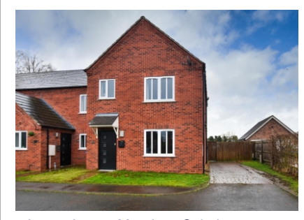
4 Lower Lanes Meadow, Seisdon, Wolverhampton