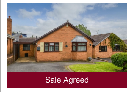
56 Coton Road, Wolverhampton