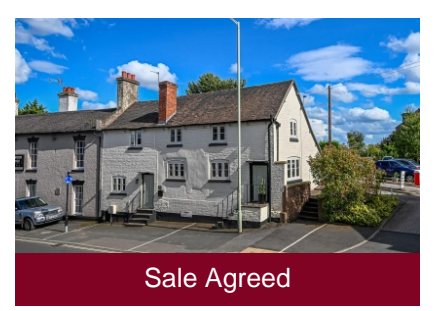
33 Salop St, Bridgnorth