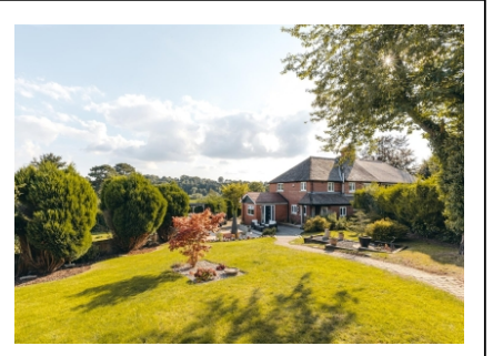
Sunnybank, 11b, Danesford, Bridgnorth