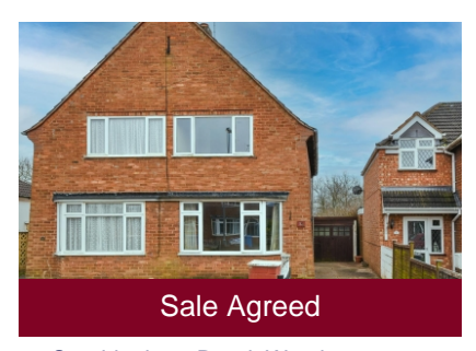
30 Sandringham Road, Wombourne, Wolverhampton