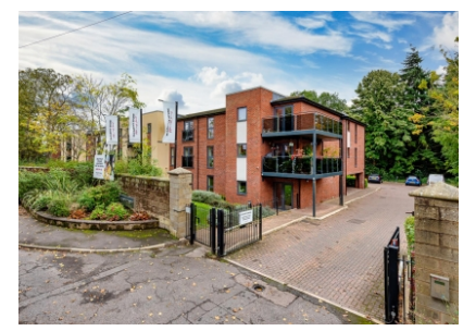
31 Thorneycroft, Wood Road, Tettenhall