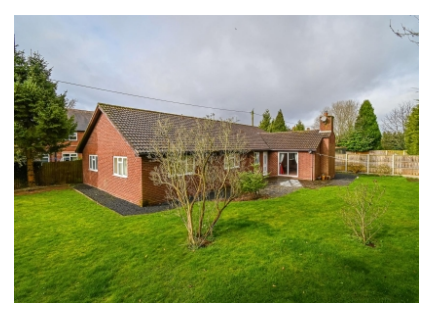
The Old Kiln, Church Lane, Bridgnorth