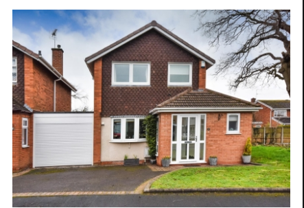
10 Ashley Gardens, Codsall, Wolverhampton