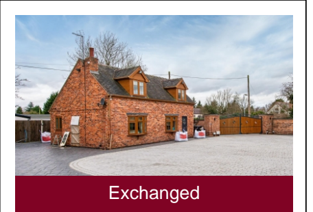
Granary Cottage, Dark Lane, Cross Green, Wolverhampton