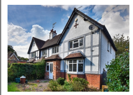
2 Danescourt Cottages, Danescourt Road, Tettenhall