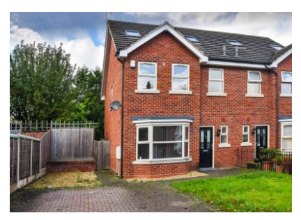
1 Marchant Road, Compton, Wolverhampton