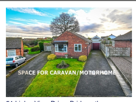
51 Linley View Drive, Bridgnorth