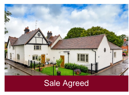
5 Plough Meadows, Trysull