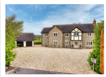
Beech House, Munslow, Shropshire