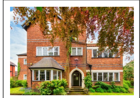
Cheviot House, 20 Stockwell Road, Tettenhall