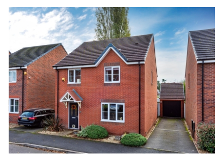
39 Rakegate Close, Oxley, Wolverhampton