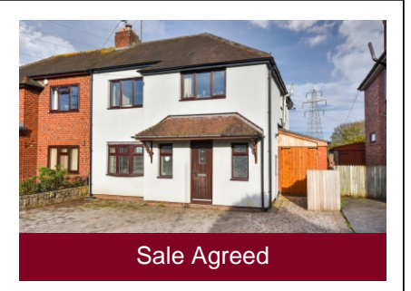
44 Market Lane, Lower Penn, Wolverhampton