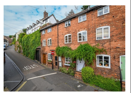
70 Cartway, Bridgnorth