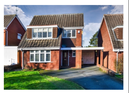
15 Histons Drive, Codsall, Wolverhampton