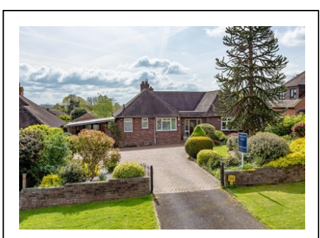
53 Conduit Lane, Bridgnorth