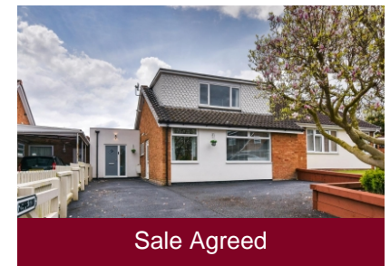
3 Greenfields Road, Wombourne, Wolverhampton