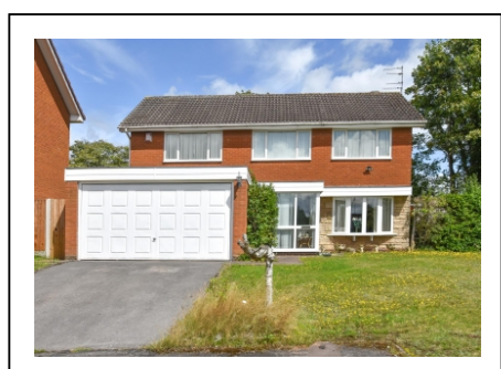
4 The Heathlands, Wombourne, Wolverhampton