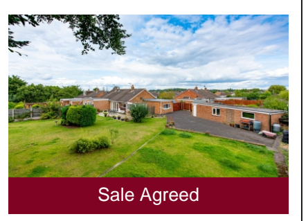
7 Blakeley Heath Drive, Wombourne, Wolverhampton