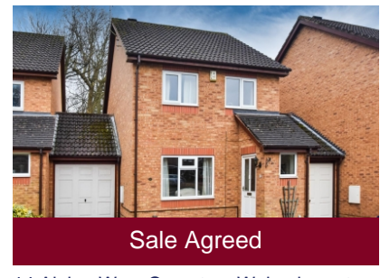
14 Alpine Way, Compton, Wolverhampton