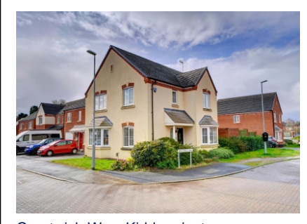
Greatwich Way, Kidderminster