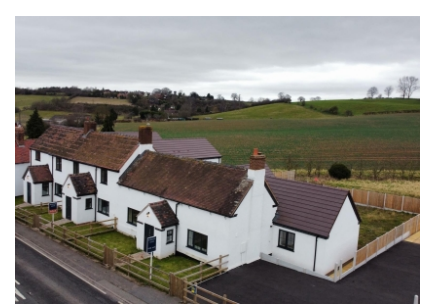
3 Ackleton Meadows, Stableford, Bridgnorth