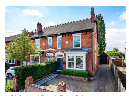
7 Richmond Road, Finchfield, Wolverhampton