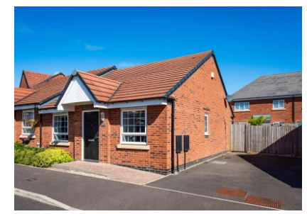
25 Brick Kiln Way, Baggeridge Village