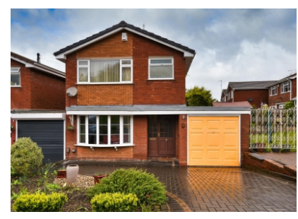
7 Marlborough Gardens, Newbridge, Wolverhampton