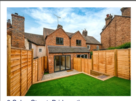
6 Salop Street, Bridgnorth