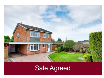
29 Windsor Road, Pattingham, Wolverhampton