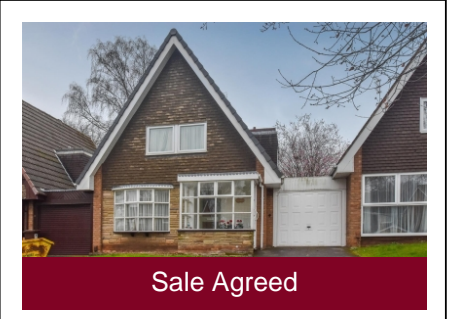
16 Surrey Drive, Finchfield, Wolverhampton