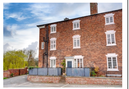
Severn Side, Stourport-On-Severn