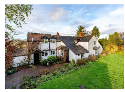
Greystoke Cottage, Kiddemore Green, Brewood