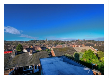
5 River View, Bridgnorth