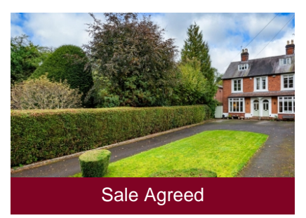
Fernleigh, 35 Oaken Lanes, Codsall