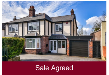
29 Goldthorn Avenue, Penn, Wolverhampton