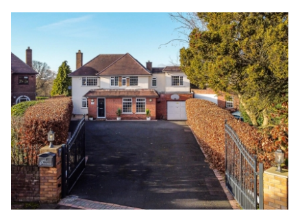
Fern House, Links Avenue, Tettenhall