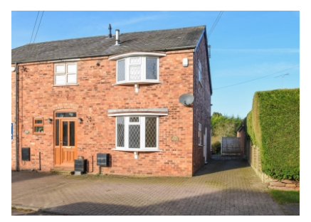
The Rambles, 16 Shop Lane, Oaken