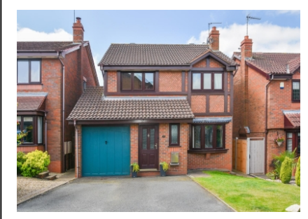
35 Penleigh Gardens, Wombourne, Wolverhampton