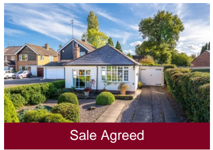
91 Suckling Green Lane, Codsall, Wolverhampton