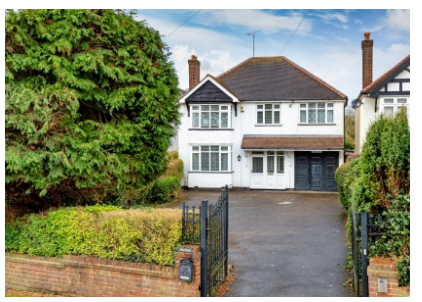
Maleesh, Stourbridge Road, Wombourne