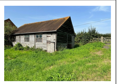
Spring Barn, Glazeley, Bridgnorth