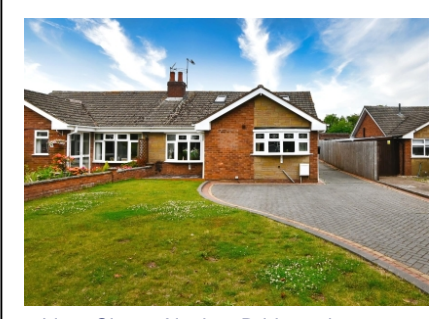
6 Lime Close, Alveley, Bridgnorth