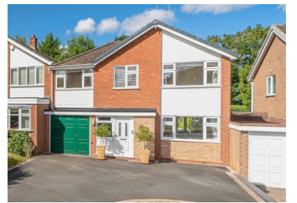
2 Whiteladies Court, Albrighton, Wolverhampton