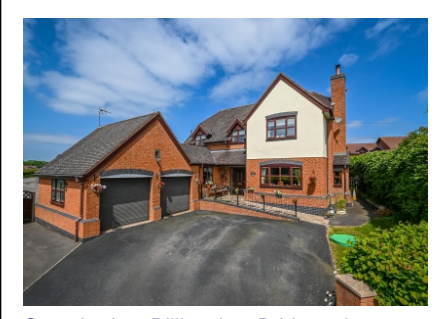
Cape Lodge, Billingsley, Bridgnorth