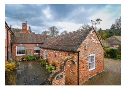
Corner House, 3 Stableford Hall, Stableford, Bridgnorth