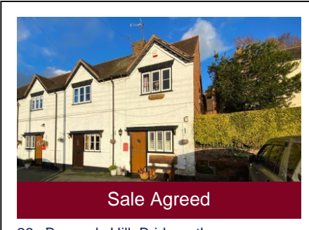
26c Bernards Hill, Bridgnorth