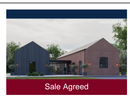
Plot 2, Bynd Lane, Billingsley, Bridgnorth