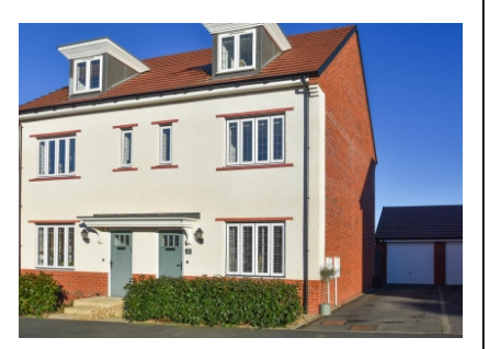
11 Marshall Way, Codsall, Wolverhampton