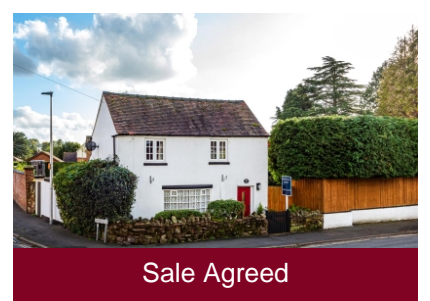
Station Cottage, 58 Station Road, Albrighton