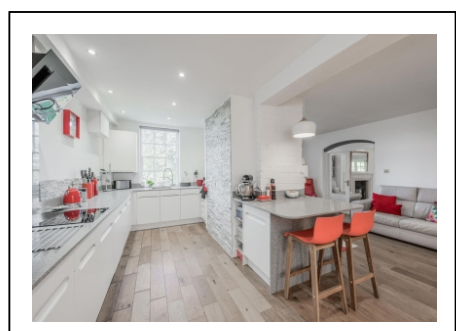
4 Stanmore Mews, Stourbridge Road, Stanmore, Bridgnorth