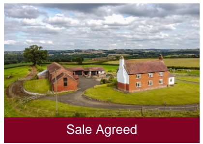
Lower Sutton Farm, Sutton, Chelmarsh, Bridgnorth