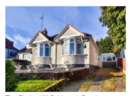
The Chalett, 78 Bridgnorth Road, Compton