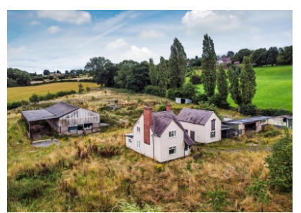
Robins Nest Farm, Dirty Foot Lane, Lower Penn, Wolverhampton