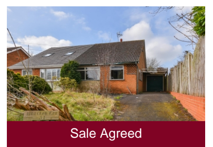
31 Bull Meadow Lane, Wombourne, Wolverhampton