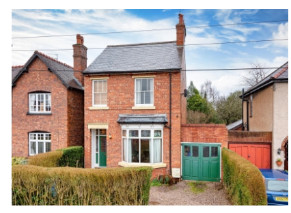
29 Walk Lane, Wombourne