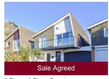
2 Cheswell Close, Compton, Wolverhampton