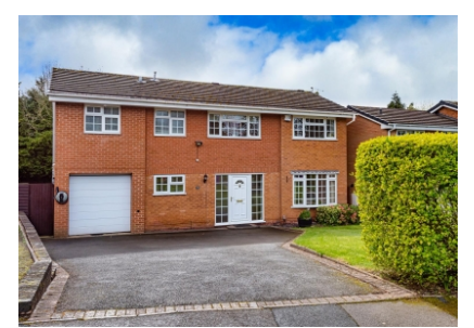
11 Swallowdale, Wightwick, Wolverhampton