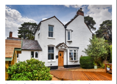
Beech Cottage, 8 The Holloway, Compton