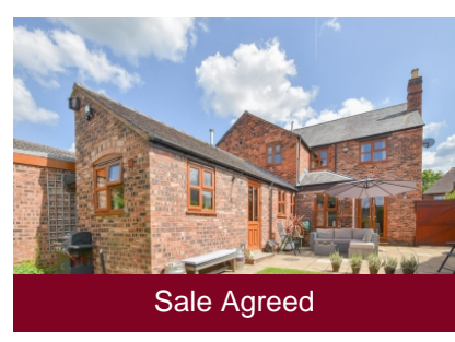
The Cottage, 18 Shop Lane, Oaken