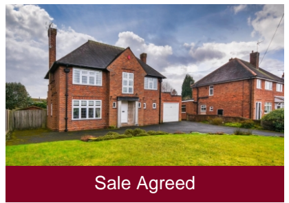
61 Brickbridge Lane, Wombourne, Wolverhampton