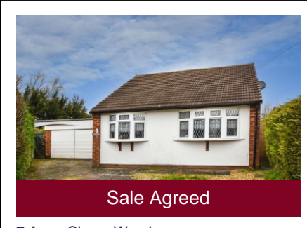
7 Apse Close, Wombourne, Wolverhampton