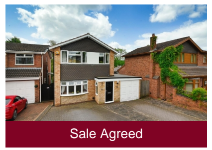
36 Bridge Road, Alveley, Bridgnorth