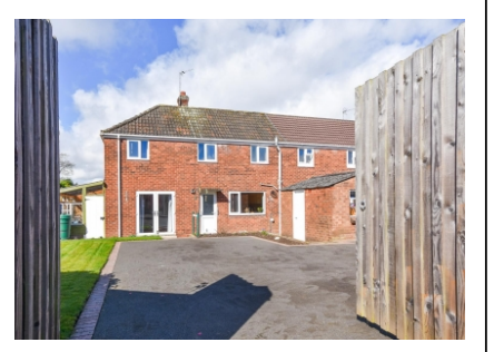
146 Cornwall Road, Wolverhampton