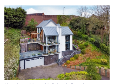
Hawthorn View, Hollybush Road, Bridgnorth