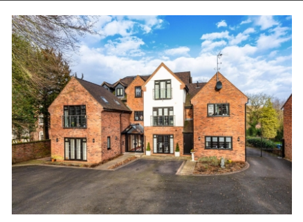
3 The Gables, Seisdon Road, Trysull, Wolverhampton