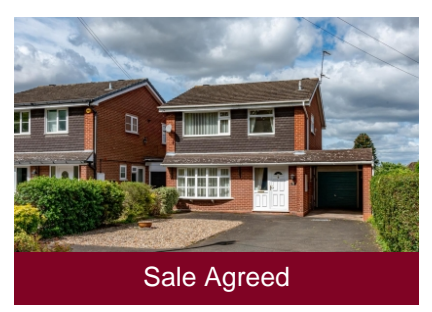
191 Common Road, Wombourne, Wolverhampton