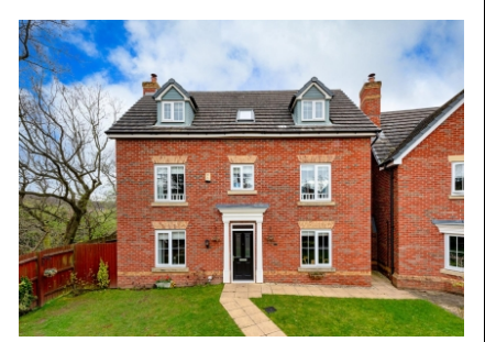
Oaklands, Wombourne, Wolverhampton