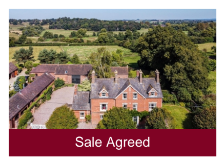
Roughton Farmhouse, Roughton, Bridgnorth