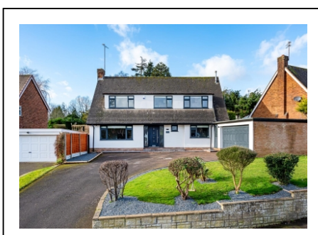
25 Perton Brook Vale, Wightwick