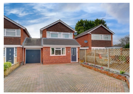
Elderberry Close, Stourport-On-Severn