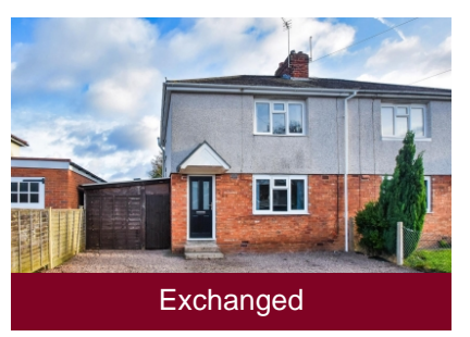
34 Hazel Grove, Wombourne, Wolverhampton