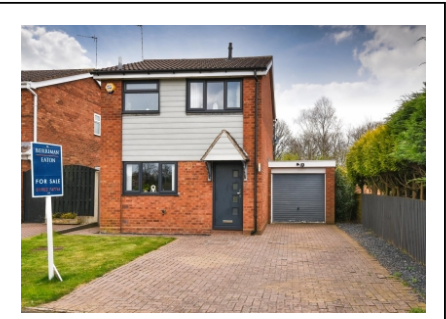
71 Mercia Drive, Perton, Wolverhampton