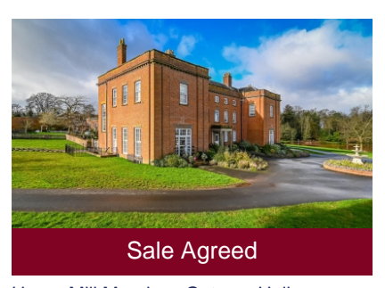
Upper Mill Meadow, Gatacre Hall, Gatacre, Claverley, Wolverhampton