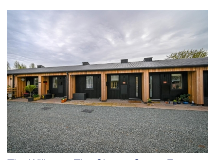
The Willow, 3 The Closes, Sutton Farm, Claverley, Wolverhampton