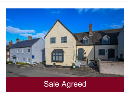
7 Bull Ring, Claverley, Wolverhampton