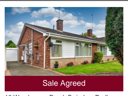
10 Wombourne Road, Swindon, Dudley