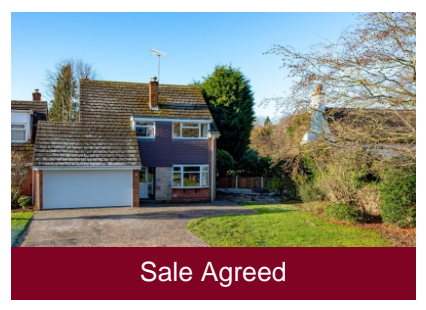
5 Post Office Road, Seisdon, Wolverhampton