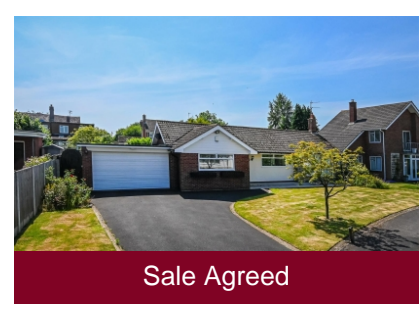
50 The Wold, Claverley, Shropshire