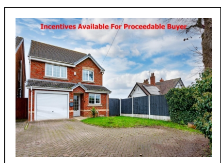
151 Tipton Road, Woodsetton, Dudley