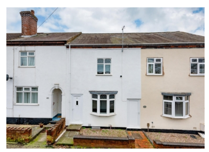
126a Clifton Street, Sedgley