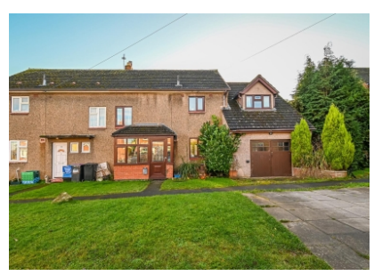
74 The Hobbins, Bridgnorth