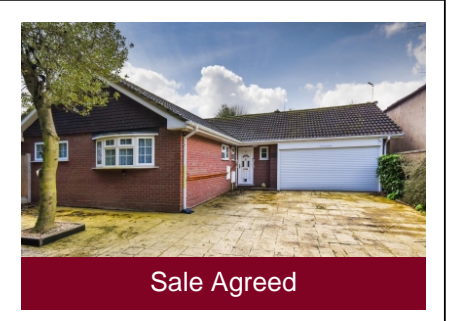
28a Mount Road, Mount Road, Tettenhall Wood