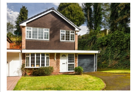
39 Alpine Way, Compton, Wolverhampton