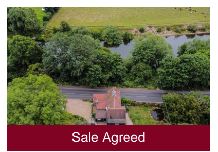
Holme Cottage, Knowle Sands, Bridgnorth