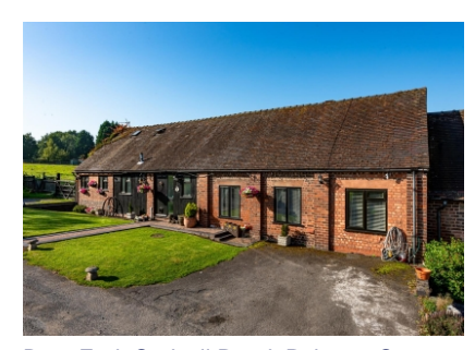
Barn End, Codsall Road, Palmers Cross, Wolverhampton