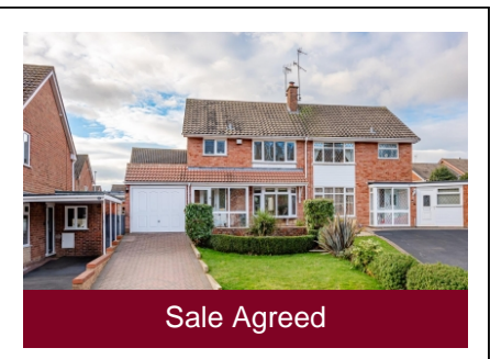
14 Chequers Avenue, Wombourne, Wolverhampton