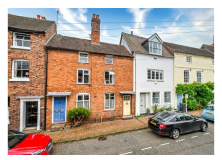
24 St. Marys Street, Bridgnorth