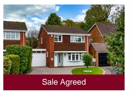
6 Tanglewood Grove, Dudley