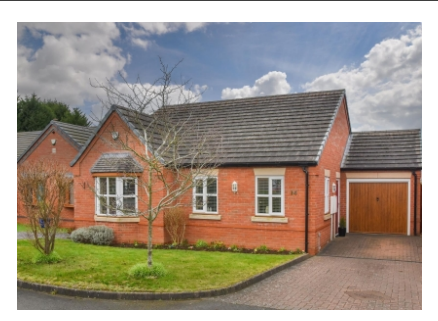
14 Berkeley Close, Perton, Wolverhampton