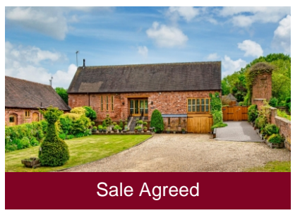
The Tythe Barn, Hyde Mill Lane, Brewood