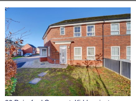
26 Rainsford Crescent, Kidderminster