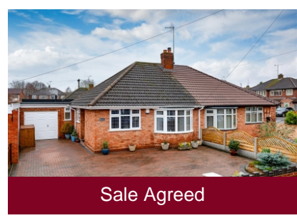
13 Kirkstone Crescent, Wombourne, Wolverhampton