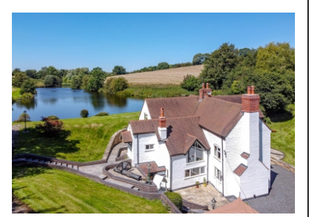
Hem Mill, The Hem, Shifnal