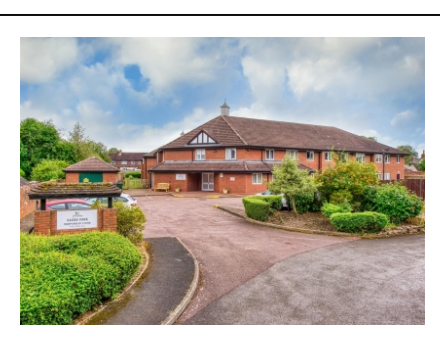
13 Saxon Park, High Street, Albrighton, Wolverhampton