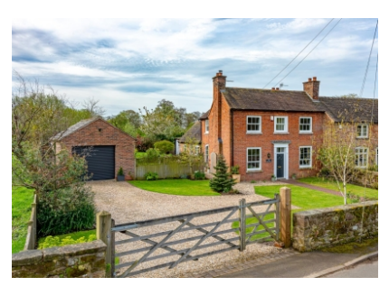
The Little House, 7 Tong Norton, Shifnal