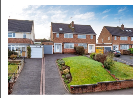
44 Common Road, Wombourne, Wolverhampton