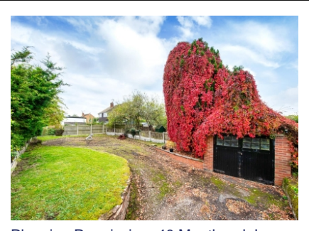
Planning Permission, 40 Moatbrook Lane, Codsall, WV8 1SD