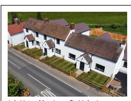
1 Ackleton Meadows, Stableford, Bridgnorth