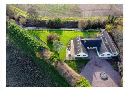
Riverside Bungalow, Muckley Cross, Acton Round, Bridgnorth