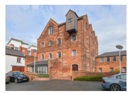
11 The Mill, Albion Street, Wolverhampton