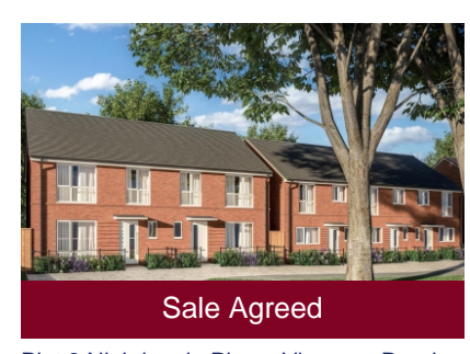
Plot 3 Nightingale Place, Vicarage Road, Wolverhampton