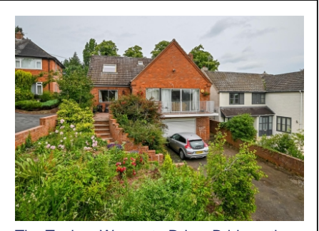
The Tyning, Westgate Drive, Bridgnorth