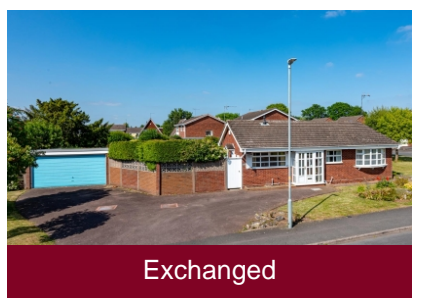
44 Woodcote Road, Wolverhampton