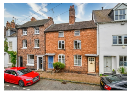
25 St. Marys Street, Bridgnorth