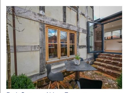
Park Cottage, Abbey Foregate, Shrewsbury