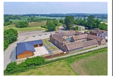
Saxon Meadow Cottage 5, The Wyke, Shifnal