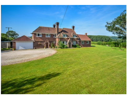
Footbridge House, Tasley, Bridgnorth