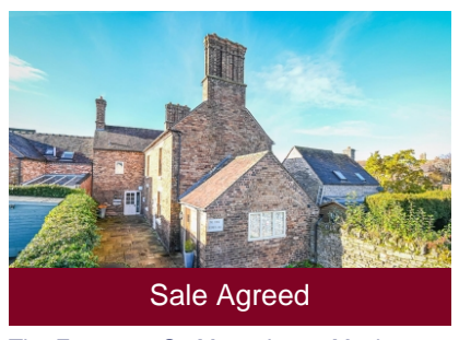
The Forge, 13 St. Marys Lane, Much Wenlock