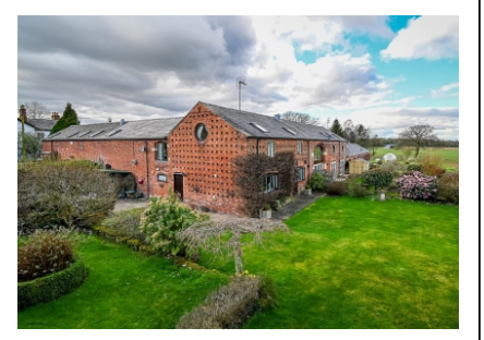
The Oak House, Oaklands Court, Lower Rudge, Pattingham