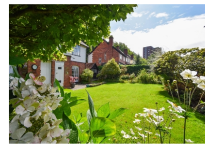
29 Bath Avenue, Wolverhampton