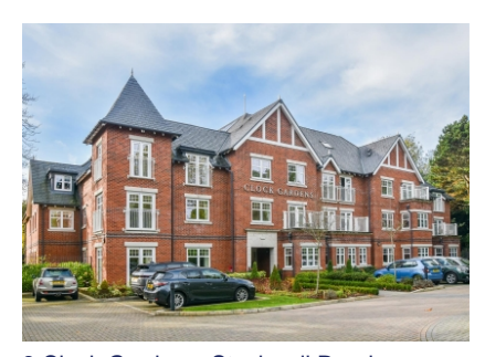
8 Clock Gardens, Stockwell Road, Wolverhampton