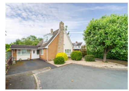
8 The Orchard, Albrighton