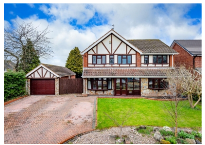
11 Waverley Gardens, Wombourne, Wolverhampton