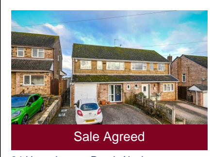
34 Honeybourne Road, Alveley, Bridgnorth