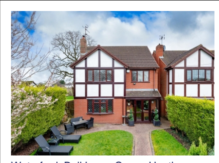
Waterford, Ball Lane, Coven Heath, Wolverhampton