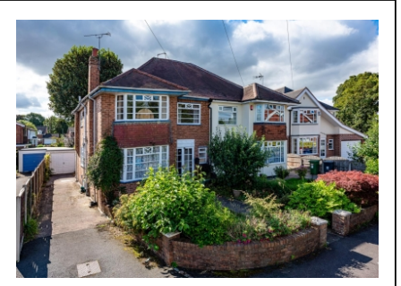
7 Newbridge Gardens, Newbridge, Wolverhampton