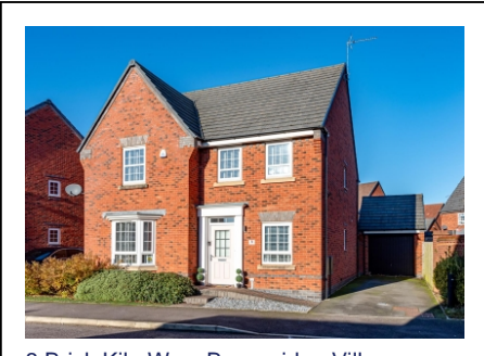
8 Brick Kiln Way, Baggeridge Village