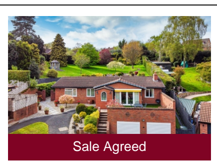
18 Bramble Ridge, Bridgnorth