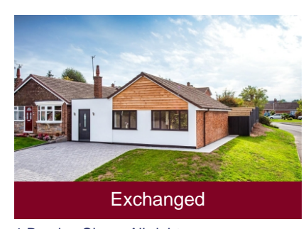
1 Barclay Close, Albrighton, Wolverhampton