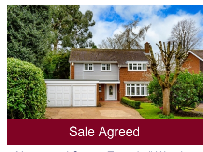
1 Mountwood Covert, Tettenhall Wood, Wolverhampton