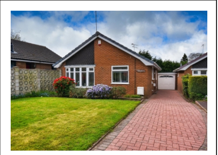
19 Finchdene Grove, Finchfield, Wolverhampton