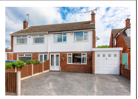
19 Chapel Street, Wombourne