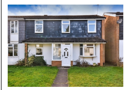
11 Woodside, Ashmore Park, Wolverhampton