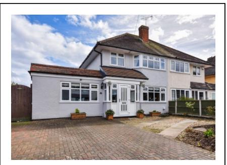
34 Delaware Avenue, Albrighton