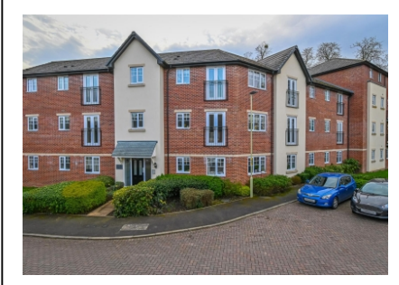
25 Greyfriars House, Stourbridge Road, Bridgnorth