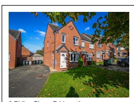
8 Ridley Close, Bridgnorth