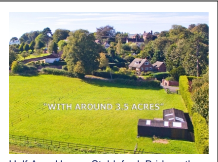
Half Acre House, Stableford, Bridgnorth