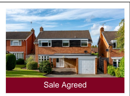
11 Copper Beech Drive, Wombourne, Wolverhampton