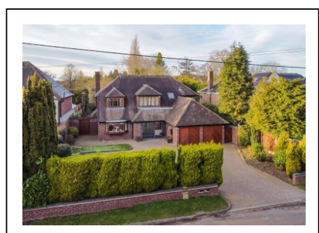
Broad Elms, Great Moor Road, Pattingham