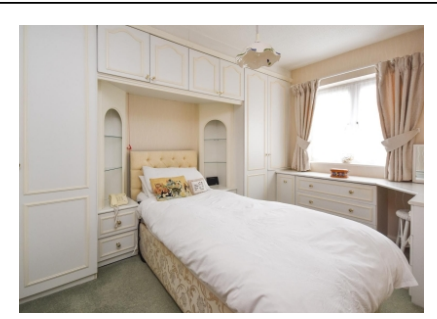
24 Hanover Court, Tettenhall, Wolverhampton