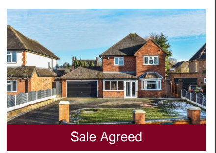
75 Yew Tree Lane, Tettenhall