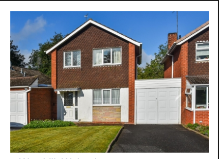
9 Westhill, Wolverhampton