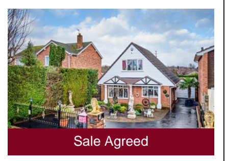
5 Bratch Common Road, Wombourne, Wolverhampton