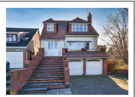
25 Bognop Road, Essington, Wolverhampton