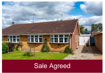
68 Clee View Road, Wombourne, Wolverhampton