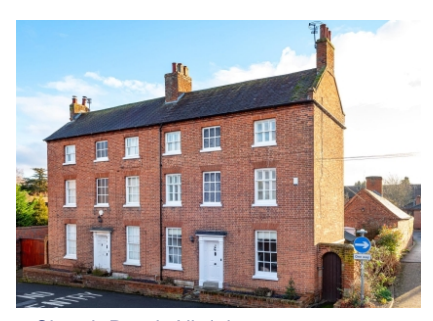
4 Church Road, Albrighton, Wolverhampton