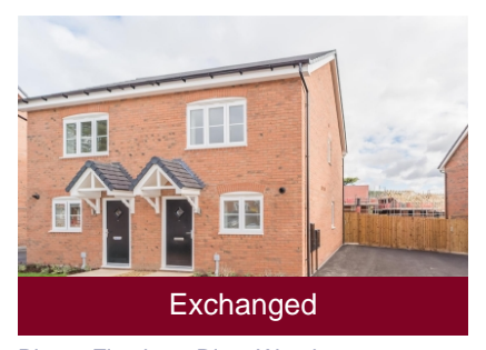
Plot 4, Fletchers Rise, Wombourne