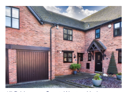
17 Bridgeman Court, Weston-Under-Lizard, Shifnal