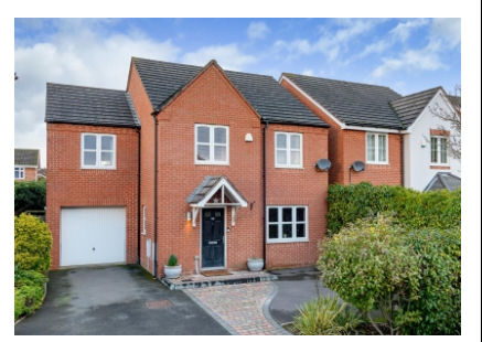
80 Brickbridge Lane, Wombourne, Wolverhampton