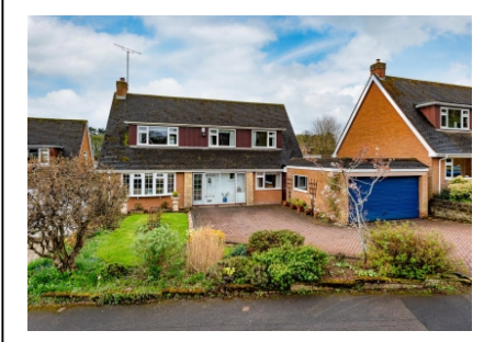
18 Quail Green, Wightwick, Wolverhampton