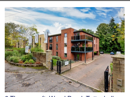
6 Thorneycroft, Wood Road, Tettenhall