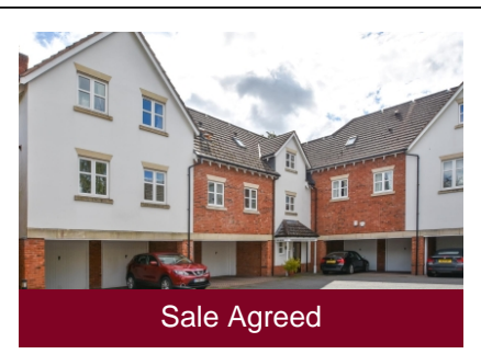
2 Albrighton House, The Water Gardens, Wolverhampton