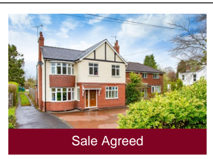
74 Langley Road, Wolverhampton