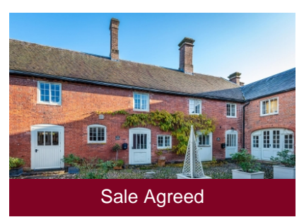
The Ostlers, 3 Patshull Hall Mews, Burnhill Green