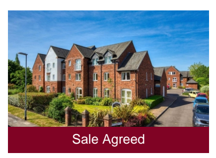
17 Wombrook Court, Wombourne, Wolverhampton