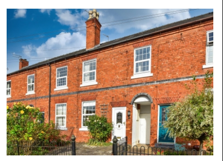
3 Shaw Lane, Albrighton, Wolverhampton