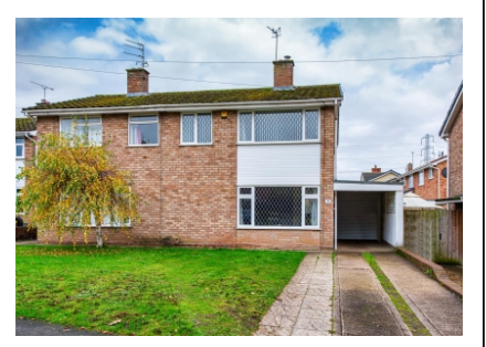
36 Wombourne Road, Swindon, Dudley