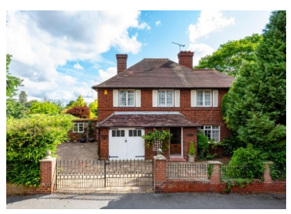
Oxleaze, Grange Road, Albrighton