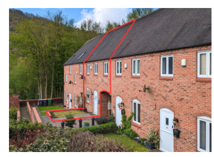
6 The Courtyard, Ironbridge, Telford