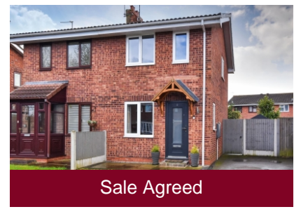
6 Troon Court, Perton, Wolverhampton