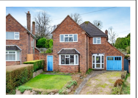
14 Peterdale Drive, Wolverhampton