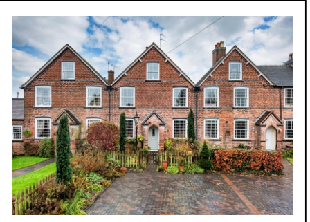
2 Labernum Cottages, Vicarage Road, Penn, Wolverhampton