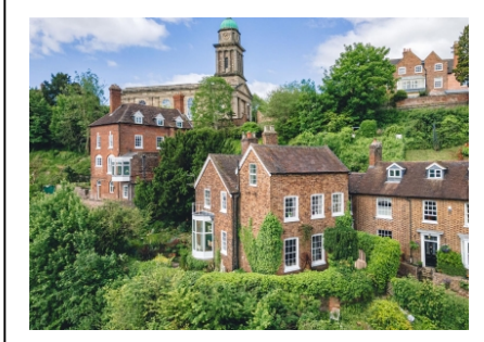
Castle Cliffe House, 24 St. Mary's Steps, Bridgnorth