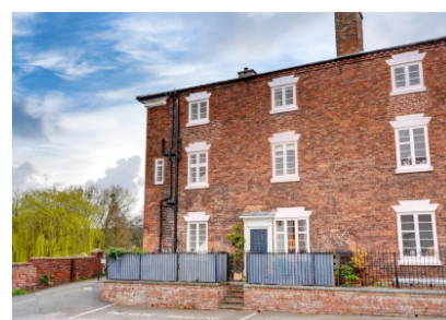
Seyn Side, Stourport-On-Severn