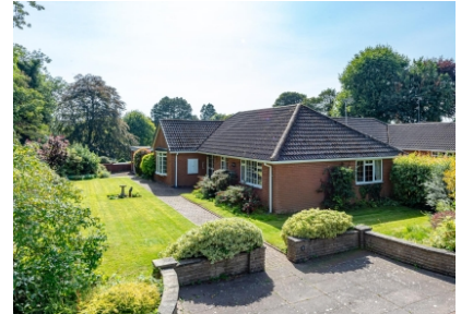
11 Compton Hill Drive, Compton, Wolverhampton