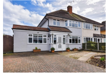
34 Delaware Avenue, Albrighton