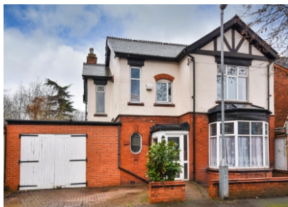
18 Elm Avenue, Bilston, Wolverhampton