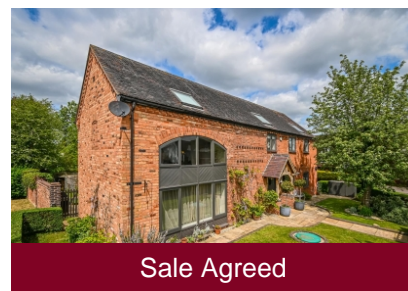
1 The Paddock, Claverley, Wolverhampton