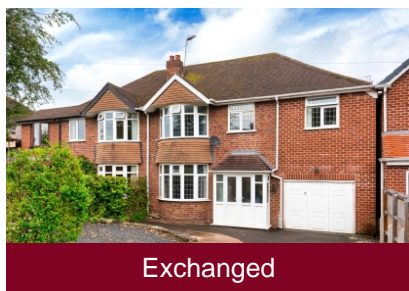
14 Bratch Lane, Wombourne, Wolverhampton