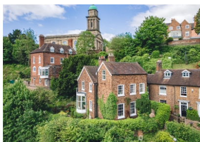
Castle Cliffe House, 24 St. Mary's Steps, Bridgnorth