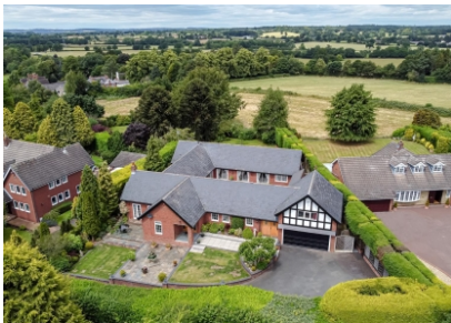
Courtenys, Oaken Drive, Oaken, Codsall