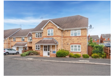
10 Cygnet Court, Wombourne, Wolverhampton