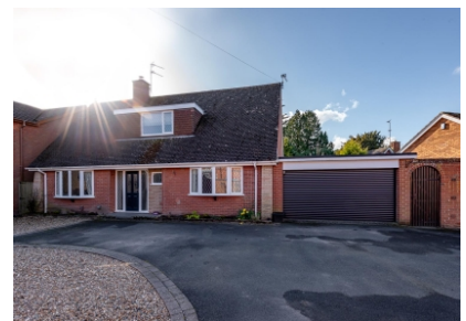
Strathmore, Shaw Lane, Albrighton