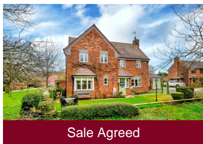
43 Pale Meadow Road, Bridgnorth