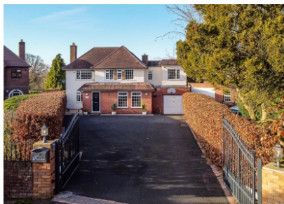
Fern House, Links Avenue, Tettenhall