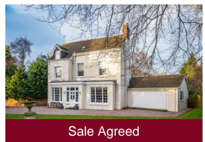
Grove House, 25 Oaken Lanes, Codsall