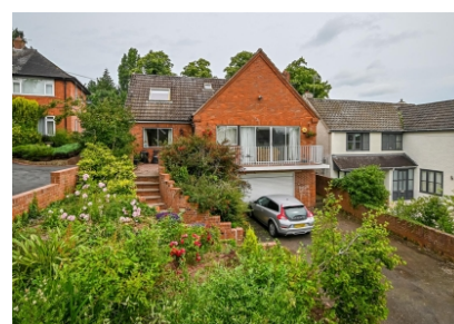
The Tynning, Westgate Drive, Bridgnorth