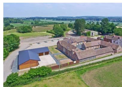
Saxon Meadow Cottage 5, The Wyke, Shifnal