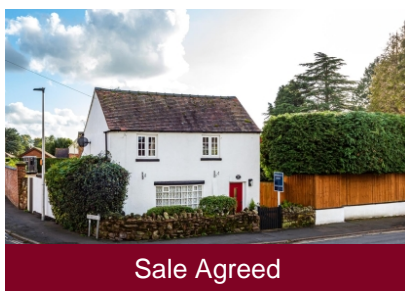
Station Cottage, 58 Station Road, Albrighton