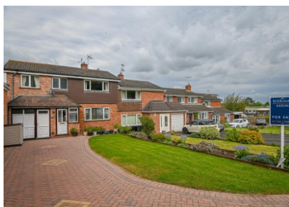
27 Castlefields, Bridgnorth