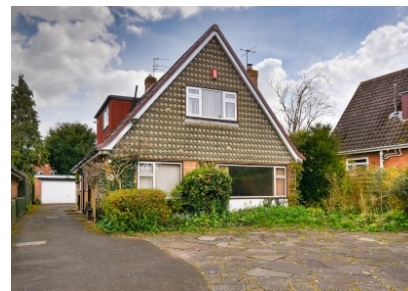
68 Mount Road, Tettenhall Wood, Wolverhampton