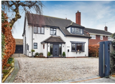
Clearview, Straight Mile, Calf Heath, Wolverhampton