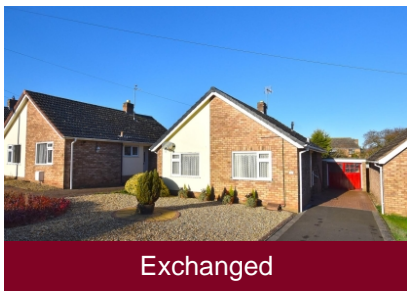
11 Greenleys Crescent, Alveley, Bridgnorth