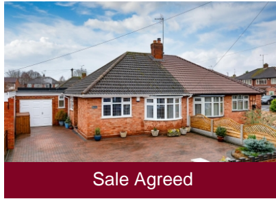
13 Kirkstone Crescent, Wombourne, Wolverhampton