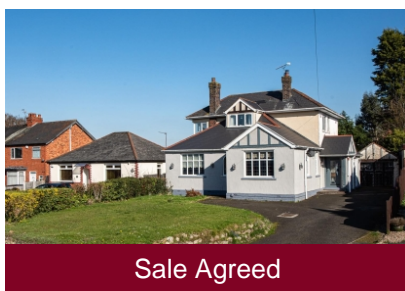
153 Trysull Road, Merry Hill, Wolverhampton