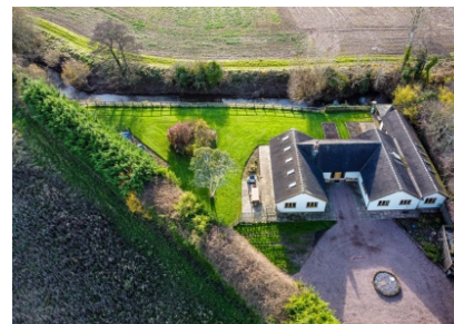
Riverside Bungalow, Muckley Cross, Acton Round, Bridgnorth