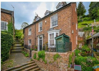
19 St. Marys Steps, Bridgnorth