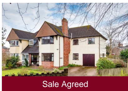
The Homestead, Westland Avenue, Compton