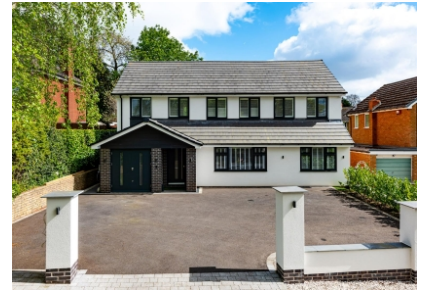
1 Chestnut Close, Codsall, WV8 2EZ