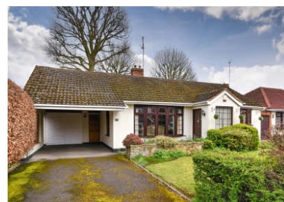
30 Sabrina Road, Wightwick, Wolverhampton