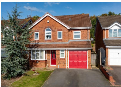
12 Dudmaston Way, Milking Bank, Dudley