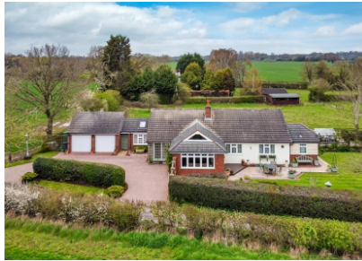
Holly Lodge, Church Lane, Boningale, Albrighton