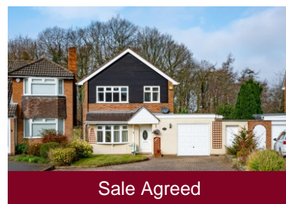
12 Hopstone Gardens, Penn, Wolverhampton