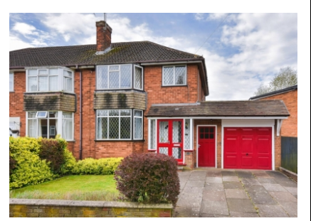
Wombourne Park, Wombourne