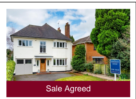
Randolph House, 55 Woodthorne Road, Wolverhampton