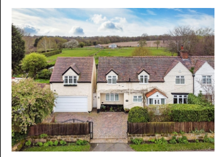
15 Birches Road, Codsall, Wolverhampton