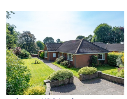
11 Compton Hill Drive, Compton, Wolverhampton