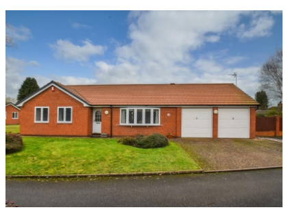
1 The Courts, Albrighton, Wolverhampton