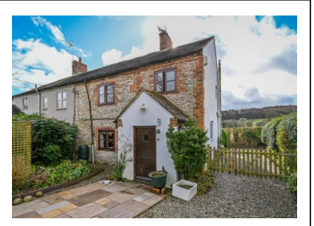
1 The Row, Easthope, Much Wenlock