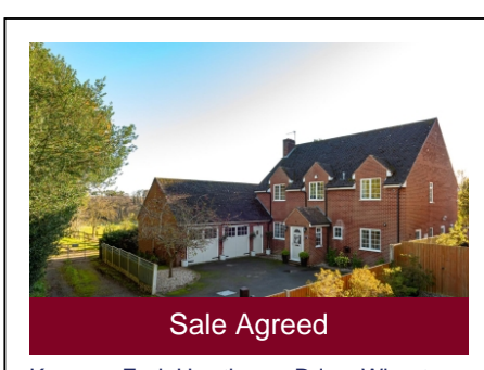
Keepers End, Hawthorne Drive, Wheaton Aston