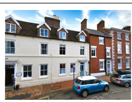
28 East Castle Street, Bridgnorth