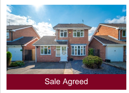
42 Gainsborough Drive, Perton, Wolverhampton