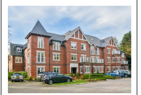
8 Clock Gardens, Stockwell Road, Wolverhampton