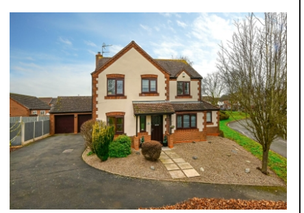
3 Danesbrook, Claverley, Wolverhampton