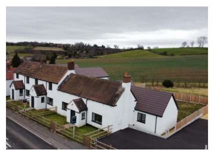
3 Ackleton Meadows, Stableford, Bridgnorth