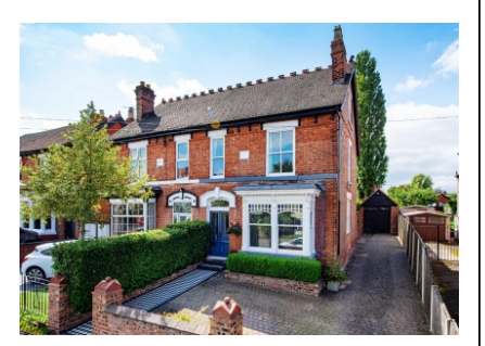
7 Richmond Road, Finchfield, Wolverhampton