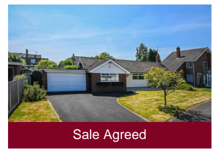
50 The Wold, Claverley, Shropshire