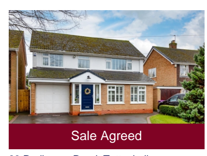
89 Redhouse Road, Tettenhall, Wolverhampton