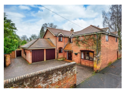
Manor Court, Cross Road, Albrighton, Wolverhampton