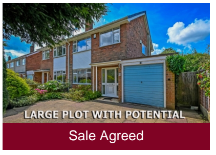
6 Moor Lane, Pattingham, Wolverhampton