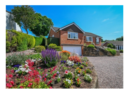
Three Ridges, Hilton, Bridgnorth