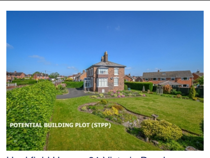
Hookfield House, 81 Victoria Road, Bridgnorth