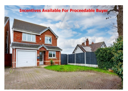
151 Tipton Road, Woodsetton, Dudley