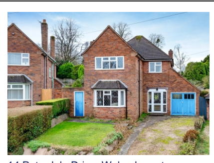
14 Peterdale Drive, Wolverhampton