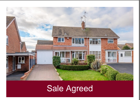
14 Chequers Avenue, Wombourne, Wolverhampton