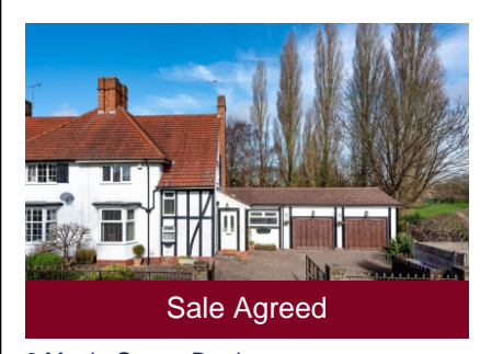
9 Myrtle Grove, Bradmore, Wolverhampton