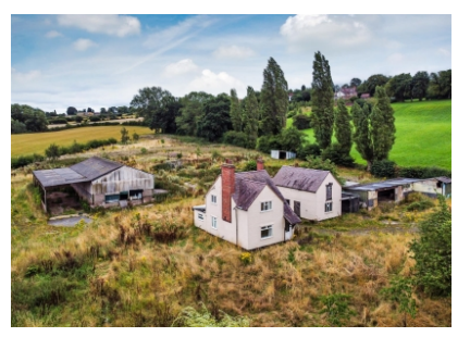
Robins Nest Farm, Dirty Foot Lane, Lower Penn, Wolverhampton