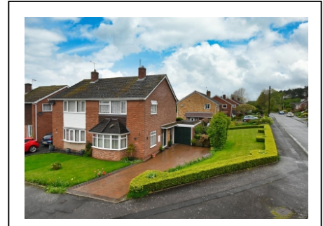
3 Hillside Avenue, Bridgnorth