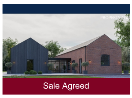
Plot 2, Bynd Lane, Billingsley, Bridgnorth