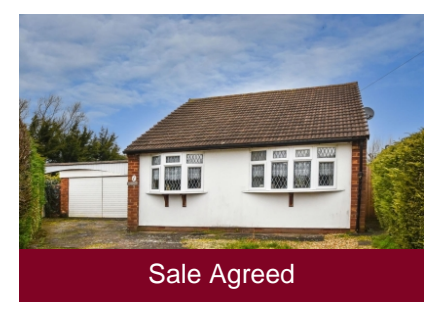
7 Apse Close, Wombourne, Wolverhampton