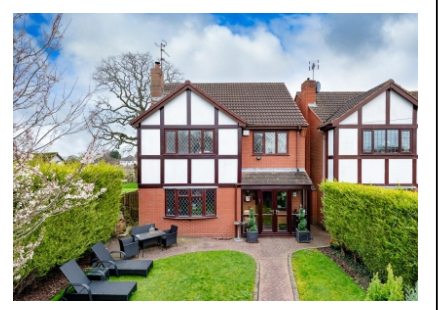
Waterford, Ball Lane, Coven Heath, Wolverhampton