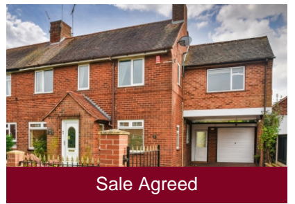
13 Grange Road, Albrighton, Wolverhampton