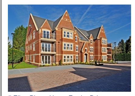
5 Ellen Place, Henry Fowler Drive, Tettenhall