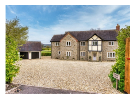
Beech House, Munslow, Shropshire