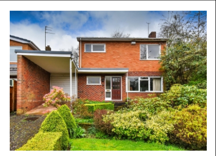
10 Ashfield Road, Compton, Wolverhampton