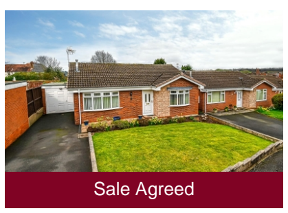
7 Claremont Drive, Bridgnorth