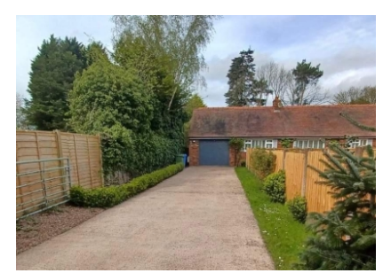
The Bungalow, Popes Lane, Wergs , Tettenhall