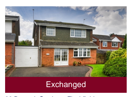
39 Bantock Gardens, Finchfield, Wolverhampton