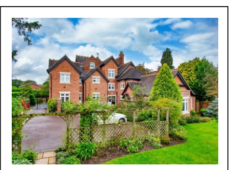
18f Southgate, Stockwell Road, Tettenhall, Wolverhampton