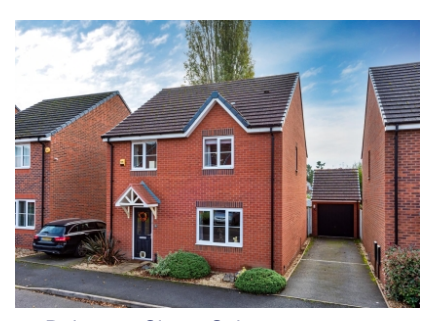
39 Rakegate Close, Oxley, Wolverhampton