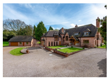
Meadowcroft, Pitchcroft Lane, Chetwynd Aston, Newport, Shropshire, TF10 9AU