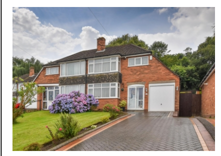
4 Chase View, Ettingshall Park, Wolverhampton