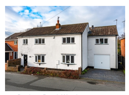
109 Rookery Road, Wombourne, Wolverhampton