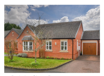
14 Berkeley Close, Perton, Wolverhampton