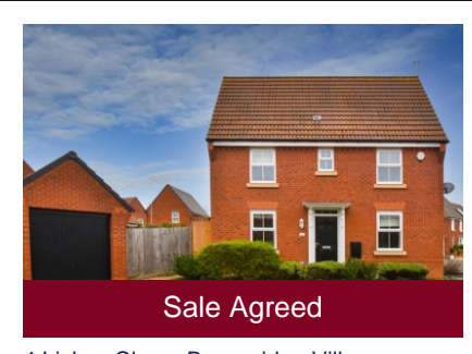
4 Lickey Close, Baggeridge Village, Dudley