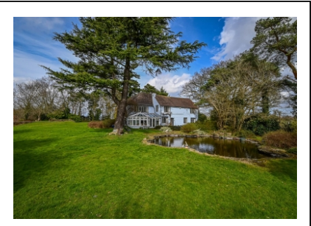
Horseshoes, Netherton, Highley, Bridgnorth