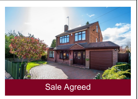
13 Springhill Lane, Wolverhampton