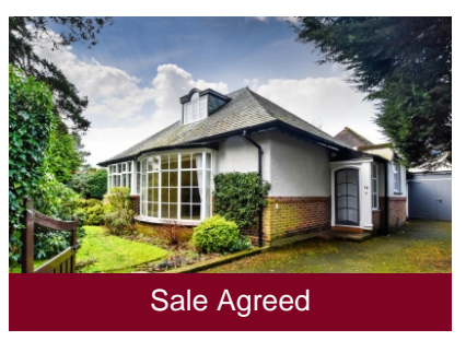
The Grey Cottage 19 Clifton Road, Wolverhampton