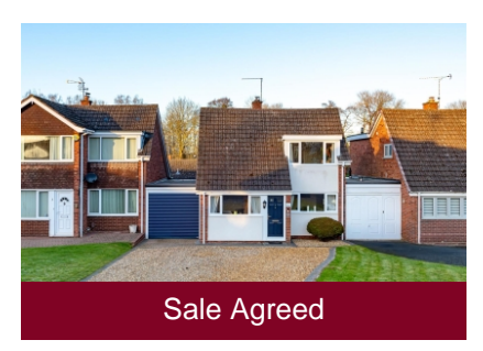
1 Bredon Close, Albrighton, Wolverhampton