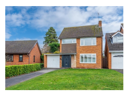
1 Redford Drive, Albrighton