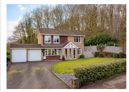
Wychaven, The Holloway, Swindon, Dudley