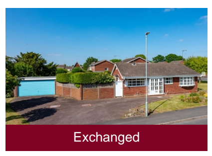
44 Woodcote Road, Wolverhampton