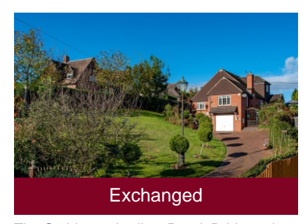
The Stable, 46 Ludlow Road, Bridgnorth