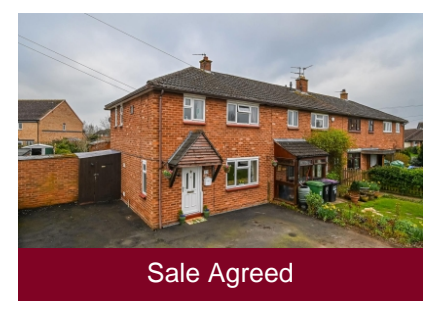
17 Racecourse Drive, Bridgnorth, Shropshire