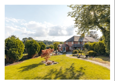
Sunnybank, 11b, Danesford, Bridgnorth