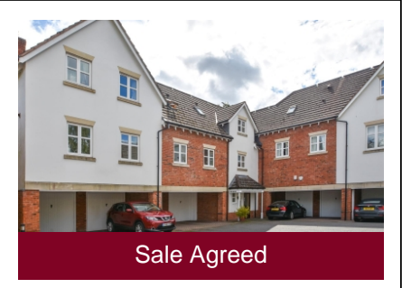
2 Albrighton House, The Water Gardens, Wolverhampton