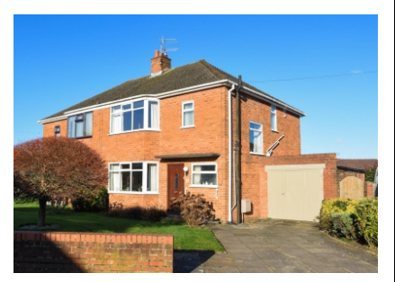
9 Windmill Grove, Kingswinford