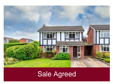
16 Meadow Vale, Codsall, Wolverhampton