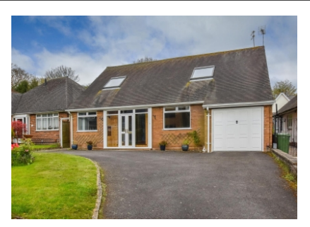
38 Foley Avenue, Tettenhall, Wolverhampton