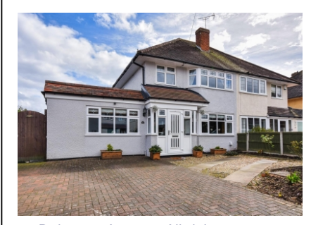
34 Delaware Avenue, Albrighton