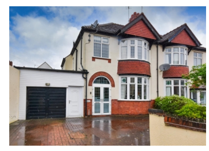
Pennhouse Avenue, Wolverhampton