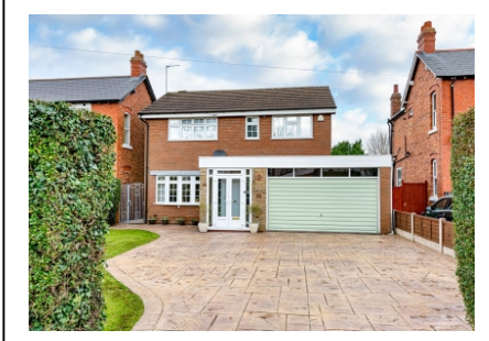
230a Trysull Road, Merry Hill, Wolverhampton