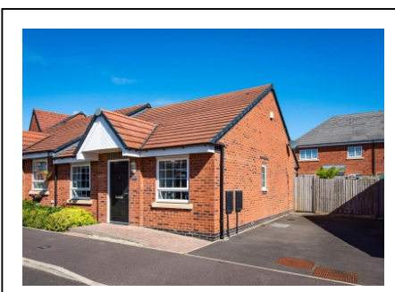
25 Brick Kiln Way, Baggeridge Village