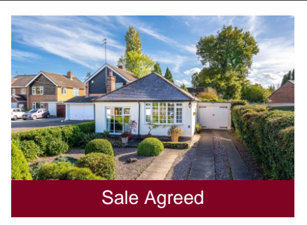
91 Suckling Green Lane, Codsall, Wolverhampton