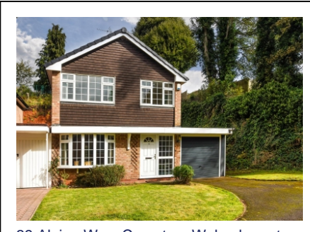
39 Alpine Way, Compton, Wolverhampton