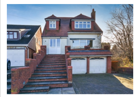
25 Bognop Road, Essington, Wolverhampton