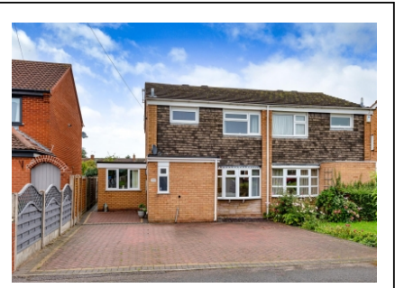
148a Birches Road, Codsall, Wolverhampton