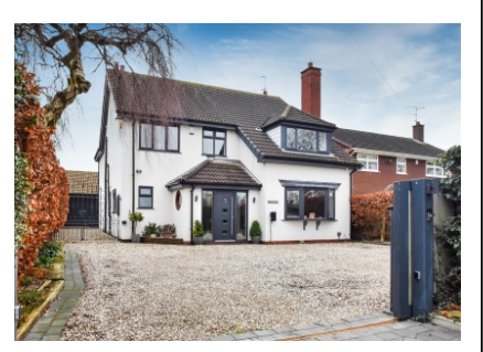
Clearview, Straight Mile, Calf Heath, Wolverhampton