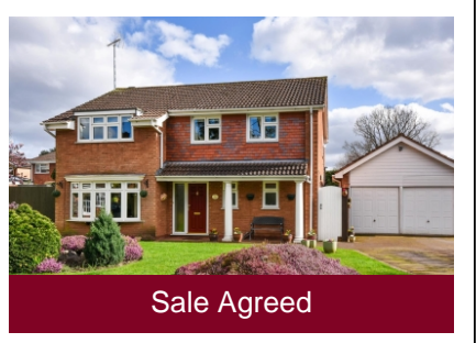
Oaken Covert, Codsall, Wolverhampton