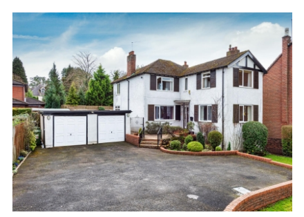
Quarry House, 30 Lansdowne Avenue, Codsall