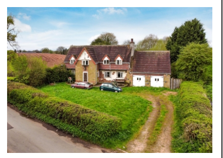
Mill Cottage, Lower Rudge, Pattingham, Wolverhampton