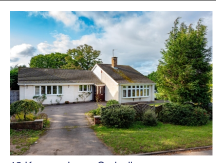
12 Keepers Lane, Codsall, Wolverhampton