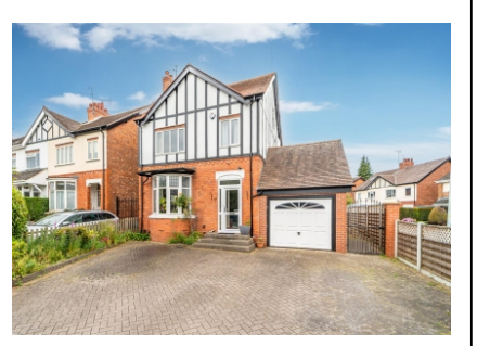
Tregunna, 27 Richmond Road, Finchfield