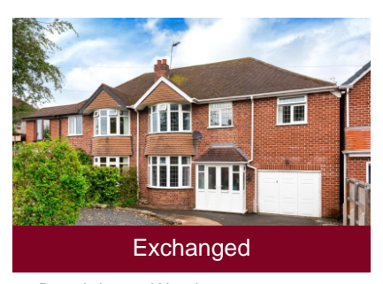
14 Bratch Lane, Wombourne, Wolverhampton