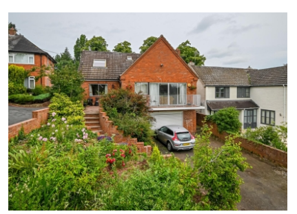
The Tyning, Westgate Drive, Bridgnorth