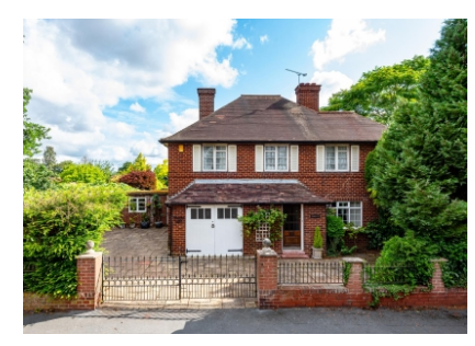
Oxleaze, Grange Road, Albrighton