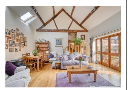
Tedstill Barn, Glazeley, Bridgnorth