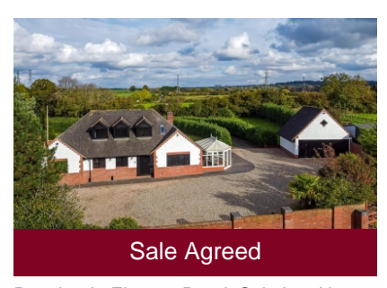
Rosebank, Ebstree Road, Seisdon, Nr Wolverhampton