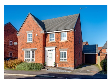
8 Brick Kiln Way, Baggeridge Village