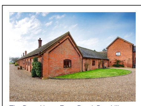
The Byre, Home Farm Road, Burnhill Green, Wolverhampton