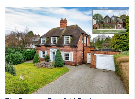
The Dormers, Finchfield Gardens, Finchfield