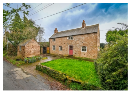
148 Broad Oak, Six Ashes