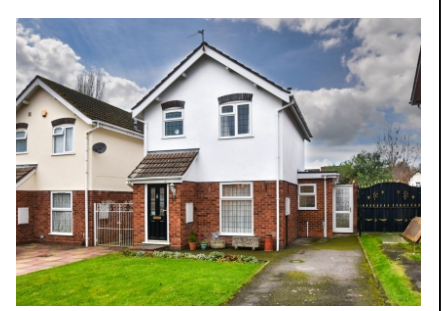
8 Laburnum Street, Wolverhampton