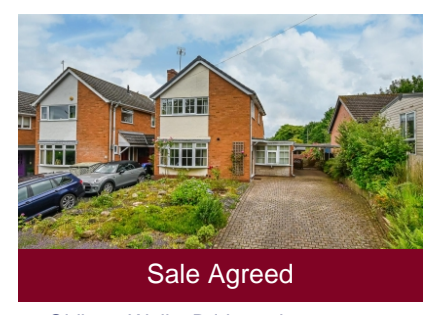
49 Oldbury Wells, Bridgnorth