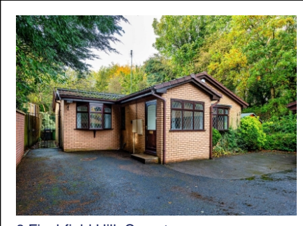
6 Finchfield Hill, Compton, Wolverhampton