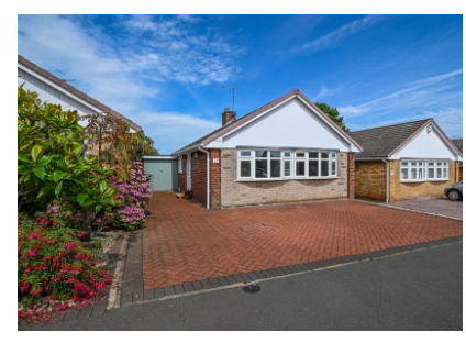
7 Princess Drive, Bridgnorth