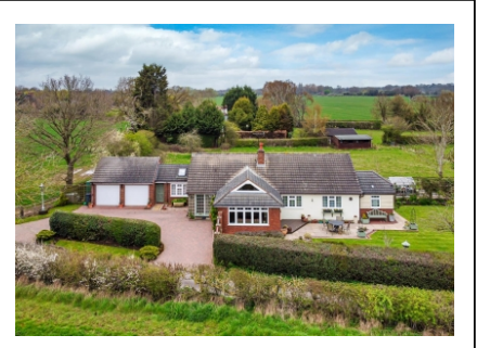
Holly Lodge, Church Lane, Boningale, Albrighton