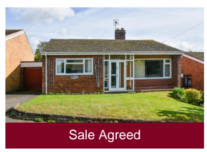
Foxcroft, 8 Fox Close, Seisdon