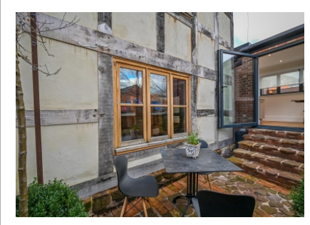
Park Cottage, Abbey Foregate, Shrewsbury