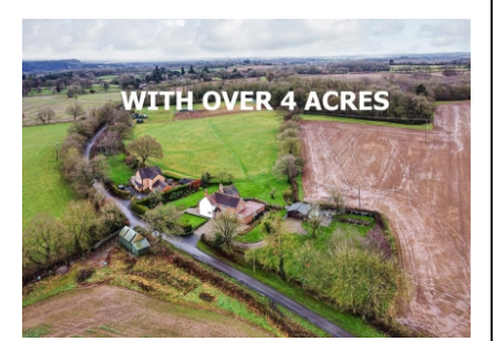
Keepers Cottage, Colemore Green, Bridgnorth