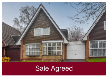
16 Surrey Drive, Finchfield, Wolverhampton