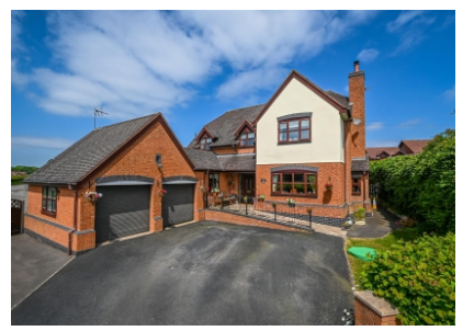
Cape Lodge, Billingsley, Bridgnorth