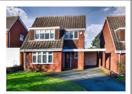
15 Histons Drive, Codsall, Wolverhampton