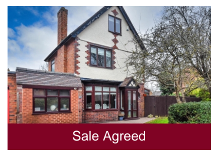
1 Cedar Grove, Bradmore, Wolverhampton