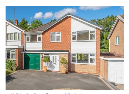
2 Whiteladies Court, Albrighton, Wolverhampton