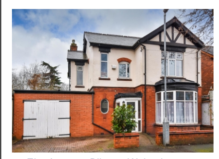
18 Elm Avenue, Bilston, Wolverhampton