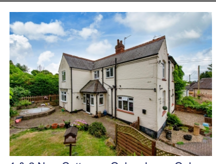
1 & 2 New Cottages, Oaken Lane, Oaken