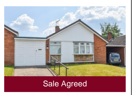
13 The Broadway, Wombourne, Wolverhampton