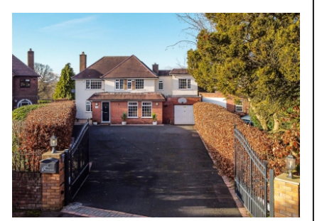
Fern House, Links Avenue, Tettenhall