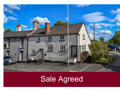
33 Salop St, Bridgnorth