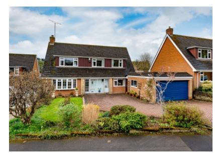
18 Quail Green, Wightwick, Wolverhampton