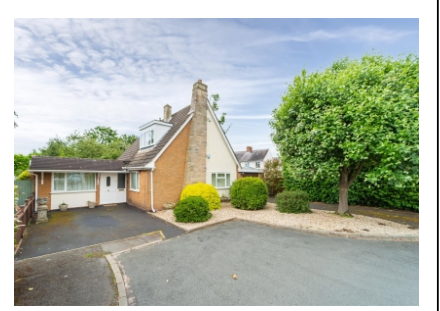
8 The Orchard, Albrighton