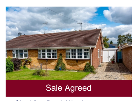
68 Clee View Road, Wombourne, Wolverhampton