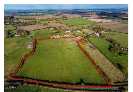
Plot of Land at Former Mill Riding Centre, Warstone Hill Road, Pattingham