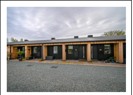
The Willow, 3 The Closes, Sutton Farm, Claverley, Wolverhampton