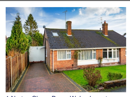
1 Norton Close, Penn, Wolverhampton