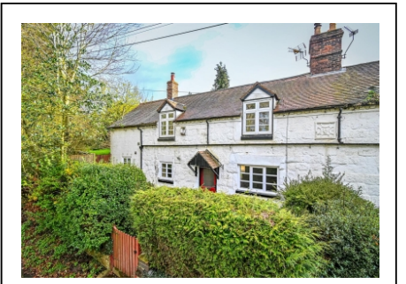
146 Broad Oak, Six Ashes