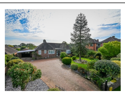
53 Conduit Lane, Bridgnorth