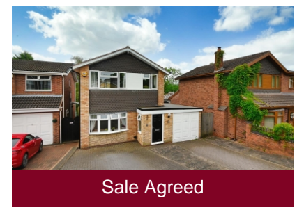
36 Bridge Road, Alveley, Bridgnorth