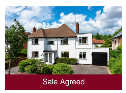
Helford House, Westland Avenue, Compton