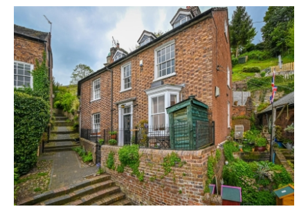
19 St. Marys Steps, Bridgnorth