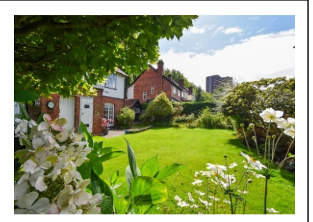
29 Bath Avenue, Wolverhampton