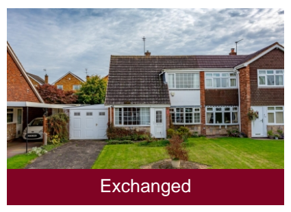
13 Greenfields Road, Wombourne, Wolverhampton