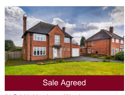
61 Brickbridge Lane, Wombourne, Wolverhampton