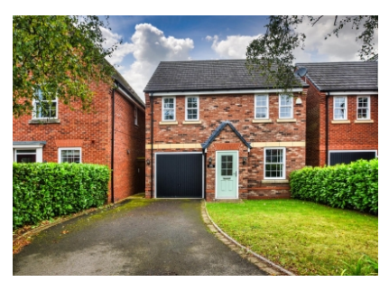
Eden House, Wombourne Road, Swindon, Dudley