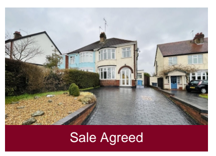
31 Sedgley Road, Penn Common, Penn