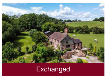
Beggar Hill House, 62 Muckley Cross, Acton Round, Bridgnorth