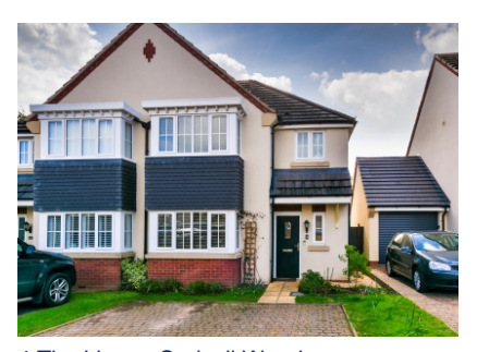
4 The Limes, Codsall Wood, Wolverhampton