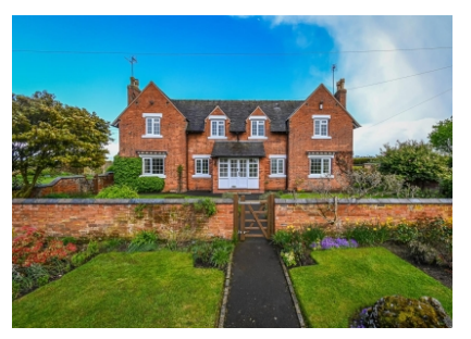
Lower Snowdon Cottage, Snowdon Road, Burnhill Green, Wolverhampton