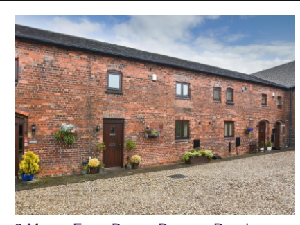
3 Manor Farm Barns, Bognop Road, Essington