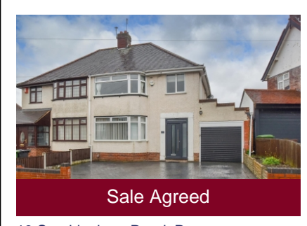
19 Sandringham Road, Penn, Wolverhampton