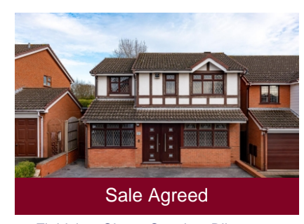
17 Fieldview Close, Coseley, Bilston