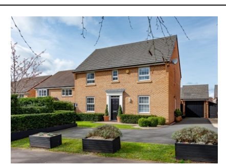
12 Larch Grove, Shifnal