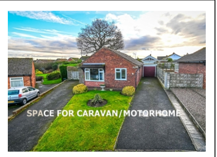
51 Linley View Drive, Bridgnorth