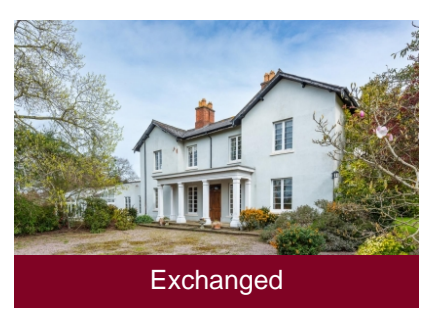
The Oaklands, Lower Rudge, Pattingham