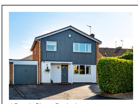
4 Beech Close, Pattingham, Wolverhampton