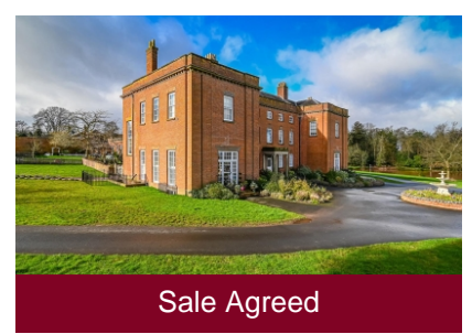
Upper Mill Meadow, Gatacre Hall, Gatacre, Claverley, Wolverhampton