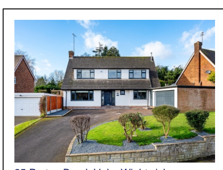
25 Perton Brook Vale, Wightwick