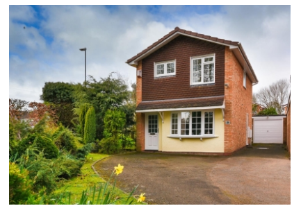
28 Quendale, Wombourne, Wolverhampton