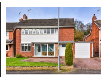
97 Henwood Road, Compton, Wolverhampton