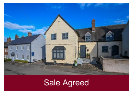
7 Bull Ring, Claverley, Wolverhampton