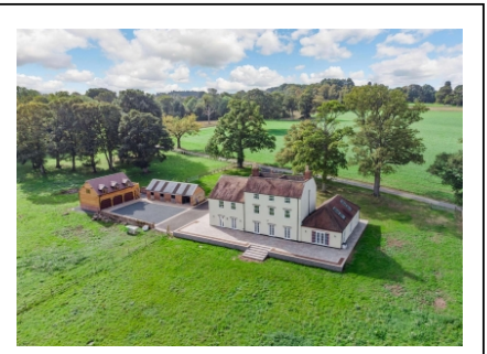
Home Farm, Gatacre, Claverley, Wolverhampton