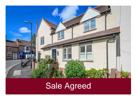
23 Pound Street, Bridgnorth