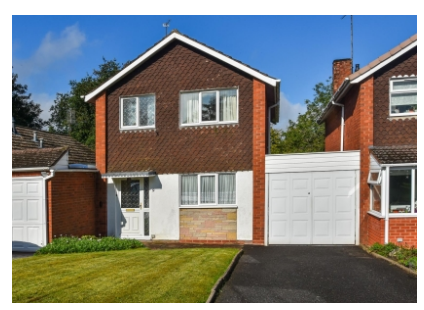
9 Westhill, Wolverhampton