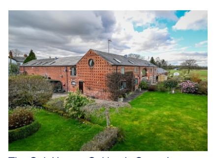
The Oak House, Oaklands Court, Lower Rudge, Pattingham