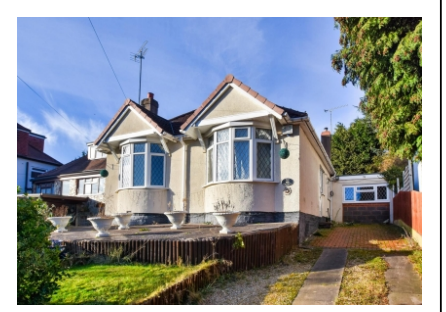
The Chalett, 78 Bridgnorth Road, Compton