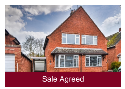
25 Bramber Drive, Wombourne, Wolverhampton