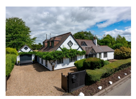
Pennygate, Paradise Lane, Slade Heath, Wolverhampton