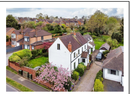
The Crofts and The Cottage, 32 Church Hill, Penn