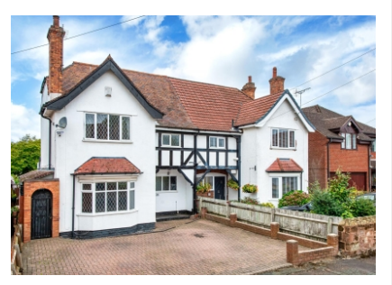
23 Hinckes Road, Tettenhall, Wolverhampton