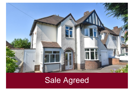
490 Penn Road, Wolverhampton