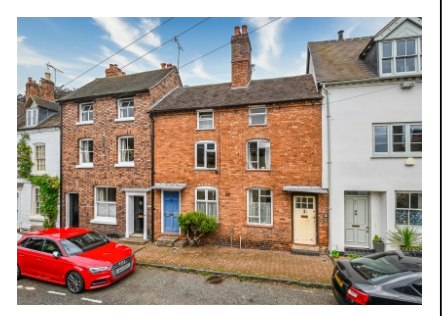
25 St. Marys Street, Bridgnorth