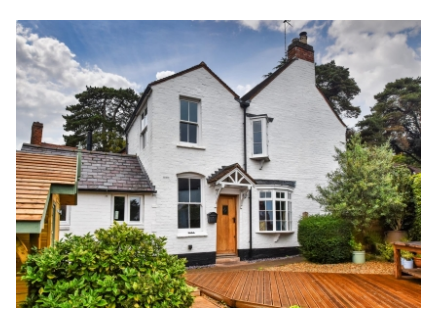
Beech Cottage, 8 The Holloway, Compton