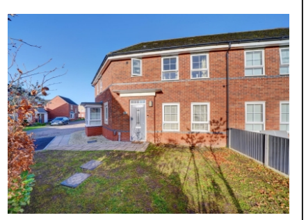
26 Rainsford Crescent, Kidderminster