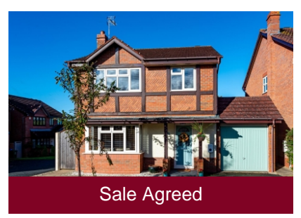
39 Penleigh Gardens, Wombourne, Wolverhampton