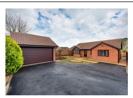
3 Montford Grove, Sedgley, Dudley