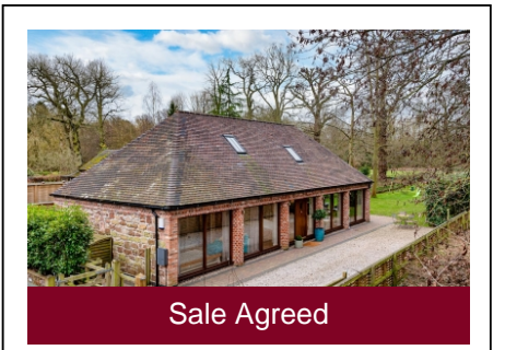
Eagle Barn, 4 Patshull Gardens, Albrighton