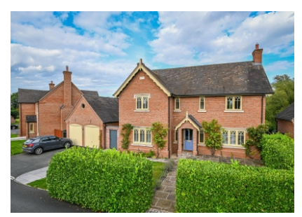
Fitzallen House, 3 Cound Park Drive, Cound, Shrewsbury