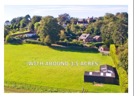
Half Acre House, Stableford, Bridgnorth