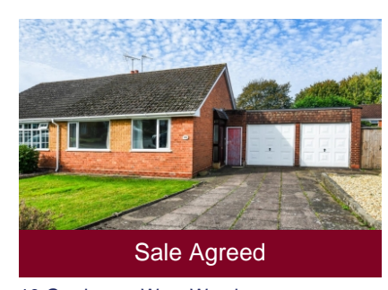
10 Gardeners Way, Wombourne, Wolverhampton