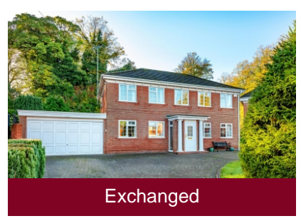
Enderby Drive, Wolverhampton