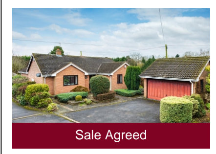
Shadowbrook, 4 Manor Fold, Middle Lane, Oaken