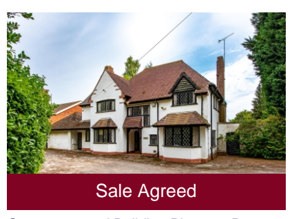
Greenways and Building Plots, 45 Perton Road