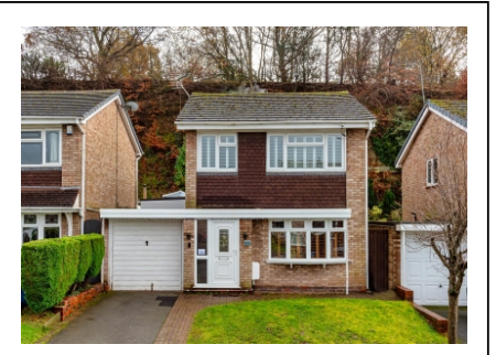
23 Redcliffe Drive, Wombourne, South Stafforshire