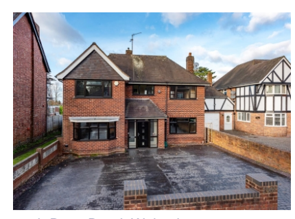
288b Penn Road, Wolverhampton