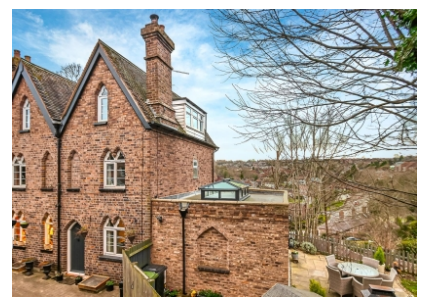
14 West Castle Street, Bridgnorth