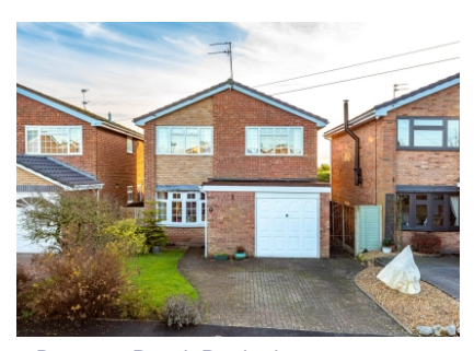
3 Braemar Road, Pattingham, Wolverhampton