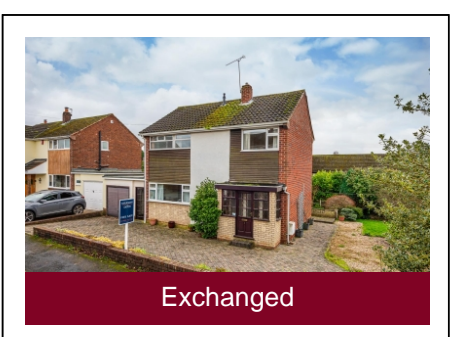
3 Newgate, Pattingham, Wolverhampton