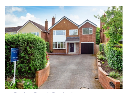
18 Rudge Road, Pattingham, Wolverhampton