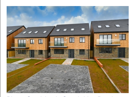
Plot 3, Sandybank, Stourbridge Road, Wootton, Bridgnorth