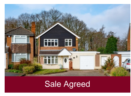
12 Hopstone Gardens, Penn, Wolverhampton