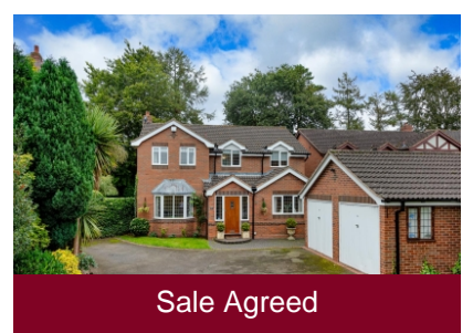
17 Hall End Lane, Pattingham, Wolverhampton