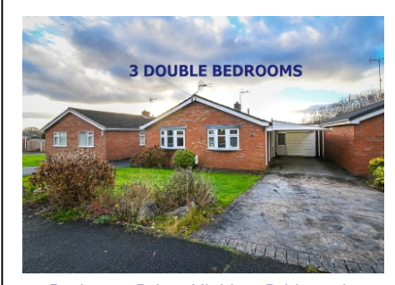
12 Redstone Drive, Highley, Bridgnorth