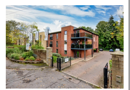
6 Thorneycroft, Wood Road, Tettenhall