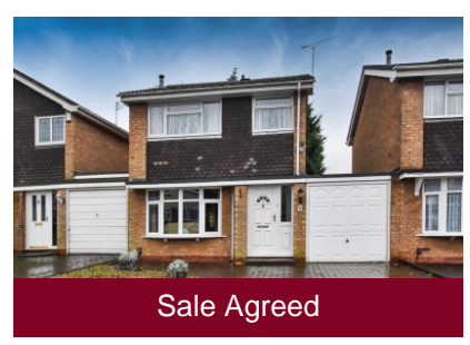
84 Bellencroft Gardens, Wolverhampton