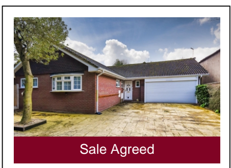
28a Mount Road, Mount Road, Tettenhall Wood