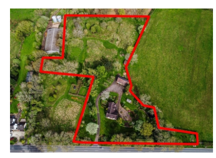
Dodds Green Cottage, 79 Dodds Green, Alveley, Bridgnorth