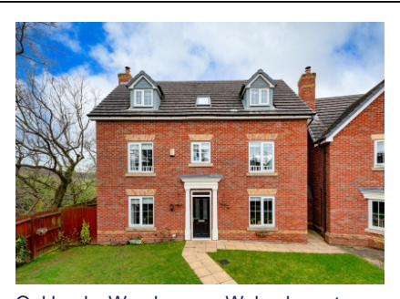
Oaklands, Wombourne, Wolverhampton