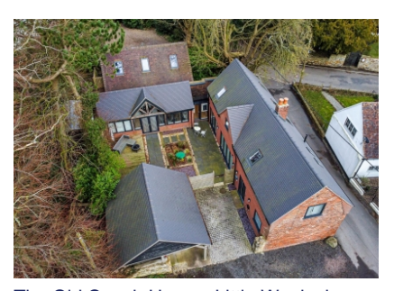
The Old Coach House, Little Wenlock, Telford