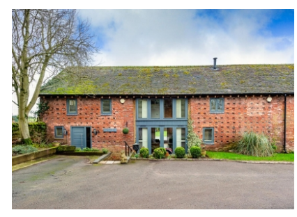
Clee View Barn, Westbeech Road, Pattingham, Wolverhampton