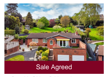
18 Bramble Ridge, Bridgnorth