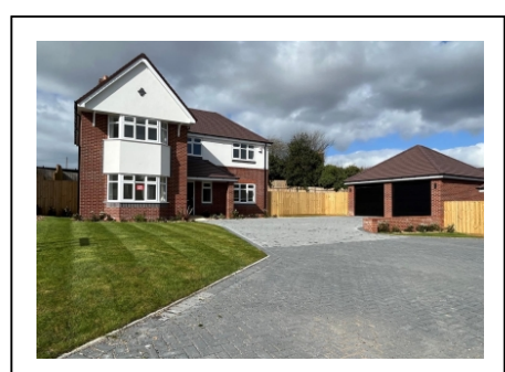
Rosewood House, 6 Rowan Grange, Broseley