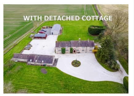
Lower Westwood Farm, Stretton Westwood, Much Wenlock