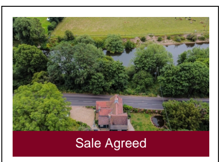
Holme Cottage, Knowle Sands, Bridgnorth