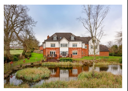
4 Albrighton House, The Water Gardens, Wolverhampton