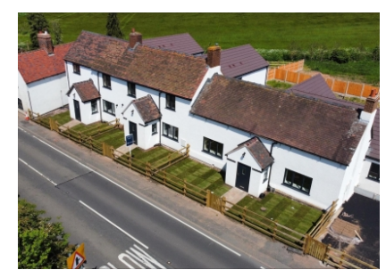
1 Ackleton Meadows, Stableford, Bridgnorth