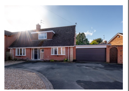
Strathmore, Shaw Lane, Albrighton