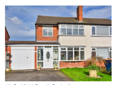
12 Oakfield Road, Codsall, Wolverhampton