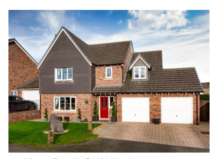
41 Kings Road, Calf Heath, Wolverhampton