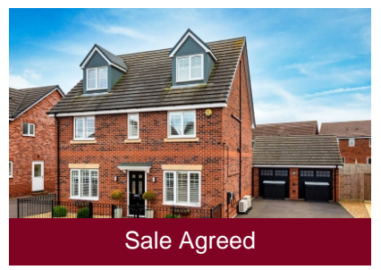
43 Farran Drive, Codsall, Wolverhampton