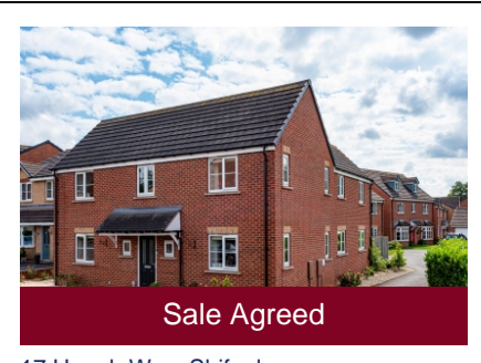
17 Hough Way, Shifnal