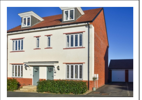
11 Marshall Way, Codsall, Wolverhampton