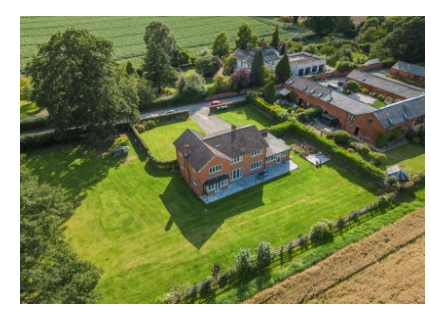
Oaklands Farm, Lower Rudge, Pattingham, Wolverhampton