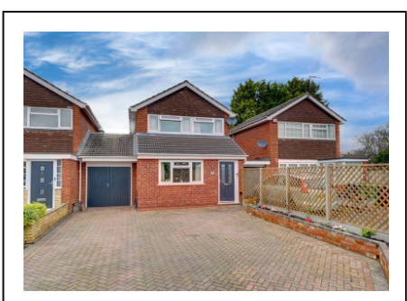
Elderberry Close, Stourport-On-Severn