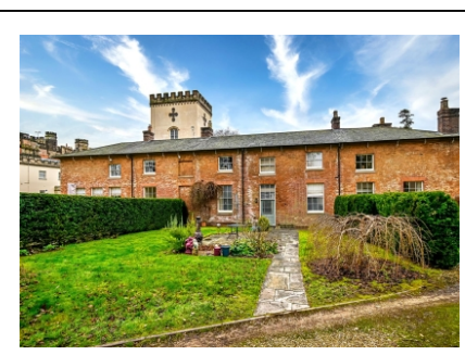
2 Apley Park Mews, Apley, Bridgnorth