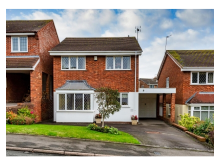
2 Woodthorne Close, Lower Gornal, Dudley