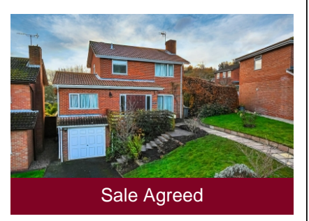
15 Bramble Ridge, Bridgnorth