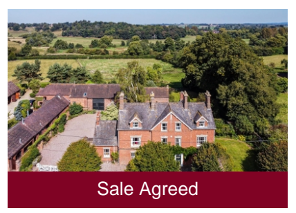
Roughton Farmhouse, Roughton, Bridgnorth