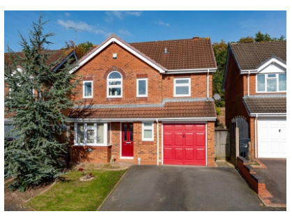
12 Dudmaston Way, Milking Bank, Dudley