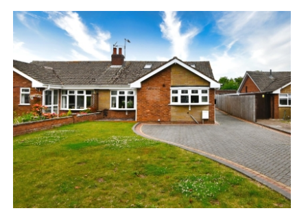
6 Lime Close, Alveley, Bridgnorth