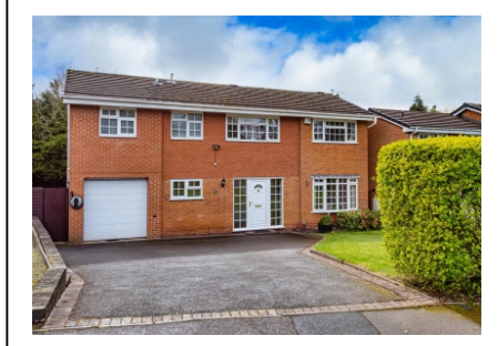
11 Swallowdale, Wightwick, Wolverhampton