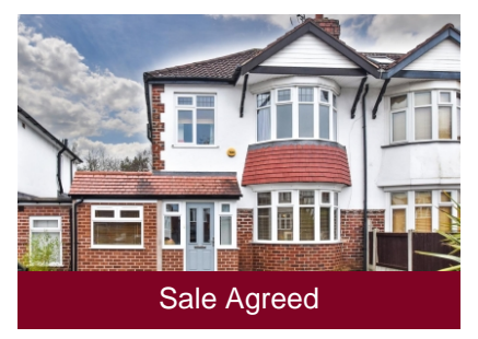
103 Windsor Avenue, Penn, Wolverhampton