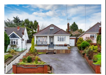
74 Bridgnorth Road, Compton