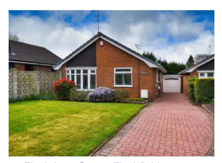
19 Finchdene Grove, Finchfield, Wolverhampton