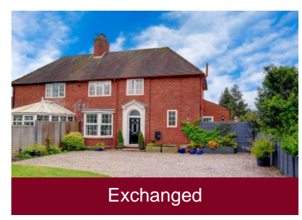
Bromyard road, Worcester