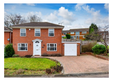
2 Heath House Drive, Wombourne, Wolverhampton