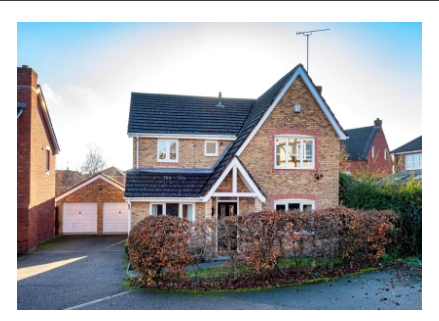
17 Holendene Way, Wombourne, Wolverhampton