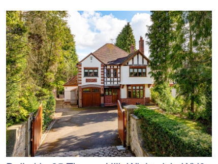
Dalkeith, 25 Tinacre Hill, Wightwick, WV6 8DB