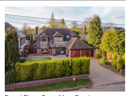
Broad Elms, Great Moor Road, Pattingham