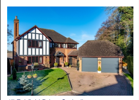
47 Fairfield Drive, Codsall, Wolverhampton