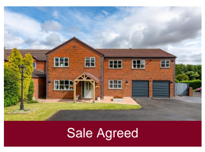
3 Mill Stream Close, Codsall, Wolverhampton