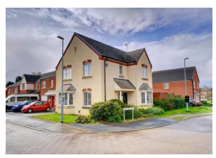
Greatwich Way, Kidderminster