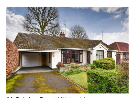
30 Sabrina Road, Wightwick, Wolverhampton