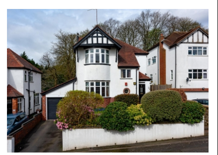
Tudor Crescent, Wolverhampton