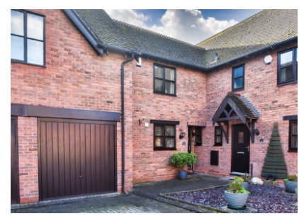
17 Bridgeman Court, Weston-Under-Lizard, Shifnal