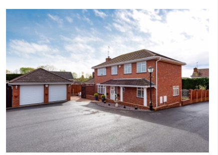
St. Johns Close, Swindon, Dudley