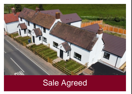
2 Ackleton Meadows, Stableford, Bridgnorth