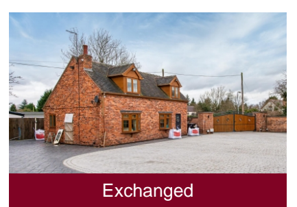
Granary Cottage, Dark Lane, Cross Green, Wolverhampton