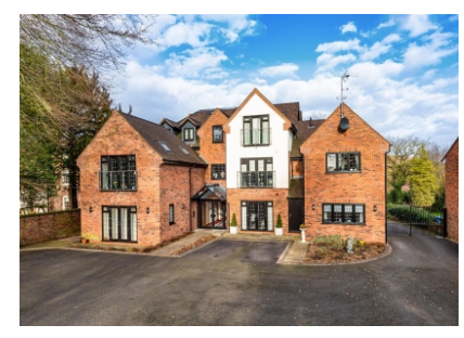
3 The Gables, Seisdon Road, Trysull, Wolverhampton