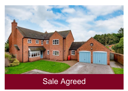
Rivendell, Park Lane, Lapley, Stafford