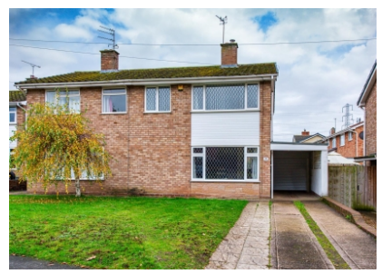
36 Wombourne Road, Swindon, Dudley