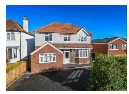
109 Victoria Road, Bridgnorth