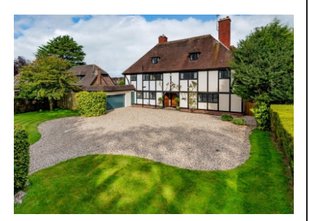
Findon, Haughton Lane, Shifnal