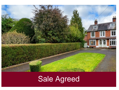
Fernleigh, 35 Oaken Lanes, Codsall