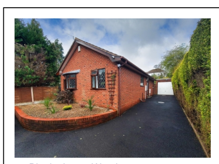
10 Planks Lane, Wombourne, Wolverhampton