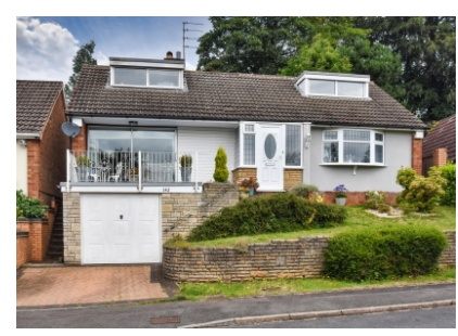
142 Bridgnorth Road, Wolverhampton