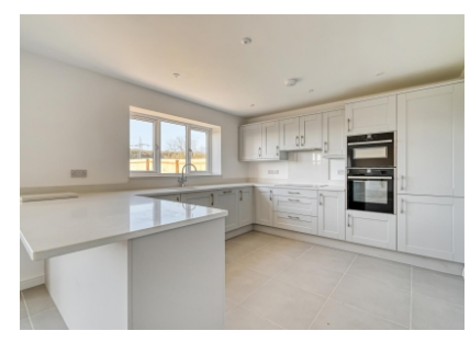
Green Acres, 3 Rowan Grange, Broseley