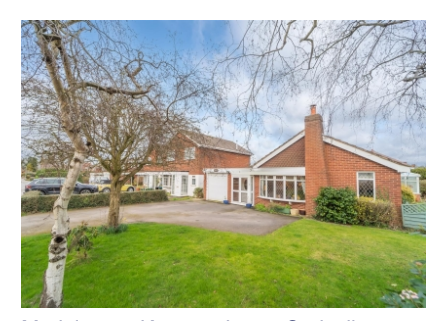
Madeira, 45 Keepers Lane, Codsall, Wolverhampton