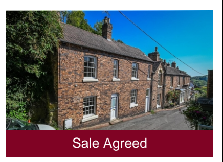
25 Church Hill, Ironbridge, Telford