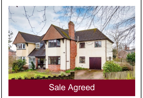
The Homestead, Westland Avenue, Compton