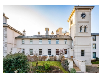
2 Old Hall, Wergs Hall Road, Tettenhall