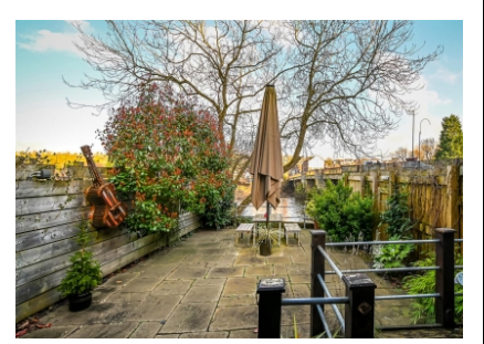
45 Cartway, Bridgnorth