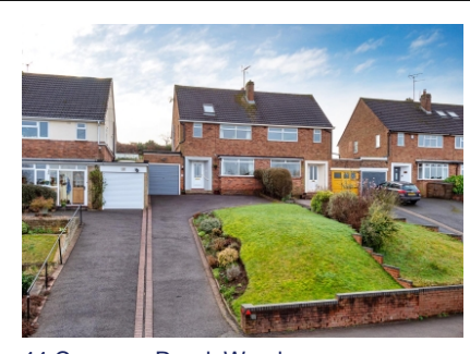
44 Common Road, Wombourne, Wolverhampton