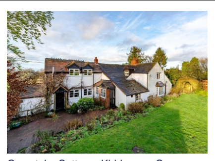
Greystoke Cottage, Kiddemore Green, Brewood