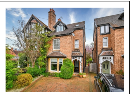
7 Westgate Villas, Salop Street, Bridgnorth