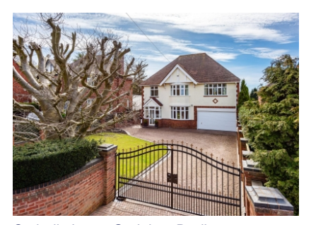
Catholic Lane, Sedgley, Dudley