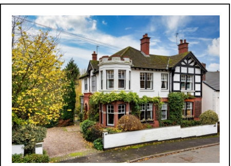
Battlefield House, 14 Battlefield Hill, Wombourne, Wolverhampton