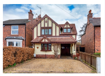
25 Walk Lane, Wombourne, Wolverhampton