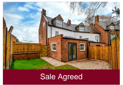
4 Rudge Road, Pattingham, Wolverhampton