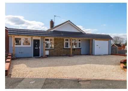
21 Uplands Drive, Wombourne, Wolverhampton