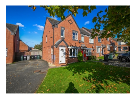
8 Ridley Close, Bridgnorth