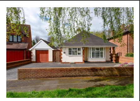
19 Foley Avenue, Tettenhall, Wolverhampton