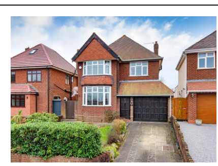
15 Foxlands Avenue, Wolverhampton