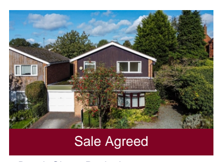
2 Beech Close, Pattingham, Wolverhampton