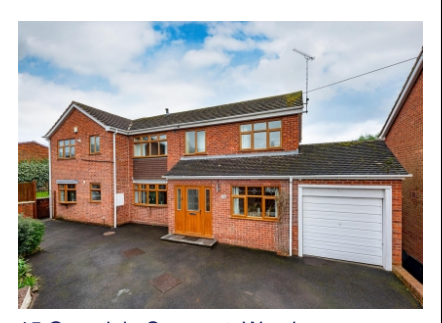
15 Ounsdale Crescent, Wombourne, Wolverhampton