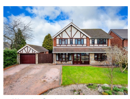
11 Waverley Gardens, Wombourne, Wolverhampton