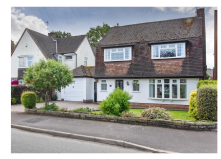
57 Oaken Park, Codsall, Wolverhampton