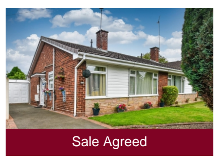
10 Wombourne Road, Swindon, Dudley