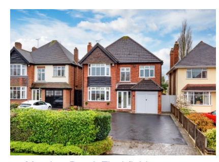
39 Meadow Road, Finchfield