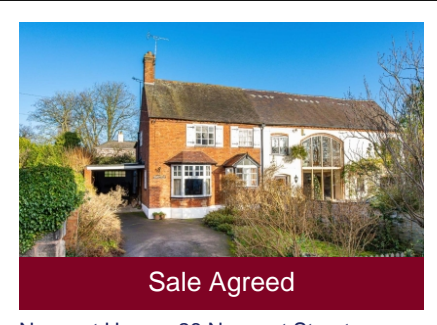
Newport House, 28 Newport Street, Brewood