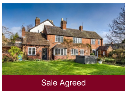
Vine Cottage, 36-38 Church Road, Codsall