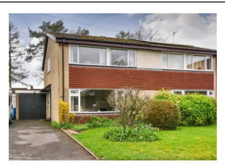
32 The Greenway, Pattingham, Wolverhampton