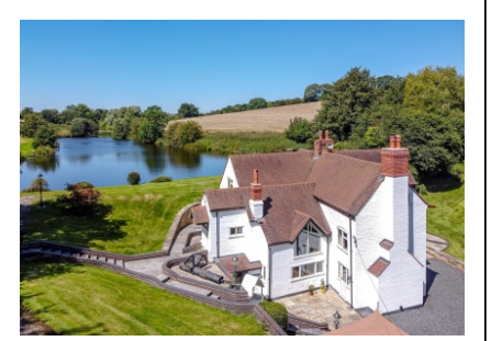
Hem Mill, The Hem, Shifnal