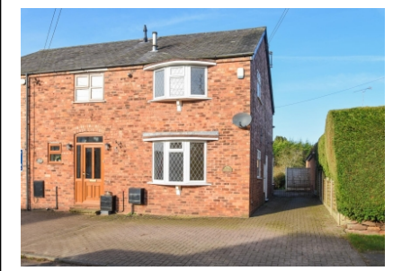
The Rambles, 16 Shop Lane, Oaken