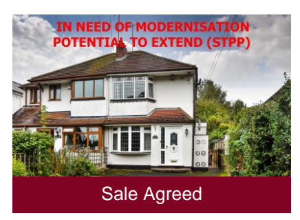
Hillcroft, Penstone Lane, Lower Penn