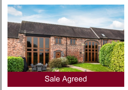
The Corn Barn, 3 East Trescott Barns Bridgnorth Road