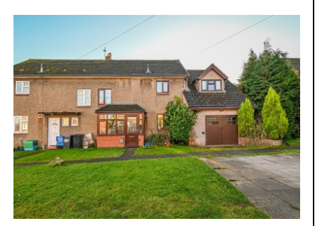
74 The Hobbins, Bridgnorth