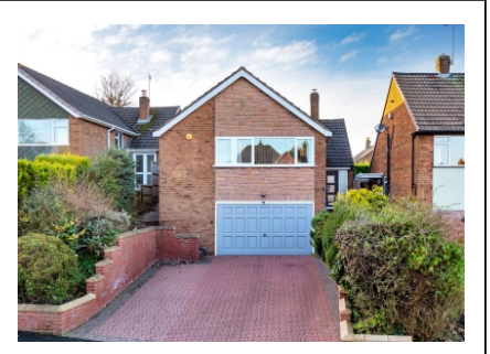
52 Church Hill, Penn, Wolverhampton