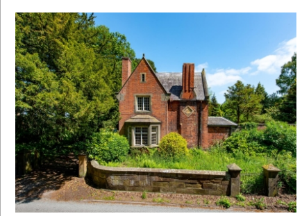
Wergs Hall Gardens, Wergs Hall Road, Tettenhall