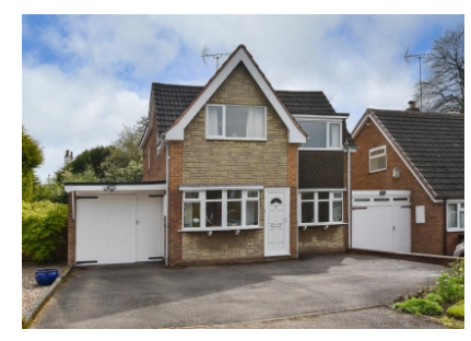
56 Bantock Gardens, Finchfield