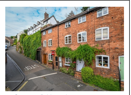
70 Cartway, Bridgnorth