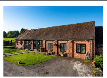
Barn End, Codsall Road, Palmers Cross, Wolverhampton