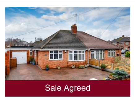
13 Kirkstone Crescent, Wombourne, Wolverhampton