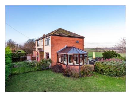
Longmoor House, Billingsley, Bridgnorth