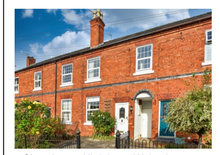
3 Shaw Lane, Albrighton, Wolverhampton