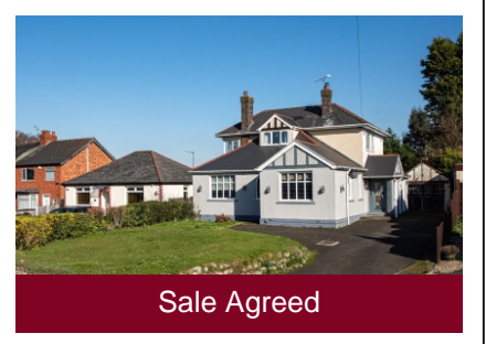
153 Trysull Road, Merry Hill, Wolverhampton