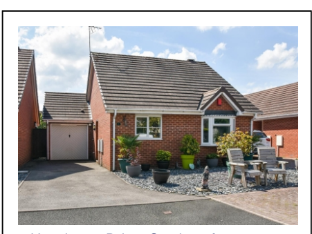
4 Hazelmere Drive, Castlecroft, Wolverhampton