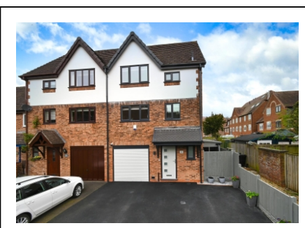
2 King Charles Way, Bridgnorth