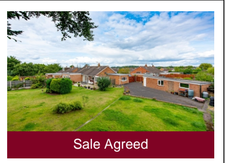
7 Blakeley Heath Drive, Wombourne, Wolverhampton