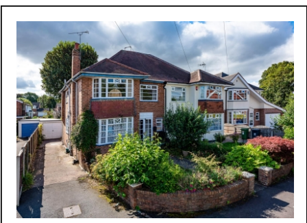
7 Newbridge Gardens, Newbridge, Wolverhampton