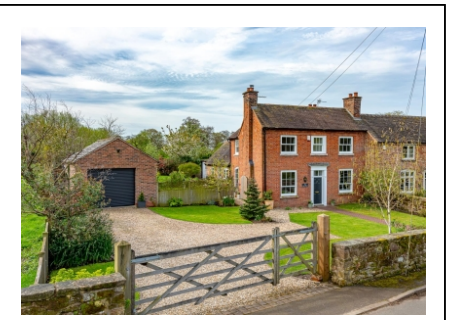
The Little House, 7 Tong Norton, Shifnal