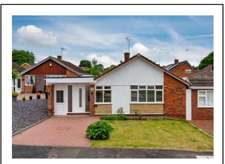
4 Mayfair Close, Albrighton, Wolverhampton