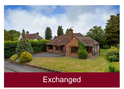
Spring View, Haughton Lane, Shifnal