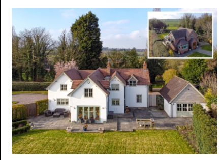
Oaklea and The Cottage, Damson Lane, Weston Heath, Shifnal