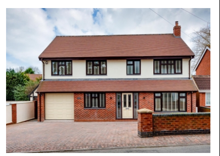
Ravenscroft, Bell Road, Trysull, Wolverhampton