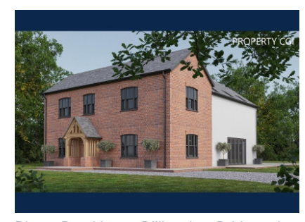
Plot 1, Bynd Lane, Billingsley, Bridgnorth