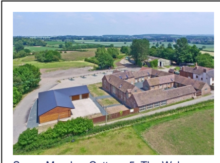
Saxon Meadow Cottage 5, The Wyke, Shifnal