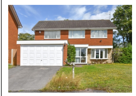
4 The Heathlands, Wombourne, Wolverhampton