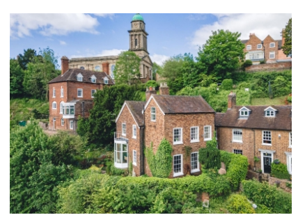
Castle Cliffe House, 24 St. Mary's Steps, Bridgnorth