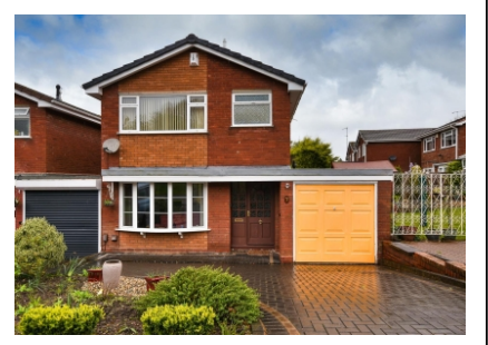
7 Marlborough Gardens, Newbridge, Wolverhampton