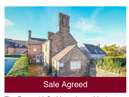
The Forge, 13 St. Marys Lane, Much Wenlock