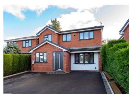
41 Ascot Drive, Dudley