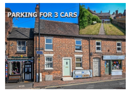
50 Whitburn Street, Bridgnorth