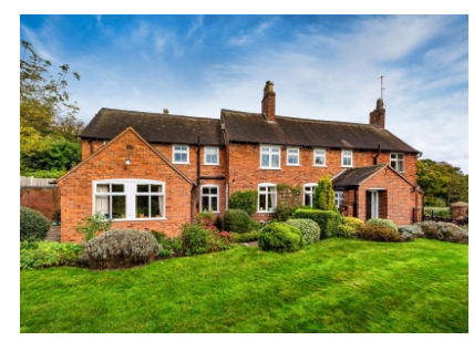
Pound Cottage, 8 School Road, Himley, Dudley