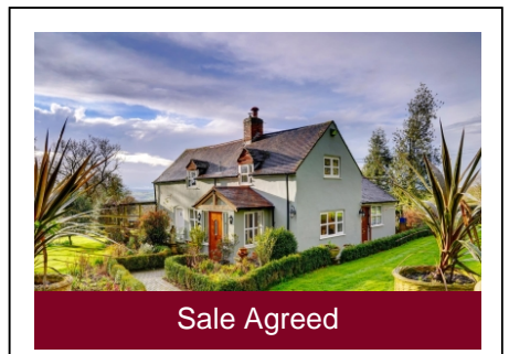
Trimpley Lane, Shatterford, Bewdley