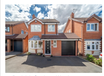
23 Penleigh Gardens, Wombourne