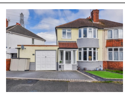
56 Hilston Avenue, Penn, Wolverhampton