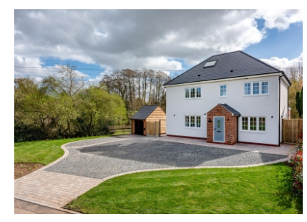
Holly Cottage, Wolverhampton Road, Pattingham