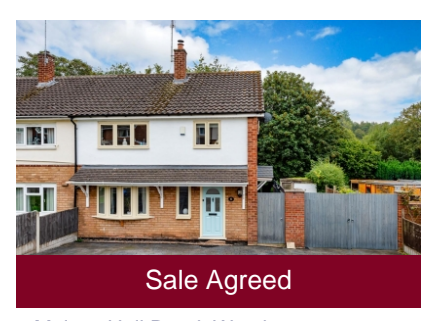
6 Moises Hall Road, Wombourne, Wolverhampton