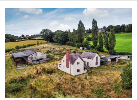
Robins Nest Farm, Dirty Foot Lane, Lower Penn, Wolverhampton