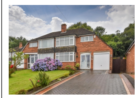
4 Chase View, Ettingshall Park, Wolverhampton