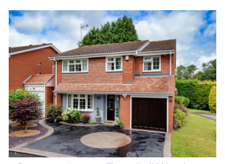
2 Brompton Lawns, Tettenhall Wood, Wolverhampton