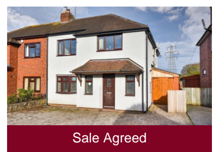
44 Market Lane, Lower Penn, Wolverhampton