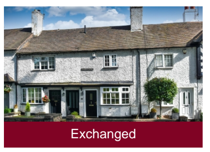
8 Codsall Road, Tettenhall, Wolverhampton