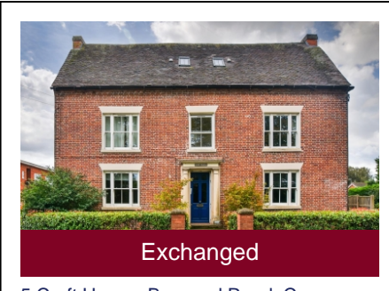
5 Croft House, Brewood Road, Coven