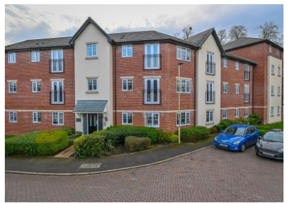
25 Greyfriars House, Stourbridge Road, Bridgnorth