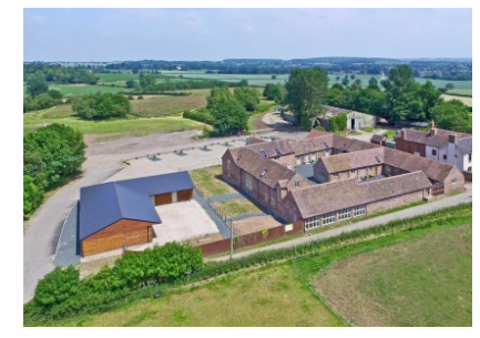
Saxon Meadow Cottage 5, The Wyke, Shifnal