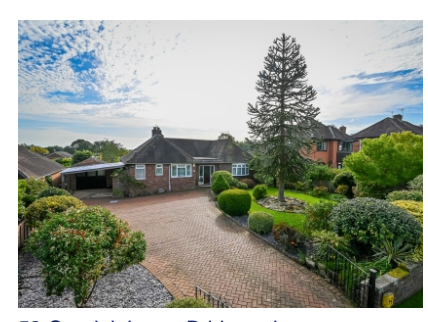
53 Conduit Lane, Bridgnorth