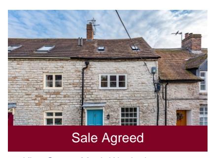
5a King Street, Much Wenlock, Shropshire