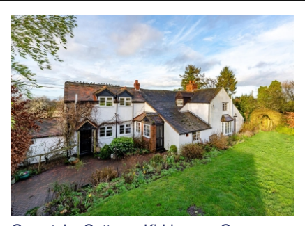
Greystoke Cottage, Kiddemore Green, Brewood