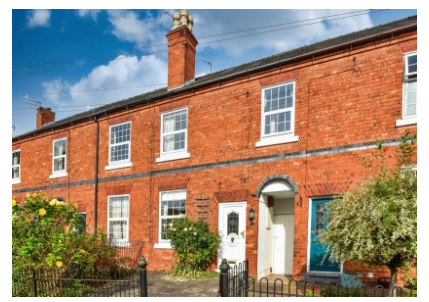
3 Shaw Lane, Albrighton, Wolverhampton