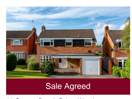
11 Copper Beech Drive, Wombourne, Wolverhampton