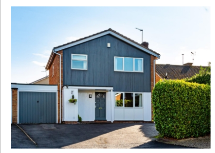
4 Beech Close, Pattingham, Wolverhampton