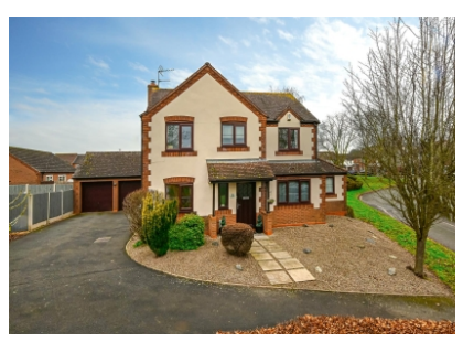
3 Danesbrook, Claverley, Wolverhampton