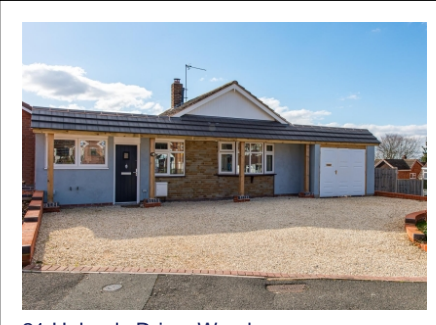
21 Uplands Drive, Wombourne, Wolverhampton