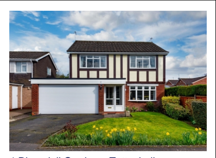
4 Rivendell Gardens, Tettenhall