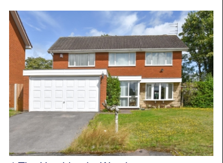
4 The Heathlands, Wombourne, Wolverhampton