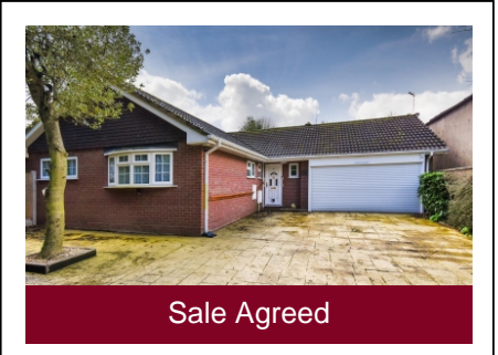
28a Mount Road, Mount Road, Tettenhall Wood