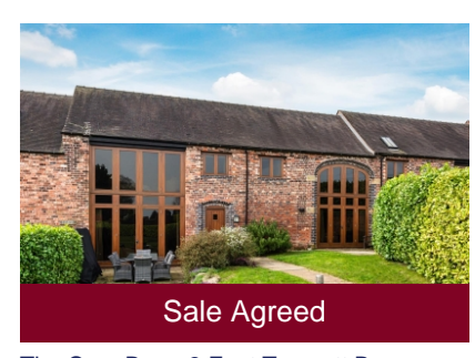
The Corn Barn, 3 East Trescott Barns Bridgnorth Road