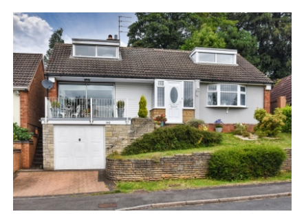
142 Bridgnorth Road, Wolverhampton