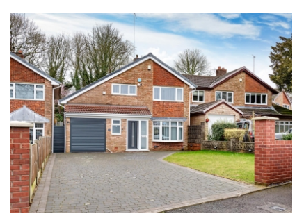
3 St. Marys Close, Dudley