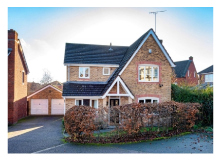
17 Holendene Way, Wombourne, Wolverhampton