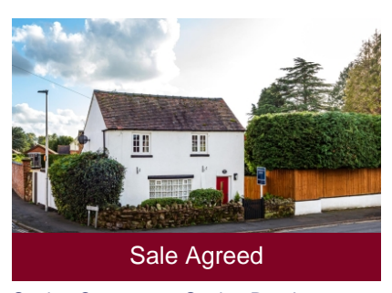
Station Cottage, 58 Station Road, Albrighton