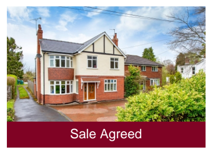
74 Langley Road, Wolverhampton