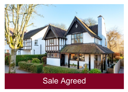
Far Croft, 19 Newbridge Avenue, Newbridge