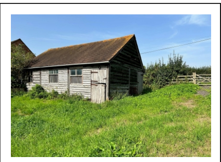
Spring Barn, Glazeley, Bridgnorth