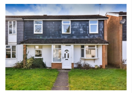
11 Woodside, Ashmore Park, Wolverhampton