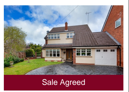
7 The Beeches, Seisdon, Wolverhampton