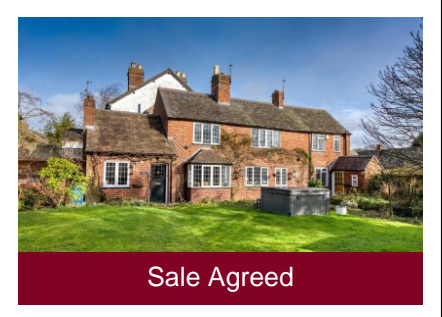
Vine Cottage, 36-38 Church Road, Codsall