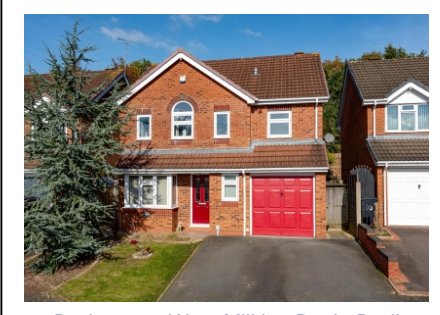
12 Dudmaston Way, Milking Bank, Dudley