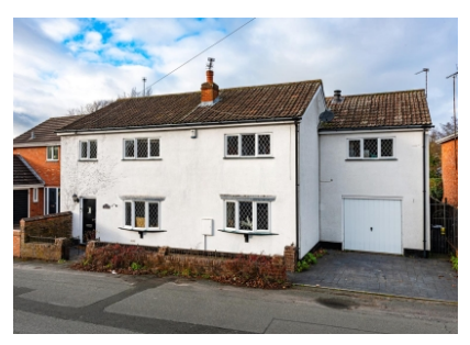
109 Rookery Road, Wombourne, Wolverhampton