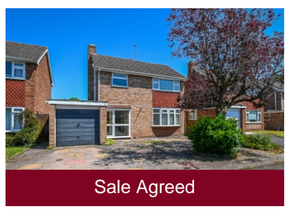
14 The Orchard, Albrighton, Wolverhampton