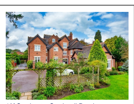
18f Southgate, Stockwell Road, Tettenhall, Wolverhampton