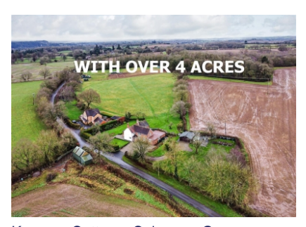
Keepers Cottage, Colemore Green, Bridgnorth