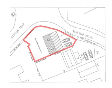
Land to the North of 15 Redford Drive, Albrighton