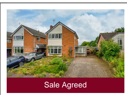
49 Oldbury Wells, Bridgnorth