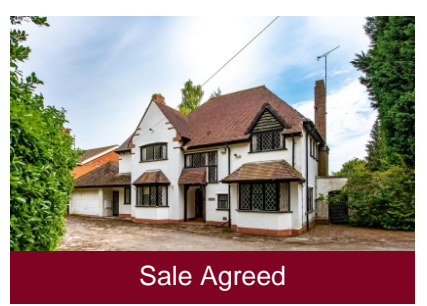
Greenways and Building Plots, 45 Perton Road