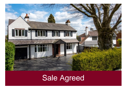
94 Codsall Road, Tettenhall, Wolverhampton