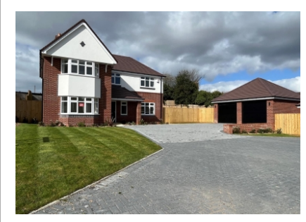
Rosewood House, 6 Rowan Grange, Broseley