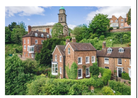
Castle Cliffe House, 24 St. Mary's Steps, Bridgnorth