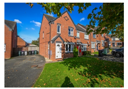
8 Ridley Close, Bridgnorth