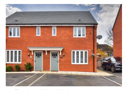
35 Foxglove Way, Himley