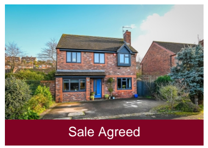
10 Washbrook Road, Bridgnorth