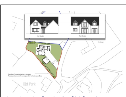
Land on the South of 2 Old Coppice Grange, Old Park, Telford