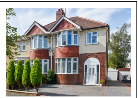
28 Links Road, Penn, Wolverhampton