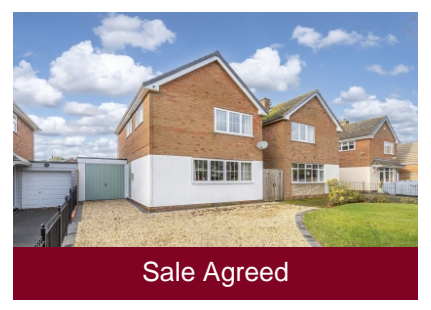
48 Clive Road, Pattingham, Wolverhampton