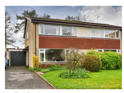
32 The Greenway, Pattingham, Wolverhampton