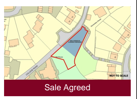
College Road, Tettenhall, Wolverhampton