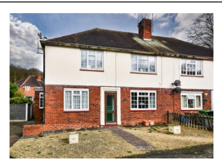
73 Meadow Lane, Wombourne, Wolverhampton