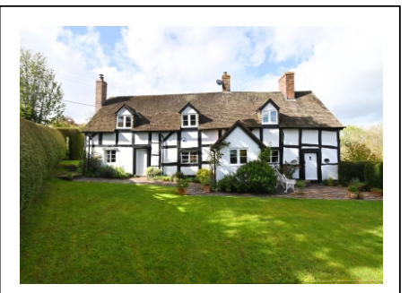
Clovers, Stableford, Bridgnorth