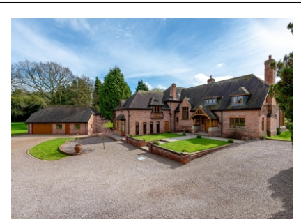
Meadowcroft, Pitchcroft Lane, Chetwynd Aston, Newport