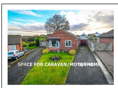
51 Linley View Drive, Bridgnorth