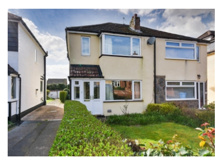
36 Hall End Lane, Pattingham, Wolverhampton