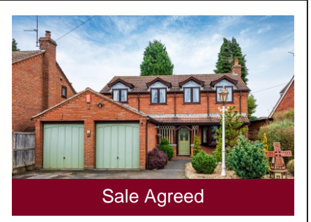
92 Bridgnorth Road, Wombourne, Wolverhampton