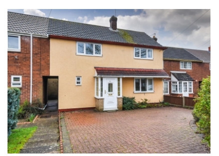
71 Cornwall Road, Tettenhall Wood