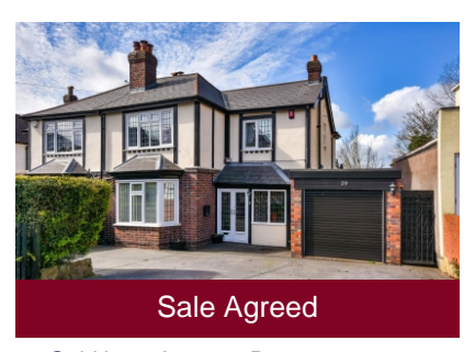
29 Goldthorn Avenue, Penn, Wolverhampton