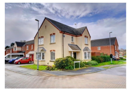
Greatwich Way, Kidderminster