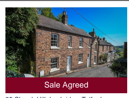
25 Church Hill, Ironbridge, Telford