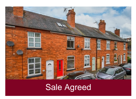
46 Severn Street, Bridgnorth