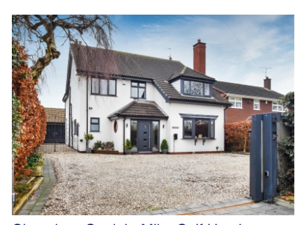
Clearview, Straight Mile, Calf Heath, Wolverhampton