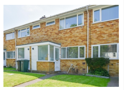
3 Ashfields, High Street, Albrighton