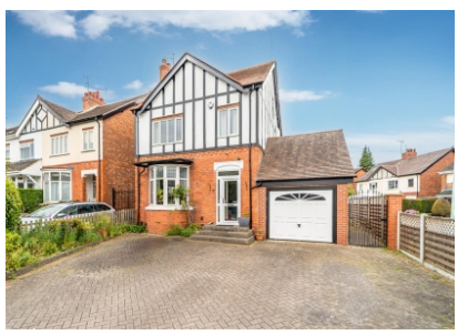
Tregunna, 27 Richmond Road, Finchfield