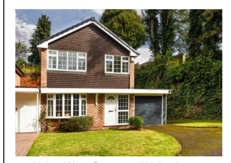
39 Alpine Way, Compton, Wolverhampton