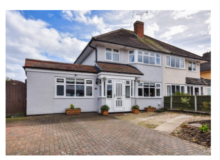
34 Delaware Avenue, Albrighton