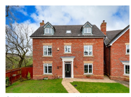
Oaklands, Wombourne, Wolverhampton