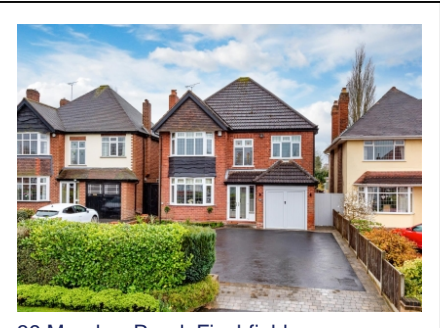
39 Meadow Road, Finchfield