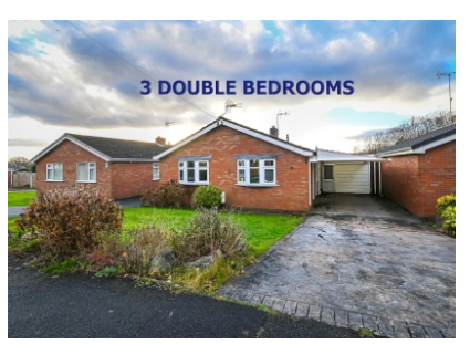
12 Redstone Drive, Highley, Bridgnorth