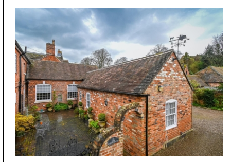
Corner House, 3 Stableford Hall, Stableford, Bridgnorth