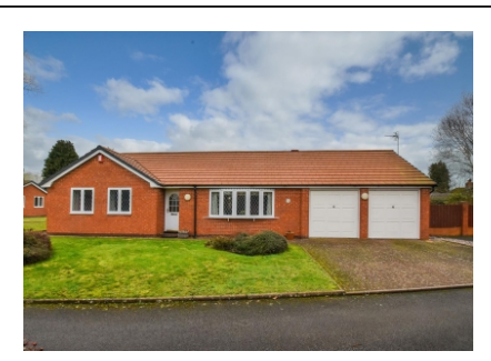
1 The Courts, Albrighton, Wolverhampton