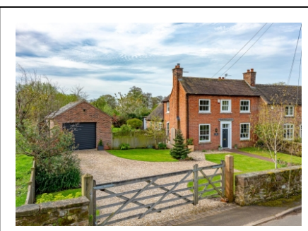
The Little House, 7 Tong Norton, Shifnal