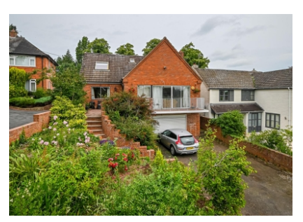
The Tyning, Westgate Drive, Bridgnorth