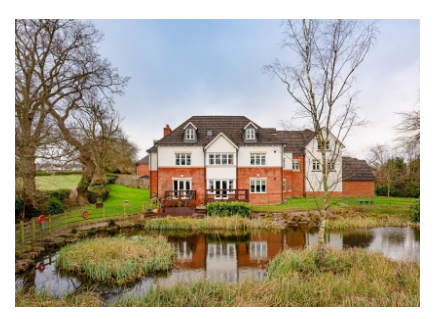
4 Albrighton House, The Water Gardens, Wolverhampton