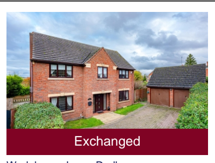
Wodehouse Lane, Dudley