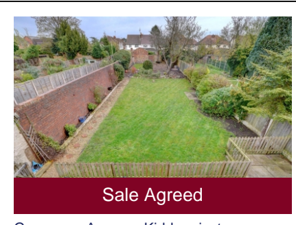
Grosvenor Avenue, Kidderminster