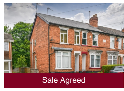
299 & 299a Hordern Road, Whitmore Reans