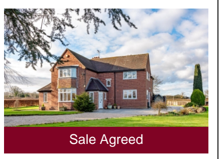
Trentham, Lapley Road, Wheaton Aston