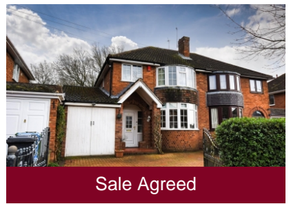
52 Wombourne Park, Wombourne, Wolverhampton