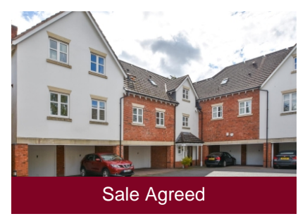
2 Albrighton House, The Water Gardens, Wolverhampton