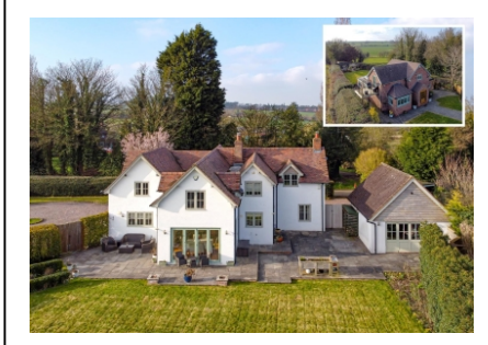
Oaklea and The Cottage, Damson Lane, Weston Heath, Shifnal