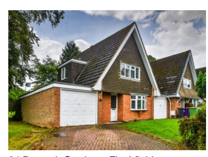
64 Bantock Gardens, Finchfield, Wolverhampton