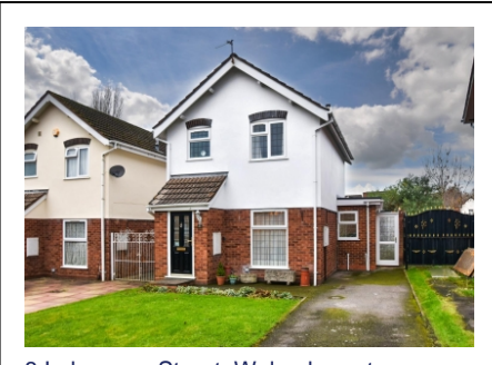
8 Laburnum Street, Wolverhampton