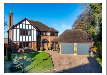
47 Fairfield Drive, Codsall, Wolverhampton