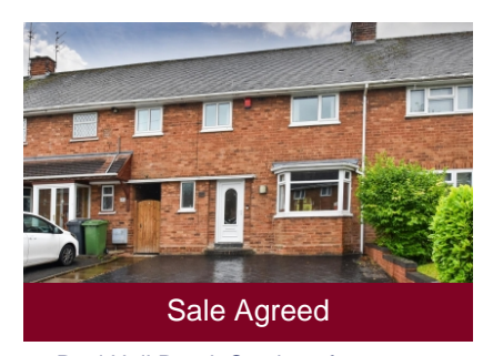
63 Pool Hall Road, Castlecroft, Wolverhampton