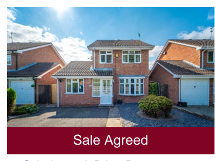
42 Gainsborough Drive, Perton, Wolverhampton