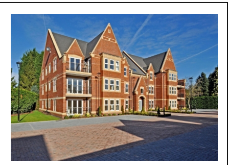
5 Ellen Place, Henry Fowler Drive, Tettenhall