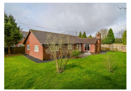
The Old Kiln, Church Lane, Bridgnorth