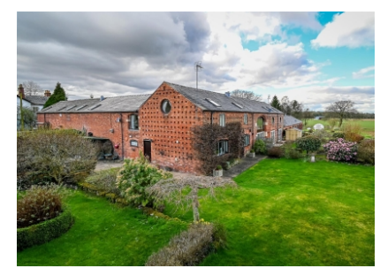
The Oak House, Oaklands Court, Lower Rudge, Pattingham