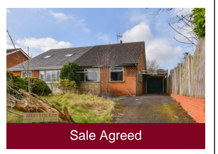
31 Bull Meadow Lane, Wombourne, Wolverhampton