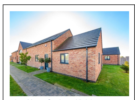
6 Lea Manor Gardens, Albrighton, Wolverhampton