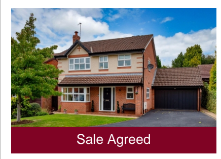
22 Bridgewater Drive, Wombourne, Wolverhampton