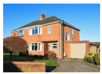
9 Windmill Grove, Kingswinford