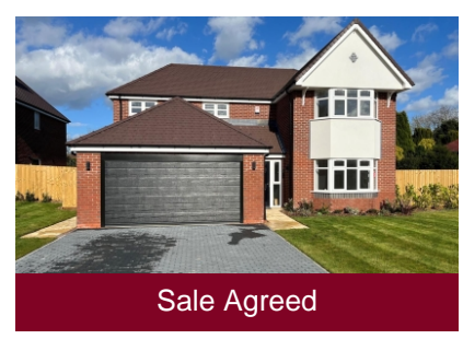
Holly House, 8 Rowan Grange, Broseley