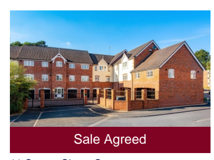
11 Cygnet Close, Compton, Wolverhampton