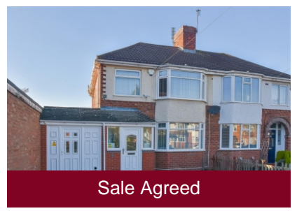
69 Fancourt Avenue, Wolverhampton