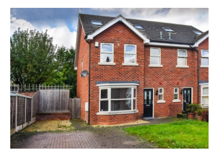
1 Marchant Road, Compton, Wolverhampton