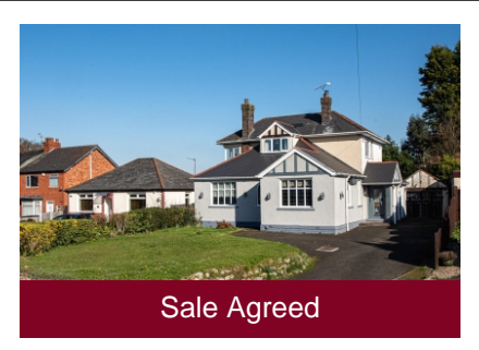
153 Trysull Road, Merry Hill, Wolverhampton