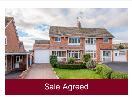
14 Chequers Avenue, Wombourne, Wolverhampton