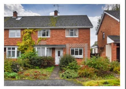
10 Neachless Avenue, Wombourne, Wolverhampton