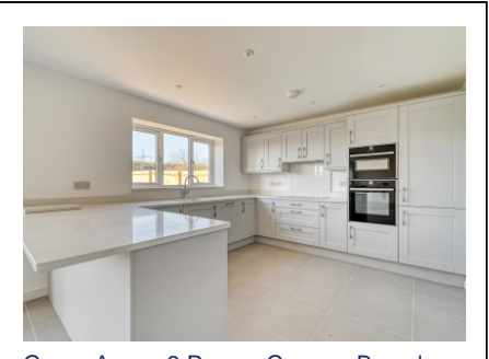
Green Acres, 3 Rowan Grange, Broseley