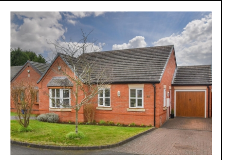
14 Berkeley Close, Perton, Wolverhampton