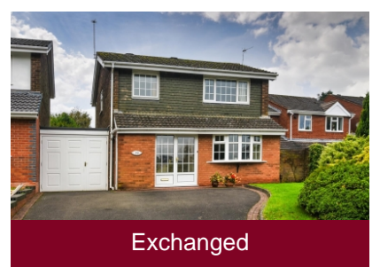
39 Bantock Gardens, Finchfield, Wolverhampton