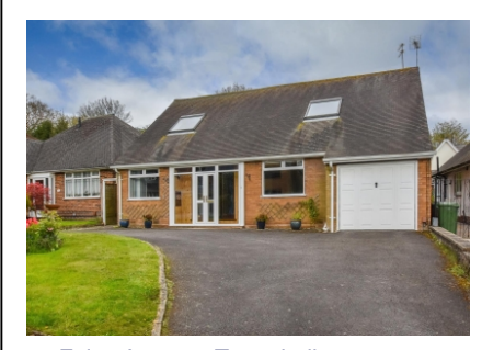
38 Foley Avenue, Tettenhall, Wolverhampton