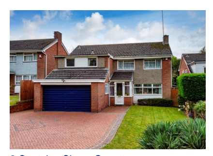
2 Captains Close, Compton, Wolverhampton