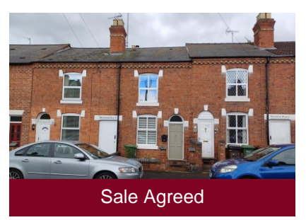
Summerfield Road, Stourport-On-Severn