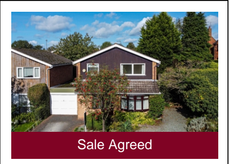
2 Beech Close, Pattingham, Wolverhampton