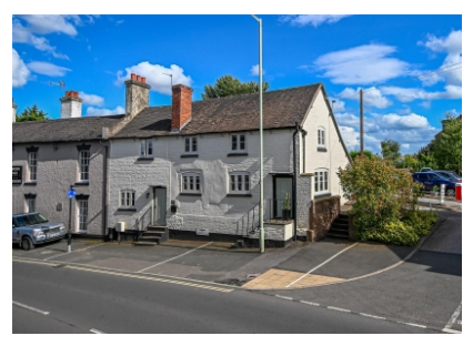
33 Salop St, Bridgnorth