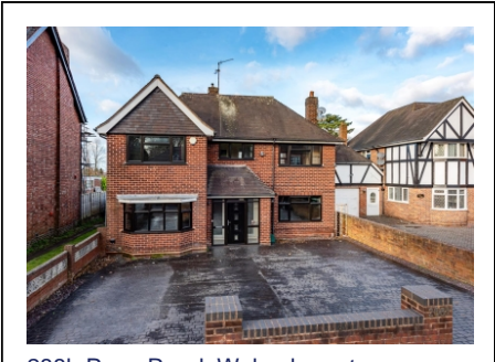
288b Penn Road, Wolverhampton