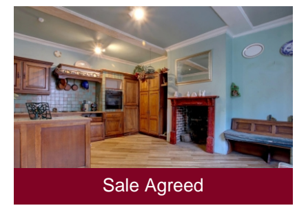
25a High Street, Bewdley