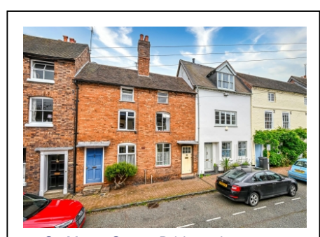
24 St. Marys Street, Bridgnorth