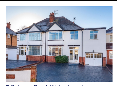
7 Osborne Road, Wolverhampton