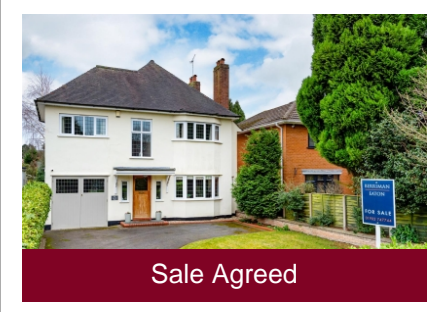
Randolph House, 55 Woodthorne Road, Wolverhampton