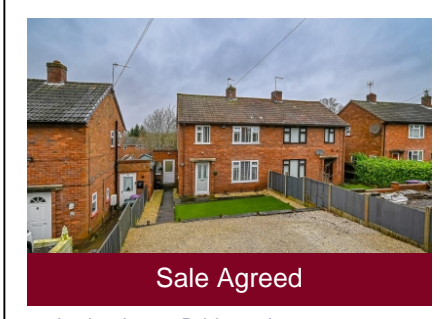
28 Lodge Lane, Bridgnorth