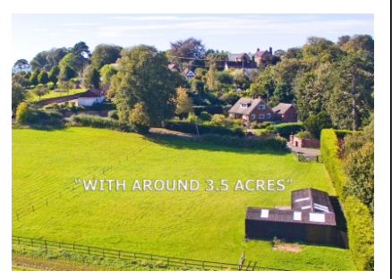
Half Acre House, Stableford, Bridgnorth