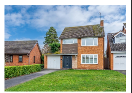
1 Redford Drive, Albrighton