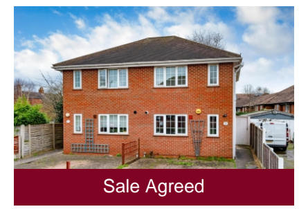
48 Abney Avenue, Albrighton