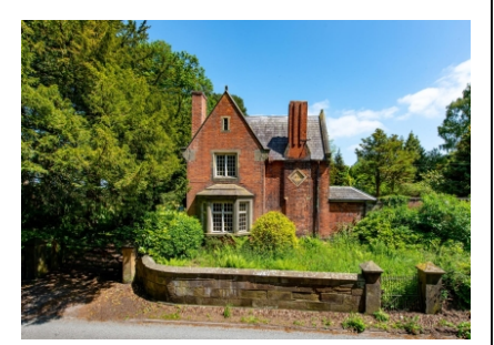
Wergs Hall Gardens, Wergs Hall Road, Tettenhall