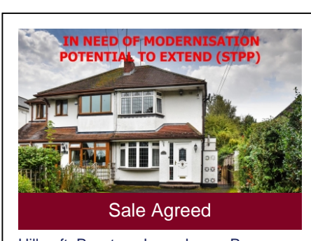
Hillcroft, Penstone Lane, Lower Penn