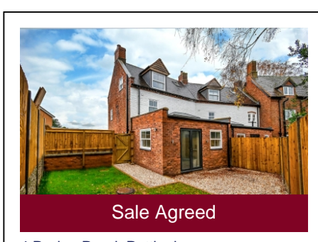
4 Rudge Road, Pattingham, Wolverhampton