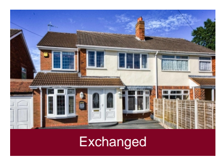
21 Churchfield Close, Coven, Wolverhampton