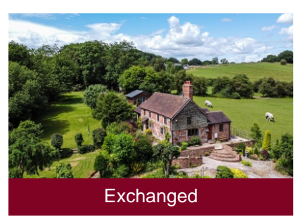
Beggar Hill House, 62 Muckley Cross, Acton Round, Bridgnorth