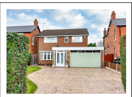
230a Trysull Road, Merry Hill, Wolverhampton