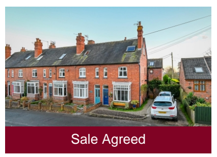
6 Merton Terrace, Oldbury Road, Bridgnorth