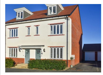
11 Marshall Way, Codsall, Wolverhampton