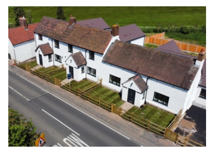
1 Ackleton Meadows, Stableford, Bridgnorth