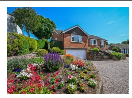
Three Ridges, Hilton, Bridgnorth