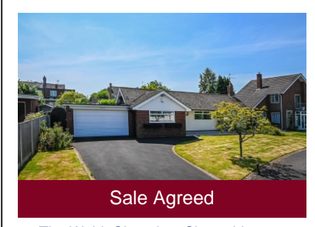
50 The Wold, Claverley, Shropshire