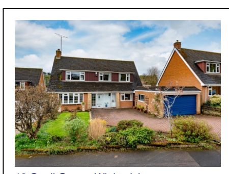
18 Quail Green, Wightwick, Wolverhampton