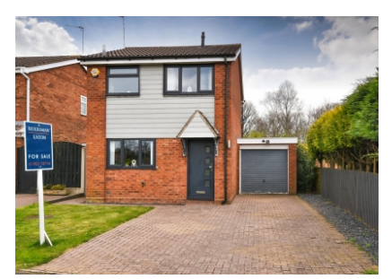
71 Mercia Drive, Perton, Wolverhampton