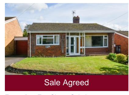
Foxcroft, 8 Fox Close, Seisdon