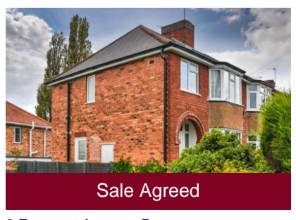
2 Fancourt Avenue, Penn, Wolverhampton