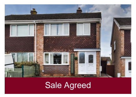
61 Wynchcombe Avenue, Penn, Wolverhampton