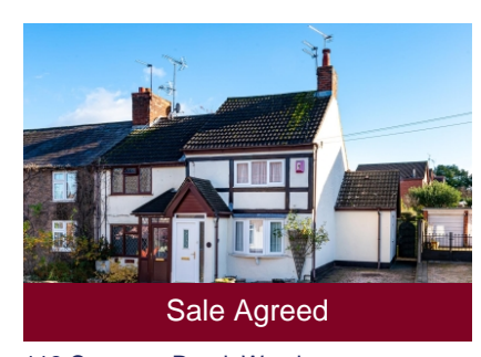
118 Common Road, Wombourne, Wolverhampton