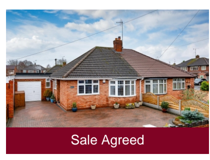
13 Kirkstone Crescent, Wombourne, Wolverhampton