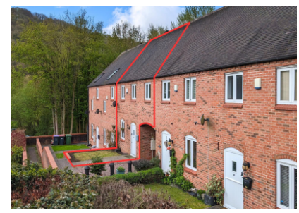
6 The Courtyard, Ironbridge, Telford