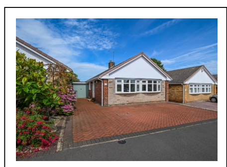
7 Princess Drive, Bridgnorth