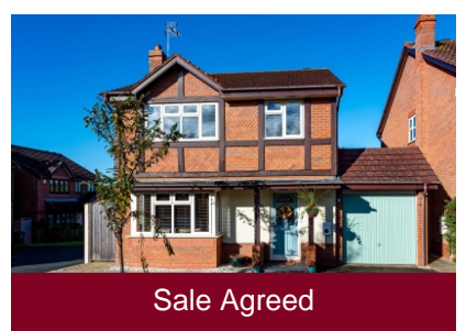
39 Penleigh Gardens, Wombourne, Wolverhampton