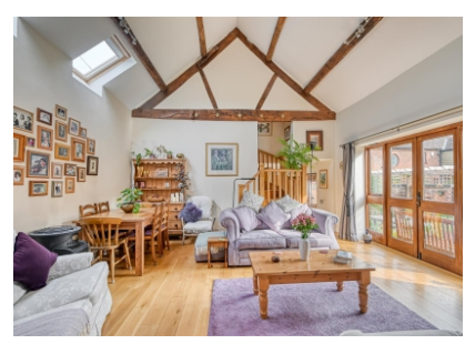
Tedstill Barn, Glazeley, Bridgnorth