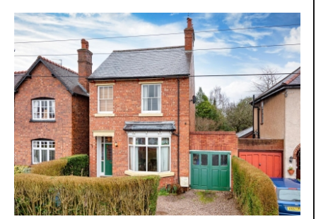
29 Walk Lane, Wombourne