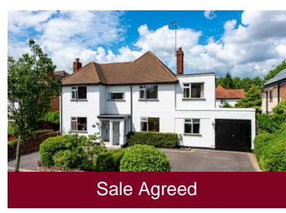
Helford House, Westland Avenue, Compton