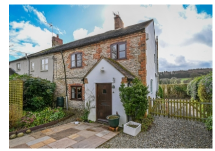
1 The Row, Easthope, Much Wenlock