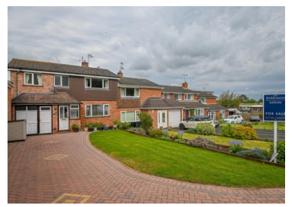
27 Castlefields, Bridgnorth