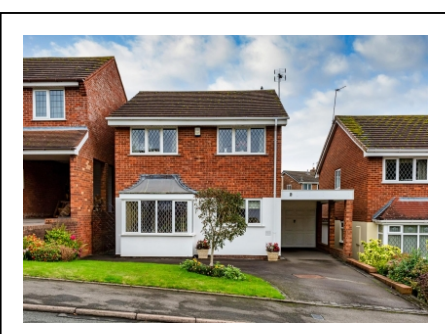
2 Woodthorne Close, Lower Gornal, Dudley