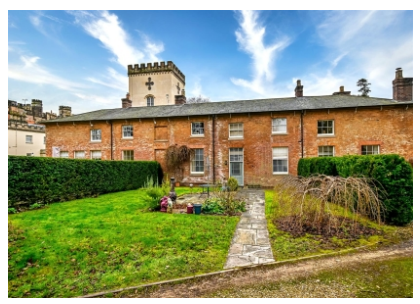
2 Apley Park Mews, Apley, Bridgnorth