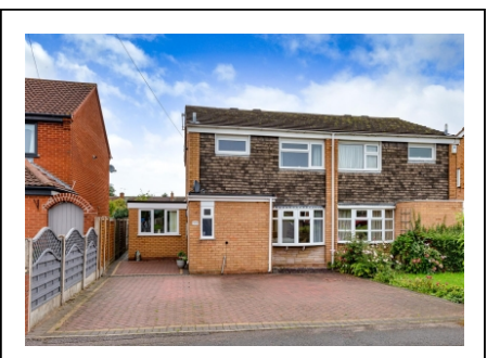
148a Birches Road, Codsall, Wolverhampton