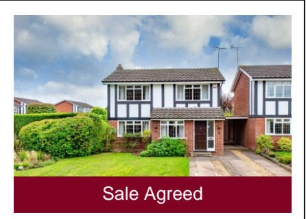
16 Meadow Vale, Codsall, Wolverhampton