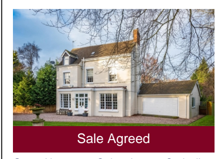
Grove House, 25 Oaken Lanes, Codsall