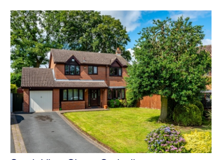
South View Close, Codsall, Wolverhampton