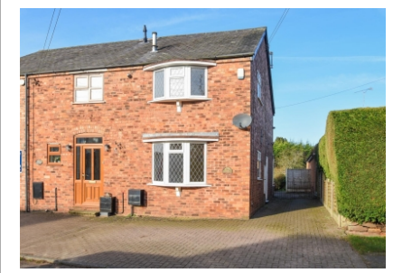
The Rambles, 16 Shop Lane, Oaken