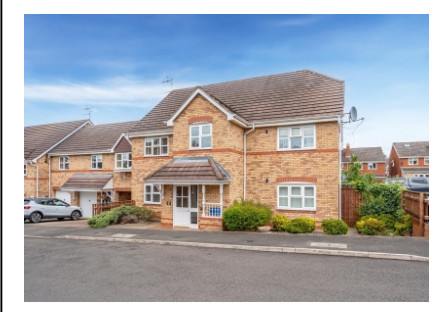
10 Cygnet Court, Wombourne, Wolverhampton