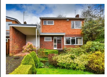
10 Ashfield Road, Compton, Wolverhampton