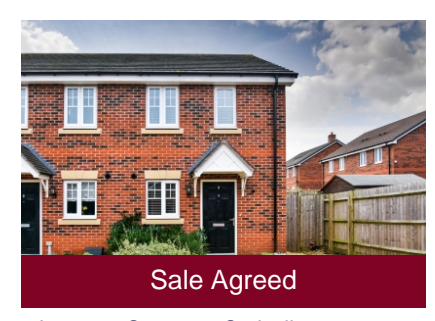
4 Leveson Crescent, Codsall, Wolverhampton