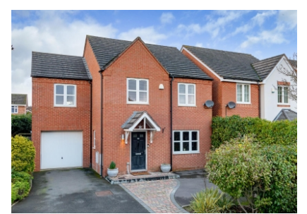
80 Brickbridge Lane, Wombourne, Wolverhampton