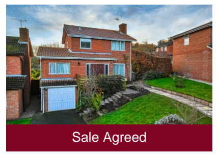
15 Bramble Ridge, Bridgnorth