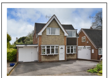
56 Bantock Gardens, Finchfield