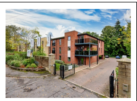
6 Thorneycroft, Wood Road, Tettenhall