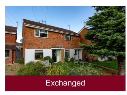
23 Brookside Close, Wombourne, Wolverhampton