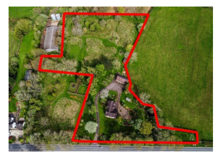
Dodds Green Cottage, 79 Dodds Green, Alveley, Bridgnorth