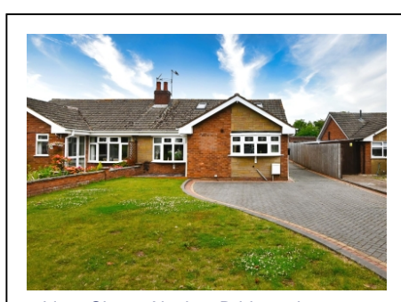
6 Lime Close, Alveley, Bridgnorth