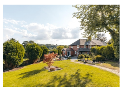
Sunnybank, 11b, Danesford, Bridgnorth