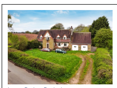
Lower Rudge, Pattingham, Wolverhampton