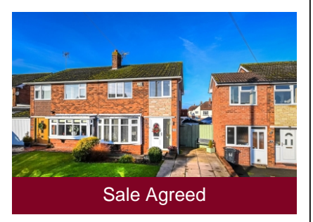
20 Orchard Drive, Bridgnorth