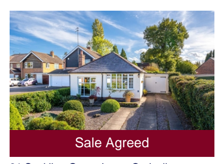
91 Suckling Green Lane, Codsall, Wolverhampton