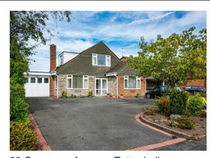
83 Cranmere Avenue, Tettenhall, Wolverhampton