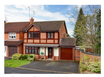
19 Penleigh Gardens, Wombourne, Wolverhampton