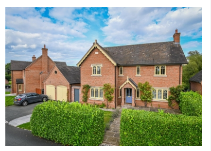
Fitzallen House, 3 Cound Park Drive, Cound, Shrewsbury