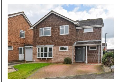
12 The Meadlands, Wombourne, Wolverhampton