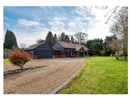
Willow Lodge, 23 High Street, Albrighton