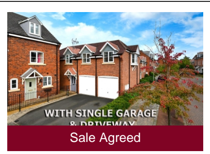
14 Rastrick Close, Bridgnorth