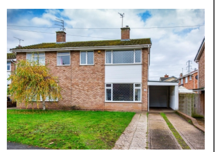
36 Wombourne Road, Swindon, Dudley