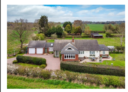
Holly Lodge, Church Lane, Boningale, Albrighton