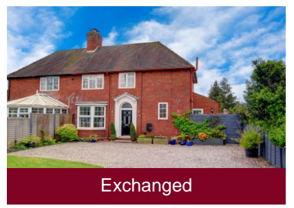
Bromyard road, Worcester