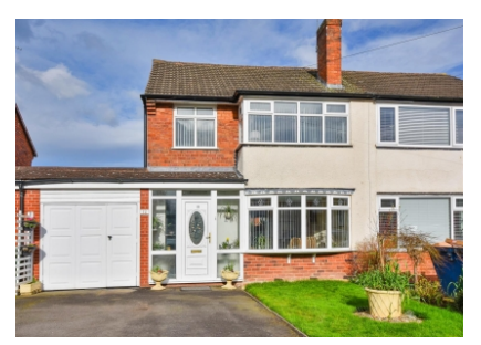
12 Oakfield Road, Codsall, Wolverhampton