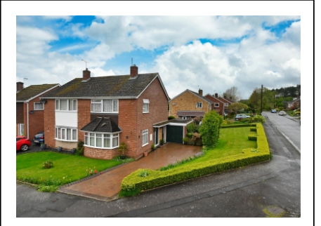
3 Hillside Avenue, Bridgnorth