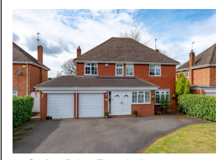
18 Corfton Drive, Tettenhall