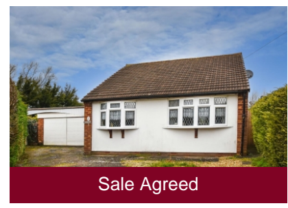
7 Apse Close, Wombourne, Wolverhampton