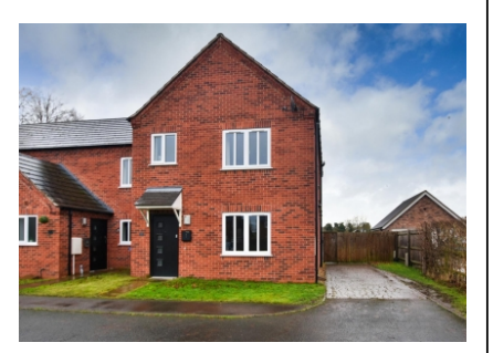
4 Lower Lanes Meadow, Seisdon, Wolverhampton