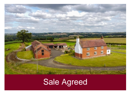
Lower Sutton Farm, Sutton, Chelmarsh, Bridgnorth