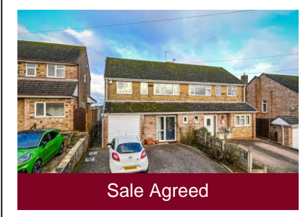
34 Honeybourne Road, Alveley, Bridgnorth