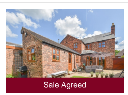
The Cottage, 18 Shop Lane, Oaken