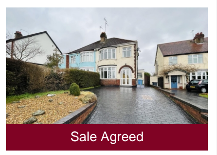
31 Sedgley Road, Penn Common, Penn