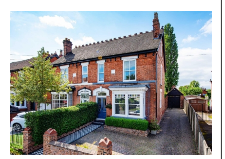
7 Richmond Road, Finchfield, Wolverhampton