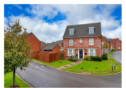
35 Chalmers Road, Baggeridge Village, Dudley