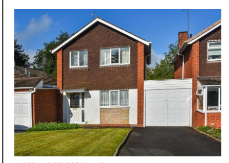
9 Westhill, Wolverhampton