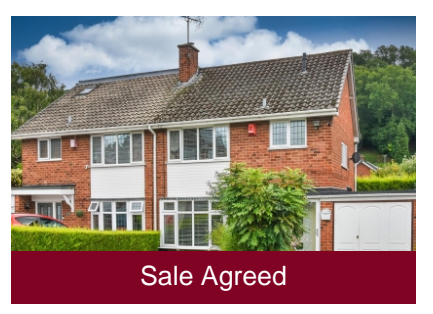
23 Chequers Avenue, Wombourne, Wolverhampton