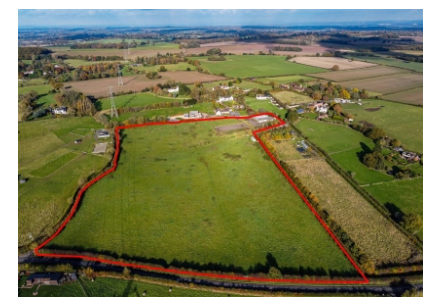
Plot of Land at Former Mill Riding Centre, Warstone Hill Road, Pattingham