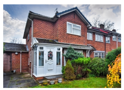
5 Manor Close, Codsall, Wolverhampton