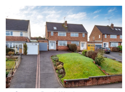
44 Common Road, Wombourne, Wolverhampton