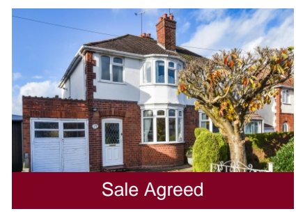
17 Fairview Road, Penn, Wolverhampton