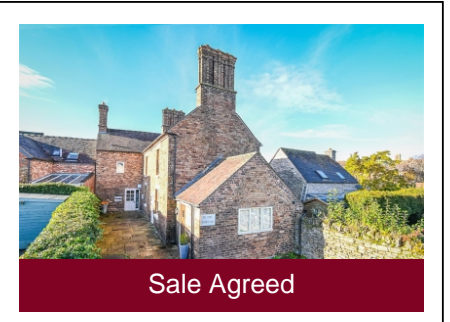
The Forge, 13 St. Marys Lane, Much Wenlock