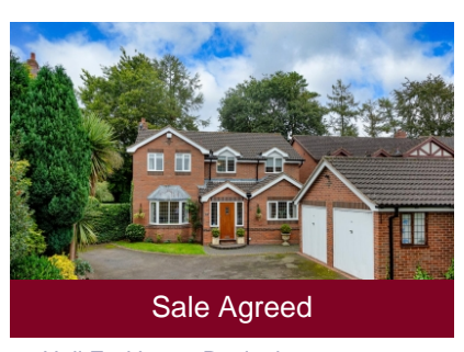
17 Hall End Lane, Pattingham, Wolverhampton