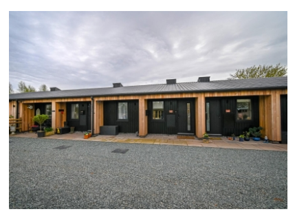
The Willow, 3 The Closes, Sutton Farm, Claverley, Wolverhampton