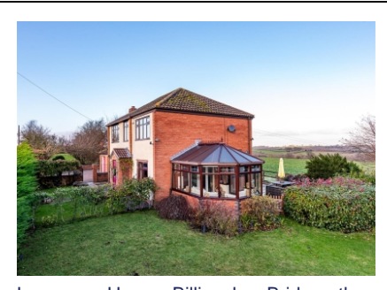
Longmoor House, Billingsley, Bridgnorth