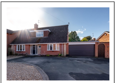
Strathmore, Shaw Lane, Albrighton