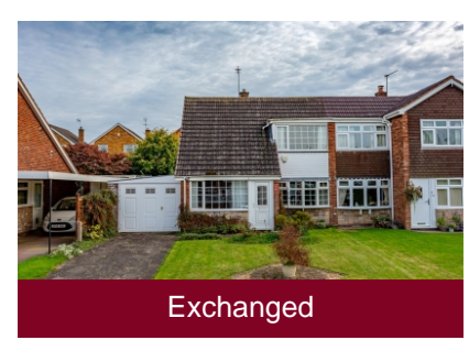
13 Greenfields Road, Wombourne, Wolverhampton