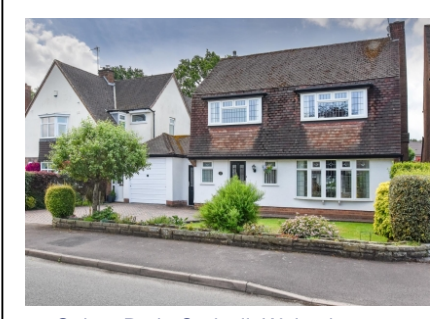
57 Oaken Park, Codsall, Wolverhampton