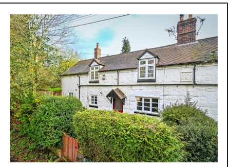
146 Broad Oak, Six Ashes