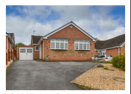
9 Brick Kiln Lane, Dudley