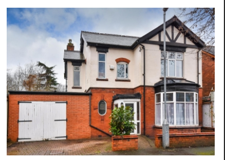
18 Elm Avenue, Bilston, Wolverhampton