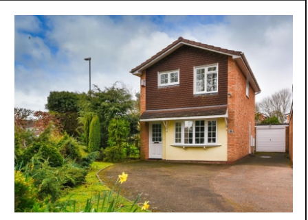
28 Quendale, Wombourne, Wolverhampton