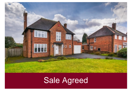
61 Brickbridge Lane, Wombourne, Wolverhampton