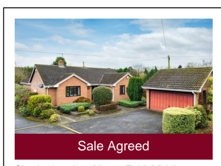
Shadowbrook, 4 Manor Fold, Middle Lane, Oaken