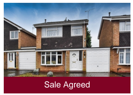
84 Bellencroft Gardens, Wolverhampton