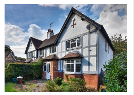
2 Danescourt Cottages, Danescourt Road, Tettenhall