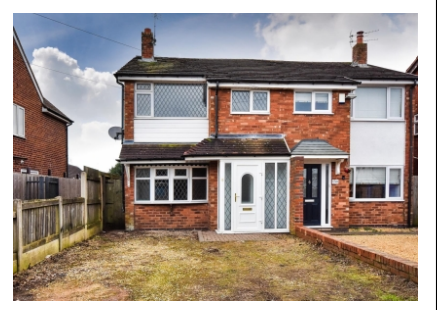
93 Hazel Grove, Wombourne, Wolverhampton