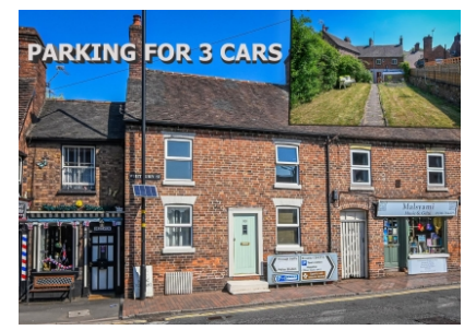
50 Whitburn Street, Bridgnorth