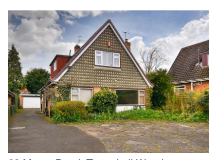
68 Mount Road, Tettenhall Wood, Wolverhampton