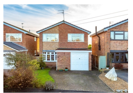
3 Braemar Road, Pattingham, Wolverhampton