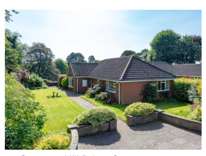
11 Compton Hill Drive, Compton, Wolverhampton