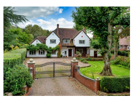
Hillside, 3 Tinacre Hill, Wightwick