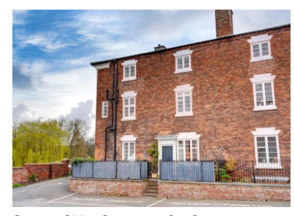
Severn Side, Stourport-On-Severn