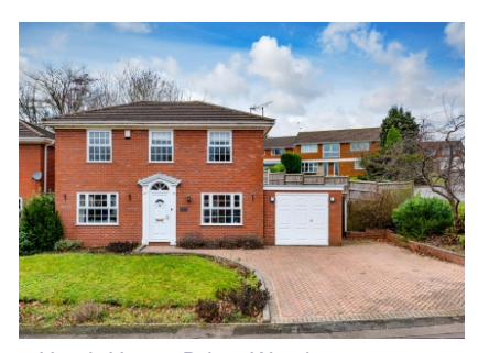
2 Heath House Drive, Wombourne, Wolverhampton