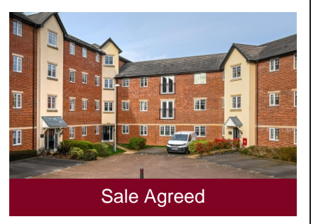
23 Greyfriars House, Kings Court, Stourbridge Road, Bridgnorth