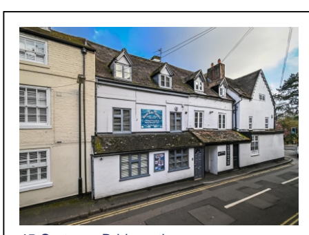
45 Cartway, Bridgnorth