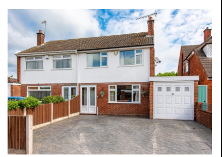
19 Chapel Street, Wombourne