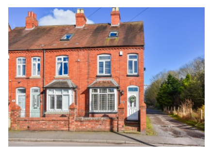
26 Innage Road, Shifnal