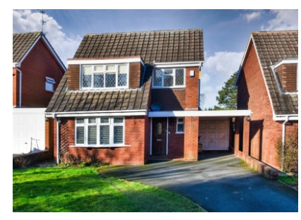
15 Histons Drive, Codsall, Wolverhampton