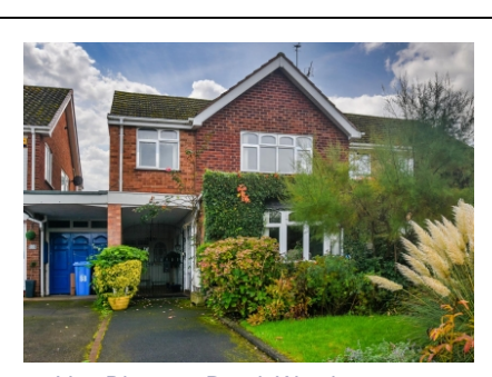
86 Van Diemans Road, Wombourne, Wolverhampton