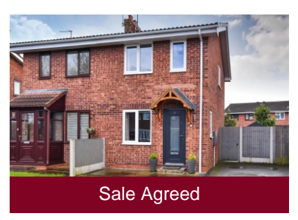
6 Troon Court, Perton, Wolverhampton