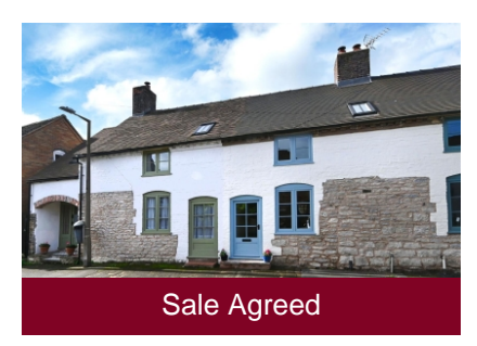
41 Barrow Street, Much Wenlock