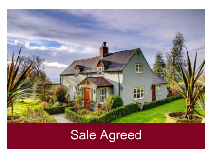
Trimpley Lane, Shatterford, Bewdley