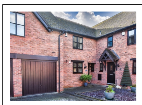
17 Bridgeman Court, Weston-Under-Lizard, Shifnal