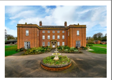
Home Wood, Gatacre Hall, Claverley, Wolverhampton