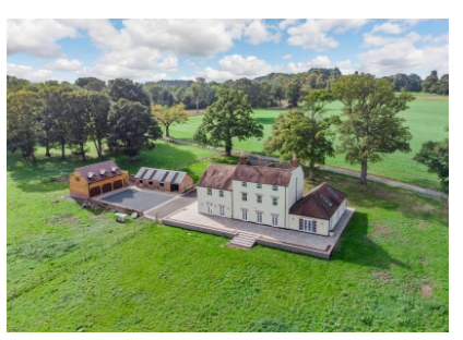
Home Farm, Gatacre, Claverley, Wolverhampton