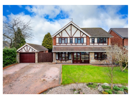
11 Waverley Gardens, Wombourne, Wolverhampton