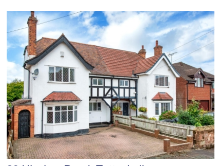
23 Hinckes Road, Tettenhall, Wolverhampton