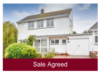
4 Newgate, Pattingham, Wolverhampton