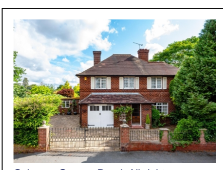
Oxleaze, Grange Road, Albrighton