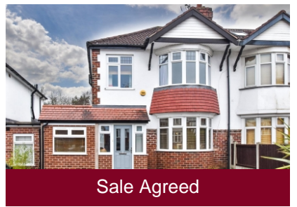
103 Windsor Avenue, Penn, Wolverhampton