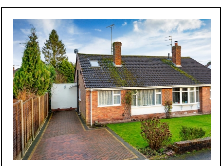
1 Norton Close, Penn, Wolverhampton