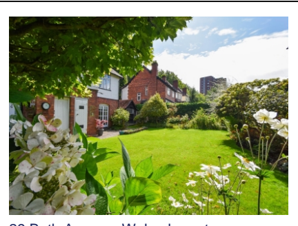
29 Bath Avenue, Wolverhampton