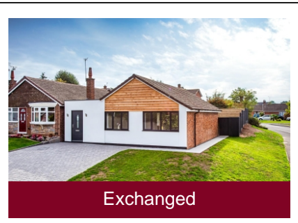
1 Barclay Close, Albrighton, Wolverhampton