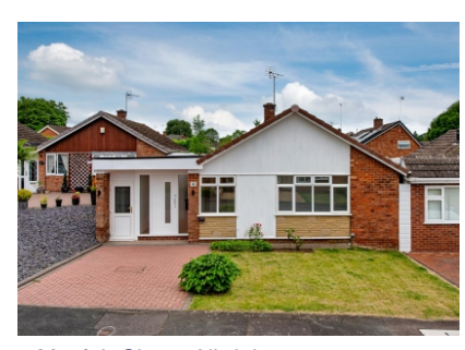
4 Mayfair Close, Albrighton, Wolverhampton