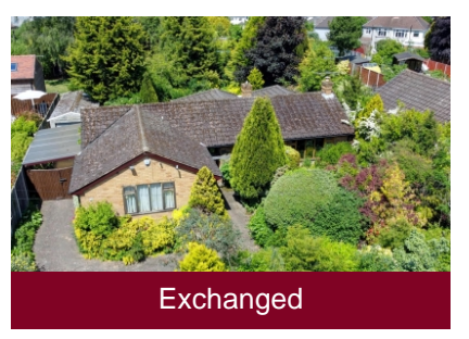
Hazelwood Close, Kidderminster