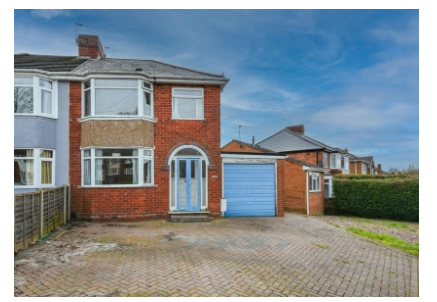
1 Rutland Avenue, Wolverhampton