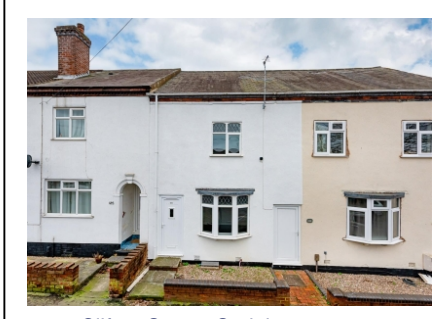
126a Clifton Street, Sedgley