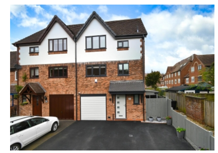
2 King Charles Way, Bridgnorth