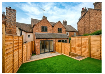
6 Salop Street, Bridgnorth