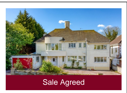
17 Muchall Road, Penn, Wolverhampton