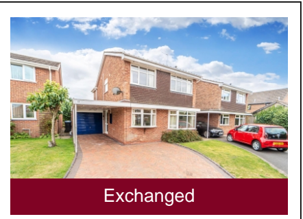
13 Dartmouth Avenue, Pattingham, Wolverhampton