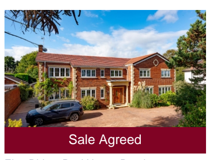
Elan Ridge. Pool House Road, Wombourne, Wolverhampton