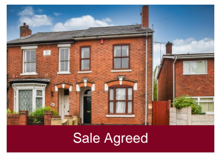
41 Hordern Road, Wolverhampton