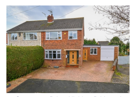
15 Crannmore Drive, Highley, Bridgnorth