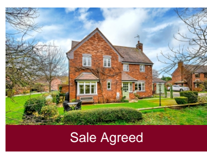
43 Pale Meadow Road, Bridgnorth