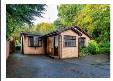
6 Finchfield Hill, Compton, Wolverhampton