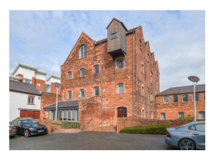
11 The Mill, Albion Street, Wolverhampton