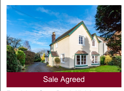
Ferndale, 7 Cross Road, Albrighton