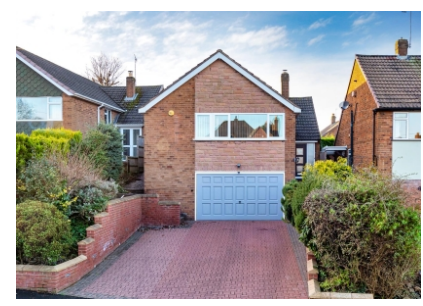
52 Church Hill, Penn, Wolverhampton