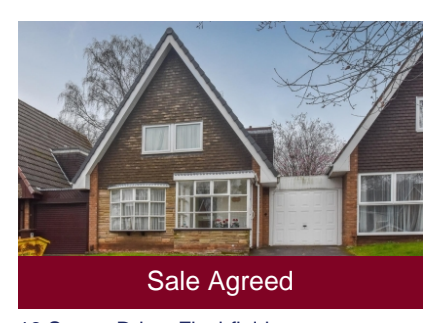
16 Surrey Drive, Finchfield, Wolverhampton