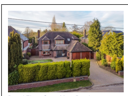
Broad Elms, Great Moor Road, Pattingham