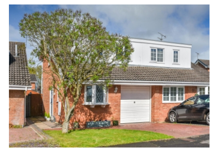
39 Mercia Drive, Perton, Wolverhampton