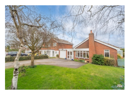
Madeira, 45 Keepers Lane, Codsall, Wolverhampton