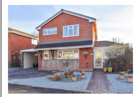
23 Bellencroft Gardens, Merry Hill, Wolverhampton