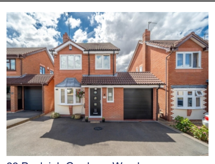
23 Penleigh Gardens, Wombourne