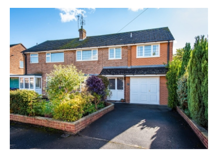
36 Delaware Avenue, Albrighton, Wolverhampton