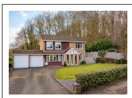
Wychaven, The Holloway, Swindon, Dudley