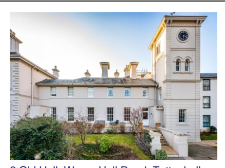
2 Old Hall, Wergs Hall Road, Tettenhall