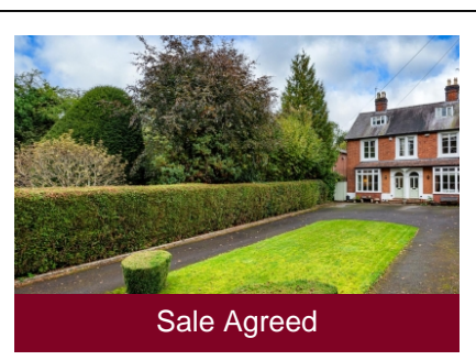
Fernleigh, 35 Oaken Lanes, Codsall