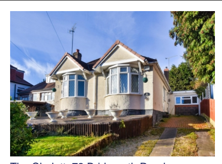
The Chalett, 78 Bridgnorth Road, Compton