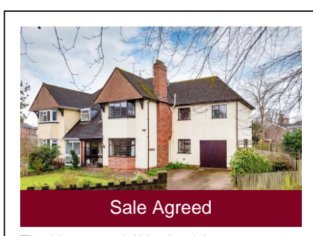
The Homestead, Westland Avenue, Compton