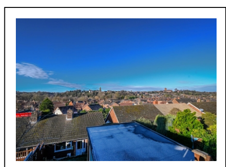
5 River View, Bridgnorth