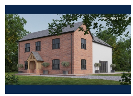
Plot 1, Bynd Lane, Billingsley, Bridgnorth