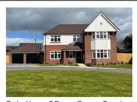
Cedar House, 7 Rowan Grange, Broseley