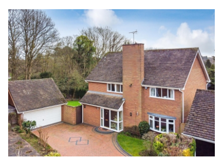
5 Mayswood Drive, Wightwick