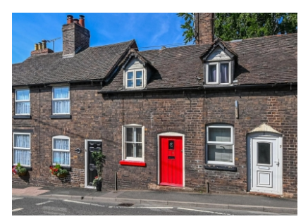
4 Pound Street, Bridgnorth