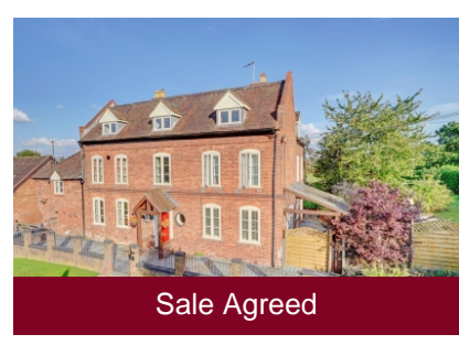
Austcliffe Road, Cookley, Kidderminster