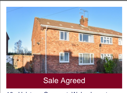
10a Hylstone Crescent, Wolverhampton