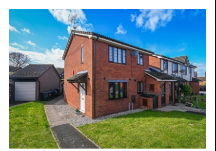
10 Fairfield, Bridgnorth