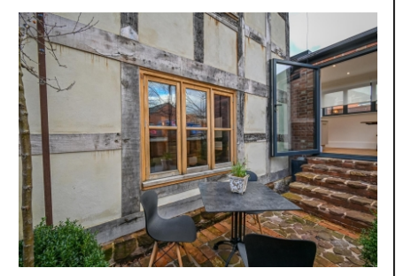
Park Cottage, Abbey Foregate, Shrewsbury