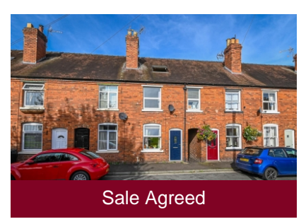
29 Severn Street, Bridgnorth