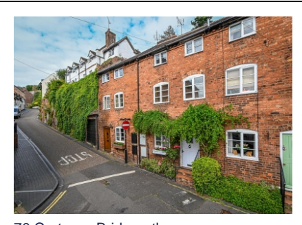
70 Cartway, Bridgnorth