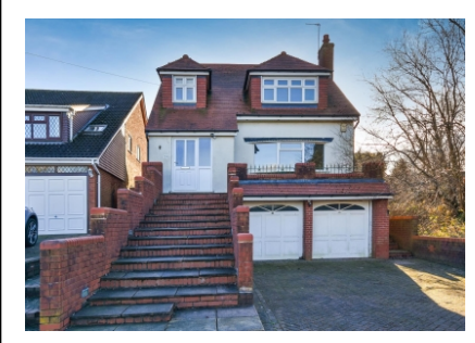
25 Bognop Road, Essington, Wolverhampton