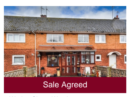
2 Woden Close, Wombourne, Wolverhampton