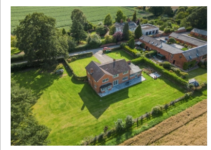
Oaklands Farm, Lower Rudge, Pattingham, Wolverhampton