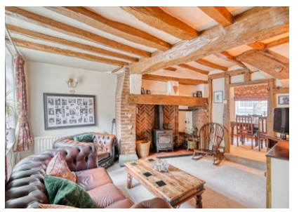
Bridgend Cottage, 43 Cartway, Bridgnorth