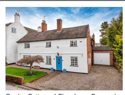
Garden Cottage, 4 Shop Lane, Brewood