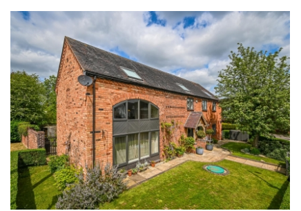
1 The Paddock, Claverley, Wolverhampton