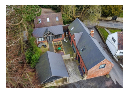
The Old Coach House, Little Wenlock, Telford