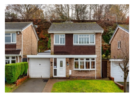
23 Redcliffe Drive, Wombourne, South Stafforshire