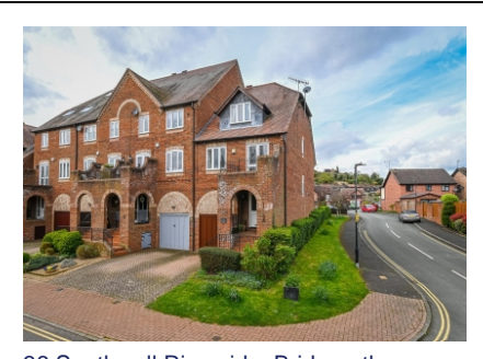
36 Southwell Riverside, Bridgnorth