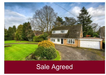
59 Woodthorne Road South, Tettenhall