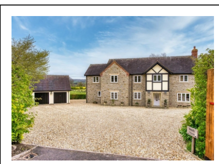
Beech House, Munslow, Shropshire