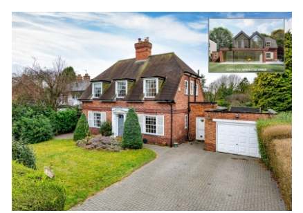
The Dormers, Finchfield Gardens, Finchfield