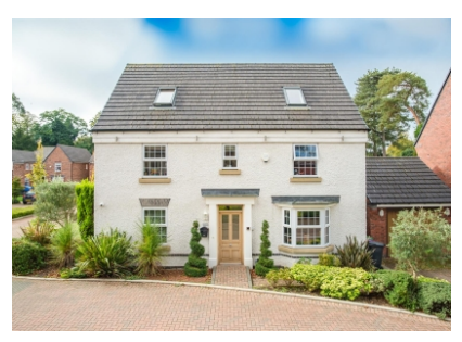
7 Great Hall Grove, Wolverhampton