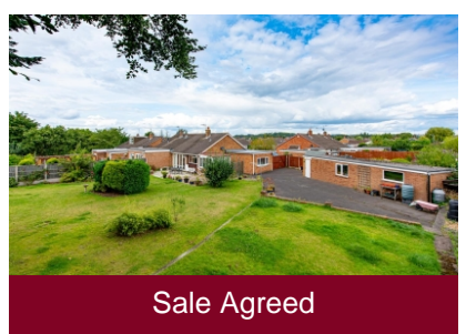
7 Blakeley Heath Drive, Wombourne, Wolverhampton