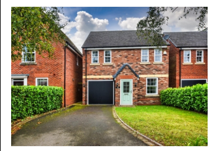
Eden House, Wombourne Road, Swindon, Dudley