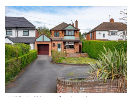
95 Windmill Lane, Castlecroft, Wolverhampton