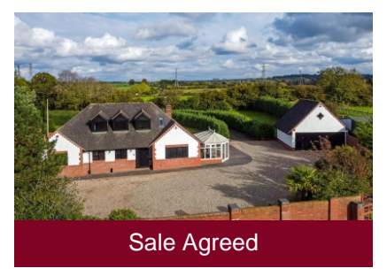
Rosebank, Ebstree Road, Seisdon, Nr Wolverhampton