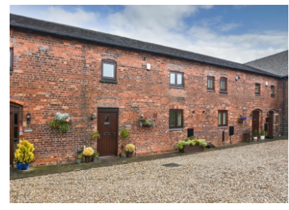
3 Manor Farm Barns, Bognop Road, Essington