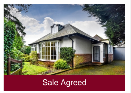
The Grey Cottage 19 Clifton Road, Wolverhampton