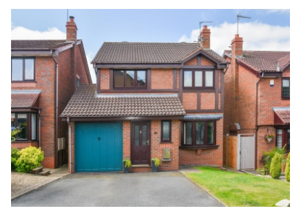
35 Penleigh Gardens, Wombourne, Wolverhampton