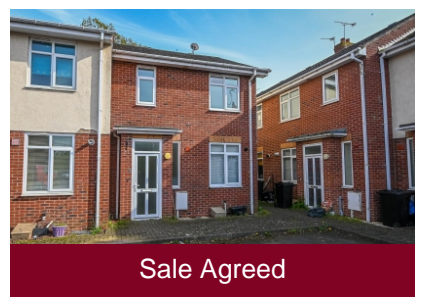
17 Orchard Square, Highley, Bridgnorth