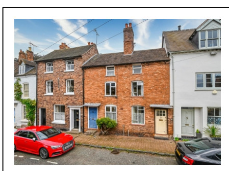
25 St. Marys Street, Bridgnorth