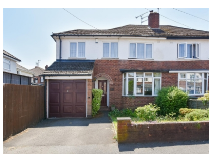
57 York Road, Wolverhampton