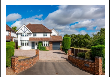
Hearthcote House, Poolhouse Road, Wombourne