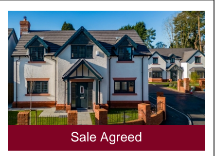
Alder House, Popes Lane, Tettenhall