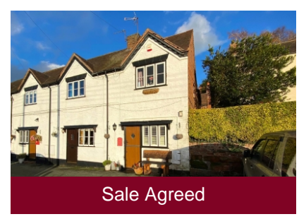
26c Bernards Hill, Bridgnorth