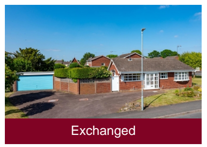
44 Woodcote Road, Wolverhampton