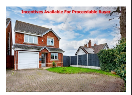
151 Tipton Road, Woodsetton, Dudley