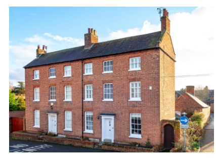
4 Church Road, Albrighton, Wolverhampton