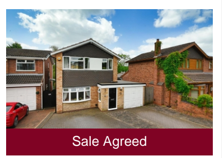
36 Bridge Road, Alveley, Bridgnorth