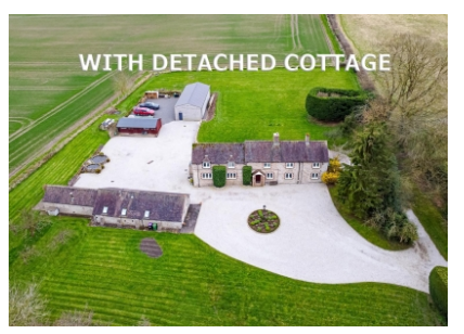
Lower Westwood Farm, Stretton Westwood, Much Wenlock