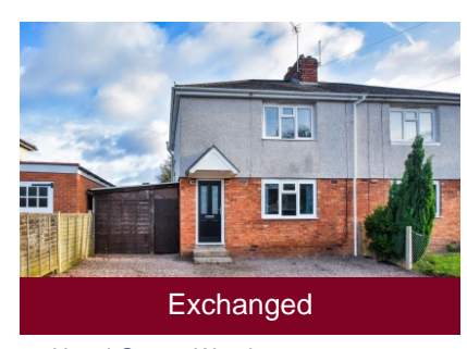
34 Hazel Grove, Wombourne, Wolverhampton