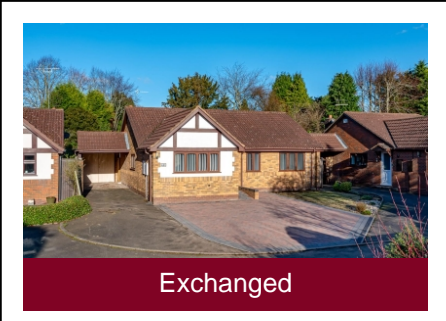
38b Redhouse Road, Tettenhall, Wolverhampton