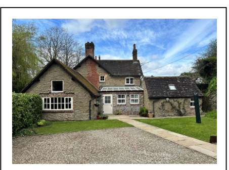
Brookside, Brockton, Much Wenlock