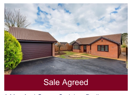
3 Montford Grove, Sedgley, Dudley