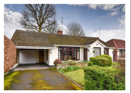
30 Sabrina Road, Wightwick, Wolverhampton