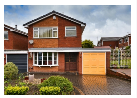
7 Marlborough Gardens, Newbridge, Wolverhampton