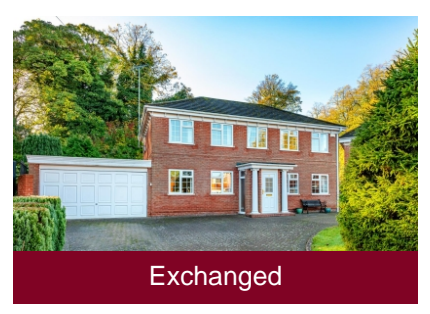
Enderby Drive, Wolverhampton