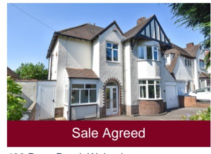
490 Penn Road, Wolverhampton