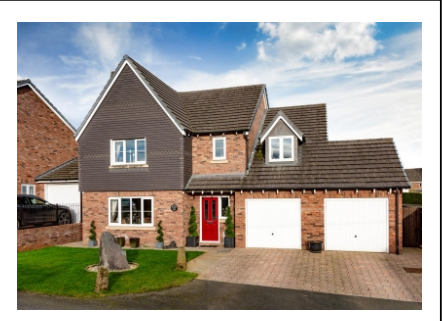
41 Kings Road, Calf Heath, Wolverhampton