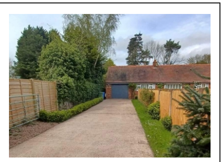
The Bungalow, Popes Lane, Wergs, Tettenhall