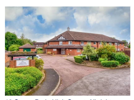
13 Saxon Park, High Street, Albrighton, Wolverhampton