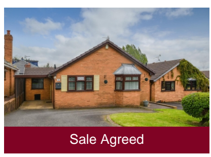
56 Coton Road, Wolverhampton