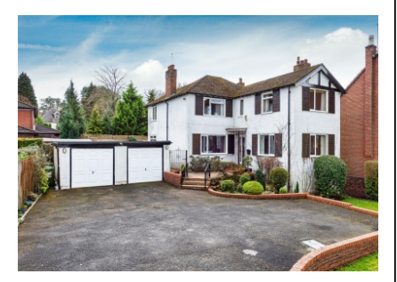
Quarry House, 30 Lansdowne Avenue, Codsall