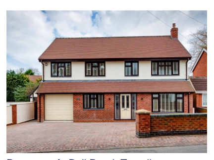
Ravenscroft, Bell Road, Trysull, Wolverhampton