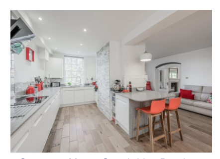
4 Stanmore Mews, Stourbridge Road, Stanmore, Bridgnorth