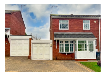
14 St James Street, Lower Gornal, Dudley