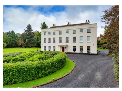
11 Leaton Hall, Church Lane, Bobbington, Stourbridge