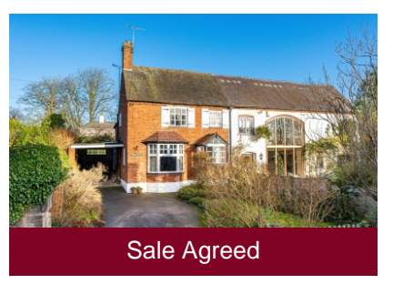
Newport House, 28 Newport Street, Brewood