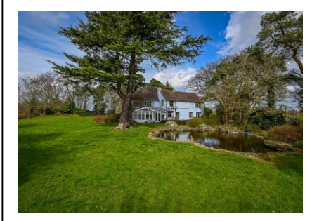
Horseshoes, Netherton, Highley, Bridgnorth