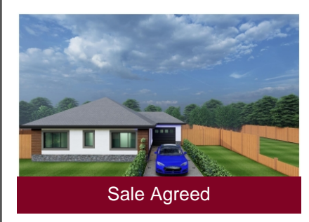
Plot 2 Hazelbrook, Hazel Lane, Great Wyrley