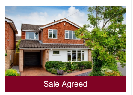
9 Windsor Road, Pattingham