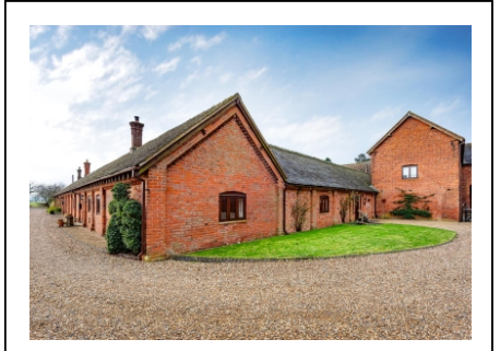
The Byre, Home Farm Road, Burnhill Green, Wolverhampton