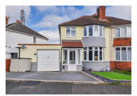
56 Hilston Avenue, Penn, Wolverhampton