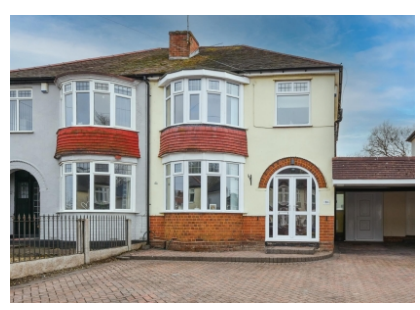
53 Woodland Road, Merry Hill, Wolverhampton