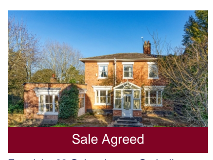
Ferndale, 33 Oaken Lanes, Codsall, Wolverhampton