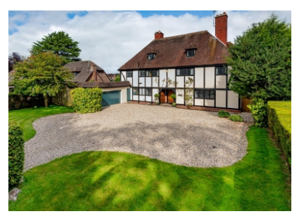
Findon, Haughton Lane, Shifnal