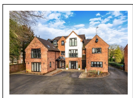
3 The Gables, Seisdon Road, Trysull, Wolverhampton