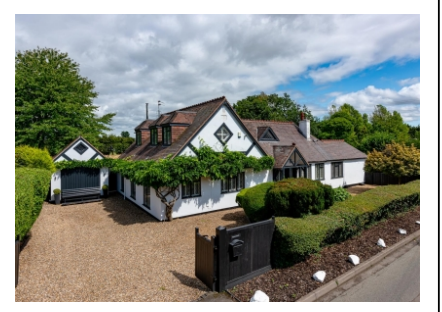
Pennygate, Paradise Lane, Slade Heath, Wolverhampton