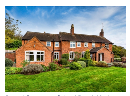
Pound Cottage, 8 School Road, Himley, Dudley