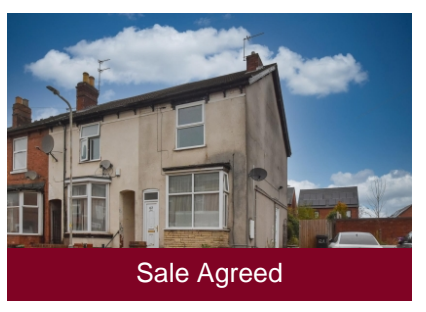
62 Merridale Street West, Wolverhampton