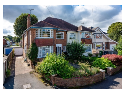
7 Newbridge Gardens, Newbridge, Wolverhampton