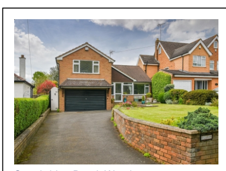
Stourbridge Road, Wombourne, Wolverhampton