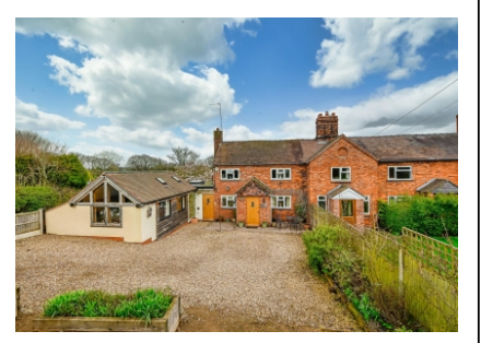
3 Tedstill Cottages, Middleton Scriven, Bridgnorth