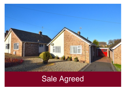
11 Greenleys Crescent, Alveley, Bridgnorth