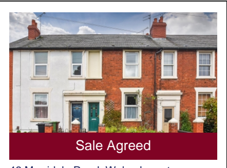
46 Merridale Road, Wolverhampton