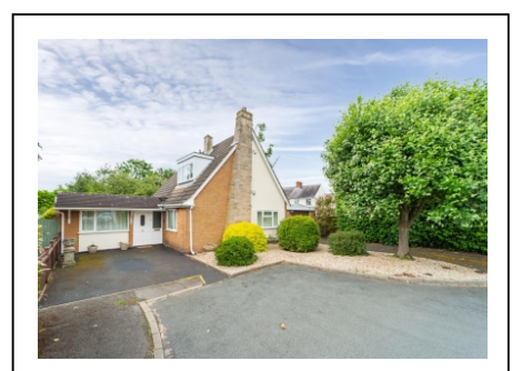
8 The Orchard, Albrighton