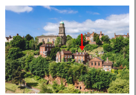
19 St. Marys Steps, Bridgnorth