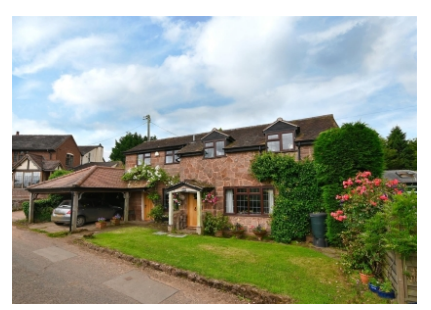
Finger Cottage, 123 Birds Green, Alveley, Bridgnorth