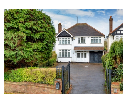
Maleesh, Stourbridge Road, Wombourne