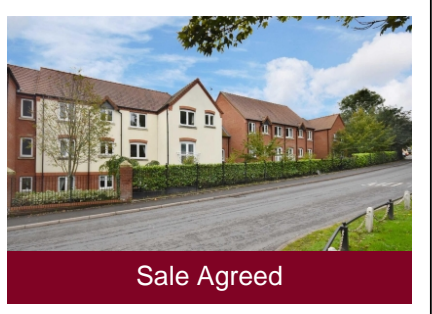
21 Farthings Court, Kings Loade, Bridgnorth