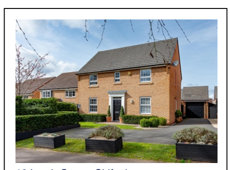
12 Larch Grove, Shifnal