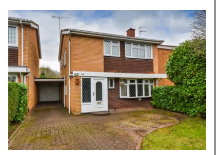
30 Sytch Lane, Wombourne, Wolverhampton