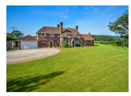
Footbridge House, Tasley, Bridgnorth