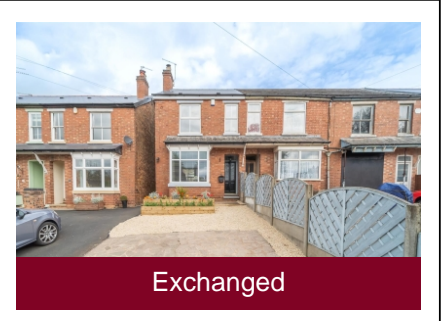
67 Wood Road, Codsall