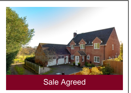
Keepers End, Hawthorne Drive, Wheaton Aston