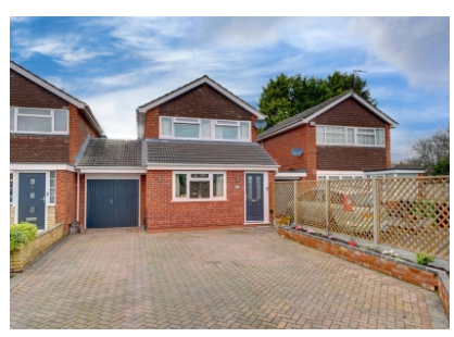
Elderberry Close, Stourport-On-Severn