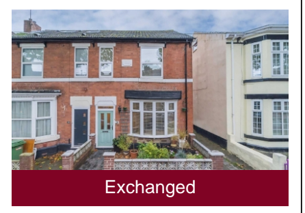
Allen Road, Whitmore Reans, Wolverhampton