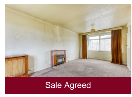
26 The Avenue, Castlecroft, Wolverhampton