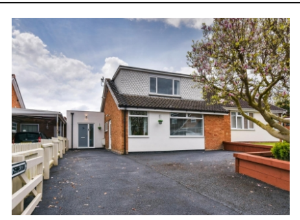
3 Greenfields Road, Wombourne, Wolverhampton