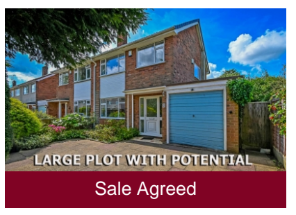
6 Moor Lane, Pattingham, Wolverhampton