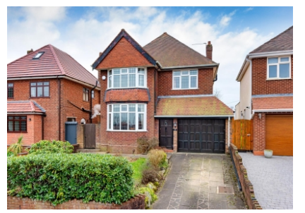
15 Foxlands Avenue, Wolverhampton