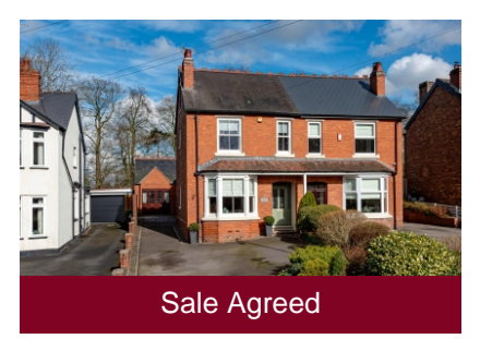
Medlicote, 79 Wood Road, Codsall