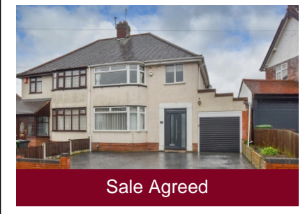
19 Sandringham Road, Penn, Wolverhampton