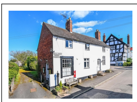
The Old Post Office, High Street, Claverley, Wolverhampton