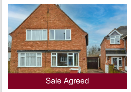
30 Sandringham Road, Wombourne, Wolverhampton