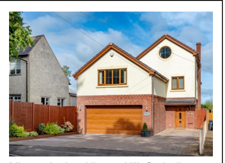
Mimosa Lodge, Histons Hill, Codsall