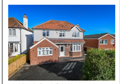
109 Victoria Road, Bridgnorth