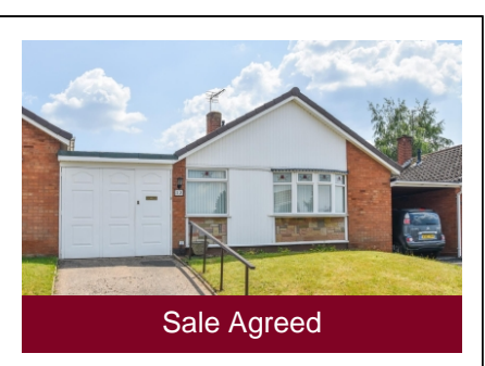
13 The Broadway, Wombourne, Wolverhampton