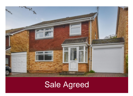
6 Surrey Drive, Finchfield