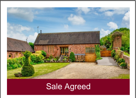
The Tythe Barn, Hyde Mill Lane, Brewood