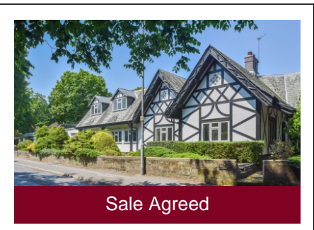
Woodhouse Lodge, Wood Road, Tettenhall Wood