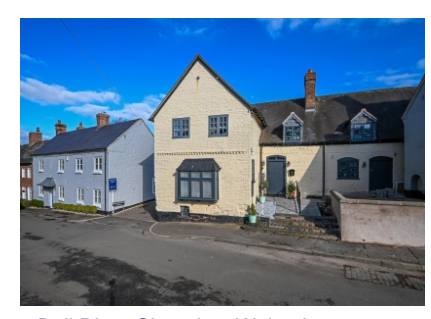
7 Bull Ring, Claverley, Wolverhampton