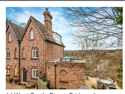
14 West Castle Street, Bridgnorth