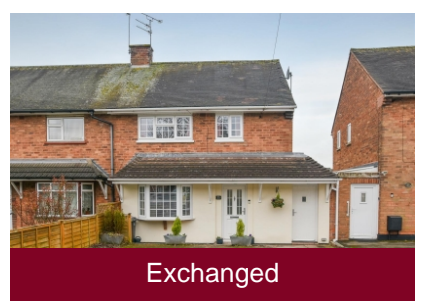
25 Ashenden Rise, Castlecroft, Wolverhampton