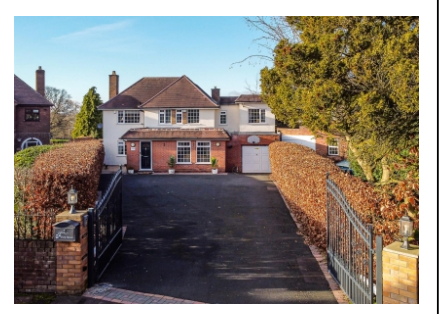
Fern House, Links Avenue, Tettenhall