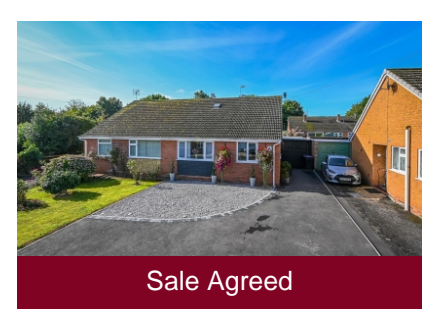
10 Captains Road, Bridgnorth