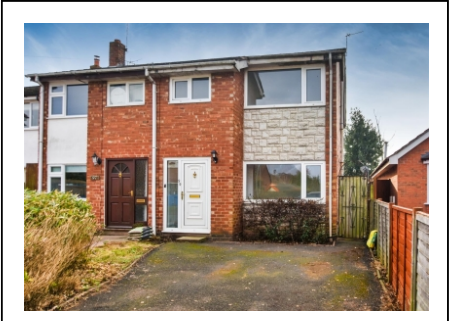
99 Hazel Grove, Wombourne, Wolverhampton