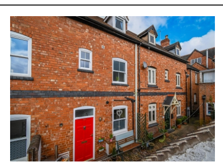
22a High Street, Bridgnorth