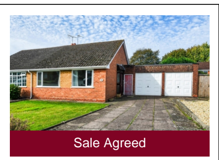
10 Gardeners Way, Wombourne, Wolverhampton