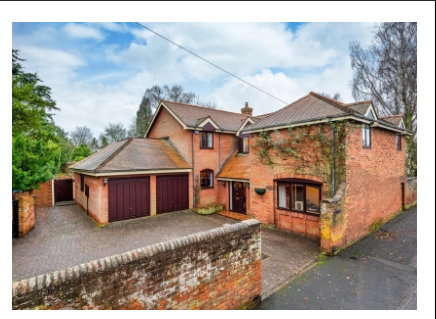
Manor Court, Cross Road, Albrighton, Wolverhampton