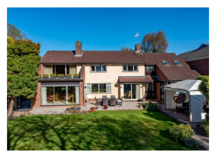
86 Woodthorne Road South, Tettenhall