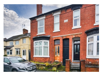
166 Crowther Road, Wolverhampton