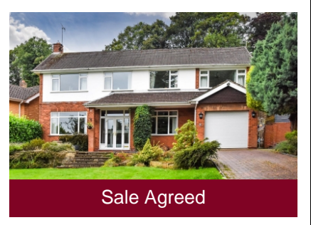
5 Firsway, Wightwick