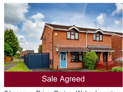
7 Leasowe Drive, Perton, Wolverhampton