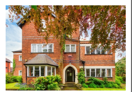
Cheviot House, 20 Stockwell Road, Tettenhall