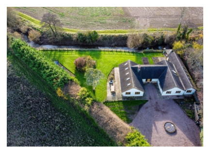
Riverside Bungalow, Muckley Cross, Acton Round, Bridgnorth