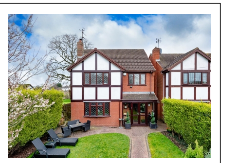
Waterford, Ball Lane, Coven Heath, Wolverhampton