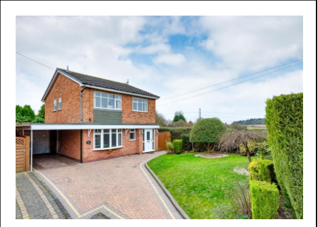
29 Windsor Road, Pattingham, Wolverhampton