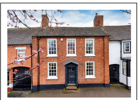
Saredon House, 28 Stafford Street, Brewood