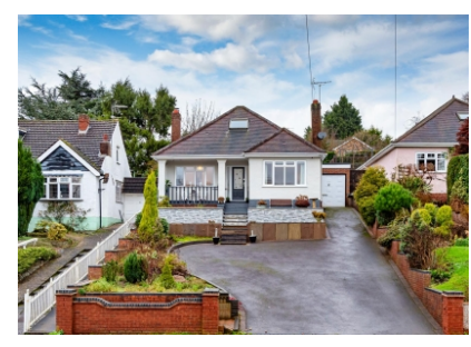
74 Bridgnorth Road, Compton