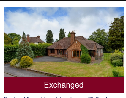
Spring View, Haughton Lane, Shifnal