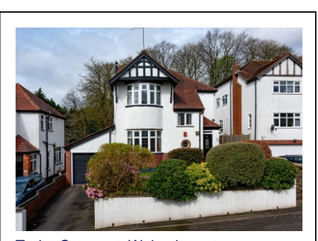
Tudor Crescent, Wolverhampton