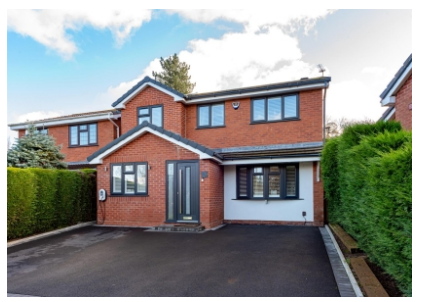
41 Ascot Drive, Dudley