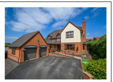
Cape Lodge, Billingsley, Bridgnorth