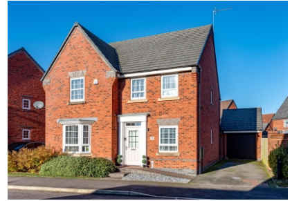
8 Brick Kiln Way, Baggeridge Village