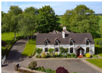
The Little Green, 2 Feiashill Road, Trysull, Wolverhampton