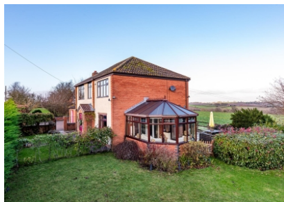
Longmoor House, Billingsley, Bridgnorth