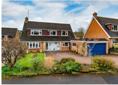
18 Quail Green, Wightwick, Wolverhampton