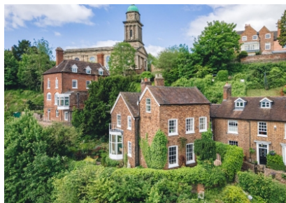
Castle Cliffe House, 24 St. Mary's Steps, Bridgnorth