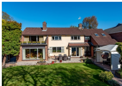
86 Woodthorne Road South, Tettenhall