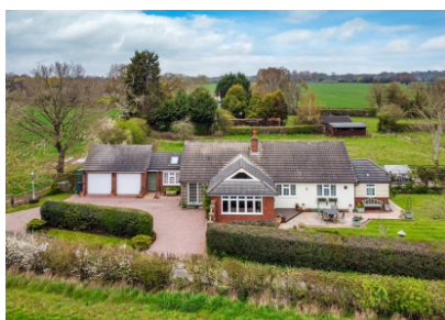
Holly Lodge, Church Lane, Boningale, Albrighton