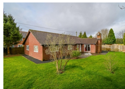
The Old Kiln, Church Lane, Bridgnorth