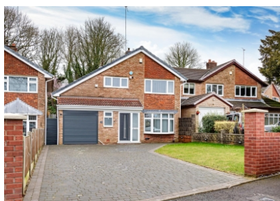
3 St. Marys Close, Dudley