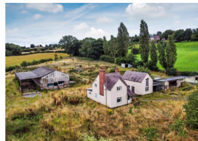
Robins Nest Farm, Dirty Foot Lane, Lower Penn, Wolverhampton