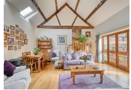
Tedstill Barn, Glazeley, Bridgnorth