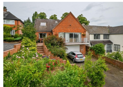
The Tynning, Westgate Drive, Bridgnorth