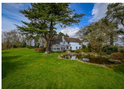
Horseshoes, Netherton, Highley, Bridgnorth