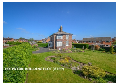
Hookfield House, 81 Victoria Road, Bridgnorth