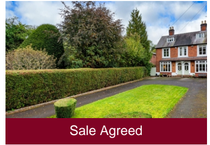
Fernleigh, 35 Oaken Lanes, Codsall