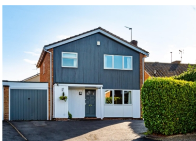
4 Beech Close, Pattingham, Wolverhampton