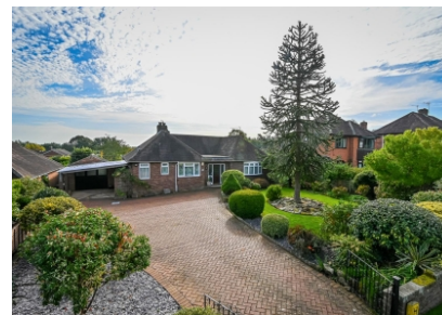
53 Conduit Lane, Bridgnorth