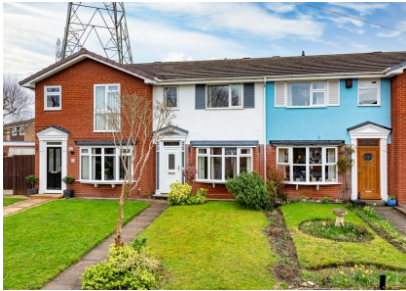
3 Swinford Leys, Wombourne, WV5 8HT