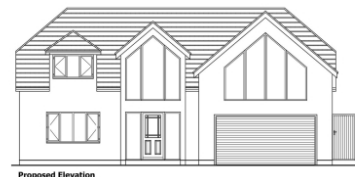
38 Cranmere Avenue, Tettenhall, Wolverhampton