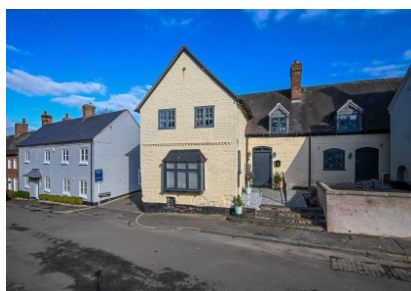
7 Bull Ring, Claverley, Wolverhampton