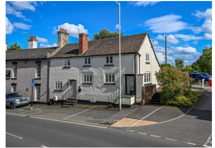
33 Salop St, Bridgnorth