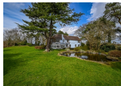
Horseshoes, Netherton, Highley, Bridgnorth