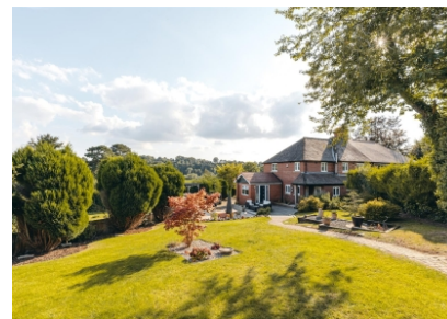
Sunnybank, 11b, Danesford, Bridgnorth