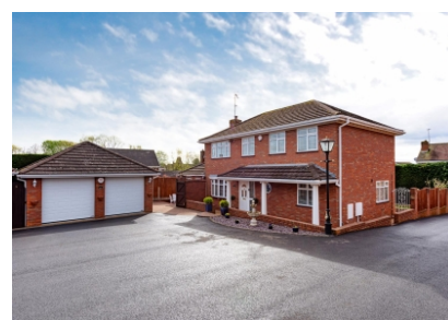
St. Johns Close, Swindon, Dudley