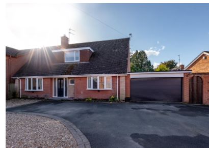
Strathmore, Shaw Lane, Albrighton