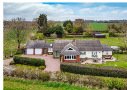
Holly Lodge, Church Lane, Boningale, Albrighton