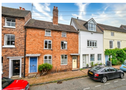
24 St. Marys Street, Bridgnorth