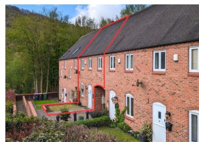
6 The Courtyard, Ironbridge, Telford