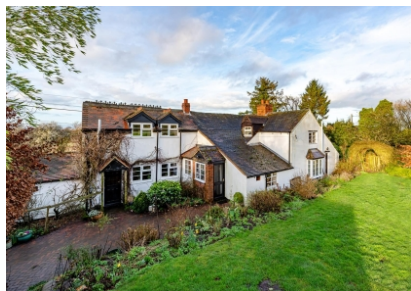
Greystoke Cottage, Kiddemore Green, Brewood