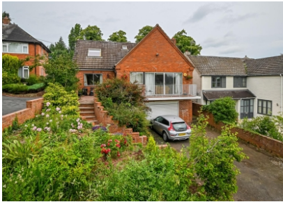
The Tying, Westgate Drive, Bridgnorth