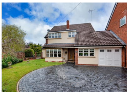
7 The Beeches, Seisdon, Wolverhampton