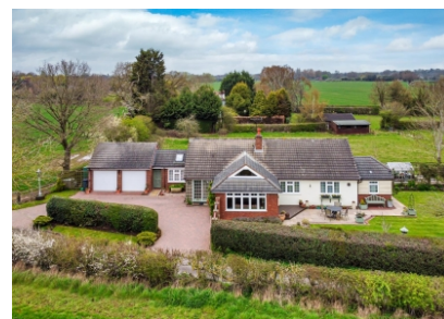
Holly Lodge, Church Lane, Boningale, Albrighton