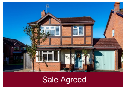
39 Penleigh Gardens, Wombourne, Wolverhampton