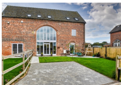
Sage Barn, 2 Victoria Barns, Brinsford Lane, Wolverhampton