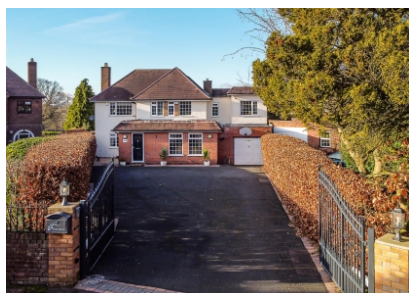
Fern House, Links Avenue, Tettenhall