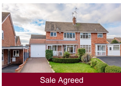
14 Chequers Avenue, Wombourne, Wolverhampton