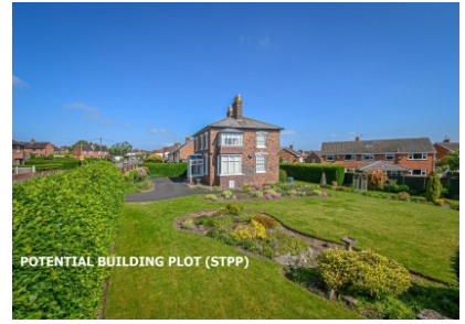
Hookfield House, 81 Victoria Road, Bridgnorth