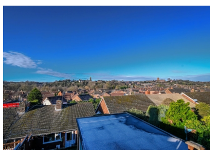
5 River View, Bridgnorth