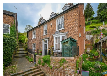
19 St. Marys Steps, Bridgnorth