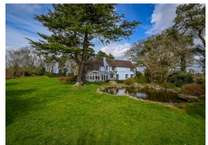
Horseshoes, Netherton, Highley, Bridgnorth