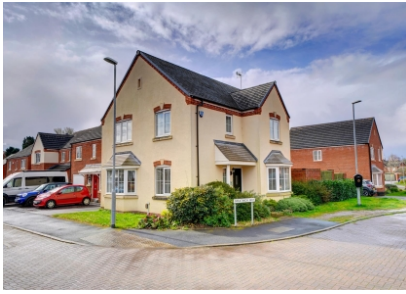
Greatwich Way, Kidderminster