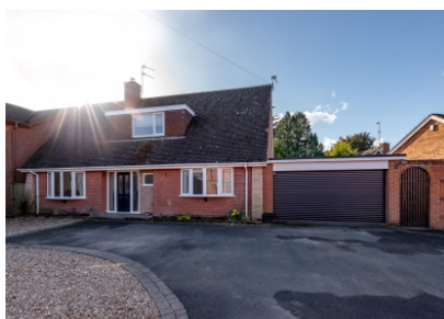
Strathmore, Shaw Lane, Albrighton