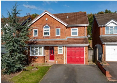
12 Dudmaston Way, Milking Bank, Dudley