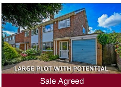
6 Moor Lane, Pattingham, Wolverhampton