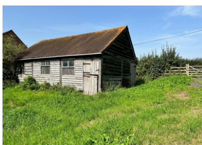
Spring Barn, Glazeley, Bridgnorth