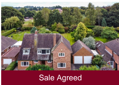
Rossleigh, Shaw Lane, Albrighton