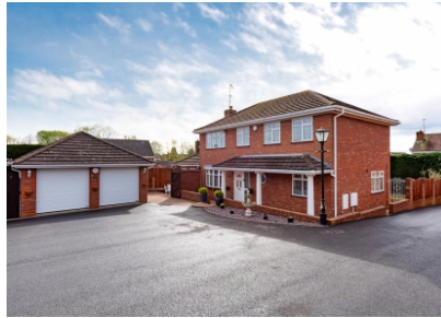
St. Johns Close, Swindon, Dudley