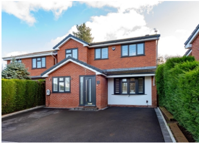
41 Ascot Drive, Dudley