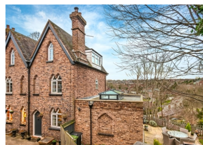
14 West Castle Street, Bridgnorth