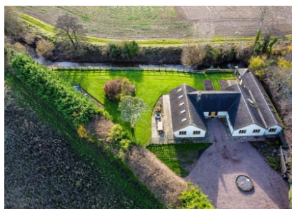
Riverside Bungalow, Muckley Cross, Acton Round, Bridgnorth