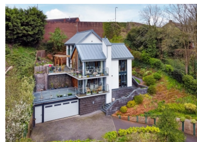
Hawthorn View, Hollybush Road, Bridgnorth