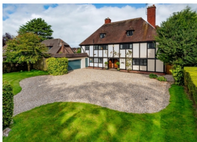
Findon, Haughton Lane, Shifnal