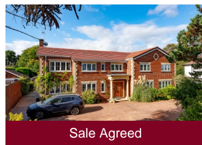
Elan Ridge, Pool House Road, Wombourne, Wolverhampton