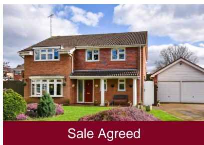
Oaken Covert, Codsall, Wolverhampton