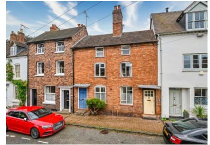
25 St. Marys Street, Bridgnorth