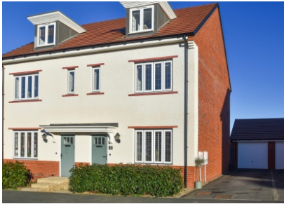
11 Marshall Way, Codsall, Wolverhampton