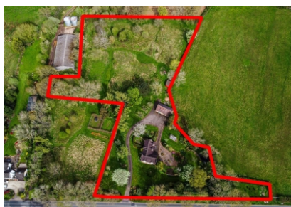
Dodds Green Cottage, 79 Dodds Green, Alveley, Bridgnorth