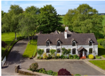
The Little Green, 2 Feiashill Road, Trysull, Wolverhampton