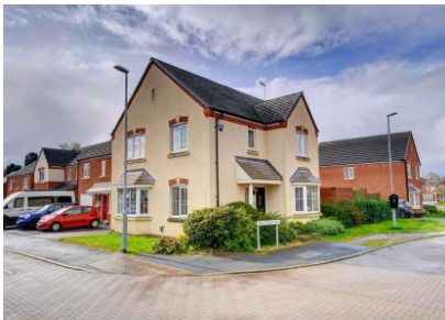
Greatwich Way, Kidderminster