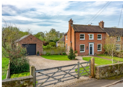
The Little House, 7 Tong Norton, Shifnal