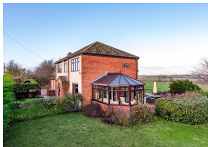
Longmoor House, Billingsley, Bridgnorth