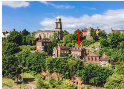
19 St. Marys Steps, Bridgnorth