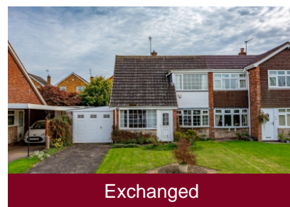
13 Greenfields Road, Wombourne, Wolverhampton