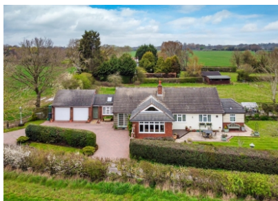
Holly Lodge, Church Lane, Boningale, Albrighton