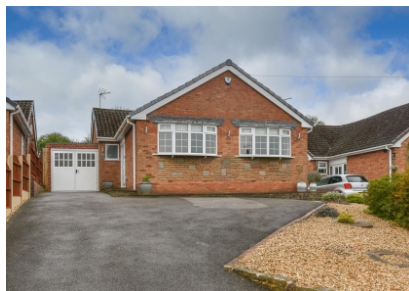
9 Brick Kiln Lane, Dudley