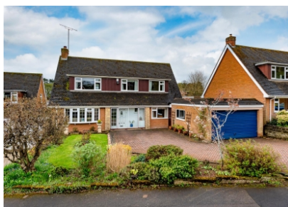
18 Quail Green, Wightwick, Wolverhampton