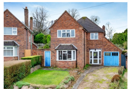
14 Peterdale Drive, Wolverhampton