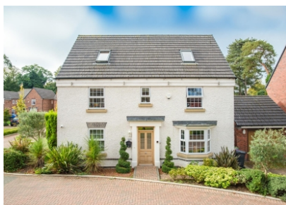
7 Great Hall Grove, Wolverhampton