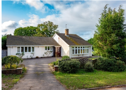
12 Keepers Lane, Codsall, Wolverhampton