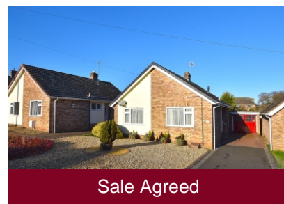
11 Greenleys Crescent, Alveley, Bridgnorth