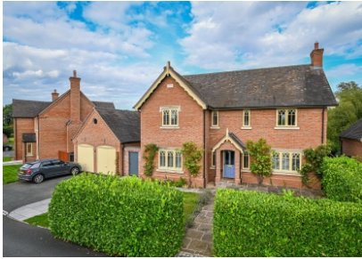
Fitzallen House, 3 Cound Park Drive, Cound, Shrewsbury