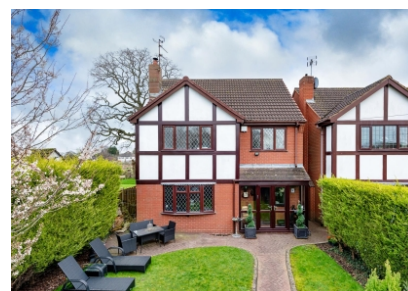
Waterford, Ball Lane, Coven Heath, Wolverhampton