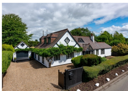
Pennygate, Paradise Lane, Slade Heath, Wolverhampton