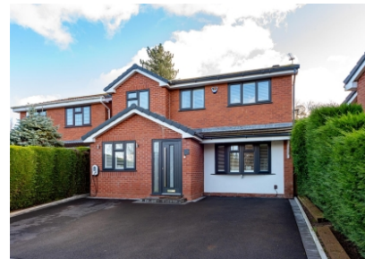
41 Ascot Drive, Dudley