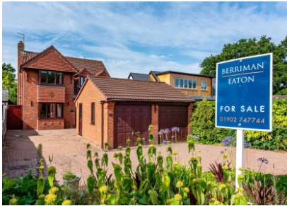
Bridgeside, 187 Birches Road, Codsall