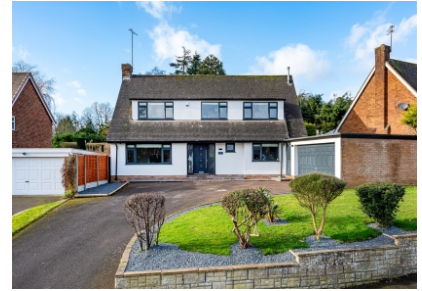
25 Perton Brook Vale, Wightwick