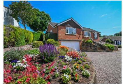
Three Ridges, Hilton, Bridgnorth