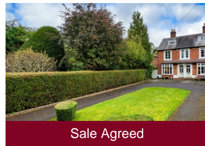
Fernleigh, 35 Oaken Lanes, Codsall