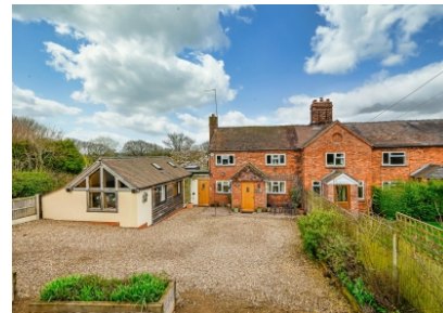
3 Tedstill Cottages, Middleton Scriven, Bridgnorth