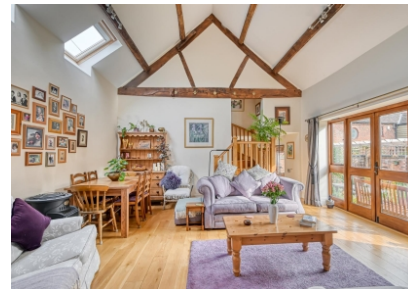
Tedstill Barn, Glazeley, Bridgnorth