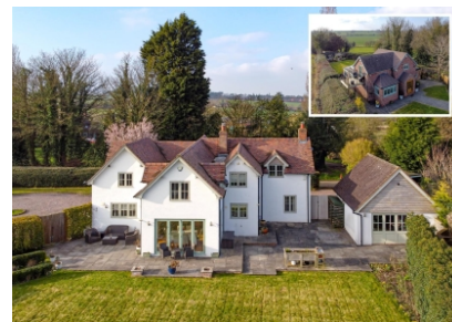
Oaklea and The Cottage, Damson Lane, Weston Heath, Shifnal