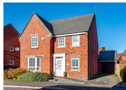
8 Brick Kiln Way, Baggeridge Village