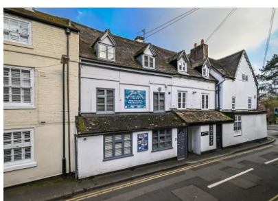
45 Cartway, Bridgnorth