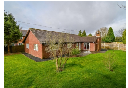
The Old Kiln, Church Lane, Bridgnorth