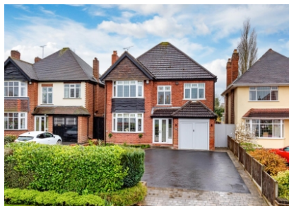
39 Meadow Road, Finchfield