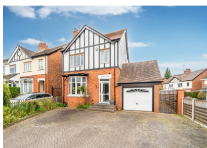
Tregunna, 27 Richmond Road, Finchfield