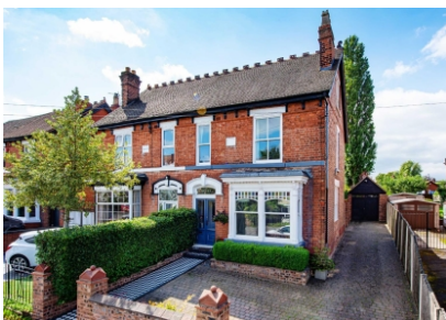
7 Richmond Road, Finchfield, Wolverhampton