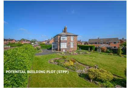
Hookfield House, 81 Victoria Road, Bridgnorth