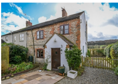
1 The Row, Easthope, Much Wenlock