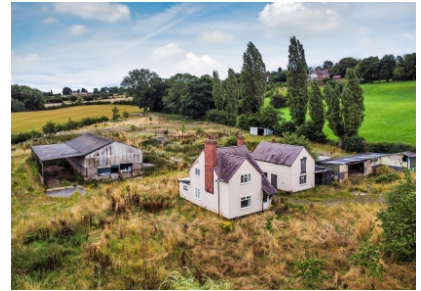
Robins Nest Farm, Dirty Foot Lane, Lower Penn, Wolverhampton