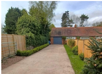
The Bungalow, Popes Lane, Wergs , Tettenhall