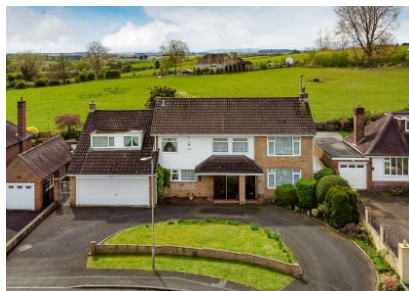
7 Wightwick Hall Road, Wightwick