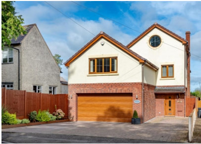
Mimosa Lodge, Histons Hill, Codsall