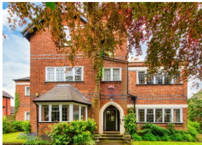
Cheviot House, 20 Stockwell Road, Tettenhall