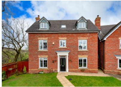
Oaklands, Wombourne, Wolverhampton