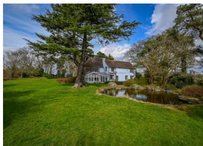
Horseshoes, Netherton, Highley, Bridgnorth