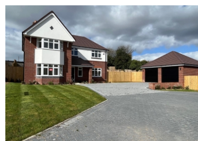
Rosewood House, 6 Rowan Grange, Broseley