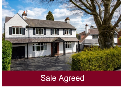
94 Codsall Road, Tettenhall, Wolverhampton