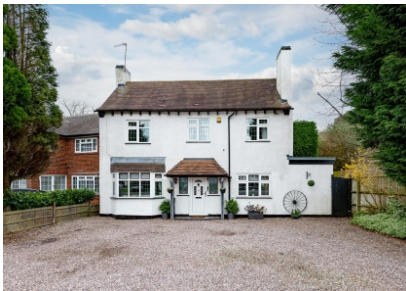
17 Stubbs Road, Wolverhampton