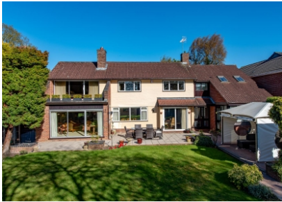
86 Woodthorne Road South, Tettenhall