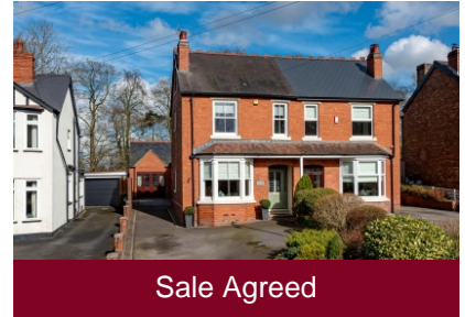
Medicote, 79 Wood Road, Codsall