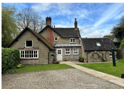
Brookside, Brockton, Much Wenlock