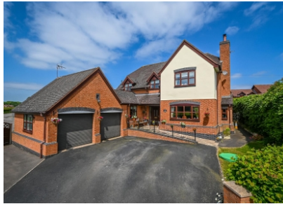
Cape Lodge, Billingsley, Bridgnorth