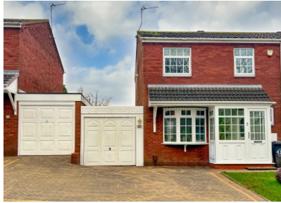
14 St James Street, Lower Gornal, Dudley