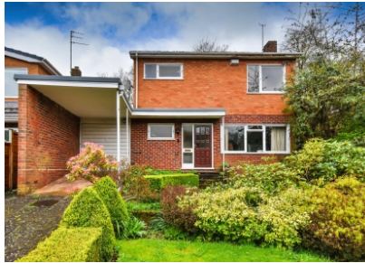
10 Ashfield Road, Compton, Wolverhampton