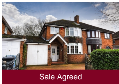
52 Wombourne Park, Wombourne, Wolverhampton