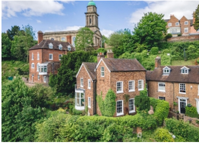
Castle Cliffe House, 24 St. Mary's Steps, Bridgnorth