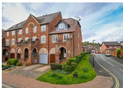
36 Southwell Riverside, Bridgnorth