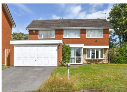
4 The Heathlands, Wombourne, Wolverhampton