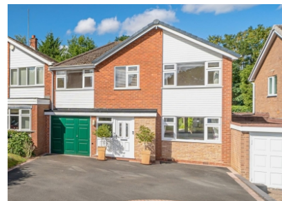
2 Whiteladies Court, Albrighton, Wolverhampton