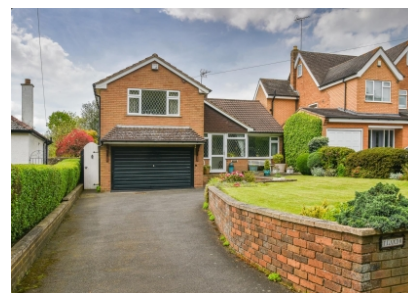
Stourbridge Road, Wombourne, Wolverhampton