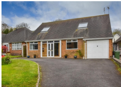
38 Foley Avenue, Tettenhall, Wolverhampton