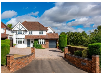
Hearthcote House, Poolhouse Road, Wombourne