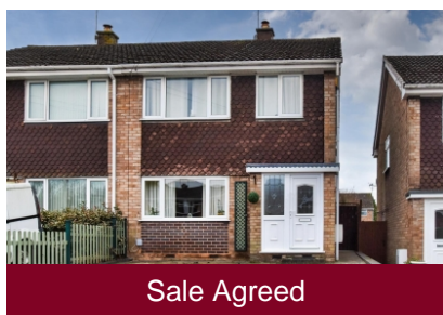
61 Wynchcombe Avenue, Penn, Wolverhampton