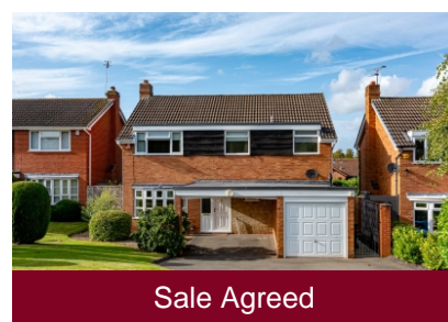
11 Copper Beech Drive, Wombourne, Wolverhampton