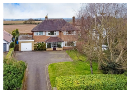
Grasmere, 5 Westbeech Road, Pattingham