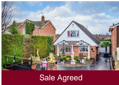
5 Bratch Common Road, Wombourne, Wolverhampton