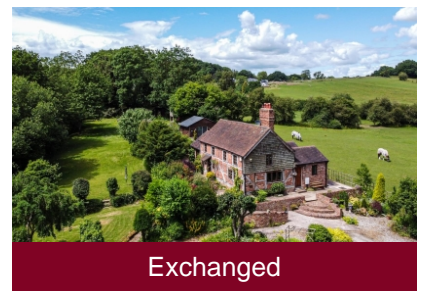
Beggar Hill House, 62 Muckley Cross, Acton Round, Bridgnorth