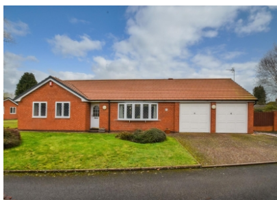
1 The Courts, Albrighton, Wolverhampton