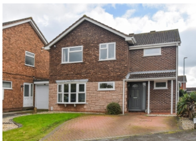
12 The Meadlands, Wombourne, Wolverhampton