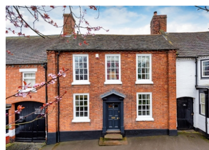
Saredon House, 28 Stafford Street, Brewood