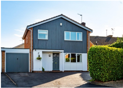
4 Beech Close, Pattingham, Wolverhampton