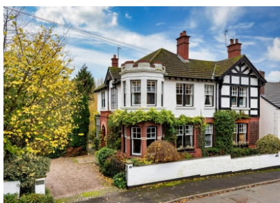
Battlefield House, 14 Battlefield Hill, Wombourne, Wolverhampton