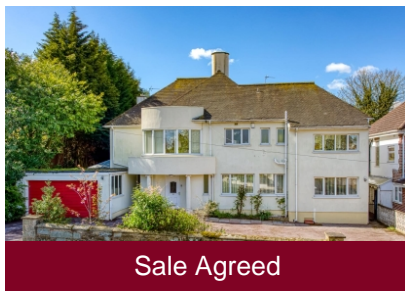
17 Muchall Road, Penn, Wolverhampton