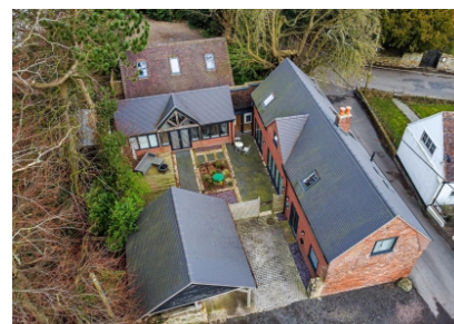
The Old Coach House, Little Wenlock, Telford