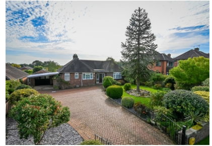
53 Conduit Lane, Bridgnorth