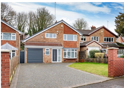
3 St. Marys Close, Dudley