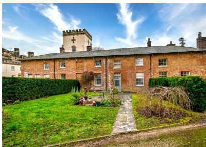
2 Apley Park Mews, Apley, Bridgnorth