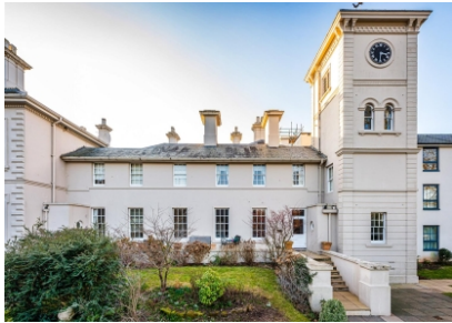
2 Old Hall, Wergs Hall Road, Tettenhall