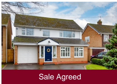
89 Redhouse Road, Tettenhall, Wolverhampton