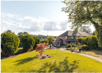
Sunnybank, 11b, Danesford, Bridgnorth