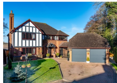
47 Fairfield Drive, Codsall, Wolverhampton