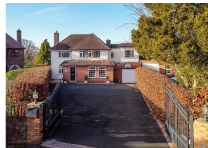
Fern House, Links Avenue, Tettenhall