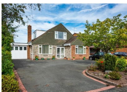
83 Cranmere Avenue, Tettenhall, Wolverhampton