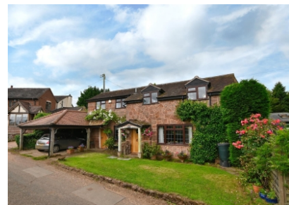
Finger Cottage, 123 Birds Green, Alveley, Bridgnorth