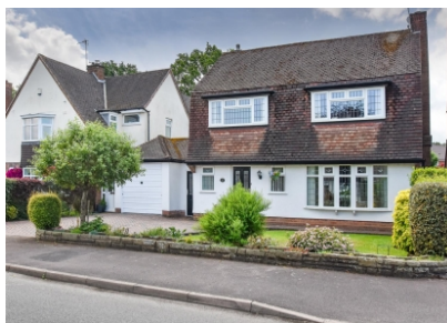
57 Oaken Park, Codsall, Wolverhampton