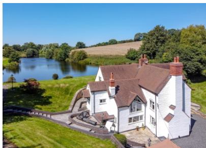
Hem Mill, The Hem, Shifnal