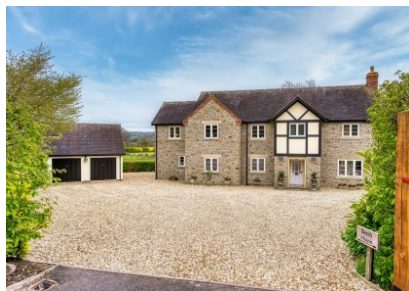
Beech House, Munslow, Shropshire