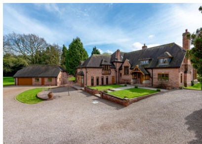
Meadowcroft, Pitchcroft Lane, Chetwynd Aston, Newport