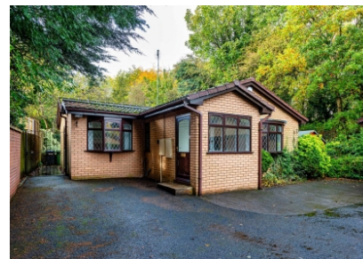
6 Finchfield Hill, Compton, Wolverhampton