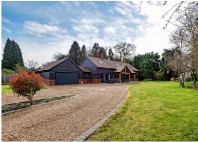
Willow Lodge, 23 High Street, Albrighton