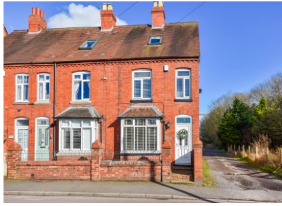
26 Innage Road, Shifnal