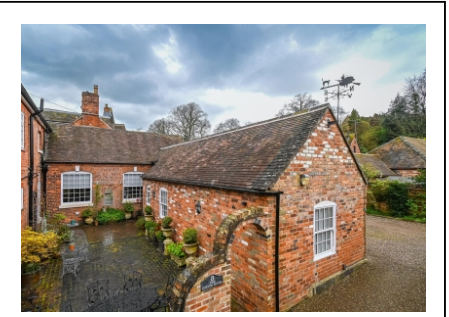
Corner House, 3 Stableford Hall, Stableford, Bridgnorth