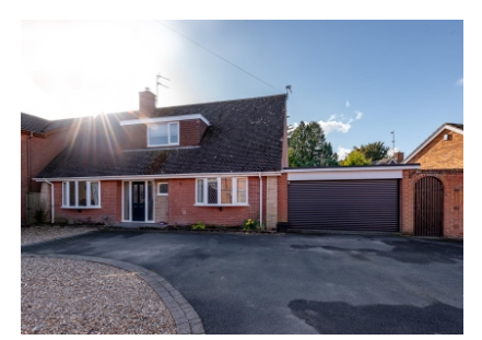
Strathmore, Shaw Lane, Albrighton