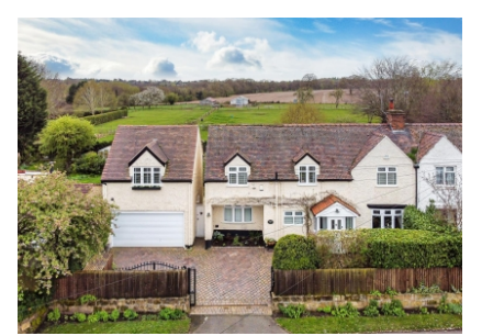
15 Birches Road, Codsall, Wolverhampton