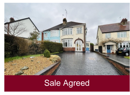
31 Sedgley Road, Penn Common, Penn