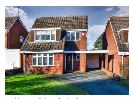
15 Histons Drive, Codsall, Wolverhampton