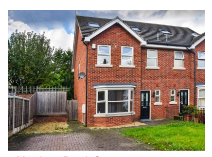
1 Marchant Road, Compton, Wolverhampton