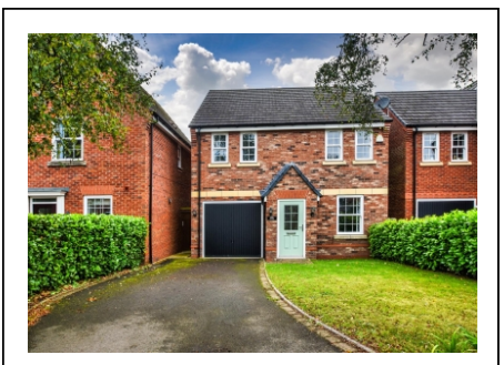
Eden House, Wombourne Road, Swindon, Dudley