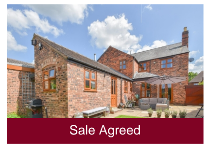
The Cottage, 18 Shop Lane, Oaken