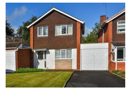
9 Westhill, Wolverhampton