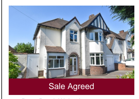
490 Penn Road, Wolverhampton