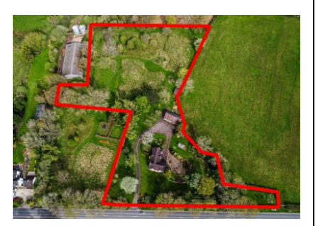
Dodds Green Cottage, 79 Dodds Green, Alveley, Bridgnorth