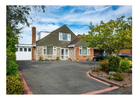
83 Cranmere Avenue, Tettenhall, Wolverhampton