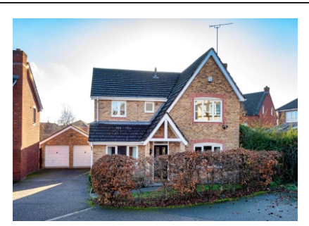
17 Holendene Way, Wombourne, Wolverhampton