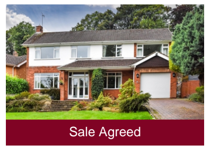
5 Firsway, Wightwick