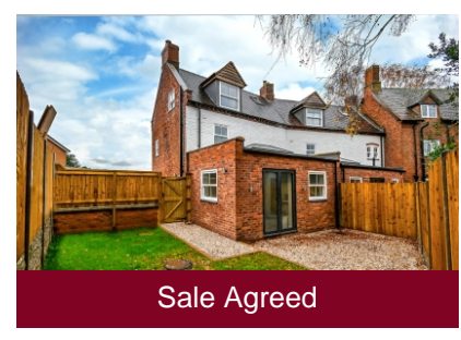
4 Rudge Road, Pattingham, Wolverhampton