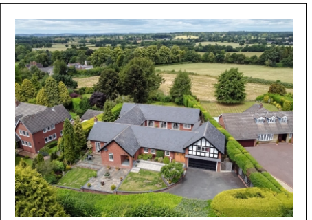
Courtneys, Oaken Drive, Oaken, Codsall