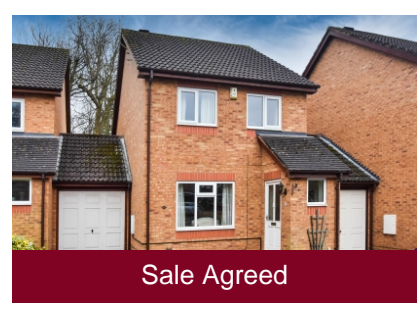
14 Alpine Way, Compton, Wolverhampton