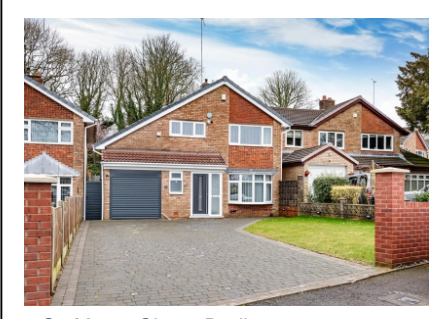
3 St. Marys Close, Dudley