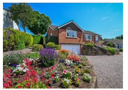
Three Ridges, Hilton, Bridgnorth