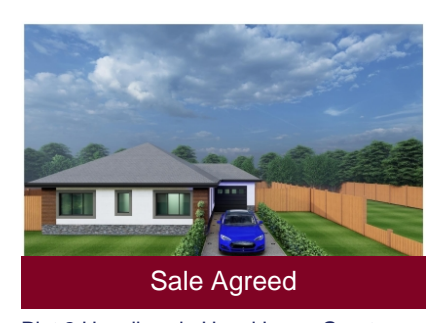
Plot 2 Hazelbrook, Hazel Lane, Great Wyrley