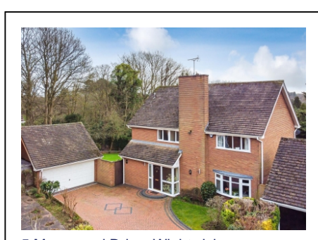
5 Mayswood Drive, Wightwick