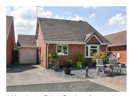
4 Hazelmere Drive, Castlecroft, Wolverhampton