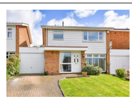
4 Forton Close, Compton, Wolverhampton