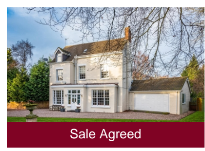
Grove House, 25 Oaken Lanes, Codsall