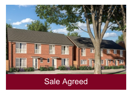
Plot 2 Nightingale Place, Vicarage Road, Wolverhampton