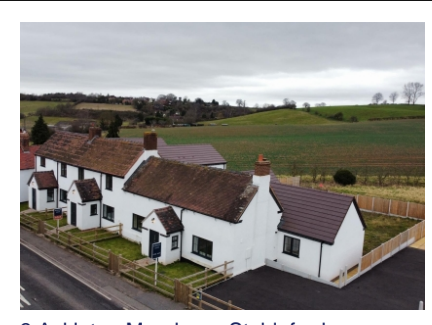
3 Ackleton Meadows, Stableford, Bridgnorth