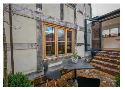
Park Cottage, Abbey Foregate, Shrewsbury