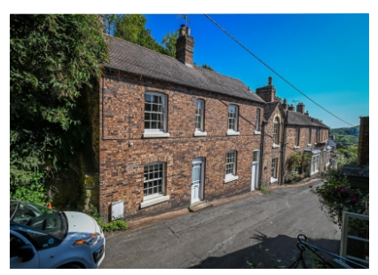
25 Church Hill, Ironbridge, Telford