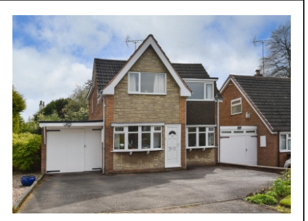
56 Bantock Gardens, Finchfield