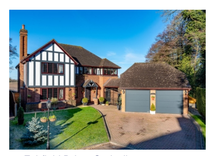
47 Fairfield Drive, Codsall, Wolverhampton