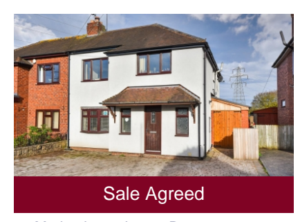
44 Market Lane, Lower Penn, Wolverhampton