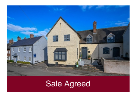
7 Bull Ring, Claverley, Wolverhampton