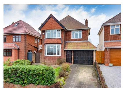
15 Foxlands Avenue, Wolverhampton