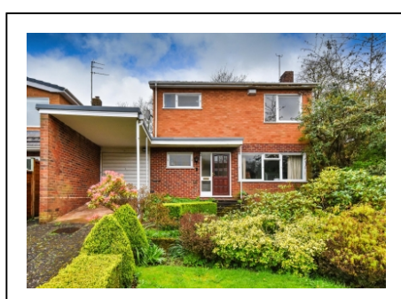
10 Ashfield Road, Compton, Wolverhampton