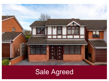
17 Fieldview Close, Coseley, Bilston