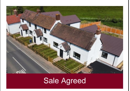
2 Ackleton Meadows, Stableford, Bridgnorth