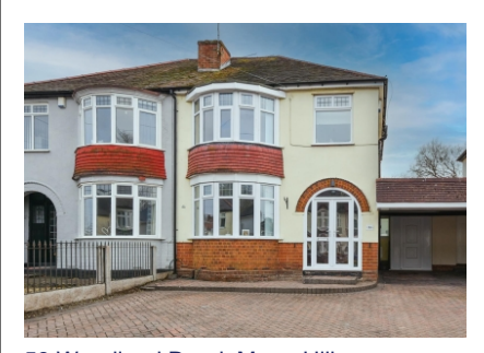
53 Woodland Road, Merry Hill, Wolverhampton