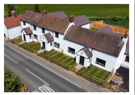
1 Ackleton Meadows, Stableford, Bridgnorth