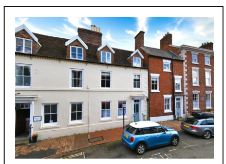
28 East Castle Street, Bridgnorth