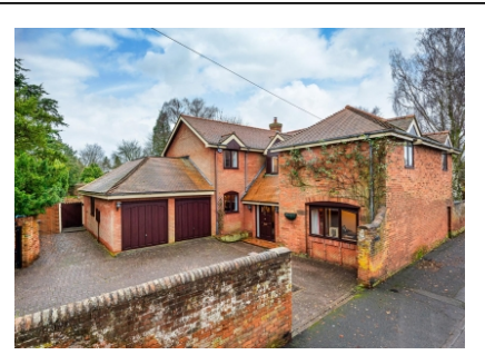
Manor Court, Cross Road, Albrighton, Wolverhampton