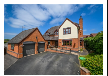
Cape Lodge, Billingsley, Bridgnorth