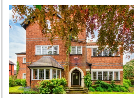
Cheviot House, 20 Stockwell Road, Tettenhall