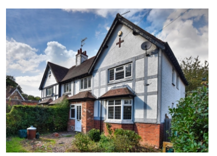
2 Danescourt Cottages, Danescourt Road, Tettenhall