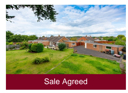
7 Blakeley Heath Drive, Wombourne, Wolverhampton