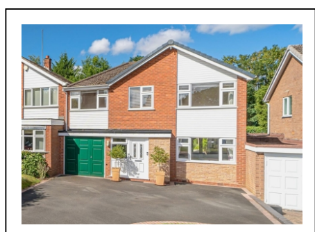
2 Whiteladies Court, Albrighton, Wolverhampton