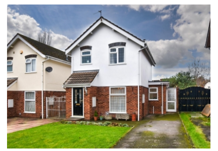
8 Laburnum Street, Wolverhampton