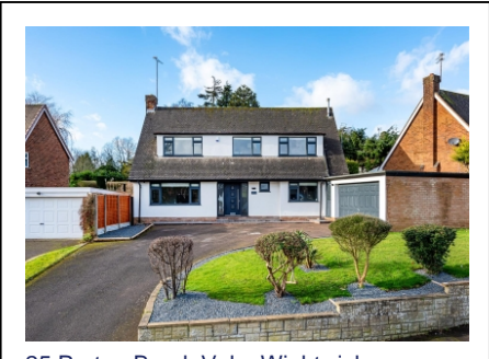
25 Perton Brook Vale, Wightwick