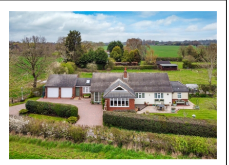
Holly Lodge, Church Lane, Boningale, Albrighton