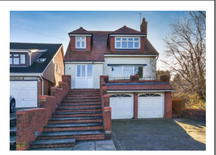
25 Bognop Road, Essington, Wolverhampton