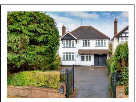
Maleesh, Stourbridge Road, Wombourne