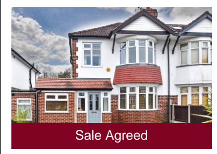
103 Windsor Avenue, Penn, Wolverhampton