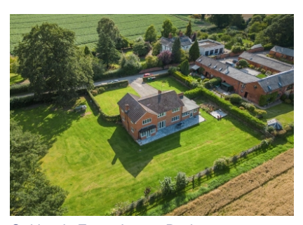
Oaklands Farm, Lower Rudge, Pattingham, Wolverhampton