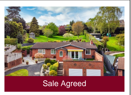
18 Bramble Ridge, Bridgnorth