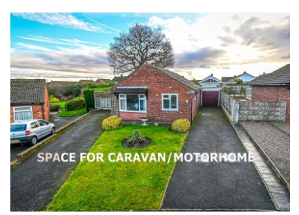
51 Linley View Drive, Bridgnorth