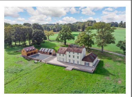
Home Farm, Gatacre, Claverley, Wolverhampton