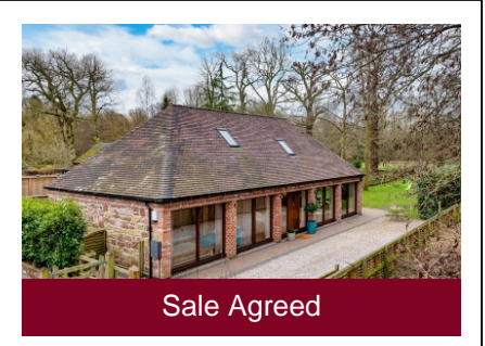
Eagle Barn, 4 Patshull Gardens, Albrighton