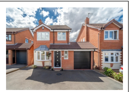
23 Penleigh Gardens, Wombourne