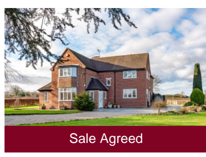
Trentham, Lapley Road, Wheaton Aston