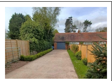
The Bungalow, Popes Lane, Wergs, Tettenhall