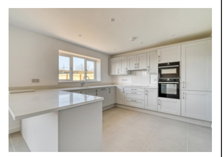
Green Acres, 3 Rowan Grange, Broseley