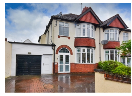
Pennhouse Avenue, Wolverhampton