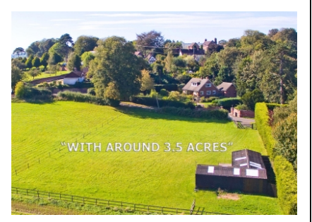
Half Acre House, Stableford, Bridgnorth