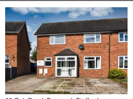
69 Oak Road, Brewood, Stafford