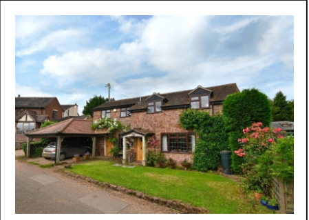
Finger Cottage, 123 Birds Green, Alveley, Bridgnorth