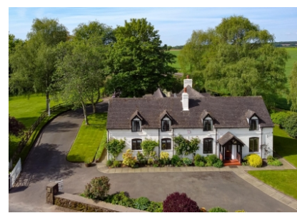
The Little Green, 2 Feiashill Road, Trysull, Wolverhampton