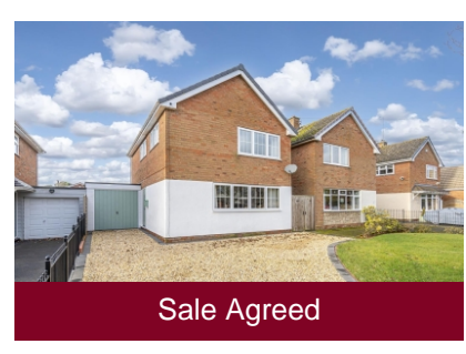
48 Clive Road, Pattingham, Wolverhampton