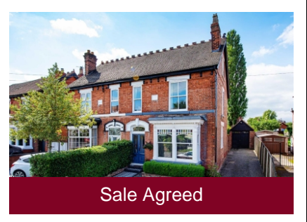
7 Richmond Road, Finchfield, Wolverhampton