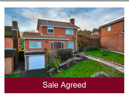
15 Bramble Ridge, Bridgnorth