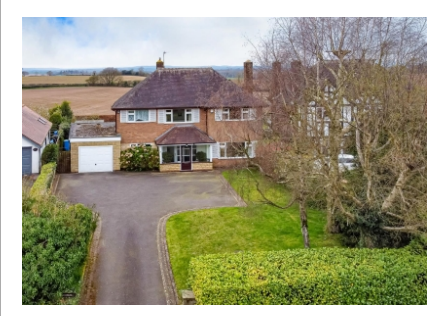
Grasmere, 5 Westbeech Road, Pattingham