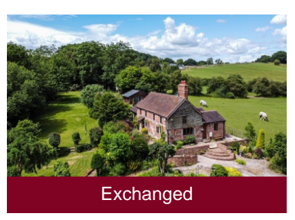
Beggar Hill House, 62 Muckley Cross, Acton Round, Bridgnorth