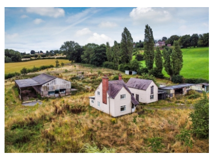
Robins Nest Farm, Dirty Foot Lane, Lower Penn, Wolverhampton