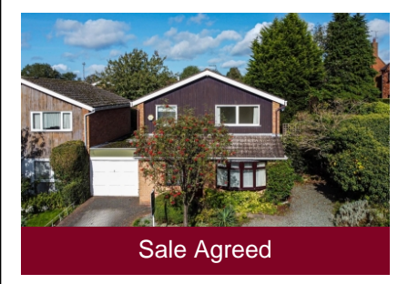
2 Beech Close, Pattingham, Wolverhampton