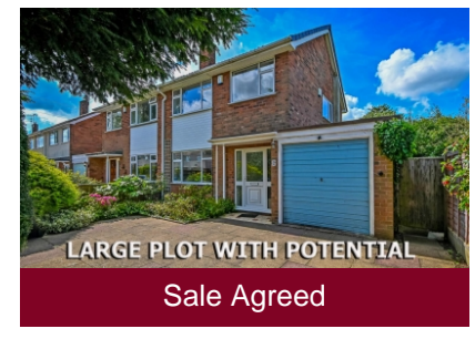
6 Moor Lane, Pattingham, Wolverhampton