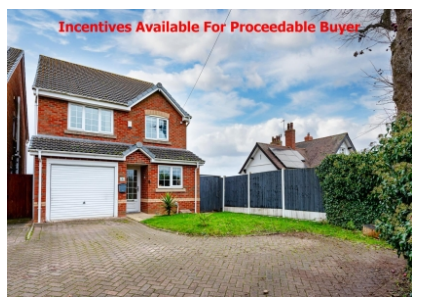
151 Tipton Road, Woodsetton, Dudley