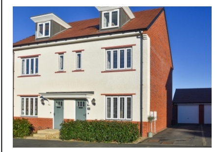
11 Marshall Way, Codsall, Wolverhampton