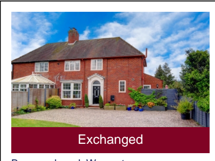
Bromyard road, Worcester