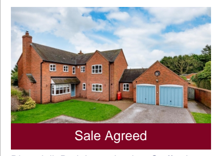
Rivendell, Park Lane, Lapley, Stafford