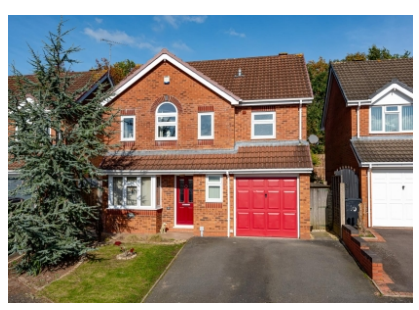
12 Dudmaston Way, Milking Bank, Dudley