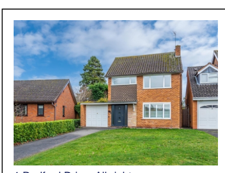
1 Redford Drive, Albrighton