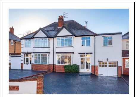
7 Osborne Road, Wolverhampton