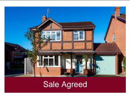
39 Penleigh Gardens, Wombourne, Wolverhampton