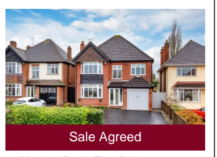
39 Meadow Road, Finchfield