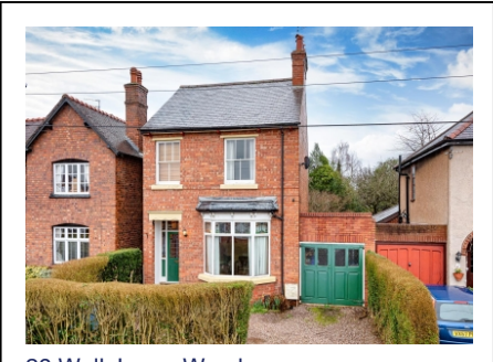
29 Walk Lane, Wombourne