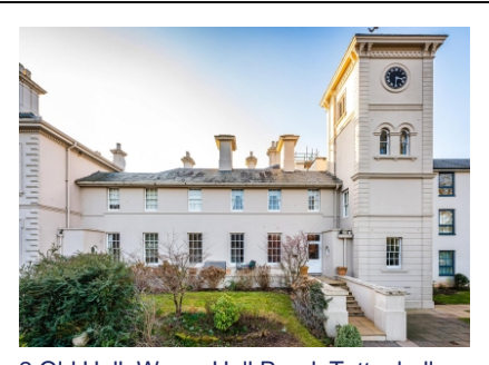
2 Old Hall, Wergs Hall Road, Tettenhall