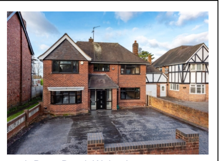
288b Penn Road, Wolverhampton