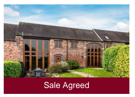
The Corn Barn, 3 East Trescott Barns Bridgnorth Road