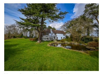
Horseshoes, Netherton, Highley, Bridgnorth