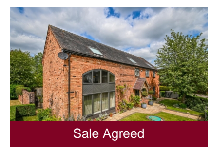
1 The Paddock, Claverley, Wolverhampton