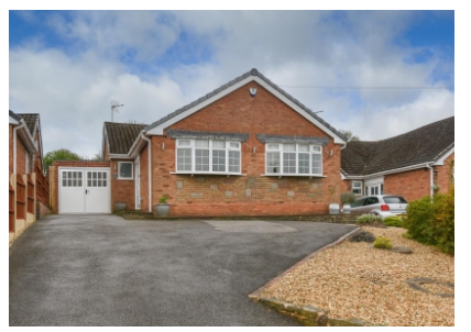
9 Brick Kiln Lane, Dudley