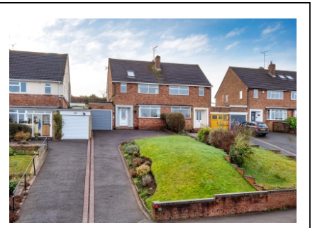
44 Common Road, Wombourne, Wolverhampton