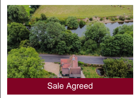
Holme Cottage, Knowle Sands, Bridgnorth