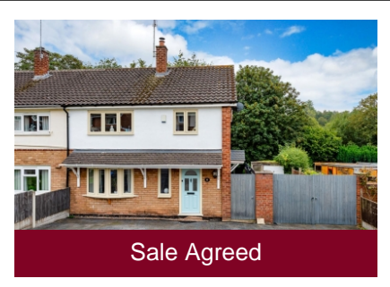
6 Moises Hall Road, Wombourne, Wolverhampton