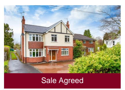
74 Langley Road, Wolverhampton