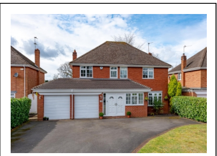
18 Corfton Drive, Tettenhall