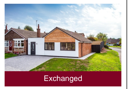
1 Barclay Close, Albrighton, Wolverhampton