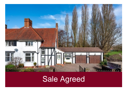
9 Myrtle Grove, Bradmore, Wolverhampton