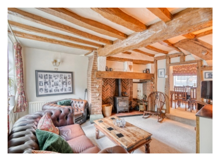
Bridgend Cottage, 43 Cartway, Bridgnorth