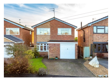
3 Braemar Road, Pattingham, Wolverhampton