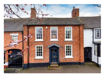
Saredon House, 28 Stafford Street, Brewood