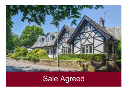
Woodhouse Lodge, Wood Road, Tettenhall Wood