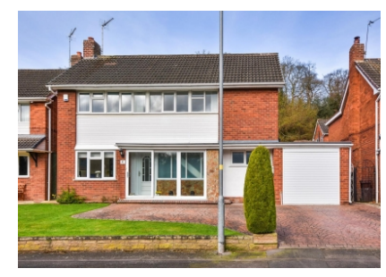
97 Henwood Road, Compton, Wolverhampton