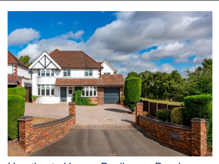
Hearthcote House, Poolhouse Road, Wombourne