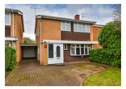
30 Sytch Lane, Wombourne, Wolverhampton