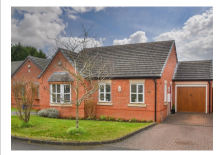
14 Berkeley Close, Perton, Wolverhampton