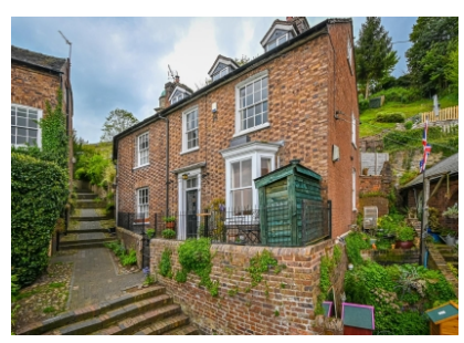
19 St. Marys Steps, Bridgnorth