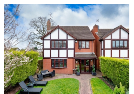
Waterford, Ball Lane, Coven Heath, Wolverhampton