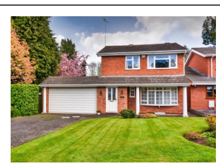
18 Fair Oak Drive, Wolverhampton