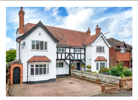
23 Hinckes Road, Tettenhall, Wolverhampton