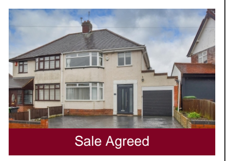
19 Sandringham Road, Penn, Wolverhampton