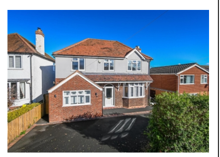
109 Victoria Road, Bridgnorth