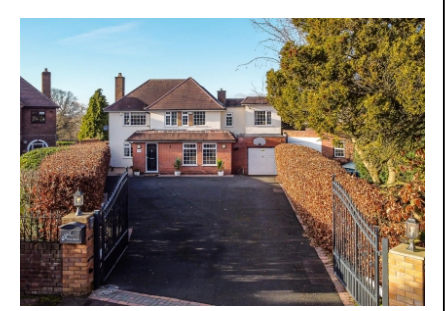
Fern House, Links Avenue, Tettenhall