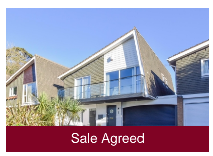
2 Cheswell Close, Compton, Wolverhampton