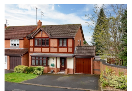
19 Penleigh Gardens, Wombourne, Wolverhampton