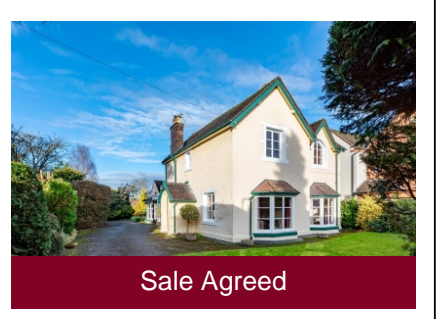
Ferndale, 7 Cross Road, Albrighton