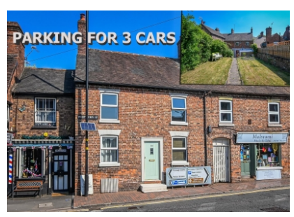
50 Whitburn Street, Bridgnorth