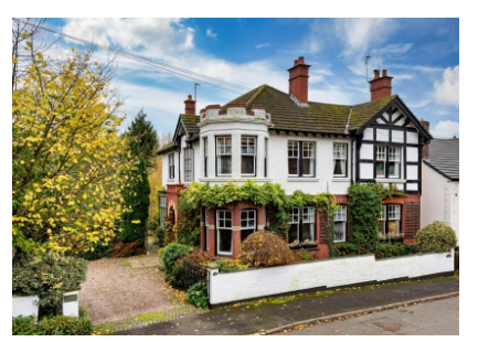
Battlefield House, 14 Battlefield Hill, Wombourne, Wolverhampton