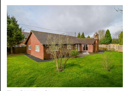
The Old Kiln, Church Lane, Bridgnorth