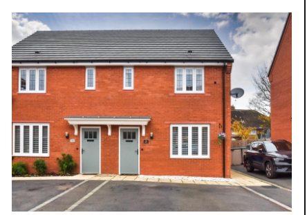
35 Foxglove Way, Himley