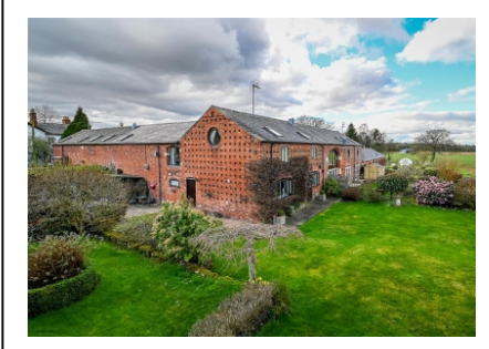
The Oak House, Oaklands Court, Lower Rudge, Pattingham