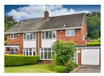
23 Chequers Avenue, Wombourne, Wolverhampton