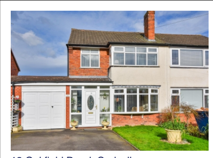
12 Oakfield Road, Codsall, Wolverhampton