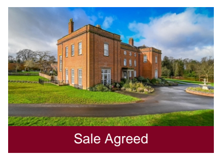
Upper Mill Meadow, Gatacre Hall, Gatacre, Claverley, Wolverhampton