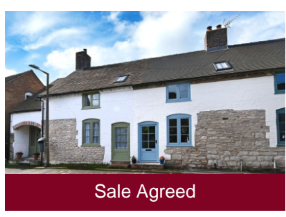
41 Barrow Street, Much Wenlock