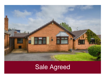
56 Coton Road, Wolverhampton