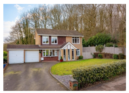
Wychaven, The Holloway, Swindon, Dudlev