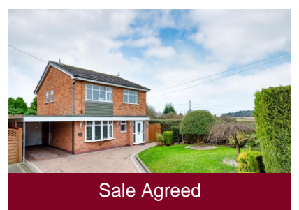
29 Windsor Road, Pattingham, Wolverhampton