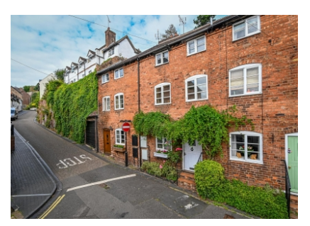
70 Cartway, Bridgnorth