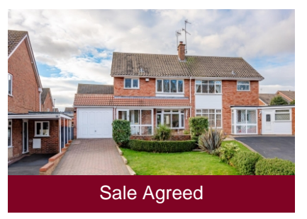
14 Chequers Avenue, Wombourne, Wolverhampton