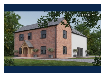
Plot 1, Bynd Lane, Billingsley, Bridgnorth