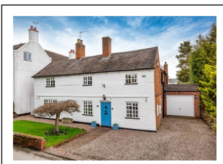
Garden Cottage, 4 Shop Lane, Brewood