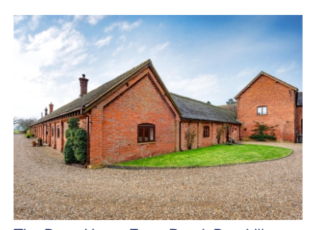
The Byre, Home Farm Road, Burnhill Green, Wolverhampton