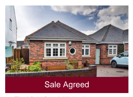
70 Finchfield Road, Wolverhampton