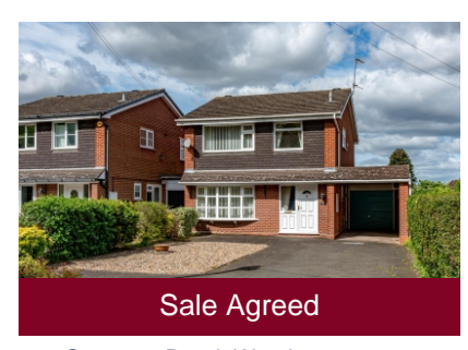
191 Common Road, Wombourne, Wolverhampton