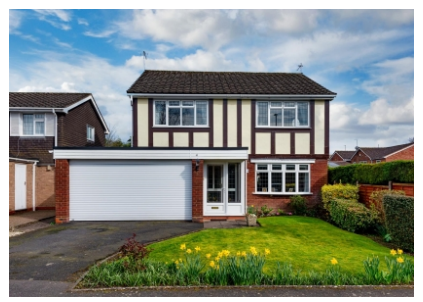
4 Rivendell Gardens, Tettenhall