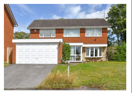
4 The Heathlands, Wombourne, Wolverhampton