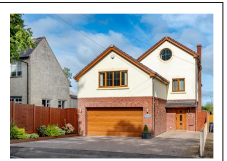
Mimosa Lodge, Histons Hill, Codsall