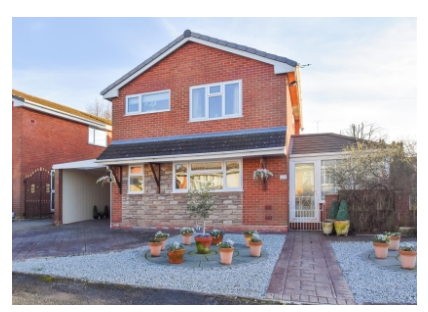
23 Bellencroft Gardens, Merry Hill, Wolverhampton