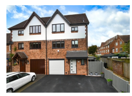
2 King Charles Way, Bridgnorth