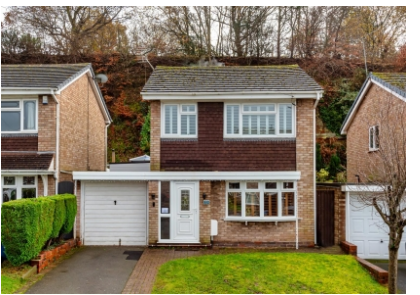
23 Redcliffe Drive, Wombourne, South Stafforshire