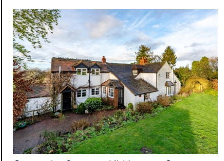
Greystoke Cottage, Kiddemore Green, Brewood