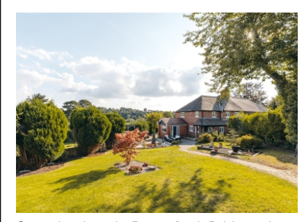
Sunnybank, 11b, Danesford, Bridgnorth