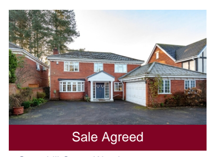
2 Greenhill Court, Wombourne, Wolverhampton