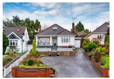
74 Bridgnorth Road, Compton