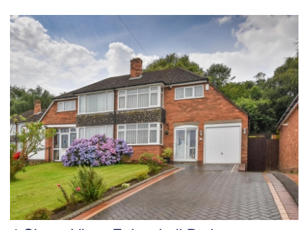
4 Chase View, Ettingshall Park, Wolverhampton