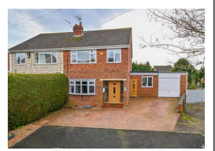
15 Crannmore Drive, Highley, Bridgnorth