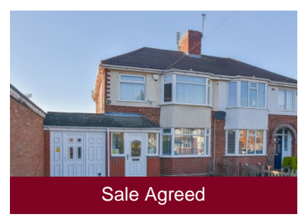
69 Fancourt Avenue, Wolverhampton