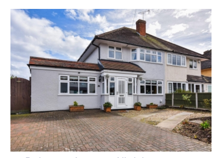
34 Delaware Avenue, Albrighton