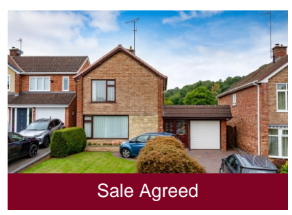
51 Strathmore Crescent, Wombourne