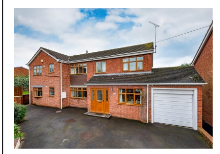
15 Ounsdale Crescent, Wombourne, Wolverhampton