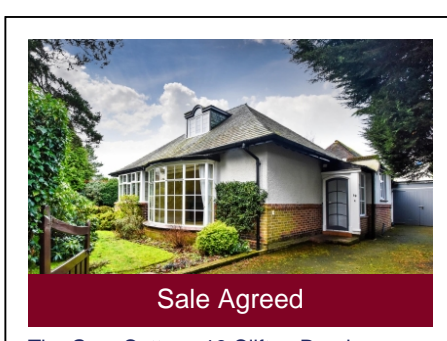
The Grey Cottage 19 Clifton Road, Wolverhampton