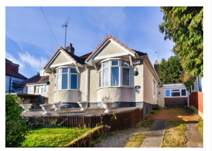
The Chalett, 78 Bridgnorth Road, Compton