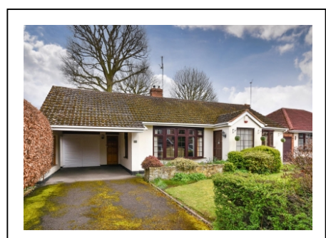
30 Sabrina Road, Wightwick, Wolverhampton