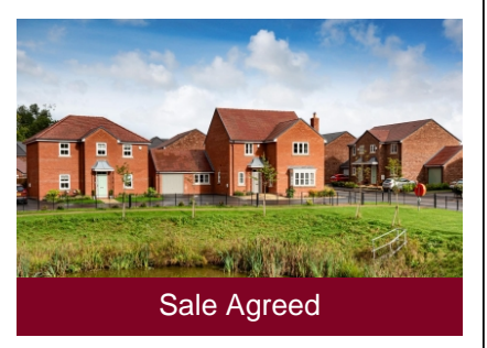
1 Millfield Road, Albrighton, Wolverhampton