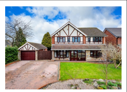
11 Waverley Gardens, Wombourne, Wolverhampton