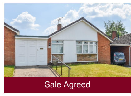
13 The Broadway, Wombourne, Wolverhampton