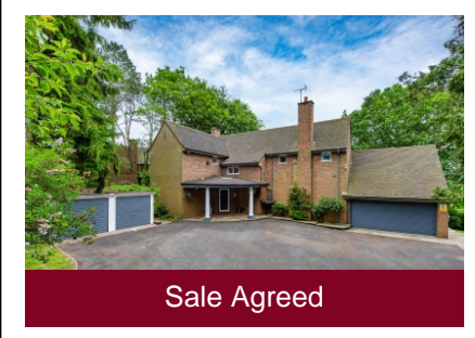
Farthings Hill, Pattingham Road, Perton Ridge