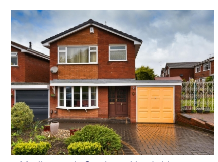
7 Marlborough Gardens, Newbridge, Wolverhampton