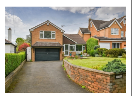
Stourbridge Road, Wombourne, Wolverhampton