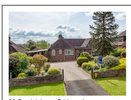
53 Conduit Lane, Bridgnorth