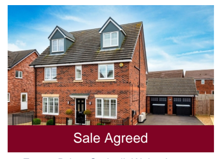
43 Farran Drive, Codsall, Wolverhampton