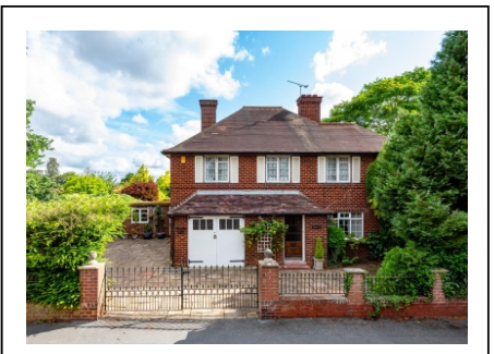
Oxleaze, Grange Road, Albrighton