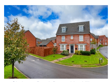
35 Chalmers Road, Baggeridge Village, Dudley