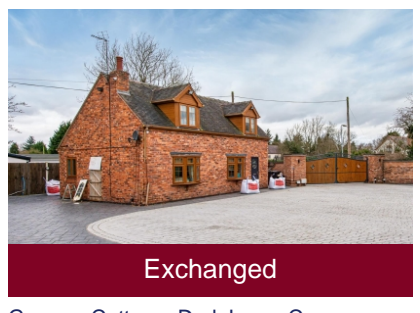
Granary Cottage, Dark Lane, Cross Green, Wolverhampton