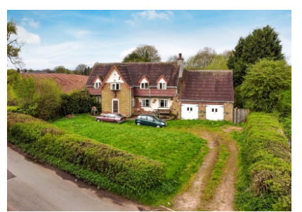
Mill Cottage, Lower Rudge, Pattingham, Wolverhampton