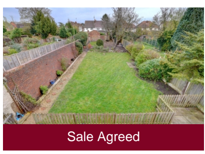
Grosvenor Avenue, Kidderminster