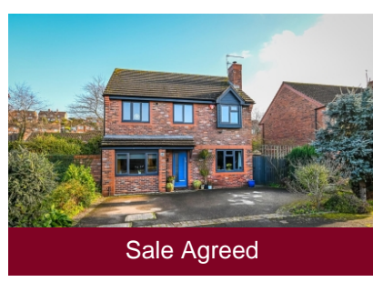
10 Washbrook Road, Bridgnorth