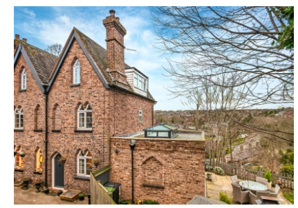
14 West Castle Street, Bridgnorth