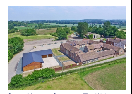
Saxon Meadow Cottage 5, The Wyke, Shifnal