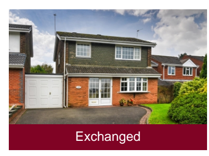
39 Bantock Gardens, Finchfield, Wolverhampton