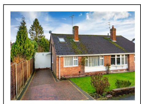
1 Norton Close, Penn, Wolverhampton