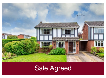
16 Meadow Vale, Codsall, Wolverhampton