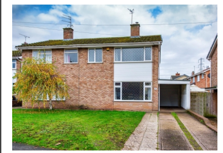
36 Wombourne Road, Swindon, Dudley