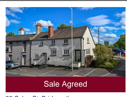
33 Salop St, Bridgnorth