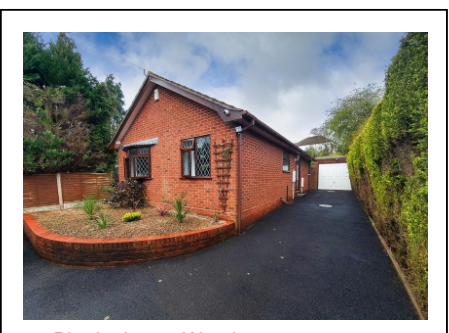
10 Planks Lane, Wombourne, Wolverhampton