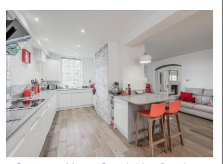
4 Stanmore Mews, Stourbridge Road, Stanmore, Bridgnorth