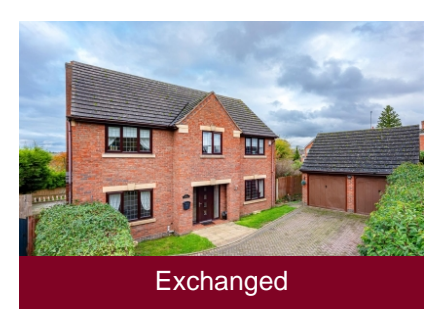
Wodehouse Lane, Dudley