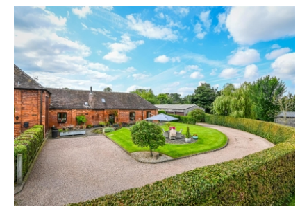
The Stables, Chesterton, Bridgnorth