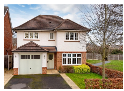
35 Bluebell Way, Shifnal