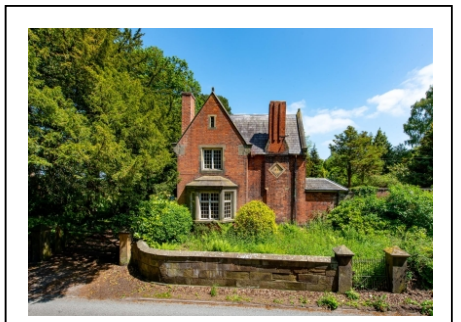
Wergs Hall Gardens, Wergs Hall Road, Tettenhall