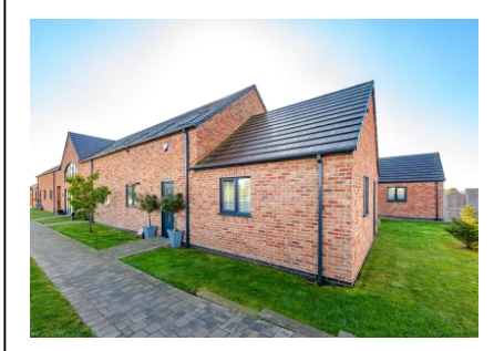
6 Lea Manor Gardens, Albrighton, Wolverhampton