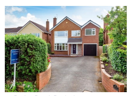
18 Rudge Road, Pattingham, Wolverhampton