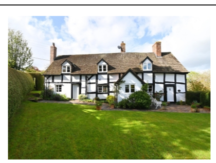
Clovers, Stableford, Bridgnorth