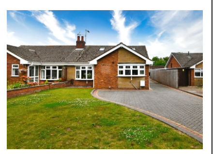
6 Lime Close, Alveley, Bridgnorth