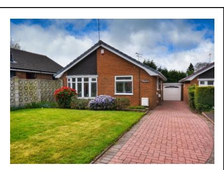
19 Finchdene Grove, Finchfield, Wolverhampton