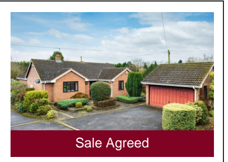
Shadowbrook, 4 Manor Fold, Middle Lane, Oaken