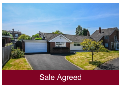
50 The Wold, Claverley, Shropshire