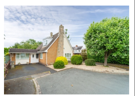
8 The Orchard, Albrighton