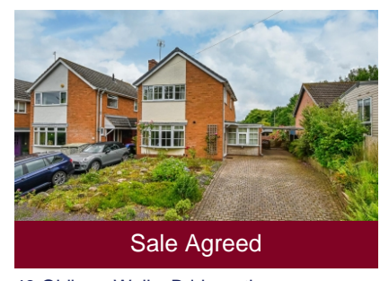
49 Oldbury Wells, Bridgnorth