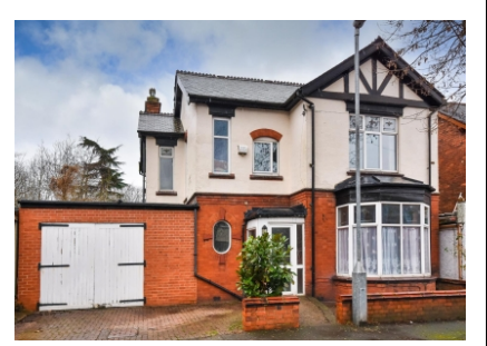
18 Elm Avenue, Bilston, Wolverhampton