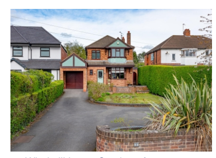
95 Windmill Lane, Castlecroft, Wolverhampton