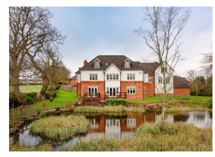
4 Albrighton House, The Water Gardens, Wolverhampton