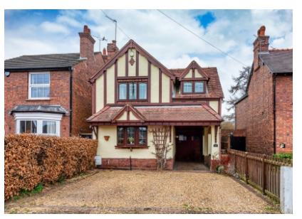
25 Walk Lane, Wombourne, Wolverhampton