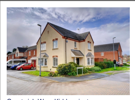
Greatwich Way, Kidderminster