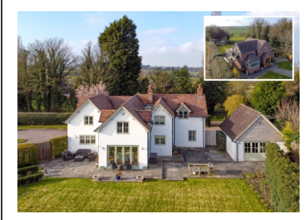
Oaklea and The Cottage, Damson Lane, Weston Heath, Shifnal