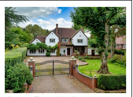
Hillside, 3 Tinacre Hill, Wightwick