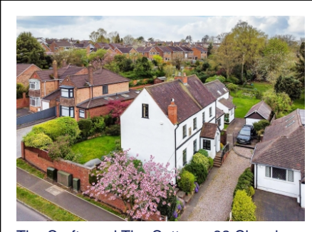
The Crofts and The Cottage, 32 Church Hill, Penn