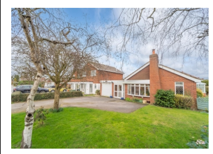
Madeira, 45 Keepers Lane, Codsall, Wolverhampton