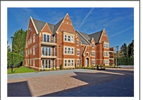
5 Ellen Place, Henry Fowler Drive, Tettenhall