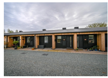
The Willow, 3 The Closes, Sutton Farm, Claverley, Wolverhampton