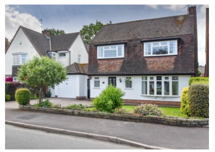
57 Oaken Park, Codsall, Wolverhampton