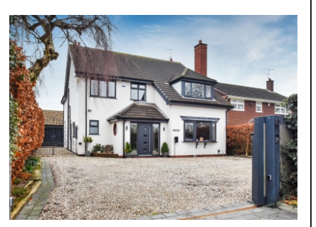
Clearview, Straight Mile, Calf Heath, Wolverhampton