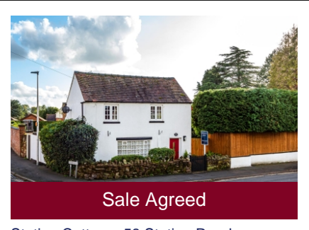
Station Cottage, 58 Station Road, Albrighton