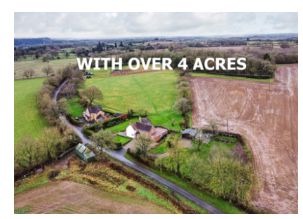
Keepers Cottage, Colemore Green, Bridgnorth