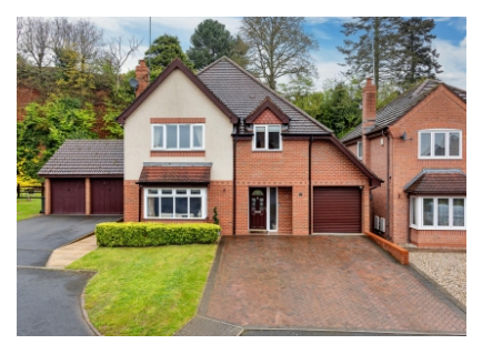
Hillside, Wombourne, Wolverhampton