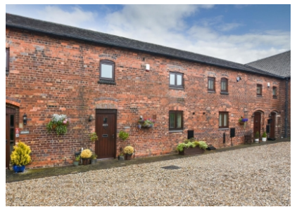
3 Manor Farm Barns, Bognop Road, Essington