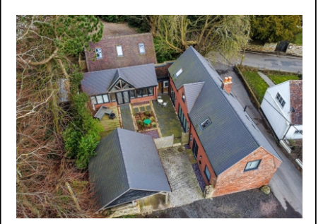
The Old Coach House, Little Wenlock, Telford