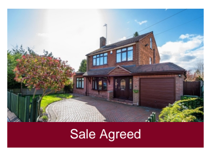
13 Springhill Lane, Wolverhampton