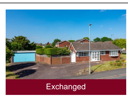
44 Woodcote Road, Wolverhampton