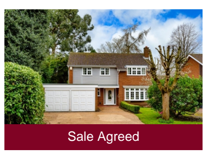
1 Mountwood Covert, Tettenhall Wood, Wolverhampton