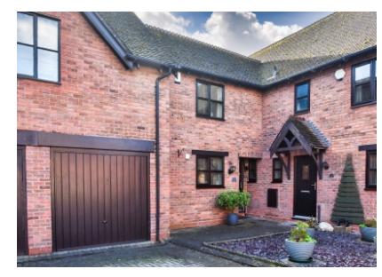
17 Bridgeman Court, Weston-Under-Lizard, Shifnal