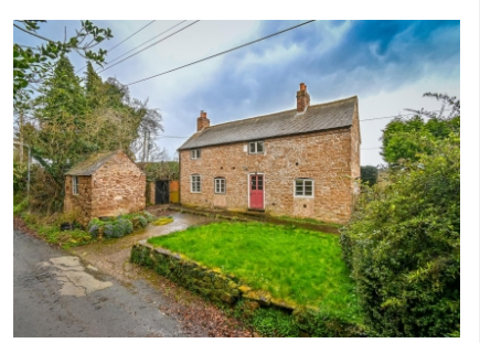
148 Broad Oak, Six Ashes