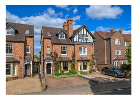
2 Westgate Villas, Salop Street, Bridgnorth