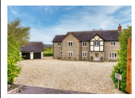
Beech House, Munslow, Shropshire