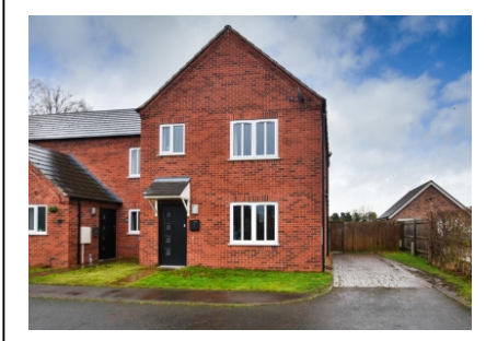
4 Lower Lanes Meadow, Seisdon, Wolverhampton