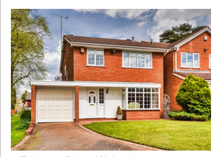
1 Foxlands Drive, Wolverhampton