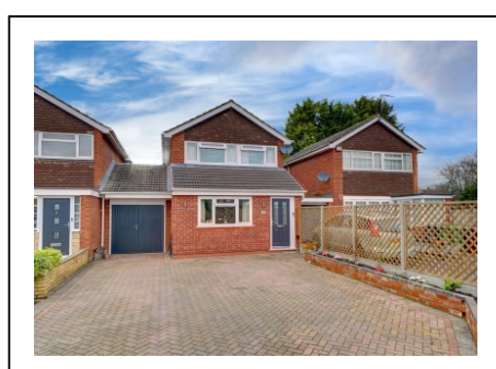
Elderberry Close, Stourport-On-Severn