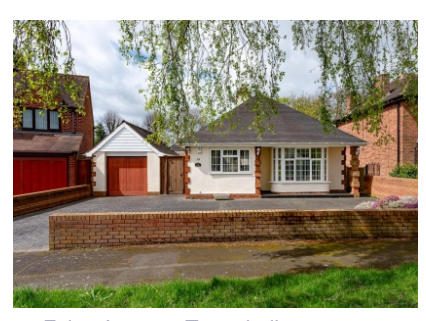
19 Foley Avenue, Tettenhall, Wolverhampton