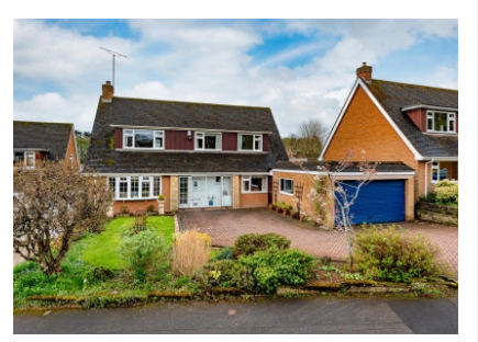
18 Quail Green, Wightwick, Wolverhampton