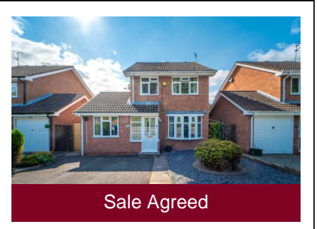
42 Gainsborough Drive, Perton, Wolverhampton