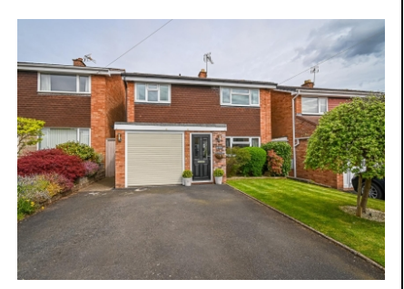
18 Stretton Close, Bridgnorth