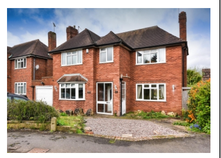
66 York Avenue, Finchfield, Wolverhampton