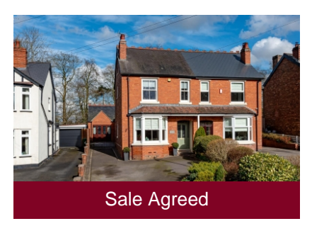
Medlicote, 79 Wood Road, Codsall