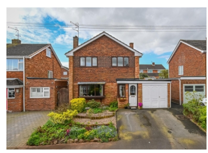
4 Whitmore Close, Bridgnorth