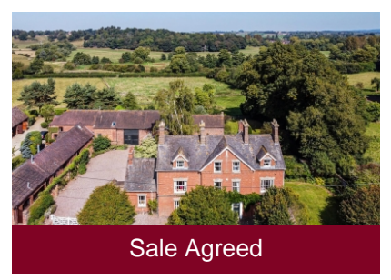
Roughton Farmhouse, Roughton, Bridgnorth