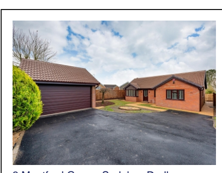
3 Montford Grove, Sedgley, Dudley