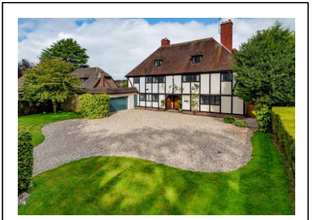
Findon, Haughton Lane, Shifnal