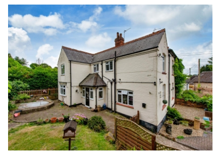
1 & 2 New Cottages, Oaken Lane, Oaken