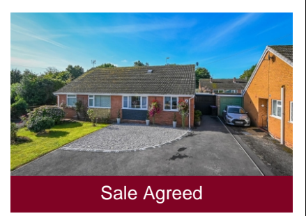
10 Captains Road, Bridgnorth