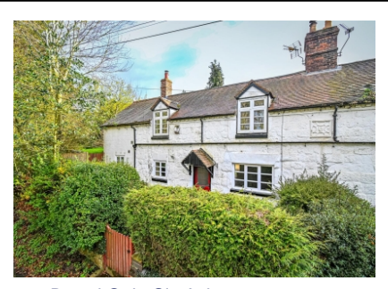
146 Broad Oak, Six Ashes