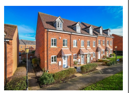
75 Rastrick Close, Bridgnorth