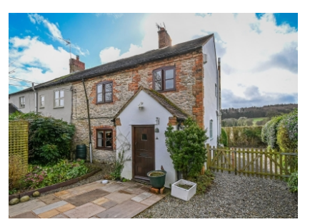
1 The Row, Easthope, Much Wenlock