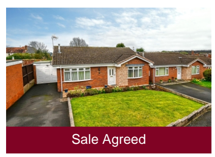
7 Claremont Drive, Bridgnorth