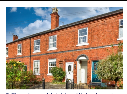
3 Shaw Lane, Albrighton, Wolverhampton