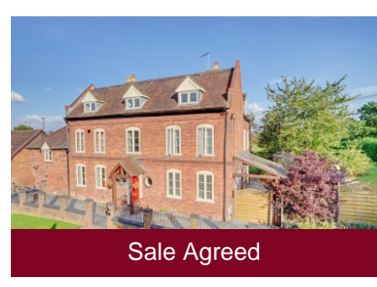
Austcliffe Road, Cookley, Kidderminster