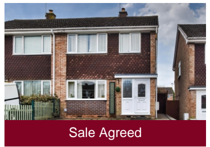
61 Wynchcombe Avenue, Penn, Wolverhampton