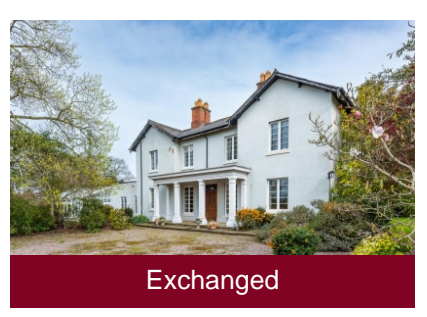
The Oaklands, Lower Rudge, Pattingham