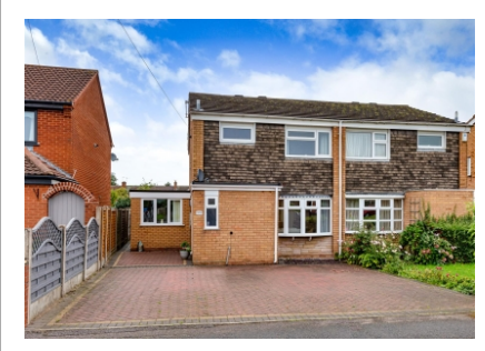
148a Birches Road, Codsall, Wolverhampton