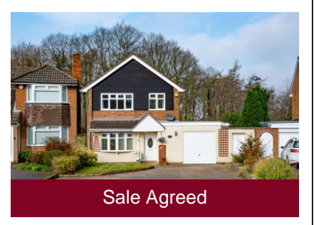
12 Hopstone Gardens, Penn, Wolverhampton