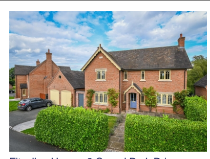
Fitzallen House, 3 Cound Park Drive, Cound, Shrewsbury