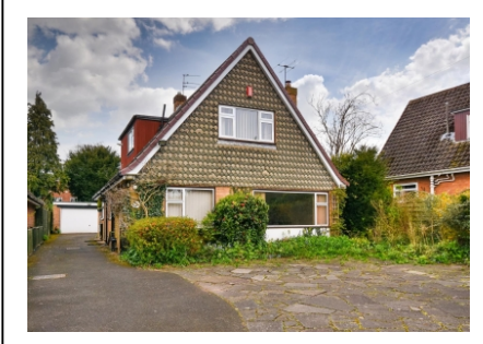
68 Mount Road, Tettenhall Wood, Wolverhampton