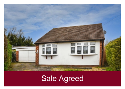
7 Apse Close, Wombourne, Wolverhampton