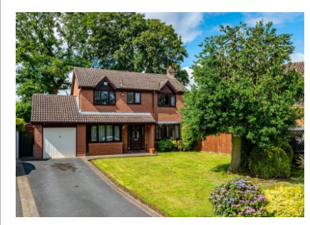
South View Close, Codsall, Wolverhampton