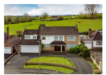
7 Wightwick Hall Road, Wightwick, WV6 8BZ