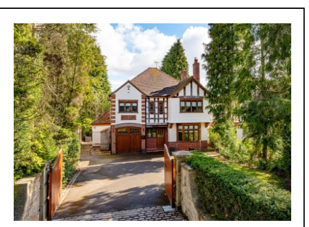
Dalkeith, 25 Tinacre Hill, Wightwick, WV6 8DB