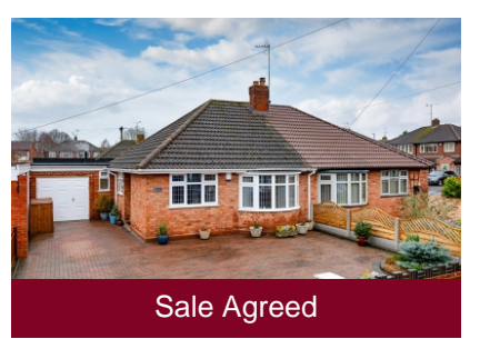
13 Kirkstone Crescent, Wombourne, Wolverhampton