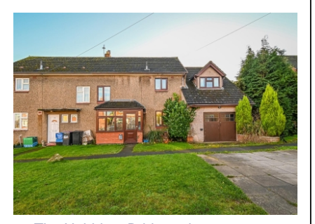
74 The Hobbins, Bridgnorth