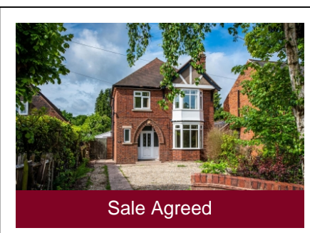
120 Amos Lane, Wednesfield