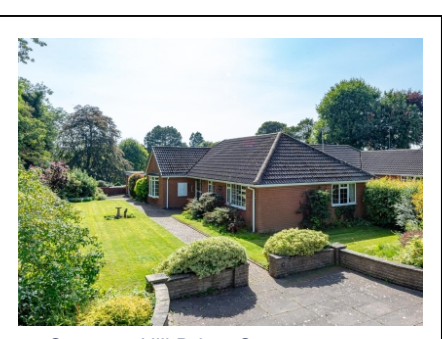
11 Compton Hill Drive, Compton, Wolverhampton