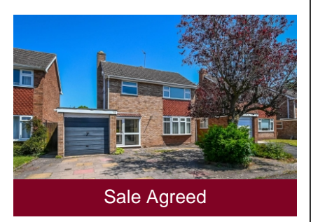
14 The Orchard, Albrighton, Wolverhampton