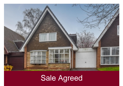
16 Surrey Drive, Finchfield, Wolverhampton