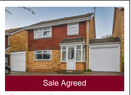
6 Surrey Drive, Finchfield