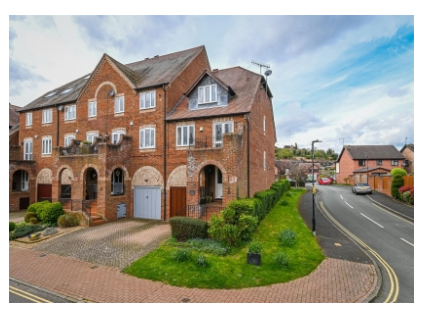
36 Southwell Riverside, Bridgnorth