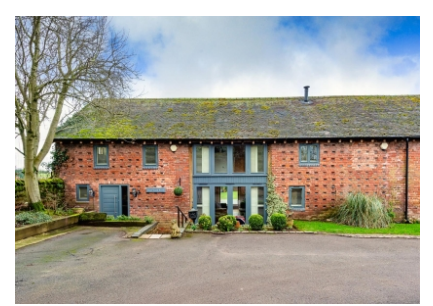
Clee View Barn, Westbeech Road, Pattingham, Wolverhampton