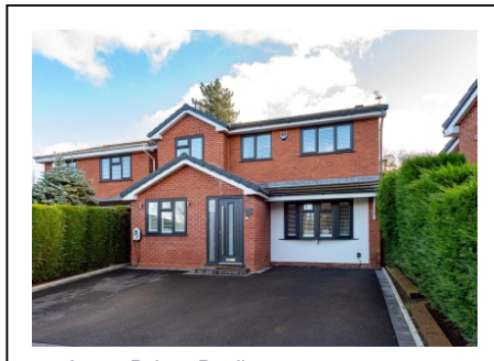
41 Ascot Drive, Dudley