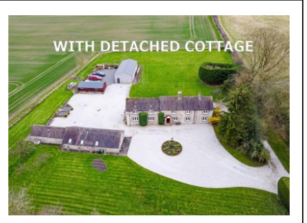
Lower Westwood Farm, Stretton Westwood, Much Wenlock