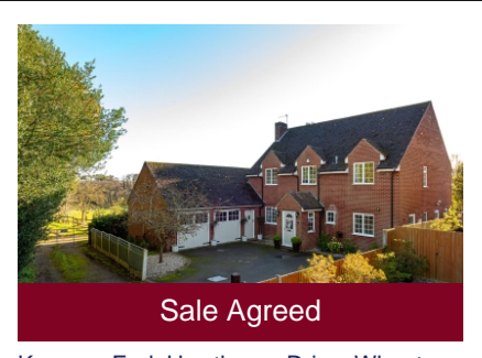
Keepers End, Hawthorne Drive, Wheaton Aston