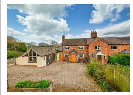
3 Tedstill Cottages, Middleton Scriven, Bridgnorth