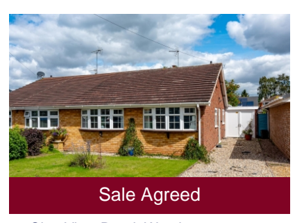
68 Clee View Road, Wombourne, Wolverhampton