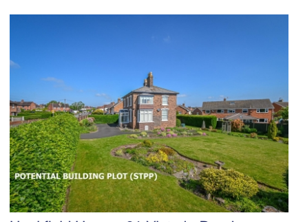
Hookfield House, 81 Victoria Road, Bridgnorth