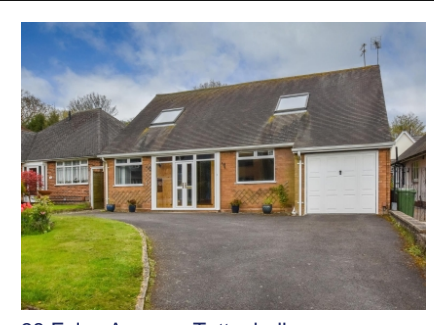
38 Foley Avenue, Tettenhall, Wolverhampton