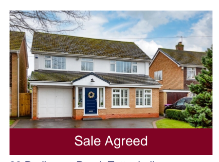
89 Redhouse Road, Tettenhall, Wolverhampton