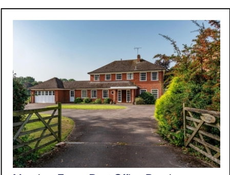
Meadow Farm, Post Office Road, Seisdon, Wolverhampton