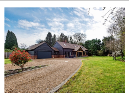
Willow Lodge, 23 High Street, Albrighton