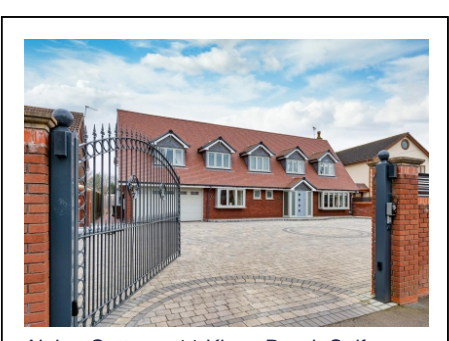
Alpine Cottage, 11 Kings Road, Calf Heath