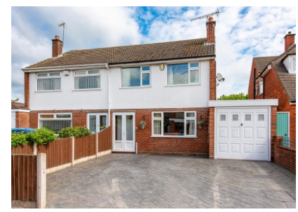
19 Chapel Street, Wombourne