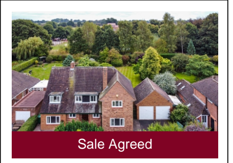
Rossleigh, Shaw Lane, Albrighton