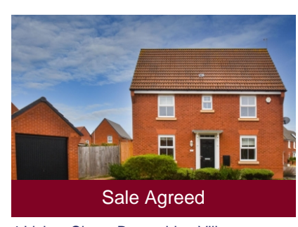
4 Lickey Close, Baggeridge Village, Dudley