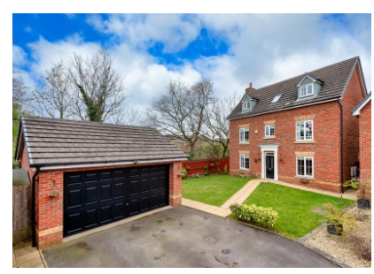
Oaklands, Wombourne, Wolverhampton