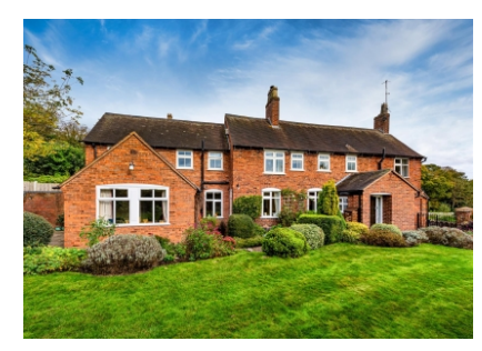
Pound Cottage, 8 School Road, Himley, Dudley