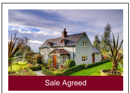
Trimpley Lane, Shatterford, Bewdley