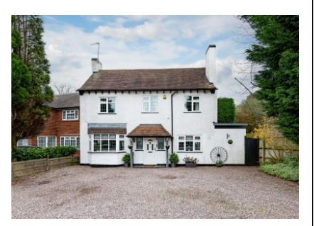
17 Stubbs Road, Wolverhampton