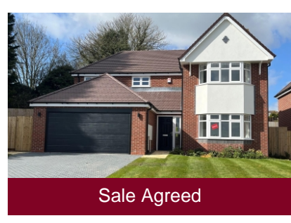
Valley View, 5 Rowan Grange, Broseley