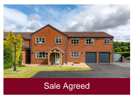
3 Mill Stream Close, Codsall, Wolverhampton