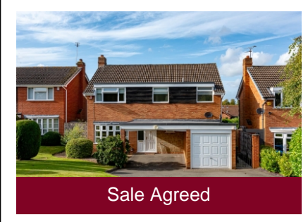
11 Copper Beech Drive, Wombourne, Wolverhampton