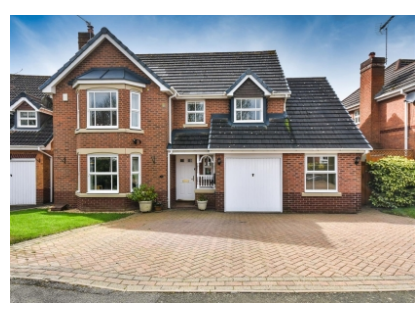
Kinloch Drive, Dudley