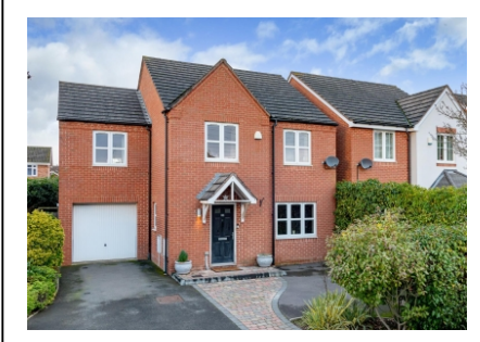
80 Brickbridge Lane, Wombourne, Wolverhampton