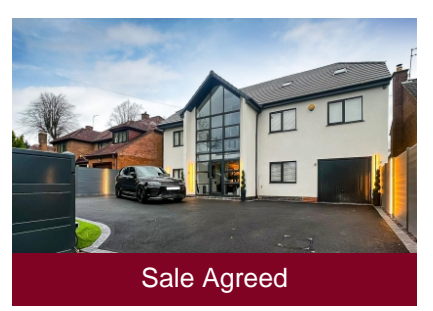
14 Lothians Road, Stockwell End