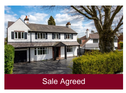
94 Codsall Road, Tettenhall, Wolverhampton