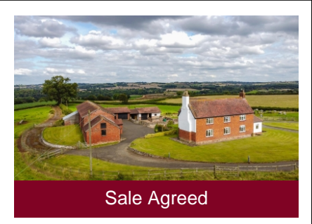
Lower Sutton Farm, Sutton, Chelmarsh, Bridgnorth