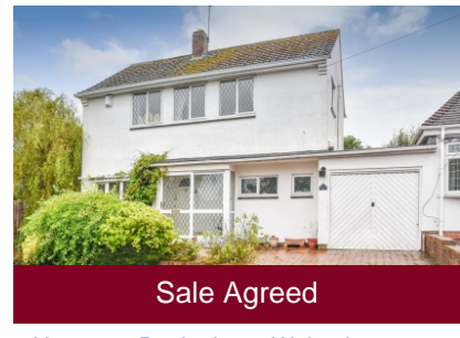
4 Newgate, Pattingham, Wolverhampton