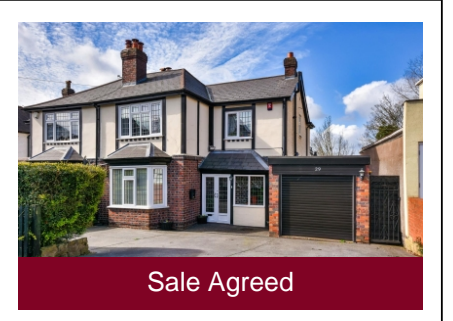
29 Goldthorn Avenue, Penn, Wolverhampton