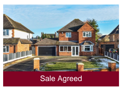
75 Yew Tree Lane, Tettenhall