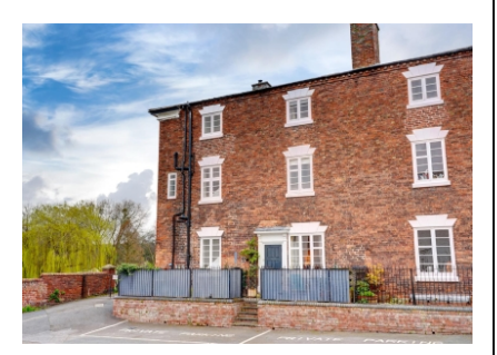
Severn Side, Stourport-On-Severn