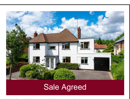
Helford House, Westland Avenue, Compton