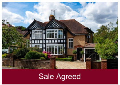
2 Highlands Road, Finchfield, Wolverhampton