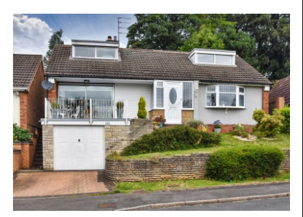
142 Bridgnorth Road, Wolverhampton