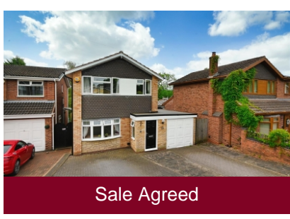
36 Bridge Road, Alveley, Bridgnorth