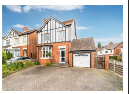
Tregunna, 27 Richmond Road, Finchfield