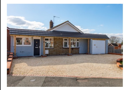
21 Uplands Drive, Wombourne, Wolverhampton