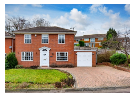
2 Heath House Drive, Wombourne, Wolverhampton