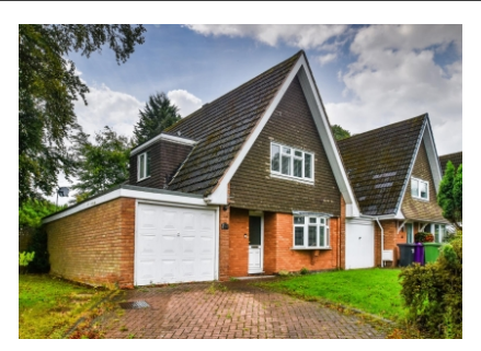
64 Bantock Gardens, Finchfield, Wolverhampton