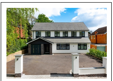
1 Chestnut Close, Codsall, WV8 2EZ