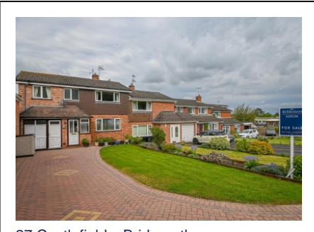
27 Castlefields, Bridgnorth