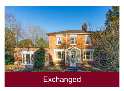
Ferndale, 33 Oaken Lanes, Codsall, Wolverhampton