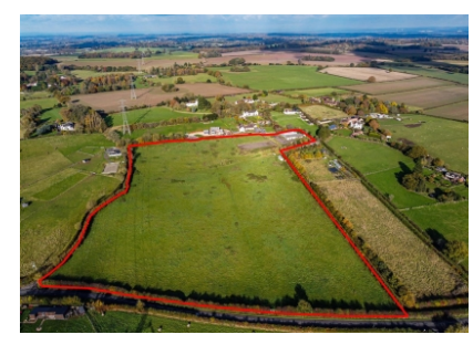
Plot of Land at Former Mill Riding Centre, Warstone Hill Road, Pattingham