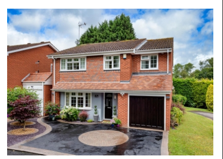
2 Brompton Lawns, Tettenhall Wood, Wolverhampton