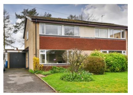
32 The Greenway, Pattingham, Wolverhampton