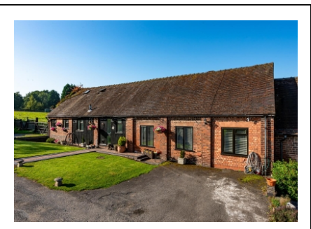
Barn End, Codsall Road, Palmers Cross, Wolverhampton