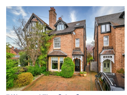
7 Westgate Villas, Salop Street, Bridgnorth