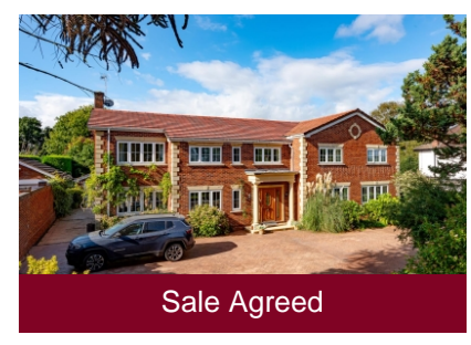
Elan Ridge. Pool House Road, Wombourne, Wolverhampton