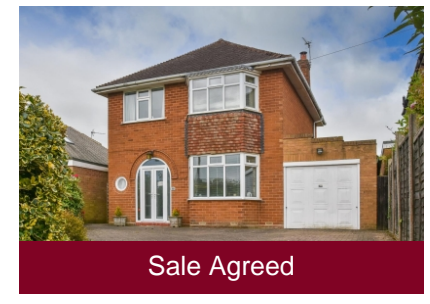
68 Clive Road, Pattingham, Wolverhampton