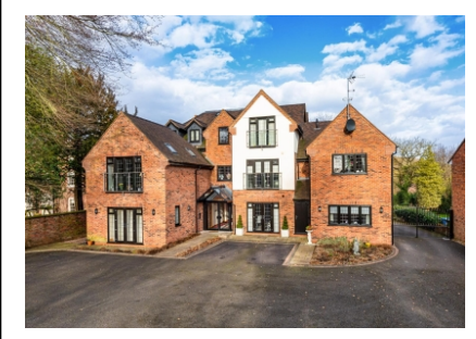
3 The Gables, Seisdon Road, Trysull, Wolverhampton