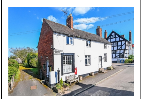
The Old Post Office, High Street, Claverley, Wolverhampton