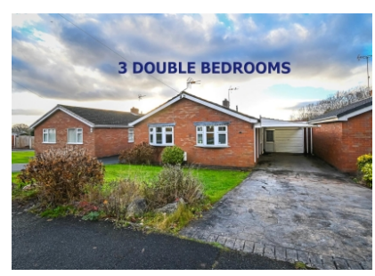
12 Redstone Drive, Highley, Bridgnorth