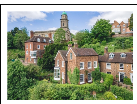
Castle Cliffe House, 24 St. Mary's Steps, Bridgnorth