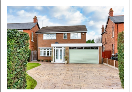
230a Trysull Road, Merry Hill, Wolverhampton