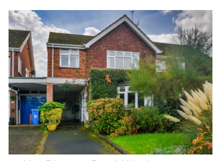
86 Van Diemans Road, Wombourne, Wolverhampton