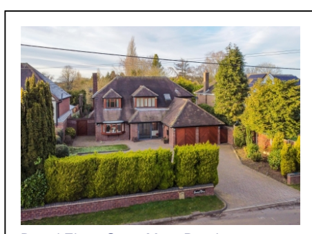
Broad Elms, Great Moor Road, Pattingham