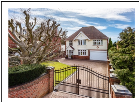
Catholic Lane, Sedgley, Dudley