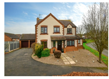
3 Danesbrook, Claverley, Wolverhampton