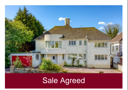
17 Muchall Road, Penn, Wolverhampton