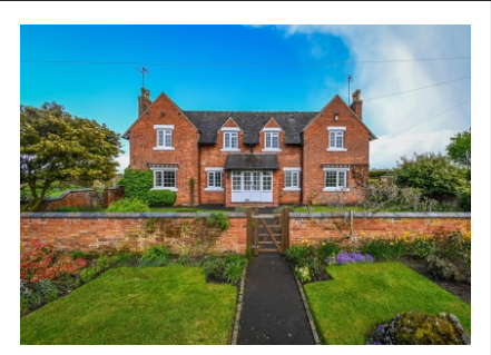
Lower Snowdon Cottage, Snowdon Road, Burnhill Green, Wolverhampton