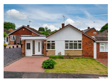
4 Mayfair Close, Albrighton, Wolverhampton