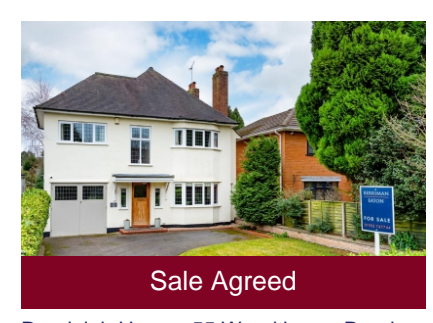
Randolph House, 55 Woodthorne Road, Wolverhampton