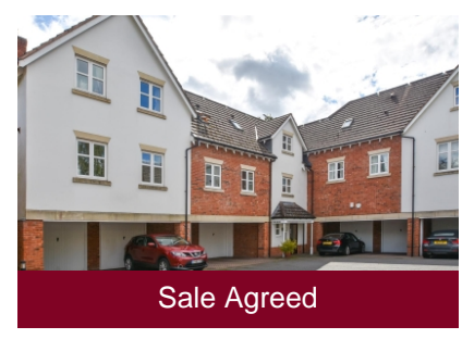
2 Albrighton House, The Water Gardens, Wolverhampton