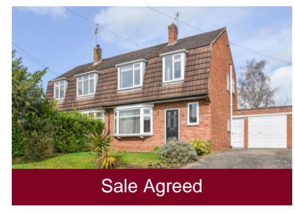
96 Planks Lane, Wombourne, Wolverhampton