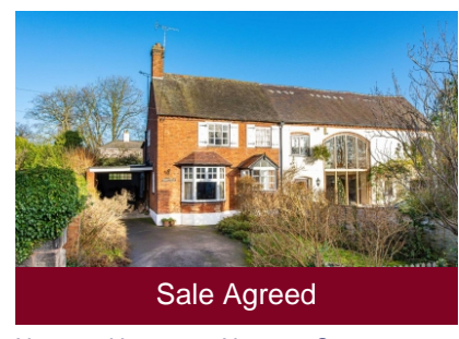
Newport House, 28 Newport Street, Brewood