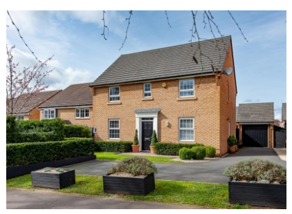
12 Larch Grove, Shifnal