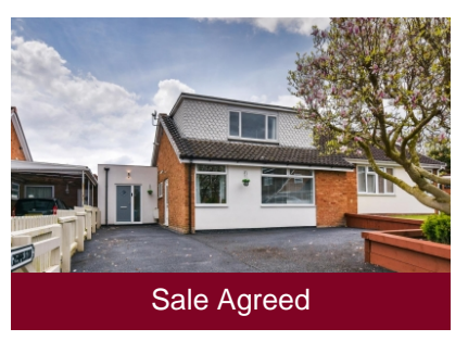
3 Greenfields Road, Wombourne, Wolverhampton