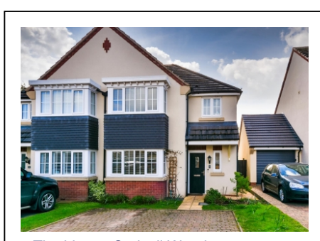
4 The Limes, Codsall Wood, Wolverhampton