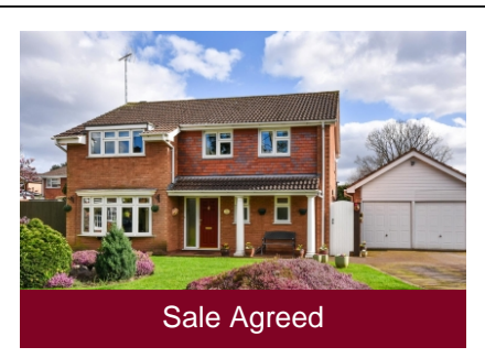
Oaken Covert, Codsall, Wolverhampton