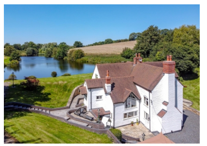
Hem Mill, The Hem, Shifnal