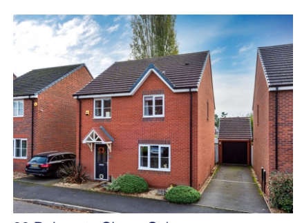
39 Rakegate Close, Oxley, Wolverhampton