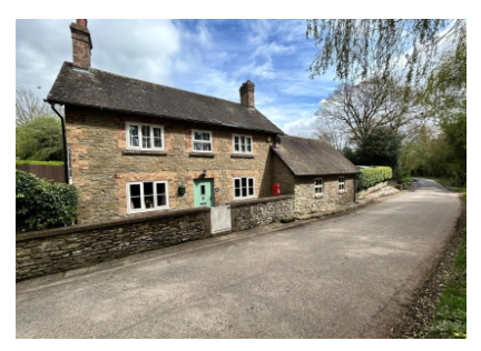
Brookside, Brockton, Much Wenlock