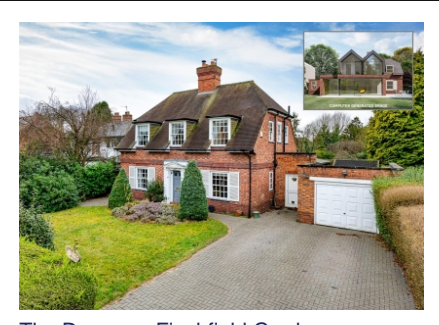
The Dormers, Finchfield Gardens, Finchfield