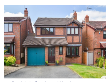
35 Penleigh Gardens, Wombourne, Wolverhampton