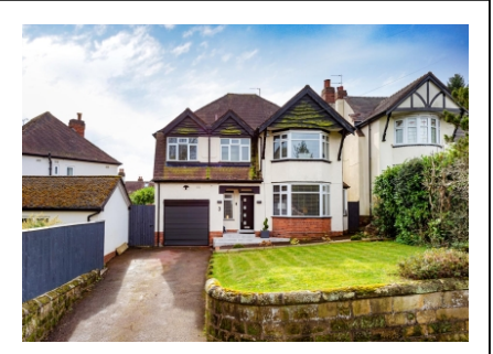
3 Lothians Road, Tettenhall, Wolverhampton