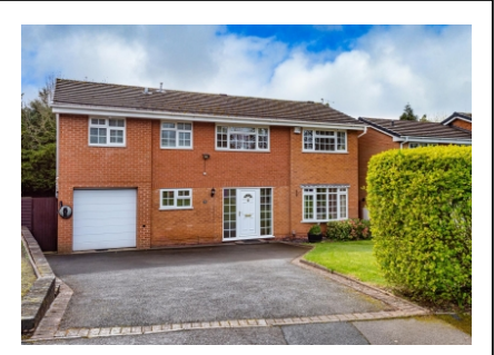
11 Swallowdale, Wightwick, Wolverhampton