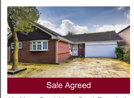
28a Mount Road, Mount Road, Tettenhall Wood