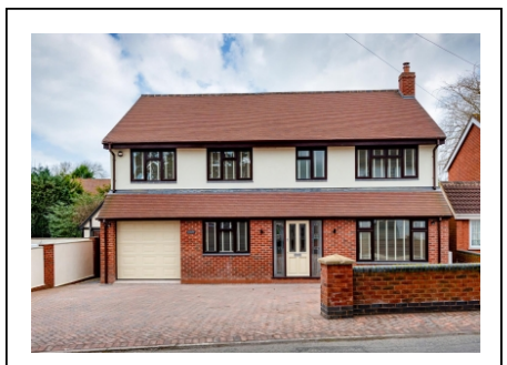
Ravenscroft, Bell Road, Trysull, Wolverhampton