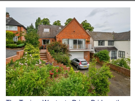
The Tyning, Westgate Drive, Bridgnorth