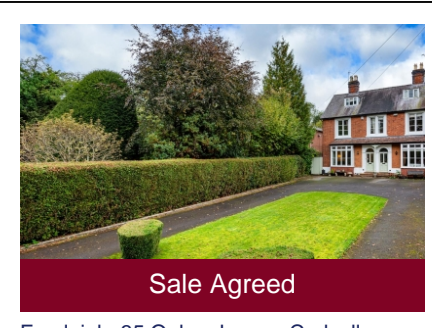
Fernleigh, 35 Oaken Lanes, Codsall