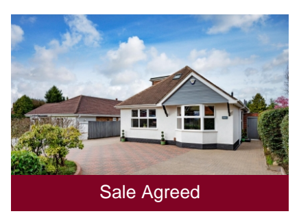
28a Wood Road, Tettenhall Wood