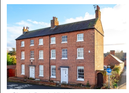
4 Church Road, Albrighton, Wolverhampton