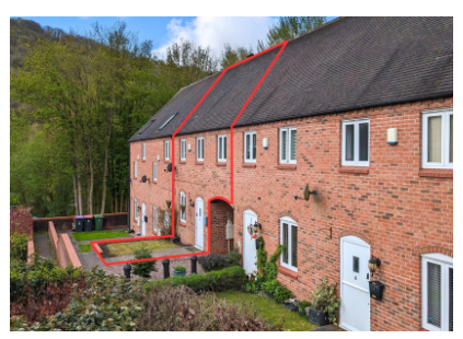
6 The Courtyard, Ironbridge, Telford