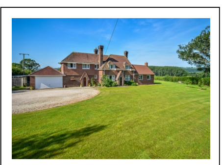
Footbridge House, Tasley, Bridgnorth