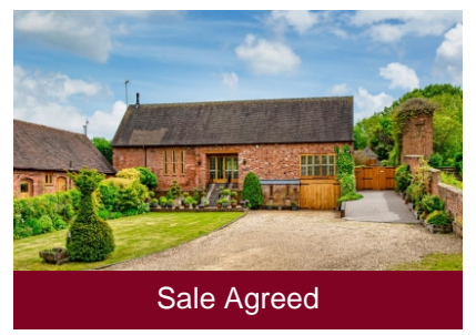
The Tythe Barn, Hyde Mill Lane, Brewood