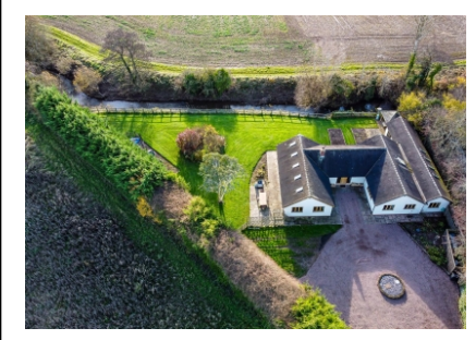
Riverside Bungalow, Muckley Cross, Acton Round, Bridgnorth