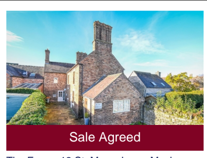
The Forge, 13 St. Marys Lane, Much Wenlock