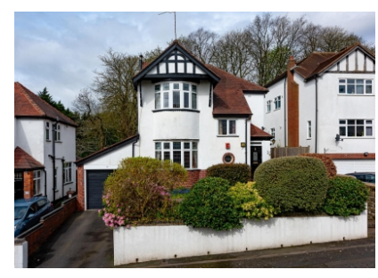
Tudor Crescent, Wolverhampton