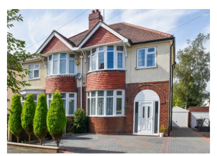
28 Links Road, Penn, Wolverhampton