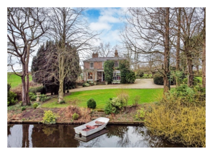
The Mill House, Badger, Wolverhampton