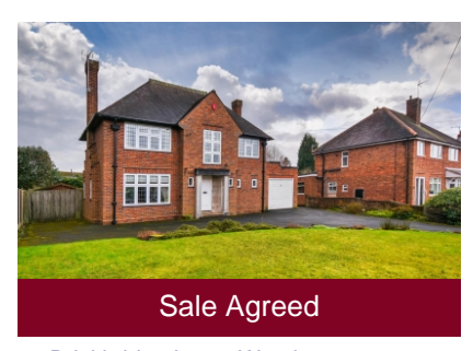
61 Brickbridge Lane, Wombourne, Wolverhampton