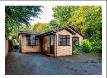
6 Finchfield Hill, Compton, Wolverhampton