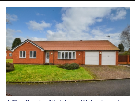
1 The Courts, Albrighton, Wolverhampton