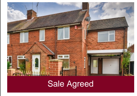
13 Grange Road, Albrighton, Wolverhampton