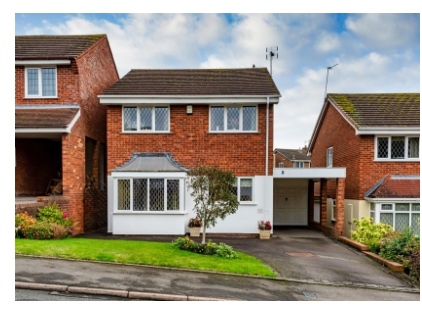
2 Woodthorne Close, Lower Gornal, Dudley