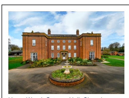
Home Wood, Gatacre Hall, Claverley, Wolverhampton