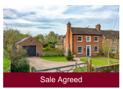
The Little House, 7 Tong Norton, Shifnal