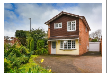
28 Quendale, Wombourne, Wolverhampton