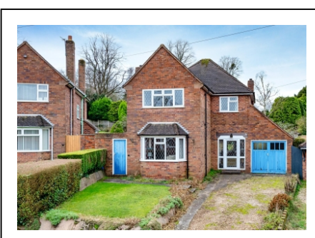
14 Peterdale Drive, Wolverhampton