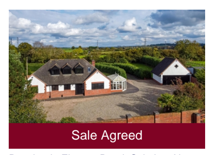
Rosebank, Ebstree Road, Seisdon, Nr Wolverhampton