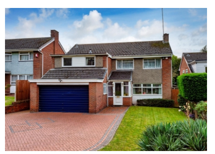
2 Captains Close, Compton, Wolverhampton