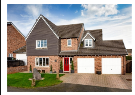
41 Kings Road, Calf Heath, Wolverhampton