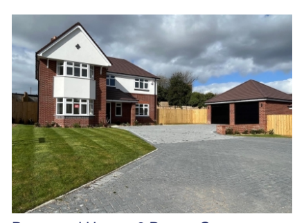
Rosewood House, 6 Rowan Grange, Broseley