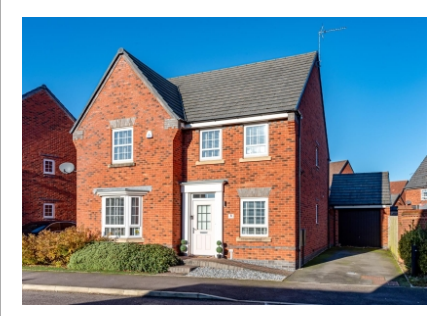
8 Brick Kiln Way, Baggeridge Village