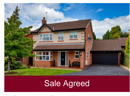
22 Bridgewater Drive, Wombourne, Wolverhampton