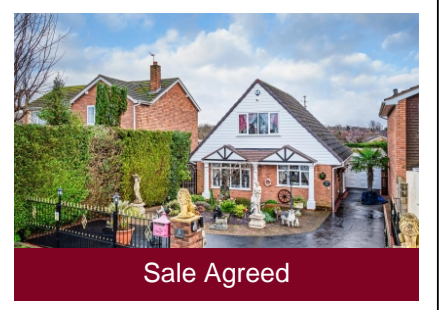
5 Bratch Common Road, Wombourne, Wolverhampton