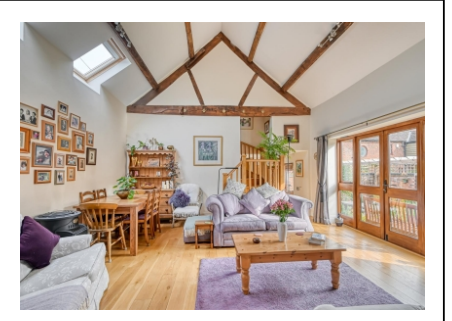
Tedstill Barn, Glazeley, Bridgnorth