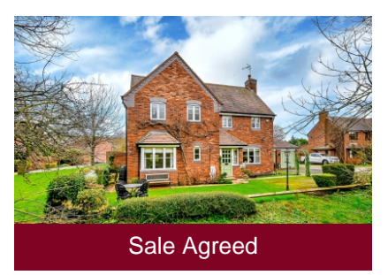
43 Pale Meadow Road, Bridgnorth