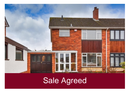
9 St. Benedicts Road, Wombourne, Wolverhampton