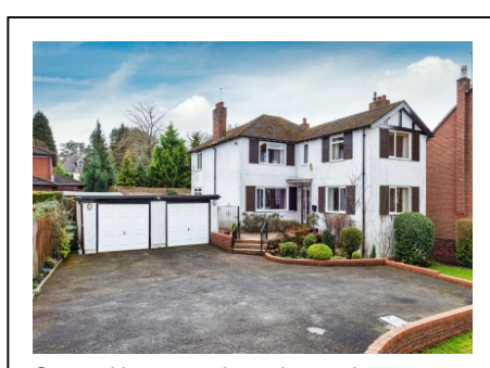
Quarry House, 30 Lansdowne Avenue, Codsall