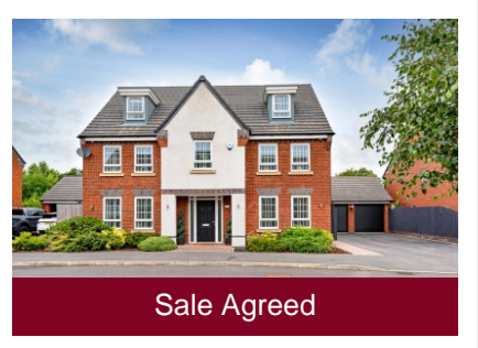
10 Lydiate Hill Road, Baggeridge Village