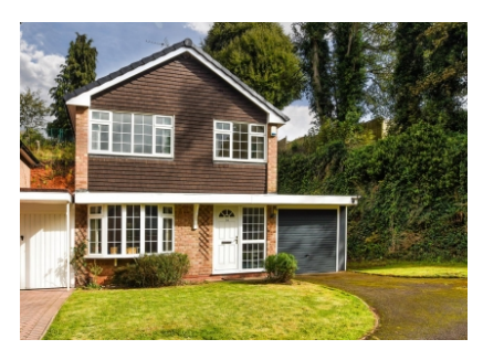
39 Alpine Way, Compton, Wolverhampton