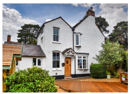
Beech Cottage, 8 The Holloway, Compton