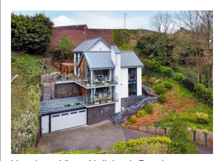
Hawthorn View, Hollybush Road, Bridgnorth