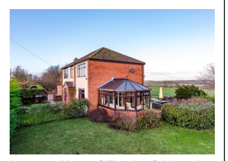
Longmoor House, Billingsley, Bridgnorth