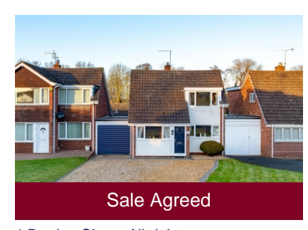
1 Bredon Close, Albrighton, Wolverhampton