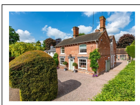
Beckbury House, Beckbury, Shifnal