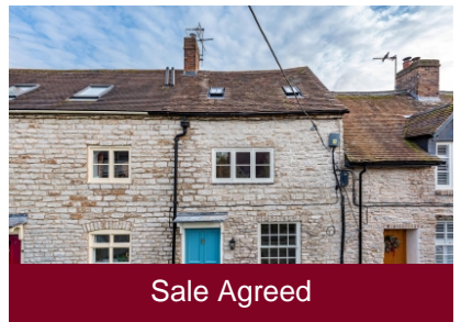
5a King Street, Much Wenlock, Shropshire