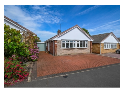
7 Princess Drive, Bridgnorth