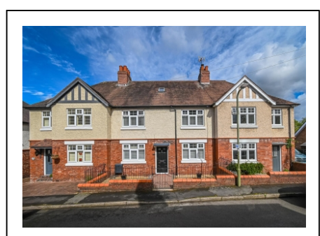
2 Cliff Gardens, Cliff Road, Bridgnorth