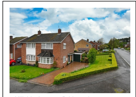
3 Hillside Avenue, Bridgnorth