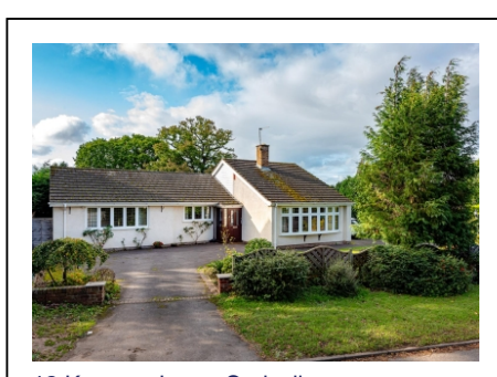
12 Keepers Lane, Codsall, Wolverhampton