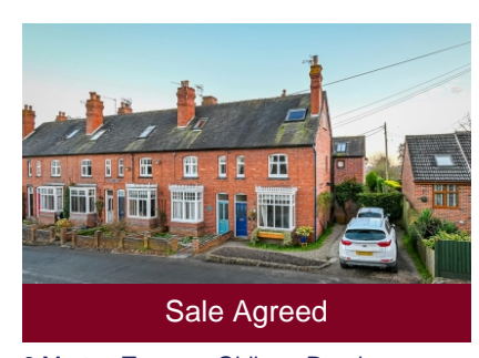
6 Merton Terrace, Oldbury Road, Bridgnorth