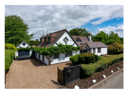
Pennygate, Paradise Lane, Slade Heath, Wolverhampton