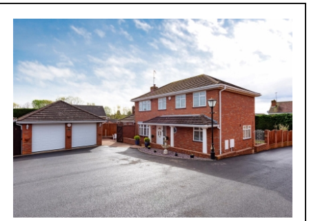
St. Johns Close, Swindon, Dudley