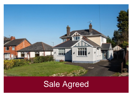
153 Trysull Road, Merry Hill, Wolverhampton