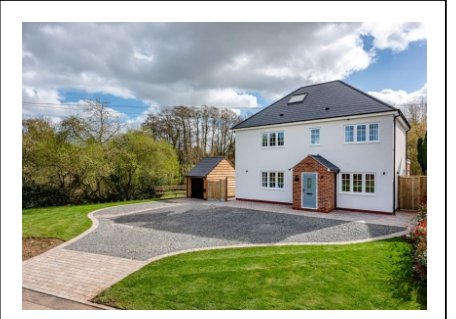
Holly Cottage, Wolverhampton Road, Pattingham