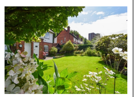
29 Bath Avenue, Wolverhampton