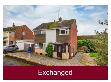
3 Newgate, Pattingham, Wolverhampton