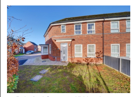
26 Rainsford Crescent, Kidderminster