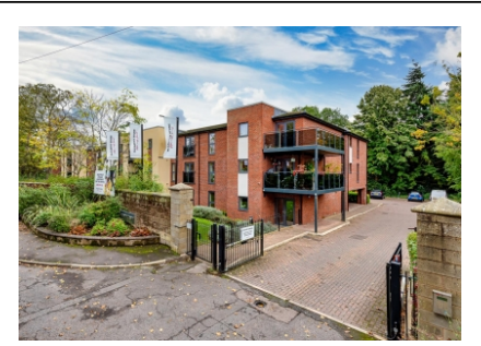
31 Thorneycroft, Wood Road, Tettenhall