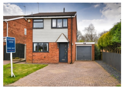
71 Mercia Drive, Perton, Wolverhampton