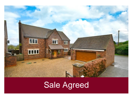
Faintree Heights, Faintree, Bridgnorth