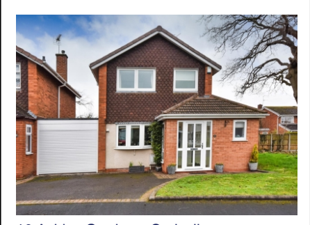
10 Ashley Gardens, Codsall, Wolverhampton