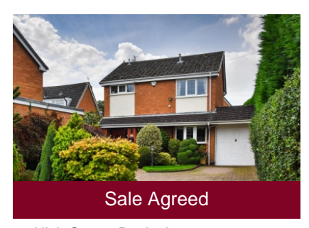
39 High Street, Pattingham, Wolverhampton