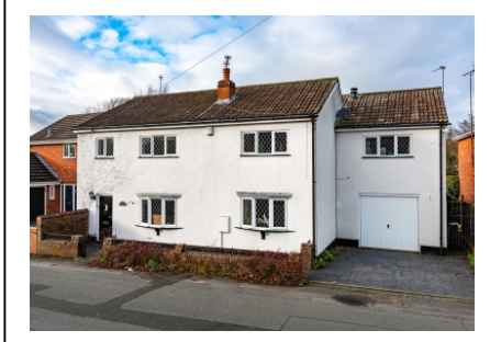
109 Rookery Road, Wombourne, Wolverhampton