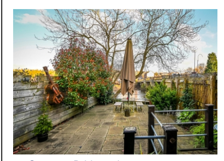
45 Cartway, Bridgnorth