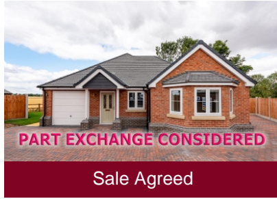
Bluebells, 6a School Close, Trysull, Wolverhampton