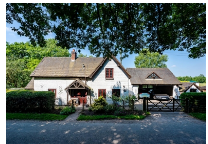
Sweet Turf Cottage, Longnor Gorse, Penkridge, Stafford, ST19 5QL