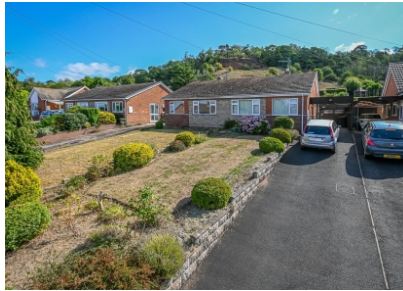
15 Lodge Lane, Bridgnorth