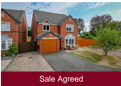
2 Ashcroft, Bridgnorth