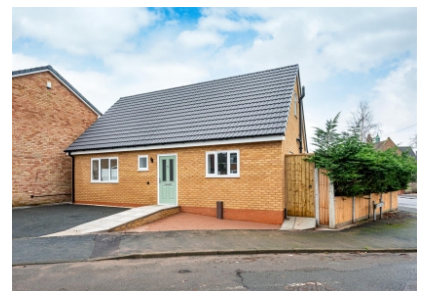
16 Redford Drive, Albrighton, WV7 3DE