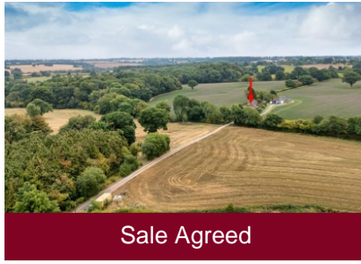
1 Netchwood Manor Cottage, Monkthopton, Bridgnorth