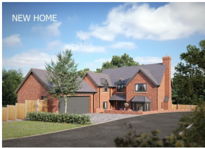
NEW HOME 5 The Stamp Works, Ludlow Road, Bridgnorth