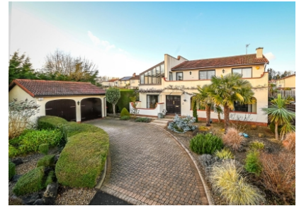
2 The Court, Sutton Hill, Telford