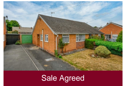
8 Captains Road, Bridgnorth