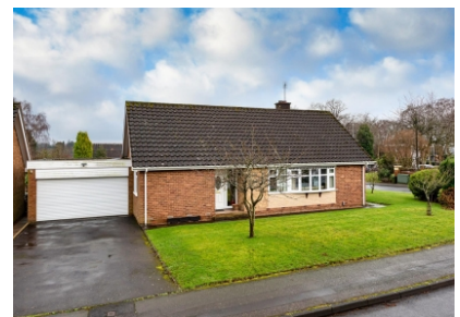
2 Fair Oak Drive, Tettenhall Wood, Wolverhampton, WV6 8HX