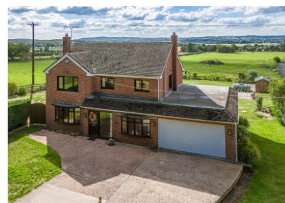
Forest Hills, New Road, Swindon, Dudley