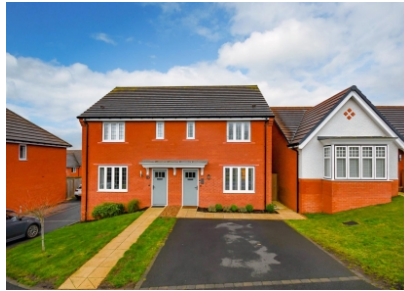
Foxglove Way, Himley, Dudley