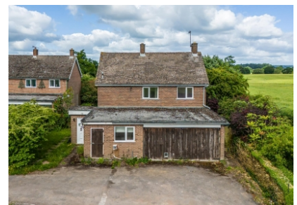
7 Shackerley Lane, Albrighton, Wolverhampton, WV7 3AB