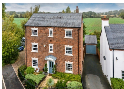
49 Deacons Field, Brewood, Stafford, ST19 9GA