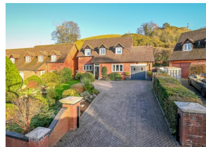
6 The Croft, Bridgnorth