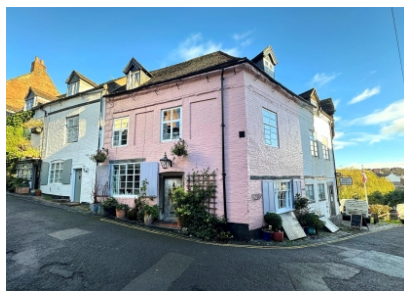
54 Cartway, Bridgnorth