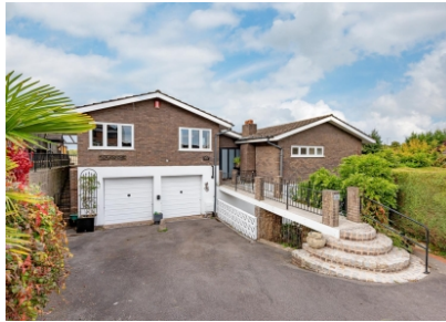
6 St. Johns Close, Swindon