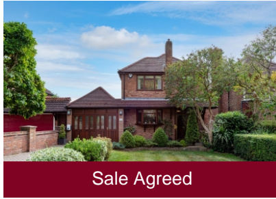
32 Billy Buns Lane, Wombourne, Wolverhampton