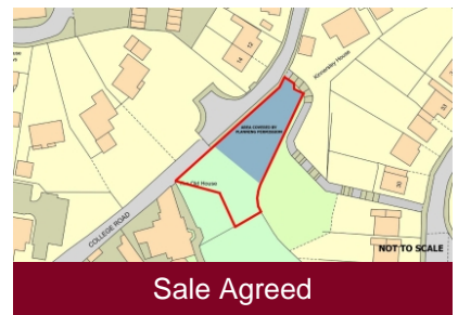
College Road, Tettenhall, Wolverhampton