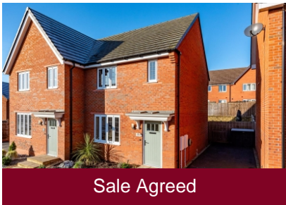
25 Rosemary Road, Himley, Dudley