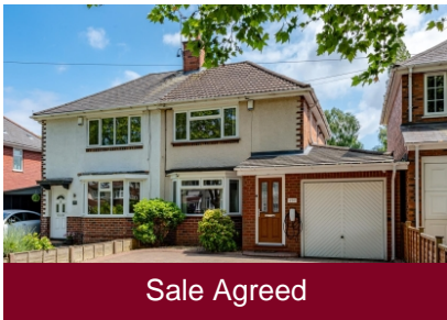
237 Warstones Road, Penn, Wolverhampton