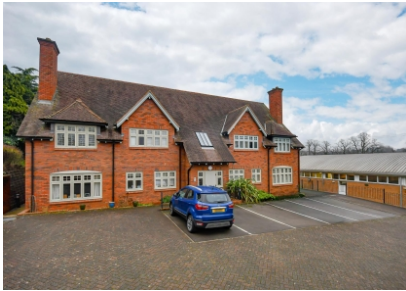
Windmill Fold, Wombourne, South Staffordshire