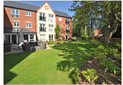
18 Bluebell Court, High Street, Tettenhall, Wolverhampton, WV6 8QW