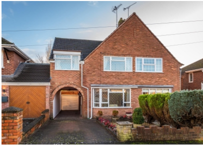
Kirkstone Crescent, Wombourne, Wolverhampton