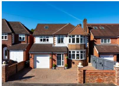
57 Queens Road, Sedgley, Dudley