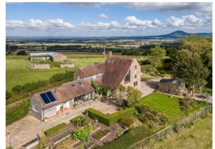
Wyres Barn, Kenley, Shrewsbury