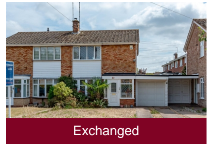
20 Wombourne Road, Swindon, Dudley