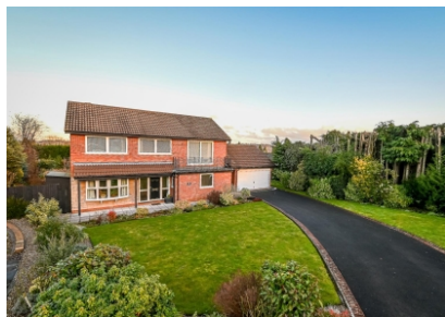
7 Huntsmans Close, Bridgnorth