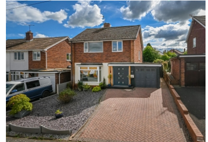
67 Duchess Drive, Bridgnorth