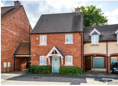
Stanham Close, Wombourne, Wolverhampton