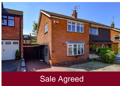
12 Calvin Close, Wombourne, Wolverhampton, South Staffordshire