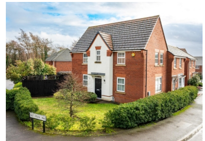
Gilt Stock Way, Dudley