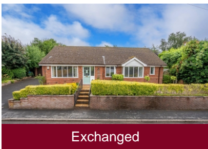
Rose Gate, Engleton Lane, Brewwood, Stafford, ST19 9DZ