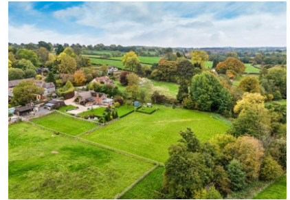
Reaside, Neenton, Bridgnorth