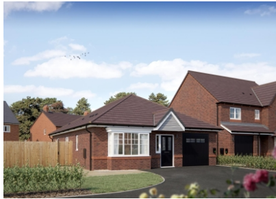
Plot 23 Derrington Meadows, Ditton Priors, Bridgnorth