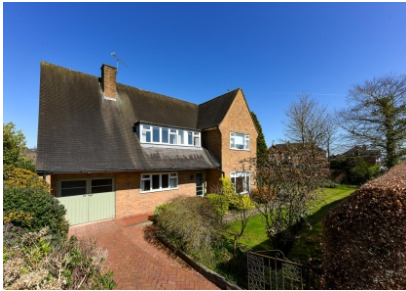
28 Springhill Park, Wolverhampton