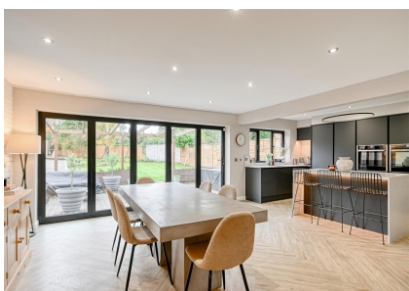
4 Willow Close, Hilton, Bridgnorth