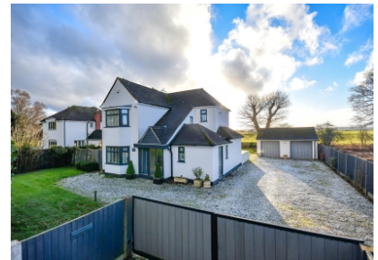
School House, Gospel Ash Road, Bobbington, Stourbridge