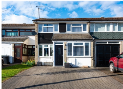
13 The Square, Pattingham, Wolverhampton, WV6 7BZ