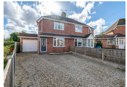
23 Homefield Road, Bilbrook, Wolverhampton, WV8 1JN