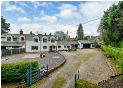
The Woodlands, Oldbury, Bridgnorth