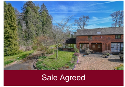
The Mill, Gatacre, Claverley