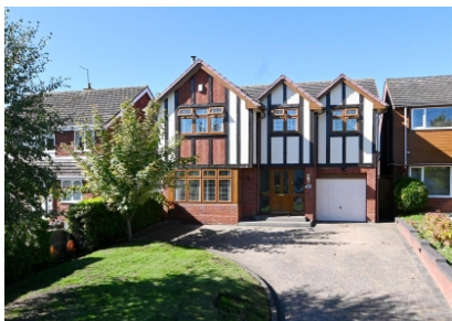
42 Folley Road, Ackleton, Wolverhampton