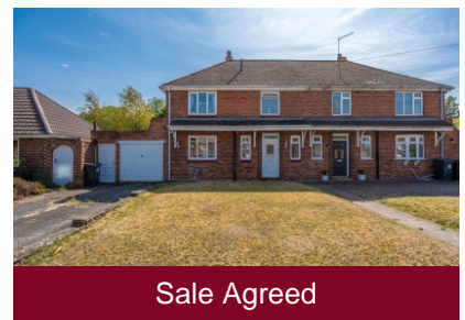
28 Woodhouse Road, Tettenhall Wood, Wolverhampton, WV6 8JH