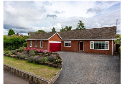
Heatherglades, The Firsway, Bishops Wood, Stafford, ST19 9AU