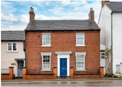
Gravel Hill, Wombourne, Wolverhampton