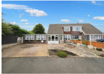
Greenfields Road, Wombourne, Wolverhampton