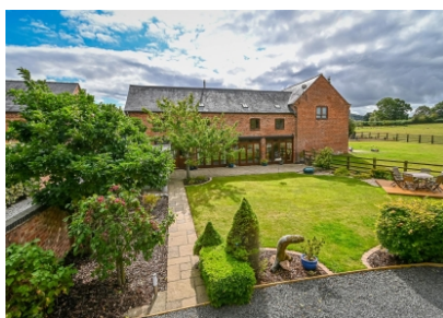
The Driftway, Ashfield Farm, Ditton Priors, Bridgnorth