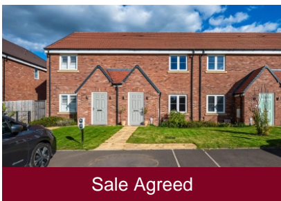
20 Millfield Road, Albrighton, Wolverhampton, WV7 3JN