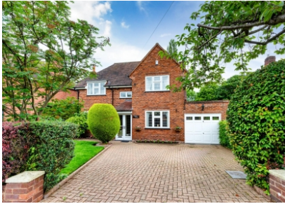
38 Cranford Road, Finchfield, Wolverhampton, WV3 8EP