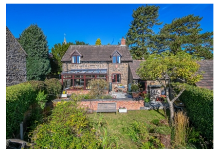
6 St. Johns Court, Ditton Priors, Bridgnorth