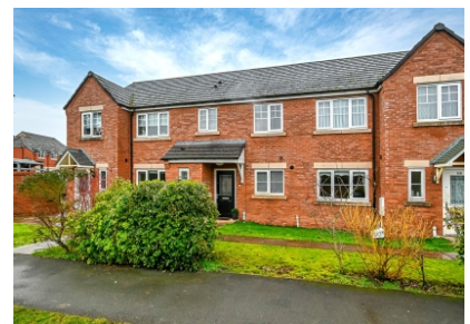
107 Wenlock Rise, Bridgnorth