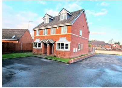
7 Groveland Road, Tipton, Oldbury, West Midlands