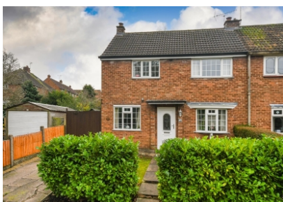
74 Meadow Lane, Wombourne, Wolverhampton