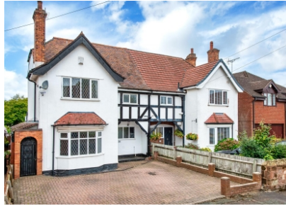
23 Hinckes Road, Tettenhall, Wolverhampton