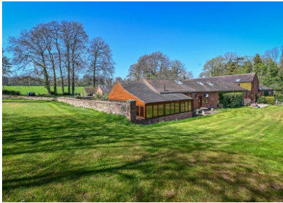
The Haywain, Gatacre, Claverley, Wolverhampton