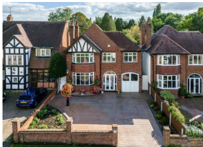
Chroma, 9 Meadow Road, Finchfield, Wolverhampton, WV3 8EZ