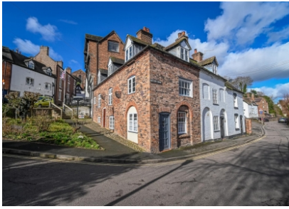
42 Riverside, Bridgnorth