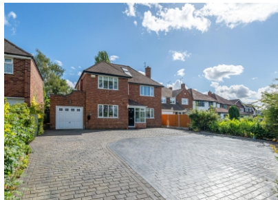
81 Yew Tree Lane, Tettenhall, Wolverhampton, WV6 8UQ