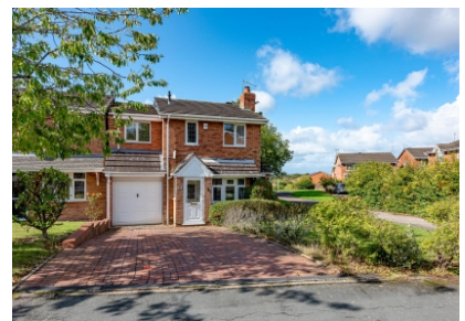
50 Cowley Drive, Dudley