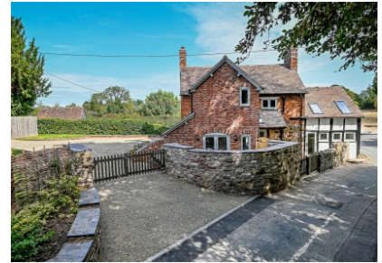
1 Shrewsbury Road, Cressage, Shrewsbury