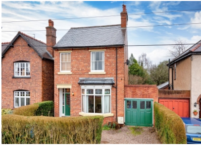
29 Walk Lane, Wombourne