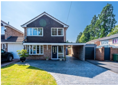
2 Aldwyck Drive, Castlecroft, Wolverhampton, WV3 8NE