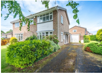
7 Elliotts Lane, Codsall, Wolverhampton, WV8 1PH