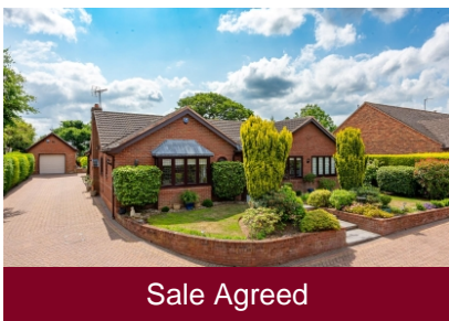
Tinkers Croft, Tinkers Castle Road, Seisdon, Wolverhampton