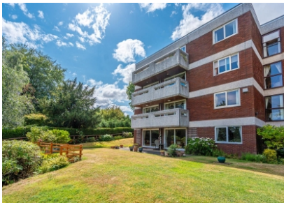
6 Eynsham Court, Clifton Road, Stockwell End, Wolverhampton, WV6 9AR