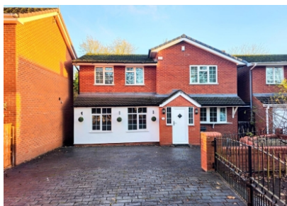
4 Brookside Drive, Hilton, Bridgnorth