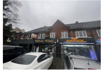
283A Tettenhall Road, Wolverhampton