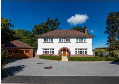
20 Pickwick Gardens, Compton, Wolverhampton, WV3 9EH