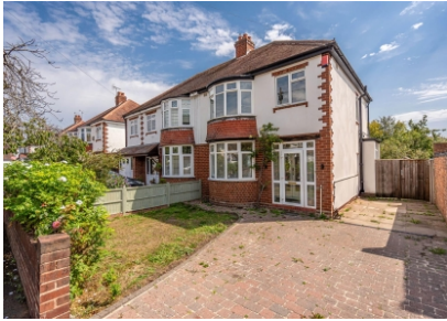
10 Fir Tree Road, Finchfield, Wolverhampton, WV3 8AN