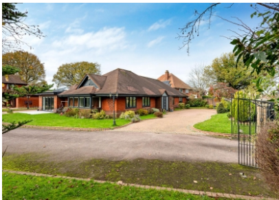
22 Yew Tree Lane, Tettenhall, Wolverhampton, WV6 8UF