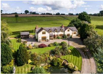
The Dairy Farm, Neenton, Bridgnorth