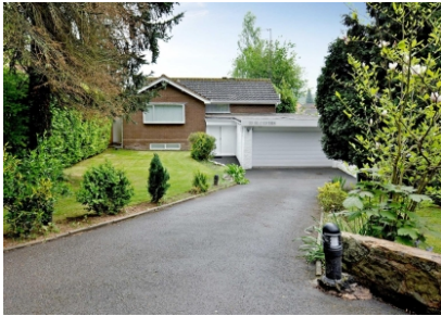
Blue Firs, Grove Lane, Wightwick