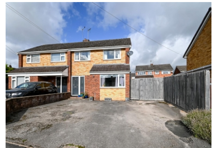
10 Goldstone Drive, Bridgnorth