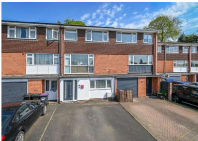
23 Cann Hall Drive, Bridgnorth