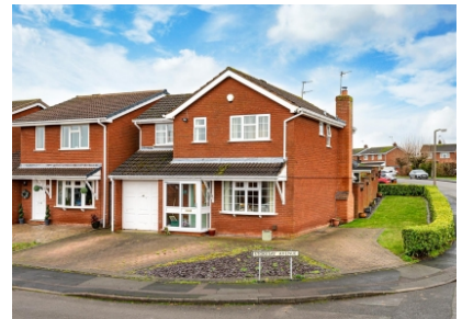
2 Stokesay Avenue, Perton, Wolverhampton, WV6 7RS