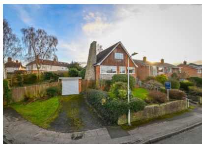
28 Greenfields Road, Bridgnorth