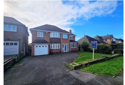
35 Sabrina Road, Wightwick