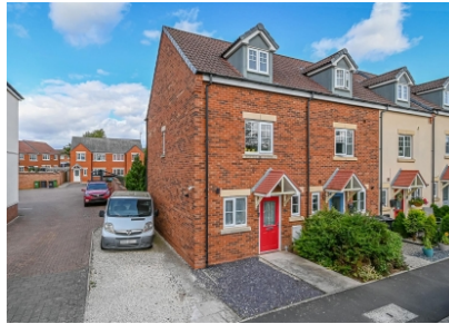
41 Wenlock Rise, Bridgnorth