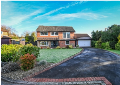
7 Huntsmans Close, Bridgnorth