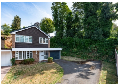
39 Alpine Way, Compton, Wolverhampton