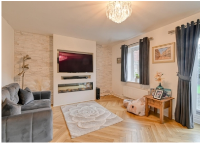
13 Hazledine Way, Bridgnorth