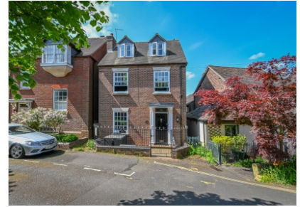
25 St. Leonards Close, Bridgnorth