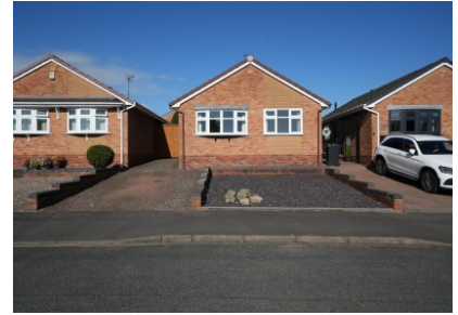
34 Bratch Park, Wombourne, Wolverhampton