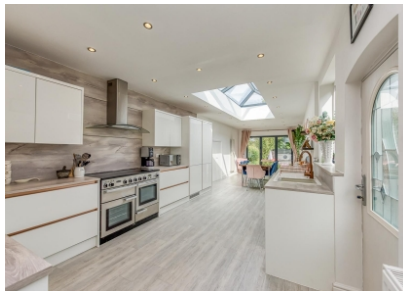
Zoar Street, Lower Gornal, Dudley