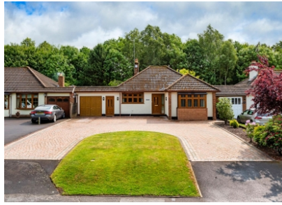
135 Yew Tree Lane, Tettenhall, Wolverhampton, WV6 8UW