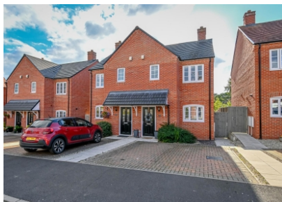
25 Staley Grove, Highley, Bridgnorth