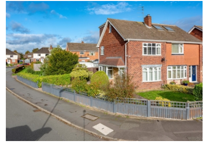
98 Van Diemens Road, Wombourne, Wolverhampton