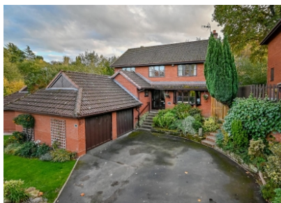
1 Wells Close, Bridgnorth