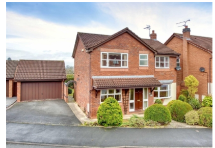
15 Penleigh Gardens, Wombourne