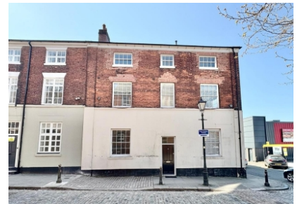
Studio 5, 17 Bond Street, Wolverhampton