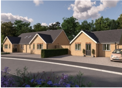
Off Meadowbrook Close, Alveley, Bridgnorth