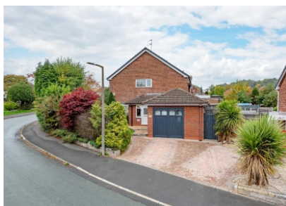
12 Strathmore Crescent, Wombourne, Wolverhampton