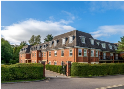
37 Castlecroft House, Castlecroft Road, Wolverhampton, WV3 8NA