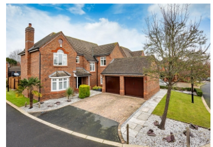
10 The Moat House, Eardington, Bridgnorth