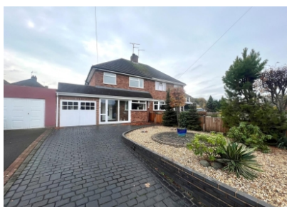
21 Bratch Lane, Wombourne, Wolverhampton