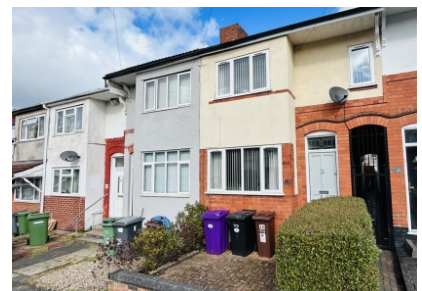
36 Belmont Road, Penn, Wolverhampton