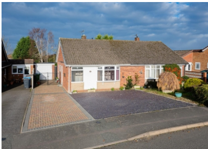
12a Blakeley Heath Drive, Wombourne, Wolverhampton