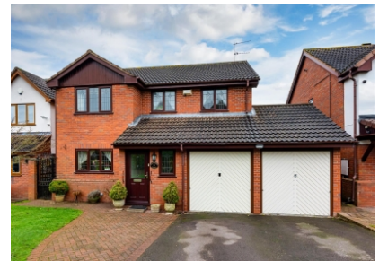
3 Cranmere Court, Cranmere Avenue, Tettenhall, Wolverhampton, WV6 8TW