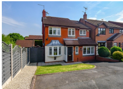
11 Penleigh Gardens, Wombourne, Wolverhampton