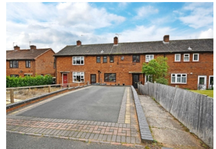
22 Lodge Lane, Bridgnorth