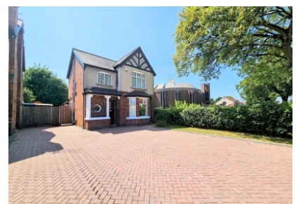
171 Coalway Road, Wolverhampton