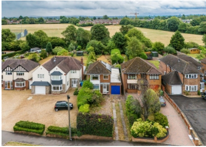
26 Elliotts Lane, Codsall, Wolverhampton, WV8 1PG