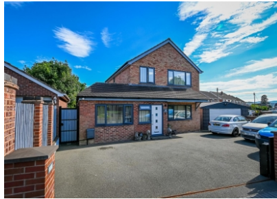
48 Hazelwells Road, Highley, Bridgnorth