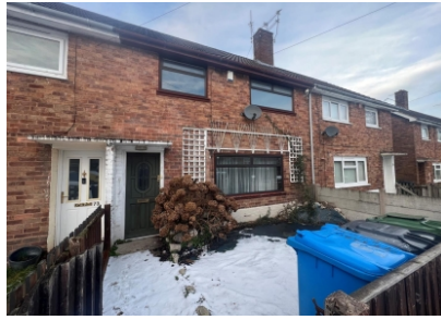
Lamb Crescent, Wombourne, Wolverhampton