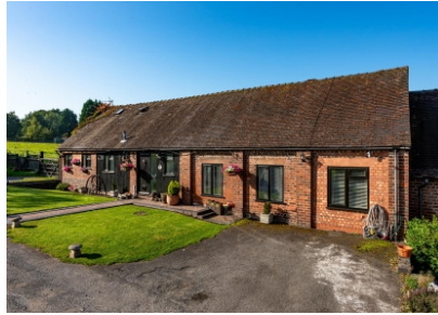
Barn End, Codsall Road, Palmers Cross, Wolverhampton