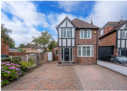
75 Broad Lane, Finchfield, Wolverhampton, WV3 9BW