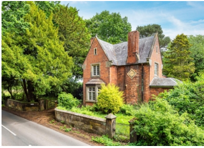
Wergs Hall Gardens, Wergs Hall Road, Tettenhall