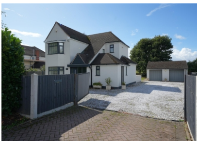
School House, Gospel Ash Road, Bobbington, Stourbridge