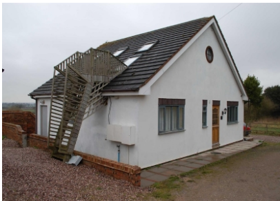
Upper Coach House Bishops Wood, Stafford