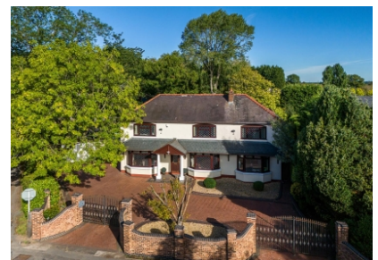
Highcroft, Holyhead Road, Albrighton, Wolverhampton, WV7 3AN