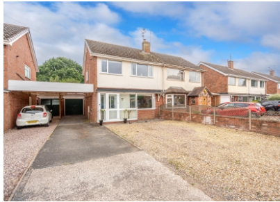
16 Moor Lane, Pattingham, Wolverhampton, WV6 7DL