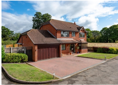
The Field House, 103 Six Ashes Road, Bobbington, Stourbridge