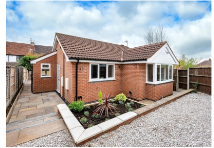
22a Dawley Road, Kingswinford