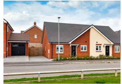
11 Leeveson Drive, Wrottesley Village, Wolverhampton