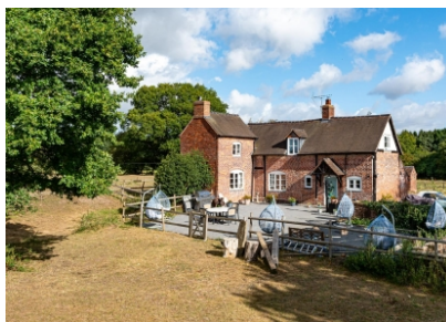
Leper House, Whitehouse Lane, Codsall, Wolverhampton, WV8 1QG