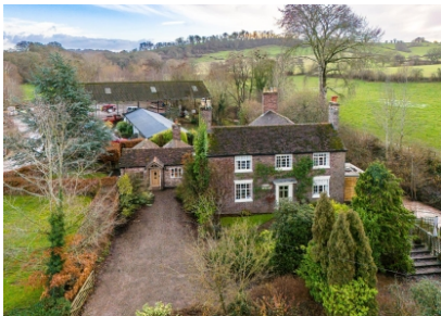
Harpsford Mill Farm, Ludlow Road, Bridgnorth