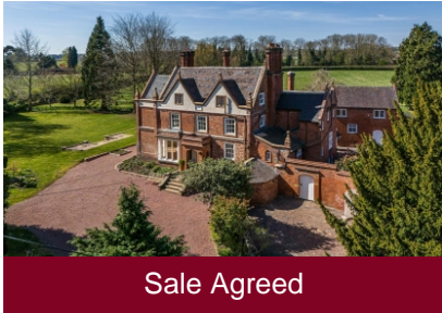
Old Manor House, Seisdon Road, Seisdon, Wolverhampton