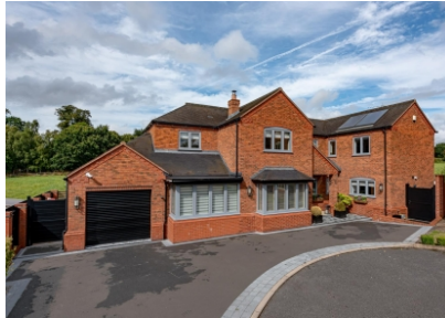
34 Post Office Road, Seisdon, Wolverhampton