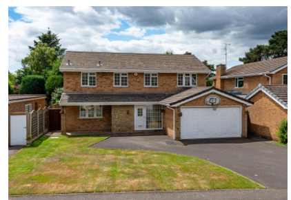
1 Saxon Court, Tettenhall, Wolverhampton, WV6 8SA