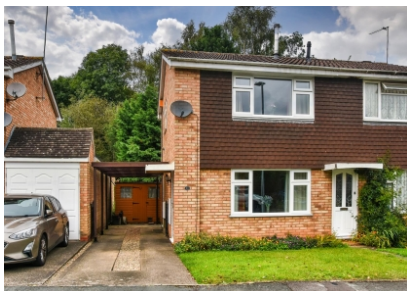
Quendale, Wombourne, Wolverhampton