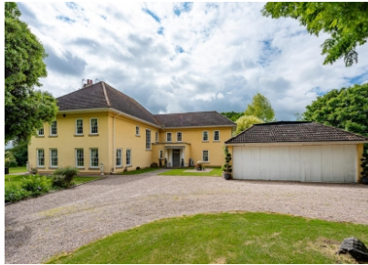
Lea House, Patshull Road, Albrighton, Wolverhampton, WV7 3BH