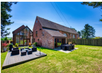
Morbrook Barn, Watery Bank, Bishops Wood