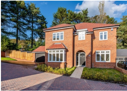
Peartree Drive, Wombourne, Wolverhampton