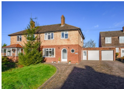
Planks Lane, Wombourne