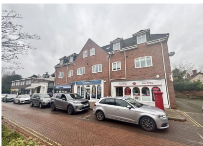
9 Kenmare House, Station Road, Codsall