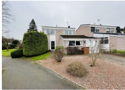
70 Woodfield Heights, Tettenhall, Wolverhampton