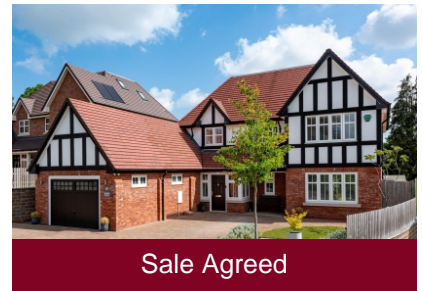
5a Ormes Lane, Tettenhall, Wolverhampton, WV6 8LL