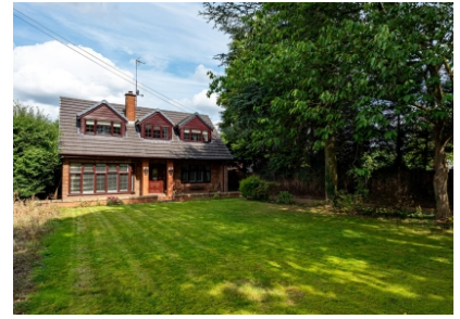
Orchard View, Paradise Lane, Slade Heath, Wolverhampton, WV10 7NZ