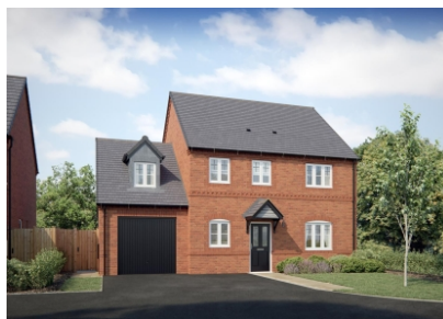
Plot 14 Derrington Meadows, Ditton Priors, Bridgnorth