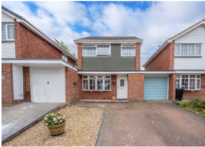
43 Applebrook, Shifnal, TF11 9PZ