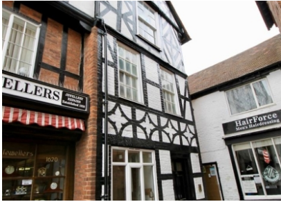
Flat 3, 3 High Street, Bridgnorth, WV16 4DB