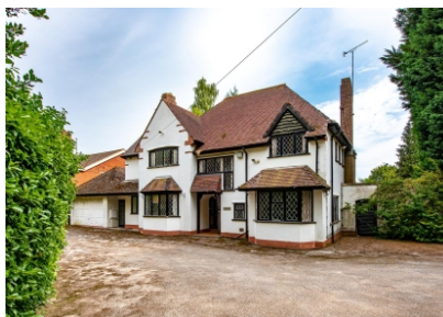
Greenways and Building Plots, 45 Perton Road, Wightwick, WV6 8DE