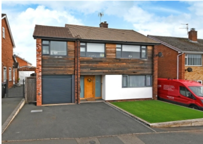
12 Queensway Drive, Bridgnorth