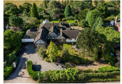
Tudor Lodge, Pattingham Road, Perton Ridge, Wolverhampton, WV6 7HD