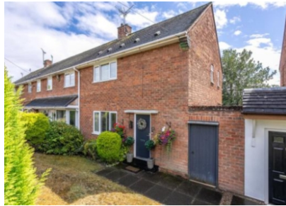
33 Pool Hall Crescent, Castlecroft, Wolverhampton, WV3 8LA