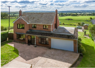
Forest Hills, New Road, Swindon, Dudley