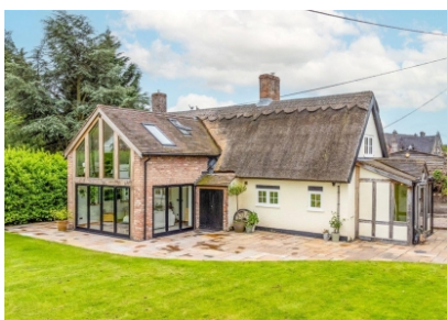
Worthington Cottage, 24 Village Road, Norton, Shifnal