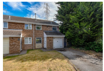
25 Foley Grove, Wombourne, Wolverhampton