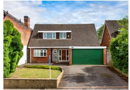
27 Mount Road, Tettenhall Wood, Wolverhampton