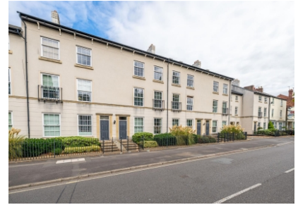
54a Regency Mews, Compton Road, Wolverhampton, WV3 9PH