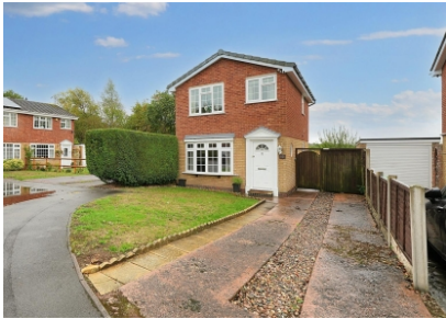
10 The Celandines, Wombourne, Wolverhampton