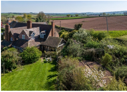
82 Haughton Cottages, Haughton, Bridgnorth