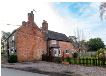
7 Kennels Lane, Albrighton, Wolverhampton