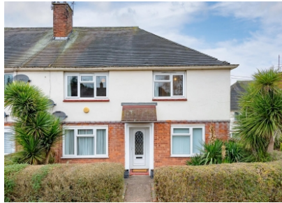
11 Lamb Crescent, Wombourne