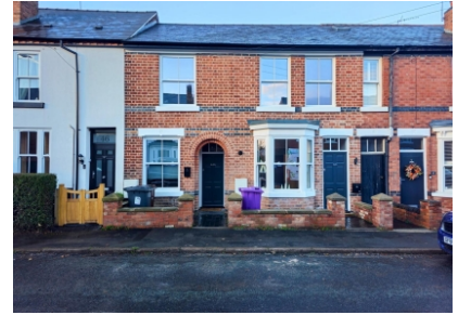
44a Limes Road, Tettenhall