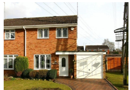
50 Forge Valley Way, Wombourne, Wolverhampton