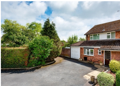
19 Woodland Close, Albrighton, Wolverhampton, WV7 3PR