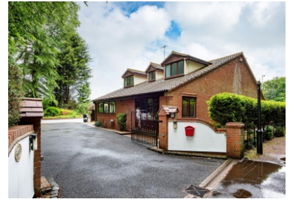
Earlswood Lodge, Stourbridge Road, Wolverhampton