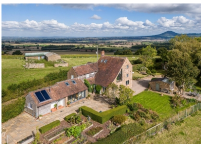
Wyres Barn, Kenley, Shrewsbury