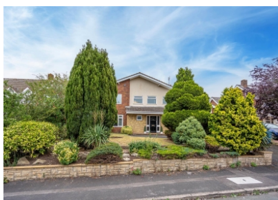
Alpine Lodge, 15 Old Weston Road, Bishops Wood, Stafford, ST19 9AG