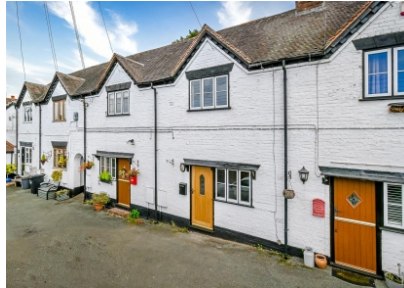
Mallards Cottage, 26b Bernards Hill, Bridgnorth