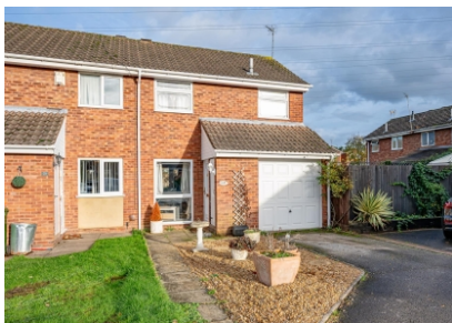
18 Longford Close, Wombourne