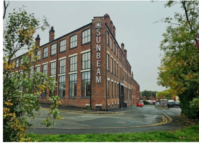
Paul Street, Wolverhampton