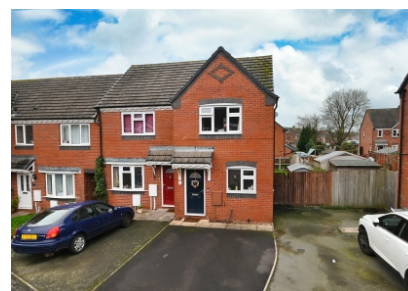
10 Ridley Close, Bridgnorth