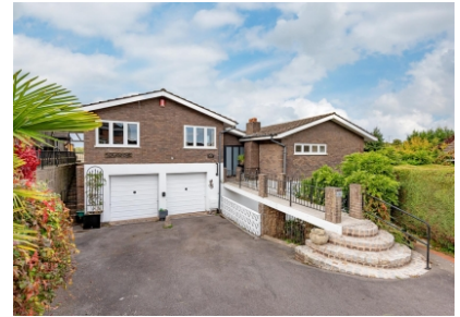
6 St. Johns Close, Swindon