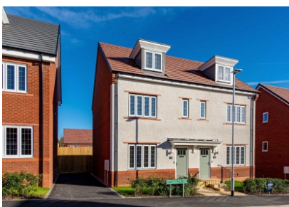
42 Foxglove Way, Himley, Dudley