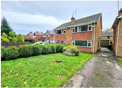
174 Henwood Road, Compton