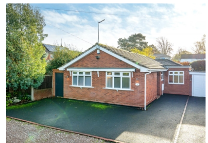
1 The Drive, Codsall, Wolverhampton, WV8 2EB