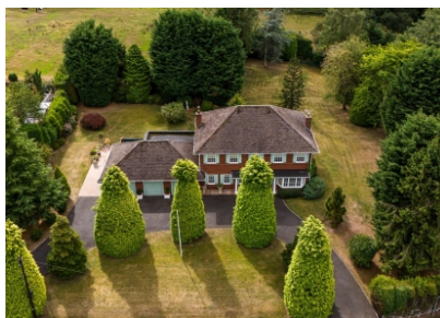
Windsor House, Off Oxe Road, Tong, Tong Norton, Shifnal, TF11 8PZ