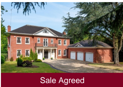
Ashfield House, Ash Hill, Compton, Wolverhampton, WV3 9DR