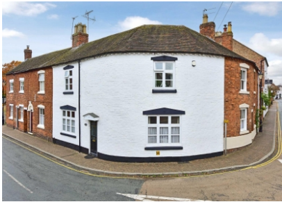
The Old Sweet Shop, 35 School Road, Brewood, Stafford, ST19 9DS