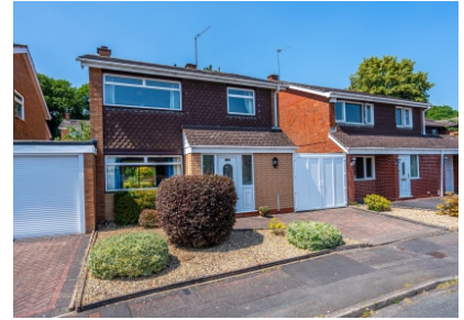
49 Woodfield Heights, Tettenhall, Wolverhampton, WV6 8PT