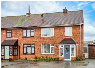
24 Egerton Road, Bushbury, Wolverhampton, WV1 8AZ