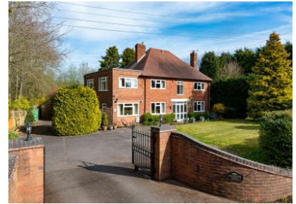
Coachmans Croft, Shop Lane, Oaken, Wolverhampton, WV8 2AX