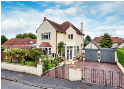
5 Knights Crescent, Tettenhall, Wolverhampton, WV6 9PZ