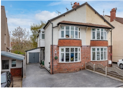
36 Pennhouse Avenue, Wolverhampton