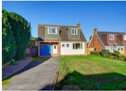
31 Hazelwood Close, Kidderminster