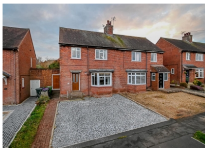
122 Victoria Road, Bridgnorth