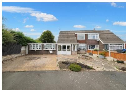
Greenfields Road, Wombourne, Wolverhampton