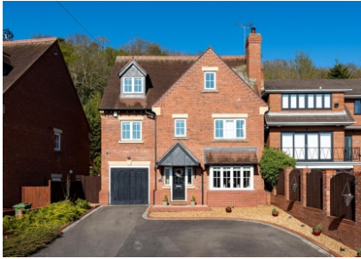
Billy Buns Lane, Wombourne, Wolverhampton