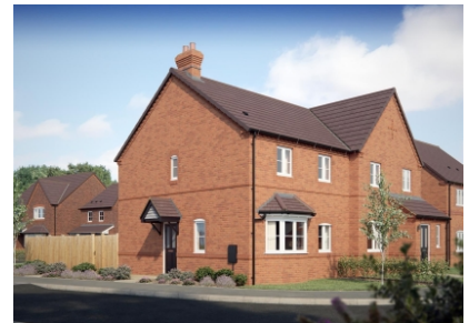
Plot 16 Derrington Meadows, Ditton Priors, Bridgnorth