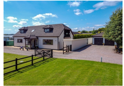
Heathlands, Fox Road, Pattingham, Wolverhampton, WV6 7EL