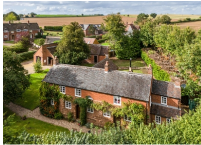
1 Chapel Cottages, Chesterton, Bridgnorth