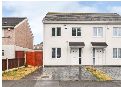
6 Wessex Road, Parkfields, Wolverhampton