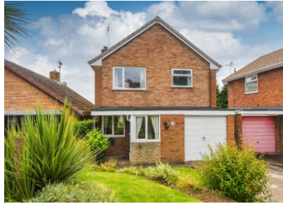
16 Woodlands Road, Wombourne, Wolverhampton