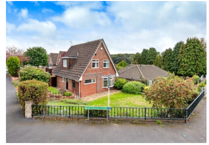
2 Reynolds Close, Swindon, Dudley