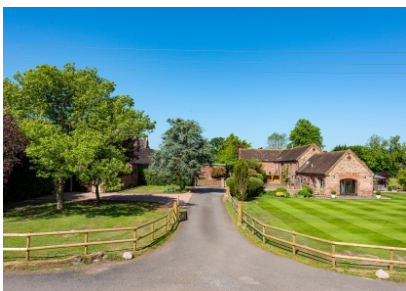
Dingle Cottage, Badger, Wolverhampton, WV6 7JU