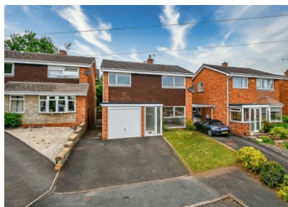
7 Stretton Close, Bridgnorth