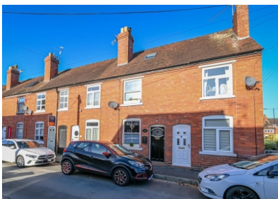
49 Severn Street, Bridgnorth