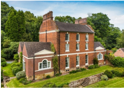
The Dower House, Hollybush Lane, Codsall, South Staffordshire, WV8 2AT