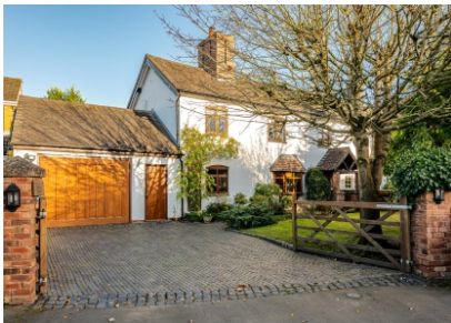
Daffodil Cottage, 94 Coven Road, Brewood, Stafford, ST19 9DF