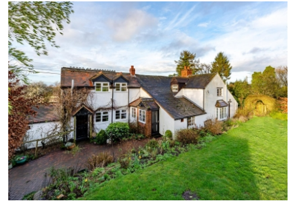
Greystoke Cottage, Kiddemore Green, Brewood