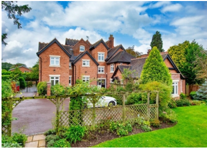
18f Southgate, Stockwell Road, Tettenhall, Wolverhampton