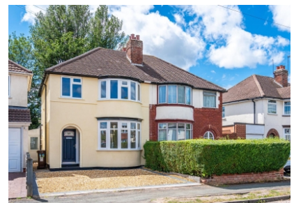
50 Beechwood Avenue, Wednesfield, Wolverhampton, WV11 1DT