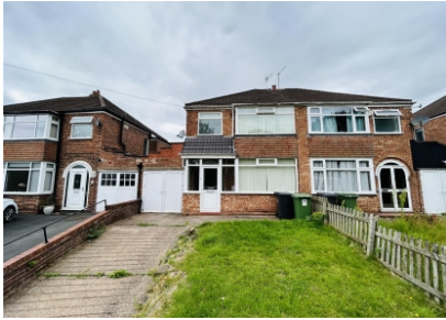
207 Aldersley Road, Claregate