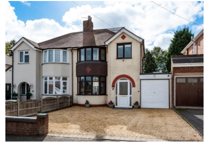
5 Springhill Grove, Wolverhampton