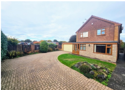
Cedars Avenue, Wombourne, Wolverhampton