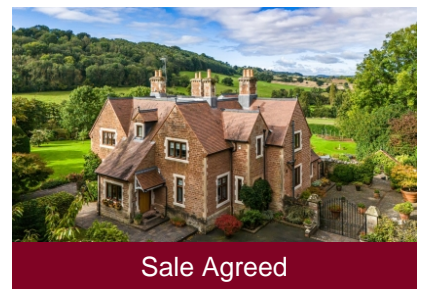
The Old Vicarage, Morville, Bridgnorth