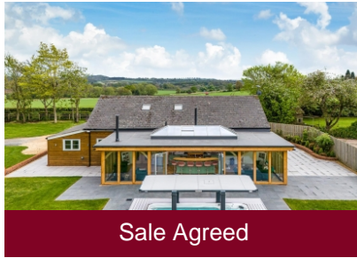
The Old Village Hall, Stanlow, Pattingham, Wolverhampton