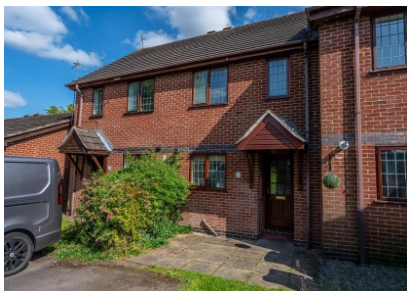
18 Tanfield Close, Tettenhall Wood, Wolverhampton, WV6 8EG