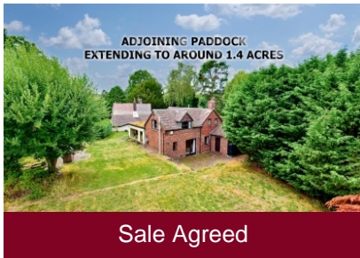
Ebenezer House, Eardington, Bridgnorth