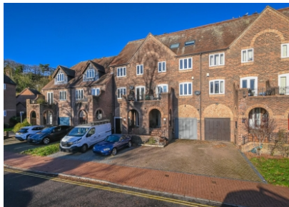
22 Southwell Riverside, Bridgnorth