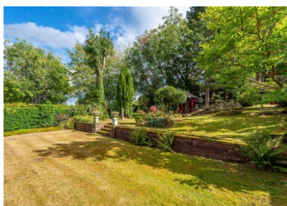
The Rafters, Flat 5 Dippons House, Dippons Drive, Wolverhampton