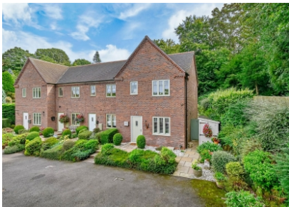
4 The Dairy, Stourbridge Road, Bridgnorth