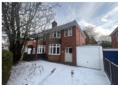
17 Scott Avenue, Penn