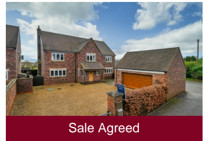
Faintree Heights, Faintree, Bridgnorth