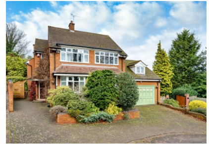
5 Elmsdale, Wightwick, Wolverhampton, WV6 8ED