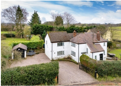
Coldham Cottage, Foxes Lane, Coldham, Brewood, ST19 9BJ