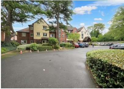
Flat 2, Pendene Court, Penn Road, Wolverhampton