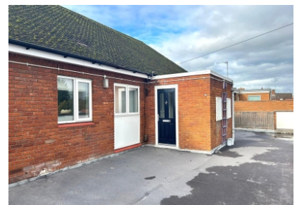
6a Bradford Street, Shifnal