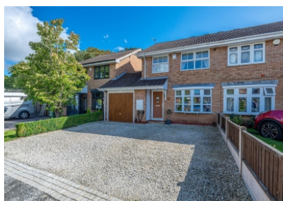
31 Blackbrook Way, Wolverhampton, WV10 8TB