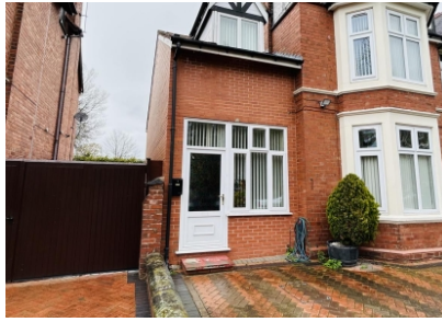
The Annexe, 61 Albert Road, Wolverhampton