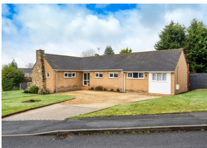
14 Heath Hill Road, Wightwick