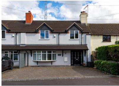
Three Hammers Farmhouse, Old Stafford Road, Cross Green Coven, Wolverhampton