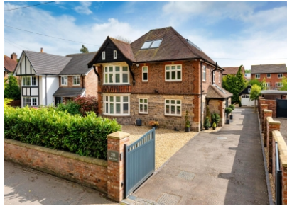
Stone House, 211 Holyhead Road, Wellington, Telford