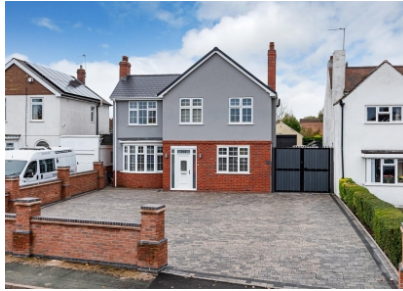
Trysull Road, Wolverhampton