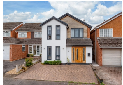
8 Banbery Drive, Wombourne, Wolverhampton