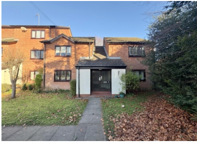
14 Cotswold Court, Penn