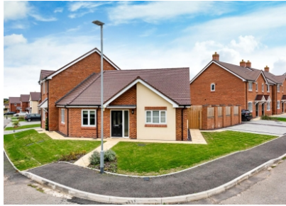
28 Cobham Close, Wrottesley Village, Wolverhampton, WV6 7JB