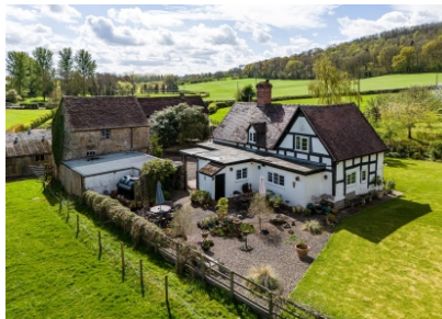
Lye Mill, Morville, Bridgnorth