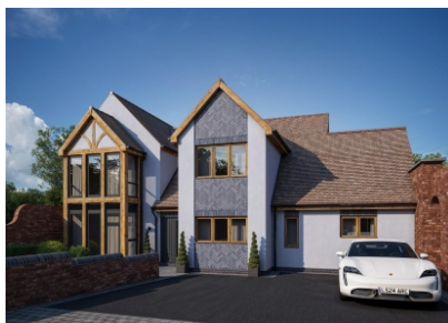
Groom Cottage, Danescourt Road, Tettenhall, Wolverhampton, WV6 9BE