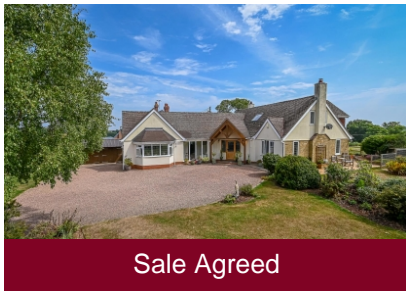
Ash Croft, Glazeley, Bridgnorth