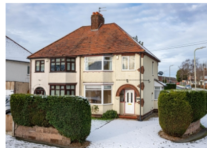
106 Green Lane, Tettenhall, Wolverhampton, WV6 9HB