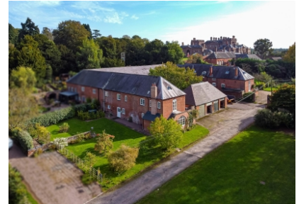
The Bothy (and Barns for conversion), Patshull Park, Patshull Hall, Burnhill Green, Wolverhampton