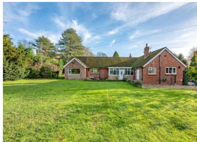
Cherrydene, Halfpenny Green, Bobbington