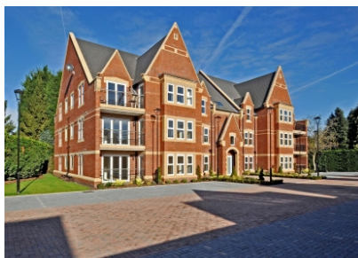
5 Ellen Place, Henry Fowler Drive, Tettenhall