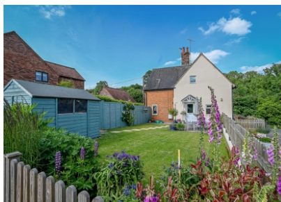
4 Brockton, Much Wenlock