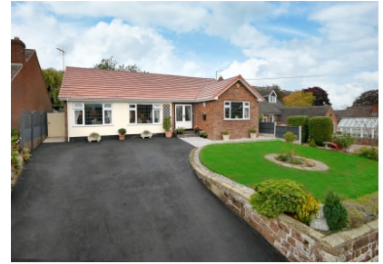
21a High Street, Claverley, Wolverhampton