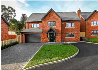
3 The Stamp Works, Ludlow Road, Bridgnorth