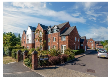
28 Wombrook Court, Wombourne, Wolverhampton