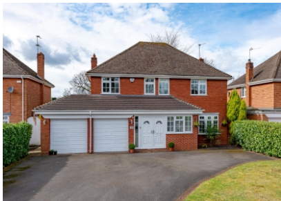
18 Corfton Drive, Tettenhall