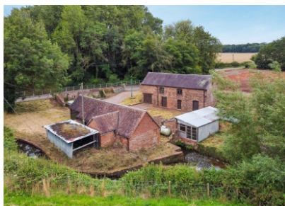
The Mill, Badger, Shropshire, WV6 7JU