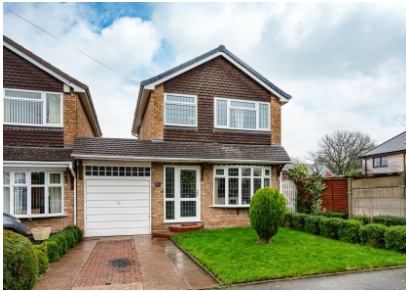
1 Denham Gardens, Castlecroft, Wolverhampton, WV3 8LW