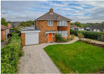
23 Conduit Lane, Bridgnorth