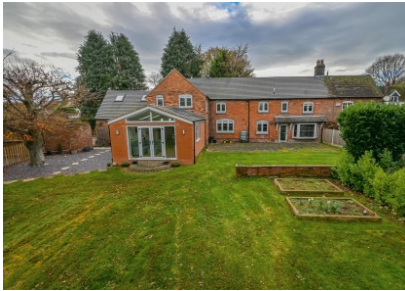
Orchard Cottage, Rudge Heath Road, Claverley, Wolverhampton