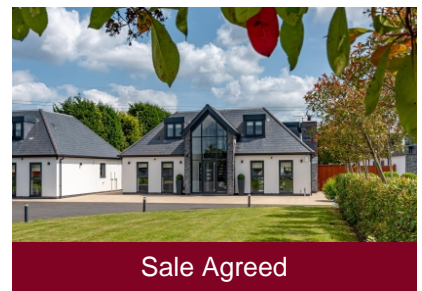
Meadow View, Mile Flats, Greensforge, Kingswinford