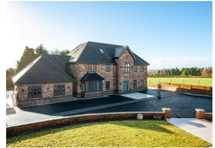
The Latter House, Pattingham Road, Perton, Wolverhampton, WV6 7HD