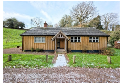
Lower Burcote Farm, Bridgnorth