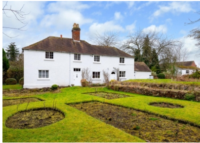
Bridge Cottage, Haughton Village, Shifnal, TF11 8HR