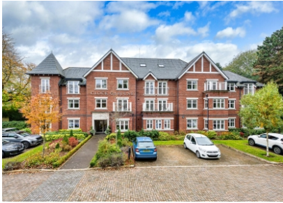
5 Clock Gardens, Stockwell Road, Tettenhall, Wolverhampton, WV6 9PS