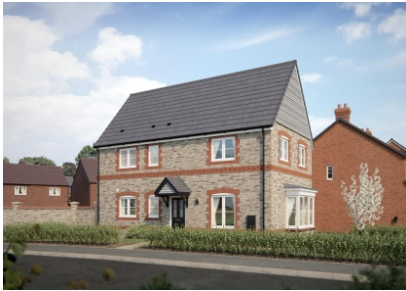
Plot 25 Derrington Meadows, Ditton Priors, Bridgnorth