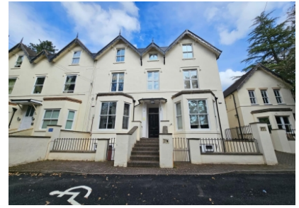
Compton Road West, Wolverhampton