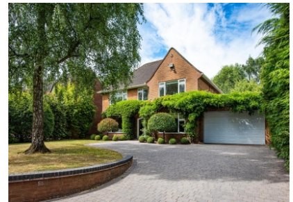
58 Perton Road, Wightwick, Wolverhampton, WV6 8DJ