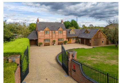
Cottage Farm, Paradise Lane, Slade Heath, Wolverhampton, WV10 7NZ