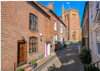
7 Church Street, Bridgnorth