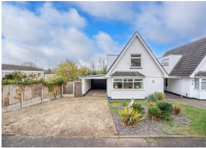
76 Woodfield Heights, Tettenhall, Wolverhampton, WV6 8PT