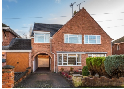
Kirkstone Crescent, Wombourne, Wolverhampton