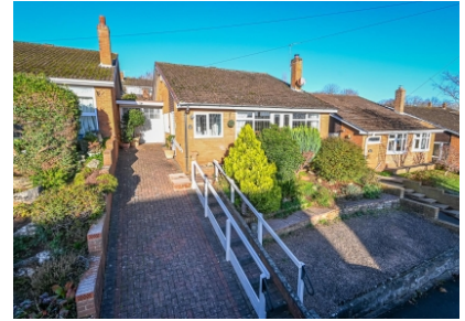
26 Ludlow Heights, Bridgnorth