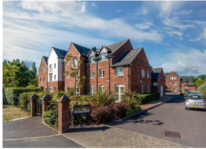
42 Wombrook Court, Wombourne