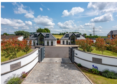
The Stables, Mile Flat, Greensforge, Kingswinford