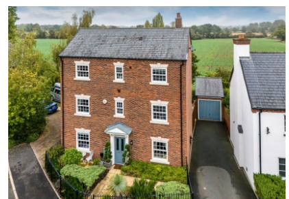
49 Deacons Field, Brewood, Stafford, ST19 9GA