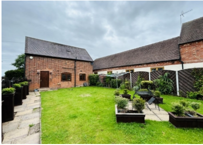
The Annexe, Hollies Lane, Pattingham