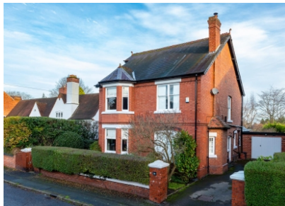
16 Church Hill Road, Tettenhall, Wolverhampton, WV6 9AT