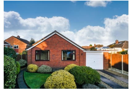
2 Green Acres, Wombourne, Wolverhampton