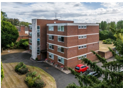
Flat 6, The Manor House, Upper Green, Tettenhall, Wolverhampton, WV6 8QJ