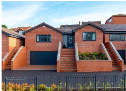
31 Auckland Road, Kingswinford