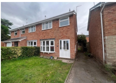
8 Crane Hollow, Wombourne