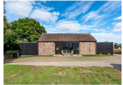
The Fold Yard, Aston Eyre, Bridgnorth