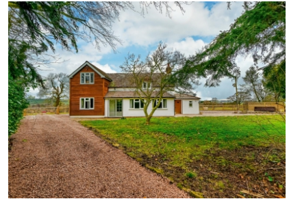
Field House, Stanton Long, Much Wenlock