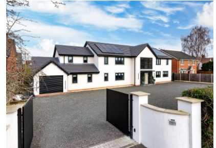
Church View, Sandy Lane, Codsall, Wolverhampton, WV8 1EW