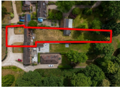
Wentworth Barn, 2 Patshull Gardens, Albrighton, Wolverhampton, WV7 3BG