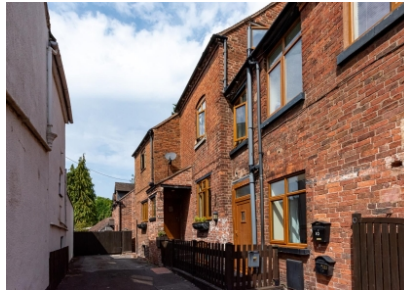
10 Church Street, Shifnal, TF11 9AA