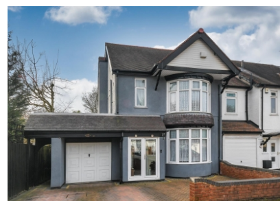
161 Clark Road, Compton, Wolverhampton, WV6 9PD