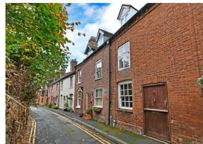
16 St. Leonards Close, Bridgnorth