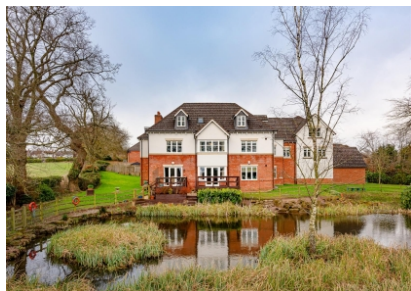
4 Albrighton House, The Water Gardens, Wolverhampton