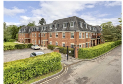
6 Castlecroft House, Castlecroft