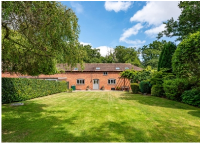
The Granary, Neachley Lane, Neachley, Shifnal, TF11 8PH