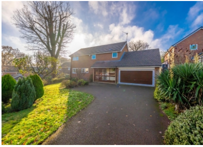
7 Maythorn Gardens, Tettenhall, Wolverhampton, WV6 8NP