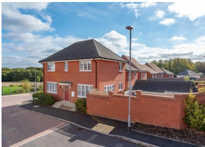
Clover Drive, Himley, Wolverhampton