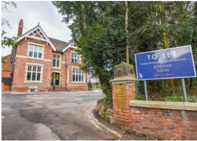
Apartment 13, Beacon House, 267 Tettenhall Road