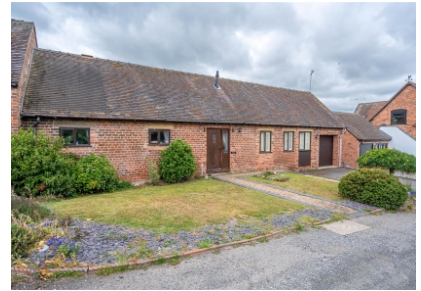
Rosemary Cottage, Codsall Road, Tettenhall, WV6 9QG