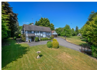
Hallonsford Cottage, Worfield, Shropshire