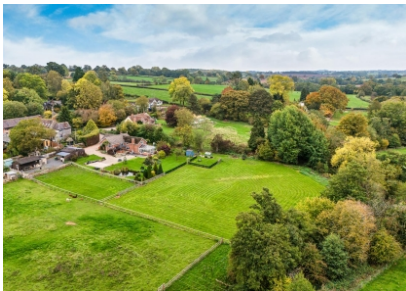
Reaside, Neenton, Bridgnorth