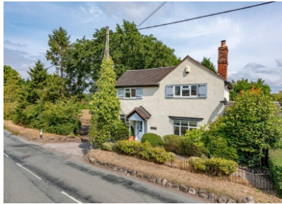
Smestow Gate Cottage, Smestow, Swindon, Dudley