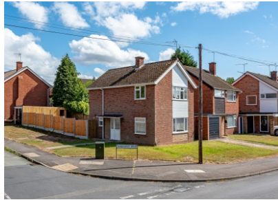
2 Sandhurst Drive, Wolverhampton