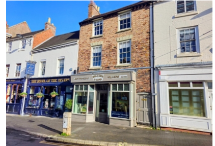
High Street, Bridgnorth