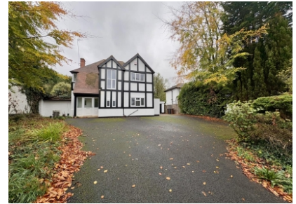
75 Compton Road, Wolverhampton