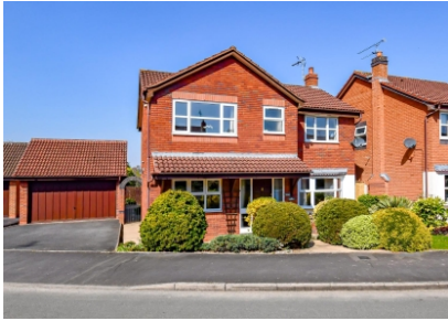
15 Penleigh Gardens, Wombourne