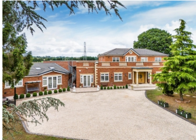
The Cottage, Bennetts Lane, Pattingham, Wolverhampton, WV6 7EY