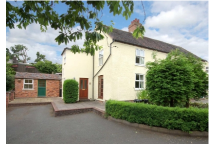
Mount Road, Tettenhall Wood, Wolverhampton