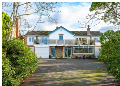
Panx, Sytch Lane, Wombourne, Wolverhampton