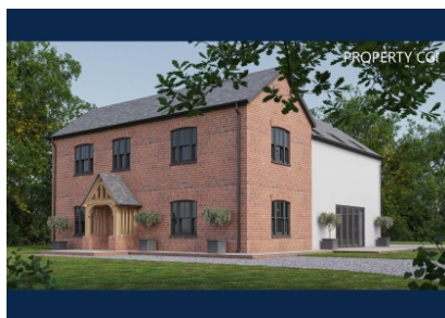
Plot 1, Bynd Lane, Billingsley, Bridgnorth