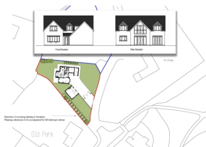
Land on the South of 2 Old Coppice Grange, Old Park, Telford