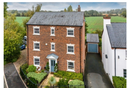
49 Deacons Field, Brewood, Stafford, ST19 9GA