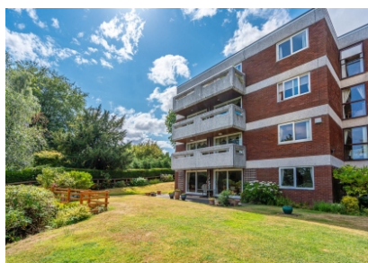
6 Eynsham Court, Clifton Road, Stockwell End, Wolverhampton, WV6 9AR