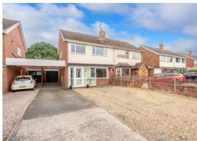
16 Moor Lane, Pattingham, Wolverhampton, WV6 7DL