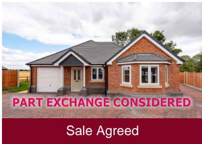
Bluebells, 6a School Close, Trysull, Wolverhampton