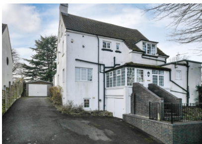
Highcroft, 127 Wolverhampton Road, Sedgley, Dudley