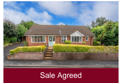
Rose Gate, Engleton Lane, Brewood, Stafford, ST19 9DZ