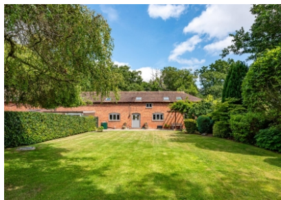
The Granary, Neachley Lane, Neachley, Shifnal, TF11 8PH