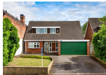
27 Mount Road, Tettenhall Wood, Wolverhampton