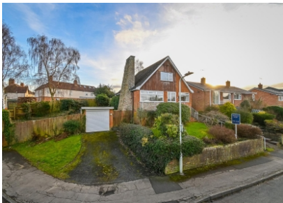
28 Greenfields Road, Bridgnorth