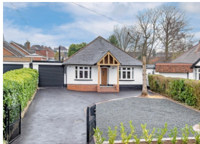
3 Bratch Lane, Wombourne, Wolverhampton