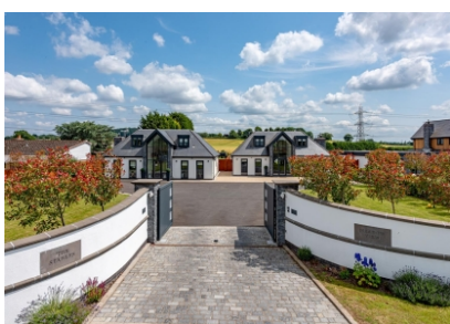
The Stables, Mile Flat, Greensforge, Kingswinford