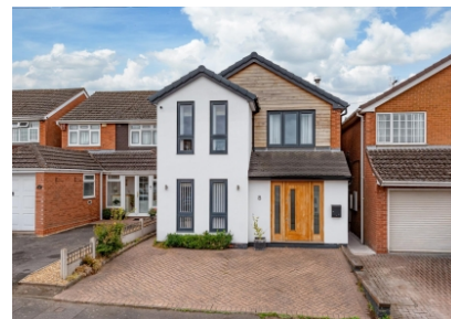
8 Banbery Drive, Wombourne, Wolverhampton