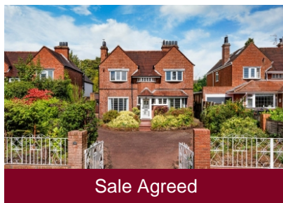
31 Wood Road, Codsall, Wolverhampton, WV8 1DN