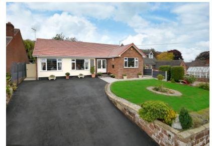
21a High Street, Claverley, Wolverhampton