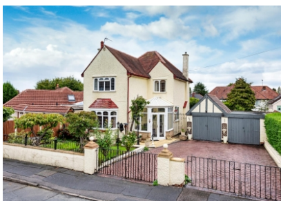
5 Knights Crescent, Tettenhall, Wolverhampton, WV6 9PZ