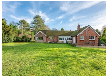
Cherrydene, Halfpenny Green, Bobbington