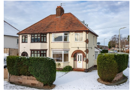
106 Green Lane, Tettenhall, Wolverhampton, WV6 9HB