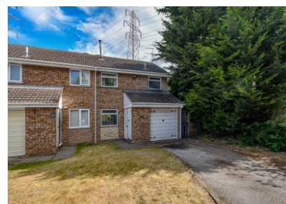
25 Foley Grove, Wombourne, Wolverhampton