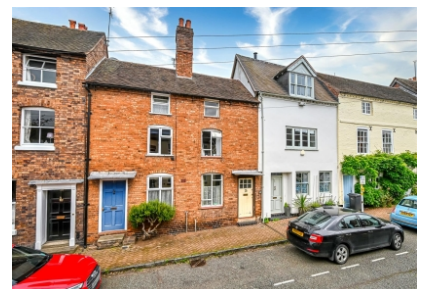
24 St. Marys Street, Bridgnorth