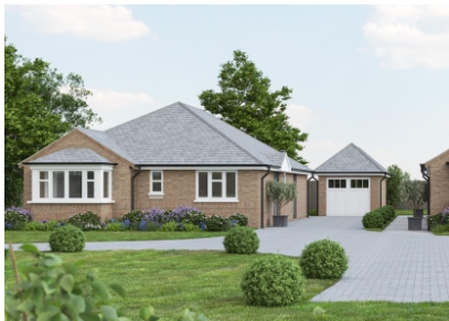
19 Swallowdale, Wightwick, Wolverhampton, WV6 8DT