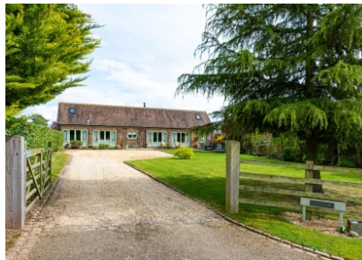
The Gatehouse, Burlington Court, Burlington, TF11 8BW