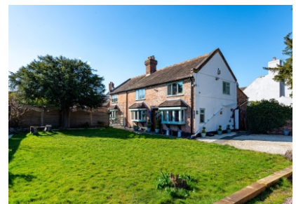
Elms Cottage, 4 Elms Lane, Sharesill, WV10 7JS