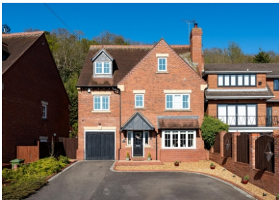
Billy Buns Lane, Wombourne, Wolverhampton