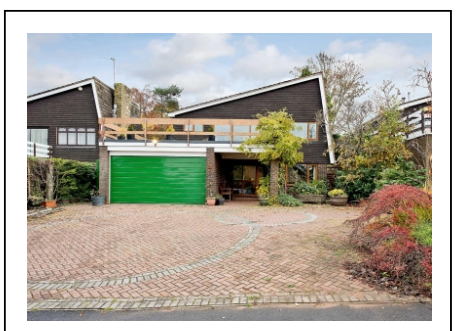
18 Perton Brook Vale, Wightwick