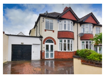
Pennhouse Avenue, Wolverhampton