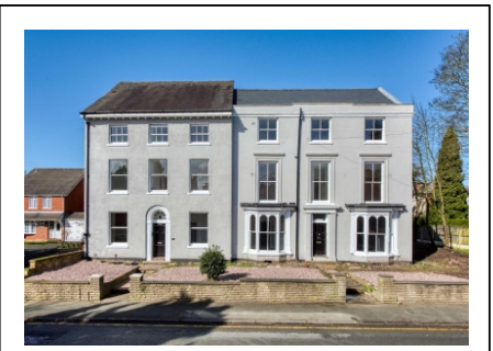
Flat 3, 228 Penn Road, Wolverhampton