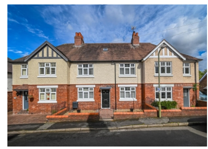
2 Cliff Gardens, Cliff Road, Bridgnorth