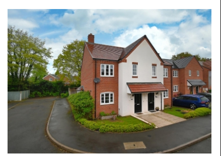
19 Staley Grove, Highley, Bridgnorth