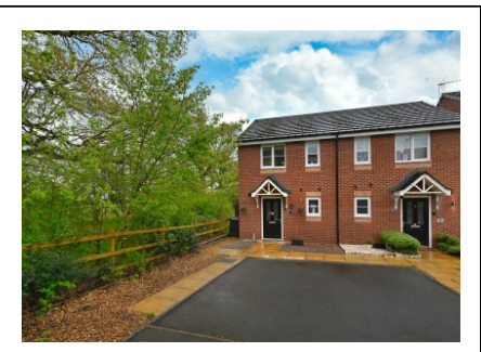
29 Hitchens Way, Highley, Bridgnorth