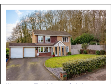
Wychaven, The Holloway, Swindon, Dudley