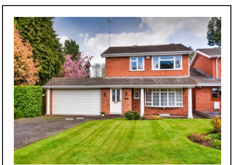
18 Fair Oak Drive, Wolverhampton