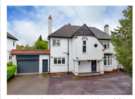
61 Codsall Road, Tettenhall, WV6 9QG