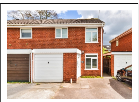
Forge Leys, Wombourne