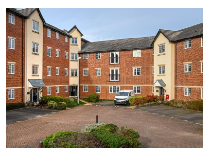
23 Greyfriars House, Kings Court, Stourbridge Road, Bridgnorth