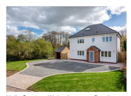
Holly Cottage, Wolverhampton Road, Pattingham