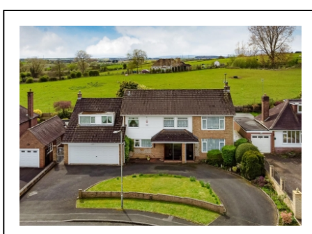
7 Wightwick Hall Road, Wightwick, WV6 8BZ