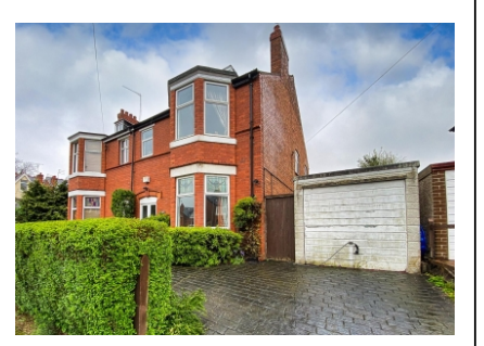
26 Marchant Road, Compton, WV3 9QG