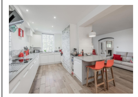
4 Stanmore Mews, Stourbridge Road, Stanmore, Bridgnorth