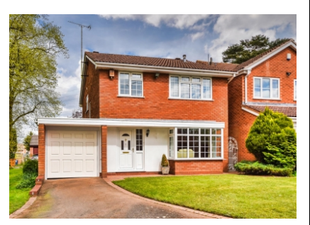
1 Foxlands Drive, Wolverhampton