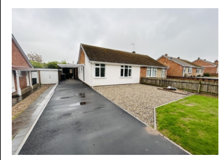
32 Four Ashes Road, Brewood