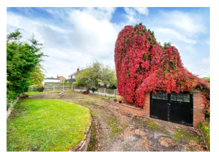
Planning Permission, 40 Moatbrook Lane, Codsall, WV8 1SD