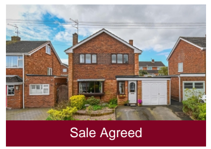
4 Whitmore Close, Bridgnorth