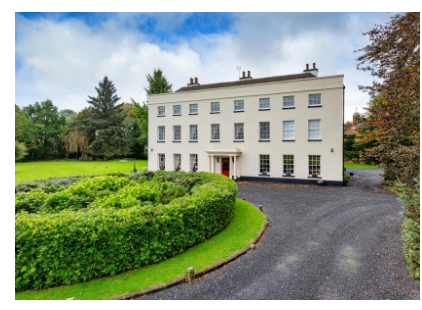
11 Leaton Hall, Church Lane, Bobbington, Stourbridge