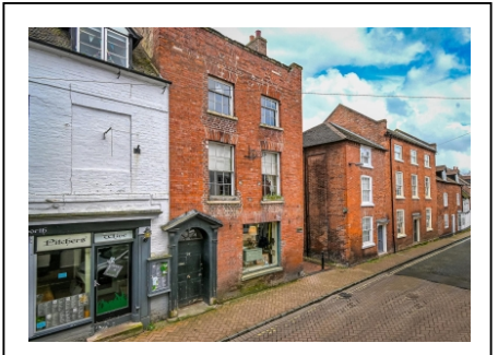
64 St. Marys Street, Bridgnorth