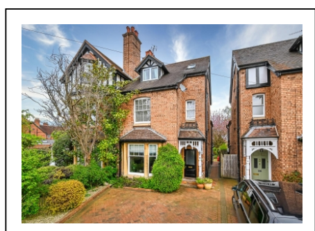
7 Westgate Villas, Salop Street, Bridgnorth