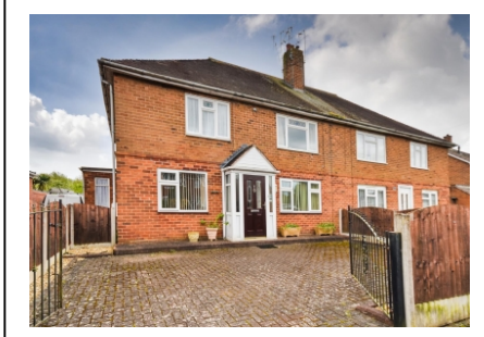
Dickinson Road, Wombourne, Wolverhampton