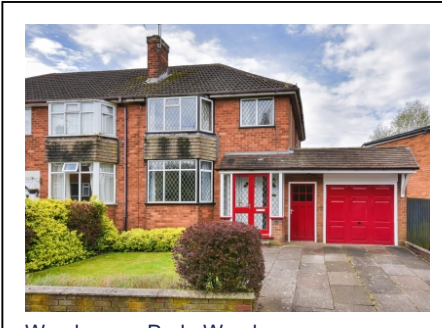
Wombourne Park, Wombourne