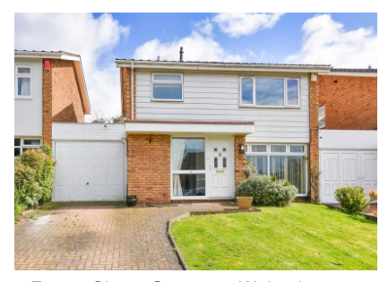
4 Forton Close, Compton, Wolverhampton