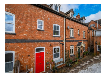
22a High Street, Bridgnorth