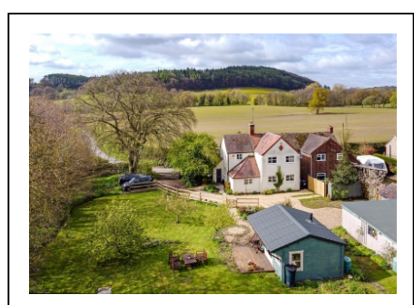
6 The Row, Easthope, Much Wenlock