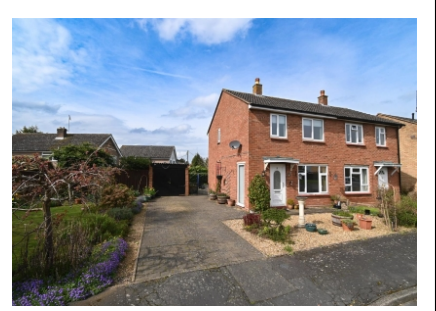
9 Wrekin Road, Bridgnorth