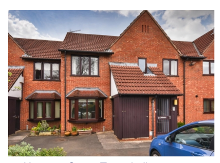
24 Hanover Court, Tettenhall, Wolverhampton