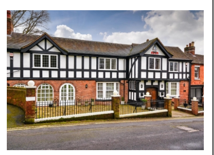
5c The Mitre, Lower Green, Tettenhall