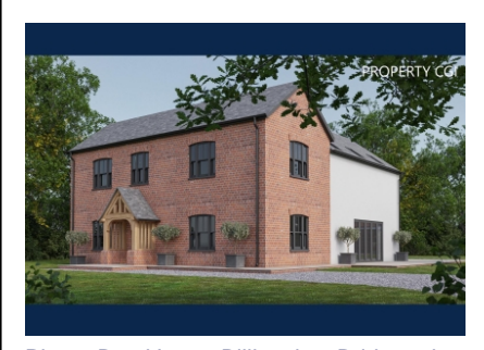
Plot 1, Bynd Lane, Billingsley, Bridgnorth