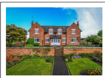
Lower Snowdon Cottage, Snowdon Road, Burnhill Green, Wolverhampton