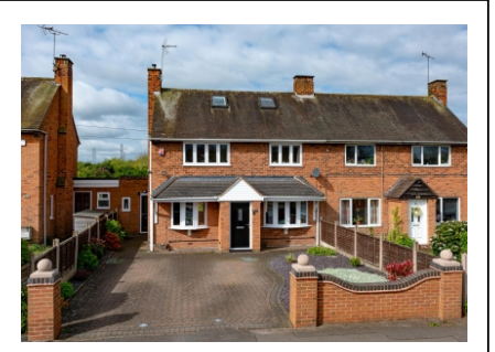
Giggetty Lane, Wombourne, Wolverhampton