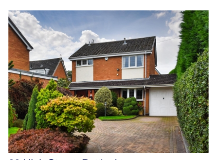
39 High Street, Pattingham, Wolverhampton