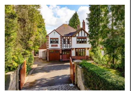
Dalkeith, 25 Tinacre Hill, Wightwick, WV6 8DB