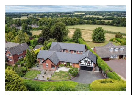
Courtneys, Oaken Drive, Oaken, Codsall