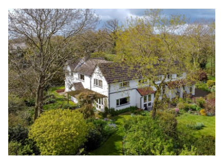
Leafields Farm, Shutt Green, Brewood, ST19 9LX