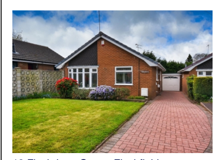
19 Finchdene Grove, Finchfield, Wolverhampton