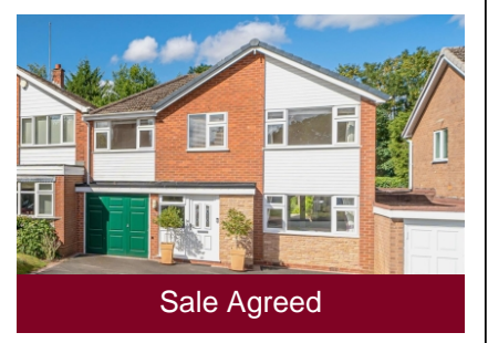
2 Whiteladies Court, Albrighton, Wolverhampton