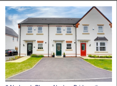
9 Narburgh Place, Alveley, Bridgnorth