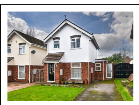
8 Laburnum Street, Wolverhampton