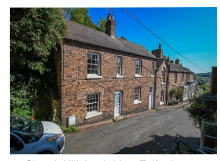
25 Church Hill, Ironbridge, Telford