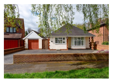
19 Foley Avenue, Tettenhall, Wolverhampton