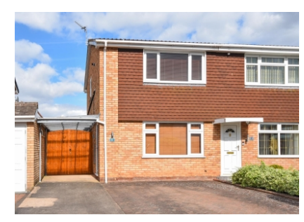
Green Meadow Close, Wombourne, Wolverhampton