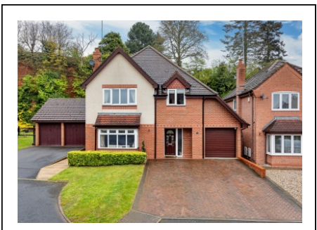
Hillside, Wombourne, Wolverhampton