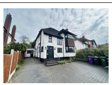
59 York Avenue, Finchfield