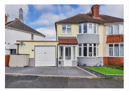
56 Hilston Avenue, Penn, Wolverhampton