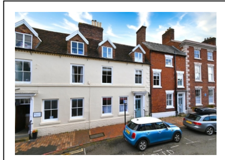
28 East Castle Street, Bridgnorth