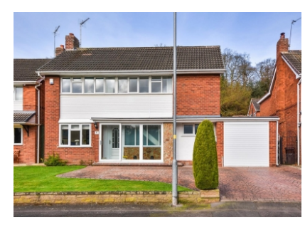
97 Henwood Road, Compton, Wolverhampton