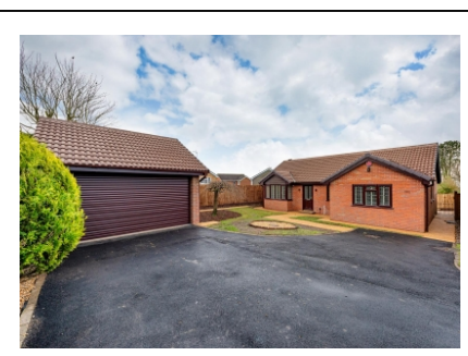
3 Montford Grove, Sedgley, Dudley