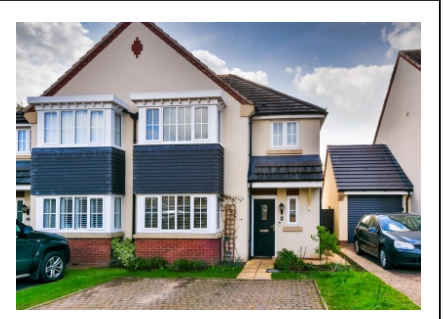
4 The Limes, Codsall Wood, Wolverhampton