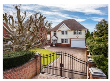
Catholic Lane, Sedgley, Dudley