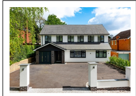
1 Chestnut Close, Codsall, WV8 2EZ