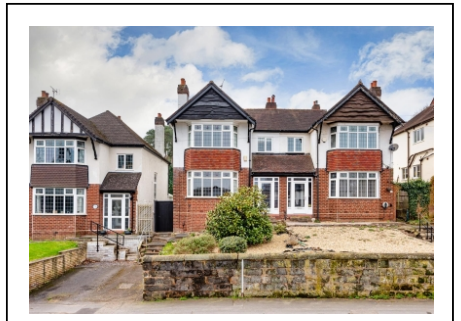
83 Lower Street, Wolverhampton