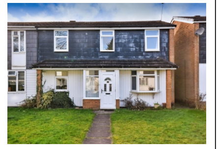
11 Woodside, Ashmore Park, Wolverhampton