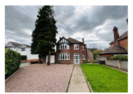
114 Amos Lane, Wolverhampton