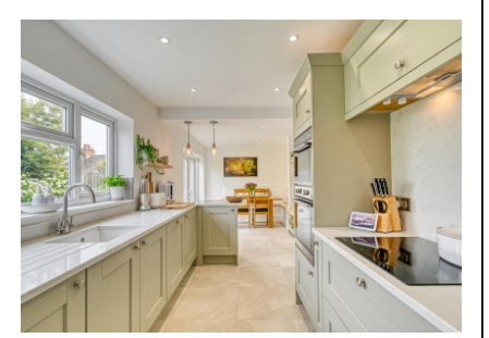
18 Stretton Close, Bridgnorth