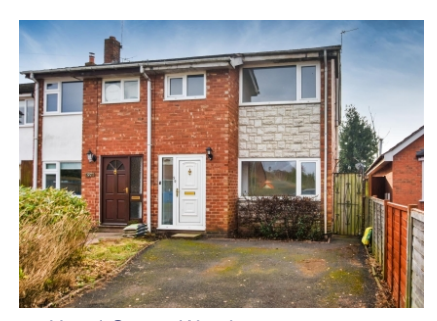
99 Hazel Grove, Wombourne, Wolverhampton