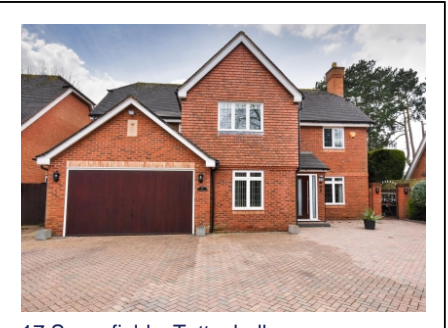
17 Saxonfields, Tettenhall