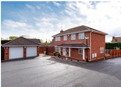
St. Johns Close, Swindon, Dudley