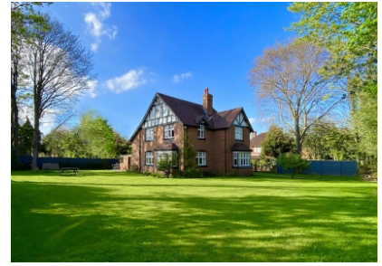
The Croft, 15 Church Road, Albrighton, Wolverhampton