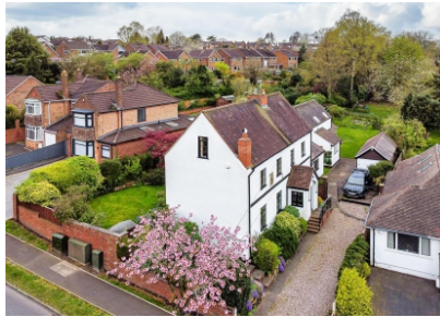
The Crofts and The Cottage, 32 Church Hill, Penn