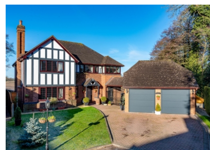
47 Fairfield Drive, Codsall, Wolverhampton