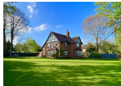
The Croft, 15 Church Road, Albrighton, Wolverhampton