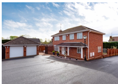
St. Johns Close, Swindon, Dudley