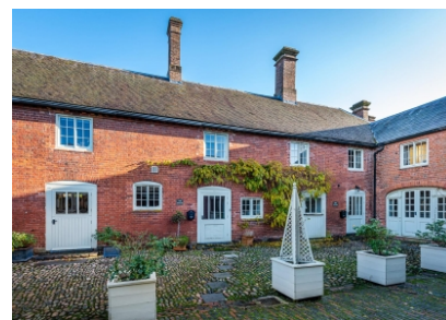
The Ostlers, 3 Patshull Hall Mews, Burnhill Green