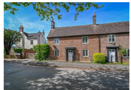
50 Ivy Place, Church Lane, Alveley, Bridgnorth