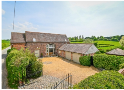
Trafalgar Barn, Worfield, Bridgnorth