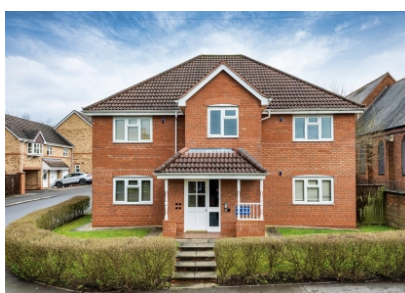
124a Common Road, Wombourne