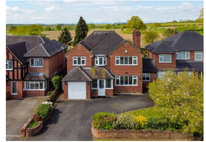
59 Sabrina Road, Wolverhampton