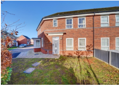
26 Rainsford Crescent, Kidderminster