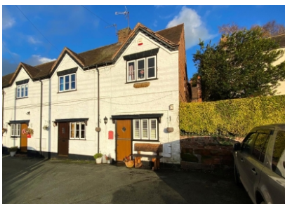
26c Bernards Hill, Bridgnorth