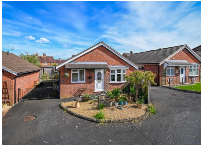
105 Hook Farm Road, Bridgnorth