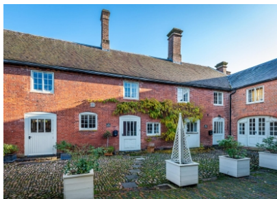
The Ostlers, 3 Patshull Hall Mews, Burnhill Green