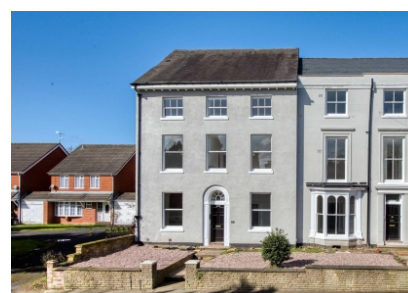
Havana House Flat 1, 228 Penn Road, Wolverhampton