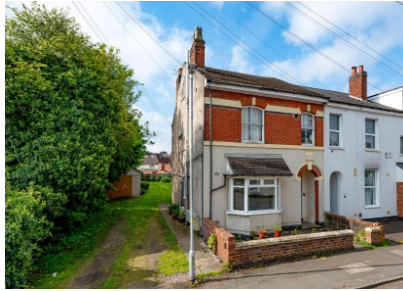
25 Newbridge Street, Newbridge, Wolverhampton, WV6 0EE