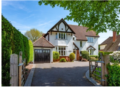
5 Coppice Road, Finchfield, Wolverhampton, WV3 8BJ