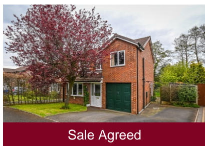
27 Greenway Avenue, Alveley, Bridgnorth