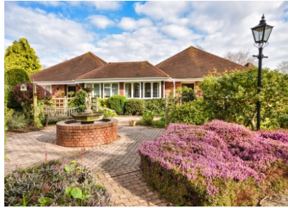
45 The Beeches, Hanover Court, Tettenhall, WV6 8QL