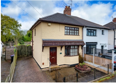
61 Woodland Avenue, Wolverhampton