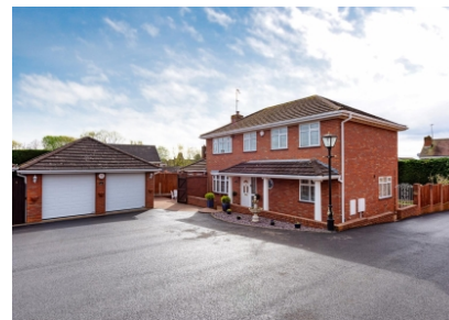
St. Johns Close, Swindon, Dudley