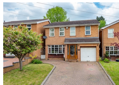
The Holloway, Swindon, Dudley